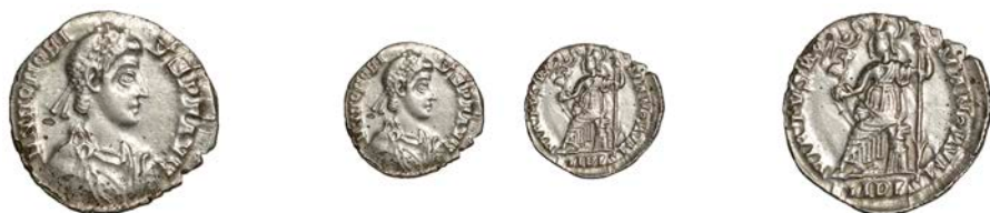
182 Siliqua, Milan, 395-402, D N HONORI-VS P F AVG, pearl-diademed, draped and cuirassed bust right, 'Eastern' pteryges, rev. VIRTVS RO-MANORVM, Roma seated left on cuirass, holding inverted spear and Victoriola on globe, MD PS in exergue, 1.52g/6h (MC 401, this coin ; Hoxne 720 [B]; RIC X p.321, 1228; RSC 59+b). A few surface blisters, very fine £50-£60