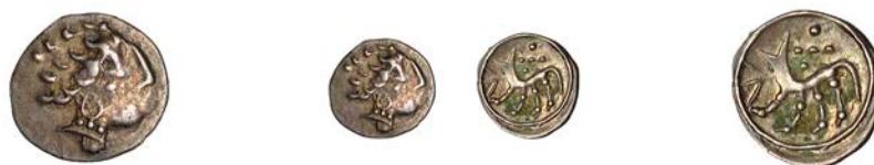
64 CISALPINE GAUL, Liguri (?), silver Obol, after the coinage of Massalia, 1st century BC, female head right, rev. stylised quadruped left, cluster of pellets above, 0.69g/11h (BMC II S93, same dies; Nash 81; Pautasso 94). Light deposits on reverse, otherwise good very fine, dark tone, charming style £120-£150

Provenance: bt J. Cummings 1997; M. Bridgewater Collection