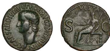
260 As, Rome, 39-40, bust left, reads DIM AVG PRON, rev. Vesta seated left, holding patera and sceptre, large S C in fields, 11.51g (RIC 47; BMC 59). Very fine, green patina £90-£120