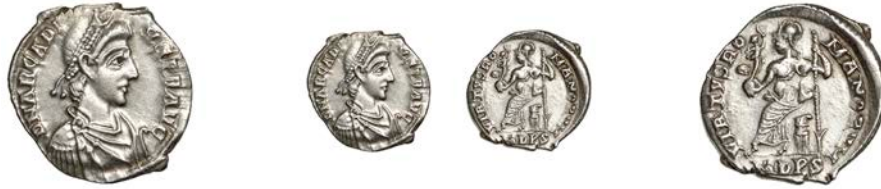
157 Siliqua, Milan, 395-402, D N ARCADI-VS P F AVG, pearl-diademed, draped and cuirassed bust right, 'Eastern' Pteryges, rev. VIRTVS RO-MANORVM, Roma seated left on cuirass, holding sceptre and Victoriola on globe, MD PS in exergue, 1.59g/6h (MC 390, this coin ; Hoxne 705 [A]; RIC X p.321, 1227; RSC 27b). Struck from a worn obverse die, good very fine £80-£100