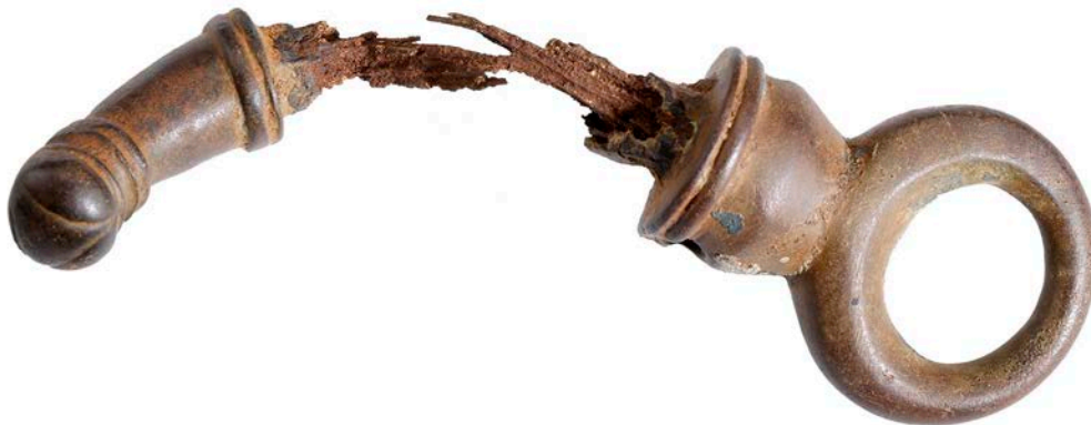
The Gargrave Linch Pin

Only two brooches for a horse harness are recorded from the UK and these are both enamelled; they are cast in two pieces, with the brooch as the upper part combined with a hinged lower part (see PAS no. DENO-2BAD49; also plate 298 in Early Celtic Art by Jope).