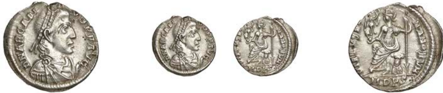
158 Siliqua, Milan, 395-402, D N ARCADI-VS P F AVG, pearl-diademed, draped and cuirassed bust right, 'Eastern' Pteryges, rev. VIRTVS RO-MANORVM, Roma seated left on cuirass, holding sceptre and Victoriola on globe, MD PS in exergue, 1.39g/12h (MC 392, this coin ; Hoxne 705 [A]; RIC X p.321, 1227; RSC 27b). Edge a little ragged, a few surface blisters, otherwise better than very fine £50-£60