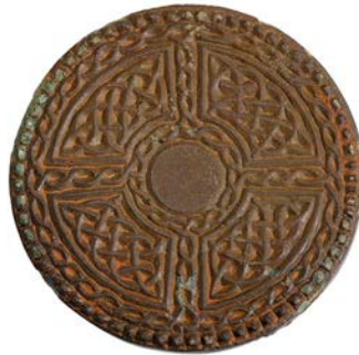
The Steeple Claydon Saxon Die