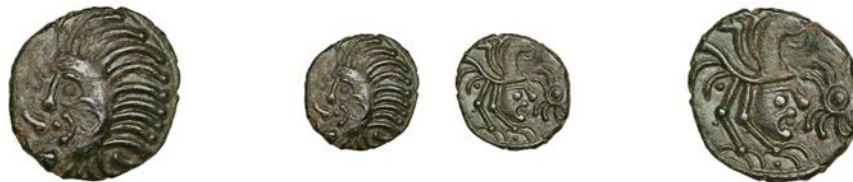
60 NORTHEAST GAUL, Bellovaci , Æ Unit, large head right with radiate left, rev. human-headed cock right, spiral-sin in field, 2.46g/12h (DLT 8584; DT 509). Very fine, glossy green patina, the reverse well-centred and charming £300-£360