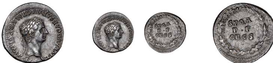
261 Denarius, 46-7, reads TR P VI IMP XI, laureate head right, rev. SPQR P P OBCS in three lines within oak wreath, 3.70g (RIC 41; BMCRE 45-7; RSC 87). A few light marks, otherwise good very fine, excellent portrait, dark find patina £1,500-£1,800

Provenance: found in Meppershall (Bedfordshire) in 2023 (PAS NARC-9D6DEC)