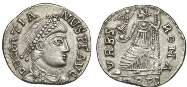
Lot 128: Irregular Siliqua naming Gratian