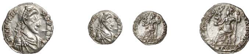
161 Siliqua, Milan, 395-402, D N ARCADI-VS P F AVG, pearl-diademed, draped and cuirassed bust right, 'Eastern' Pteryges, rev. VIRTVS RO-MANORVM, Roma seated left on cuirass, holding sceptre and Victoriola on globe, MD PS in exergue, 1.27g/12h (MC 395, this coin ; Hoxne 706 [B]; RIC X p.321, 1227; RSC 27b). Clipped, striking crack, very fine £30-£40