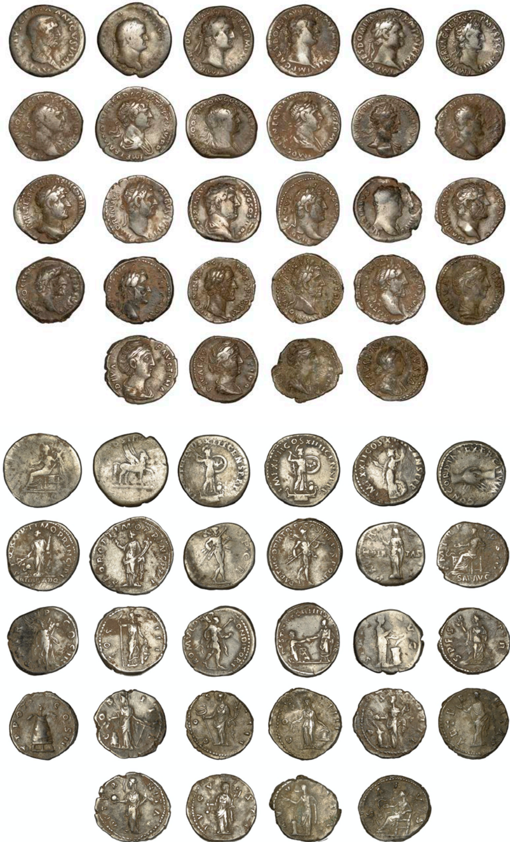
The Scrayingham Hoard of 28 Roman Denarii