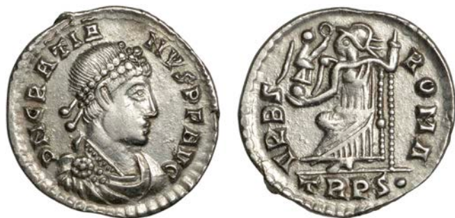
Lot 129: Irregular Siliqua naming Gratian

In attempting to determine the chronology of these irregular issues we are helped, in the first instance, by the fact that the coins show no (or very limited)