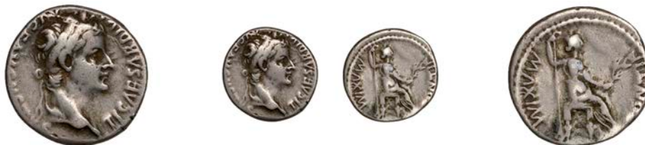
258 Denarius, Lugdunum, after 16, laureate bust right, rev. PONTIF MAXIM, Livia seated right on ornate stool, holding sceptre and olive branch, 3.67g (RIC 30; RSC 16a; RCV 1763). Very fine, light grey tone £90-£120