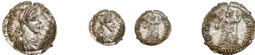
159 Siliqua, Milan, 395-402, D N ARCADI-VS P F AVG, pearl-diademed, draped and cuirassed bust right, 'Eastern' Pteryges, rev. VIRTVS RO-MANORVM, Roma seated left on cuirass, holding reversed spear and Victoriola on globe, MD PS in exergue, 1.28g/12h (MC 43, this coin ; Hoxne 706 [B]; RIC X p.321, 1227; RSC 27b). Some surface blisters, otherwise good very fine £60-£80