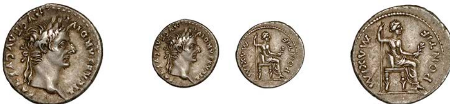
256 Denarius, Lugdunum, after 16, laureate bust right, rev. PONTIF MAXIM, Livia seated right on ornate stool, holding sceptre and olive branch, 3.76g (RIC 30; RSC 16a; RCV 1763). Good very fine, a few light marks, toned £200-£260