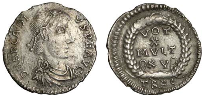
Lot 165: Irregular Siliqua naming Arcadius

monetary functions as their legitimate counterparts, but large enough to confirm that they do indeed represent a separate phenomenon, struck from a distinct source of bullion.