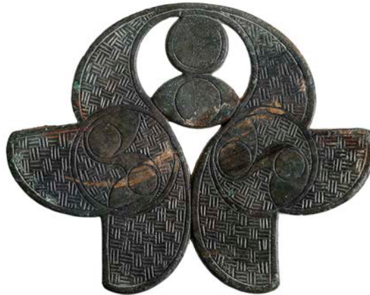
The Sutton Scotney Iron Age Brooch