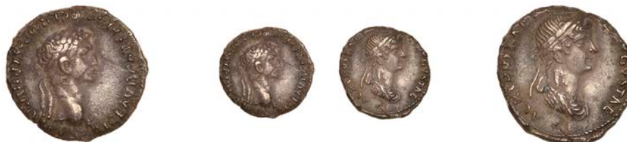
262 Denarius, Lugdunum, 51, laureate bust right, rev. AGRIPPINAE AVGVSTAE, draped bust of Agrippina Junior right, wearing crown of corn-ears, 3.12g (RIC 81; BMCRE 75; RSC 4; RCV 1886). Small scuff in obverse field and edge slightly ragged, otherwise good very fine, dark find patina £900-£1,200

Provenance: found in Meppershall (Bedfordshire) in 2023 (PAS NARC-9D6DEC)