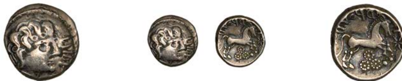
61 NORTHEAST GAUL, Suessiones , silver Quinarius, early 1st century BC, NI DE [retrograde], male head right with curled hair, rev. ΛΑΒΡΟΔΙΙΟC , horse bounding right, star before face, three rosettes below, 2.47g/7h (Flesche –; DLT –; DT 207). Very fine and well-centred, rare £200-£260