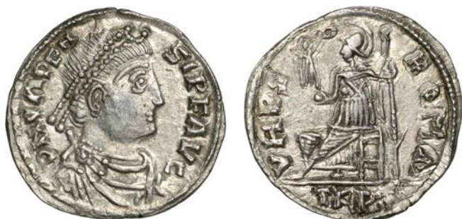
Lot 123: Irregular Siliqua naming Valens

Presented in the listing below are four irregular silver Siliquae. These unusual and anomalous coins are best understood as of local British manufacture, struck at a time when the supply of official coinage was restricted. Three of the irregular coins offered for sale here imitate the First Vrbs Roma issue, struck at Trier c. 374-77. The unofficial character of these coins can be recognised on stylistic grounds. While, in general terms, the irregular coins follow the prototype issue closely, they also display trend towards abstractionism, expressed most clearly in the depiction of Roma on the reverse.