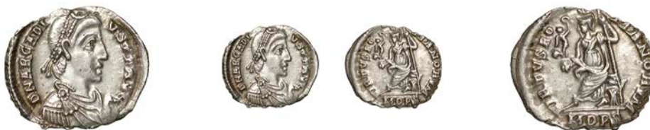
162 Siliqua, Milan, 395-402, D N ARCADI-VS P F AVG, pearl-diademed, draped and cuirassed bust right, 'Eastern' Pteryges, rev. VIRTVS RO-MANORVM, Roma seated left on cuirass, holding sceptre and Victoriola on globe, MD PS in exergue, 1.32g/12h (MC 393, this coin ; Hoxne 707 [C]; RIC X p.321, 1227; RSC 27b). Edge a little ragged, a few surface blisters, otherwise better than very fine £60-£70