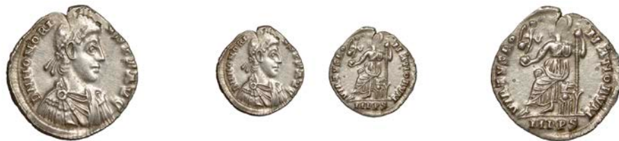
180 Siliqua, Milan, 395-402, D N HONORI-VS P F AVG, pearl-diademed, draped and cuirassed bust right, 'Eastern' pteryges, rev. VIRTVS RO-MANORVM, Roma seated left on cuirass, holding reversed spear and Victoriola on globe, MD PS in exergue, 1.28g/12h (MC 408, this coin ; Hoxne 720 [B]; RIC X p.321, 1228; RSC 59+b). A few small blisters, very fine £60-£80