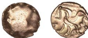
27 CORIELTAUVI , Uninscribed issues, Stater, Domino type, worn wreath pattern, rev. stylised horse left, box containing four pellets above, four-armed spiral below, 5.33g (ABC 1758; BMC 3185-6; S 393). Very fine, softly struck £600-£800