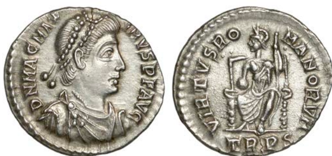
Lot 143: Siliqua of Maxnus Maximus

By the end of that day some 40 siliquae had been recovered, all single finds distributed over an area of some twenty square metres. The next day a similar number was found. Over the next two years, Mr Finder returned time and time again, working around pandemic 'lockdowns', to increase the total number of finds to nearly 300. Each and every find was logged using a hand-held GPS unit, allowing Mr. Finder to accurately plot the distribution of the coins; the final tally of ploughsoil finds were distributed over an area of almost a third of an acre. A number of the coins were found in fragmentary condition, and many of these showed signs of fresh damage. This, combined with the hoard's scattered dispersal, suggests that it was disrupted by recent, ongoing, agricultural activity; it seems clear that Mr. Finder's diligent effort has saved the Colkirk Hoard from further loss and destruction.