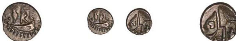
31 DUROTRIGES , Uninscribed issues, silver Quarter-Stater [Boat Bird type], crescent with three appendages ('three men in a boat'), rosette to left, rev. zigzag thunderbolt dividing various ornaments, 0.88g (ABC 2208; BMC 2734-47; S 368). Good very fine, toned £90-£120

Provenance: found near Standlake (Oxfordshire) in 2023 (PAS OXON-FB3D18)