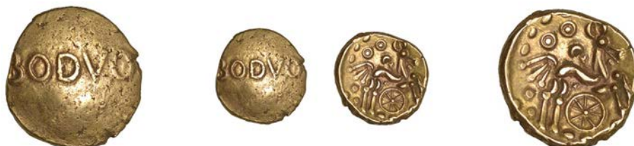
30 DOBUNNI, Bodvoc (25-5 BC), Stater, \text{BODVO}[c] on plain field, rev. triple-tailed horse bounding right through star-filled field, wheel below, frowning face above, 5.42g/1h (ABC 2039; BMC 3135ff; VA 1052-1; S 388). Good very fine, reverse well-centred, sharply struck up and pleasing, very rare thus £4,000-£5,000

Provenance: found near Standlake (Oxfordshire) in 2023 (PAS OXON-FB3D18)