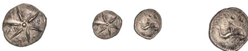
15 ATREBATES and REGNI, Tincomarus, silver Unit, dolphin type, star of six limbs, faint traces of inscription, rev. boy on dolphin right, traces of inscription around, 1.28g (ABC 1127; VA 371-1; S 88). Very fine for issue £120-£150