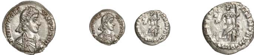
179 Siliqua, Milan, 395-402, D N HONORI-VS P F AVG, pearl-diademed, draped and cuirassed bust right, 'Eastern' pteryges, rev. VIRTVS RO-MANORVM, Roma seated left on cuirass, holding reversed spear and Victoriola on globe, MD PS in exergue, 1.28g/12h (MC 406, this coin ; Hoxne 719ff; RIC X p.321, 1228; RSC 59+b). Struck from a worn reverse die and with a few tiny blisters, obverse nearly extremely fine £80-£100