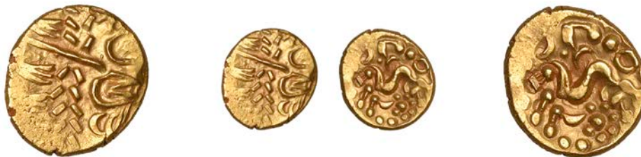
26 CORIELTAUVI , Uninscribed issues, Stater, British I [North East Coast type], devolved head of Apollo right, rev. disarticulated horse left, charioteer's arm above, rosette below, 6.16g (ABC 1731; BMC 202; VA 805-9; S 29). Hairline stress mark, otherwise good very fine, well-centred and very rare £800-£1,000