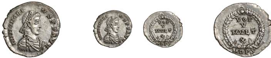
178 Siliqua, Milan, 395-402, D N HONORI-VS P F AVG, pearl-diademed, draped and cuirassed bust right, rev. VOT V MVL T X in four lines within wreath, MD PS in exergue, 1.56g/12h (MC 226, this coin ; Hoxne 703; RIC X p.321, 1226; RSC 63+). Clipped, surface marks, very fine £60-£80