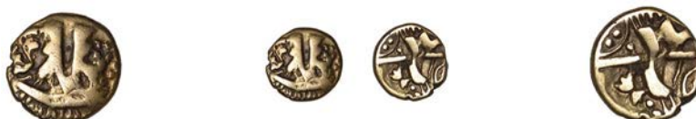
11 BELGAE. Uninscribed series, Quarter-Stater, British O [Hampshire Thunderbolt type], stylised boat with two standing figures, rev. cruciform thunderbolt motif, 1.29g (ABC 767; BMC 129-36; S 46). Very fine, peripheral hairline striking crack £200-£260