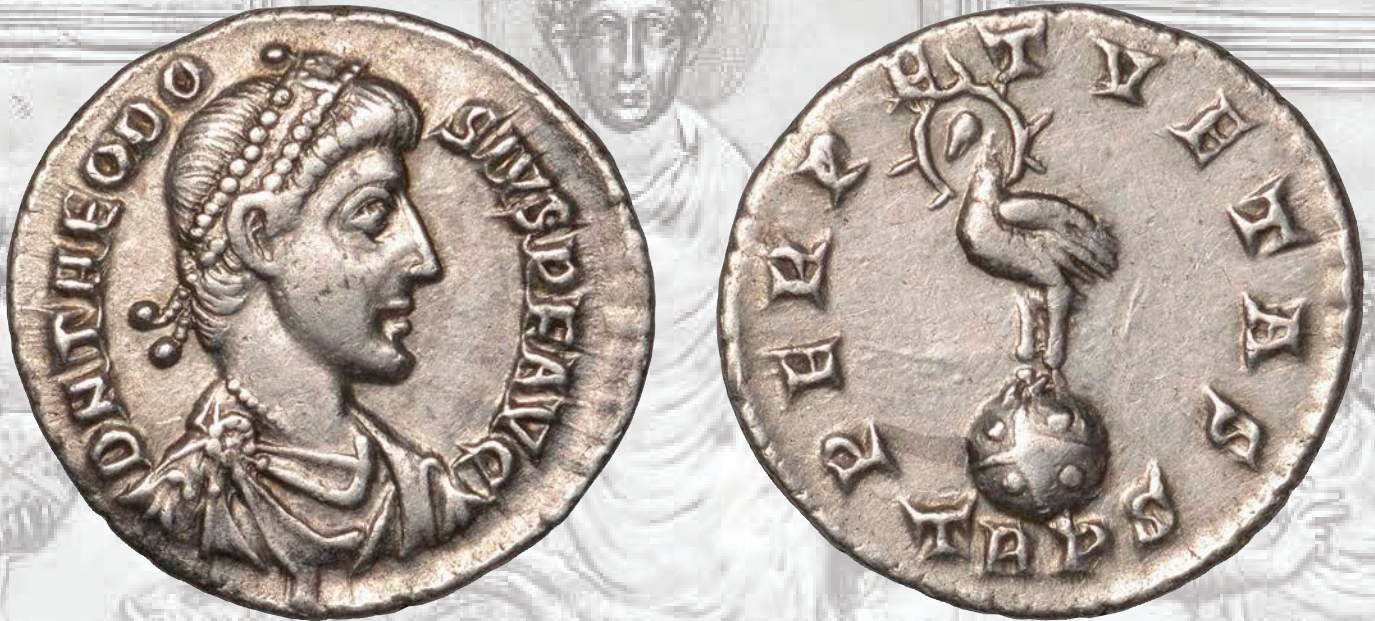
Lot 137: Third-Miliarensis of Theodosius

The most numismatically significant item contained with the Colkirk hoard is an extremely rare coin of Theodosius I. With its unusual reverse type (depicting a phoenix nimbate standing to the left upon a zoned globe) and unusual weight standard (weighing far less than contemporary, unclipped, Siliquae), this coin clearly belongs outside of the ordinary issues of the Trier mint. Similar coins were produced in the names Theodosius' contemporaries, Gratian and Valentinian II. Mr M. Cuddeford has offered a review of this fascinating coinage in a paper set to be published in the upcoming volume of the Numismatic Chronicle . Cuddeford proposes that these rare coins ought to be recognised as third-Miliarensia. This is supported, not only, by the coins' metrology, but also by developments in the contemporary gold coinage; in 383 Magnus Maximus introduced a third-Solidus, intended for use in donative payments.