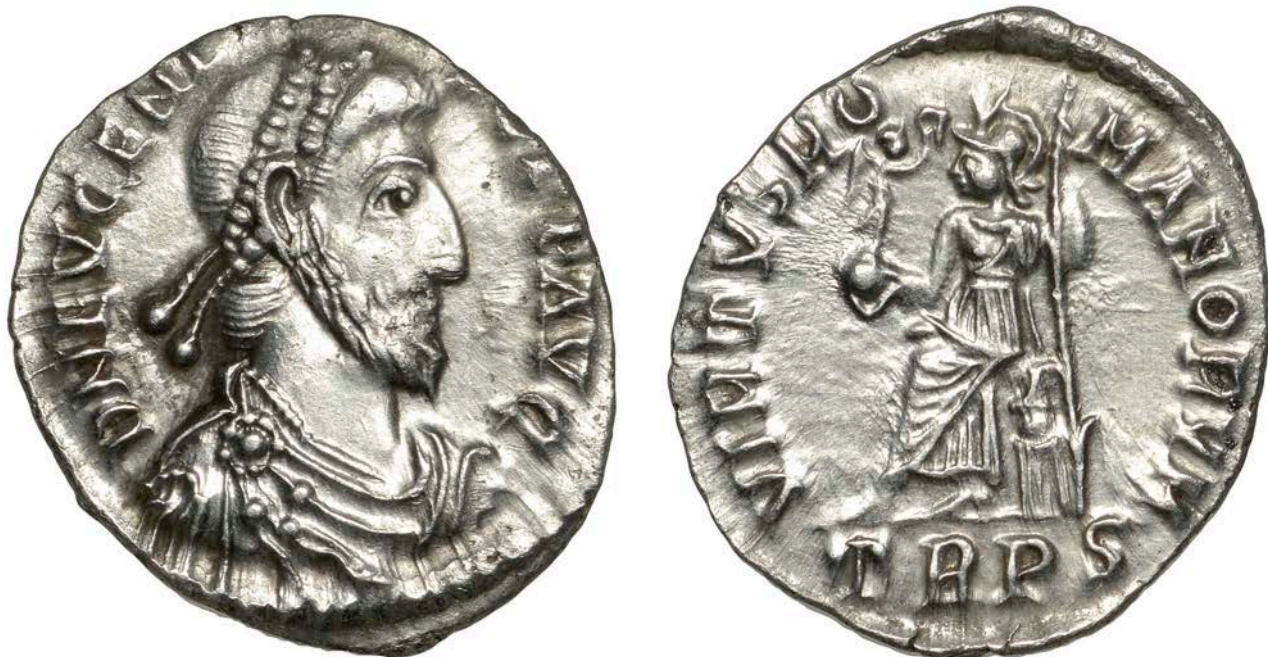
Lot 167: Siliqua of Eugenius

running from Constantius II to Honorius. Several of the coins have been clipped to a light or moderate degree, with only a few having been extensively clipped beyond the legends. Ninety-two internal die links were noted by the finder, with Arcadius and Honorius predominating. This pattern, along with the presence of clipped siliqua within the hoard, supports a deposition date in the early fifth century.