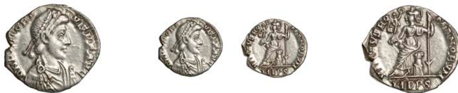
181 Siliqua, Milan, 395-402, D N HONORI-VS P F AVG, pearl-diademed, draped and cuirassed bust right, 'Eastern' pteryges, rev. VIRTVS RO-MANORVM, Roma seated left on cuirass, holding inverted spear and Victoriola on globe, MD PS in exergue, 1.54g/6h (MC 400, this coin ; Hoxne 720 [B]; RIC X p.321, 1228; RSC 59+b). A little softly struck on obverse, good very fine £50-£60