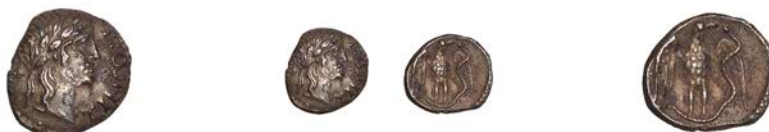
13 ATREBATES and REGNI, Tincomarus (c. 25 BC - 10 AD), silver Unit, Eagle type, laureate head right, TINCOM-B around, rev. eagle with open wings, holding serpent in talons, 1.31g/12h (ABC 1106; BMC 880ff; S 83). Traces of porosity, otherwise good very fine, rare thus £240-£300