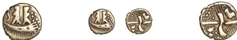
8 BELGAE. Uninscribed series, Quarter-Stater, British O [Hampshire Thunderbolt type], stylised boat with two standing figures, rev. cruciform thunderbolt motif, 1.32g (ABC 767; BMC 129-36; S 46). Hairline striking crack, otherwise very fine, broad flan for issue £240-£300