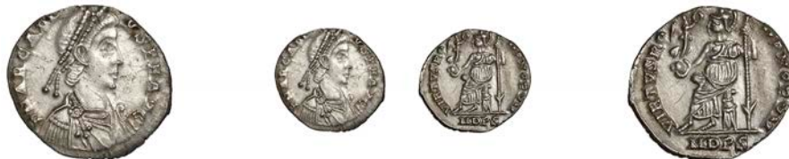
160 Siliqua, Milan, 395-402, D N ARCADI-VS P F AVG, pearl-diademed, draped and cuirassed bust right, 'Eastern' Pteryges, rev. VIRTVS RO-MANORVM, Roma seated left on cuirass, holding sceptre and Victoriola on globe, MD PS in exergue, 1.43g/12h (MC 391, this coin ; Hoxne 706 [B]; RIC X p.321, 1227; RSC 27b). Clipped, light surface marks, very fine £50-£60