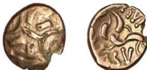
29 CORIELTAUVI, Esuprasu (40-47 AD), a contemporary plated Stater, cruciform wreath design with rosettes in angles, rev. disjointed horse left, \text{ASV} around, 3.36g ( cf. ABC 1917; BMC 3269; S 405). Much residual plating, small edge chip, very fine £120-£150