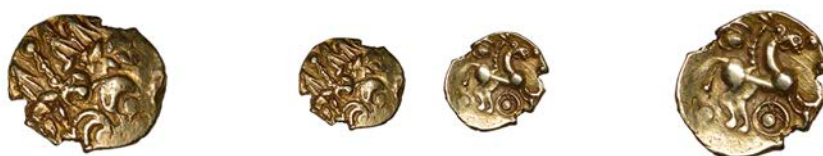
32 ATREBATES and REGNI , Early Uninscribed issues, Quarter-Stater, Essex Wheels type, devolved head of Apollo, trace of wheel visible, rev. horse right with pelleted mane, wheel below, 'onion' motif above, 1.40g (ABC 2231; BMC 485; S 48). Struck on an oval flan, good very fine and very rare £400-£500