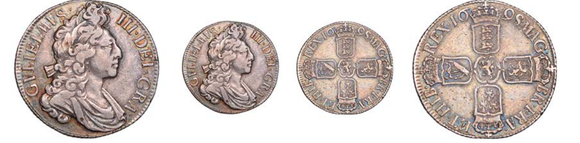
376 Shilling, 1698, fourth bust (ESC 1141; S 3515). About very fine with some toning, scarce