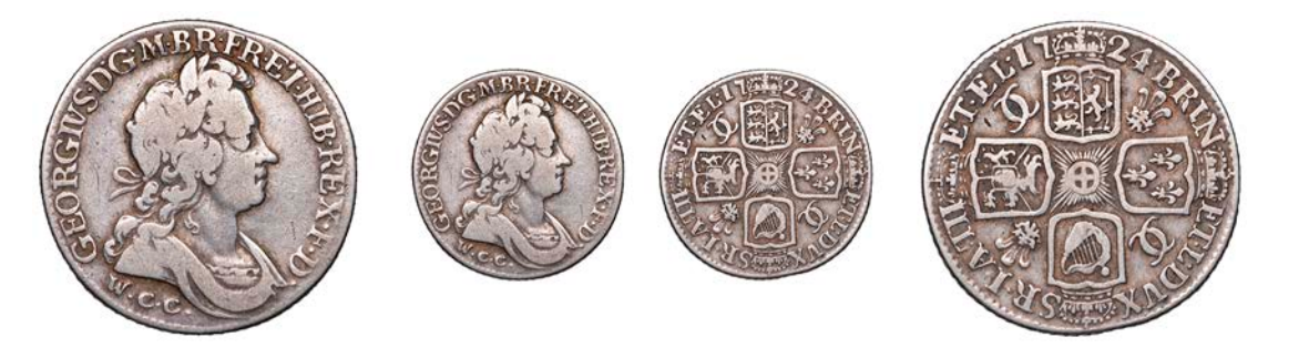
392 Shilling, 1724 wcc, second bust (ESC 1595; S 3650). Good fine, very rare