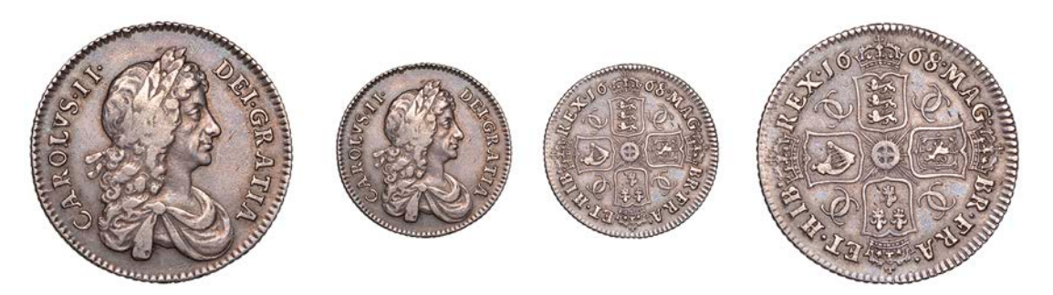
358 Shilling, 1668, second bust (ESC 511; S 3375). Very fine