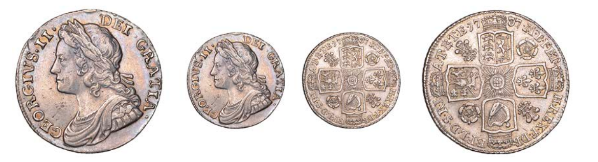
399 Shilling, 1737, roses and plumes (ESC 1711; S 3700). Lightly cleaned, otherwise good very fine