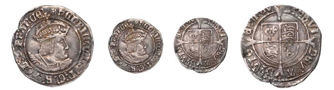
251 Second coinage, Groat, Tower, mm. rose, bust B, Greek profile, saltires in cross ends, 2.53g/4h (Whitton 1; N 1797; S 2337D). Light find patina, better than very fine, scarce £400-£500