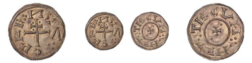
111 KINGDOM OF YORK, Cnut, Penny, CNVT REX around patriarchal cross, trefoils of pellets in legend, rev. CVH HET TI around small cross pattée with pellet in first and fourth quarters, trefoils of pellets in legend, 1.36g/8h (Lyon/Stewart, Gp Ile [c-1(b):CR-G]; N 501; S 993). Extremely fine, golden tone over residual lustre

Provenance: Glendining Auction, 28 March 1984, lot 156