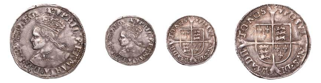
280 Groat, mm. lis, reads PHILIP ET MARIA D' G' REX ET REGINA, 1.86g/2h (N 1730; S 2508). Scratch behind head, otherwise about extremely fine, superb portrait £900-£1,200