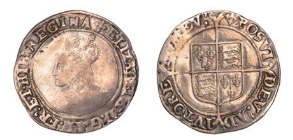
285 Second issue, Shilling, mm. cross-crosslet, bust 1A, 5.61g/9h (N 1985; S 2555A). Polished, fine, reverse better