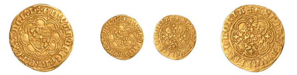
189 Transitional Treaty period, Quarter-Noble, series A2, mm. cross potent, saltire stops, trefoils on spandrels, annulets on cusps on obv., lis above lion in fourth quarter, 1.89g/1h (SCBI Schneider 69, same dies; N 1224(iii); S 1501). Very fine, full broad flan