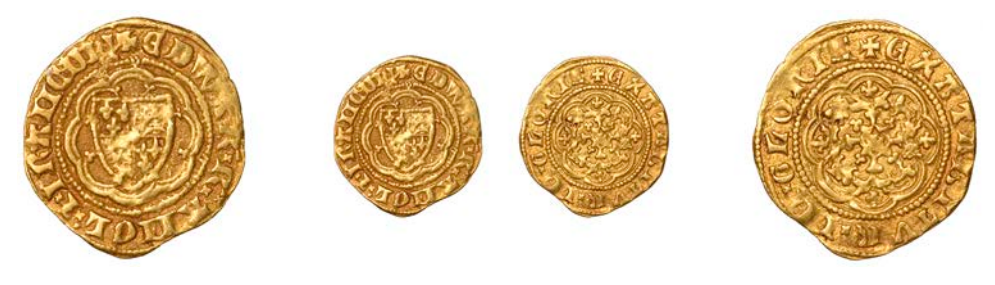
187 Pre-Treaty period, Quarter-Noble, series Gf/Gg mule, mm. cross, 1.80g/10h (cf. SCBI Schneider 49; N 1191; S 1498). Struck from tired dies, about very fine