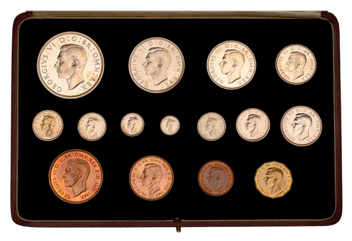
562 Proof set, 1937, comprising Crown to Farthing [15]. About as struck, brilliant; in case of issue