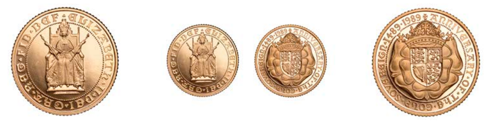
G 557 Proof Half-Sovereign, 1989, Sovereign Anniversary (M 544H; S SB3). Brilliant, virtually as struck

G 556 Proof Sovereign, 2020 (S SC9H). Brilliant, as struck; in case of issue with original certificate of authenticity [no. 1428]