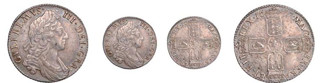
375 Shilling, 1697, third bust variety (ESC 1132; S 3511). Toned, about extremely fine