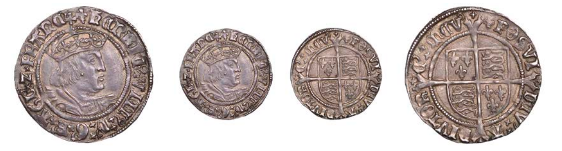
252 Second coinage, Groat, Tower, mm. lis (A), bust D, saltires in cross ends, 2.53g/4h (Whitton (iv); N 1797; S 2337E). About extremely fine and richly toned; the bust well struck up and pleasing £900-£1,200

Provenance: Bt Baldwin mid 1980s; SNC April 2008 (HS 3337); Bt CNG