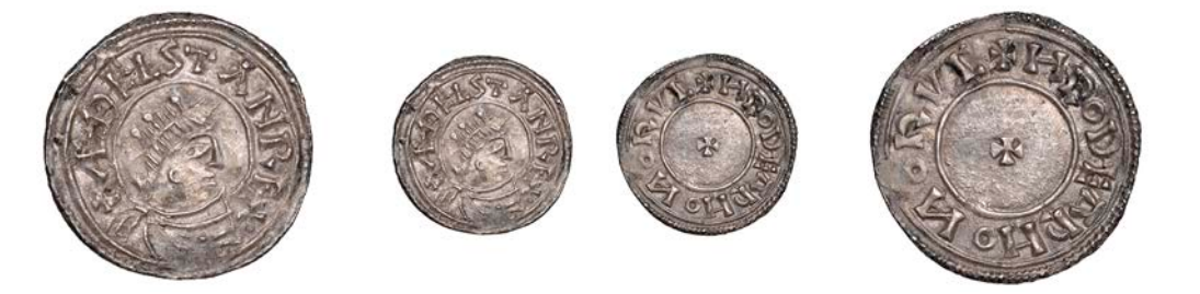
112 Penny, Crowned Bust type, Norwich, Hrodgar, ÆDELSTAN REX crowned and draped bust right breaking inner circle, rev. HRODEAR HO NORVC, 1.51g/9h (Blunt 284; N 675; S 1095). Some find patina, otherwise good very fine, strong portrait £3,000-£4,000