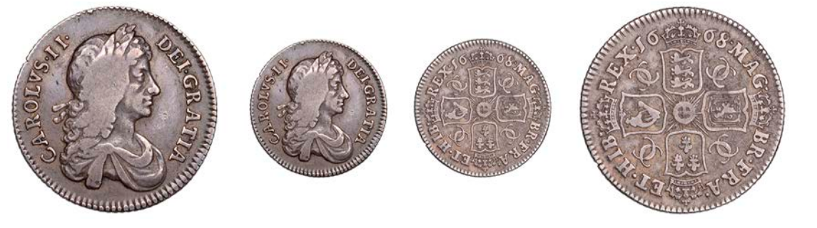
359 Shilling, 1668, second bust (ESC 511; S 3375). Good fine, toned