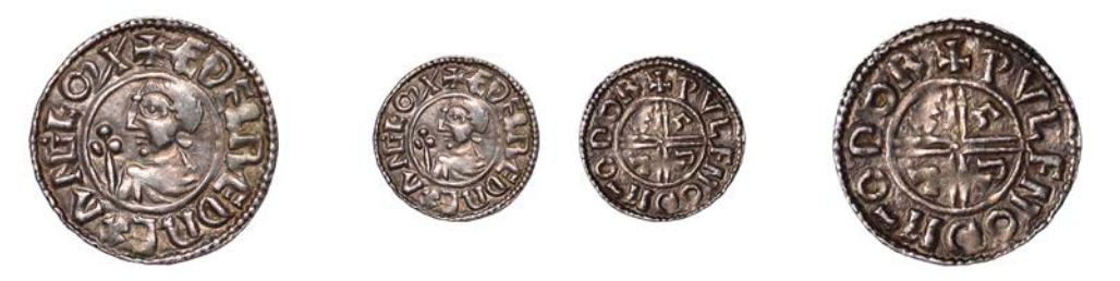
114 Penny, CRVX type, Dorchester , Wulfnoth, PVLFNOD M<sup>-</sup>O DOR, 1.65g/12h (BEH 436; FEJ 250; N 770; S 1148). Very fine, neat round flan with some toning, very rare thus £800-£1,000