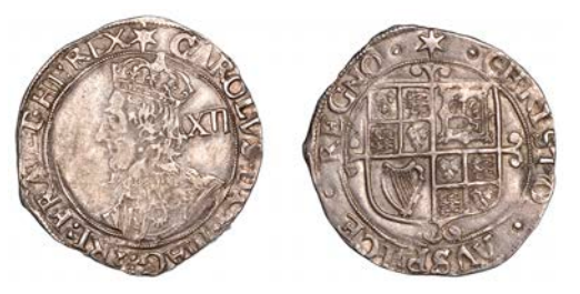
322 Tower mint, Shilling, Gp G, mm. star, 6.05g/7h (SCBI Brooker 548; Sharp G1/2; N 2231; S 2799). Very fine