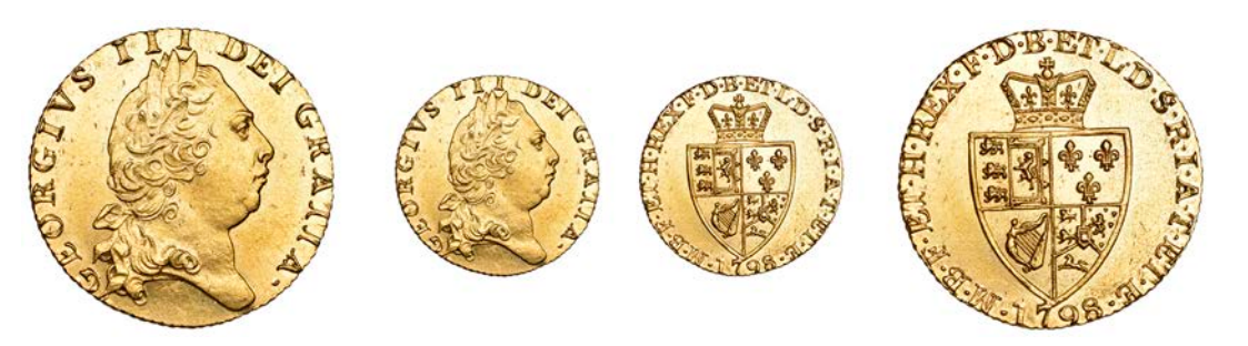
408 Guinea, 1798, fifth bust (EGC 732; S 3729). Extremely fine or better