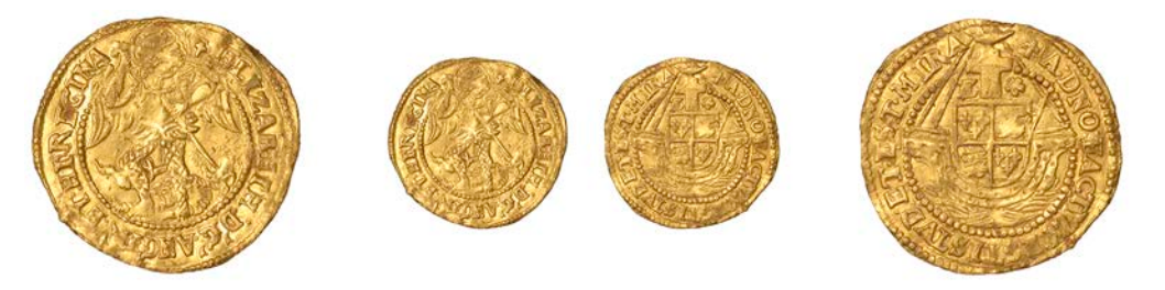
281 Fifth issue, Half-Angel, mm. Latin cross, 2.45g/12h (Brown/Comber D9; cf. SCBI Schneider 772-3; N 1992/1; S 2526). A few small marks and scuffs, otherwise better than very fine, on a full round flan, very rare £4,600-£5,000