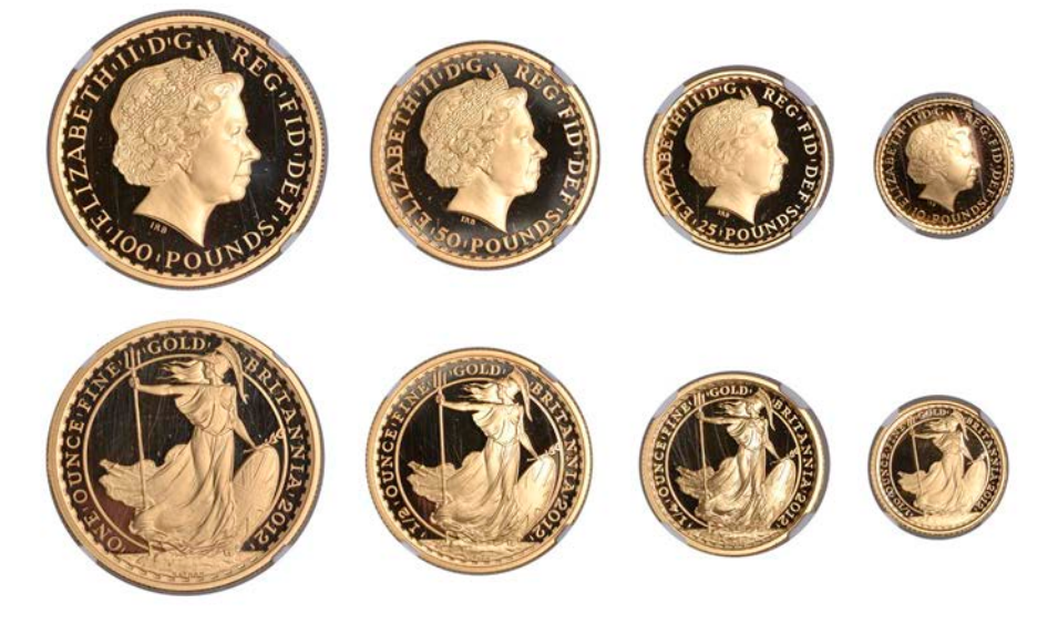
G 561 Britannia gold Proof set, 2012, comprising 100, 50, 25 and 10 Pounds (S PBG35) [4]. Brilliant, as struck [each certified and graded by NGC as PF 70 Ultra Cameo]; sold with original Royal Mint case £2,400-£3,000