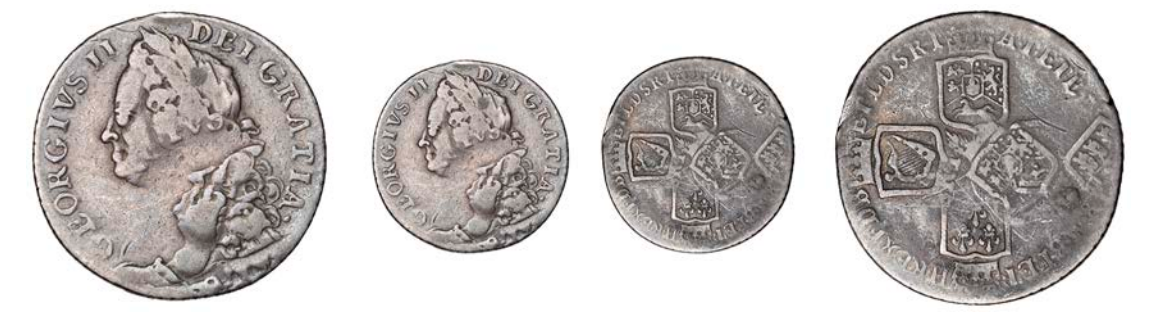
405 Shilling, date unclear [1743-58] ($ 3702-4). A double strike showing two portraits and reverse designs, the second 70% off-centre, nearly fine, an extremely rare and unusual misstrike £240-£300