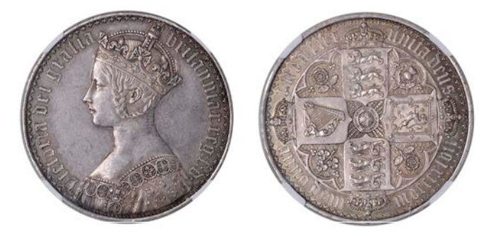
487 'Gothic' Crown, 1847, edge UNDECIMO (ESC 2571; S 3883). Nearly extremely fine [certified and graded by NGC as PF 60] £5,000-£7,000

486 'Gothic' Crown, 1847, edge UNDECIMO (ESC 2571; S 3883). Extremely fine and toned [certified and graded by NGC as PF 61] £5,000-£6,000