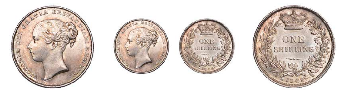
500 Shilling, 1842 (ESC 2987; S 3904). Minor surface marks, otherwise extremely fine or better, lightly toned