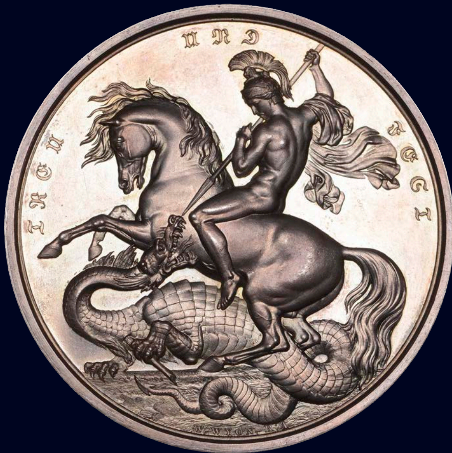
ENGLAND, PRINCE ALBERT, 1845, A SILVER PERSONAL AWARD MEDAL BY W. WYON ESTIMATE: £800-£1,000

FOR ALL ENQUIRIES PLEASE CONTACT PETER PRESTON-MORLEY ON 020 7016 1700 OR EMAIL COINS@NOONANS.CO.UK