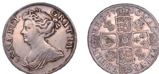
182 Halfcrown, 1710, roses and plumes, edge NONO (ESC 1372; S 3607). Toned, once lightly cleaned, almost very fine