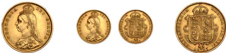
G 220 Half-Sovereign, 1887 (Hill 478C; S 3869). Almost extremely fine