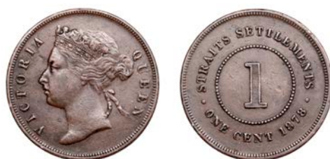
357 Victoria, Cent, 1878, Calcutta (KM 9). Even brown patina, very fine and extremely rare £400-£500