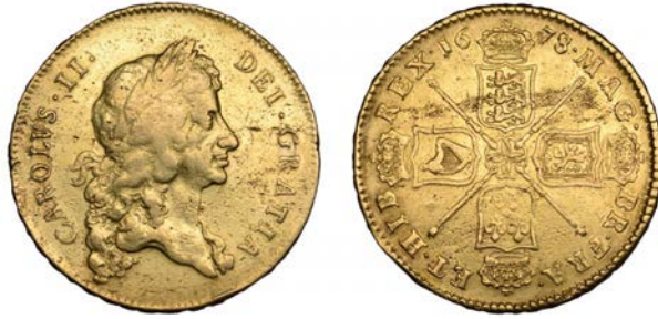
169 Five Guineas, 1678/7, first bust, edge TRICESIMO (MCE 15; S 3328A). Ex-jewellery, some roughness in reverse field, otherwise good fine and very rare £6,000-£8,000