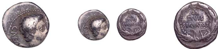
290 Denarius, Spain, possibly Colonia Patricia, 19-18, bare head right, rev. OB CIVIS SERVATOS in three lines within oak wreath, 3.58g/7h (Chilfrome 69, this coin; RIC 77A; BMC 378; RSC 208). Obverse off centre, nearly fine £60-£80