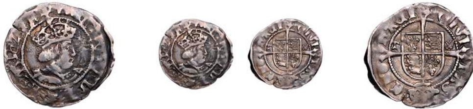
151 Halfgroat, York, Abp Wolsey, mm. voided cross, \tau\omega by shield, cardinal's hat below, 1.04g/12h (Whitton i (var); N 1805; S 2346). Very fine, some peripheral weakness, toned £150-£180