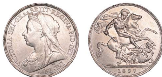
226 Crown, 1897, edge LXI (ESC 2602; S 3937). Cleaned, otherwise extremely fine £100-£120