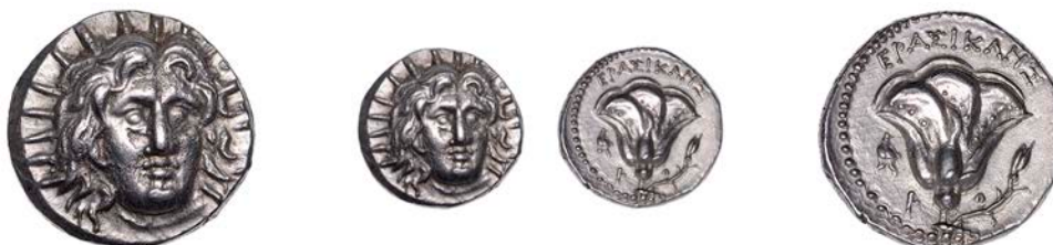
256 ISLANDS OFF CARIA, Rhodes , Didrachm struck under the magistrate Erasikles, c. 275-250, radiate head of Apollo facing slightly right, rev. rose bud, Phrygian helmet to left, ΕΡΑΣΙΚΛΗΣ above, P-O below, 6.78g/12h (SNG Copenhagen 764; BMC 139). Traces of minor porosity, otherwise good very fine, well centred £300-£360