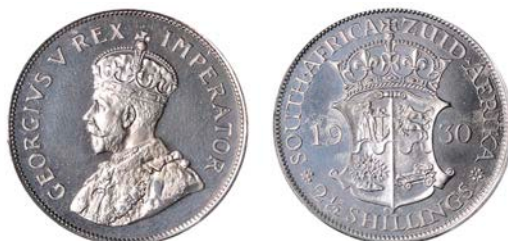
350 George V (1910-1936), Proof Halfcrown, 1930, Pretoria (Hern S281; KM 19.2). A superb example with deep reflective fields and a strong cameo; practically as struck and extremely rare [Graded by PCGS as PR 64] £4,000-£5,000