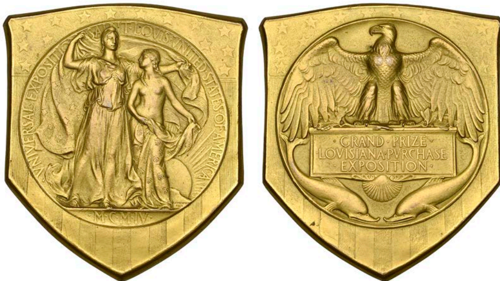
395 Louisiana Purchase Exposition, St Louis, 1904 , Grand Prize, a gilt-bronze shield-shaped plaque by A.A. Weinman, standing figures representing Columbia and Louisiana, rev. eagle with wings outstretched, two dolphins below, 74 x 64mm, 149.39g (Baxter 109; Krueger 17; GV 52.6). Very fine and extremely rare £800-£1,200