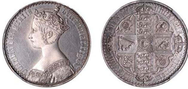
222 'Gothic' Crown, 1847, edge UNDECIMO (ESC 2571; S 3883). Fields clouded by residue, hairlines beneath, otherwise extremely fine [Graded by NGC as PF Details - Obv. repaired] £2,000-£2,600