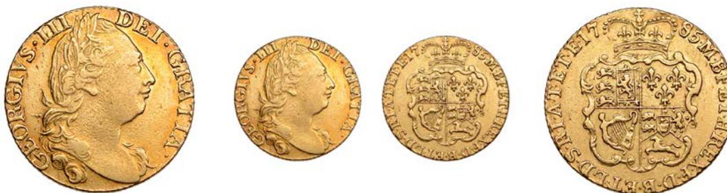
195 Guinea, 1785, fourth bust (EGC 708; S 3728). Good fine, cleaned