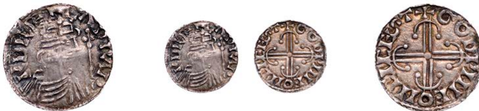
112 Penny, Hammer Cross type, Chichester , Godwine, GODPINE ON CICEST, 1.28g/10h (Freeman 18; HHK 123; Sussex Mints 23; BMC 127; N 828; S 1182). Good fine, toned £150-£200