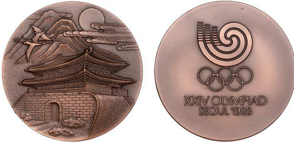
394 Olympic Games, Seoul, 1988 , a bronze Participant's medal by K. Kwanghyun, South Gate temple, mountains and flying cranes above, rev. Seoul Games logo above legend, 60mm, 118.91g (GV 267.2). As struck; in original blue felt box with outer packaging £120-£150