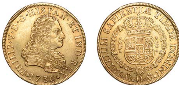
344 PHILIP V, 8 Escudos, 1736 MF , 27.04g/12h (VI 1735; Cal. 2235; KM 138). Minute edge bruise at 1 o'clock otherwise good very fine, attractive yellowish tone £3,000-£4,000