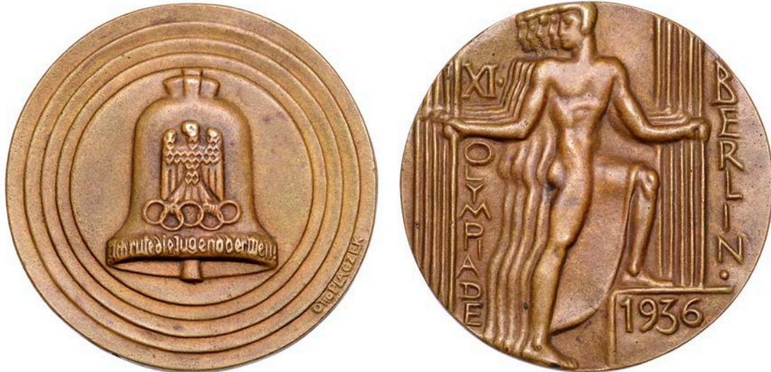
385 Olympic Games, Berlin, 1936 , a cast bronze Participant's medal by O. Placzek for Bildgießerei Hermann Noack, semi-naked athletes mounting podium, rev. bell decorated with eagles holding Olympic rings in claws, 70mm, 118.82g (GV 99.2; Heidemann, DGMK 7, 6.28; Alfen 43; cf. Silich II, 761). Very fine; in original red card box of issue [- this damaged] £150-£200