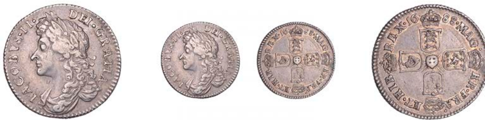
176 Sixpence, 1688 (ESC 780; S 3413). Toned, very fine £200-£300