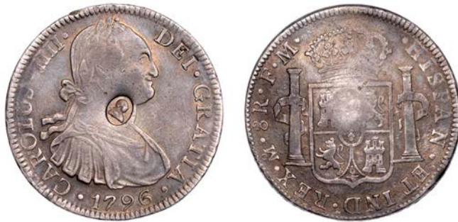
199 MEXICO, Charles IV, 8 Reales, 1796 FM , Mexico City, rev. countermarked with head of George III in oval [1797], 27.08g (ESC 1852; S 3765A; Cal. 959 for host coin). Countermark good very fine, host coin good fine, toned £150-£200