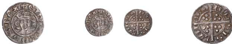
138 Farthing, class Ia, London 0.41g/3h (Withers Ia; SCBI North 996; N 1051; S 1443). Better than very fine, dark toned £240-£300