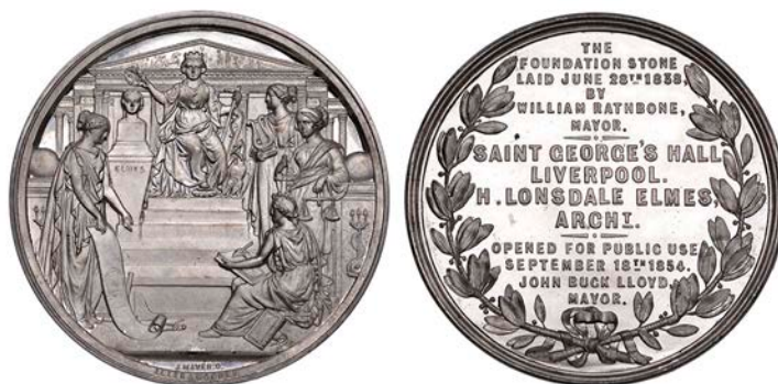
370 Opening of St. George's Hall, Liverpool, 1854, a white metal medal by J. Mayer for Allen & Moore, figure enthroned facing, holding rudder and crowning herme of architect Havery Elmes to left, rev. inscription in fourteen lines within laurel wreath, 44mm (BHM -; Eimer -). Lustrous and prooflike, practically as struck £70-£90