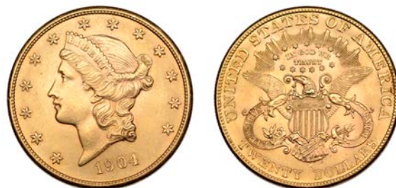
G 362 20 Dollars, 1904s. Light bagmarks, otherwise extremely fine £1,800-£2,200