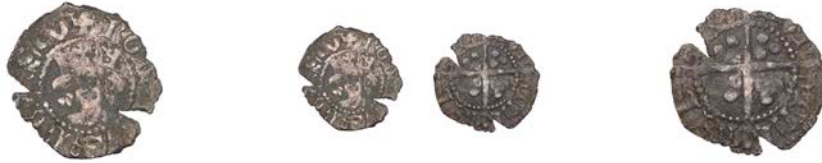
247 Heavy coinage, First issue, Halfpenny, Edinburgh, ROBERTVS REX SCO, annulet stops, rev. VILLA EDINBVRGH, 0.33g/12h (SCBI 35, 610; SCBI 72, 312ff; B 1, fig. 347; S 5187). Fine but flan ragged, rare £100-£120