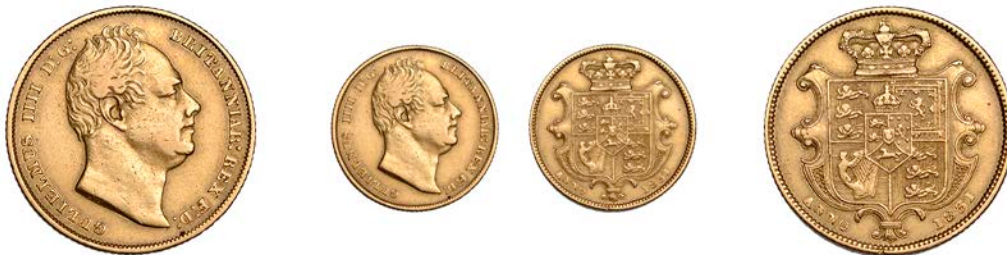
G 215 Sovereign, 1831, first bust, w.w. with stops (Hill 16; S 3829). Good fine