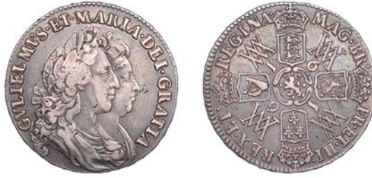
178 Halfcrown, 1691, second busts, edge TERTIO (ESC 850; S 3436). Toned, nearly very fine, scarce