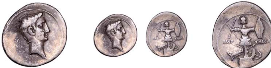
285 Denarius, uncertain Italian mint, c. 30-29, bust right, rev. IMP CAESAR, naval and military trophy set on ship's prow, rudder and anchor at base, 3.75g/3h (Chilfrome 84, this coin ; RIC 265a; RSC 119). Good fine, some surface deposit, banker's mark on cheek £90-£120