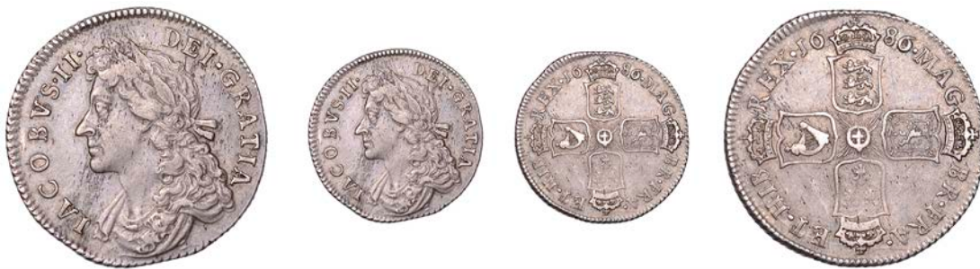
175 Shilling, 1686 (ESC 765; S 3410). Light haymarking, very fine or better, attractive tone £400-£500

Provenance: Spink Auction 18006, 25 September 2018, lot 1762