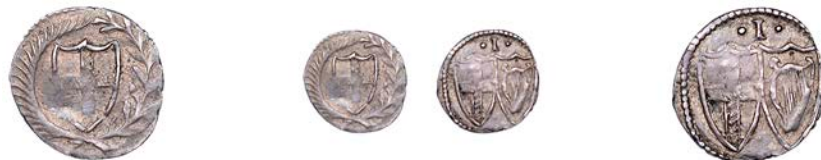
168 Penny, 0.51g/6h (ESC 228; N 2729; S 3222). Very fine, toned £100-£120

Bidders interested in English Hammered Coins are reminded of the forthcoming auction A Collection of English Silver Coins, The Property of a Gentleman (Part I) , to be held in these rooms on the afternoon of the same day as the current sale, beginning at 14:30.