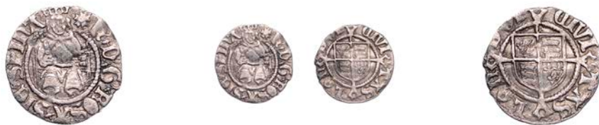
153 Second coinage, Penny, London, mm. rose on obv. only, 0.57g/11h (N 1808; S 2349). Very fine £90-£120