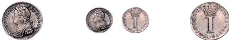
193 Maundy Penny, 1739 (ESC 1825; S 3715A). About as struck, beautifully toned