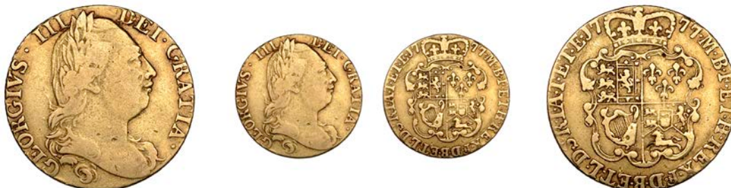
194 Guinea, 1777, fourth bust (EGC 695; S 3728). Fine