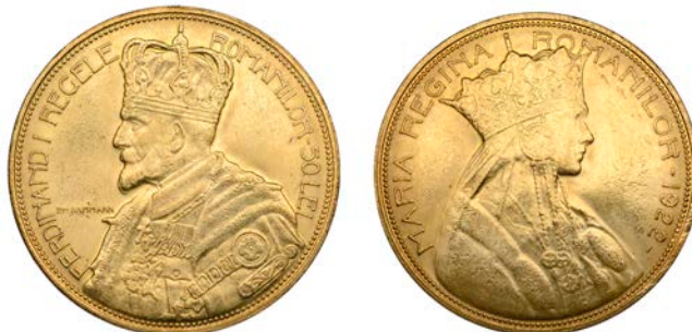
345 Ferdinand I, 50 Lei, dated 1922 (1928), Coronation issue, London (Fr. 11; KM M3). Some light bagmarks in fields, otherwise almost extremely fine, rare £4,000-£5,000