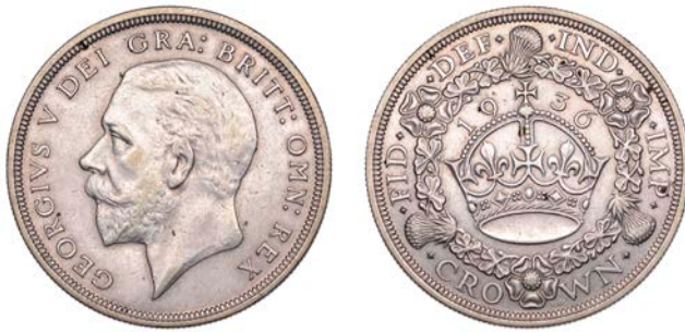
234 Crown, 1936 (ESC 3649; S 4036). Toned, almost extremely fine, scarce