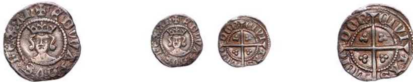
142 Treaty period, Halfpenny, London, colon stops, Treaty x in REX, 0.52g/12h (Withers II 17b; N 1274; S 1634). Very fine, clear portrait, toned £80-£100