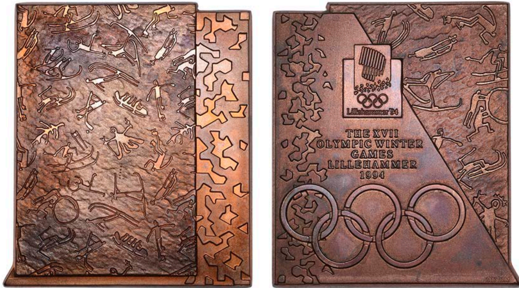
392 NORWAY, Winter Olympic Games, Lillehammer, 1994 , a bronze Participant's plaque by M. Kleppan, pictograms of athletes set against ice crystals and the Lillehammer logo, rev. more pictograms, 76 x 66mm, 221.25g (GV 493.2; cf. DNW 128, 686). Virtually as struck, a very detailed and distinguished modernistic design; in wooden case of issue which doubles as a display stand