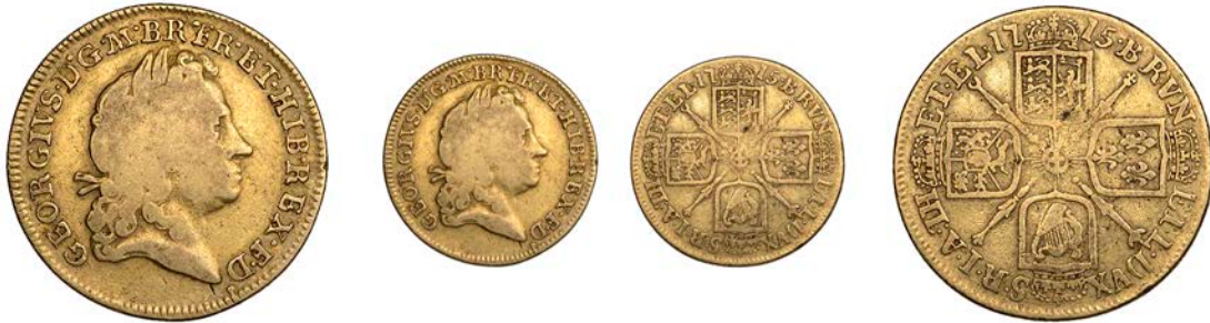
184 Guinea, 1715, third bust (EGC 504; S 3630). Fair, toned