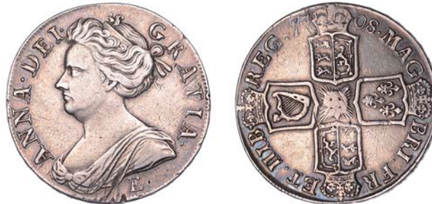
180 Crown, 1708E, edge SEPTIMO (ESC 1356; S 3600). Once cleaned and now lightly toned, nearly very fine