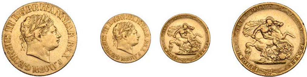
G 204 Sovereign, 1820, closed 2 (Hill 4B; S 3785C). Bright, good fine