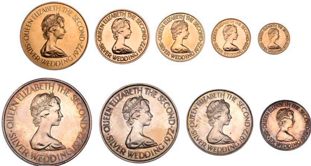
244 Elizabeth II, Proof Set, 1972, Silver Wedding Anniversary, comprising Five Pounds to Fifty Pence (KM 35-43) [9]. All lightly toned, about as struck; in original blue cloth case of issue £4,000-£5,000