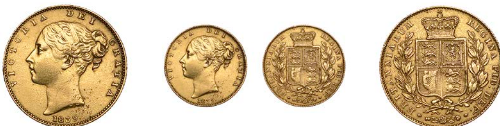
216 Sovereign, 1839 (Hill 23; S 3852). Cleaned, otherwise very fine