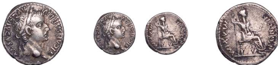
308 Denarius, Lugdunum, after AD 16, laureate head right, rev. Livia as Pax, seated right on chair with ornated legs, holding sceptre and olive branch, feet on stool, PONTIF MAXIM around, 3.70g/9h (Chilfrome 89, this coin ; RIC 30; RSC 16a). About very fine, patchy patina £90-£120