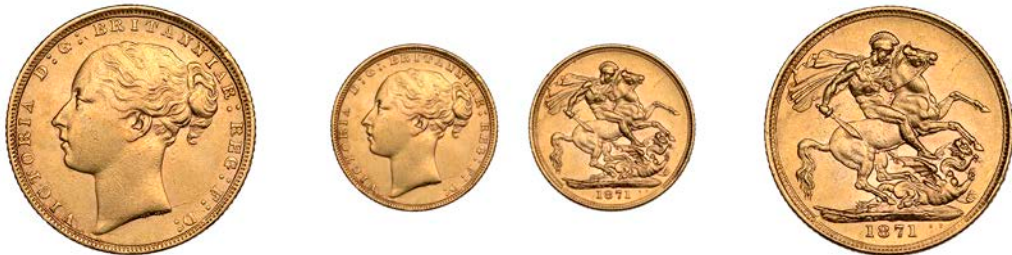
G 219 Sovereign, 1871, St. George rev., small BP (Hill 84; S 39856A). About extremely fine