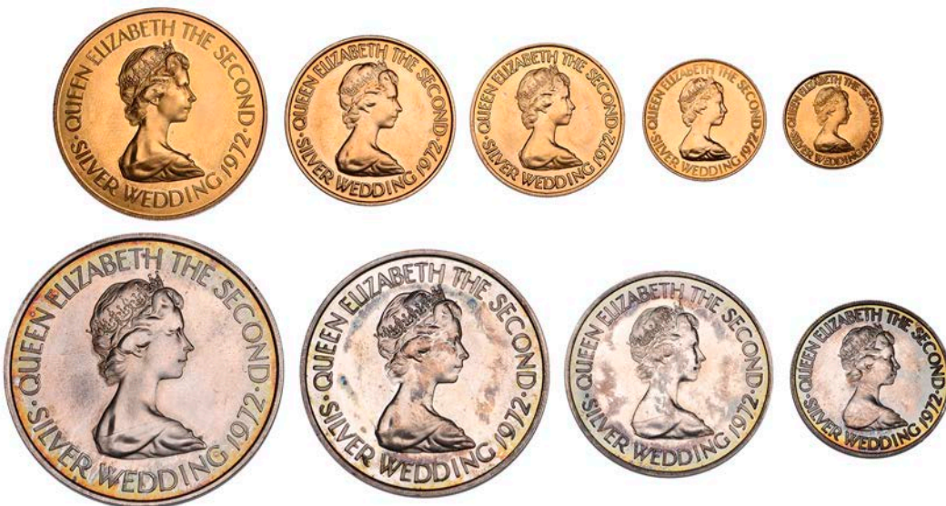
245 Elizabeth II, Proof Set, 1972, Silver Wedding Anniversary, comprising Five Pounds to Fifty Pence (KM 35-43) [9]. All lightly toned, about as struck; in original blue cloth case of issue £4,000-£5,000