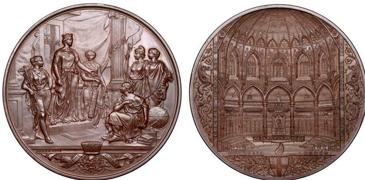
375 Opening of the New Council Chamber at the Guildhall, 1884, a bronze medal by J.S. & A.B. Wyon for the Corporation of the City of London, interior of the Chamber, rev. Londinia, attended by Commerce and Magistracy, addressing her council, 77mm (BHM 3177; E 1705; Taylor 206a). An excellent example, good extremely fine; in original fitted case of issue £200-£300