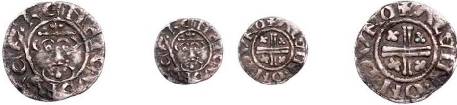
135 Penny, class IVb, Durham , Alein, ALEIN . ON . DVNO, dies 443/445, 1.14g/1h (Durham Mint 15b; SCBI Mass 1129, same dies; N 968/1; S 1348A). Good fine, mottled patina £80-£100