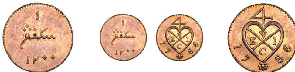
x 358 EIC, Soho, Proof Keping, AH 1200 (1786), in gilt copper, 3.22g/6h (Prid. 17b; Sch. 956a; KM 257.1). Lightly toned with subdued brilliance, extremely fine, rare £300-£400