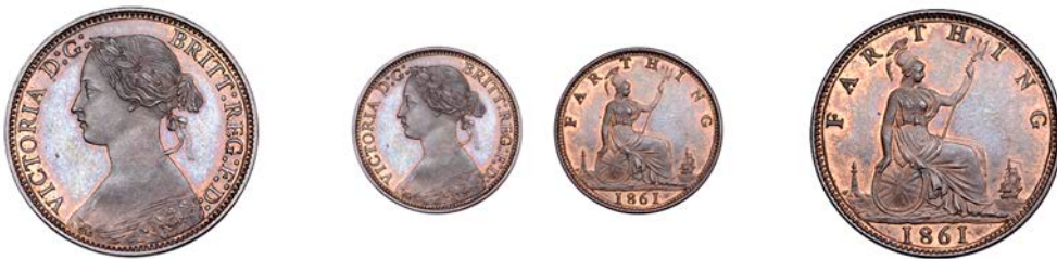
229 Proof Farthing, 1861 (BMC 1864; F 506; S 3958). Lustrous with an attractive cameo and original colour, practically as struck, rare £200-£300