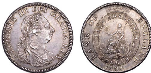
201 Dollar, 1804, types E/2, no stop after REX (ESC 1951; S 3768). A few surface marks, otherwise good very fine, toned £200-£260

Provenance: DNW Auction 136, 8 June 2016, lot 671