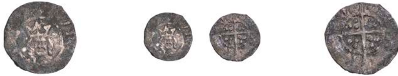
248 Heavy coinage, First issue, Halfpenny, Edinburgh (?), narrow face with tall crown, 0.51g/12h (SCBI 35, 610; SCBI 72, 312ff; B 1, fig. 347; S 5187). Fair, rare £60-£80