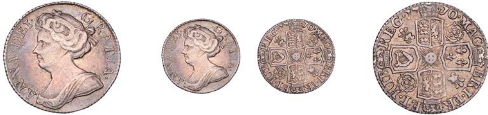
183 Sixpence, 1710, roses and plumes (ESC 1459; S 3624). Toned, good fine or better, rare