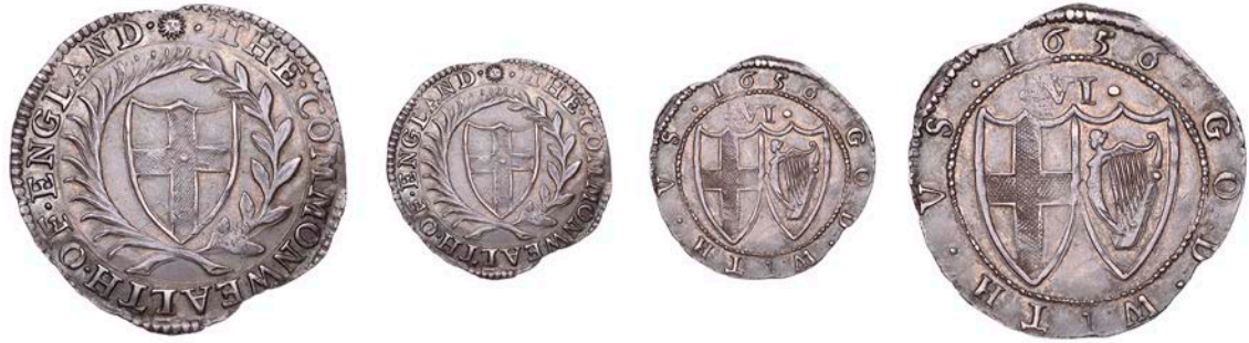
165 Sixpence, 1656, mm. sun on obv. only, 3.09g/8h (ESC 204; N 2726; S 3219). Flan slightly irregular, about extremely fine, pleasing old tone £400-£600