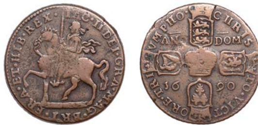
249 Gunmoney coinage, Crown, 1690, sword into legend, no stop after IAC · II, stop after REX 14.09g/12h (Withers 12/14; S 6578). Fine £60-£80