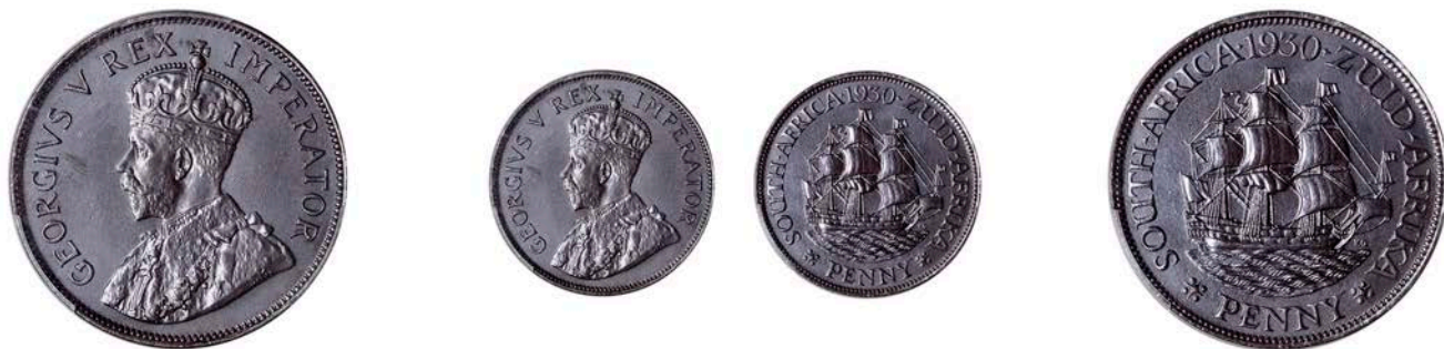
355 George V, Proof Penny, 1930, Pretoria (Hern S90; KM 14.2). A pleasing example with an even grey-brown patina, practically as struck and extremely rare [Graded by PCGS as PR 63 Brown] £600-£800