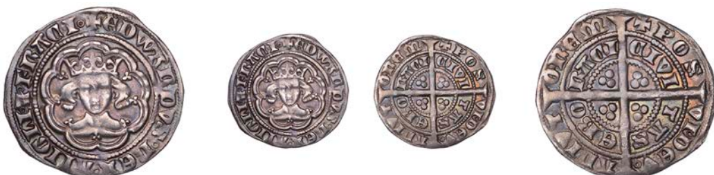
139 Halfgroat, series E, York, mm. cross 2, lis on breast, 2.26g/12h (N 1166; S 1582). Struck on a full flan with pleasing cabinet tone, good very fine, scarce £100-£150