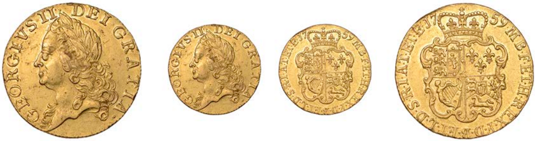
188 Guinea, 1759 (EGC 622; S 3680). Good very fine, residually lustrous, numerous surface marks