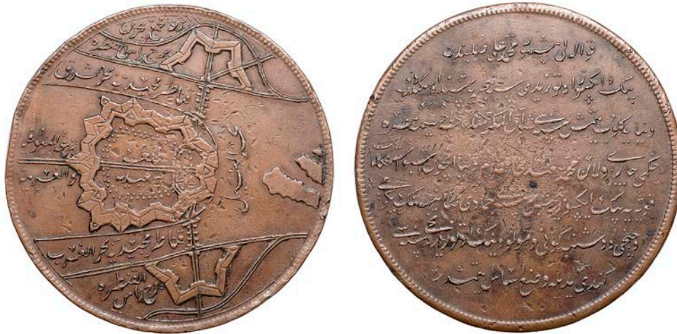
381 Construction of the Citadel of Qala'at Sa'idyya , AH 1271 (1855), in the name of Muhammad (Ali) Sa'id Pasha, a bronze medal, aerial view of fortification plans, rev. Arabic inscription in seven lines, 64mm (Fonrobert 5295). Usual pitting in fields, otherwise very fine, rare £100-£120