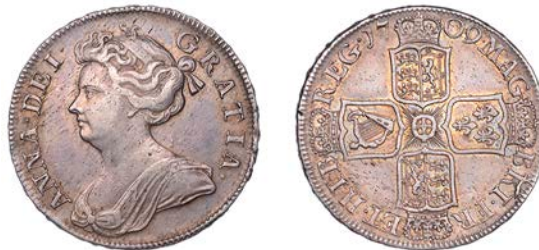
181 Halfcrown, 1709, edge OCTAVO (ESC 1371; S 3604). Attractively toned, very fine