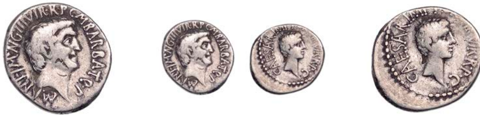
284 Denarius, mint moving with Antony, spring - early summer 41, moneyer Marcus Barbatius Pollio, bare head of Mark Antony right, M ANT IMP AVG III VIR R P C M BARBAT Q P, rev. CAESAR IMP PONT III VIR R P C, bare head of Octavian right, 3.87g/11h (Craw. 517/2; BMCRR East 100; RSC 8a). Banker's mark on Antony's cheek, good fine, reverse slightly off-centre £150-£200