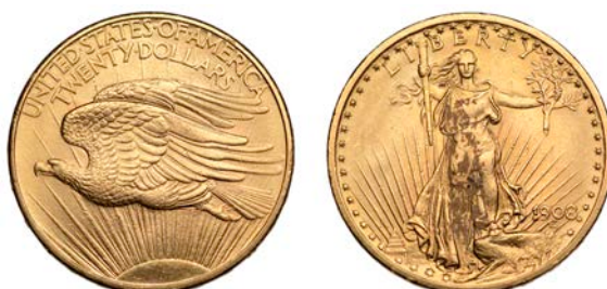
G 363 20 Dollars, 1908. Light bagmarks, otherwise about extremely fine £1,800-£2,200