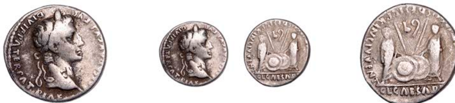
297 Denarius, Lugdunum, 2 BC-AD 4, laureate bust right, rev. Caius and Lucius Cæsars standing facing, two shields and two spears between them, simpulum and lituus in field above, 3.64g/8h (Chilfrome 77, this coin; RIC 207; RSC 43). Good fine £60-£80