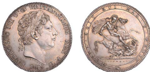
206 Crown, 1819, edge LUX (ESC 2010; S 3787). Perhaps once lightly wiped, now prettily toned, extremely fine