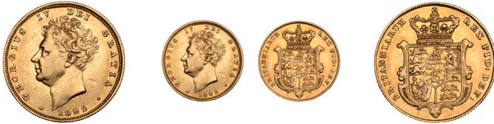
G 212 Sovereign, 1829 (Hill 14; S 3801). Toned, good very fine