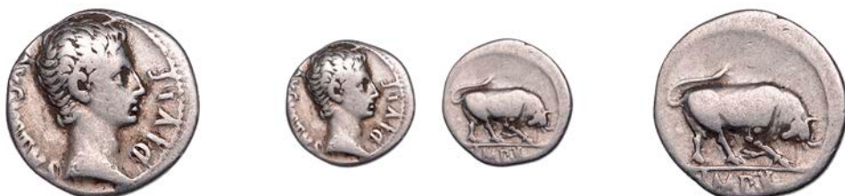
292 Denarius, Lugdunum, 15-13 BC, bare head right, AVGVSTVS DIVI F around, rev. bull butting right, IMP X in exergue, 3.58g/6h (Chilfrome 71, this coin; RIC 167a; RSC 137). Good fine, light hoard patina, scarce £120-£150