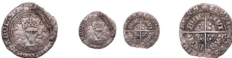
144 Halfgroat, Class E/G, London, mm. pierced cross on obv. only, mullet on neck, no marks by crown, F over z, 1.57g/4h (DIG E2/G6, this coin illustrated; N 1393; S 1775). Edge slightly chipped, otherwise fine, very rare £400-£600

Provenance: D. Greenhalgh Collection, Dnw Auction 106, 6 February 2013, lot 158