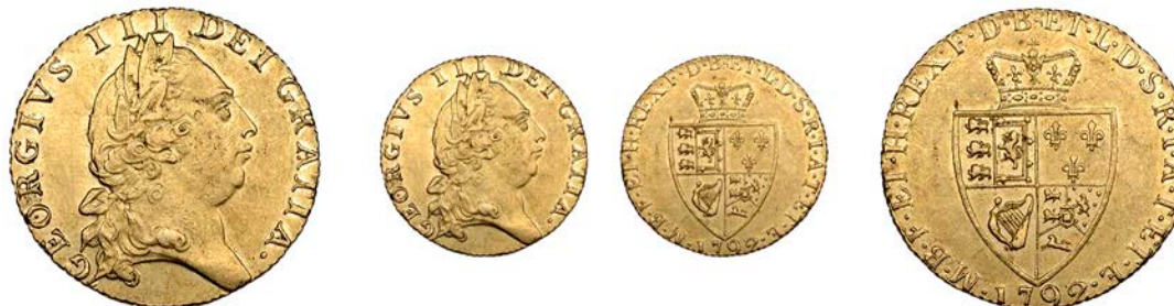
196 Guinea, 1792, fifth bust (ESC 720; S 3729). Harshly cleaned, otherwise good very fine