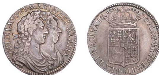
177 Halfcrown, 1690, second shield, edge TERTIO (ESC 849; S 3435). Attractively toned, nearly very fine, very rare £300-£400