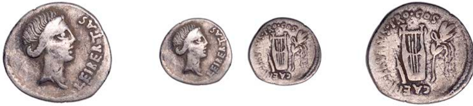
283 Denarius, Eastern mint, c. 42, bare head of Libertas right, LIBERTAS before, rev. CAEPIO BRVTVS PRO COS, plectrum, lyre and laurel branch tied with fillet, 3.61g/9h (Chilfrome 62, this coin ; Crawford 501/1; RSC 5). Good fine, light hoard patina, rare £120-£150