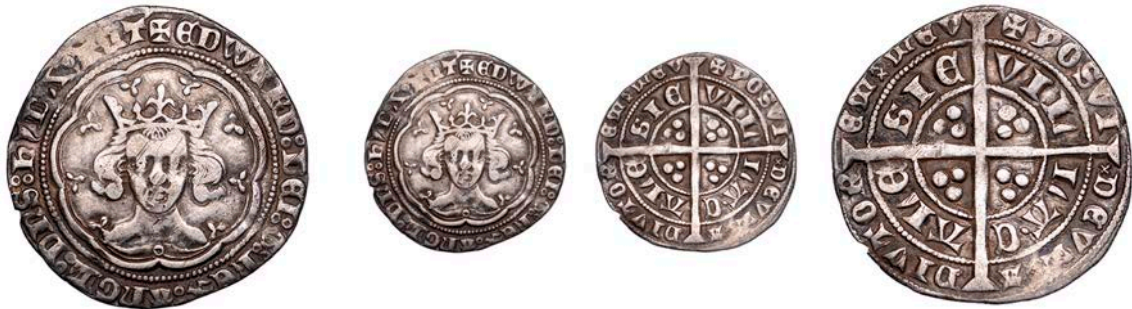
141 Treaty Period, Groat, variety G, Calais, mm. cross 3, annulet in centre of breast, double annulet stops on obv. double saltire stops on rev. , 4.44g/8h (N 1258; S 1619). A few scuffs, good fine, scarce thus £120-£150