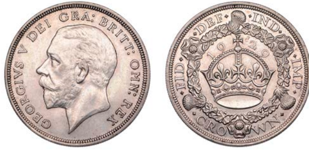
232 Crown, 1929 (ESC 3636; S 4036). Nearly extremely fine