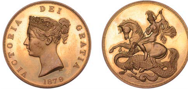
223 Fantasy Crown, dated 1879, struck in brass by Donald R. Golder for the INA (International Numismatic Agency), crowned bust left, rev. stylised St. George slaying the Dragon left, edge plain, 30.11g/12h (KM X.83A). Some wear in obverse fields, otherwise good extremely fine £50-£70