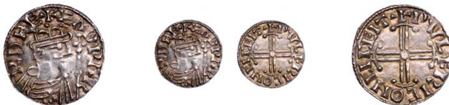
113 Penny, Hammer Cross type, Chichester , Wulfric, PVLFRIC ON CICEIT, 1.30g/6h (HHK 124; Freeman 38; Sussex Mints 24; BMC 128; N 828; S 1182). Very fine, reverse better, grey toned £200-£260

Provenance: Spink Auction 230, 15 July 2015, lot 356; Auckland Collection