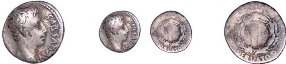
288 Denarius, Spain, possibly Colonia Patricia, 19-18, bare head right, rev. oak wreath, OB CIVIS SERVATOS above and below, 3.73g/6h (Chilfrome 67, this coin; RIC 40a; RSC 210). Reverse fair, obverse better £60-£80