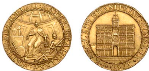
343 VENICE, Francesco Loredan (1752-62), Osella, 1760, a later product in gold, 13.68g (cf. Paol 243; CNI 13). Area of filing on edge, several test marks in fields, otherwise almost extremely fine and presumably extremely rare £1,500-£1,800