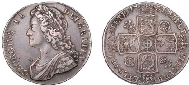
190 Crown, 1734, roses and plumes, edge SEPTIMO (ESC 1662; S 3686). Light scratches in field by neck and high points rubbed, otherwise about very fine, toned