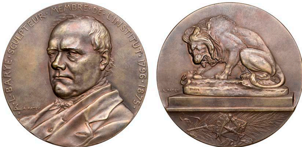
382 A. L. Barye , [c. 1894], a bronze medal by A. Patey, bust left, rev. sculpture by Barye of lion on plinth in stand-off with snake, sculpting tools below, 68mm (BDM IV, 425). Pleasingly toned, good extremely fine £70-£90