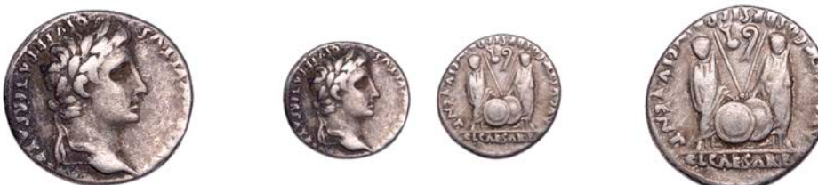
298 Denarius, Lugdunum, 2 BC-AD 4, laureate bust right, rev. Caius and Lucius Cæsars standing facing, two shields and two spears between them, simpulum and lituus in field above, 3.81g/1h (Chilfrome 78, this coin; RIC 207; RSC 43). Good fine, hoard patina £90-£120