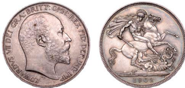
230 Proof Crown, 1902, edge || (ESC 3562; S 3979). Very lightly hairlined, otherwise prettily toned, good extremely fine £120-£150