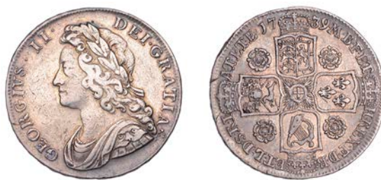
191 Halfcrown, 1739, roses, edge DVODECIMO (ESC 1679; S 3693). Surface marks, nearly very fine