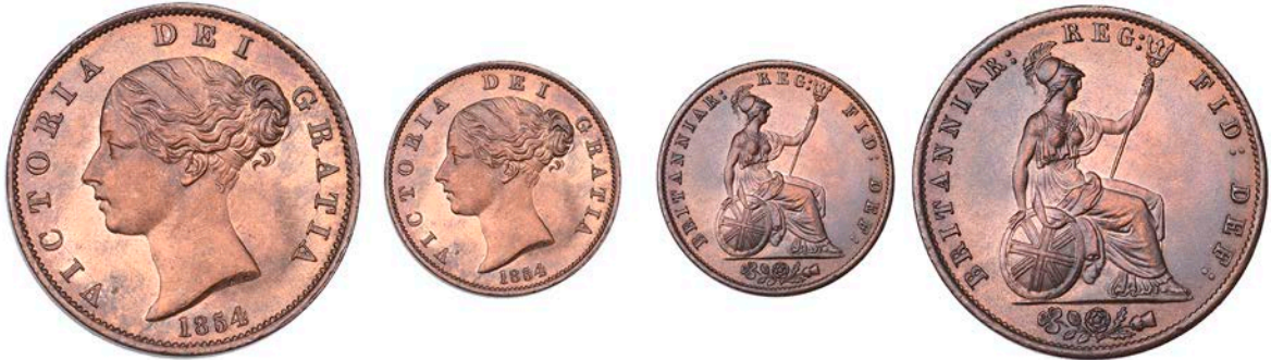
× 228 Halfpenny, 1854, inverted A for v in VICTORIA (BMC –; S –). Nearly extremely fine, light discolouration over original lustre, the legend variety clear and unrecorded in the standard references, very rare thus £120-£150