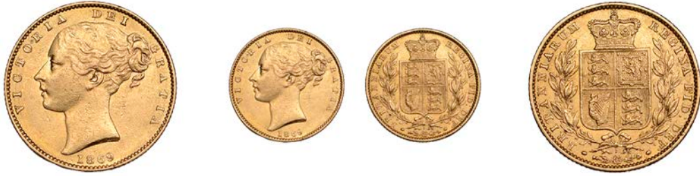
G 217 Sovereign, 1869, die no. 1 (Hill 53; S 3853). Good very fine