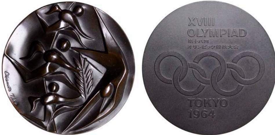
389 Olympic Games, Tokyo, 1964 , a bronze Participant's medal by T. Okamoto and K. Tanaka for Naigai Art, athletes and swimmer, rev. Olympic symbol, legend above and below, edge impressed NAIGAI ART IND, 61mm, 109.53g (GV 149.2; cf. DNW 128, 670). Extremely fine £120-£150