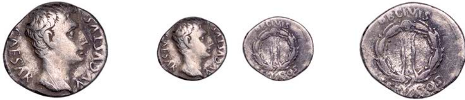
287 Denarius, Spain, possibly Colonia Patricia, 19-18, bare head right, rev. oak wreath, OB CIVIS SERVATOS above and below, 3.68g/6h (Chilfrome 68, this coin; RIC 40a; RSC 210). Fine, scarce £60-£80