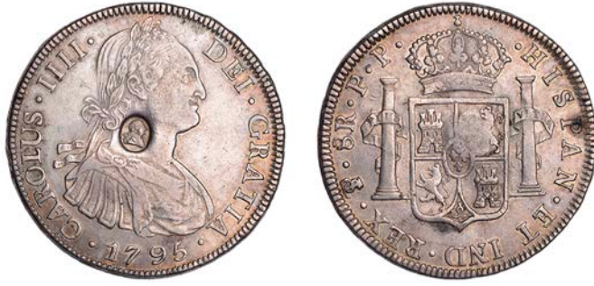
198 BOLIVIA, Charles III, 8 Réales, 1795 PP , Potosí, obv. countermarked with head of George III in oval, 26.62g (ESC 1855; S 3765A). Coin about very fine but with some toning, countermark better £400-£500