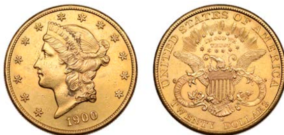
G 361 20 Dollars, 1900s. Light bagmarks, otherwise about extremely fine £1,800-£2,200