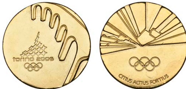
387 Winter Olympic Games, Turin, 2006 , a gilt-bronze Participant's medal, unsigned, stylised bridge, rev. rays over Olympic rings, 39mm, 30.87g (cf. DNW 128, 692). Extremely fine and very rare; in official plastic container, as issued £70-£90

These gilt examples were only presented to high-level VIPs and IOC officials.