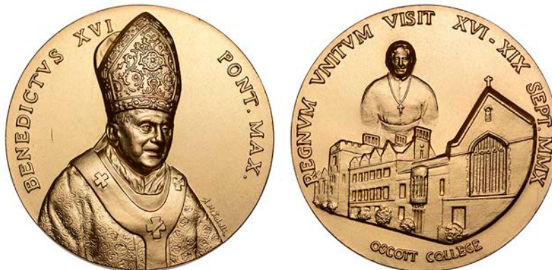
388 Visit of Pope Benedict XVI to Oscott College, Birmingham, 2010 , a bronze gilt medal by A. Mistichelli, Pope three quarters right, rev. Pope above front of Oscott College building, 50mm. As struck; in original red case of issue £100-£120