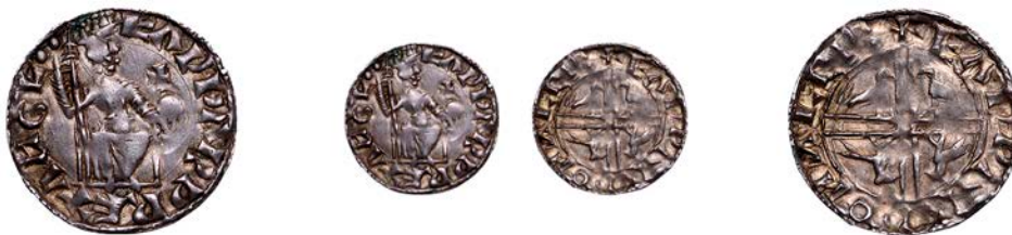
111 Penny, Sovereign/Eagles type, Lewes , Eadward, EADPARD ONN LAEP., 1.33g/6h (HHK 245; Sussex Mints 148; BMC 592; SCBI South Eastern 1374-5; Freeman 27; N 827; S 1181). A little striking weakness, otherwise very fine, toned with specks of green deposit £240-£300