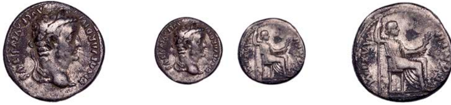
304 Denarius, Lugdunum, after AD 16, laureate head right, rev. Livia as Pax, seated right on chair with plain legs, holding sceptre and olive branch, feet on stool, PONTIF MAXIM around, 3.49g/5h (Chilfrome 87, this coin ; RIC 26; RSC 16a). Fine £60-£80