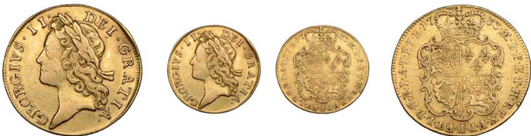
186 Guinea, 1733 (EGC 591; S 3674). Good fine, scarce