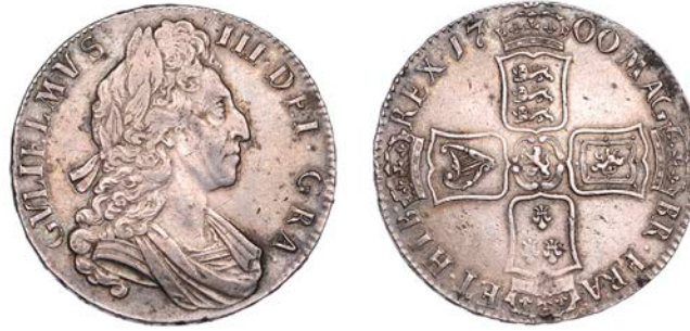
179 Crown, 1700, edge DVODECIMO (ESC 1010; S 3474). Once lightly cleaned, a bolder very fine