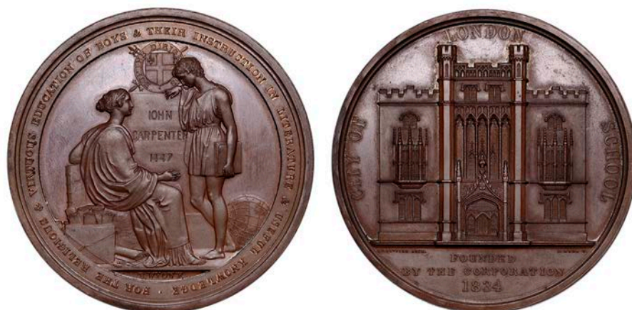
369 Foundation of the City of London School, 1834, a copper medal by B. Wyon, façade of building, rev. youth with seated figure of Knowledge, 58mm (BHM 1680; E 1279; Taylor 120a). Chocolate-brown patina with redness around inscription, good extremely fine; in original fitted screw case of issue £100-£120