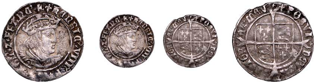
152 Second coinage, Groat, Tower mint, mm. lis, bust D, reads AGL Z FRANC, saltires in forks, 2.34g/12h (Whitton iii; N 1797; S 2337E). Minute edge chip and a few light scuffs, otherwise very fine, clear portrait £120-£150