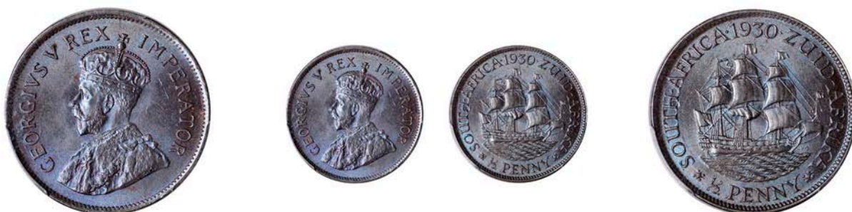
356 George V, Halfpenny, 1930, Pretoria (Hern S50; KM 13.2). Pleasing blue hue with some residual colour around devices, good extremely fine, scarce [Graded by PCGS as MS 64 Brown] £100-£120