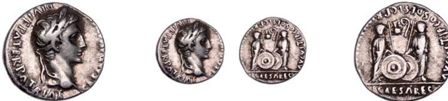
294 Denarius, Lugdunum, 2 BC-AD 4, laureate bust right, rev. Caius and Lucius Cæsars standing facing, two shields and two spears between them, simpulum and lituus in field above, 3.72g/6h (Chilfrome 73, this coin; RIC 207; RSC 43). Good fine, some light marks £120-£150