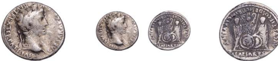
295 Denarius, Lugdunum, 2 BC-AD 4, laureate bust right, rev. Caius and Lucius Cæsars standing facing, two shields and two spears between them, simpulum and lituus in field above, 3.57g/12h (Chilfrome 74, this coin; RIC 207; RSC 43). Fine, hoard patina £60-£80