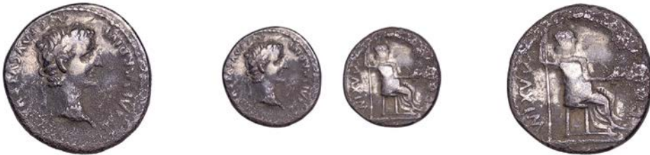
306 Denarius, Lugdunum, after AD 16, laureate head right, rev. Livia as Pax, seated right on chair with plain legs, holding sceptre and olive branch, feet on stool, PONTIF MAXIM around, 3.75g/6h (Chilfrome 85, this coin ; RIC 26; RSC 16a). Obverse good fine, reverse fine, surface deposits on both sides £60-£80