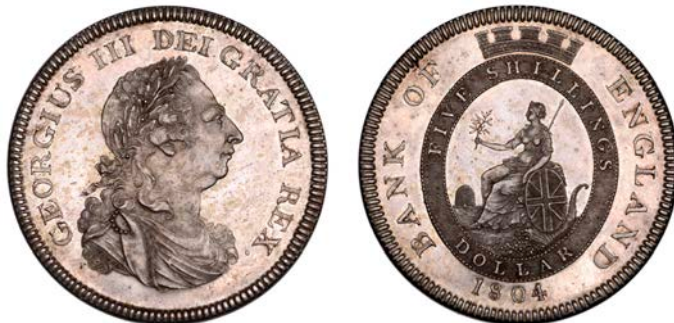
200 Proof Dollar, 1804, by C.H. Kuchler, types D/2a, 27.13g/12h (ESC 1946; S 3768). Some light mottled toning over reflective fields, extremely fine and rare £600-£800