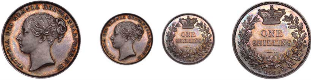
227 Proof Shilling, 1839, no initials, edge plain, 5.56g/6h (ESC 2980; S 3904). A trifling mark in obverse field, otherwise good extremely fine, rich old toning £1,000-£1,200