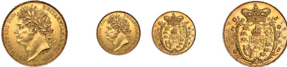
G 213 Half-Sovereign, 1821 (Hill 403; Bull 988; S 3802). Light marks, almost extremely fine