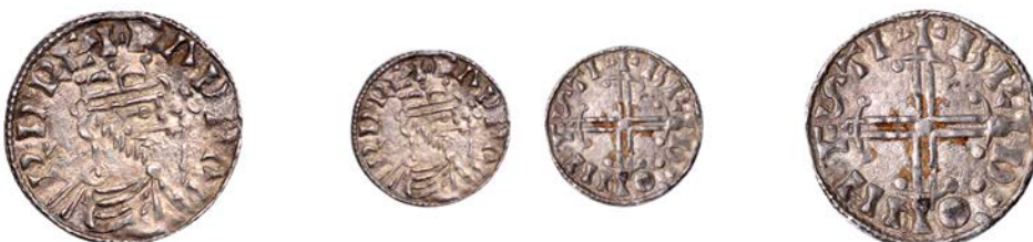
114 Penny, Hammer Cross type, Hastings , Brid, BRID ON HÆSTI, 1.21g/3h (HHK 121; Sussex Mints 80; Freeman 8; SCBI Fitzwilliam 915; N 828; S 1182). Very fine, struck on a neat round flan £150-£200

Provenance: Spink Auction 230, 15 July 2015, lot 356; Auckland Collection