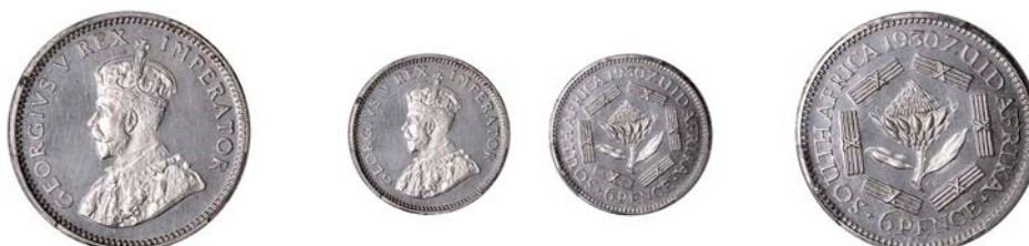
353 George V , Proof Sixpence, 1930, Pretoria (Hern S167; KM 16.1). A superb example with deep reflective fields and a strong cameo, practically as struck and extremely rare [Graded by PCGS as PR 64] £1,000-£1,500