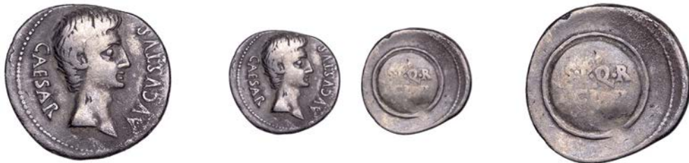
289 Denarius, uncertain Spanish mint (Colonia Caesaraugusta?), 19-18 BC, bare head right CAESAR AVGVSTVS around, rev. S P Q R CL V in two lines on round shield (clipeus virtutis), 3.61g/6h (Chilfrome 66, this coin; RIC 42a; RSC 294). Nearly fine £60-£80