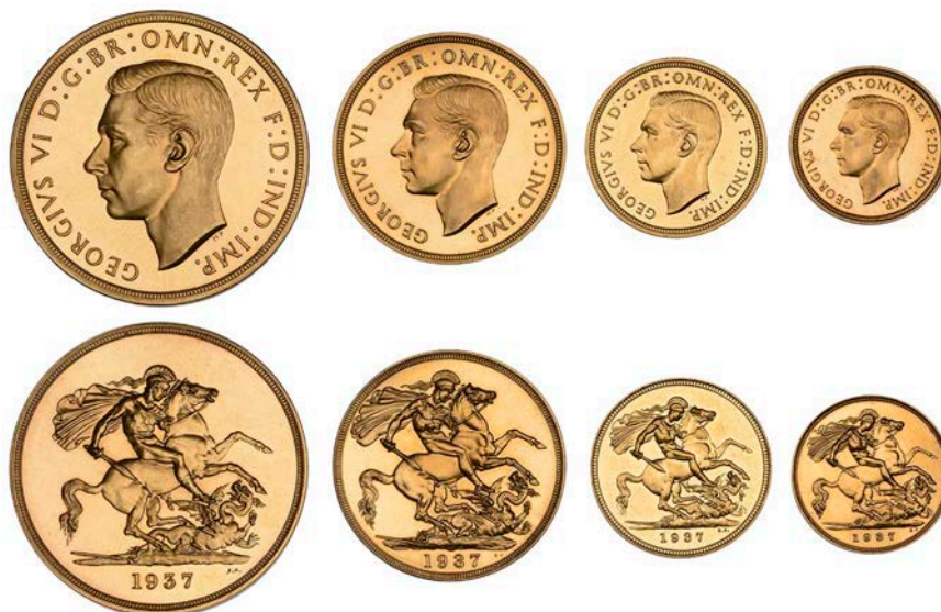
G 235 Proof Set, 1937, comprising Five Pounds, Two Pounds, Sovereign, and Half-Sovereign (S PS15) [4]. Some hairlines in fields, otherwise good extremely fine; in original red case of issue £8,000-£10,000