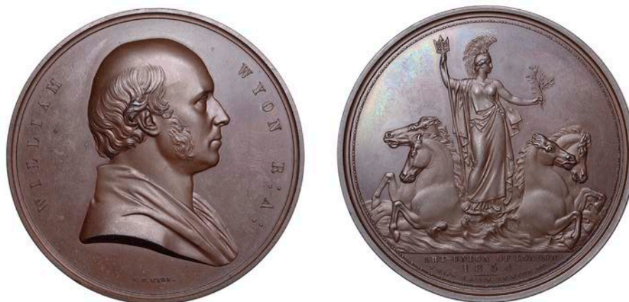
371 William Wyon, 1854, a copper medal by L.C. Wyon for the Art Union of London, bust right, rev. Britannia and four sea-horses, 56mm (BHM 2535; E 1480). Minute edge nick at 7 o'clock otherwise good extremely fine, chocolate brown patina £200-£260