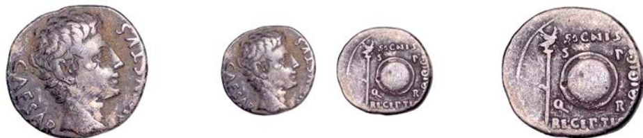
291 Denarius, Colonia Patricia, 19-15, bare head right, CAESAR AVGVSTVS around, rev. round shield inscribed CL V, with S P Q R in corners between aquila left and standard right, SIGNIS RECEPTIS above and below, 3.60g/7h (Chilfrome 70, this coin; RIC 86a; RSC 265). Fine, hoard patina £60-£80