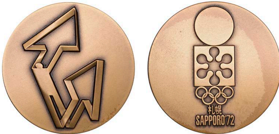
390 JAPAN, Winter Olympic Games, Sapporo, 1972 , a bronze Participant's medal by S. Fukuda, Sapporo logo, rev. athlete projecting two stylistic arrows, 60mm (GV 428.2; cf. DNW 128, 673). Practically as struck; in original plastic presentation case of issue £120-£150