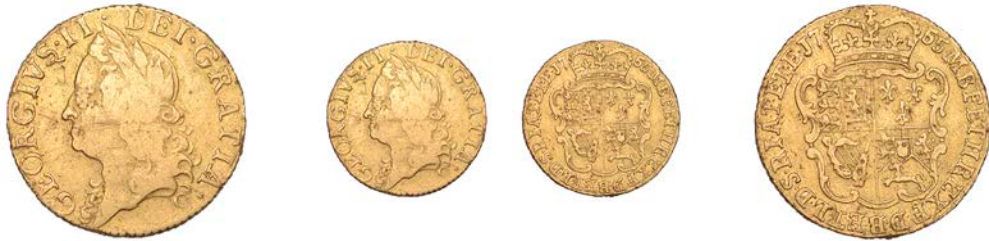
189 Half-Guinea, 1755 (EGC 657; MCE 363; S 3685). Fine, reverse a little better, a few light scuffs and surface marks