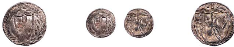
167 Penny, 0.47g/12h (ESC 228; N 2729; S 3222). Very fine, toned £80-£100 Provenance: H.M. Lingford Collection [bt October 1949, with supporting ticket]