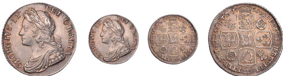
192 Shilling, 1735, roses and plumes (ESC 1707; S 3698). Lightly hairlined, otherwise good very fine, lightly toned