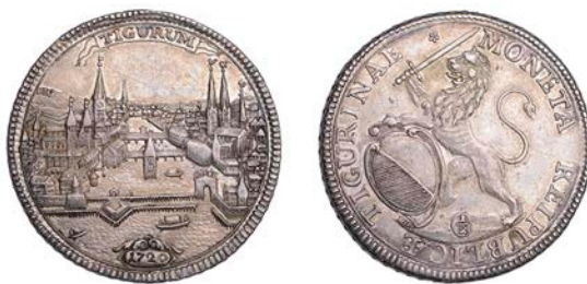
359 Half-Thaler, 1720, City View, Zurich (Hürlimann 676; HMZ 1165k; KM 146). Light scratches beneath grey tone, good very fine, rare thus £120-£150