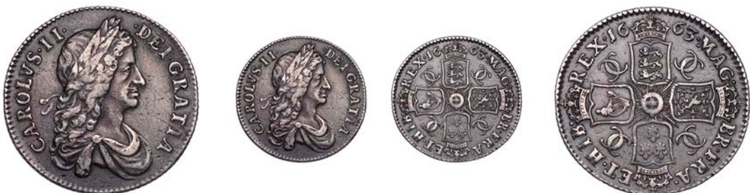
172 Shilling, 1663, first bust (ESC 505; S 3371). Very fine, light marks, dark tone