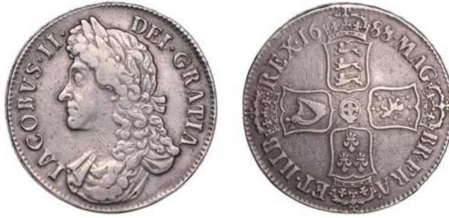
173 Crown, 1688/7, second bust, edge QVARTO (ESC 747; S 3407). With the faintest graffiti across the obverse, otherwise very fine, grey toned £400-£500

Provenance: DNW Auction 137, 21 September 2016, lot 1182