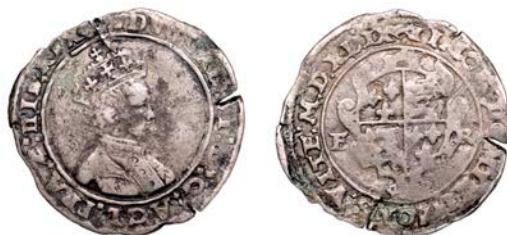
154 Shilling, Tower II, MDXLIX [1549], mm. grapple, bust 3, normal legends, reads D G AGL, 4.38g/6h (N 1917/1; S 2466). Edge split, fine, some surface stains, scarce £120-£150

Provenance: Spink Auction, 9 January 2025, lot 141 (part)