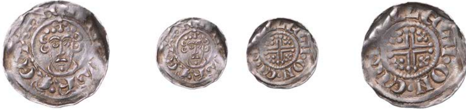
136 Penny, class Vb2, Chichester , Willelm, WILLELM ON CIC, 1.46g/8h (SCBI Mass 1481-2; N 970; S 1351). Struck a little off-centre with resulting raised lip of metal, otherwise good very fine, golden-grey tone, rare thus £200-£260

Provenance: SNC May 2009 (139); Auckland Collection