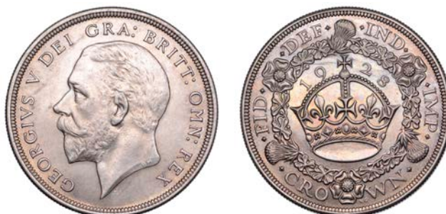
231 Crown, 1928 (ESC 3633; S 4036). Lustrous, good extremely fine £120-£150