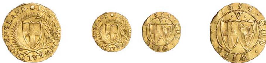
163 Crown, 1654/0, 2.24g/12h (EGC 69; N 2719; S 3212). Probably removed from a mount, nearly very fine