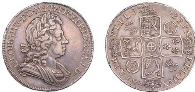
185 Crown, 1720/18, roses and plumes, edge SEXTO (ESC 1543; S 3639). Minute graffiti in reverse fields, otherwise very fine, toned