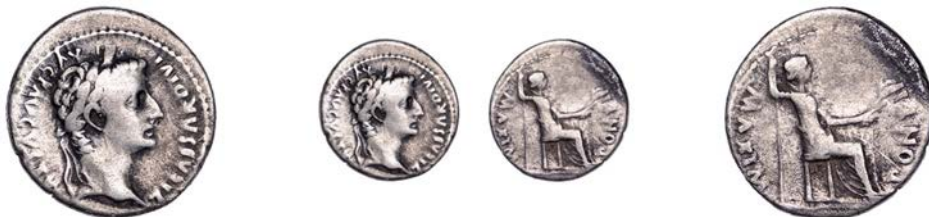
307 Denarius, Lugdunum, after AD 16, laureate head right, rev. Livia as Pax, seated right on chair with plain legs, holding sceptre and olive branch, feet on stool, PONTIF MAXIM around, 3.76g/12h (Chilfrome 86, this coin ; RIC 26; RSC 16a). Scratch on reverse, fine, portrait better £60-£80