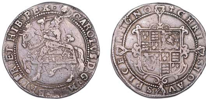
162 Tower mint, Crown, type Ia, mm. cross on steps (over lis on obv. ), 29.79g/9h (FRC II*/VII [Sale, lot 48]; SCBI Brooker 236; N 2190; S 2753). About very fine, some haymarking, toned