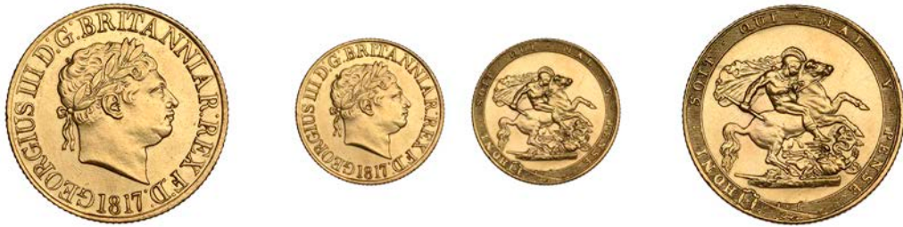
G 203 Sovereign, 1817 (Hill 1; S 3785). Cleaned, scratches below neck, otherwise good very fine