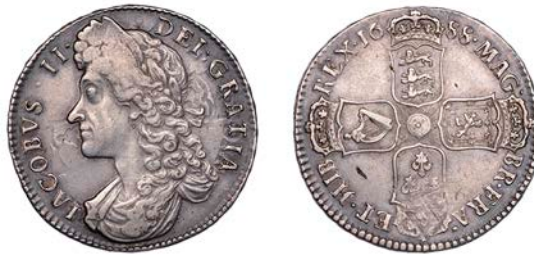
174 Halfcrown, 1688, edge QVARTO (ESC 759; S 3409). Some clashmarks, otherwise very fine, grey toned £400-£500

Provenance: DNW Auction 137, 21 September 2016, lot 1182