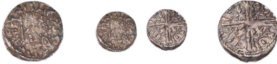
246 First coinage, Sterling, type III, Berwick, ROBERT ON BE ; 1.42g/2h (SCBI 35, 106; B 19a, fig. 107A; S 5043). Fine or better £100-£120