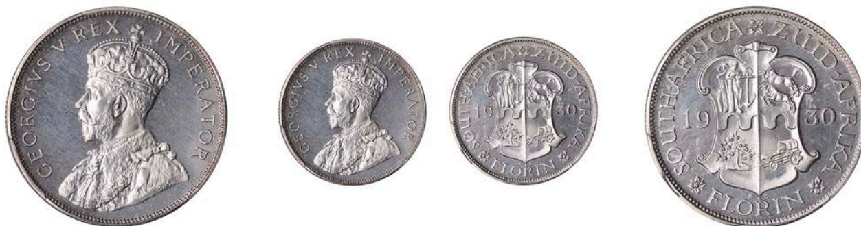
351 George V , Proof Florin, 1930, Pretoria (Hern S243; KM 18). A superb example with deep reflective fields, practically as struck and extremely rare [Graded by PCGS as PR 64] £3,000-£4,000