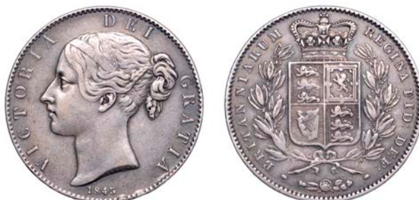
221 Crown. 1845. edgē. viii. cinquefoil stops (ESC 2564; S 3882). Good fine. some toning