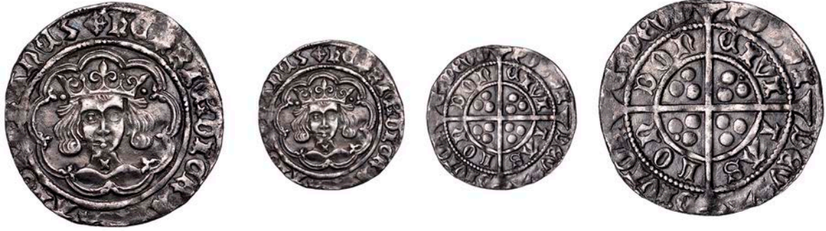
150 Cross-Pellet issue, Groat, class B, London, mm. cross IIIb on obv. only, saltire on neck, fleur on breast, pellets by crown, mullet after HENRIC, extra pellets in quarters under CIVI and LON, 3.75g/9h (Whitton 72d; N 1517; S 1935). Very fine, dark toned, a little peripheral weakness £200-£260