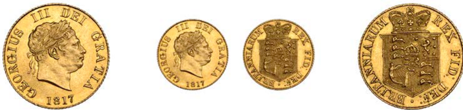
G 205 Half-Sovereign, 1817 (Hill 400; S 3786). Almost extremely fine