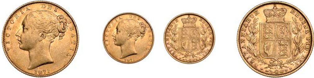
G 218 Sovereign, 1871, die 97 (Hill 55; S 3853B). Good very fine