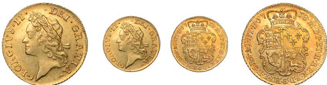
x 187 Guinea, 1738 (EGC 597; S 3674). A few trifling hairlines, good very fine, golden toning with residual mint bloom