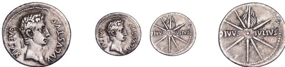
286 Denarius, Cæsaraugusta, c. 19-18 BC, bust right, wearing oak wreath, CAESAR AVGVSTVS around, rev. DIVVS IVLIVS either side of eight-rayed comet with tail upwards, 3.72g/7h (Chilfrome 65, this coin ; RIC 37a; RSC 98). About very fine, mottled hoard patina, rare £150-£200

The comet, sometimes called the sidus Iulium , was observed in the sky at the time of the public funerary games which followed the assassination of Caesar. This was taken to represent the soul of the dictator passing on its way to join the immortals