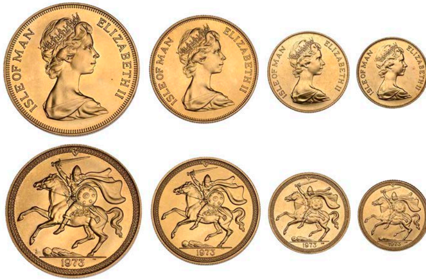
243 Elizabeth II, Specimen Set, 1973, comprising Five Pounds, Two Pounds, Sovereign, and Half-Sovereign (KM 25-28) [4]. All as struck; in green case of issue £5,000-£6,000