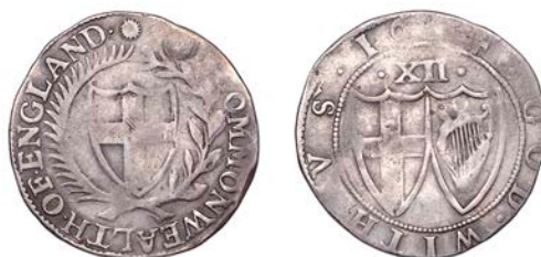
164 Shilling, 1654, mm. sun on obv. only, 5.78g/10h (ESC 137; N 2724; S 3217). Flan irregularity at 1 o'clock on obverse, otherwise good fine