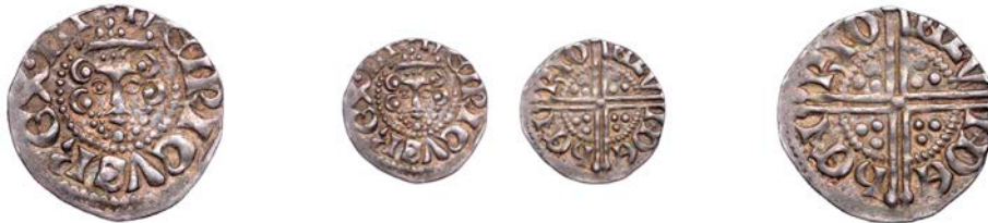
137 Long Cross Coinage, Penny, class IIIb, London , Henri, HENRI ON LVNDE, 1.47g/3h (N 987; S 1363). Struck a little off-centre, otherwise good very fine, old tone £80-£100