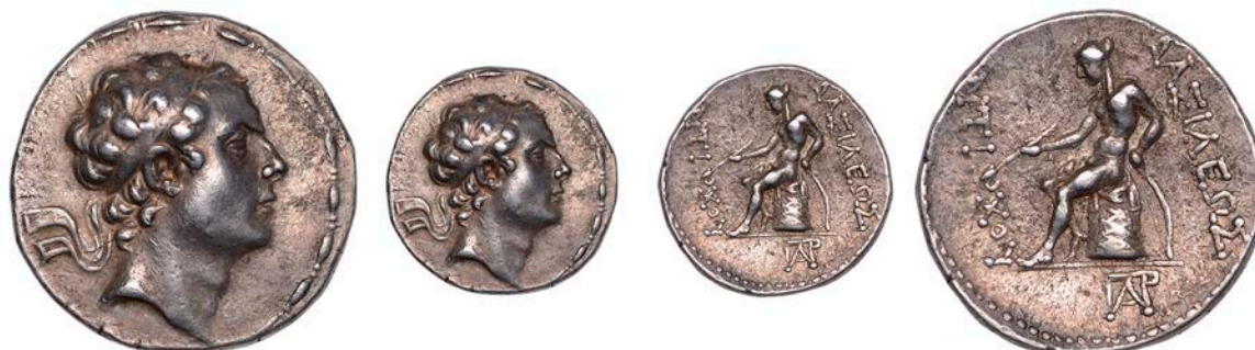
257 SELEUKID KINGS OF SYRIA, Antiochus IV (175-164), Tetrachm, Seleukeia on the Tigris, diademed head right within filleted border, rev. Apollo seated left on omphalos, testing arrow, ΑΝΤΙΟΧΟΥ ΒΑΣΙΛΕΩΣ around, monogram [ΠΑΡ] in exergue, 16.96g/12h (SC 1506.2). A trace of light porosity, otherwise better than very fine and lightly toned, the portrait struck in high relief £300-£360

Provenance: R. Inder Collection, DNW Auction 148, 18 September 2018, lot 1300