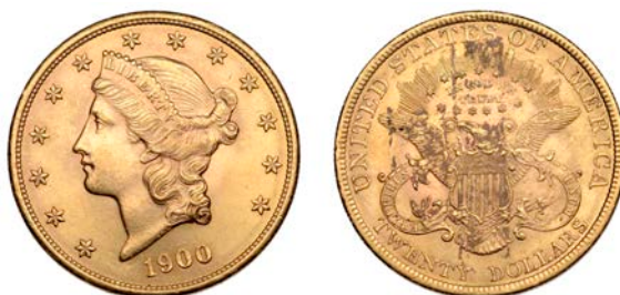
G 360 20 Dollars, 1900. Light bagmarks, otherwise extremely fine £1,800-£2,200