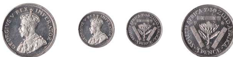
354 George V , Proof Threepence, 1930, Pretoria (Hern S129; KM 15.1). A superb example with deep reflective fields and a strong cameo, practically as struck and extremely rare [Graded by PCGS as PR 64] £800-£1,000