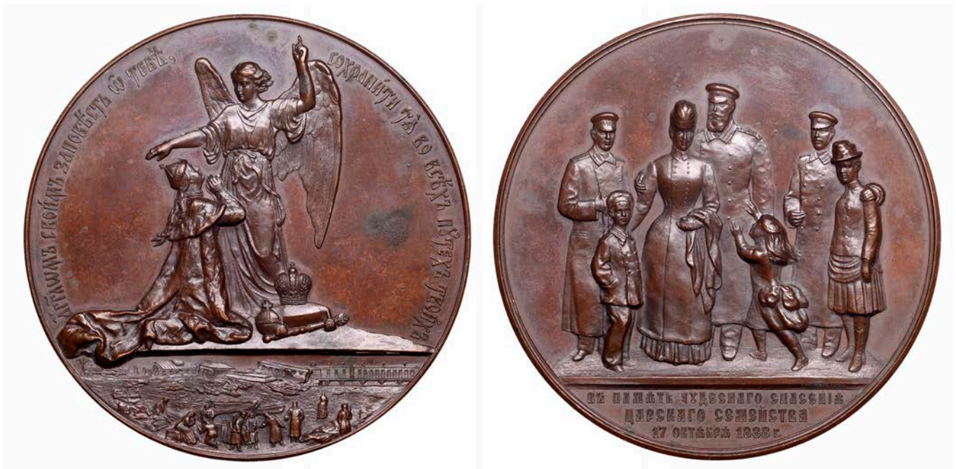
393 Miraculous Survival of the Imperial Family after their Railway Crash, 1888 , a large bronze medal by A. Griliches Jr., Alexander III with members of the Imperial family, inscription in three lines below, rev. Angel blessing mother Russia kneeling before her, regalia at feet, scene of the crash below, 89mm (Diakov 1010.1). Some spots of toning, otherwise extremely fine and very rare