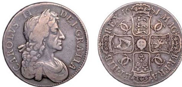
171 Crown, 1681, fourth bust, edge TRICESIMO TERTIO (ESC 414; S 3359). Good fine, toned