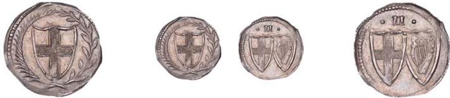
166 Halfgroat, 0.97g/10h (ESC 224; N 2728; S 3221). Cabinet tone, extremely fine £200-£300