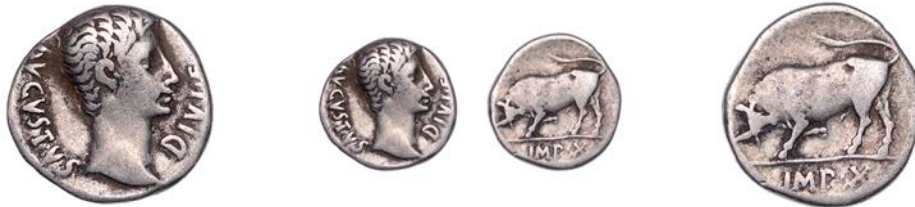
293 Denarius, Lugdunum, 15-13 BC, bare head right, AVGVSTVS DIVI F around, rev. bull butting left, IMP X in exergue, 3.61g/3h (Chilfrome 72, this coin; RIC 169; RSC 141). Nearly fine, portrait better, the scarcer reverse variety £90-£120