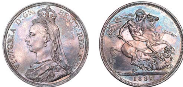
224 Crown, 1887 (ESC 2585; S 3921). About extremely fine, the fields rather hairlined but bright and reflective, dark toned £120-£150