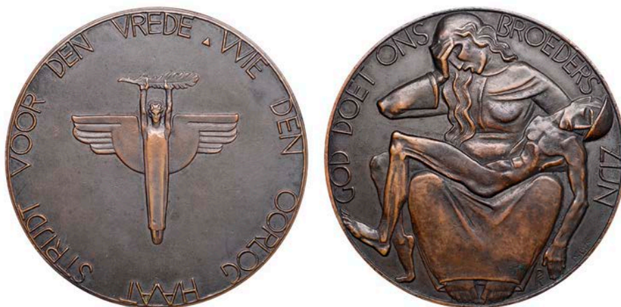
391 Vrede, 1931 , a bronze medal by Dirk Bus, weeping woman holding naked helmeted man over lap, rev. !ying angel with dove's feather raised over her head, 60mm (KB 534; Til. 87). Toned, extremely fine £70-£90