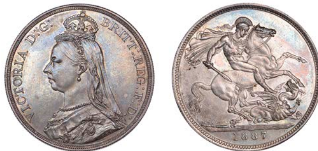
225 Crown, 1887 (ESC 2585; S 3921). Cabinet tone, about extremely fine £100-£120