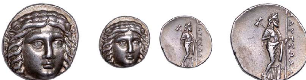
255 SATRAPS OF CARIA, Maussolos (377-353), Tetrachm, Halikarnassos, 370-360, leuretea head of Apollo facing slightly right, rev. Zeus Labraundos standing right, holding staff and axe, μ by feet, π under shoulder, to right, ΜΑΥΣΣΩΛΛΟ, 15.11g/12h (Konuk Identities 21; cf. BMFA 1998). Good very fine, the portrait struck in high relief and of excellent style, grey toned with subdued iridescent highlights £2,000-£2,600

Provenance: Leu Numismatik Web Auction 12, 30 May 2020, lot 410 [From a European Collection, formed before 2005]