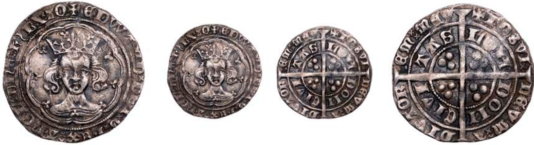
140 Treaty period, Groat, London, mm. cross potent, variety a, double saltire stops, obv. legend ends AQ, 4.42g/3h (N 1249; S 1616). A few light marks, very fine, excellent portrait £150-£200