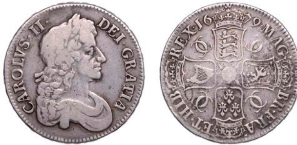
170 Crown, 1679, third bust, edge TRICESIMO PRIMO (ESC 403; S 3358). Fine, toned