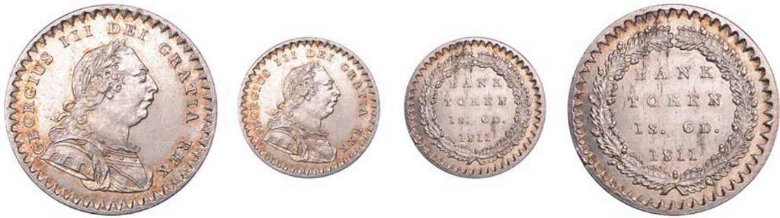
202 Eighteen Pence, 1811 (ESC 2112; S 3771). Prettily toned and lustrous, good extremely fine