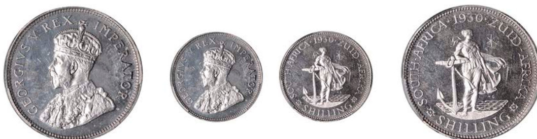
352 George V , Proof Shilling, 1930, Pretoria (Hern S205; KM 17.2). Lightly toned over deep reflective fields, practically as struck and extremely rare [Graded by PCGS as PR 63] £2,000-£3,000