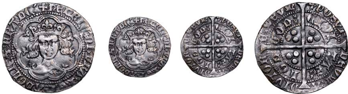
143 Definitive issues, Groat, class C, mm. pierced cross, mullet on king's left shoulder, 3.53g/1h (Stewartby p.324; N 1387; S 1765). Good fine, dark tone, a few light scuffs £150-£200