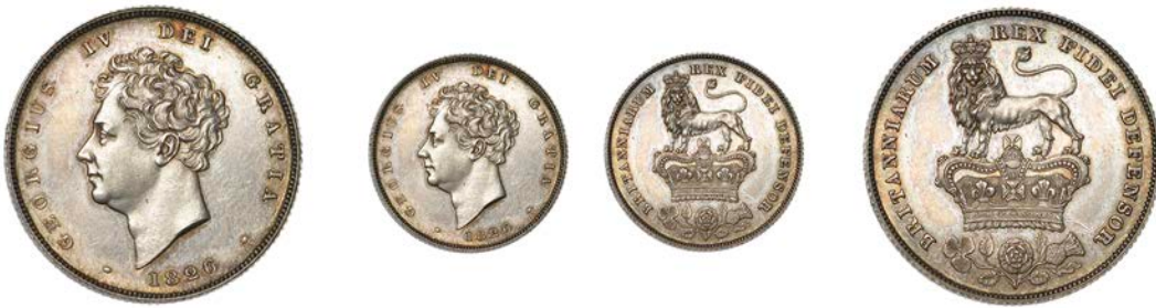
214 Proof Shilling, 1826, edge grained, 5.64g/6h (ESC 2411; S 3812). Clouded fields with hairlines, otherwise better than extremely fine, toned [Graded by NGC as PF 61]