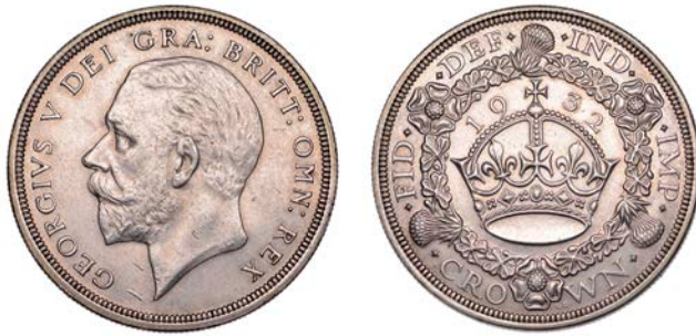
233 Crown, 1932 (ESC 3641; S 4036). Extremely fine