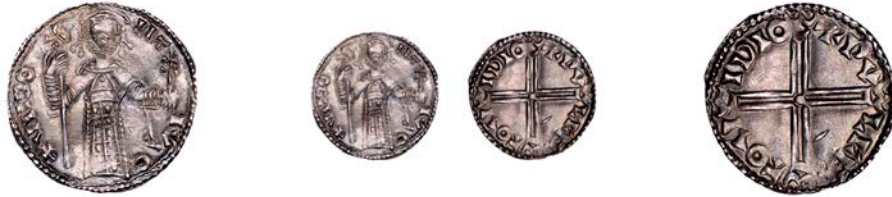
332 DENMARK, Sven Estridsen (1047-75), Penny pr Penning, Lund , +PVLFE:T OV IDIO, 0.94g/12h (Hauberg 9). Some doubling, good very fine, attractively toned £150-£200