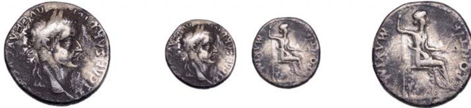
305 Denarius, Lugdunum, after AD 16, laureate head right, rev. Livia as Pax, seated right on chair with ornated legs, holding sceptre and olive branch, feet on stool, PONTIF MAXIM around, 3.66g/2h (Chilfrome 96, this coin ; RIC 30; RSC 16a). Good fine, surface deposits and patchy patina £60-£80