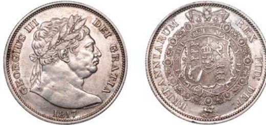
3172 Halfcrown, 1817, large head (ESC 2090; S 3788). Lightly toned over lustre, nearly extremely fine