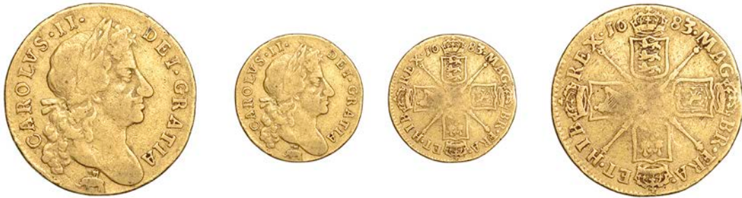
3132 Guinea, 1683, fourth bust, elephant and castle below (Bull 279; S 3345). Fair, rare £700-£900