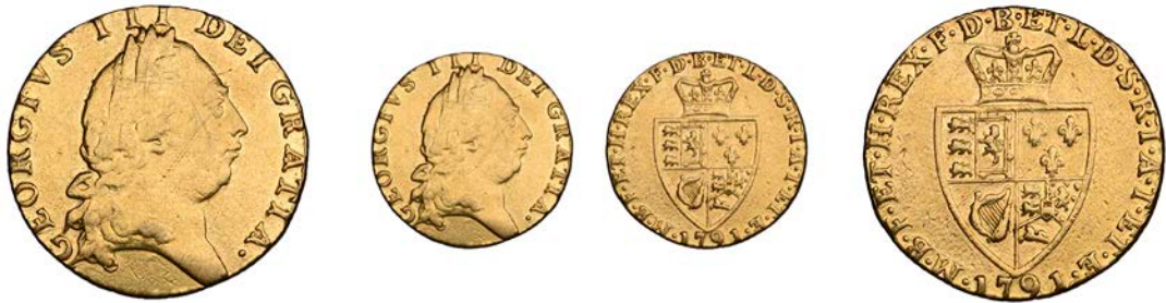
3158 Guinea, 1791, fifth bust (EGC 719; S 3729). Sweated, fine