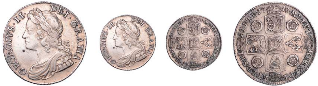
3153 Shilling, 1741, roses (ESC 1717; S 3701). Cleaned and now re-toned, very fine £100-£120