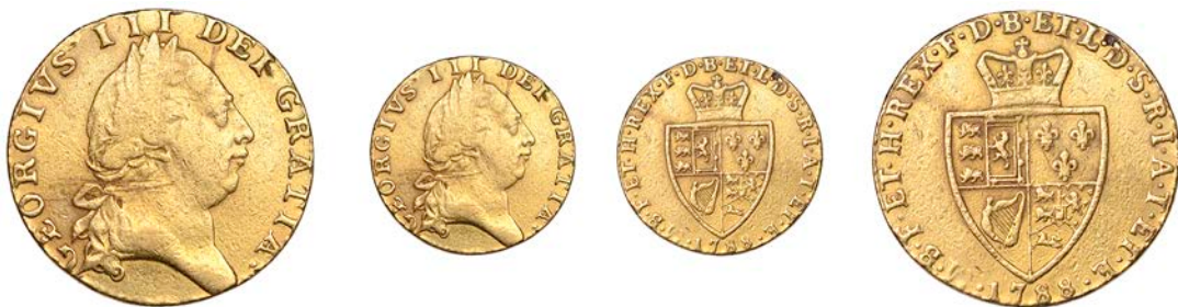
3156 Guinea, 1788, fifth bust (EGC 713; MCE 392; S 3729). Fine £700-£900