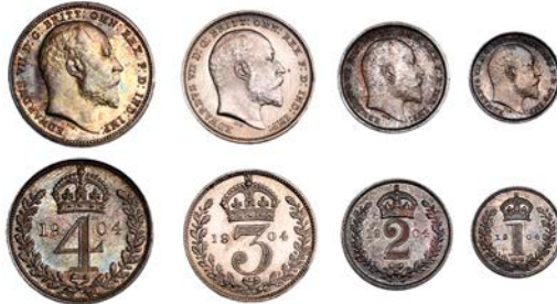
3212 Maundy Set, 1904 (ESC 3610; S 3985) [4]. Toned, extremely fine; in original fitted case of issue