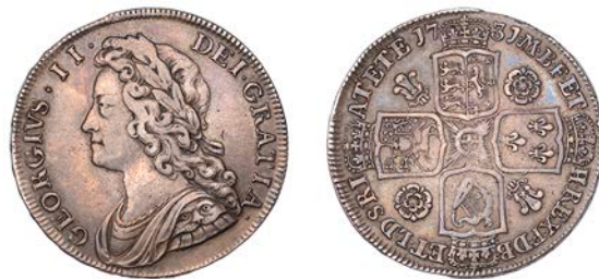
3147 Halfcrown, 1731, roses and plumes, edge QVINTO, Q sideways (ESC 1674; S 3692). About very fine, grey toned