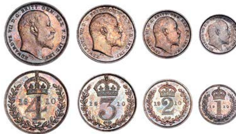
3218 Maundy Set, 1910 (ESC 3616; S 3985) [4]. Dark cabinet tone, good extremely fine; in original fitted case of issue