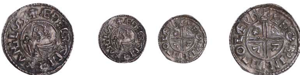
3032 Penny, CRVX type, Lewes , Leofwine, LEOPFINE M-O LÆPE, 1.59g/6h (HHK 31; BEH 1447; N 770; S 1148). Some peckmarks, good fine, toned £100-£150