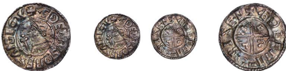
3030 Penny, CRVX type, Chichester , Æthelm, ÆDELM M-O CISEC, 1.65g/9h (HHK 21; BEH 264; N 770; S 1148). Cracked, iridescent tone, good fine £80-£100