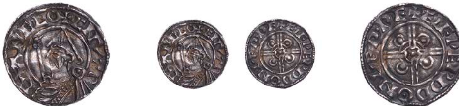
3044 Penny, Pointed Helmet type, Lewes , Ælfweard, ÆLFPERDD ON LÆP.PE; 1.13g/3h (BEH 1259; HHK 151; Sussex Mints 132; N 787; S 1158). Somewhat crimped, very fine, dark toned