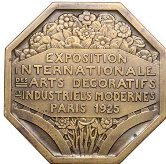
3745 Exposition Internationale des Arts Décoratifs et Industriels Modernes , Paris, 1925, an octagonal Art Déco bronze plaque by P. Turin, semi-naked female sat to right on a cloud, dispensing roses from a basket supported by her left arm, rev. legend on tablet, flowers in background, edge impressed cuivre and cornucopia, 71mm, 158.65g (Maier 322; Classens 128; cf. MDC 11, 1236; cf. DNW 184, 827). One of the classic Art Déco medallic images, some blotchy toning, otherwise extremely fine £100-£120