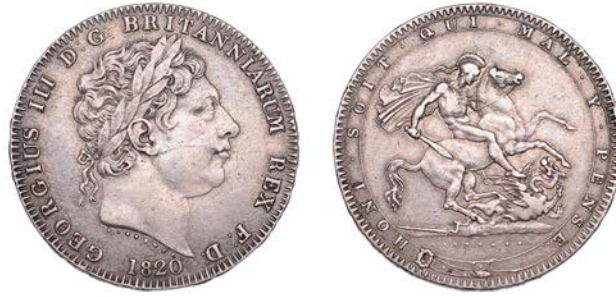
3171 Crown, 1820, edge LX (ESC 2016; S 3787). Toned, better than very fine