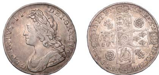
3148 Halfcrown, 1736, roses and plumes, edge NONO (ESC 1678; S 3692). Fine, some tone £100-£120