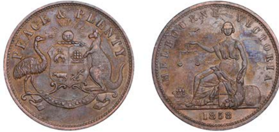
3410 MELBOURNE , Penny Token, 1858, Peace & Plenty (KM Tn285). Very fine or better, toned