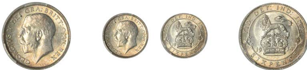
x 3220 Sixpence, 1914 (ESC 3875; S 4014). Lustrous, mint state [Graded by PCGS as MS 65]