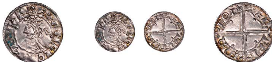
3042 Penny, Quatrefoil type, Thetford , Ælfwine, +EL.FPLE O DEOD, obv. , diadem ties from crown, three extra pellets along inner circle, 0.77g/4h (cf. BEH 3444-5; SCBI Copenhagen –; N 781; S 1157). Peripheral staining on obverse, otherwise good very fine, a scarce variety