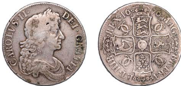
3133 Crown, 1676, third bust, edge VICESIMO OCTAVO (ESC 397; S 3358). Fine, patchy patina £100-£120