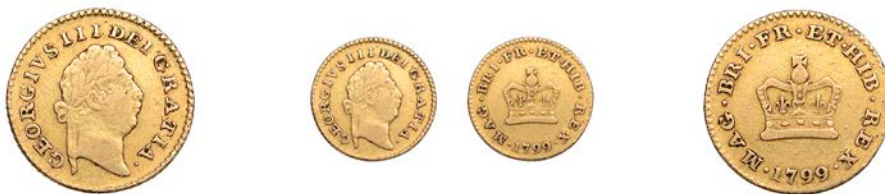
3162 Third-Guinea, 1799, first bust (EGC 869; S 3738). Good fine, rare