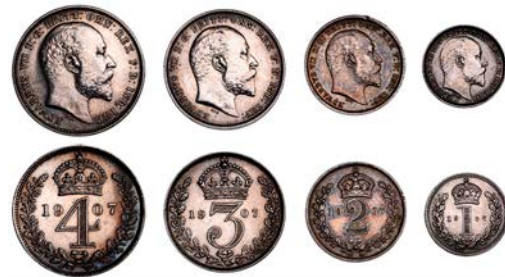
3215 Maundy Set, 1907 (ESC 3613; S 3985) [4]. Toned, extremely fine; in fitted case of issue