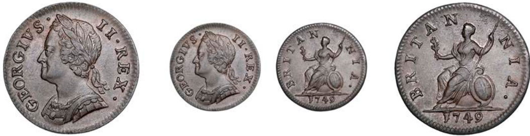
3154 Halfpenny, 1749 (BMC 879; S 3719). Dark patina, good very fine £100-£120