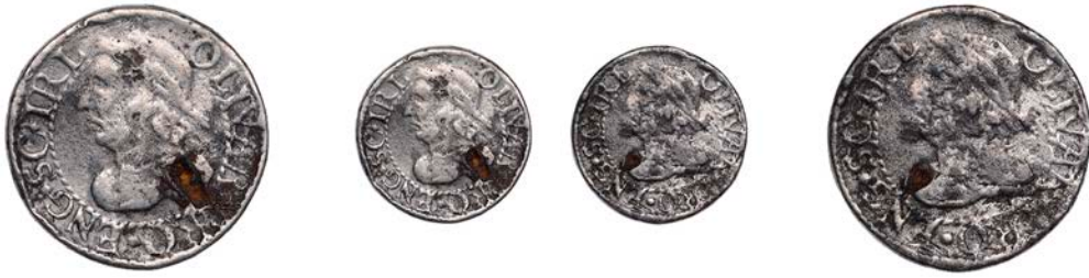
3131 Farthing, a later cast in white metal after a double obverse mule(?), 5.97g/12h (cf. S 3230). Porous surfaces with scatterings of verdigris, fine, unusual £100-£120