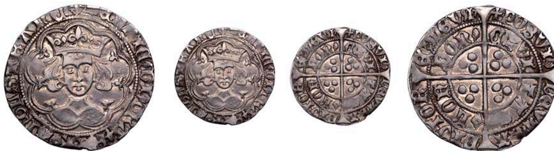
3100 Pinecone-Mascle issue, Groat, London, mm. crosses IIIb/V, mascle after REX and before LON, pinecones after HENRIC, DEI, GRA, POSVI and SIE, N over s in LON, 3.65g/12h (N 1460; S 1874). Very fine, clear portrait, lightly toned £90-£120