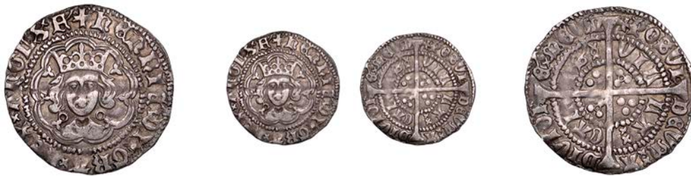
3096 Annulet issue, Halfgroat, Calais, mm. cross II on obv. only, annulets by neck, after POSVI and in quarter below VIL and CAL, 1.76g/9h (N 1429; S 1840). Nearly very fine, grey toned £80-£100