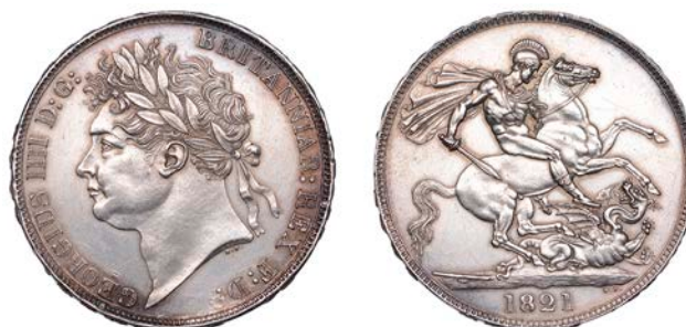
3177 Crown, 1821, edge SECUNDO (ESC 2310; S 3805). Cleaned, field marks at 6 o'clock, otherwise extremely fine