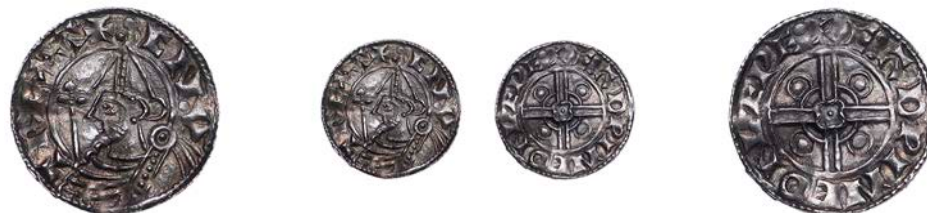
3045 Penny, Pointed Helmet type, Lewes , Eadwine, EADPINE ON LÆPE; 1.03g/9h (BEH 1264; HHK 158; Sussex Mints –; N 787; S 1158). Crimped, good very fine, attractive tone