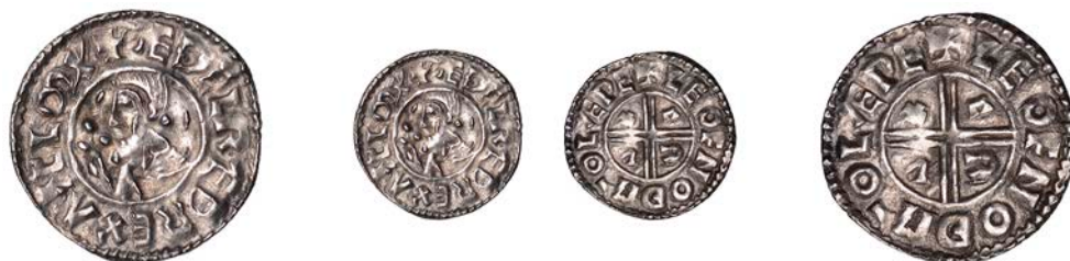
3031 Penny, CRVX type, Lewes , Leofnoth, LEOFNOD MO LÆPE, 1.37g/9h (HHK 29; BEH 1438; N 770; S 1148). Peckmarked, good fine £100-£150