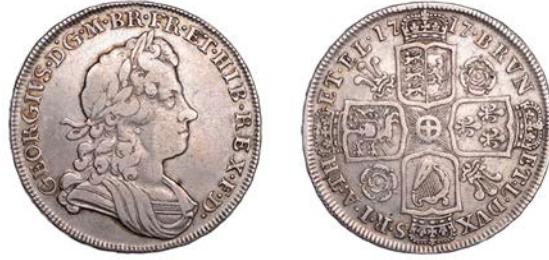
3144 Halfcrown, 1717, roses and plumes, edge TIRTO (ESC 1554; S 3642). Fine