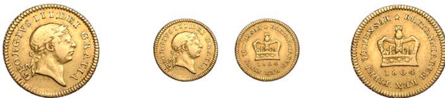
G 3160 Half-Guinea, 1804, seventh bust (MCE 442; S 3737). Good fine