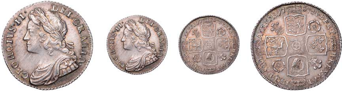
3152 Shilling, 1737, roses and plumes (ESC 1711; S 3700). Obverse very lightly wiped, otherwise prettily toned, about extremely fine £120-£150