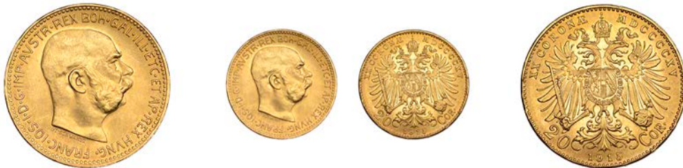
3414 Franz Joseph I , 20 Corona, 1915, a later restrike (KM. 2818). About as struck