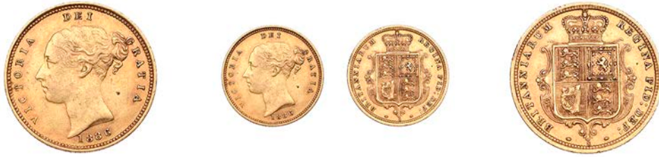
3409 Victoria , Half-Sovereign, 1886s, Sydney (Hill 468; S 3862E). Lightly toned, good very fine, rare