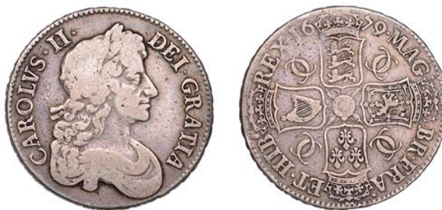
3135 Crown, 1679, third bust, edge TRICESIMO PRIMO (ESC 403; S 3358). Fine