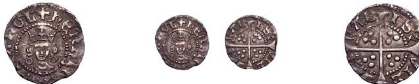
3097 Annulet issue, Halfpenny, Calais , mm. cross V on obv. only, 0.44g/3h (Withers A3; N 1435; S 1849). Some peripheral weakness, portrait good very fine, toned £40-£50