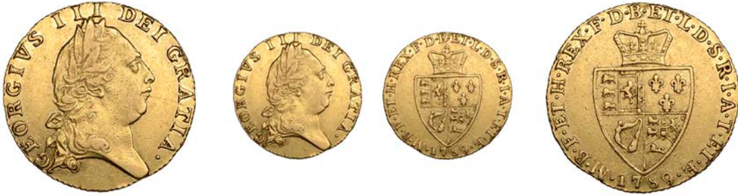
3157 Guinea, 1789, fifth bust, large 9 in date (EGC 716; S 3729). Very fine