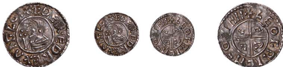
3034 Penny, CRVX type, Lympne , Leofric, LEOFRIC M-O LIMN, reads ÆDERED, 1.42g/1h (SCBI Helsinki 84 and South-Eastern Museums 843, same dies; SCBI Copenhagen 515; BEH 1614; BMC —; N 770; S 1148). Peckmarked, pierced and plugged, very fine, toned £150-£200 Provenance: T. Maudlin Collection, DNW Auction 160, 5 June 2019, lot 115 [from J. Mann November 2012]