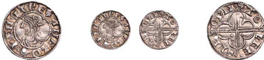
3040 Penny, Quatrefoil type, Lewes , Leofnoth, LEOFNOD O LÆE, legend starts at 8 o'clock, ends ANGLOR, 0.78g/3h (HHK 139 var.; Sussex Mints –; BEH –; N 781; S 1157). Neatly pierced at 6 o'clock, very fine, rare