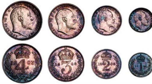
3211 Maundy Set, 1903 (ESC 3609; S 3985) [4]. Toned, good extremely fine; in original fitted case of issue