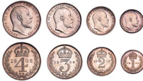
3216 Maundy Set, 1908 (ESC 3614; S 3985) [4]. Extremely fine; in original fitted case of issue