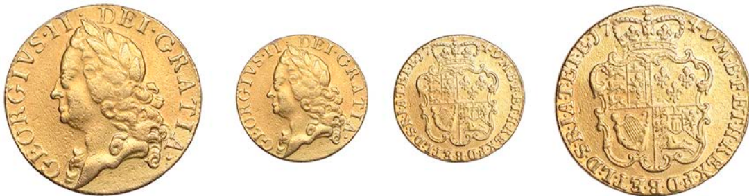
3146 Guinea, 1749 (EGC 612; S 3680). Edge solder at 12 o'clock, otherwise good fine, a scarcer date