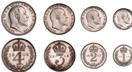
3213 Maundy Set, 1905 (ESC 3611; S 3985) [4]. Lustrous, extremely fine; in original fitted case of issue