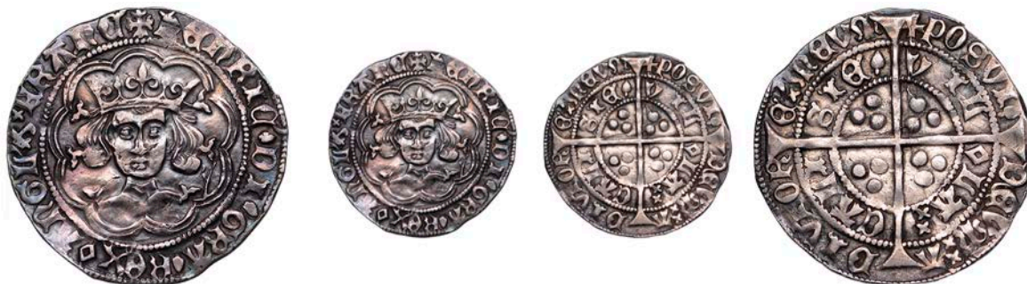
3101 Pinecone-Mascle issue, Groat, Calais, mm. crosses IIIa/V, mascle after REX and before LA, pinecones after HENRIC, DEI, GRA, POSVI and SIE, 3.65g/9h (Stewartby III; N 1461; S 1875). Very fine, mottled tone £90-£120