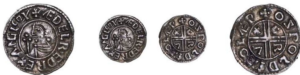
3033 Penny, CRVX type, Lewes , Oswold, OSPOLD MO LÆP, 1.63g/3h (HHK 36; BEH 1470; N 770; S 1148). Pierced and plugged at 8 o'clock, good fine or better £80-£100