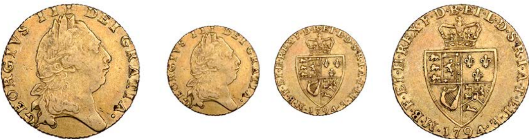
3159 Guinea, 1794, fifth bust (EGC 725; S 3729). Fine