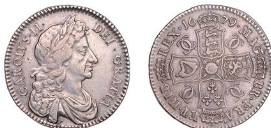
3136 Halfcrown, 1679, fourth bust, edge TRICESIMO PRIMO (ESC 480; S 3367). About very fine, lightly toned