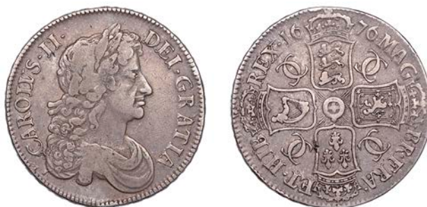
3134 Crown, 1676, third bust, edge VICESIMO OCTAVO (ESC 397; S 3358). Toned, good fine £100-£120