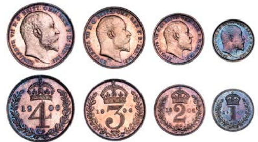
3214 Maundy Set, 1906 (ESC 3612; S 3985) [4]. Toned, good extremely fine; in original fitted case of issue