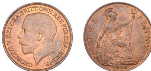
3221 Penny, 1918 H , Heaton mint (F 183; BMC 2253; S 4052). A pleasing example with much original colour, good extremely fine £100-£120