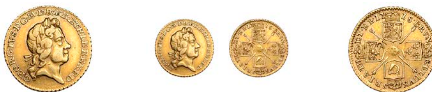
3143 Quarter-Guinea, 1718 (EGC 550; S 3638). Good very fine