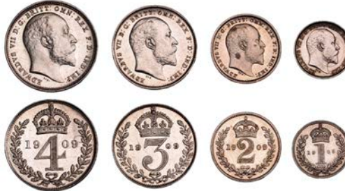
3217 Maundy Set, 1909 (ESC 3615; S 3985) [4]. Lustrous, extremely fine; in fitted case of issue