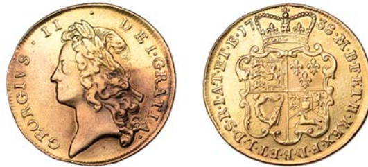
3145 Two-Guineas, 1738 (MCE 291; EGC 568; S 3667B). Removed from jewellery, good fine