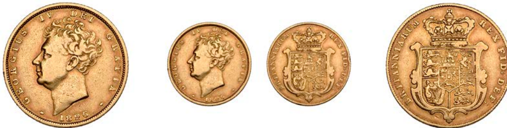
G 3175 Sovereign, 1826 (Hill 11; S 3801). Fine