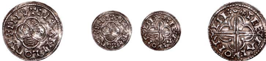
3041 Penny, Quatrefoil type, Lewes , Leofa, LEEFA MONE LEE; legend starts at 9 o'clock, ends ANGLORV, 1.14g/6h (HHK 138; Sussex Mints –; BEH 1281; N 781; S 1157). Central crack, a little double struck, very fine