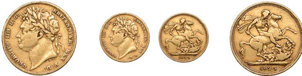
G 3173 Sovereign, 1823 (M 7; S 3800). Good fine, rare