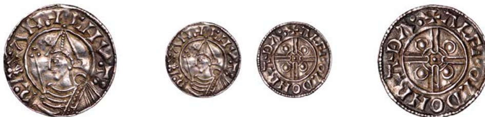
3043 Penny, Pointed Helmet type, Bath , Ælfwold, ALFPOLD ON BADA; 1.05g/9h (BEH 47; N 787; S 1158). Several surface cracks, otherwise very fine, toned