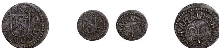
3137 London (Rural Middlesex), Edmonton , John Tabaraham, Farthing, 1668, 1.03g/8h (N 9124; D 44C). Dark tone, good fine £100-£120