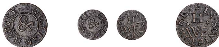
57 South Town [Little or South Yarmouth], William Harvey, Farthing, 0.76g/12h (N 4453; D 292A/BW. Norfolk 321). Very fine and very rare; the only token for the locality

Provenance: M.J. Harris Collection, Spink Auction 43, 18 April 1985, lot 51