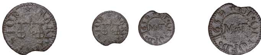
53 Orford , Mary Thurston, Farthing, 1659, 0.88g/6h (N 4437; BW. 280). Struck on a bar end, fine; the only token for the village