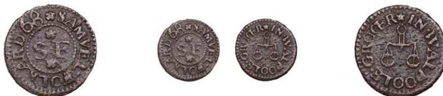
66 Walpole , Samuel Folkard, Farthing, [16]68, 0.92g/12h (N 4489; BW. 348), Halfpenny, 1670, 1.38g/6h (N 4490; BW. 347) [2]. First good fine and rare, second about fine; the only tokens for the village £80-£100 Provenance: *N 4489 bt Spink May 1976; N 4490 bt Spink February 1976