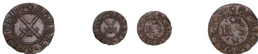
54 Rickingham , Samuel Fitch, Farthing, 1665, 1.04g/12h (N 4438; BW. 281); Robert Spencer, Farthing, 1667, 0.69g/3h (N 4439; BW. 282) [2]. First fine, second very fine; the only tokens for the village