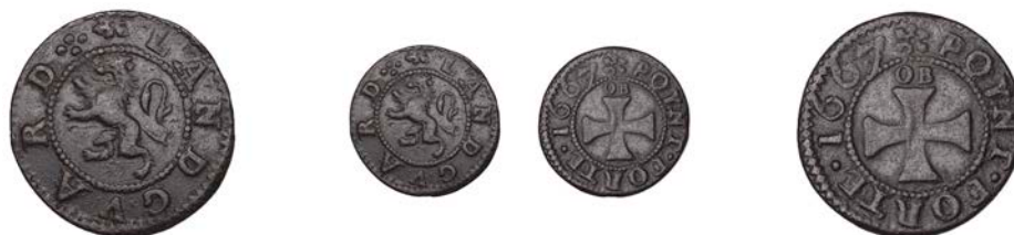
41 Landguard Point [Felixstowe], Governor's Halfpenny, 1667, 2.26g/12h (N 4389; BW. 204). About very fine, rare £120-£150