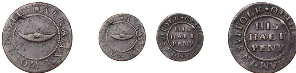
64 Thelnetham , Abraham Wotherell, Halfpenny, 2.05g/12h (N 4487; BW. 344). Fine; the only token for the village £50-£70 Provenance: J.L. Wetton Collection; bt N.A. Clark June 1998