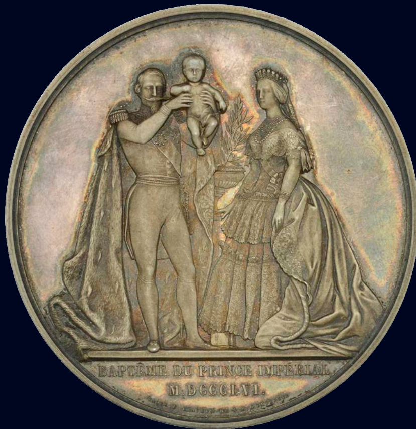
FRANCE, BAPTÊME DU PRINCE IMPÉRIAL [BAPTISM OF THE PRINCE IMPERIAL], 1856 A PRESENTATION PAIR OF SILVER AND COPPER MEDALS BY A.-A. CAQUÉ, ESTIMATE: £600–£800

FOR ALL ENQUIRIES PLEASE CONTACT PETER PRESTON-MORLEY ON 020 7016 1700 OR EMAIL COINS@NOONANS.CO.UK