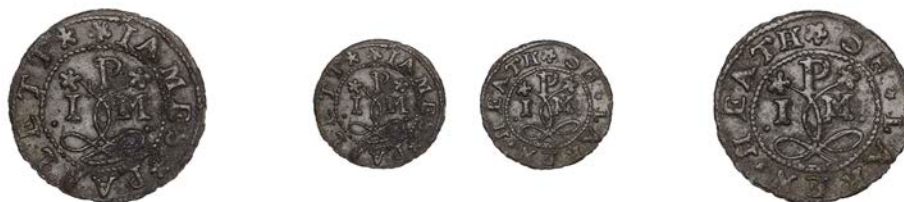
40 Lakenheath , James Parlett, Farthing, 0.84g/12h (N 4387; BW. 203). Light surface corrosion, otherwise very fine, rare; the only token for the village £70-£90

Provenance: N 4384 bt S.E. Schwer January 1980; *N 4386 R.J. Carthew Collection, Eileen Judson Collection, DNW Auction 57, 19 March 2003, lot 997 (part), bt N.A. Clark June 2003