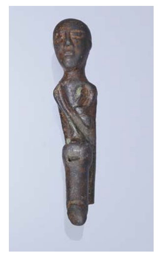
The Haconby Celtic Fertility Figure

937 A bronze male nude figure, 1st century AD, 5.5cm high by 1.2cm wide; oval-shaped face with lentoid eyes, long straight nose, slit mouth and small protruding ears; the narrow torso has angled shoulders with the left arm held against the chest holding a small purse; the right hand is extended downwards holding an enlarged phallus which is hinged for movement; the straight legs are merged together; behind the head is a loop, while the back is concave. Very fine with a smooth brown patina £800-£1,200