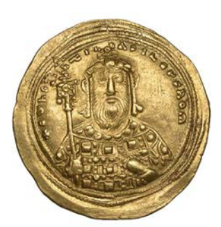
809 Constantine VIII (1025-28), Histamenon Nomisma, Constantinople, facing bust of Christ holding gospels, nimbus around head, rev. crowned facing bust of emperor, holding labarum, 4.41g (DOC 2; Sear 1815). Traces of die wear, otherwise about extremely fine £500-£600

Provenance: CNG Auction 49, 17 March 1999, lot 1979