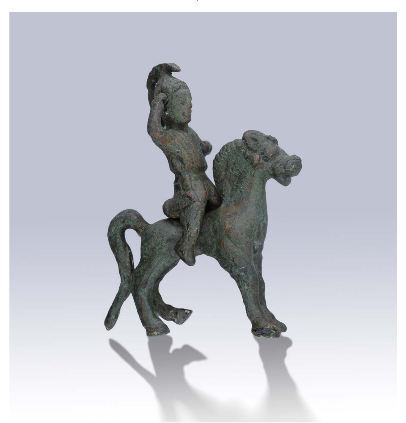
The Lissington Horse and Rider

990 Bronze horse and rider figurine, 2nd-3rd century, horse 10cm long by 9cm high by 2.5cm wide, rider 9.5cm high by 4cm wide by 2.5cm deep; the rider wears a belted tunic with vertical folds and a kilt below; he has a crested helmet on his head, his right arm extends sideways and turns up at the elbow with a notch to hold a spear; the left arm extends sideways to the elbow, where a shield would have been attached; the horse has muscular legs, which are straight at the front, while the back legs are bent and there is a long thick curving tail, a thick crested mane, and the eyes are disc-shaped and bulbous; there is a bridle, nose and head band. All the detailing is clear with a slightly uneven green patina and red highlights; the tail has been re-attached £4,000-£5,000