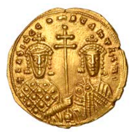
Basil II with Constantine VIII (976-1025), Histamenon Nomisma, Constantinople, facing bust of Christ holding gospels, nimbus around head, rev. crowned facing half-figure busts of Basil and Constantine holding patriarchal cross between them, 4.33g (DOC 2; Sear 1796). Extremely fine £800-£1,000