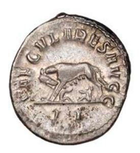
532 Philip I, Antoninianus, 248, radiate bust right, rev. saecvlares avgg, she-wolf suckling twins, 4.30g/12h (RIC 15; RSC 178; RCV 8957). Good very fine €70-€90