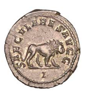
531 Philip I , Antoninianus, 248, radiate and draped bust right, rev. SAECVLARES AVGG, lion walking right, 4.13g/6h (RIC 12; RSC 173; RCV 8956). Good very fine £60-£80