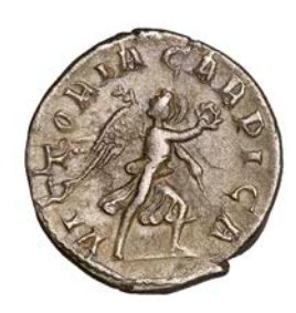
Philip I , Antoninianus, 247, radiate and draped bust right, rev. VICTORIAE CARPICA, Victory advancing right, holding wreath and palm frond, 3.34g/12h (RIC 66; RSC 238; RCV 8973). Very fine and toned; the reverse type rare and of historical interest #120-£150 Provenance: Bt 1965