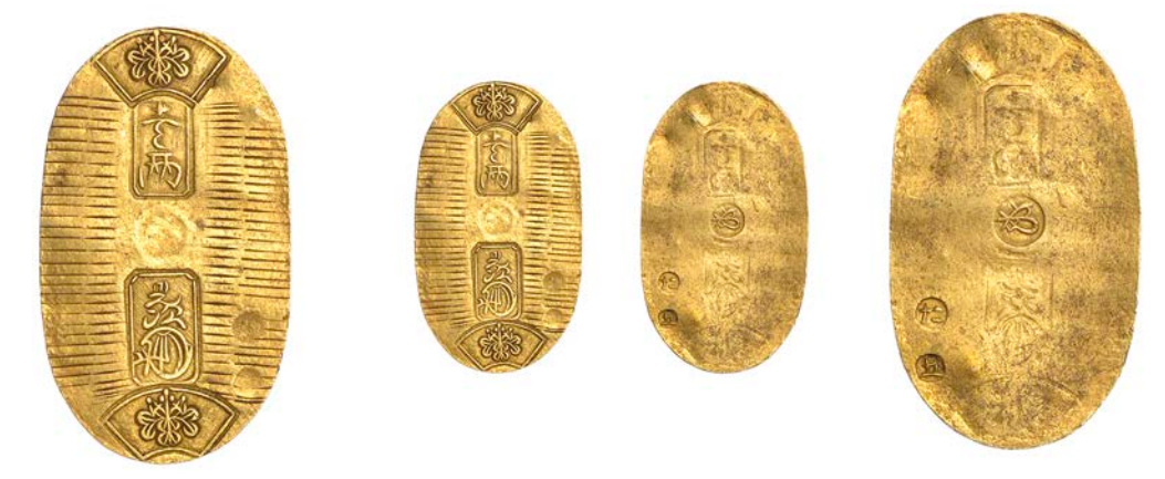
35 MANEN , gold Koban [1860-7], 36 x 21mm, 3.32g (JNDA 09-23; J & V B109; KM. C22d; F 17). Good very fine £400-£500