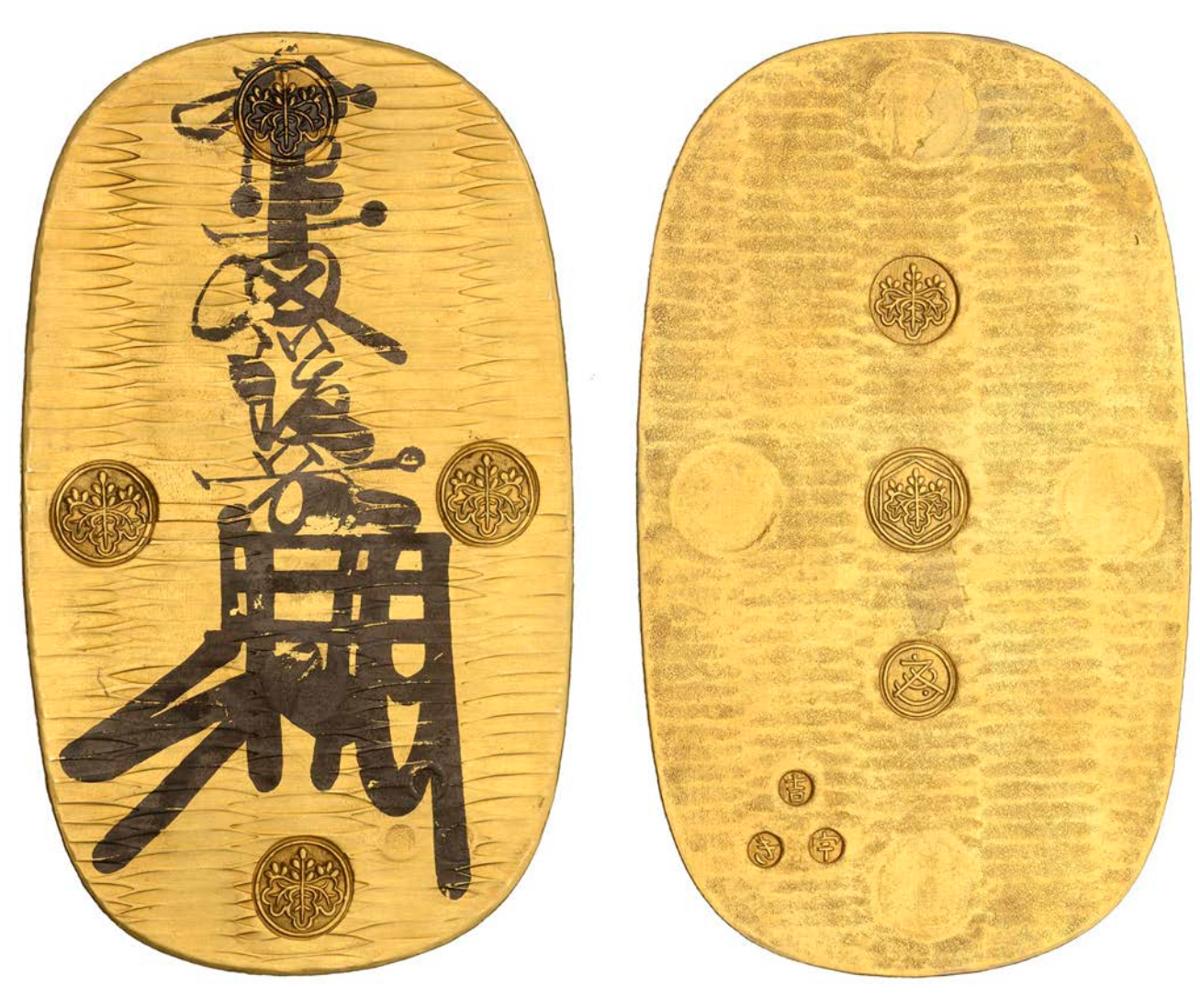
34 MANEN , gold Oban [1860-2], 135 x 81mm, 113.21g (JNDA 09-11; J & V A7; KM. C24a.2; F 7). Extremely fine £6,000-£8,000