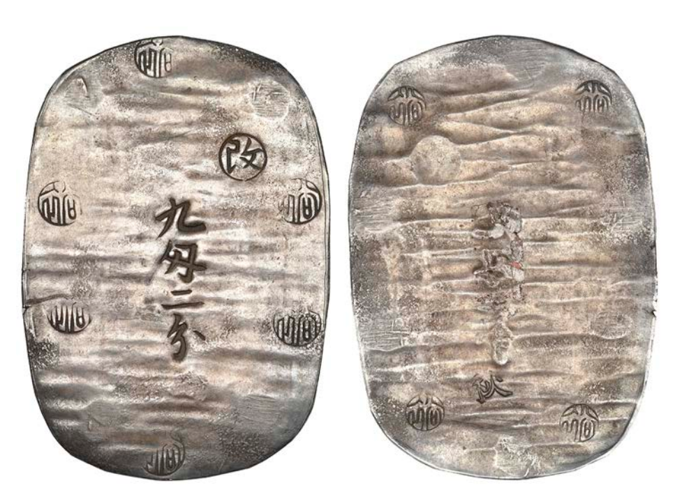
38 AKITA , silver 9 Momme 2 Bu [1863], 84 x 57mm, 34.47g (JNDA 09-71; J & V p.38; KM. 12). Good very fine Provenance : J.W. Garrett Collection, Part I, NFA/Bank Leu Auction (Beverly Hills), 16-18 May 1984, lot 9