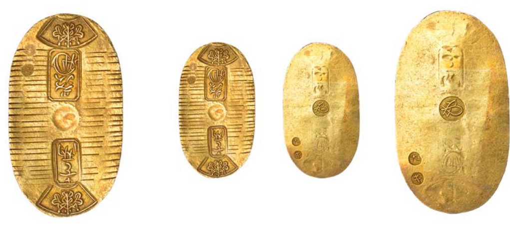
36 MANEN, gold Koban [1860-7], 37 x 21mm, 3.32g (JNDA 09-23; J & V B109; KM. C22d; F 17). Surface flaw on reverse, otherwise good very fine £400-£500