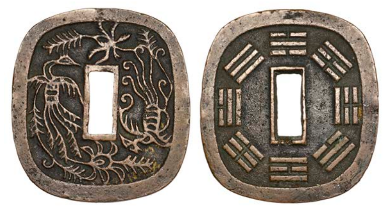
37 AKITA , 100 Mon [1862], short-tailed phoenix, 52 x 48mm, 51.79g (JNDA 10; KM. 6.1). Very fine