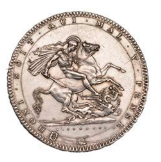
429 Crown, 1820, edge LX (ESC 219; S 3787). Cleaned, otherwise extremely fine