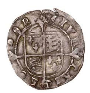
262 Posthumous coinage, Groat, Southwark, mm. E (?) on obv . only, bust 4, Roman lettering, ε and s in alternate forks, lozenge stops, 2.31g/11h (N 1872; S 2404). Very fine for issue, very rare