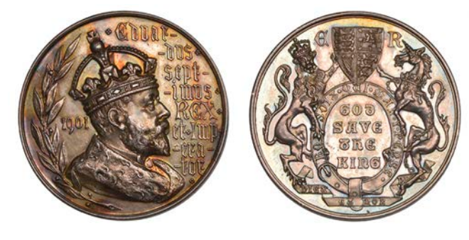
1004 Accession, 1901, medals (4) by J. Moore: white metal, 38mm (C & W 4019A.1); silver, 38mm (C & W 4019A.4); white metal, rev. wreath, 38mm (C & W –); Hythe, white metal, 38mm (C & W 4030A.1) [4]. Good very fine or better, second and third rare