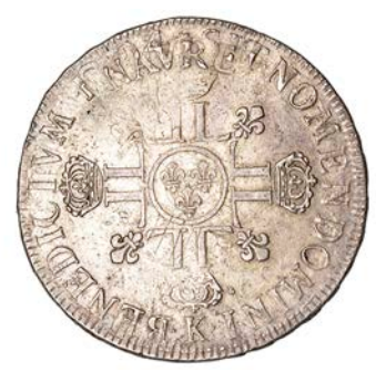
1268 Louis XIV, Écu aux huit L, 1704κ, Bordeaux, réformation, 27.31g/6h (Dup. 1551A; Gad. 224). Good very fine; traces of undertype visible

1269 Louis XV, Écu de Béarn aux lauriers, 1734, Pau, 29.19g/6h (Dup. 1675; Gad. 321a). Fine, scarce