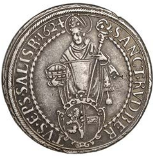
1225 SALZBURG , Paris von Lodron , Thaler, 1624, 28.80g/12h (Probszt 1197; Dav. 3504). Cleaned at one time and now re-toned, otherwise very fine £120-£150