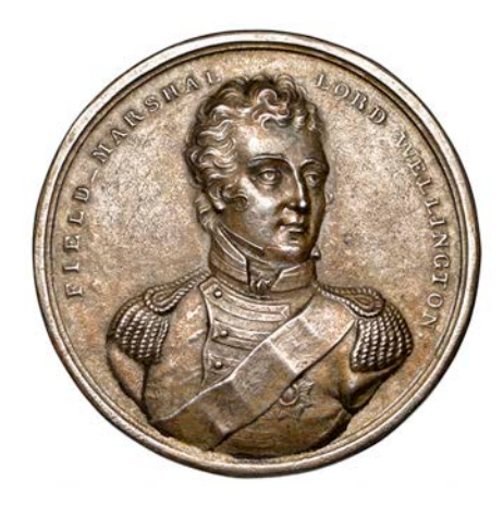
884 Congress of Vienna, [1814-15], a uniface cast iron cliché, unsigned (by F. Detler?), uniformed bust facing, 55mm (Eimer 56, this piece illustrated). Very fine and very rare