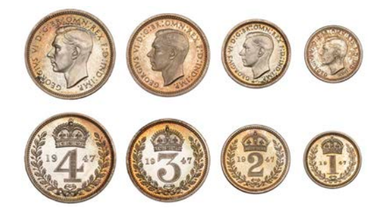
549 Maundy set, 1947 (ESC 4316; S 4091) [4]. Good extremely fine, rare