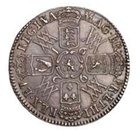
369 Halfcrown, 1692, edge QVARTO (ESC 853; S 3436). Good very fine, toned