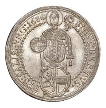
1230 SALZBURG , Johann Ernst von Thun und Hohenstein , Thaler, 1688, 28.85g/12h (Probszt 1795; Dav. 3510). Tooled in places, otherwise about extremely fine £150-£180