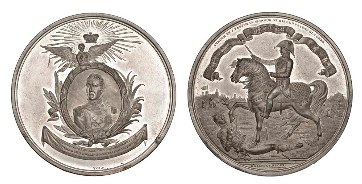
887 Battle of Waterloo, [1815], a white metal medal by T. Halliday, uniformed bust facing within oval medallion, angel and radiate crown above, inscribed mantle below, rev. Blücher on horseback left, trampling fallen figure, inscribed ribbon above, 74mm (Eimer 58; BHM 902; E 1072). Extremely fine, scarce