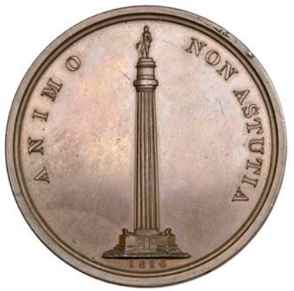
1130 Column Erected to Lord Hill at Shrewsbury , 1816, a copper medal by T. Halliday, bust right, rev. uniformed figure of Lord Hill, with sword, standing upon a column, 54mm (BHM 912). Extremely fine £80-£100