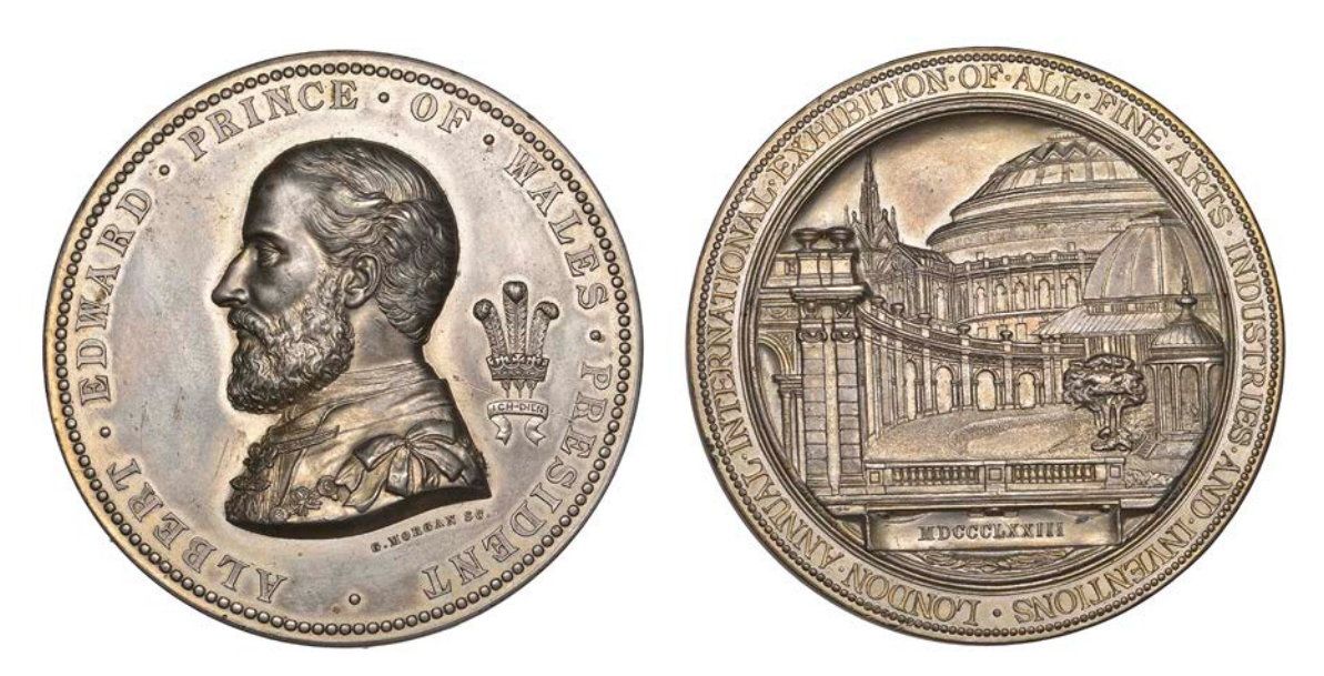
993 International Exhibition of all Fine Arts Industries and Inventions, London, 1873, a gilt white metal medal by G.T. Morgan after J. Gamble, bust of the Prince of Wales left, rev. façade of buildings, edge named (C. & J. Welden, Catalogue No 3789A), 70mm (BHM 2964; E 1622). About extremely fine

992 Birth , 1841, a brass medal, unsigned, 9mm (BHM 1998); The Prince of Wales Box , a round brass box, unsigned and undated, 17mm (BHM −) [2]. Good very fine and very fine £30-£40