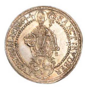
1226 SALZBURG , Paris von Lodron , Thaler, 1644, 28.49g/12h (Probszt 1223; Dav. 3504). Lightly cleaned, otherwise about extremely fine