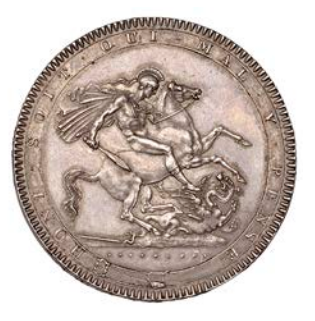
428 Crown, 1818, edge LIX (ESC 2009; S 3787). Small cut on king's nose, otherwise about extremely fine Provenance : P. Evans Collection