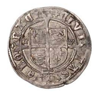
258 Second coinage, Groat, York, Abp Wolsey, mm. voided cross, Tw by shield, cardinal's hat below, reads reads AGL' Z FRA'C', saltires in forks, 2.67g/8h (Whitton (i); N 1799; S 2339). Very fine, scarce