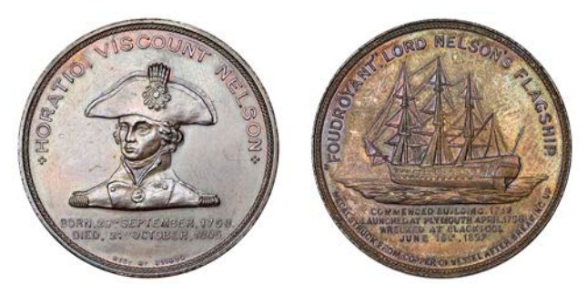
1001 HMS Foudroyant Wrecked, 1897, a bronze medal, unsigned, bust of Lord Nelson facing, rev. view of the ship, 38mm (BHM 3613; E 1813). Extremely fine with some toning