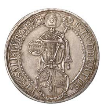
1231 SALZBURG, Johann Ernst von Thun und Hohenstein, Thaler, 1694, 29.09g/12h (Probszt 1800; Dav. 3510). Good very fine £150-£180