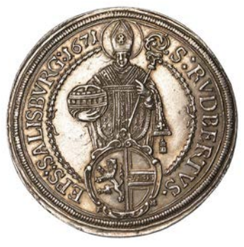
1229 SALZBURG , Max Gandolph von Küenburg , Thaler, 1671, 28.77g/12h (Probszt 1655; Dav. 3508). Lightly cleaned at one time and now re-toned, good very fine £150-£180