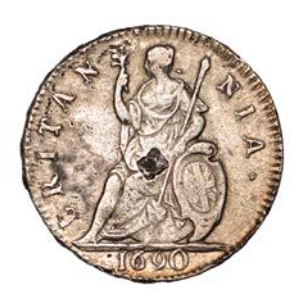
372 Farthing, 1690 (Cooke 646ff; BMC 578ff; S 3451). Copper plug; free of tin pest, smooth surfaces, very fine