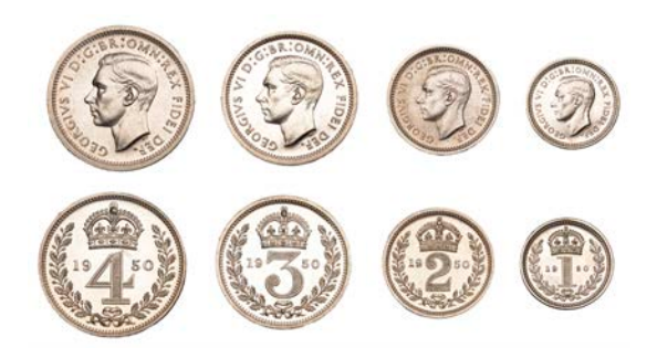
551 Maundy set, 1950 (ESC 4319; S 4096) [4]. Brilliant, virtually as struck; in modern fitted case