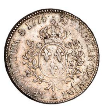
Louis XVI , Écu aux lauriers, 1774A, Paris, 29.35g/6h (Dup. 1708; Gad. 356). Some flecking, otherwise good very fine, the date very rare £1,000-£1,200

1274 Consulate, 5 Francs, AN 8Q, Perpignan, 24.69g/6h (Gad. 563a; KM 639.8). Fine