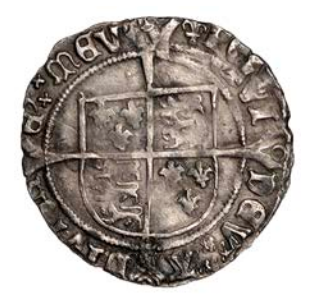
259 Third coinage, Groat, Tower, mm. lis, bust 2, annulets in forks, saltire stops, 1.99g/9h (N 1844; S 2369). Very fine with a good portrait, patchy toning £700-£800