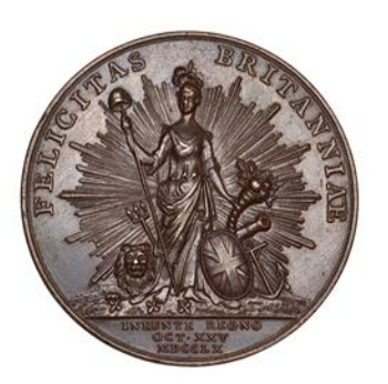
x 1109 George III, Accession, 1760, a copper medal, unsigned [by T. Pingo], armoured and draped bust left, rev. Britannia standing facing between lion and shield, holding lance and cornucopia, rays behind, 41mm (Eimer Pingo 17; BHM 3; E 683). About extremely fine £100-£120