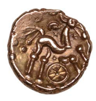
Lot 76: British Iron Age Stater struck under Bodvoc of the Dobunni, found at Hazelbury Manor