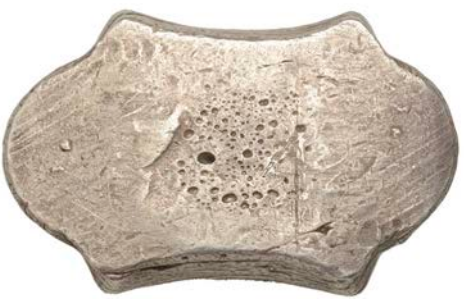
1246 EMPIRE, Yunnan, silver sycee, 'packsaddle' type, late 19th or early 20th century, 60 x 37 x 15mm, 172g. Good very fine £1,000-£1,200