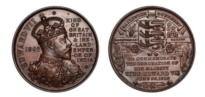
1009 Coronation, 1902, medals (2) by Beck & Inchbold: Cambridge, bronze, 38mm (C & W 4125E.1a); Guernsey, bronze, 38mm (C & W 4125J.2) [2]. First about extremely fine and pierced for suspension, second extremely fine and rare