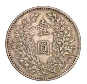
1248 REPUBLIC, Yuan Shih-kai, Dollar, yr 3 [1914] (L & M 63; KM Y329). Very fine