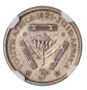
One of the most sought-after South African coins: the 1931 Tickey

1470 George V, Threepence, 1931 (Hern S130; KM 15.2). Very fine and very rare [slabbed NGC VF 25]