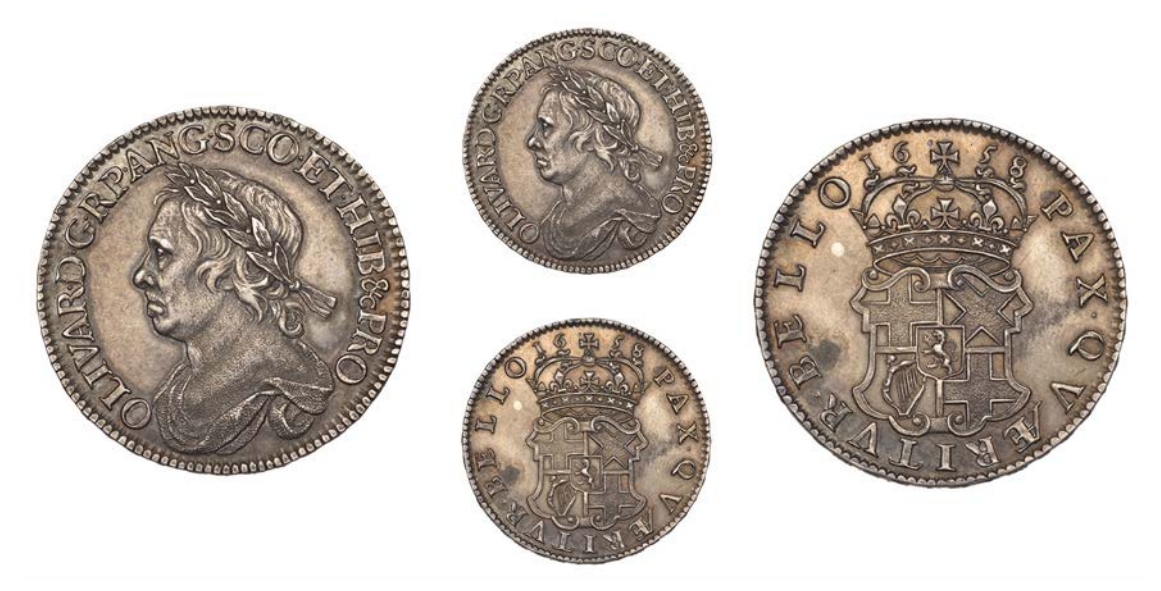
345 Halfcrown, 1658 (Lessen I26; ESC 252; S 3227A). A few light marks, otherwise about extremely fine Provenance : Graham Collection [from Dolphin Coins 1983]

Provenance: A Collection of Gold Coins, the Property of a Gentleman