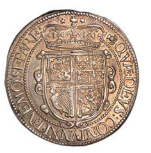
592 Charles I (1625-49), Third coinage, Falconer's Second issue, Thirty Shillings, mm. two leaved thistles (large and small), F by horse's hoof, smooth ground line, two small stars above crown (five-pointed to left, six-pointed to right), 14.85g/6h (Bull 15; Murray 4; cf. SCBI 35, 1492-4; B 39; S 5555). Usual die flaw at 12 o'clock on obverse, otherwise very fine or better, lightly toned