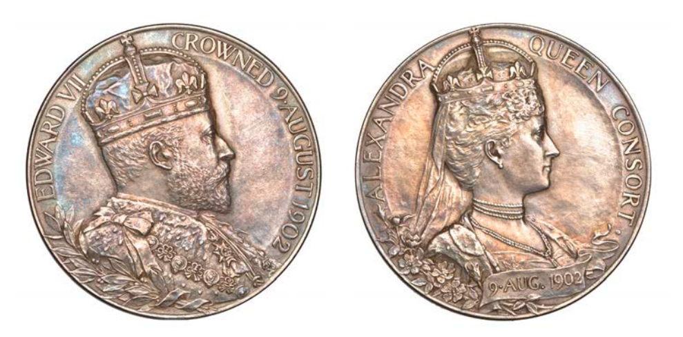
1008 Coronation , 1902, silver (2) and bronze medals by G.W. de Saulles, 31mm, 55mm, 55mm (C & W 4100A.1, 4100A.3a, 4100A.4a; BHM 3737) [3]. First about very fine, other two about extremely fine; latter two in cases of issue