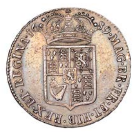
366 Halfcrown, 1689, second shield, caul only frosted, pearls, edge PRIMO (ESC 839; S 3435). Sometime cleaned and now re-toned, good very fine

367 Halfcrown, 1689, second shield, no frosting, no pearls, edge PRIMO (ESC 846; S 3435). Fine