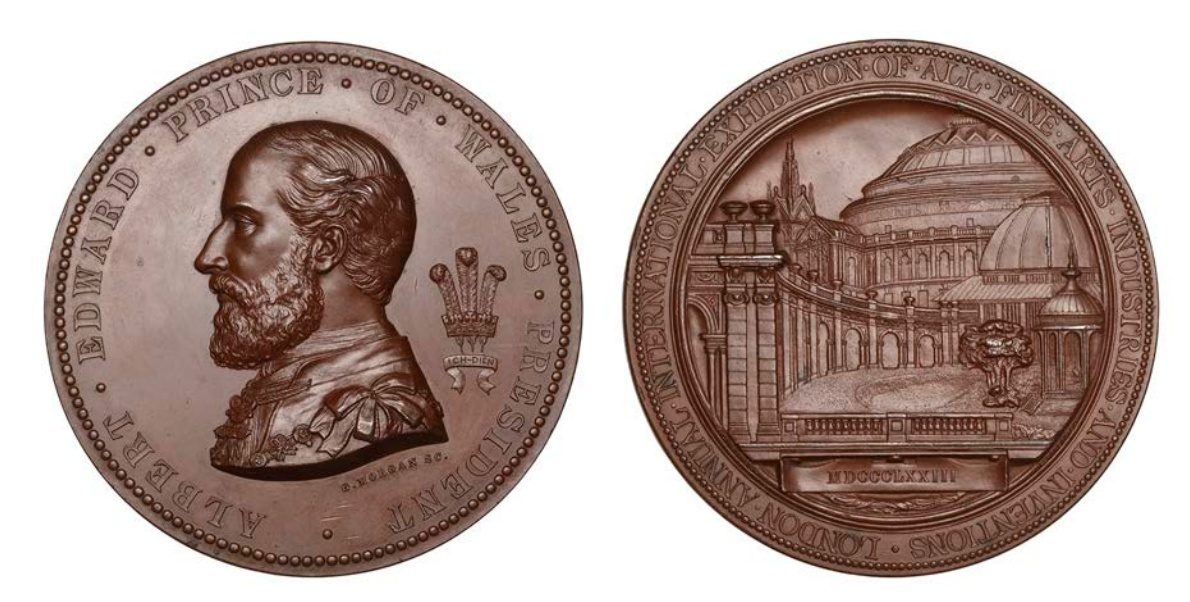
994 International Exhibition of all Fine Arts Industries and Inventions, London, 1873, a bronze medal by G.T. Morgan after J. Gamble, bust of the Prince of Wales left, rev. façade of buildings, edge plain, 70mm (BHM 2964; E 1622). Extremely fine