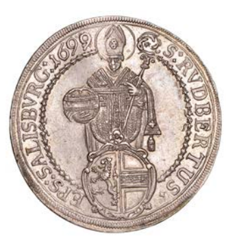
1232 SALZBURG , Johann Ernst von Thun und Hohenstein , Thaler, 1699/8, 28.82g/12h (Probszt 1805; Dav. 3510). Extremely fine £300-£400