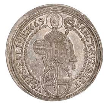
1227 SALZBURG , Guidobald von Thun und Hohenstein , Thaler, 1665, 28.86g/12h (Probszt 1482; Dav. 3505). Fields lightly tooled, otherwise very fine £120-£150