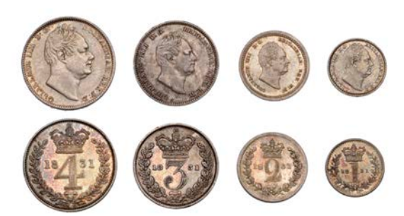
449 Maundy set, 1831 (ESC 2547; S 3840) [4]. Threepence about very fine, others better