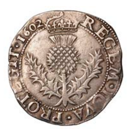
591 James VI , Eighth coinage, Thistle Merk, 1602, 6.57g/12h (SCBI 35, 1284-8; SCBI 58, 1571-82; B 3, fig. 943; S 5497). Very fine or better