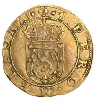
590 James VI , Seventh coinage, Rider, 1594, mm. quatrefoil, pellets by date, 4.98g/3h (SCBI 35, 1161ff; SCBI 58, 1278ff; B 4, fig. 954; S 5458). Marks on edge, good fine, toned £2,000-£2,600

Provenance: A Collection of Gold Coins, the Property of a Gentleman