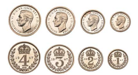
548 Maundy set, 1947 (ESC 4316; S 4091) [4]. Scratch on obverse of Penny, otherwise brilliant, about as struck; in case of issue £200-£260