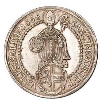
1228 SALZBURG , Guidobald von Thun und Hohenstein , Thaler, 1666, 28.39g/12h (Probszt 1483; Dav. 3505). Fields lightly tooled, otherwise very fine €120-€150