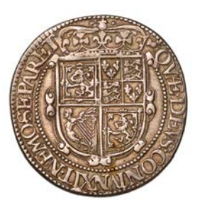
593 Charles I, Third coinage, Falconer's Second issue, Thirty Shillings, mm. leaved thistle (with star each side on obv. ), F below horse's hoof, rough ground line, two stars over crown, 14.38g/6h (Bull 9; Murray 1; SCBI 35, –; B 40, fig. 1015; S 5556). Nearly very fine £240-£300