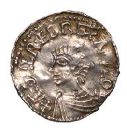
Provenance: P. Evans Collection

137 Penny, CRVX type, Lincoln, Kolgrimr, COLGRIM M<sup>-</sup>O LINCOL, 1.21g/9h (Mossop pl. iv, 3, same rev. die; BEH 1706; N 770; S 1148). Chipped and a little crimped, fine, reverse better £150-£180