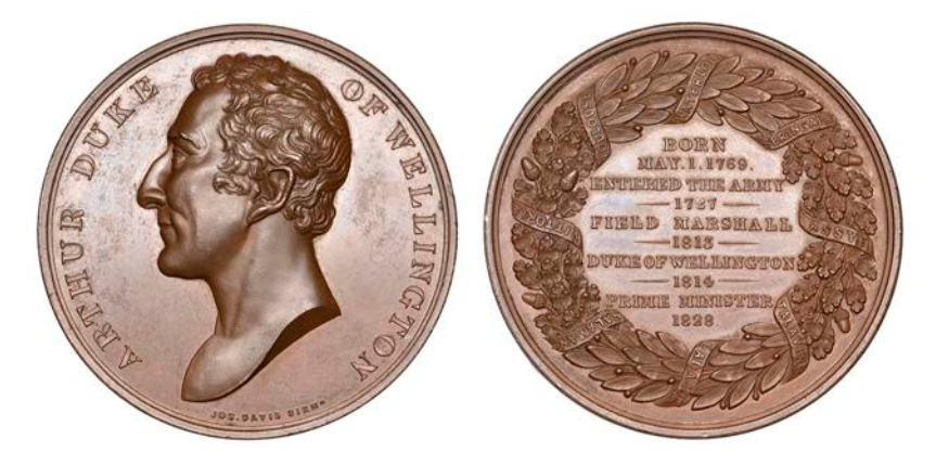
925 Prime Minister , 1828, a copper medal by J. Davis, bare head left, legend within wreath, 51mm (Eimer 103; BHM 1330). Extremely fine, very rare