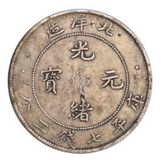
1247 EMPIRE, Chihli , Dollar, yr 34 [1908], 27.05g/12h (L & M 465; KM Y73.2). A few marks, otherwise very fine [slabbed NGC XF Details, Obv Graffiti, Chopmarked] £300-£400