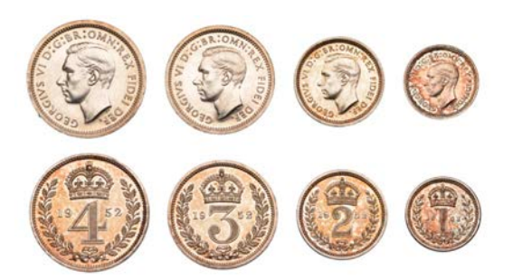
552 Maundy set, 1952 (ESC 4322; S 4096) [4]. About as struck, scarce