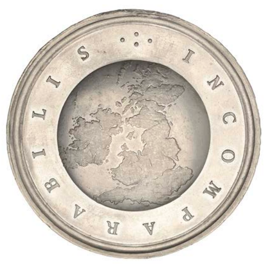
1108 State of Britain, 1760, a white metal medal by J.C. Hedlinger, laureate, armoured and draped bust of George II left, rev. INCOMPARABILIS, British Isles on globe, 68mm, 121.91g (Felder 189; MI II, 712/449; BDM II, 464; cf. DNW 199/871). Fields brushed, some minor marks on obverse, otherwise extremely fine, very rare £2,000-£2,600