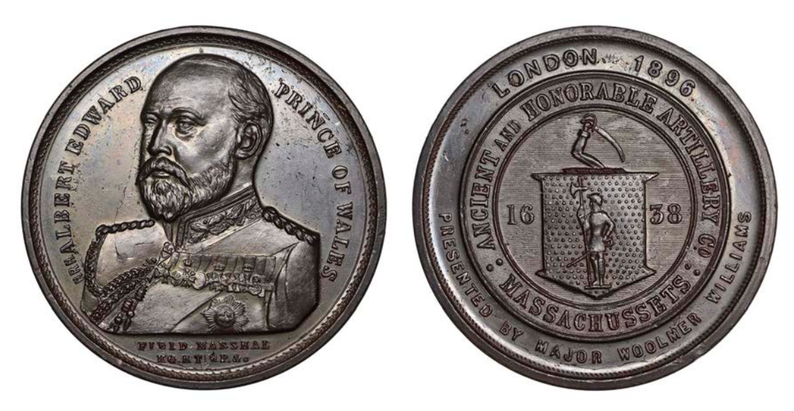
1000 Ancient and Honorable Artillery Co. of Massachusetts, Visit to London, 1896, a bronze medal, unsigned, uniformed bust facing three-quarters left, rev. arms of the Company, 69mm (W & E -; BHM -). Some marks and surface flaws, otherwise about extremely fine, rare