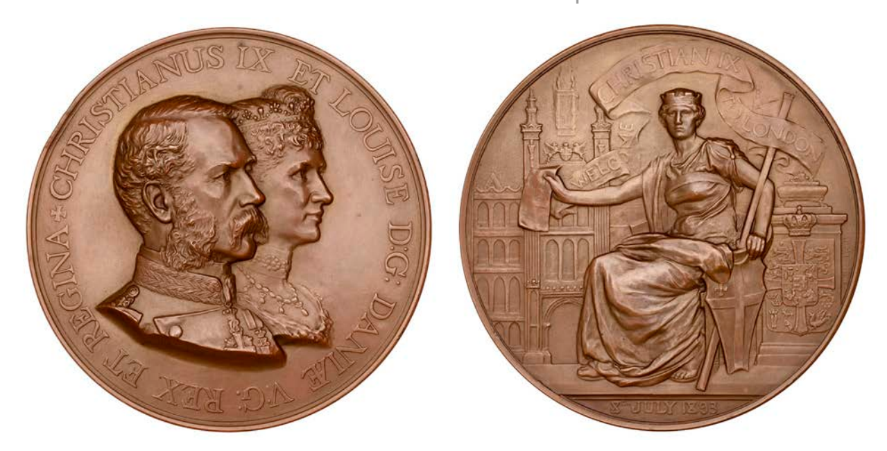
1152 Visit of Christian IX and Louise of Denmark to the City of London, 1893, a light bronze medal by F. Bowcher for the Corporation of the City of London, conjoined busts right, rev. Londinia seated, façade of the Guildhall behind, 75mm (W & E 1766A.1; BHM 3454; E 1783). Extremely fine; in case of issue [this distressed]