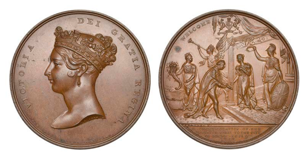
379 Victoria, Visit to the City of London, 1837, a copper medal by J. Barber for Griffin & Hyams, crowned head left, rev. Victoria, attended by Britannia, welcomed by the Lord Mayor, 61mm (W & E 62A.2; BHM 1772; E 1303). Some minor marks, carbon spot in reverse field, otherwise extremely fine; in contemporary fitted case

378 The Reform Bill, 1832, a white metal medal by J. Davis, bare head of Earl Grey left, rev. British lion right, scroll behind, 43mm (BHM 1579; E 1257). A few minor marks, otherwise extremely fine <u>£60-£80</u>