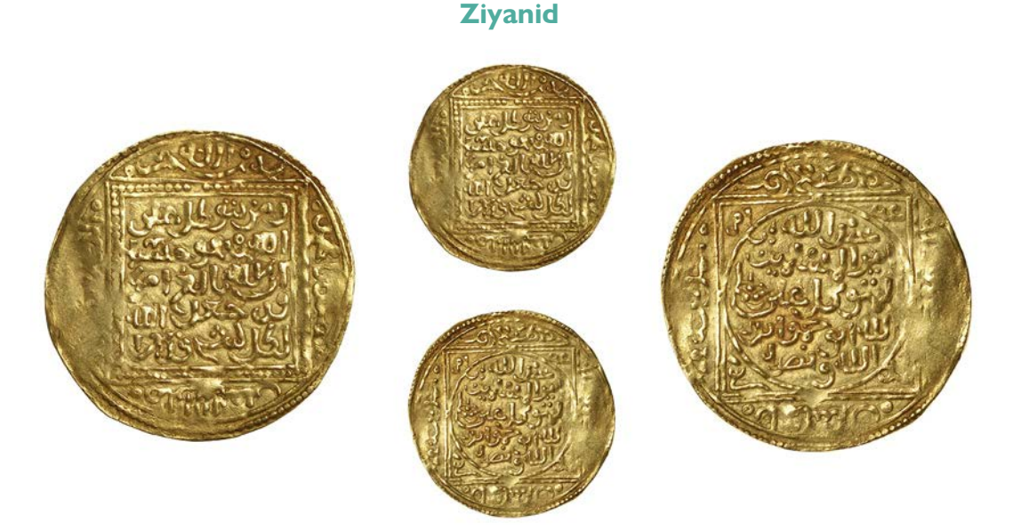
584 Abu Hammu Musa III (922-934h), Dinar, Madinat Tilimsan, undated, rev. legend within circle, 4.26g/12h (Zeno 110860; Hazard -; A 519M; ICV 749). Some weakness in margins, otherwise good very fine, extremely rare £1,000-£1,200

583 al-Mahdi Muhammad I, billon Dirham, al-Andalus, date (442h?) uncertain, citing Yahya, 2.55g/4h (A 371.2; ICV 581). Slightly bent, otherwise good very fine, scarce £60-£80