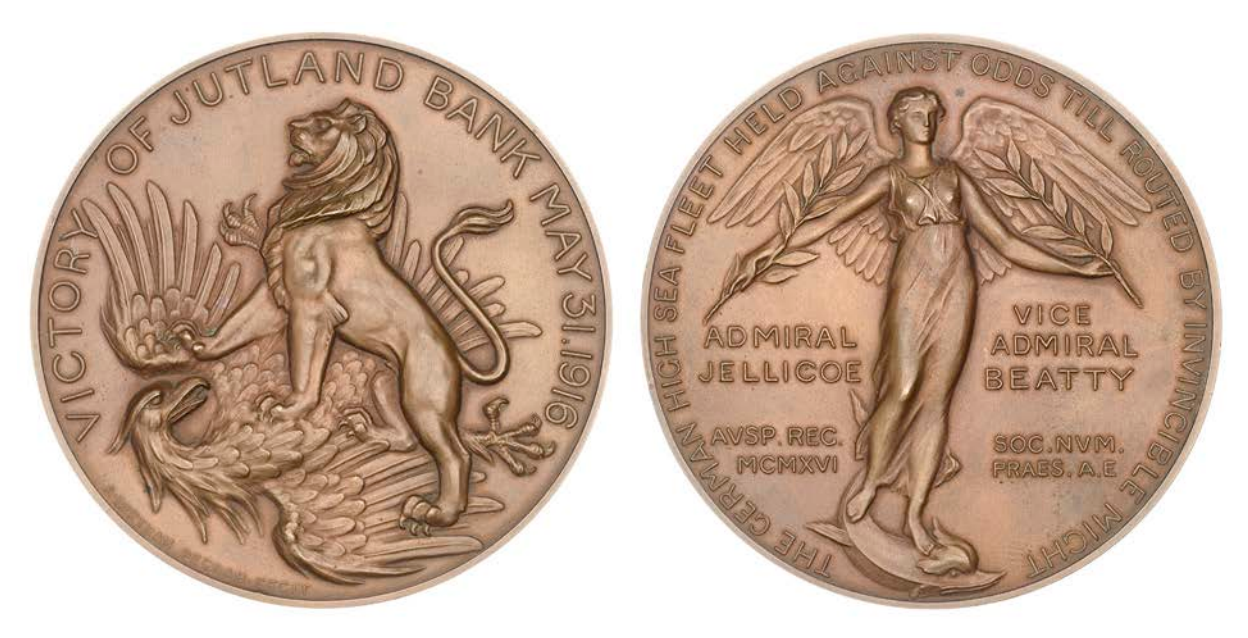
435 Battle of Jutland , 1916, a bronze medal by A.B. Pegram for Spink, British lion trampling German eagle, rev. Victory standing on dolphin, holding laurel branch in each hand, 76mm (BHM 4127; E 1949). Extremely fine; in case of issue £200-£260