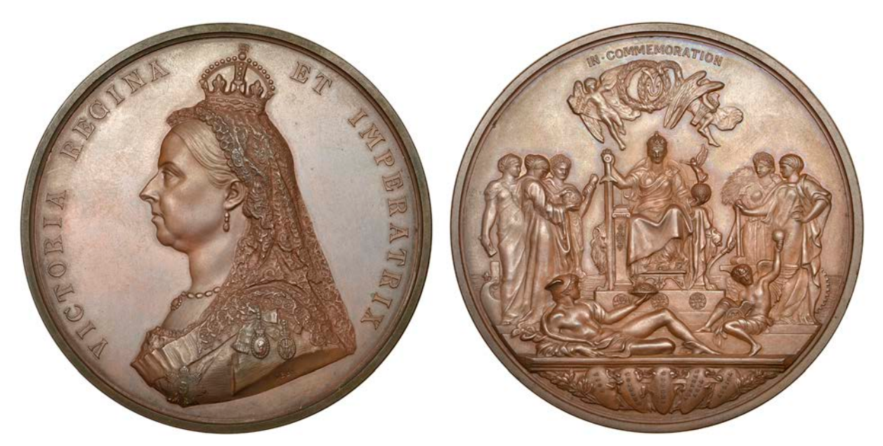
414 Victoria, Golden Jubilee, 1887, a bronze medal by L.C. Wyon after Sir J.E. Boehm and Sir F. Leighton, similar, 77mm (W & E 2000A.1; BHM 3219; E 1733b). Extremely fine; in case of issue £200-£260

413 Victoria, Golden Jubilee, 1887, a silver medal by L.C. Wyon after Sir J.E. Boehm and Sir F. Leighton, crowned bust left, rev. enthroned figure of Empire surrounded by standing figures representing Science, Letters, Art, etc, Mercury and Time below, 77mm, 216.16g (W & E 2000A.2; BHM 3219; E 1733b). Polished, some marks in fields, otherwise about extremely fine; in case of issue £400-£500