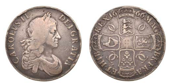
173 Crown, 1666, second bust, edge xviii (ESC 366; S 3355). Edge smoothed, possibly due to ring-mounting, otherwise fine £150-£200

x 172 Crown, 1662, first bust, rose below, 6h (ESC 340; S 3350). Numerous edge bruises, otherwise good very fine, attractively toned £1,000-£1,200