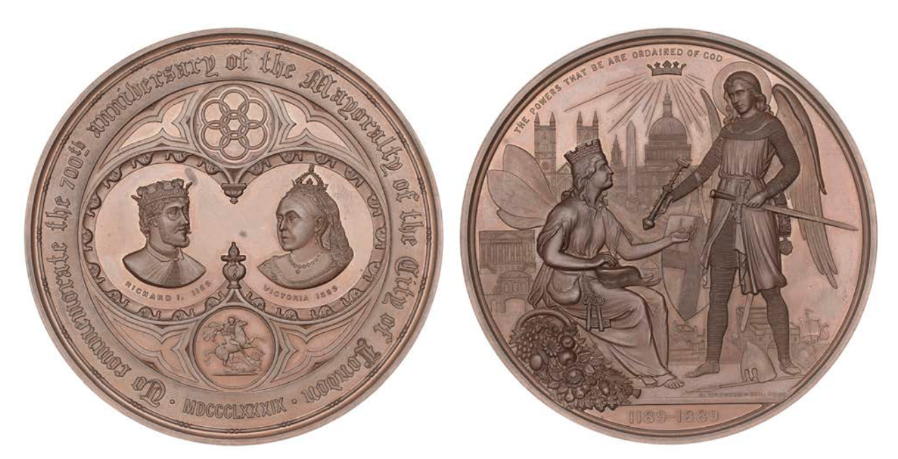
416 700th Anniversary of the Mayoralty of the City of London , 1889, a bronze medal by A. Kirkwood & Sons for the Corporation of the City of London, busts of Richard I and Victoria vis-à-vis in cartouche, rev. St Michael presenting sceptre to kneeling figure of Londinium, St Paul's behind, 77mm (BHM 3377; E 1752). Virtually as struck; in fitted case of issue £500-£700