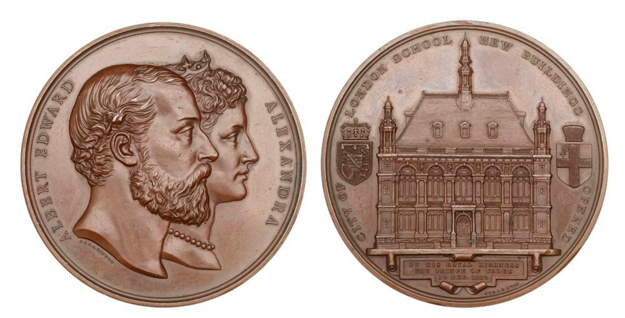
410 New Buildings at the City of London School Opened, 1882, a bronze medal by J.S. & A.B. Wyon for the Corporation of the City of London, conjoined busts of the Prince and Princess of Wales right, rev. frontal elevation of the School, 77mm (W & E 1461A.1; BHM 3133; E 1690). Extremely fine