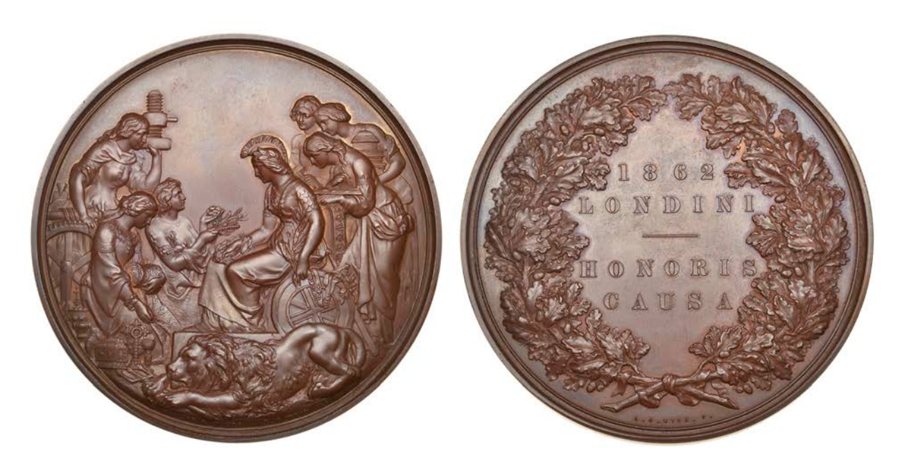
397 International Exhibition, South Kensington, 1862, Prize Medal, a copper award by L.C. Wyon [after D. Maclise], similar, edge named (W.A. Rose, Class IV), 77mm (Allen SK-A001; BHM 2747; E 1553). Good extremely fine; in contemporary fitted case £200-£260

W.A. Rose, City of London; awarded for Oils