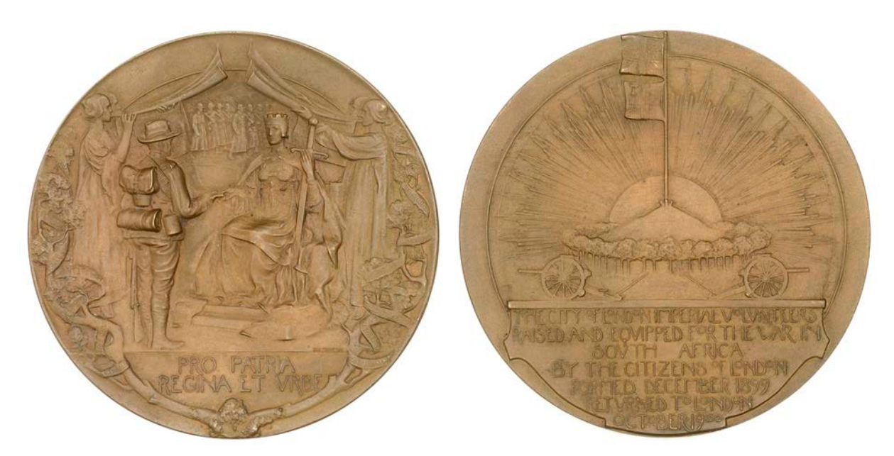
427 City of London Imperial Volunteers, 1900, a bronze medal by Sir George Frampton for the Corporation of the City of London, Volunteer standing before seated Londinia, rev. flagpole on mound surrounded by ring of trees, radiant sun behind, 76mm (BHM 3684; E 1848). About extremely fine; in case of issue [this damaged and repaired]