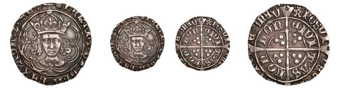
155 Facing Bust issue, Groat, class Illc, mm. crowned leopard's head on obv. , pansy on rev. , crown with inner arch plain, 2.00g/6h (SCBI Ashmolean 331; N 1705c; S 2199). Struck on a compact flan, otherwise good very fine, the combination of mint marks rare £300-£400