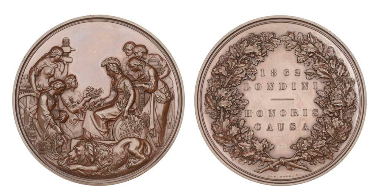
398 International Exhibition, South Kensington, 1862, Prize Medal, a copper award by L.C. Wyon [after D. Maclise], similar, edge named (Christy & Co., Class XX), 77mm (Allen SK-A001; BHM 2747; E 1553). Lightly cleaned, otherwise extremely fine; in contemporary fitted case

W.A. Rose, City of London; awarded for Oils