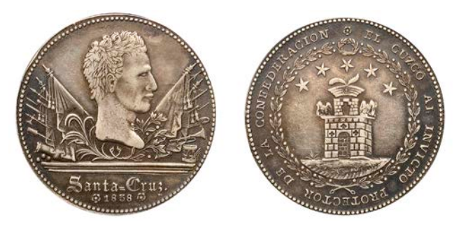
475 PERU-BOLIVIA, Confederation, 1838, silver proclamation medal, bare head of Santa Cruz right, crossed flags and arms behind, rev. tower within wreath, 38mm (Fonrobert 9235). Cleaned, otherwise very fine [slabbed ANACS EF 45 Details, Cleaned] £100-£120

476 PRUSSIA, Capture of Prague, 1757, a bronze medal, unsigned [by J.G. Holtzhey], 48mm; Battles of Rosbach and Lissa, 1757, pinchbeck medals (2), unsigned, 48mm & 47mm; Victories of Frederick the Great, 1758, a cast bronze satirical medal, unsigned, 43mm [4]. Fine or better