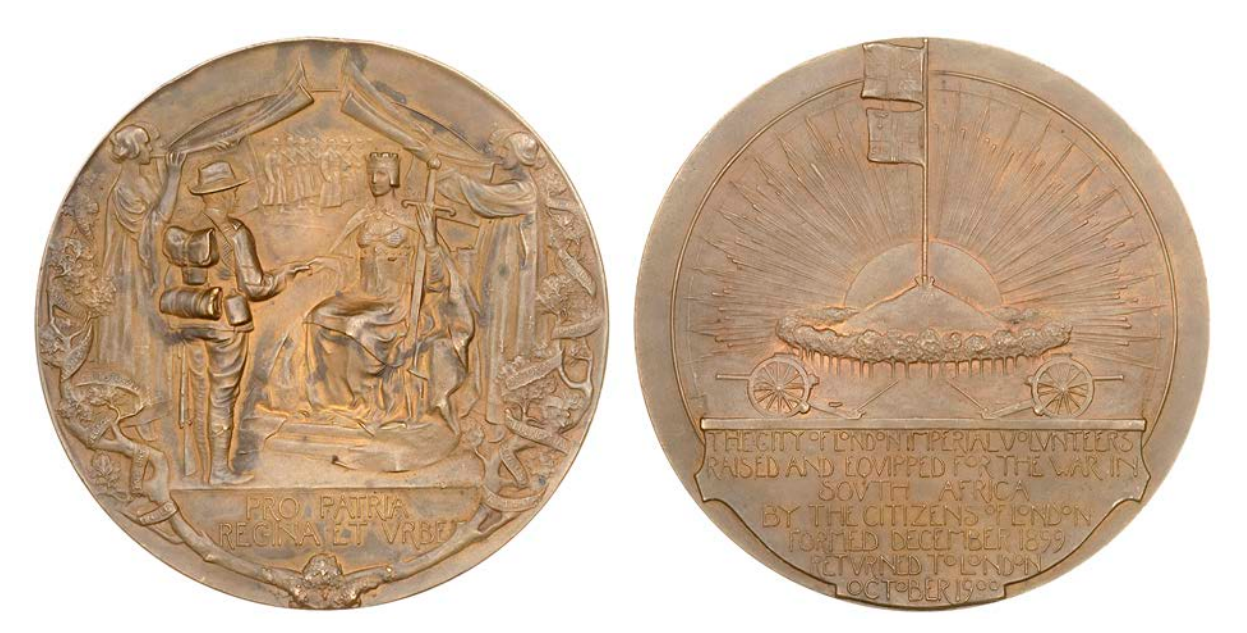
428 City of London Imperial Volunteers, 1900, a bronze medal by Sir George Frampton for the Corporation of the City of London, similar, 76mm (BHM 3684; E 1848). Extremely fine £120-£150

429 Edward VII , Coronation , 1902, a silver medal by G.W. de Saulles, 31mm (BHM 3737); together with other bronze medals (2), and a Dundee silver Shilling token [4]. Very fine or better, one cleaned £80-£100