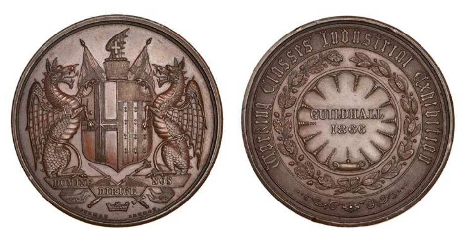
406 Working Classes Industrial Exhibition , 1866, a copper medal by B. Sulman, arms of the City of London, rev. GUILDHALL 1866 on circular scroll within wreath, 56mm (BHM 2871). A few small edge knocks, otherwise extremely fine, very rare £150-£180