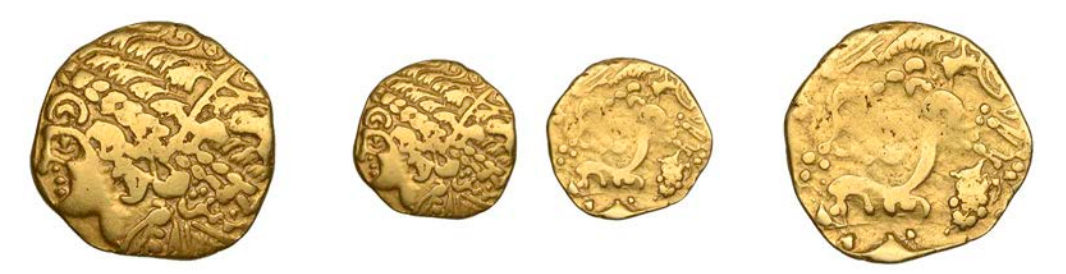
105 GALLO-BELGIC, Stater, class Ab, laureate head of Apollo left, rev. horse left, pellets and ornaments around, rosette below, 7.51g/11h (Sills class 5, fig. 33j, 294-7; ABC 4; VA 12-1; S 2). Obverse very fine, reverse good fine, both sides remarkably well-centred £1,500-£1,800