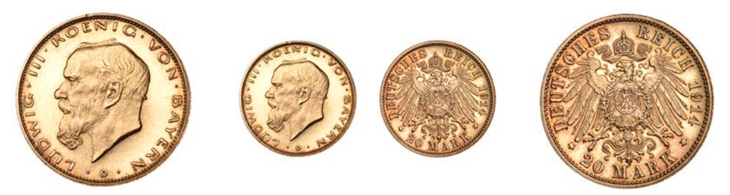
511 BAVARIA, Ludwig III, Pattern 20 Marks, 1914D, in gilt-silver, edge plain with small hallmark, 5.94g/12h. Good extremely fine, rare £300-£400