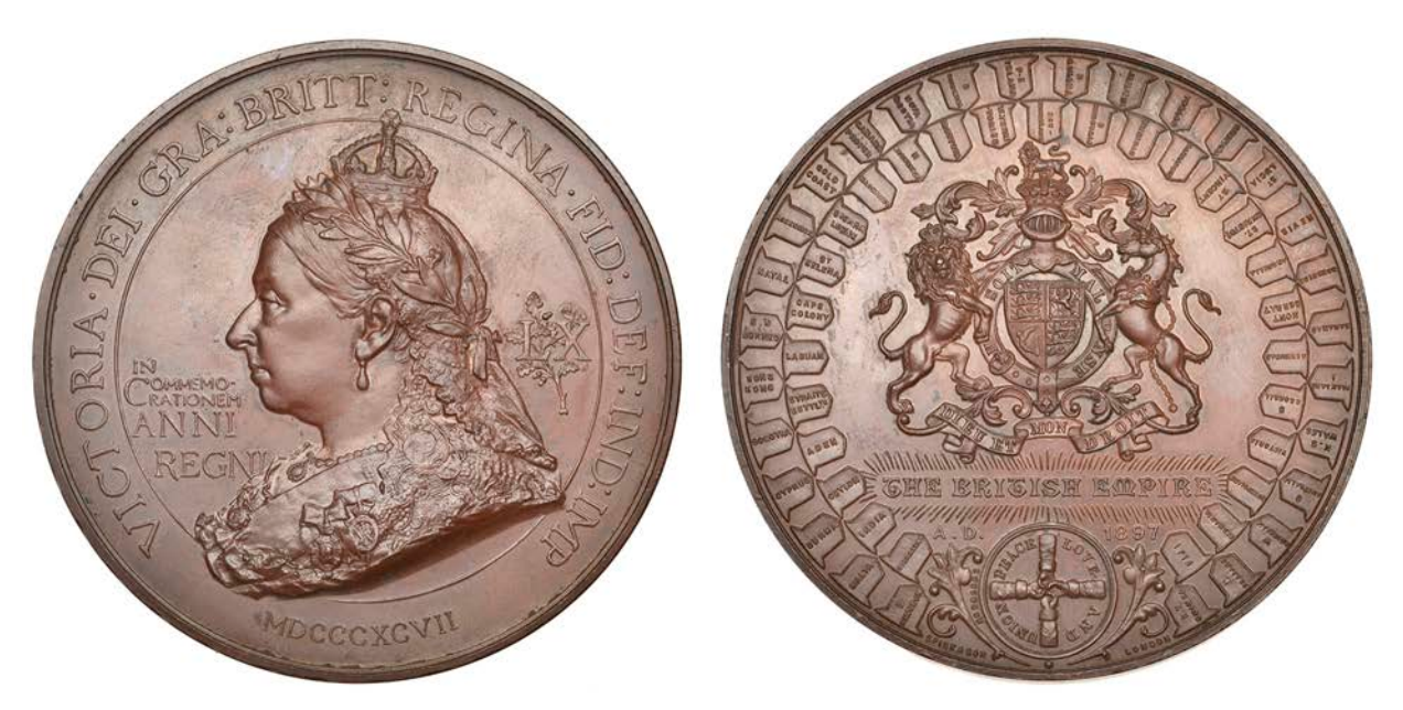
425 Victoria, Diamond Jubilee, 1897, a copper medal by F. Bowcher for Spink, similar, 76mm (W & E 3475A.4; BHM 3511; E 1816). Extremely fine; in contemporary round case by A.B. Savory & Sons, Cornhill, London £120-£150

424 Victoria, Diamond Jubilee, 1897, a copper medal by F. Bowcher for Spink, crowned bust left, rev. royal arms with supporters, names of British territories on small shields around, 76mm (W & E 3475A.4; BHM 3511; E 1816). Extremely fine; in red card box of issue