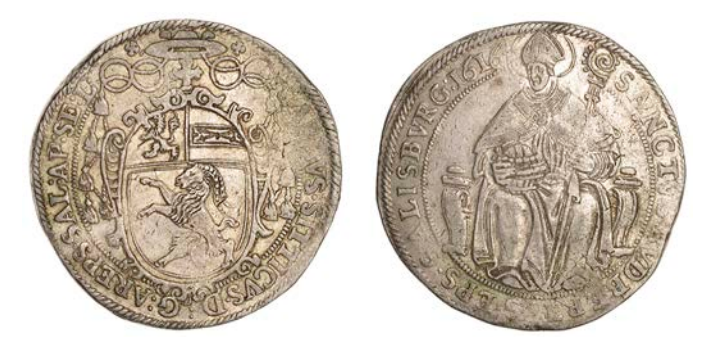
490 SALZBURG, Markus Sittikus von Hohenems, Thaler, 1616, 28.57g/4h (Probszt 967; Dav. 3492). Very fine £300-£400