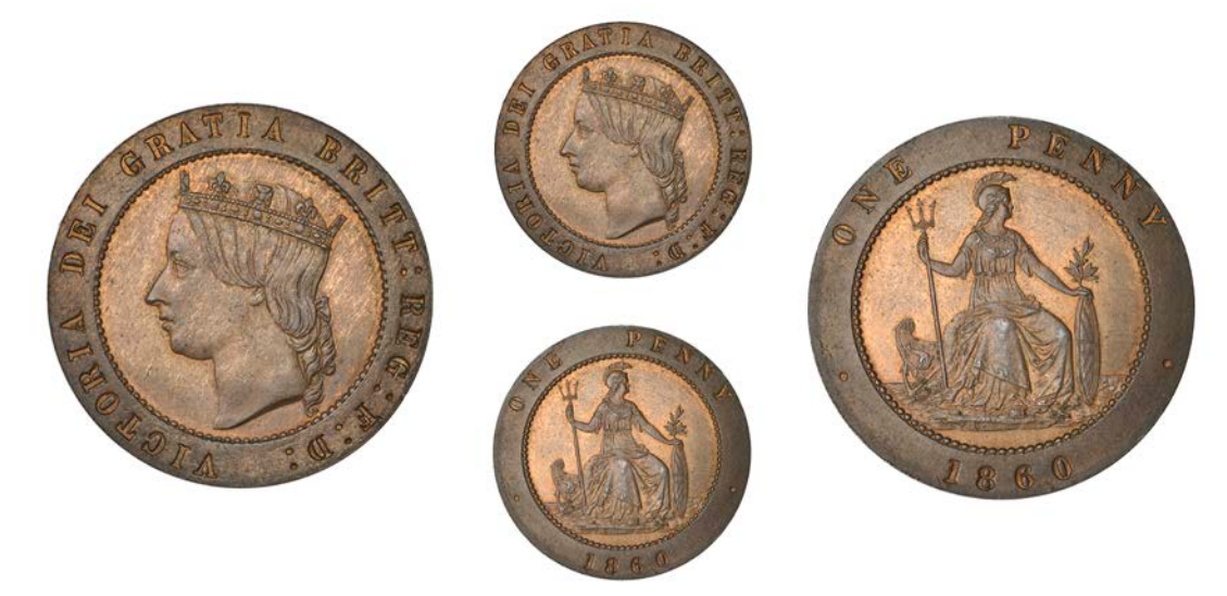
2 166 Pattern Penny, 1860, by J. Moore, in copper, type 5, coronetted bust left, full titles around, rev. Britannia seated to right on rock within inner beaded circle, ONE PENNY above, date below, edge plain, 9.47g/12h (F 863; BMC 2135; Magnay 297). Virtually as struck, considerable original colour and sharp rims, very rare Provenance: London Coins Auction 142 (Bracknell), 1-2 September 2013, lot 2658