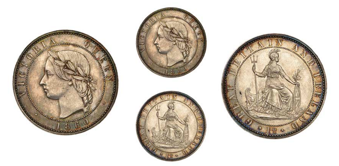
x 149 Pattern Penny, 1860, by J. Moore, type 1, in silver, laureate bust left, rev. Britannia seated to right on rock within inner beaded circle, Great Britain and Ireland around, value expressed as 1<sup>D</sup>, edge plain, 11.83g/12h (F 825; BMC 2099; Magnay 260). Characteristic group of rust spots by olive branch, cabinet friction on face and upper neck, otherwise brilliant and virtually as struck, extremely rare; only two others noted in commerce in the last 30 years [Magnay and Bamford] £1,200-£1,500