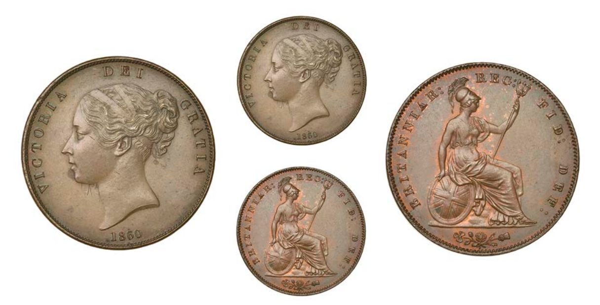
x 148 Penny, 1860/59 (BMC 1521; $ 3948). Usual flaw under Queen's chin, obverse with some spotting otherwise extremely fine, reverse with a little original colour, very rare Provenance: Baldwin Auction 60, 5-6 May 2009, lot 951