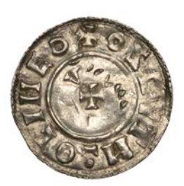
1030 Penny, Last Small Cross type, Lincoln, Asgautr, OSGVT M · O LINCO, late Lincoln C dies, additional v within field on rev., reads ANG, 1.17g/12h (Mossop –; Parsons, BNJ 1916, –; SCBI Copenhagen –; BEH 1827; N 777; S 1154). Cleaned and peckmarked on reverse, otherwise about very fine, very rare with the reverse marking £240-£300