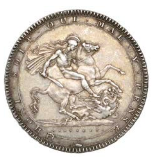
1197 Crown, 1819, edge LIX (ESC 2010; S 3787). Good very fine, toned