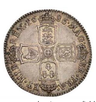
1157 Shilling, 1686 (ESC 765; S 3410). Good very fine and attractively toned, but with some scratches in reverse field £300-£400

x 1158 Shilling, 1686 (ESC 765; S 3410). Fine