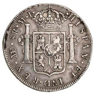
1192 PERU, Charles III, 8 Réales, 1780mi, Lima, obv. countermarked with head of George III in oval, 26.91g (ESC -; S 3765A). Very fine £300-£400