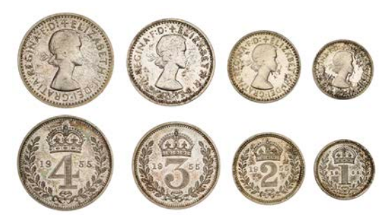
1265 Maundy set, 1955 (ESC 4564; S 4131) [4]. Threepence bright on obverse, otherwise about as struck, light toning; in red case