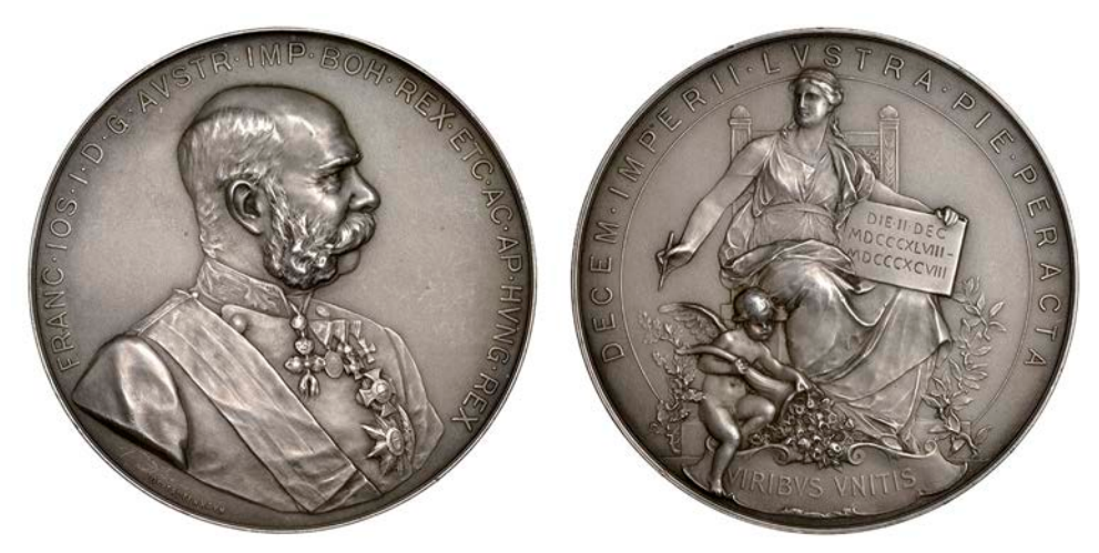
1642 AUSTRIA , Franz Joseph I , Golden Jubilee , 1898, a silver medal by J. Tautenhayn, uniformed bust right, rev . female figure seated facing on throne, cherub at feet holding cornucopia, 60mm (Hauser 939; Wurzb. 2565; BDM VI, 39). About extremely fine £150-£180