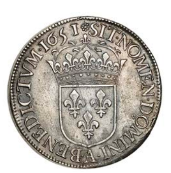
1716 Louis XIV, Écu à la mèche longue, 1651A, Paris (Dup. 1469; Gad. 202; KM. 155.1). Cleaned, some light scratches on reverse, otherwise about extremely fine £100-£120