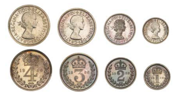
1267 Maundy set, 1958 (ESC 4568; S 4131) [4]. About as struck, some toning; in red case