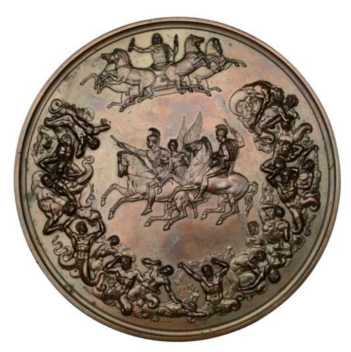
1627 Battle of Waterloo , 1815, an original fine filled bronzed electrotype of the celebrated medal by B. Pistrucci, conjoined laureate busts of George, Prince Regent, Franz I of Austria, Alexander I of Russia and Friedrich Wilhelm III of Prussia within a circle of classical mythological figures, rev. Victory rides with Wellington and Blücher, border with Jupiter casting lightning bolts at battling giants, 133mm (Eimer 57; BHM 870; E 1067). As made; in modern box £1,000-£1,500