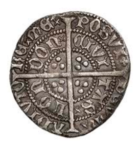
1081 Definitive issues, Halfgroat, class G, mm. pierced cross pattée on obv. , tressure of 11 arcs, quatrefoil after POSVI only, saltires after TAS and DON, 1.70g/9h (DIG 1/5; N 1393; S 1775). About very fine, toned **Provenance: M. Atkin Collection**