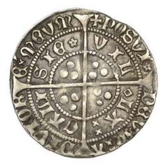
1084 Rosette-Mascle issue, Groat, Calais, mm. crosses II/V, mascles after REX and before LA, 3.76g/1h (Whitton 24a; N 1446; S 1859). Very fine