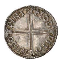
1026 Penny, Long Cross type, Winchester, Godman, GODEMAN MΩO PINT, 1.69g/1h (Winchester Mint 590; same dies as SCBI Copenhagen 1391 and Berlin 457; BEH 4225; N 774; S 1151). Neat and round, good very fine with attractive light toning