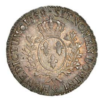
1722 Louis XVI, Écu aux lauriers, 1788q, Perpignan (Dup. 1708; Gad. 356; KM. 564.13). About extremely fine, attractively toned