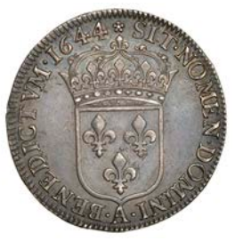
1719 Louis XIV , Half-Écu à la mèche courte, 1644A, Paris (Dup. 1462; Gad. 168; KM. 163.1). Cleaned at one time and now re-toned, otherwise about extremely fine £200-£260