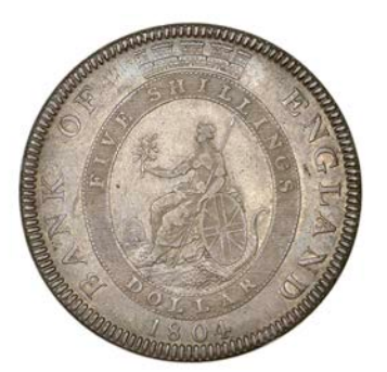
1193 Dollar, 1804, type B/2, : CHK on truncation, κ in relief below shield (ESC 1929; S 3768). Very fine, toned £120-£150