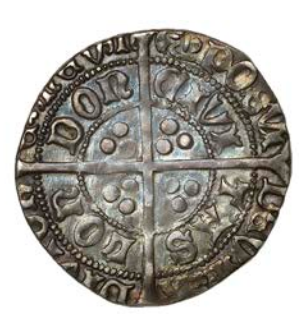
1088 Groat, London, type 2b, mm. boar's head (no.2), nothing below bust, barred A in CIVITAS, 2.88g/9h (Stewartby p.434, Ilb; Winstanley 6; N 1679; S 2156). A little short of flan, otherwise good very fine, iridescent tone £1,500-£1,800