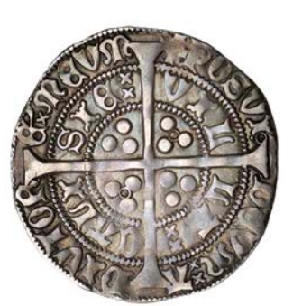
1083 Annulet issue, Groat, Calais, mm. cross II, reads ANGL, no fleur on breast, broken letters, 3.84g/3h (Whitton 9; N 1427; S 1836). Very fine, lightly toned £100-£120