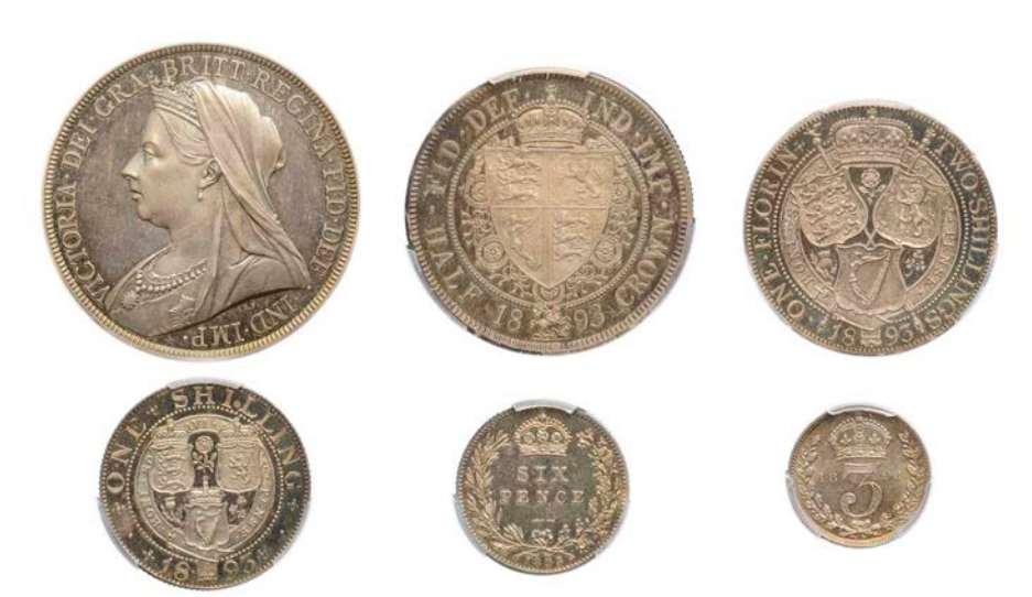
1245 Proof set, 1893, comprising silver Crown to Threepence [6]. Some light hairlines, otherwise about as struck, toned [slabbed PCGS PR 65 CAM, PR 64+ CAM, PR 65+ CAM, PR 65 CAM, PR 65 CAM and PR 65 respectively]; together with official Royal Mint case £3,000-£4,000