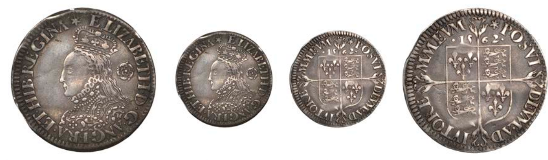
1122 Milled coinage, Sixpence, 1562, mm. star, bust D, 3.06g/12h (Borden/Brown 26, O8/R2; N 2027; S 2596). Lightl crease mark, faint scratches in obverse field and edge irregularity at 8 o'clock, otherwise nearly very fine, toned £200-£260 Provenance: M. Atkin Collection