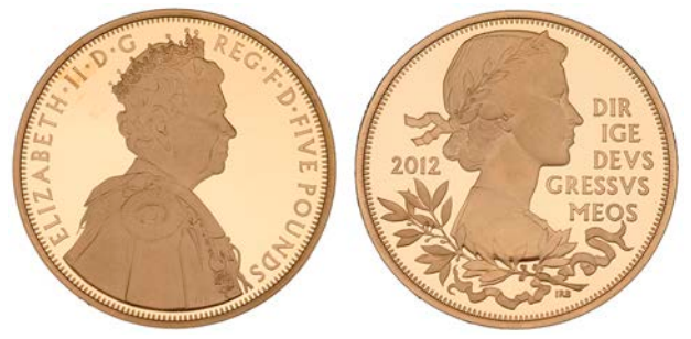
G 1272 Proof Five Pounds, 2012, Diamond Jubilee (S L24). Brilliant, as struck; in case of issue with certificate £1,500-£1,800