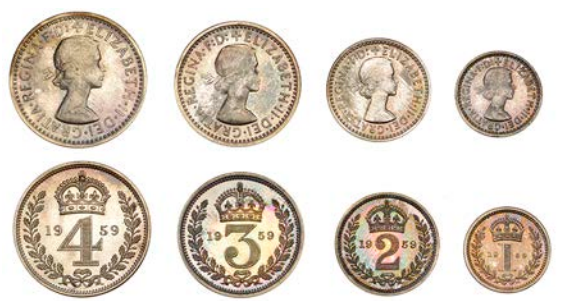
1268 Maundy set, 1959 (ESC 4568; S 4131) [4]. About as struck, streaky toning; in red case