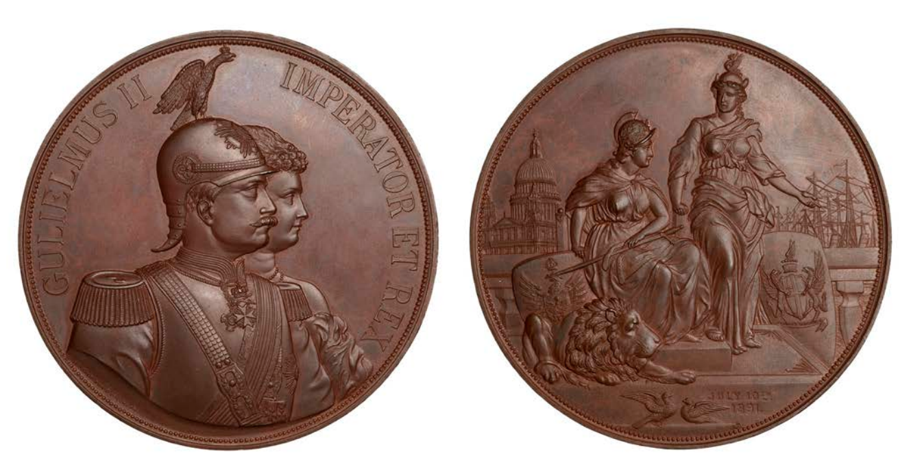
1629 Visit of Kaiser Wilhelm II to the City of London, 1891, a bronze medal by Elkington & Co for the Corporation of the City of London, conjoined busts of Wilhelm and Princess Augusta right, rev. Londinia indicating shipping on the Thames to a figure of Prussia, St Paul's behind, 80mm (W & E 1668.1; BHM 3412; E 1768). Extremely fine; in brown leather gilt-blocked fitted case of issue

1628 Crimean War, the Holy Alliance, 1854, a copper medal by Allen & Moore, 45mm (BHM 2536; E 1489); International Exhibition of all Fine Arts Industries and Inventions, 1874, a bronze award medal by G.T. Morgan, named (Col. The Hon. W.J. Colville, For Services), 52mm (BHM 2992; E 1633); International General Trade Exhibition, London, 1932, an enamelled and gilt breast star, 90 x 55mm [3]. Second very fine and with rim knocks, others extremely fine £60-£80 Col. The Hon. Sir William James Colville, KCVO, CB (1827-1903), Lieutenant of the Yeomen of the Guard, late Rifle Brigade; served in the Crimean War: amateur draughtsman and caricaturist: treasurer to Alfred. Duke of Edinburgh. 1871-94