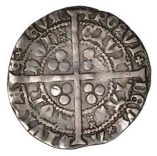
1080 Definitive issues, Groat, class C, mm. pierced cross, mullet on King's left shoulder, 3.52g/12h (N 1387b; S 1765). Good fine, reverse a little better, light grey tone Provenance: M. Atkin Collection