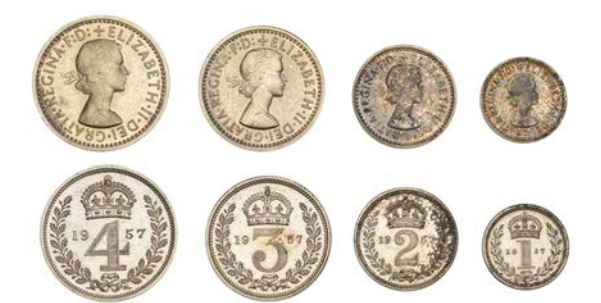
1266 Maundy set, 1957 (ESC 4567; S 4131) [4]. Some surface staining, otherwise about as struck; in red case £100-£120