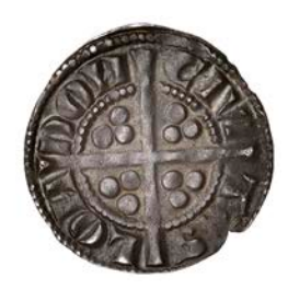
1065 New coinage, Penny, class 2a, London, reversed NS, 1.44g/12h (SCBI North 50; N 1014; S 1385). Trace of cross through face, otherwise very fine, dark-toned Provenance: M. Atkin Collection