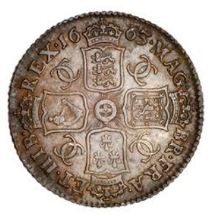
1151 Shilling, 1663, first bust variety (ESC 506; S 3372). Surface marks consistent with having been excavated, otherwise very fine £180-£220