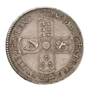
1156 Halfcrown, 1685, edge PRIMO (ESC 748; S 3408). Reverse edge nick at 7 o'clock, otherwise about very fine £300-£400