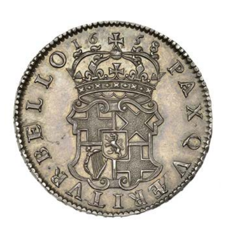
1145 Halfcrown, 1658 (Lessen 126; ESC 252 [447]; S 3227A). Small scrape in reverse legend, otherwise extremely fine, attractively toned [slabbed NGC MS 64] £4,000-£6,000