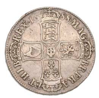
1155 Crown, 1688/7, second bust, edge QVARTO (ESC 747; S 3407). Minor marks on bust, otherwise about very fine £300-£400