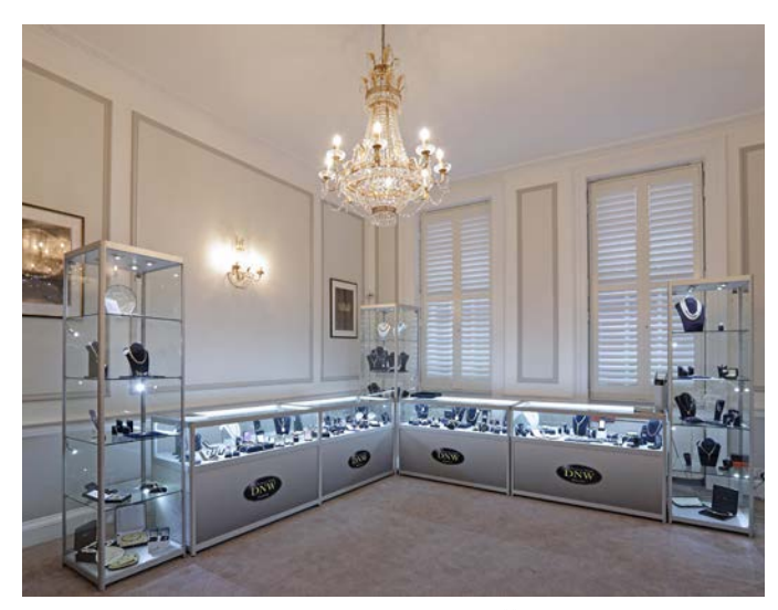
Jewellery viewing room

Our offices, open from 9.30am-5pm, Monday to Friday, include viewing rooms, normally enabling us to offer viewing prior to each auction.