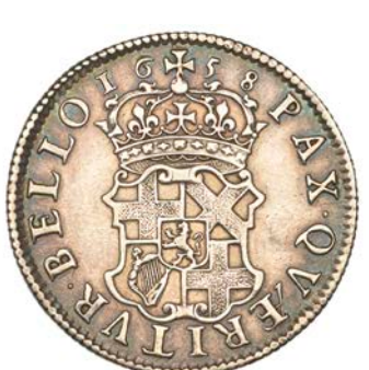
1146 Shilling, 1658 (Lessen J28; ESC 254; S 3228). Lightly wiped, otherwise nearly very fine Provenance : M. Atkin Collection [bt A. Bryant]