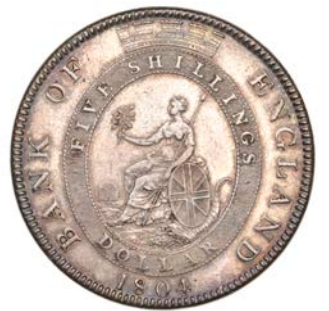
1194 Dollar, 1804, types C/2, leaf to centre of E in DEI (ESC 1931; S 3768). About very fine