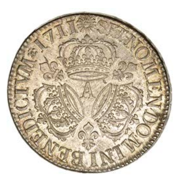
1718 Louis XIV , Écu aux trois couronnes, 1711A, Paris (Dup. 1568; Gad. 229; KM. 386.1). Minor adjustment marks, otherwise extremely fine with mint bloom £400-£500