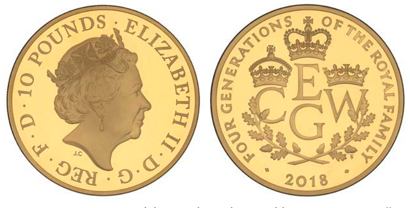
G 1271 Proof Ten Pounds, 2018, Four Generations of the Royal Family, in gold, 156.30g (S –). Brilliant, as struck and rare; in Royal Mint case of issue with certificates [no.14 of 100] £6,000-£8,000