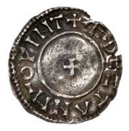
1024 Penny, Reform type, Winchester, Æthelstan, ÆDESTAN M<sup>-</sup>O PINT, 1.28g/3h (Winchester Mint -; BMC -; N 763; S 1142). Some minor porosity and edge slightly ragged at 6 o'clock, otherwise about very fine with the portrait clear and legends fully legible, extremely rare ### Provenance: M. Atkin Collection