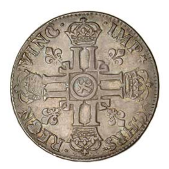
1717 Louis XIV , Écu aux huit L, first type, 1691&, Aix-en-Provence, réformation (Dup. 1514A; Gad. 216; KM. 275.20). Very fine and toned, rare