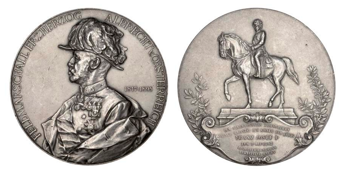
1643 AUSTRIA , Archduke Albrecht Memorial , 1898, a silver medal by A. Scharff, uniformed bust left, rev . statue on pedestal, legend in cartouche below, 70mm (Hauser 2516; Wurzb. 87; BDM V, 373). Good very fine £200-£260