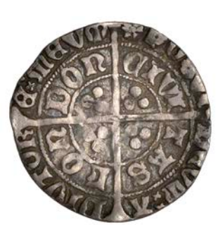
1089 Groat, London, type 3, mm. halved sun and rose (no.2), nothing below bust, 2.72g/8h (Winstanley 12; N 1679; S 2157). Clipped, good fine £300-£360 Provenance: M. Atkin Collection