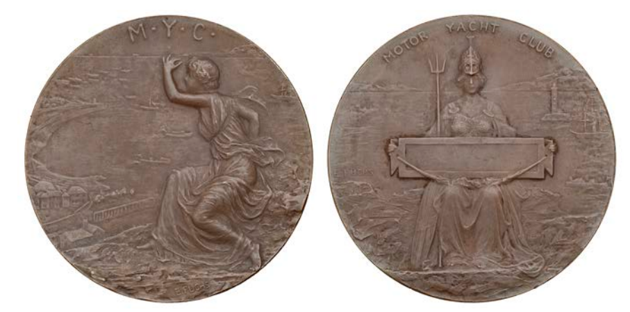
1630 Motor Yacht Club , 1905, a bronze award medal by E. Fuchs, draped figure seated left, overlooking harbour scene, rev. Britannia seated front, holding tablet, un-named, 55mm (IECM 22; Works of Emil Fuchs, p.104). Extremely fine; in original fitted case