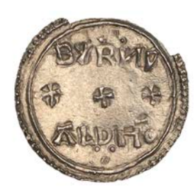
1022 Penny, Two Line type [HT 1], Beornweald, BYRNPALD MO in two lines divided by three crosses pattée, trefoil of pellets above and below, 1.32g/6h (CTCE 26; SCBI BM 297; N 688; S 1105). Some edge loss, otherwise very fine £300-£360 Provenance: M. Atkin Collection