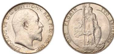
395 Florin, 1903 (ESC 3579; S 3981). Minor bagmarks, otherwise about mint state