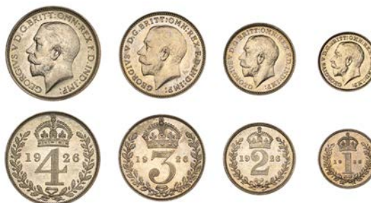
477 Maundy set, 1926 (ESC 3986; S 4027) [4]. About as struck