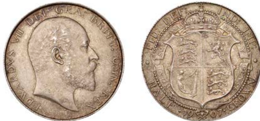
326 Halfcrown, 1907 (ESC 3573; S 3980). About extremely fine, toned £120-£150