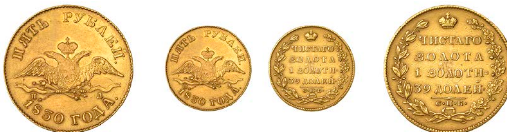
G 1260 Nicholas I , 5 Roubles, 1830 HD , St Petersburg, 6.47g/12h (Bit. 5; KM. C174; F 154). Mount removed from centre of reverse, some minor marks, lightly cleaned, otherwise very fine £500-£700