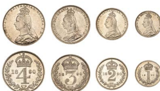
373 Maundy set, 1890 (ESC 3548; S 3943) [4]. Of bright appearance, good extremely fine