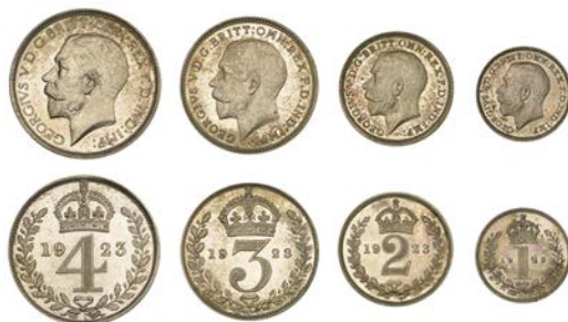
474 Maundy set, 1923 (ESC 3983; S 4027) [4]. About as struck