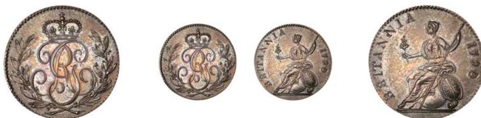
562 Pattern Sixpence, 1790, by J.-P. Droz, in silver, crowned cypher within wreath, rev. Britannia seated left, edge grained, 2.68g/12h (ESC 2221; Selig –). Extremely fine and toned