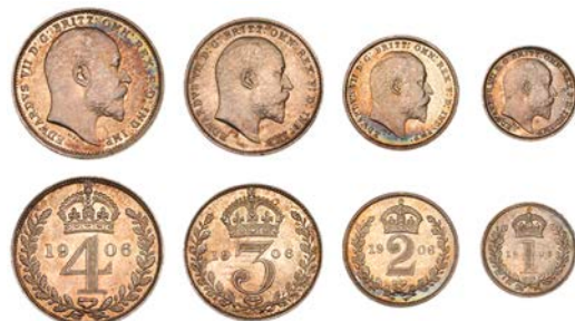
418 Maundy set, 1906 (ESC 3612; S 3985) [4]. Good extremely fine, toned