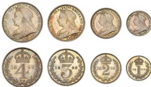
379 Maundy set, 1899 (ESC 3557; S 3943) [4]. About as struck, toned