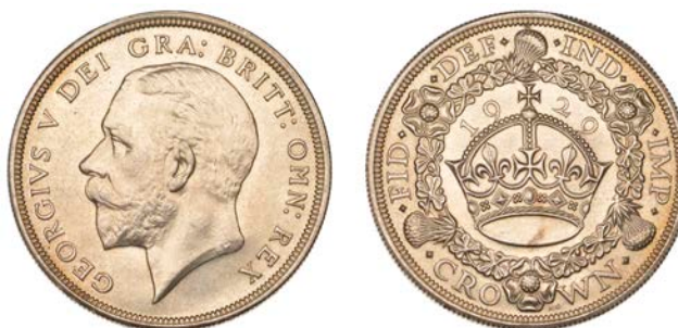
428 Crown, 1929 (ESC 3636; S 4036). A few small surface marks, otherwise good extremely fine