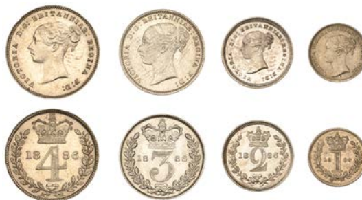
370 Maundy set, 1886 (ESC 3543; S 3916) [4]. Lightly cleaned at some time, otherwise extremely fine