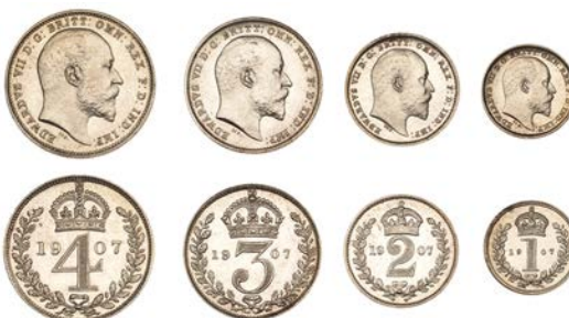
419 Maundy set, 1907 (ESC 3613; S 3985) [4]. Of bright appearance, good extremely fine