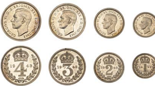
504 Maundy set, 1943 (ESC 4312; S 4086) [4]. Brilliant, about as struck, rare