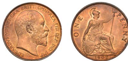
423 Penny, 1902, low horizon (F 156; BMC 2205; S 3990A). Good extremely fine, full original colour