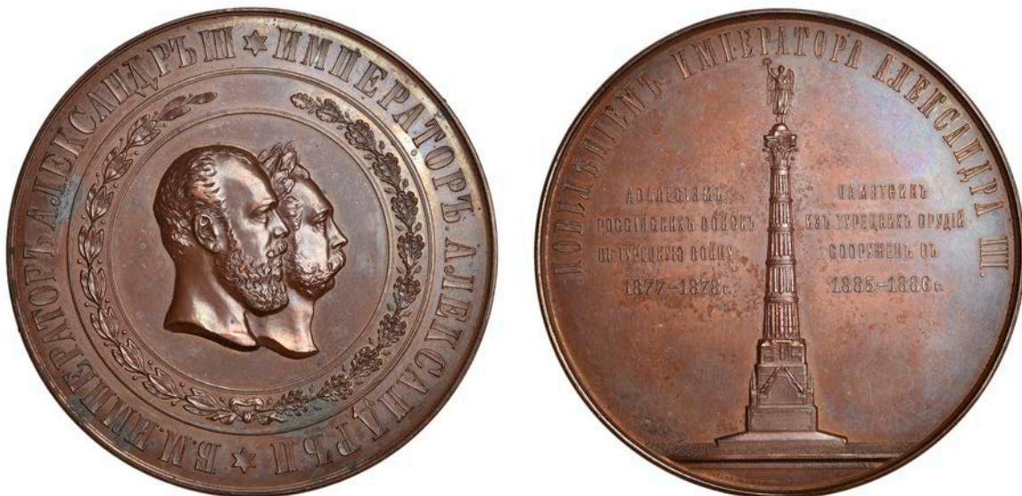
1424 RUSSIA, Inauguration of the Monument cast from Turkish Cannon, St Petersburg , 1886, a bronze medal by A. Griliches Jr and Sr, conjoined heads of Alexander II and Alexander III right within oak and laurel wreath and legend, rev. view of monument, 72mm (Diakov 974.1; Smirnov 921). About extremely fine with chocolate brown toning on obverse, very rare £150-£200 The monument was cast from Turkish cannon captured during the Russo-Turkish War of 1877-8