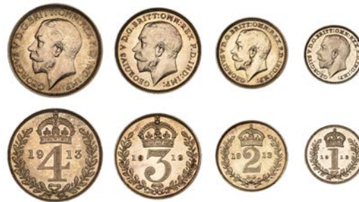
464 Maundy set, 1913 (ESC 3973; S 4016) [4]. About as struck, toned