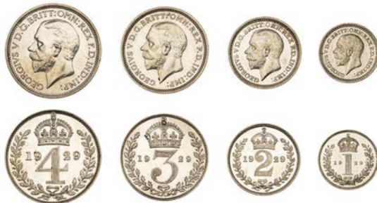
480 Maundy set, 1929 (ESC 3989; S 4043) [4]. Has been lightly cleaned at some time, otherwise extremely fine