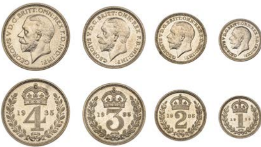
486 Maundy set, 1935 (ESC 3996; S 4043) [4]. About as struck, scarce