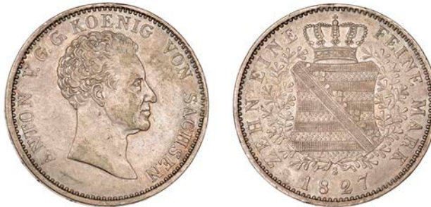
1096 SAXONY, Anton , Thaler, 1827 s (Dav. 865; KM. 1112). Lightly cleaned and with some minor marks and scratches, otherwise good very fine £100-£120