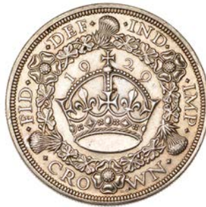
647 Crown, 1929 (ESC 3636; S 4036). About extremely fine