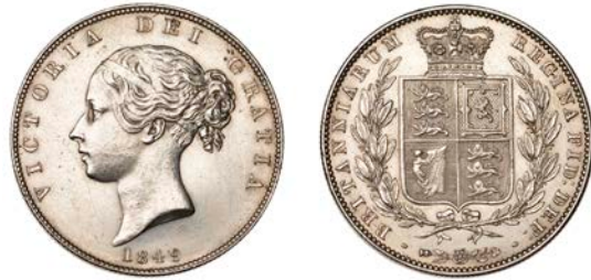
210 Halfcrown, 1849, large date (ESC 2730; S 3888). Cleaned, otherwise extremely fine £400-£500