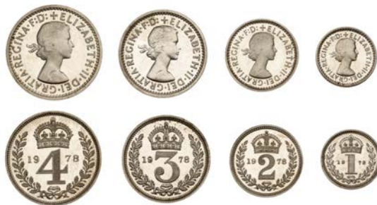
532 Maundy set, 1978 (S 4211) [4]. About as struck, proof-like