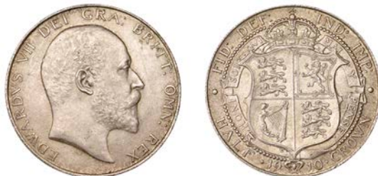
329 Halfcrown, 1910 (ESC 3576; S 3980). Extremely fine £200-£260