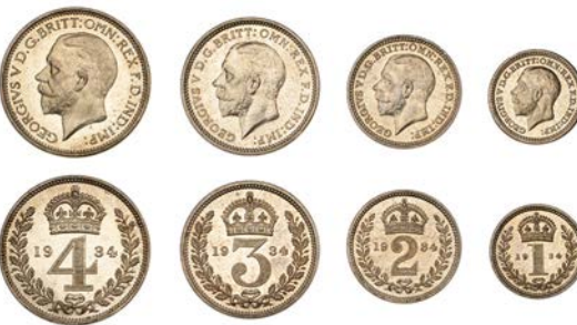
485 Maundy set, 1934 (ESC 3995; S 4043) [4]. About as struck