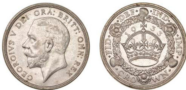
651 Crown, 1933 (ESC 3644 [373]; S 4036). Sometime cleaned, otherwise about extremely fine