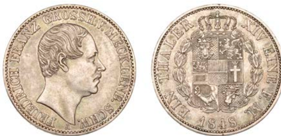
1073 MECKLENBURG-SCHWERIN, Friedrich Franz II , Thaler, 1848A (Dav. 727; KM. 304). Good very fine