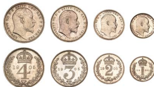
417 Maundy set, 1905 (ESC 3611; S 3985) [4]. Good extremely fine, toned