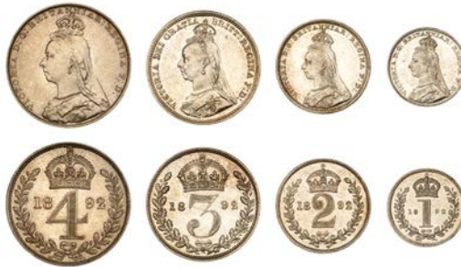
375 Maundy set, 1892 (ESC 3550; S 3932) [4]. Of bright appearance, good extremely fine