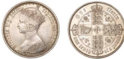
237 Florin, 1869, die 3 (ESC 2867; S 3893). A few minor marks, otherwise extremely fine