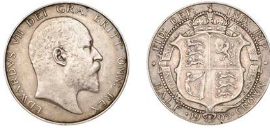
324 Halfcrown, 1905 (ESC 3571; S 3980). Cleaned and with some minor marks, otherwise about very fine, rare £500-£700