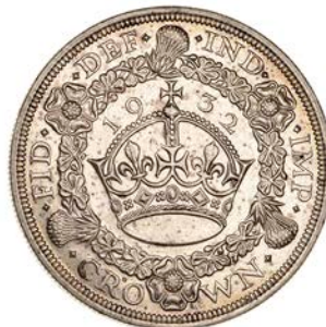
650 Crown, 1932 (ESC 3641; S 4036). Has been lightly cleaned in the past, otherwise about extremely fine