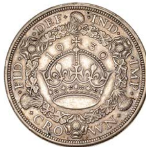
648 Crown, 1930 (ESC 3638; S 4036). A few surface marks, otherwise good very fine