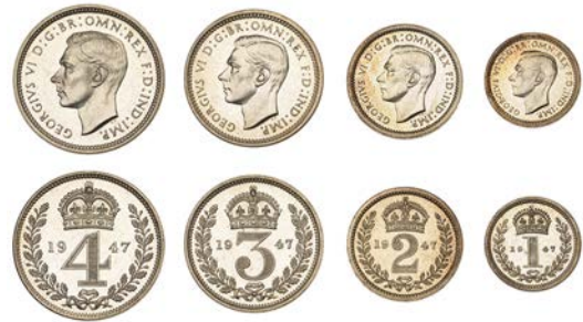
508 Maundy set, 1947 (ESC 4316; S 4091) [4]. Brilliant, about as struck, rare