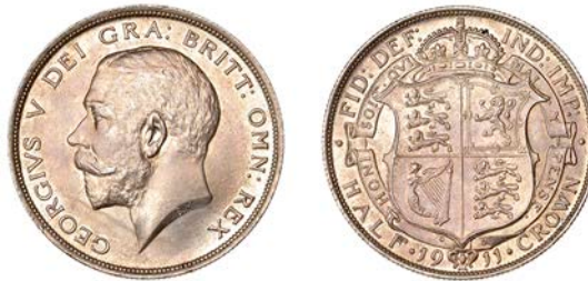
341 Halfcrown, 1911 (ESC 3709; S 4011). Good extremely fine