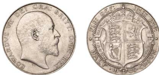
391 Halfcrown, 1908 (ESC 3574; S 3980). Surface marks, otherwise extremely fine £300-£400