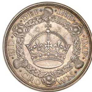
649 Crown, 1931 (ESC 3639; S 4036). About extremely fine, toned