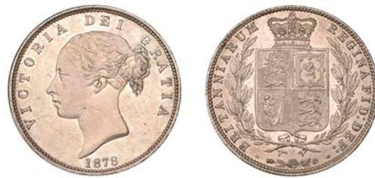
216 Halfcrown, 1878 (ESC 2751; S 3889). Cleaned, otherwise extremely fine £120-£150