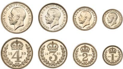
484 Maundy set, 1933 (ESC 3994; S 4043) [4]. About as struck