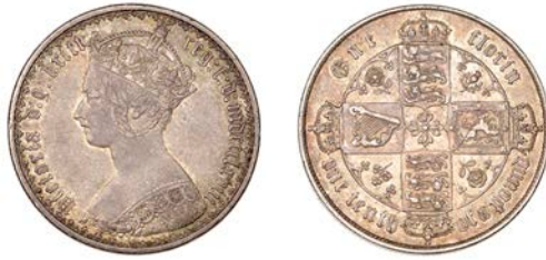
236 Florin, 1868, die 29 (ESC 2866; S 3893). Good very fine, toned