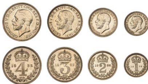
483 Maundy set, 1932 (ESC 3993; S 4043) [4]. About as struck