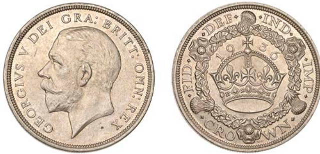
340 Crown, 1936 (ESC 3649; S 4036). About extremely fine