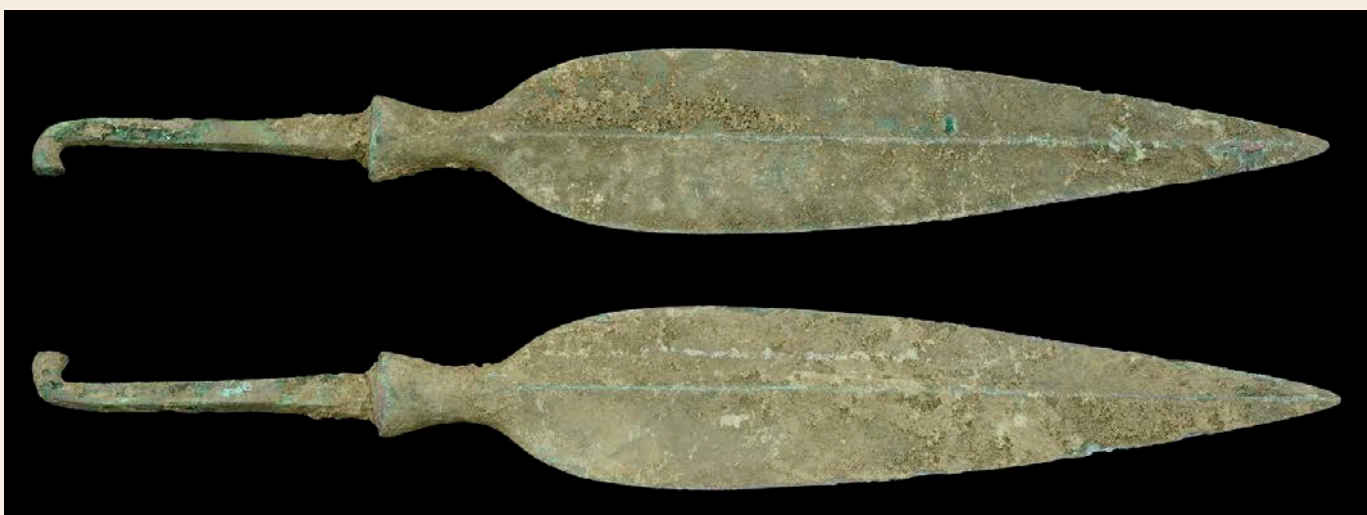
1532 Bronze Age , Luristan, Spear Head, 1000-800 BC, 30cm long by 44cm wide, leaf-shaped with raised central rib and extended tang. Very fine, with a light earthy deposit overlaying a green patina £120-£150