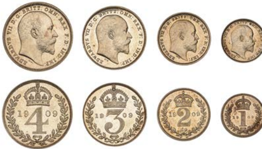
421 Maundy set, 1909 (ESC 3615; S 3985) [4]. Good extremely fine and toned, scarce