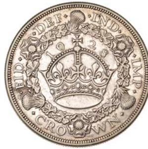
646 Crown, 1928 (ESC 3633; S 4036). Very fine