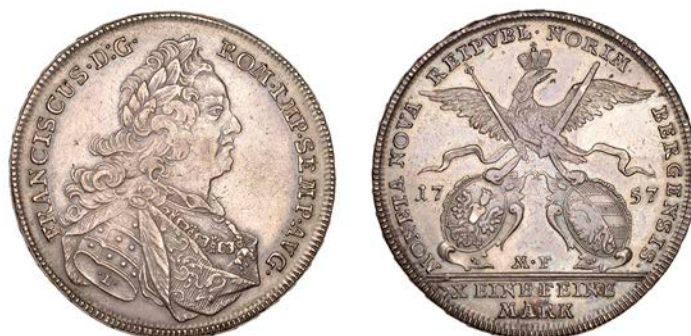
1075 NUREMBERG, Free City , Thaler, 1757MF (Dav. 2485; KM. 321). Cleaned at one time and now re-toned, otherwise good very fine