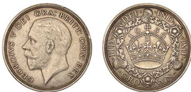
653 Crown, 1936 (ESC 3649; S 4036). Edge nick at 3 o'clock, otherwise better than very fine, toned