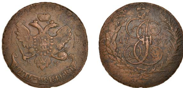
1255 Paul I , 5 Kopecks, 1793 EM , overstruck, large mintmark, 44.06g/12h (Bit. 101; Brekke 10). Very fine, scarce £100-£120