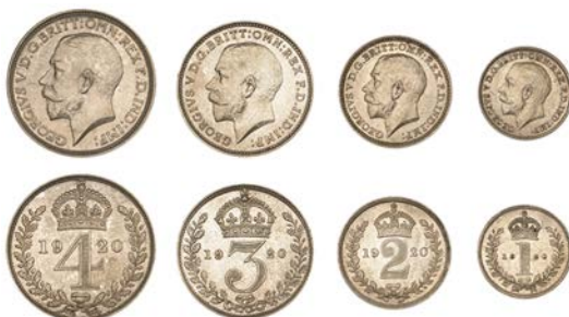
471 Maundy set, 1920 (ESC 3980; S 4016) [4]. About as struck