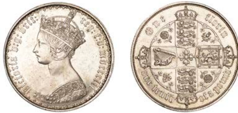
229 Florin, 1852, second i of date over stop (ESC 2822; S 3891). Brightly cleaned, otherwise extremely fine, rare £200-£260