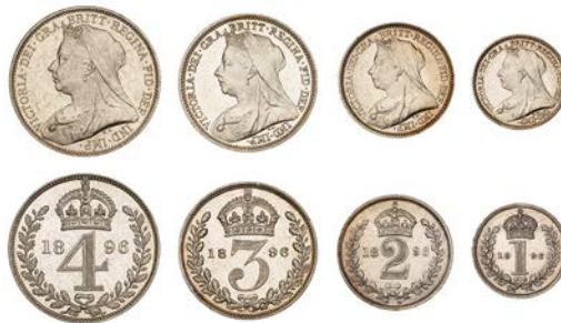
377 Maundy set, 1896 (ESC 3554; S 3943) [4]. Of bright appearance, good extremely fine