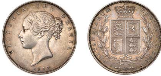
209 Halfcrown, 1844 (ESC 2720; S 3888). Cleaned at one time and now re-toned, otherwise good very fine £120-£150