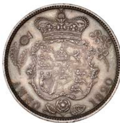
580 Halfcrown, 1820 (ESC 2357; S 3807). About extremely fine, dark-toned Provenance: Bt Seaby 1963