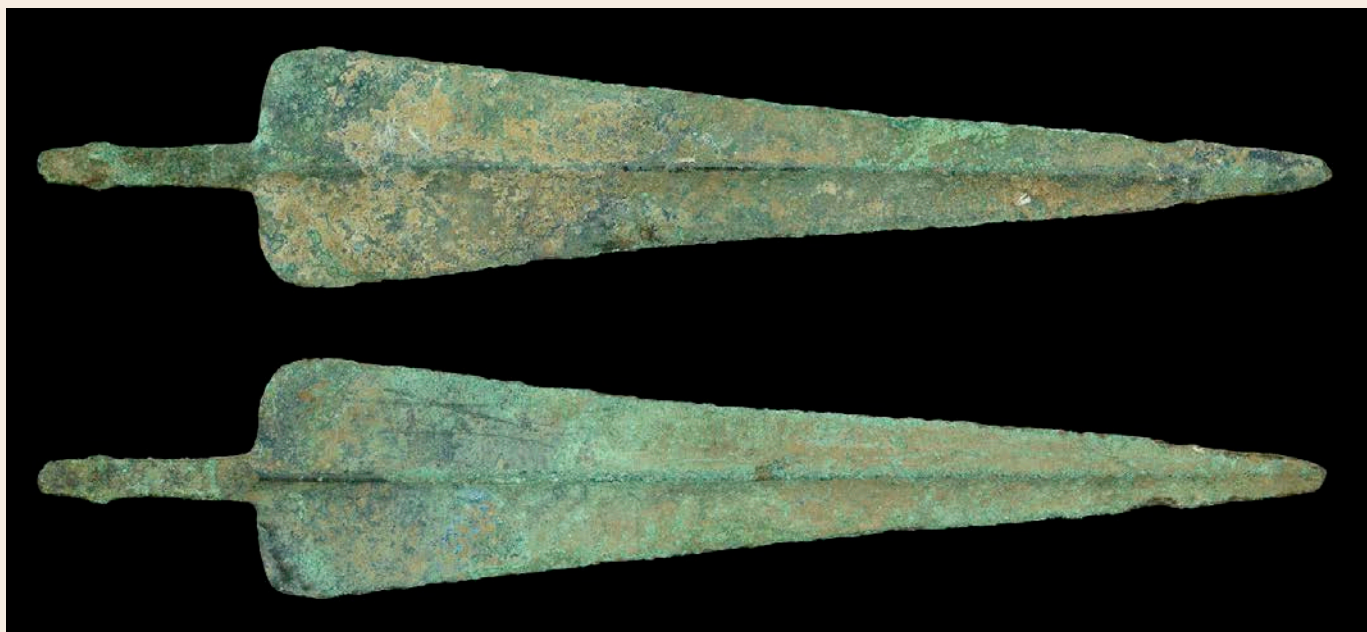
1531 Bronze Age , Luristan, a tanged Dagger/Spearhead, 1000-800 BC, 27.6 cm long by 5.2 cm wide, leaf-shaped blade with central midrib and short tang/handle. Light earthy deposit over a green brown patina £120-£150