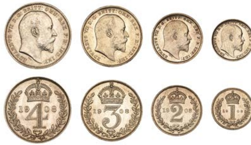
420 Maundy set, 1908 (ESC 3614; S 3985) [4]. Good extremely fine, toned