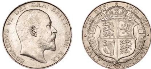
325 Halfcrown, 1906 (ESC 3572; S 3980). Some contact marks, otherwise extremely fine £150-£180