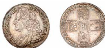
550 Sixpence, 1757 (ESC 1762; S 3711). About extremely fine, attractively toned