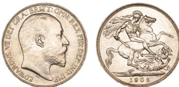
386 Crown, 1902, edge II (ESC 3560; S 3978). Good extremely fine