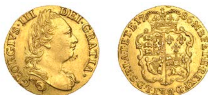
553 Guinea, 1786, fourth bust (EGC 706; S 3728). Lightly wiped, flan flaw by chin, otherwise very fine