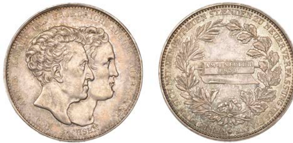
1097 SAXONY, Anton , Thaler, 1831 s (Dav. 869; KM. 1133). Lightly cleaned, otherwise about extremely fine £100-£120