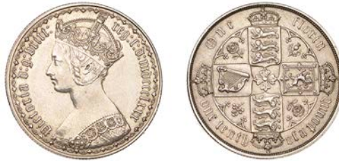
245 Florin, 1880 (ESC 2900; S 3900). Brightly cleaned, otherwise about extremely fine