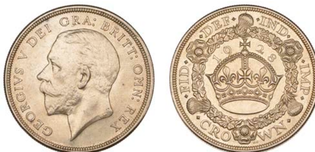
427 Crown, 1928 (ESC 3633; S 4036). A few small surface marks, otherwise good extremely fine