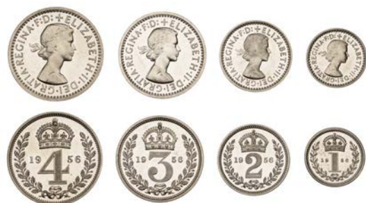
525 Maundy set, 1956 (ESC 4566; S 4131) [4]. About as struck, proof-like