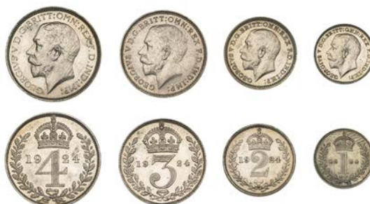
475 Maundy set, 1924 (ESC 3984; S 4027) [4]. About as struck