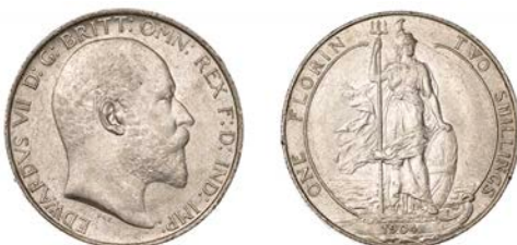
396 Florin, 1904 (ESC 3580; S 3981). Light surface marks, otherwise extremely fine