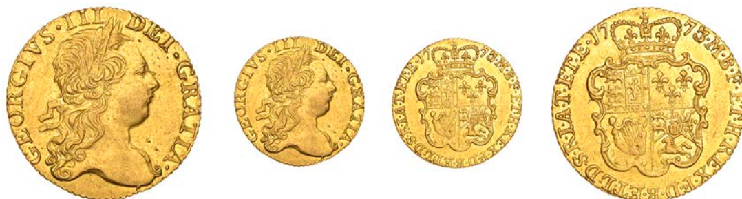
552 Guinea 1773, third bust (EGC 684; S 3727). Light surface marks and hairlines consistent with having been excavated, otherwise better than very fine