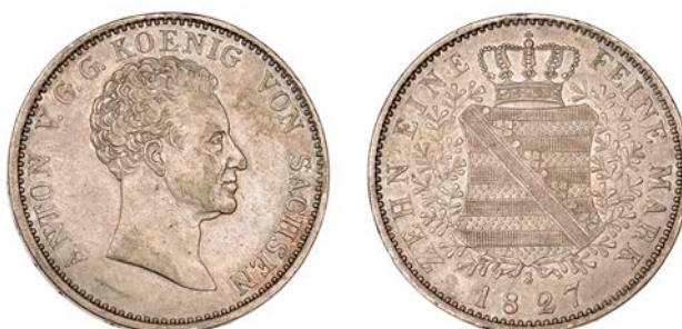
1096 SAXONY, Anton , Thaler, 1827 s (Dav. 865; KM. 1112). Lightly cleaned and with some minor marks and scratches, otherwise good very fine £100-£120