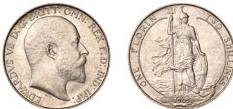
397 Florin, 1905 (ESC 3581; S 3981). Sometime lightly cleaned, otherwise extremely fine or better, rare