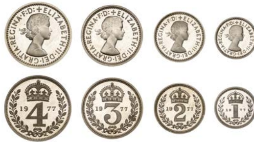
531 Maundy set, 1977 (S 4211) [4]. About as struck, proof-like