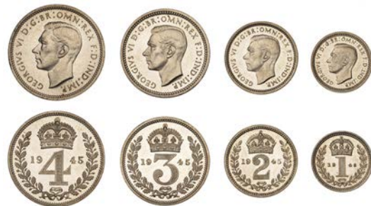
506 Maundy set, 1945 (ESC 4314; S 4086) [4]. Brilliant, about as struck, rare