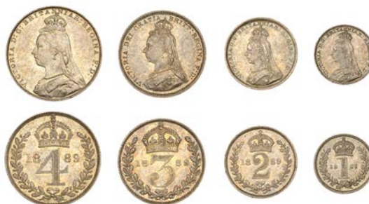
372 Maundy set, 1889 (ESC 3547; S 3932) [4]. About as struck, toned