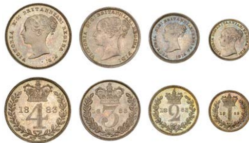
369 Maundy set, 1883 (ESC 3540; S 3916) [4]. About as struck, toned