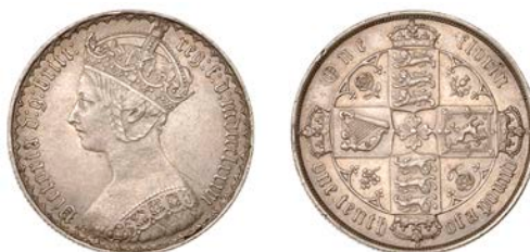
250 Florin, 1886 (ESC 2911; S 3900). Cleaned, otherwise about extremely fine