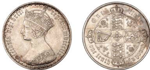
232 Florin, 1859 (ESC 2843; S 3891). About extremely fine