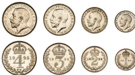
476 Maundy set, 1925 (ESC 3985; S 4027) [4]. About as struck