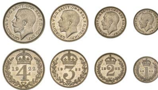
473 Maundy set, 1922 (ESC 3982; S 4027) [4]. About as struck