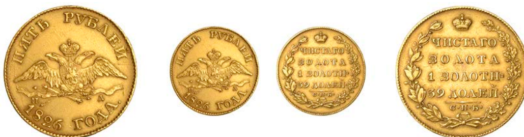
G 1259 Nicholas I , 5 Roubles, 1826 HD , St Petersburg, 6.57g/12h (Bit. 1; KM. C174; F 154). Mount removed from centre of reverse, lightly cleaned, otherwise good very fine, scarce £700-£900