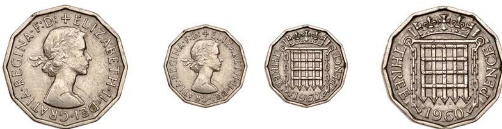
655 Threepence, 1960, struck in nickel , 6.71g/12h (cf. S 4153). Good very fine, very rare