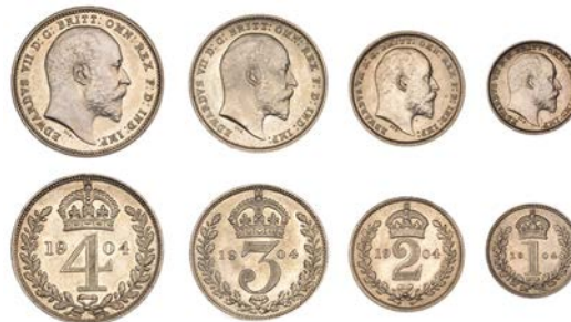
416 Maundy set, 1904 (ESC 3610; S 3985) [4]. Good extremely fine, toned