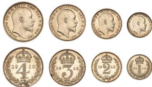
422 Maundy set, 1910 (ESC 3616; S 3985) [4]. Good extremely fine and toned, scarce