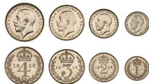
467 Maundy set, 1916 (ESC 3976; S 4016) [4]. Has been lightly cleaned at some time, otherwise extremely fine