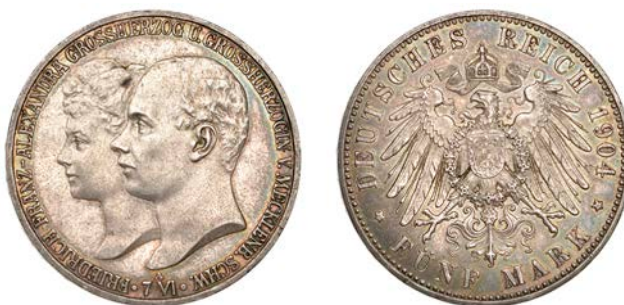
1074 MECKLENBURG-SCHWERIN, Friedrich Franz IV , 5 Marks, 1904A (Dav. 730; KM. 334). Cleaned at one time and now re-toned, otherwise about extremely fine