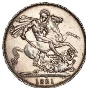
579 Crown, 1821, edge SECUNDO (ESC 2310; S 3805). Polished, otherwise about extremely fine