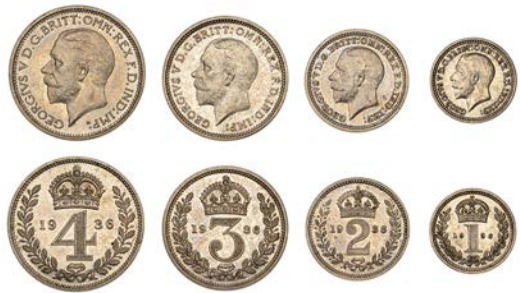
487 Maundy set, 1936 (ESC 3997; S 4043) [4]. About as struck, scarce