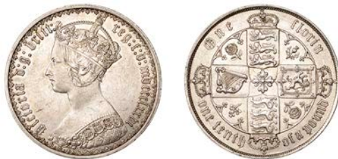
242 Florin, 1876, die 23 (ESC 2884; S 3893). Lightly cleaned, otherwise about extremely fine