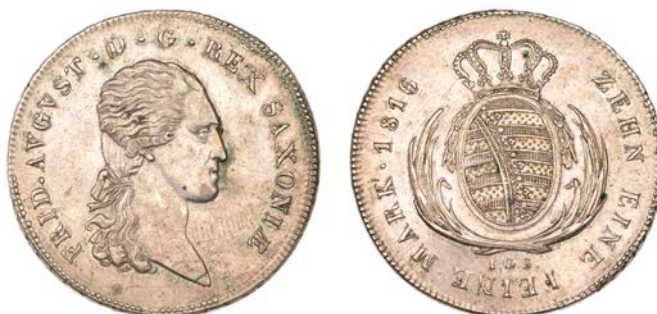
1095 SAXONY, Friedrich August I , Thaler, 1816 IGS (Dav. 854; KM. 1059.1). Overstruck with traces of undertype visible, lightly cleaned, otherwise good very fine £100-£120