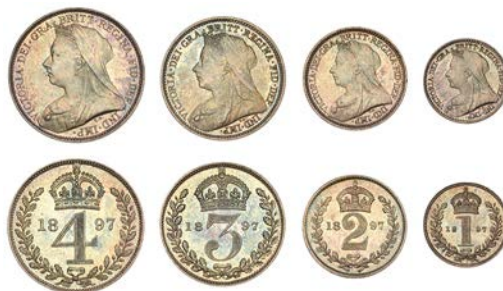
378 Maundy set, 1897 (ESC 3555; S 3943) [4]. About as struck, toned