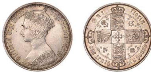
240 Florin, 1874, die 37 (ESC 2881; S 3893). Flan flaw or attempted piercing on Queen's forehead and has been cleaned, otherwise extremely fine