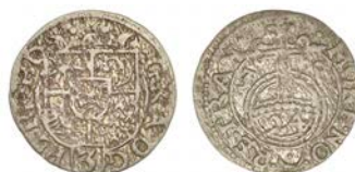
1321 Georg Rakoczi I , 3 Polker, [16]38, 1.06g/1h (Resch 27 var.; KM. 231). Very fine, rare