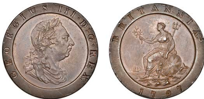
563 Twopence, 1797 (BMC 1077; S 3776). Extremely fine with traces of original colour