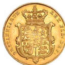
G 578 Sovereign, 1830 (M 15; S 3801). Good very fine