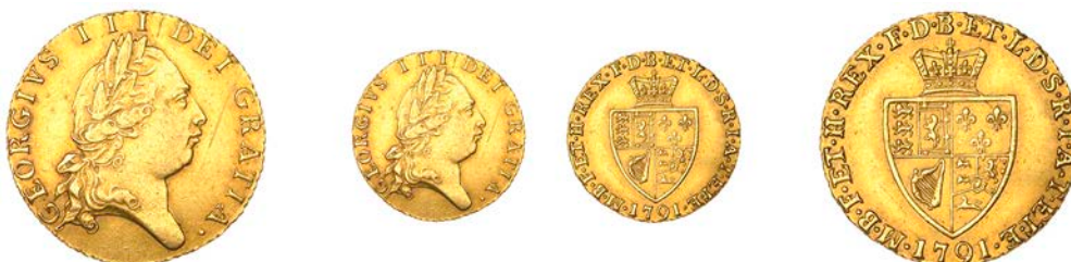
557 Half-Guinea, 1791, fifth bust (EGC 834; S 3735). Wiped and with a small scratch in obverse field, otherwise very fine