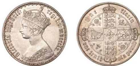
233 Florin, 1860 (ESC 2845; S 3891). Cleaned, otherwise about extremely fine