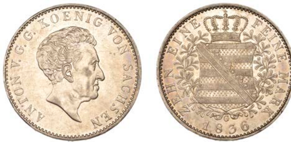
1098 SAXONY, Anton , Thaler, 1836 G (Dav. 867). Minor hairlines, otherwise good extremely fine £200-£260