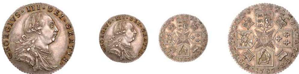
560 Sixpence, 1787, no hearts, first l of iii over D (ESC 2187 var.; S 3748). Extremely fine and toned, extremely rare; the overstamp apparently first noted in 2018