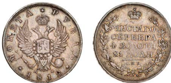
1256 Alexander I , Rouble, 1812 MΦ , St Petersburg (Bit. 103; KM. C130). Minor flan flaws on obverse, otherwise very fine and toned £100-£120