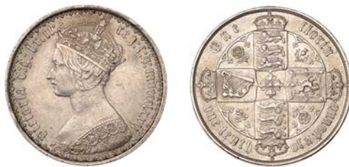
238 Florin, 1872, die 105 (ESC 2878; S 3893). Lightly cleaned and with some contact marks, otherwise about extremely fine