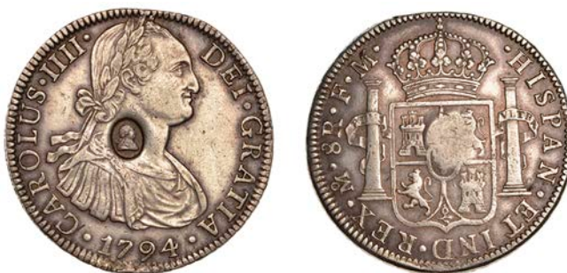
566 MEXICO, Charles IIII, 8 Réales, 1794 FM , Mexico City, obv. countermarked with head of George III in oval, 26.93g (ESC 1852; S 3765A). Host about very fine, countermark better, but lightly wiped on obverse