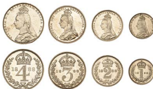
371 Maundy set, 1888 (ESC 3545; S 3932) [4]. Lightly cleaned at some time, otherwise extremely fine or better