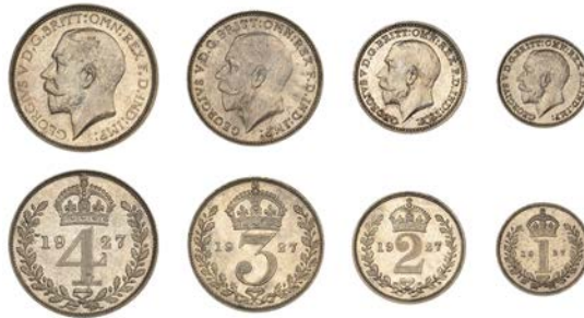
478 Maundy set, 1927 (ESC 3987; S 4027) [4]. About as struck