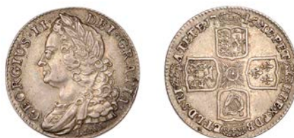
549 Shilling, 1745 LIMA (ESC 1724; S 3703). Small edge bruise, otherwise good very fine, toned