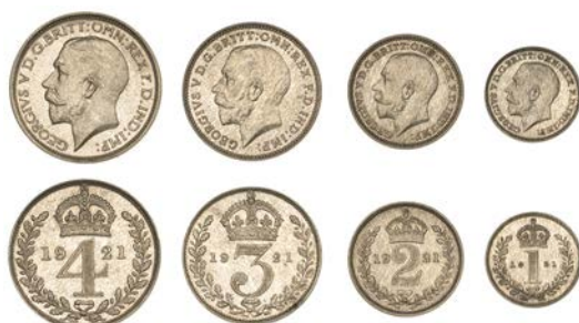
472 Maundy set, 1921 (ESC 3981; S 4027) [4]. About as struck