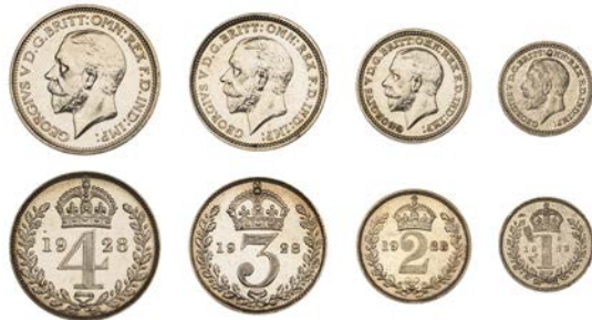
479 Maundy set, 1928 (ESC 3988; S 4043) [4]. Has been lightly cleaned at some time, otherwise extremely fine