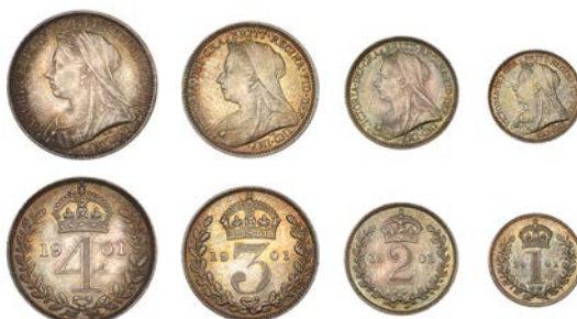
381 Maundy set, 1901 (ESC 3559; S 3943) [4]. About as struck, toned