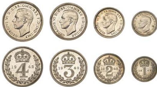
503 Maundy set, 1942 (ESC 4311; S 4086) [4]. Brilliant, about as struck, rare