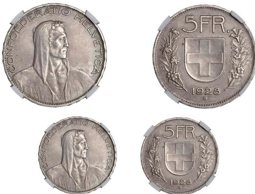
1319 Confederation , 5 Francs, 1928 B (HMZ 1199g; KM. 38). About extremely fine, very rare [slabbed NGC AU 58]