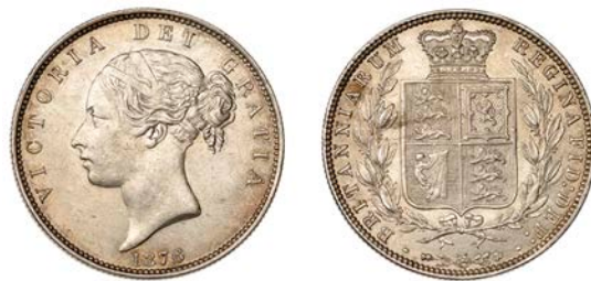
214 Halfcrown, 1876 (ESC 2748; S 3889). Cleaned, otherwise about extremely fine £100-£120