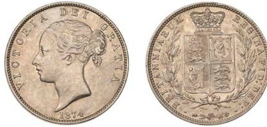
212 Halfcrown, 1874 (ESC 2741; S 3889). Lightly cleaned, otherwise good very fine £100-£120