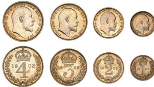
415 Maundy set, 1903 (ESC 3609; S 3985) [4]. Good extremely fine, toned