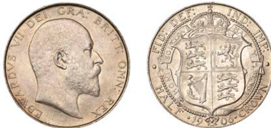
389 Halfcrown, 1906 (ESC 3572; S 3980). Surface marks, otherwise extremely fine or better, toned £200-£300