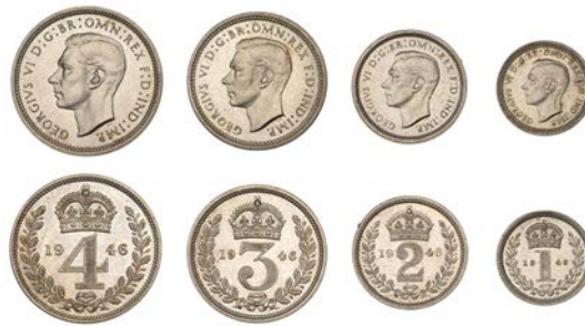
507 Maundy set, 1946 (ESC 4315; S 4086) [4]. About as struck, rare