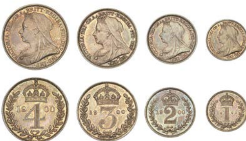
380 Maundy set, 1900 (ESC 3558; S 3943) [4]. About as struck, toned