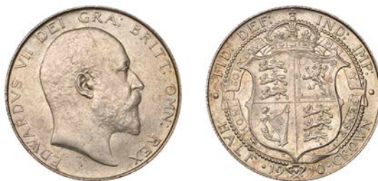
393 Halfcrown, 1910 (ESC 3576; S 3980). About as struck