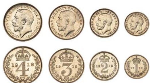
470 Maundy set, 1919 (ESC 3979; S 4016) [4]. Has been lightly cleaned at some time, otherwise extremely fine £120-£150