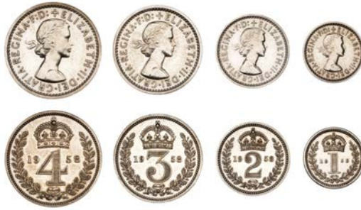
526 Maundy set, 1958 (ESC 4568; S 4131) [4]. About as struck