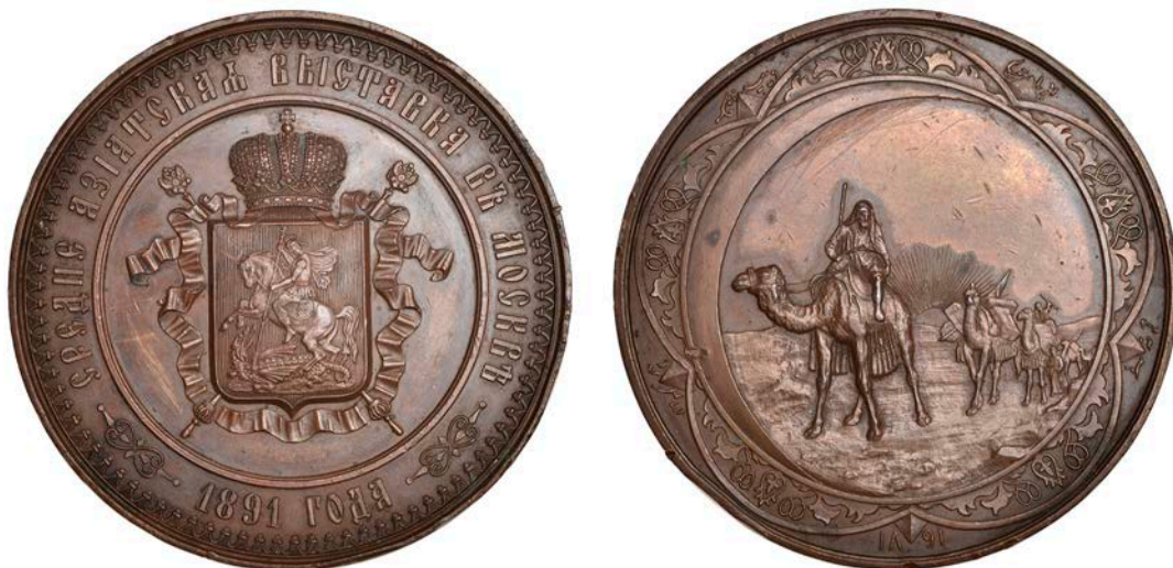
1425 RUSSIA, Central Asian Exhibition, Moscow , 1891, a bronze medal by A. Griliches Jr and Sr, crowned arms of Moscow, rev. caravan moving left through desert landscape, sunset in background, all within ornate border, 67mm (Diakov 1061.1; Smirnov 997). A few edge knocks, obverse extremely fine, reverse nearly so but scratched in upper field, very rare £200-£300