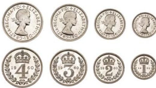
527 Maundy set, 1960 (ESC 4570; S 4131) [4]. About as struck, proof-like