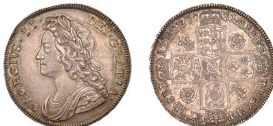
548 Halfcrown, 1731, roses and plumes, edge QVINTO, Q sideways (ESC 1674; S 3692). About extremely fine, attractively toned