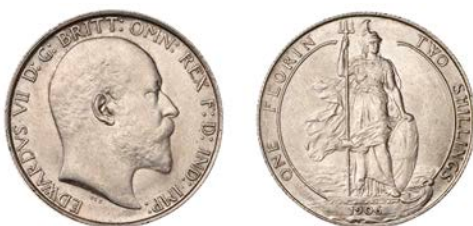
398 Florin, 1906 (ESC 3582; S 3981). Light surface marks and of bright appearance, otherwise extremely fine or better