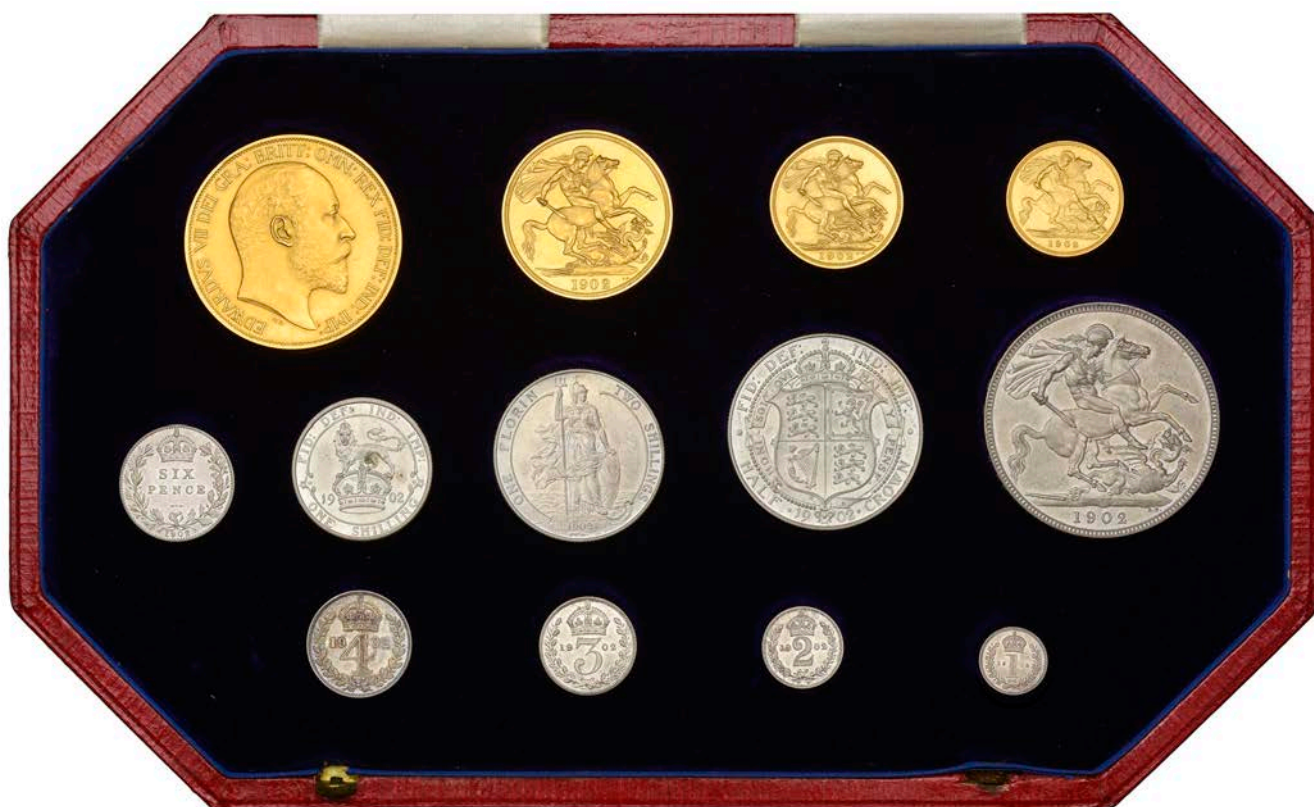
426 Proof set, 1902, comprising gold Five Pounds, Two Pounds, Sovereign and Half-Sovereign, silver Crown to Maundy Penny [13]. Matt, practically as struck, but the gold lightly hairlined; in official case of issue £5,000-£6,000