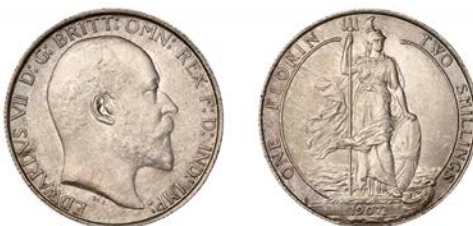
399 Florin, 1907 (ESC 3583; S 3981). Light surface marks, otherwise good extremely fine, toned