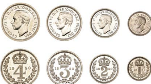
511 Maundy set, 1950 (ESC 4319; S 4096) [4]. Brilliant, about as struck, rare