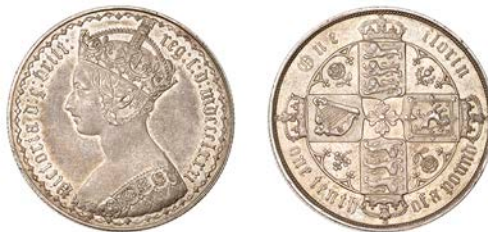
246 Florin, 1881 (ESC 2902; S 3900). About extremely fine