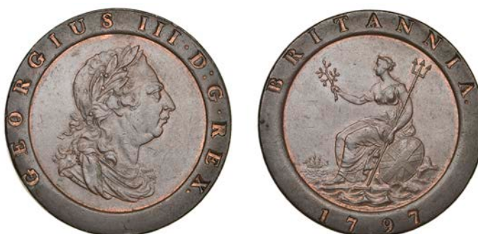
564 Twopence, 1797 (BMC 1077; S 3776). About extremely fine, traces of original colour