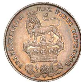
583 Shilling, 1826 (ESC 2409; S 3812). Minor surface marks, otherwise about as struck, toned Provenance: DNW Auction 129, 18 March 2015, lot 452