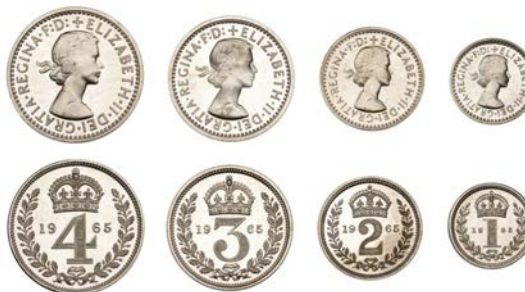
528 Maundy set, 1965 (ESC 4575; S 4131) [4]. About as struck, proof-like