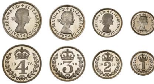
530 Maundy set, 1976 (S 4211) [4]. About as struck, proof-like