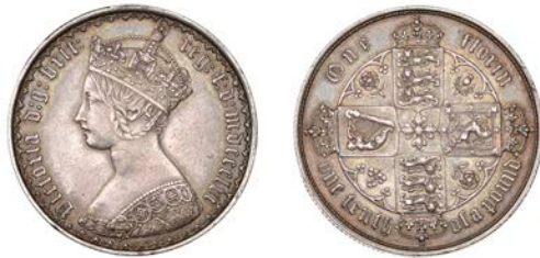
231 Florin, 1856 (ESC 2833; S 3891). Cleaned at one time and now re-toned, otherwise about extremely fine £120-£150