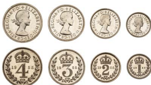
524 Maundy set, 1955 (ESC 4564; S 4131) [4]. About as struck