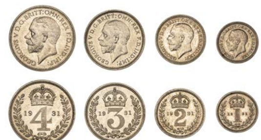
482 Maundy set, 1931 (ESC 3991; S 4043) [4]. About as struck