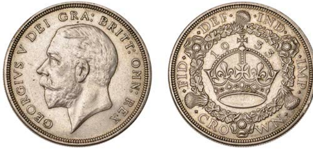
339 Crown, 1933 (ESC 3644; S 4036). Minor edge marks, otherwise about extremely fine