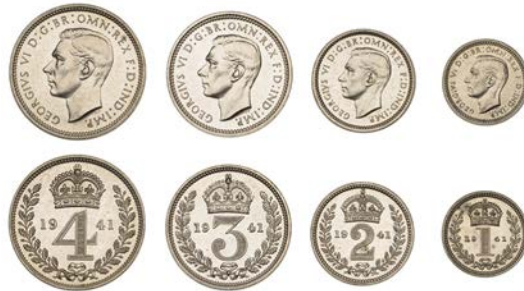
502 Maundy set, 1941 (ESC 4310; S 4086) [4]. Brilliant, about as struck, rare