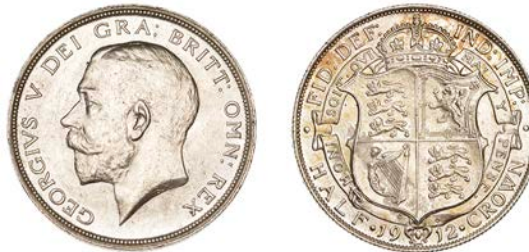
342 Halfcrown, 1912 (ESC 3711; S 4011). About as struck