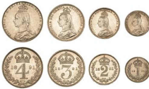
374 Maundy set, 1891 (ESC 3549; S 3932) [4]. Of bright appearance, good extremely fine