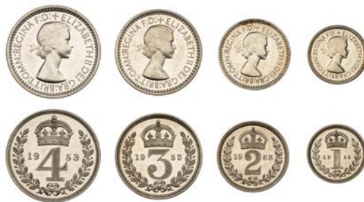
522 Maundy set, 1953 (ESC 4559; S 4126) [4]. Some surface marks and minor stain at 12 o'clock on Twopence, otherwise good extremely fine, rare £600-£800