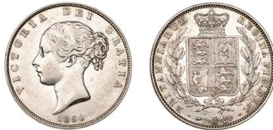
211 Halfcrown, 1850 (ESC 2733; S 3888). Cleaned, otherwise very fine £100-£120