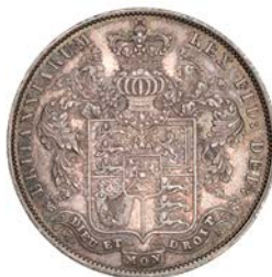
581 Halfcrown, 1826 (ESC 2375; S 3809). Extremely fine, toned