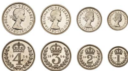
523 Maundy set, 1954 (ESC 4563; S 4131) [4]. About as struck