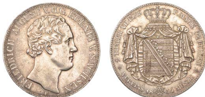
1099 SAXONY, Friedrich August II , Double-Thaler, 1854 F (Dav. 874; KM. 1149). Lightly cleaned, otherwise good very fine £150-£180