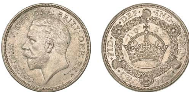
652 Crown, 1933 (ESC 3644; S 4036). Some spotting, otherwise about extremely fine