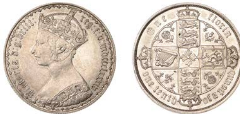
248 Florin, 1884 (ESC 2907; S 3900). Obverse cleaned, otherwise about extremely fine