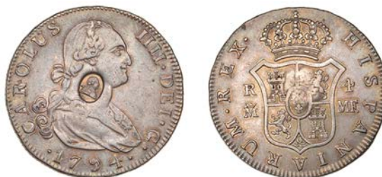
567 SPAIN, Charles IIII, 4 Réales, 1794 MF , Madrid, obv. countermarked with head of George III in oval, 13.65g (ESC 1875; S 3767). Good very fine, toned