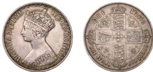
234 Florin, 1862 (ESC 2847; S 3891). Very fine, rare