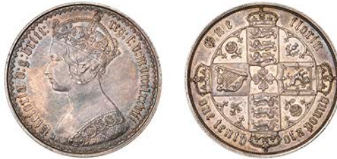
244 Florin, 1878, die 75 (ESC 2889; S 3895). Cleaned at one time and now re-toned, about extremely fine