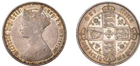
235 Florin, 1866, die 19 (ESC 2858; S 3892). Good very fine, toned