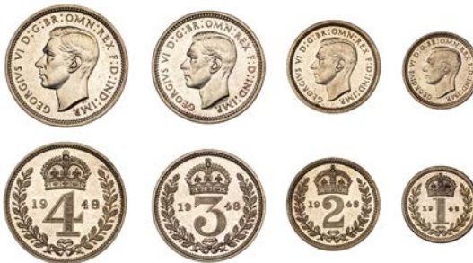
509 Maundy set, 1948 (ESC 4317; S 4091) [4]. Brilliant, about as struck, rare