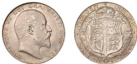
328 Halfcrown, 1909 (ESC 3575; S 3980). About extremely fine £150-£180