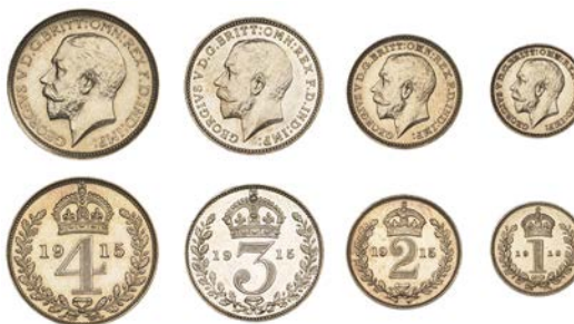
466 Maundy set, 1915 (ESC 3975; S 4016) [4]. Has been lightly cleaned at some time, otherwise extremely fine