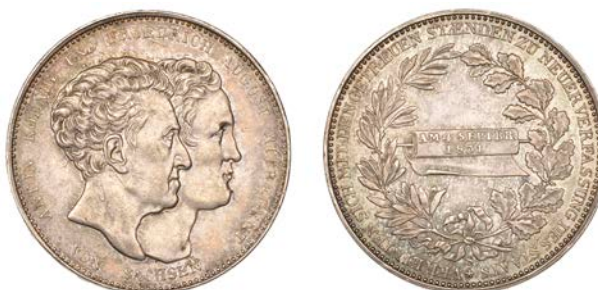
1097 SAXONY, Anton , Thaler, 1831 s (Dav. 869; KM. 1133). Lightly cleaned, otherwise about extremely fine £100-£120