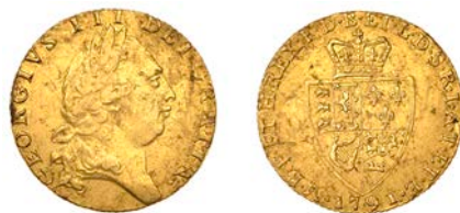
554 Guinea, 1791, fifth bust (EGC 719; S 3729). Excavated, good fine