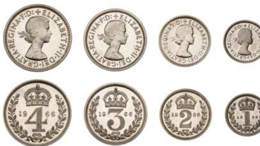
529 Maundy set, 1966 (ESC 4576; S 4131) [4]. About as struck, proof-like