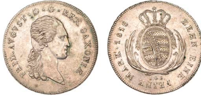
1095 SAXONY, Friedrich August I , Thaler, 1816 IGS (Dav. 854; KM. 1059.1). Overstruck with traces of undertype visible, lightly cleaned, otherwise good very fine £100-£120