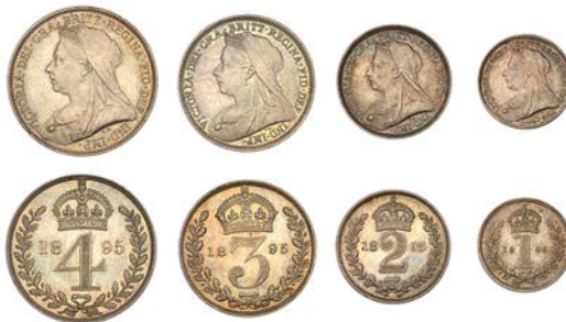
376 Maundy set, 1895 (ESC 3553; S 3943) [4]. About as struck, toned