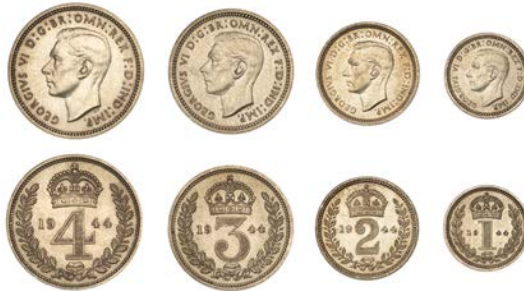
505 Maundy set, 1944 (ESC 4313; S 4086) [4]. About as struck, toned, rare