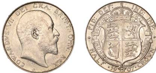
390 Halfcrown, 1907 (ESC 3573; S 3980). Surface marks, otherwise extremely fine, toned £150-£200