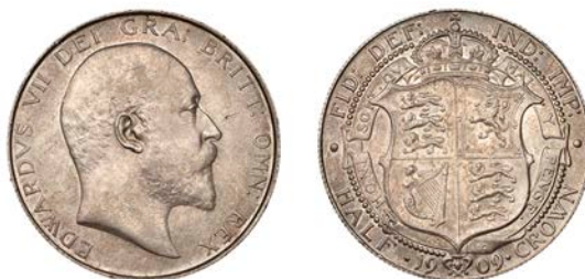
392 Halfcrown, 1909 (ESC 3575; S 3980). Light scratch before nose, otherwise good extremely fine £200-£300