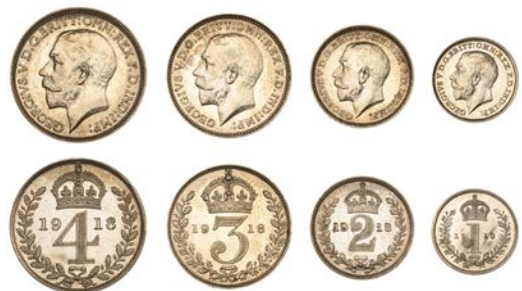
469 Maundy set, 1918 (ESC 3978; S 4016) [4]. About as struck