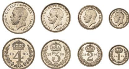
481 Maundy set, 1930 (ESC 3990; S 4043) [4]. Has been lightly cleaned at some time, otherwise extremely fine