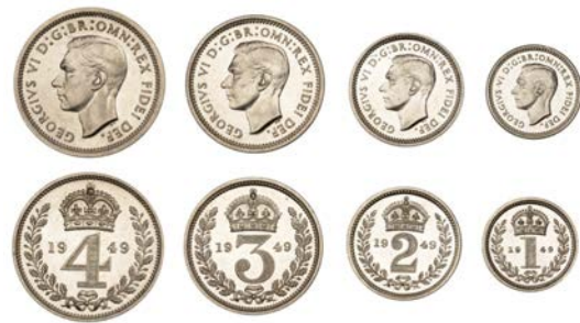
510 Maundy set, 1949 (ESC 4318; S 4096) [4]. Brilliant, about as struck, rare