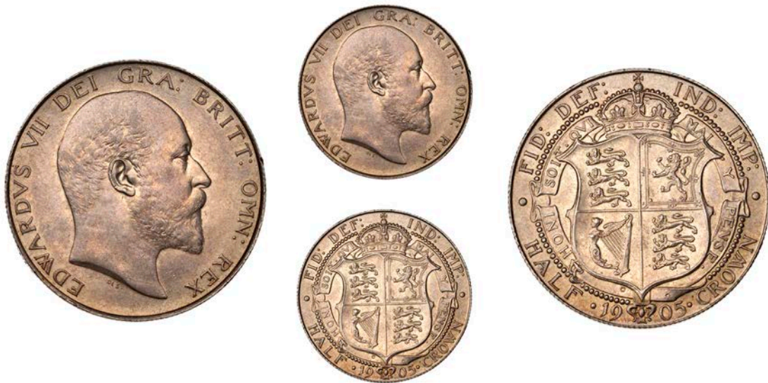
388 Halfcrown, 1905 (ESC 3571; S 3980). Minor rim nick at 3 o'clock, otherwise good extremely fine, rare £4,000-£5,000