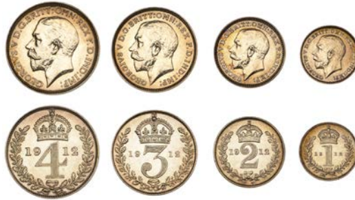
463 Maundy set, 1912 (ESC 3972; S 4016) [4]. Of bright appearance, good extremely fine