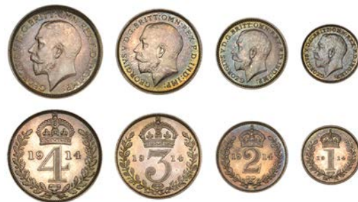
465 Maundy set, 1914 (ESC 3974; S 4016) [4]. About as struck, toned