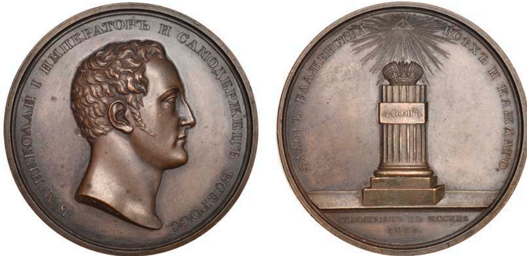
1423 RUSSIA, Nicholas I, Coronation , 1826, a copper medal by V. Alexeev and I. Lavretsov, bust right, rev. imperial crown on column, 65mm (Diakov 446.1; Reichel 3450). Extremely fine £150-£200