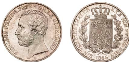
1077 OLDENBURG, Nicolaus Friedrich Peter , Thaler, 1866B (Dav. 753; KM. 196). Extremely fine