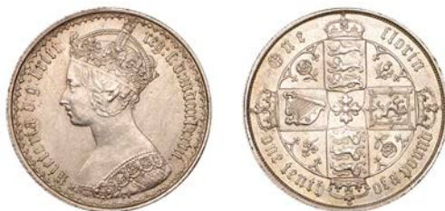
243 Florin, 1877, die 42, stop after date (ESC 2887; S 3895). About extremely fine