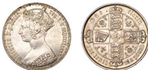
249 Florin, 1885 (ESC 2908; S 3900). Cleaned, otherwise about extremely fine