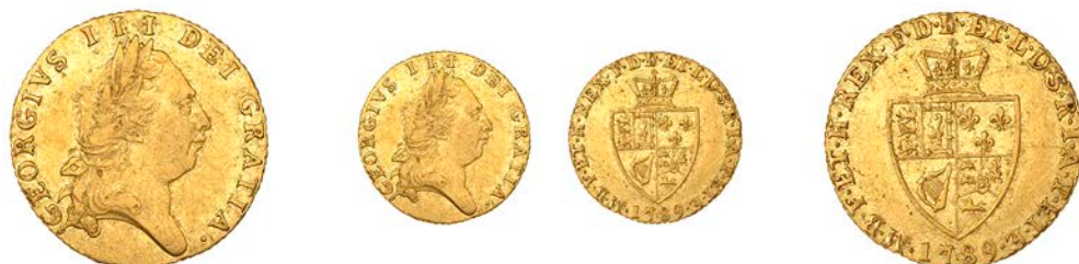
556 Half-Guinea, 1789, fifth bust (EGC 832; S 3735). Good fine or better, but some surface marks and scuffs