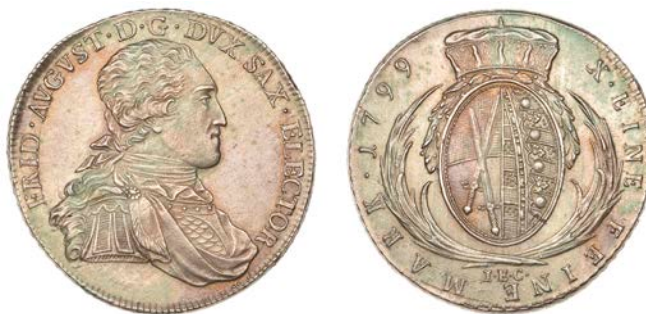
1093 SAXONY, Friedrich August III , Thaler 1799 IEC (Schnee 1092; Dav. 2701). Lightly cleaned, otherwise about extremely fine £100-£120