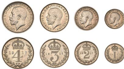
468 Maundy set, 1917 (ESC 3977; S 4016) [4]. About as struck