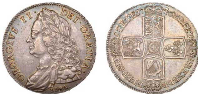
547 Crown, 1746, LIMA, edge DECIMO NONO (ESC 1668; S 3689). About extremely fine, attractively toned