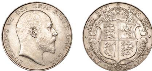
327 Halfcrown, 1908 (ESC 3574; S 3980). About extremely fine £240-£300