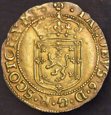
James VI (1567-1625)