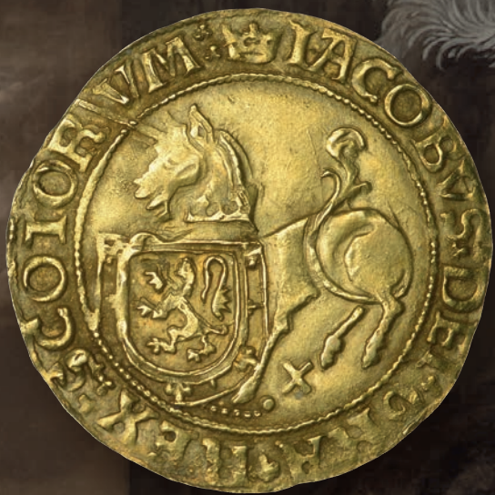
James V (1513-1542)