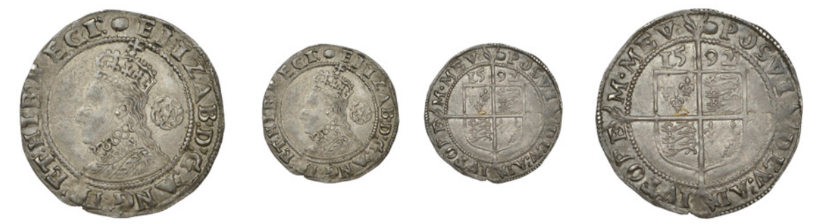
861 Sixpence, 1592, mm. tun, bust 6C, reads ELIZAB D G ANG FR ET HIB REGI, 3.18g/11h (BCW TN-2:TN-b; N 2015; S 2578B). Last digit of date double-punched, otherwise good very fine, old cabinet toning Provenance: Bt Seaby October 1986