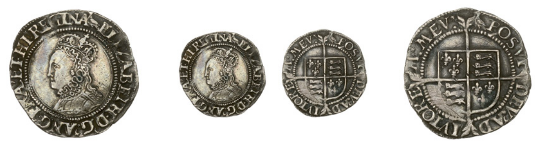
569 Groat, mm. martlet, bust 1F, reads ELIZABETH D G ANG FRA ET HIB REGINA, 1.96g/6h (BCW MR-1B:MR-b3; N 1986; S 2556). Light scratch on forehead and crown, otherwise about very fine £150-£180 Provenance: Bt J.S.J. Welsh March 1986

568 Groat, mm. cross-crosslet, bust 1F, reads ELIZABETH D G AN FR ET HIB REGI', 2.13g/7h (BCW CC-1K:CC-b5; N 1986; S 2556). Lightly creased and a weak patch at 5 o'clock, otherwise very fine, attractively toned £200-£240 Provenance: DNW Auction 104, 5 December 2012, lot 200