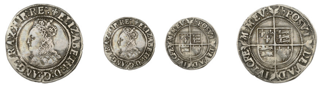
521 Groat, mm. lis, bust 1F, beaded and wire-line inner circles, reads ELIZABETH D G ANG FRA Z HIB RE, 1.93g/10h (BCW LS-3D:LSe1; N 1986; S 2551). About very fine £150-£200