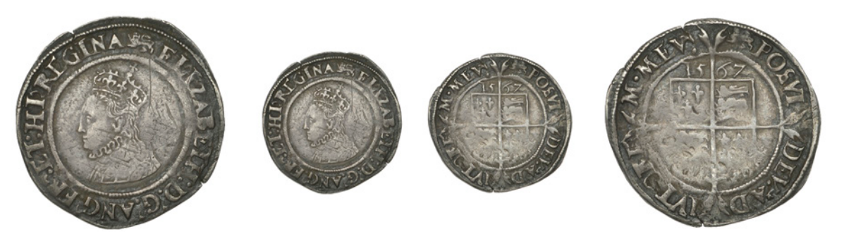
648 Sixpence, 1567, mm. lion, bust 4B, reads ELIZABETH D G ANG FR ET HI REGINA, 'no rose behind head', 2.63g/1h (BCW LN-1A:LNd2; N 1997; S 2562). Obverse field almost certainly tooled in field to erase the rose, good fine or better but surfaces marked, a curiosity Provenance: Spink Auction 230, 15 July 2015, lot 420

649 Sixpence, undated, mm. lion, bust 4B, reads ELIZABETH D G ANG FR ET HI REGINA, 2.36g/9h (BCW LN-7:LN-b; DNW 136, 593, same rev. die; cf. N 1997; S 2562A). Creased, edge cracks, only fair but excessively rare; probably only six known £150-£200