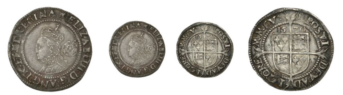
672 Sixpence, 1570, mm. castle, bust 4B, reads ELIZABETH D G ANG FR ET HI R'EGINA , lowest lion missing in third quarter of shield, 3.05g/2h (BCW CA-2:CA-c1; N 1997; S 2562). Very fine, dark tone, the variants very rare £150-£200 Provenance: DNW Auction 137, 21-3 September 2016, lot 691 (part)