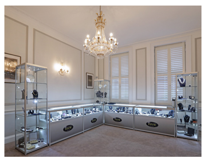
Jewellery viewing room

Our offices, open from 9.30am-5pm, Monday to Friday, include viewing rooms, normally enabling us to offer viewing prior to each auction.