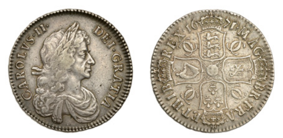
108 Halfcrown, 1671/0, third bust variety, edge VICESIMO TERTIO (ESC 458 [469]; S 3366). Slightly weak on hair, otherwise good very fine, scarce £700-£900