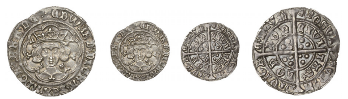
29 Light Coinage, Groat, London, class VI, mm. sun, lis after TAS, saltire stops, 3.06g/10h (B & W VI; N 1569; S 2000). Nearly extremely fine with attractive dark tone, scarce