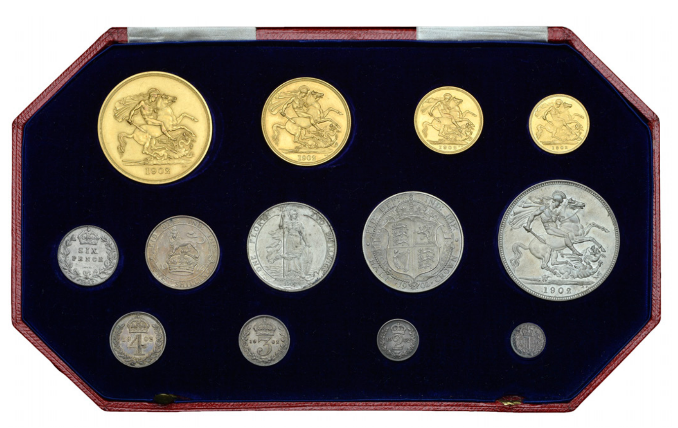
194 Proof set, 1902, comprising Five Pounds, Two Pounds, Sovereign and Half-Sovereign, Crown to Maundy Penny [13].Matt, the silver toned, about as struck; in official red case of issue£5,000-£6,000