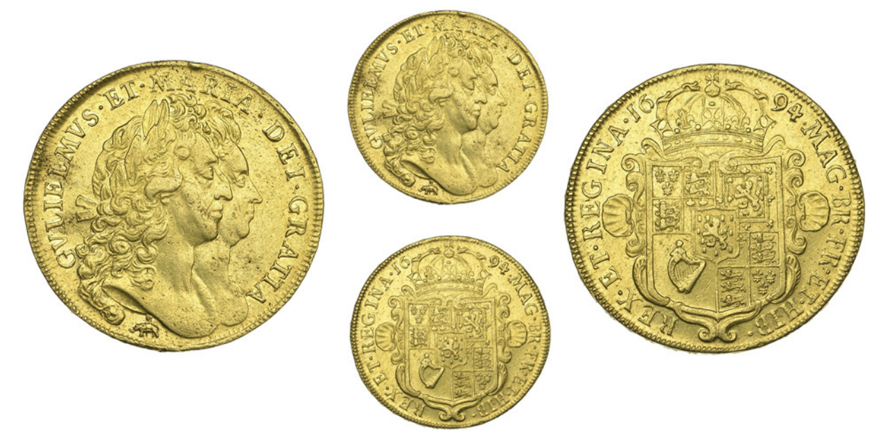
134 Five Guineas, 1694, elephant and castle, edge SEXTO (MCE 143; S 3423). Haymarking on obverse, otherwise good very fine