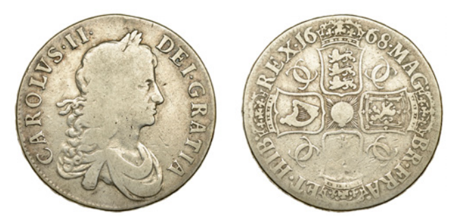
95 Crown, 1668, second bust, edge VICESIMO (ESC 373 [36]; S 3357). Good fine