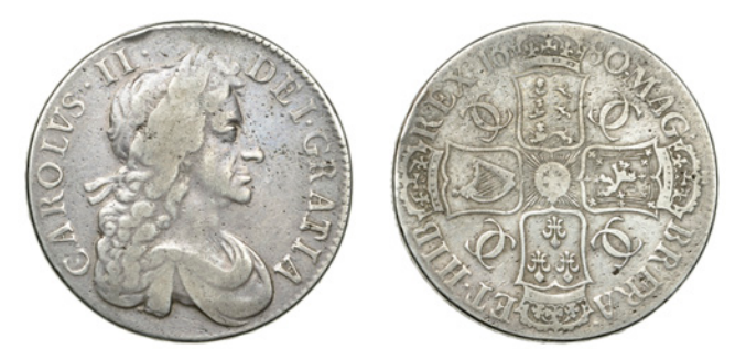
104 Crown, 1680, fourth bust, edge TRICESIMO SECVNDO (ESC 412 [60]; S 3359). Good fine or a little better