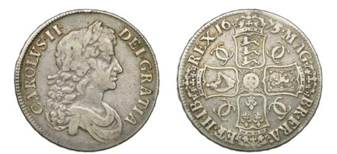
99 Crown, 1675/3, third bust, edge vicesimo septimo (ESC 396 [50A]; S 3358). Nearly very fine, extremely rare £1,400-£1,600