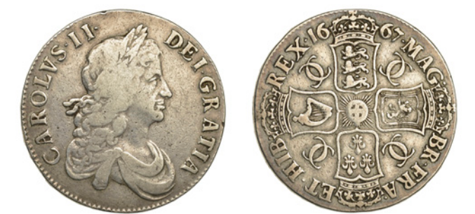
94 Crown, 1667, second bust, edge reads AN · REG · DECIMO NONO (ESC 372 [35]; S 3357). Better than fine, scarce £200-£260