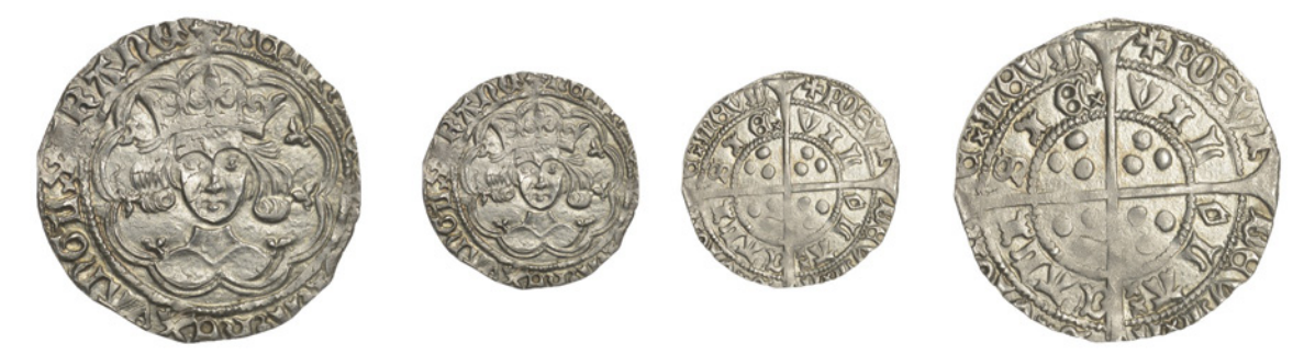
28 Pinecone-Mascle/Leaf-Mascle issue mule, Groat, Calais, mm. crosses IIIb/V, pinecones after HENRIC, DI and GRA, mascle after REX and before LA, double saltire after LA, saltire and small leaf after SIE, 3.78g/6h (Whitton 30d; N 1461/1475; S 1889). Small of flan (but virtually full weight) and of bright appearance, otherwise very fine or better, rare £200-£260 Provenance: From the Reigate Brokes Road (Surrey) Hoard, 1990; Glendining Auction, 8 December 1992, lot 315 (part)