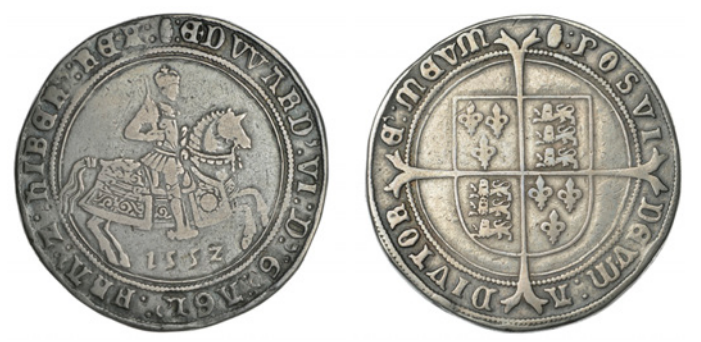
39 Third period, Fine issue, Crown, 1552, mm. tun, 30.68g/10h (Lingford dies B-12; N 1933; S 2478). Good fine or better £1,200-£1,500 Provenance: R. Hansen Collection, DNW Auction 114, 18 September 2013, lot 1010 [from Spink (Australia) October 1977]

38 Third period, Fine issue, Crown, 1551, mm. y, 30.46g/6h (Lingford dies A-1; N 1933; S 2478). On a full flan, nearly very fine £1,200-£1,500