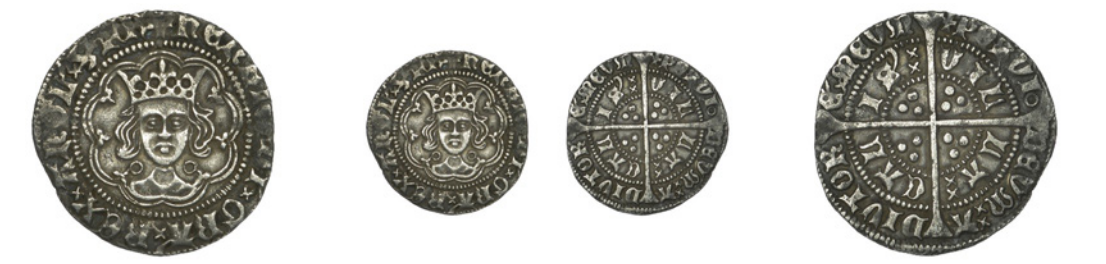
27 Annulet issue, Halfgroat, Calais, mm. cross V, no annulets on rev., 1.65g/12h (N 1429; S 1841). Good very fine £60-£80