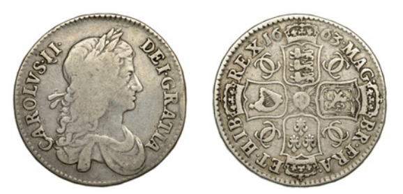
107 Halfcrown, 1663, first bust, edge xv, no stops on obv . (ESC 444 [459]; S 3361). Good fine, toned, rare £300-£400

106 Crown, 1684, fourth bust, edge SEXTO (ESC 420 [67]; S 3359). Some minor marks, otherwise very fine, scarce £700-£900