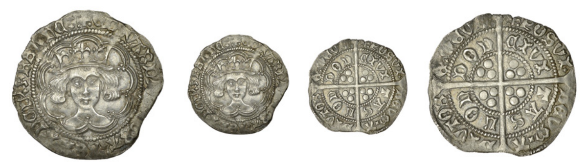
31 Groat, London, class XVI, mm. cross with four pellets, trefoils on cusps, saltire stops, 2.99g/1h (B & W XVI; N 1631; S 2096). On a slightly irregular flan, otherwise nearly extremely fine with a good portrait £240-£300

30 Angel, mm. pierced cross and pellet (in fourth quarter), reads DEI, 5.05g/8h (B & W XVIII; SCBI Schneider 465; N 1626; S 2091). Shadow of a crease mark, otherwise well-struck with strong details, nearly extremely fine £2,600-£3,000