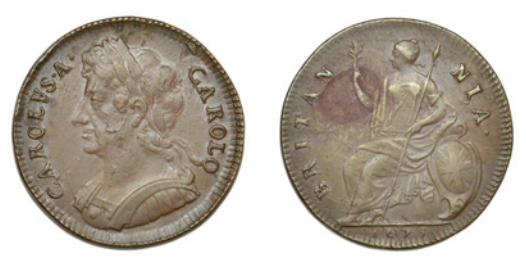
127 Halfpenny, 1675 (BMC 516; S 3393). Stain on reverse, otherwise nearly extremely fine