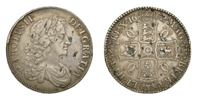
97 Crown, 1672, third bust, edge vicesimo quarto (ESC 388 [45]; S 3358). Nearly very fine but numerous surface marks £300-£400