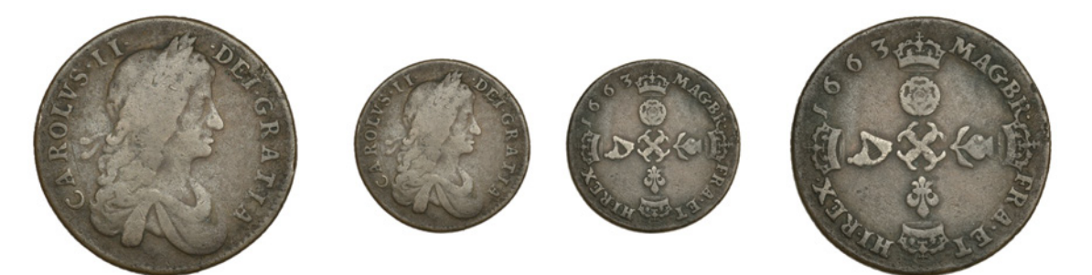
115 Pattern Shilling, 1663, by J. Roettiers, in copper, laureate bust right, rev . crowned cruciform emblems around four interlinked Cs, reads HI, edge grained, 5.27g/8h (ESC 562 [1067]; BMC 488). Fine, very rare £500-£600