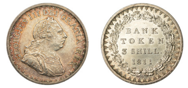
162 Three Shillings, 1811 (ESC 2065 [408]; S 3769). Of bright appearance, extremely fine or better