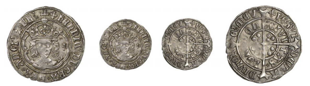
34 Facing Bust issue, Groat, class IVa, mm. cross-crosslet, 3.14g/8h (SCBI Ashmolean 428ff; N 1706a; S 2200). King's face weak, otherwise good very fine, toned £200-£260