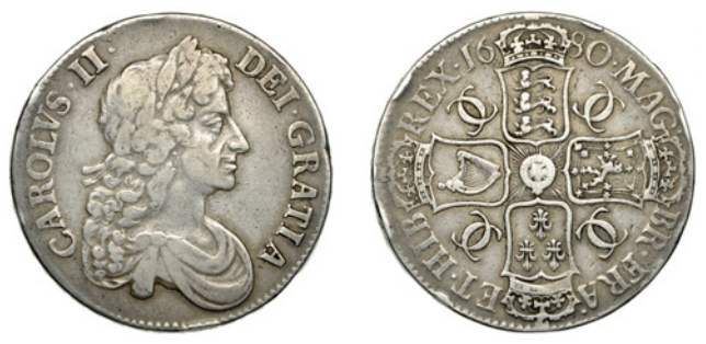
103 Crown, 1680, third bust, edge TRICESIMO SECVNDO (ESC 408 [58]; S 3358). Very fine, scarce

102 Crown, 1679, third bust, edge TRICESIMO PRIMO (ESC 403 [56]; S 3358). Very fine