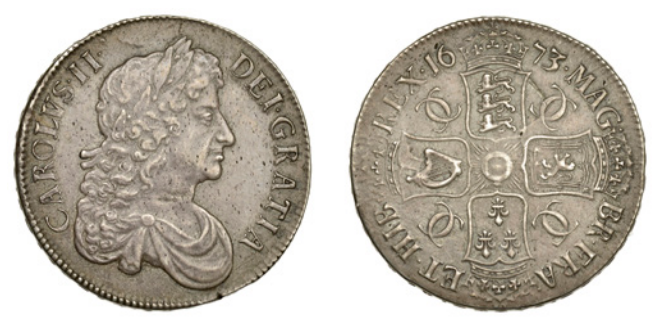
98 Crown, 1673, third bust, edge VICESIMO QVINTO (ESC 390 [47]; S 3358). Weak in places, otherwise nearly extremely fine £1,200-£1,500