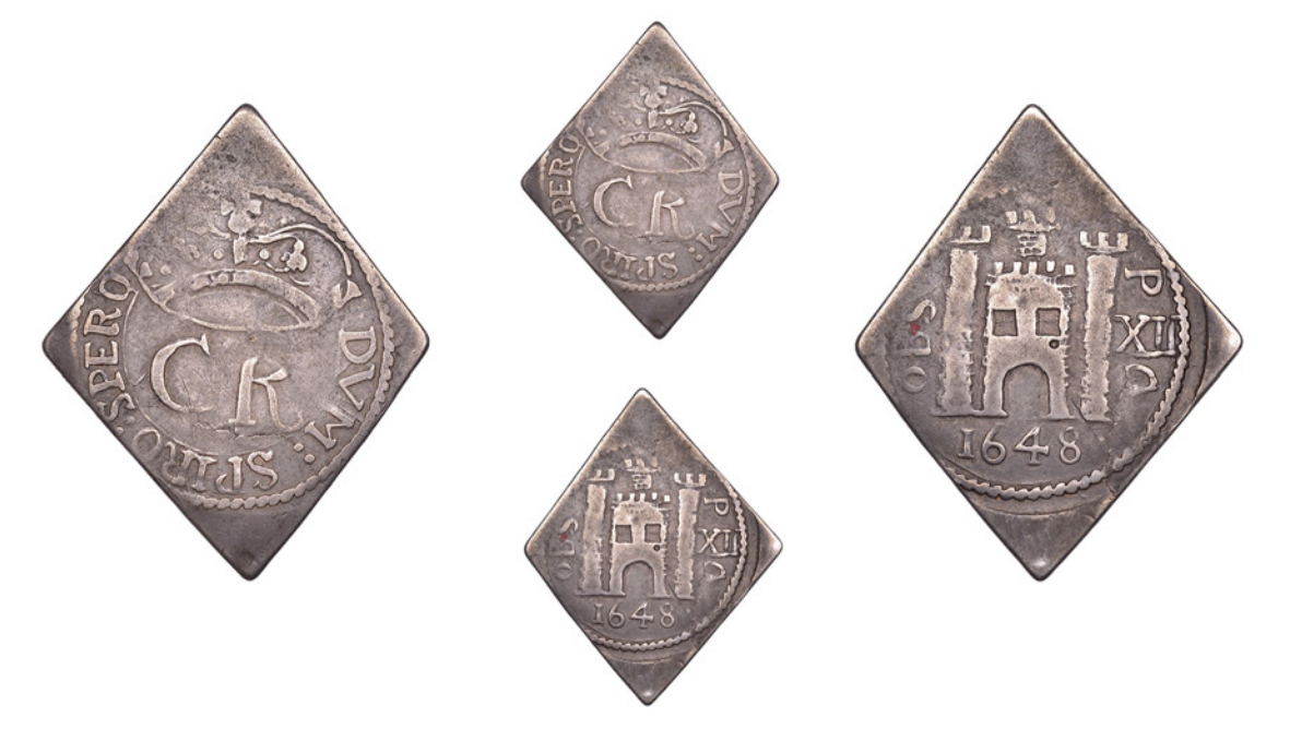
77 Pontefract, Shilling, 1648, type I, crowned c-R, rev. castle gateway, value dividing PC to right, 4.44g/12h (Hird 276-8;<br/>SCBI Brooker 1233, same dies; N 2647; S 3149). Good fine, rare£3,600-£4,000