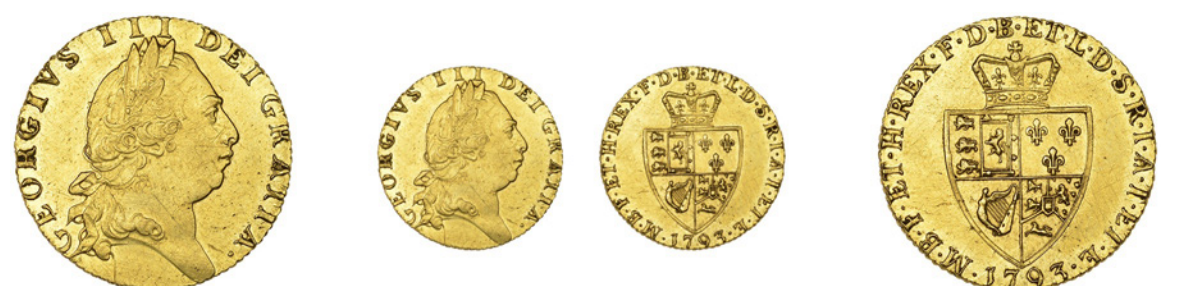
154 Guinea, 1793, fifth bust (MCE 397; S 3729). Better than extremely fine