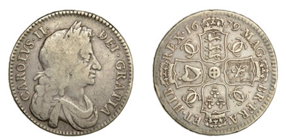
110 Halfcrown, 1679, fourth bust, edge TRICESIMO PRIMO (ESC 480 [481]; S 3367). Fine