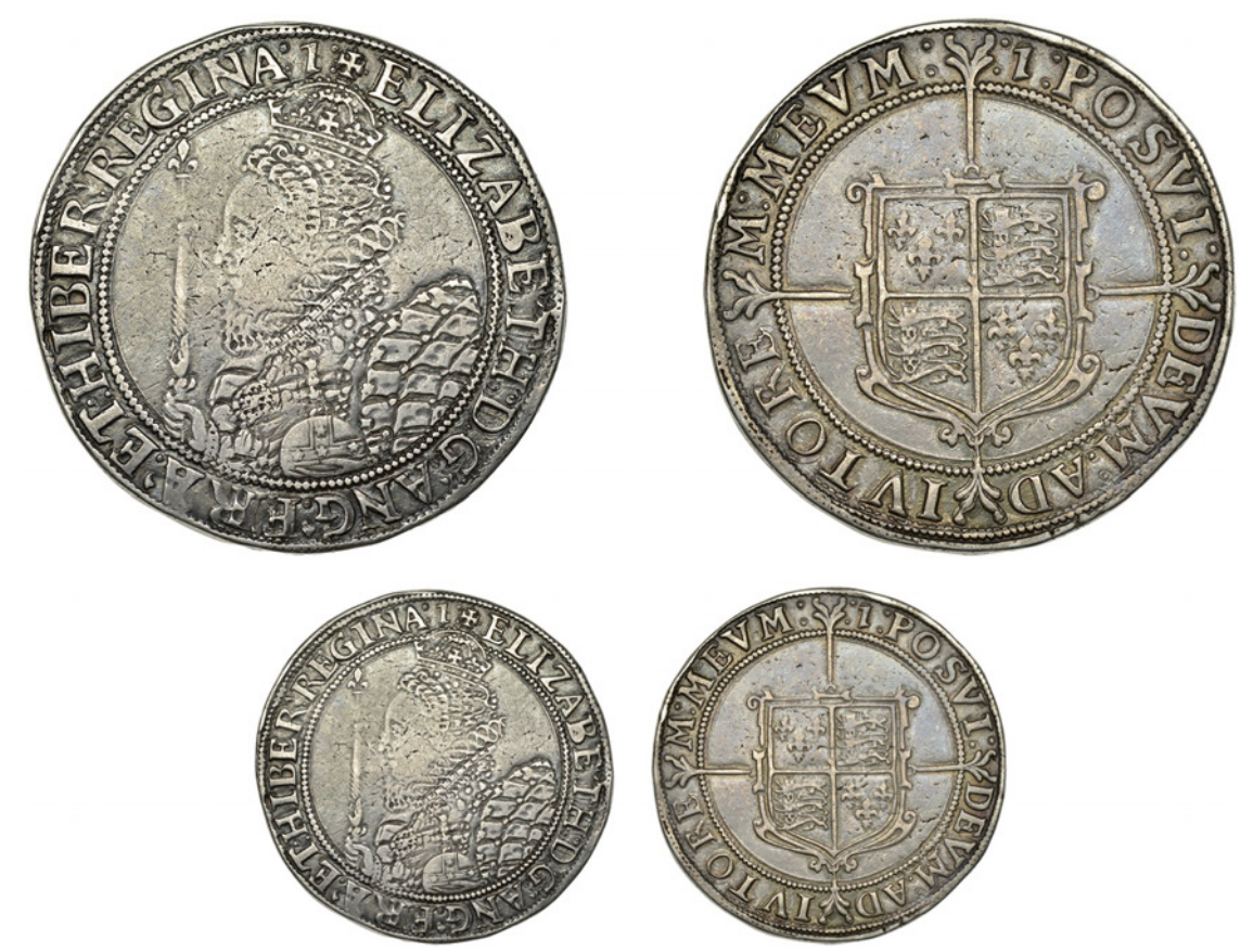
44 Seventh issue, Crown, mm. 1, sceptre points to G of REGINA, 29.64g/1h (FRC A-2 [Sale, lot 2]; N 2012; S 2582). Some light tooling and minute surface cracking, otherwise very fine and toned, the variety very rare £3,000-£4,000

43 Sixth issue, Angel, mm. hand, 5.17g/12h (Brown/Comber C39; SCBI Schneider 790; N 2005; S 2531). A little weak in places, otherwise nearly extremely fine and probably much as struck, scarce £4,000-£4,600