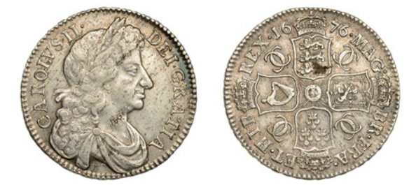
109 Halfcrown, 1676, fourth bust, edge VICESIMO OCTAVO (ESC 471[478]; S 3367). A little haymarking, otherwise good very fine £600-£800