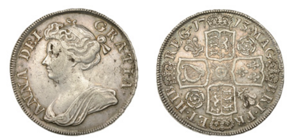
144 Halfcrown, 1713, roses and plumes, edge DVODECIMO (ESC 1375 [584]; S 3607). Good very fine