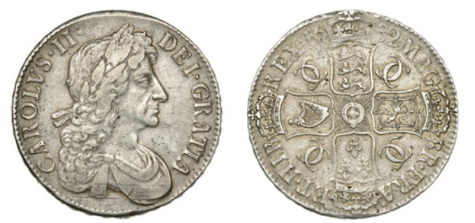
105 Crown, 1682/1, fourth bust, edge TRICESIMO QVARTO/TERTIO (ESC 418 [65B]; S 3359). Very fine or better but with an edge flaw on reverse at 12 o'clock, rare £800-£1,000