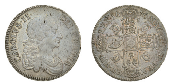
100 Crown, 1676, third bust, edge VICESIMO OCTAVO (ESC 397 [51]; S 3358). Some obverse haymarking, otherwise about very fine, toned £400-£500