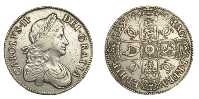
96 Crown, 1671, third bust, edge VICESIMO TERTIO (ESC 386 [43]; S 3358). Sometime cleaned, otherwise better than very fine £400-£600