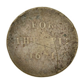
301 LONDON, Drury Lane, Theatre Royal, First Theatre, 1671, brass, unsigned [by J. Roettiers], bust of Charles II left, rev. FOR THE PIT, 33mm, 11.06g (W 178; D & W 18/191). Mediocre, extremely rare ### Provenance: F.S. Cokayne Collection