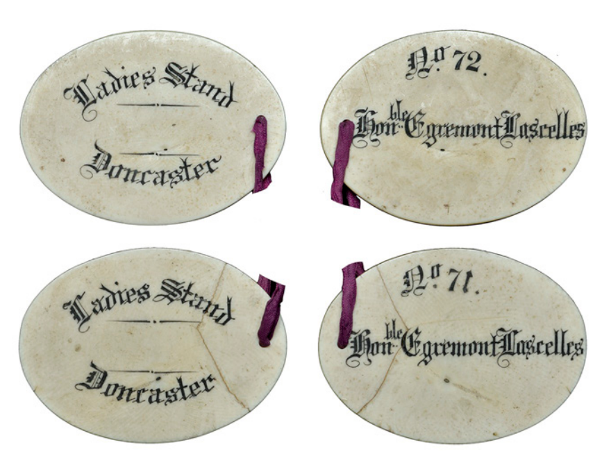
288 YORKSHIRE , Doncaster , oval ivory (2), Ladies Stand, undated, backs named (No. 71, Honble. Egremont Lascelles; No. 72, Honble. Egremont Lascelles), both 50 x 37mm, 7.28g and 8.04g (W –; D & W –) [2]. Fine to very fine but No. 71 cracked, very rare; pierced for suspension and tied together with contemporary purple ribbon £300-£400

Please note that ivory is covered by CITES legislation and may be subject to export and other trade restrictions