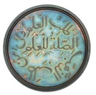
394 INDIA , East India College , Haileybury , Arabic prize, c . 1809, a copper medal, unsigned [by C.H. Küchler], arms and supporters, rev . legend in Arabic, 37mm (Pudd. 948.1.1; Pollard 31). Extremely fine £200-£300