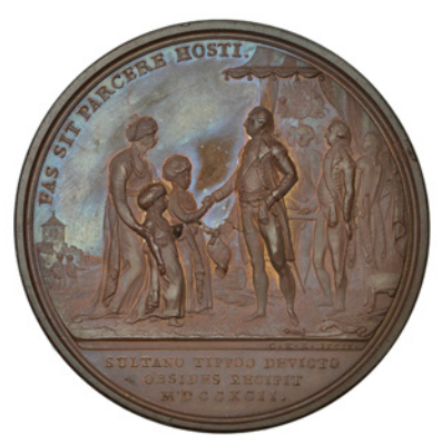
393 INDIA , Defeat of Sultan Tippoo , 1792, a copper medal by C.H. Küchler, uniformed bust of Marquis Cornwallis left, rev. Cornwallis receives the sons of Sultan Tipoo as hostages, 48mm (Pudd. 792; BHM 363; E 845; Pollard 5). Extremely fine; in original metal shells £200-£300