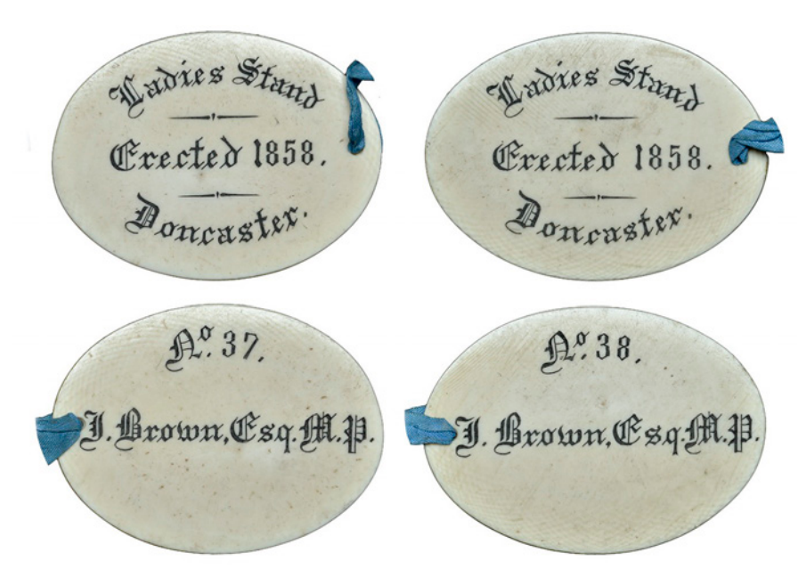
286 YORKSHIRE , Doncaster , oval ivory (2), Ladies Stand, Erected 1858, backs named (No. 37, J. Brown, Esq, MP; No. 38, J. Brown, Esq, MP), both 50 x 37mm, 7.72g and 8.06g (W -; D & W -) [2]. Very fine and very rare; pierced for suspension, with contemporary blue ribbons £300-£400

Please note that ivory is covered by CITES legislation and may be subject to export and other trade restrictions