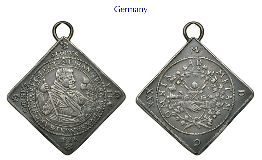
564 SAXONY , Johann Georg , Klippe Thaler, 1630, 28.74g/12h (Dav. 7609). Very fine and toned, but loop-mount attached to top corner