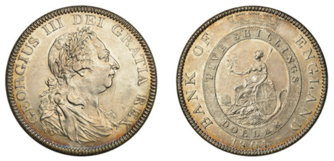
274 Dollar, 1804, types E/2, leaf to centre of E in DEI (ESC 1951 [164]; S 3768). Cleaned and with some contact marks, otherwise very fine £150-£180 Provenance: DNW Auction 42, 8 September 1999, lot 441