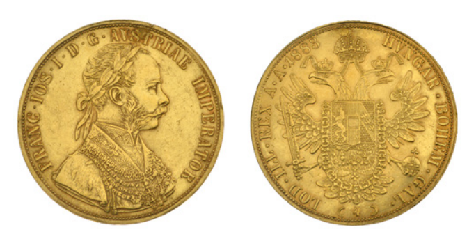
G 552 Franz Joseph I, 4 Ducats, 1883 (KM. 2276; F 487). Traces of mounting, otherwise good very fine £400-£500