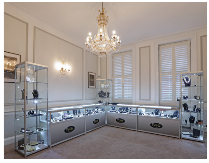
Jewellery viewing room

Our offices, open from 9.30am - 5pm, Monday to Friday, include viewing rooms, normally enabling us to offer viewing three weeks prior to an auction.