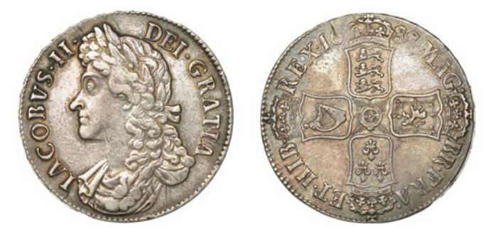
188 Crown, 1688/7, second bust, edge QVARTO (ESC 747 [81]; S 3407). Lightly cleaned, otherwise good very fine £600-£800

189 Crown, 1688, second bust, edge QVARTO (ESC 746 [80]; S 3407). Good fine