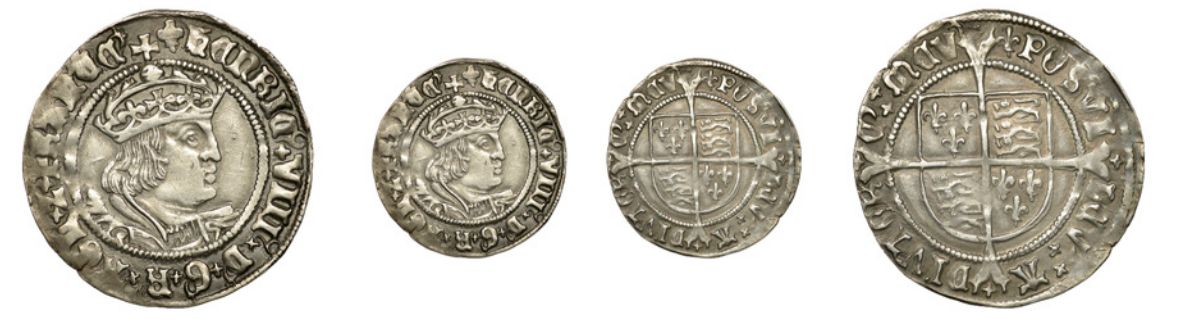
119 Second coinage, Groat, Tower, mm. lis, bust D, 2.77g/12h (N 1797; S 2337E). Lightly cleaned, otherwise very fine £200-£260

120 Second coinage, Halfgroat, Canterbury, Abp Warham, mm. uncertain, wA by shield, 1.30g/1h (N 1802; S 2343). Minor<br/>double-striking on reverse, otherwise about very fine, toned£80-£100