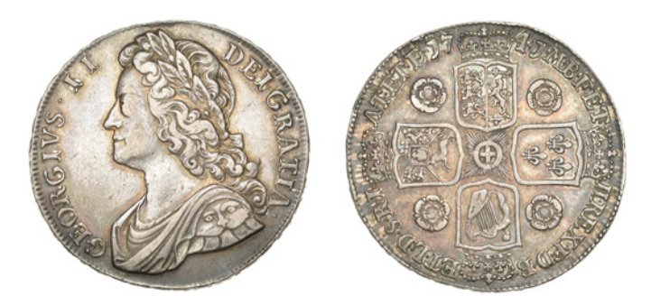
245 Crown, 1741, roses, edge DECIMO QVARTO (ESC 1666 [123]; S 3687). Minor deposit, otherwise very fine, toned £600-£800