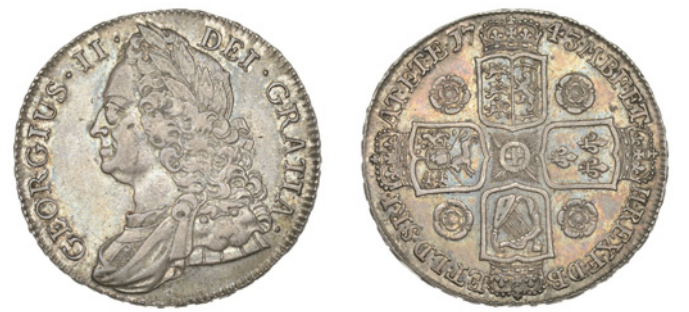
247 Crown, 1743, roses, edge decimo septimo (ESC 1667 [124]; S 3688). Minor deposit, otherwise good very fine and toned £800-£1,000