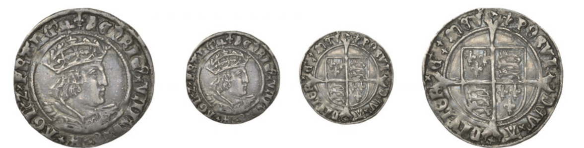
116 Second coinage, Groat, Tower, mm. lis, bust D, 2.76g/11h (N 1797; S 2337E). Very fine, toned