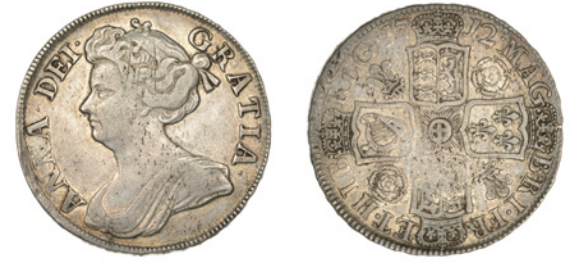
223 Halfcrown, 1712, roses and plumes, edge UNDECIMO (ESC 1374 [582]; S 3607). About very fine