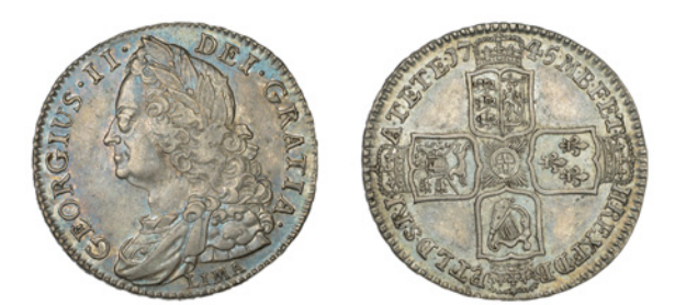
253 Halfcrown, 1745 LIMA, edge DECIMO NONO (ESC 1687 [605]; S 3695). Good very fine, reverse a little better £200-£240