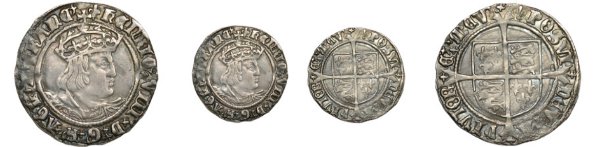
117 Second coinage, Groat, Tower, mm. lis, bust D, 2.59g/9h (N 1797; S 2337E). Very fine