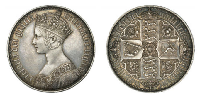
311 'Gothic' Crown, 1847, edge UNDECIMO (ESC 2571 [288]; S 3883). Nearly extremely fine