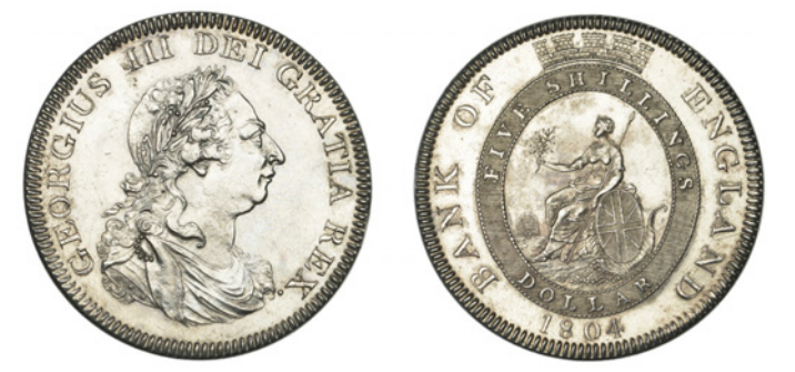
273 Dollar, 1804, types A/2, leaf to upright of E, C · H · K on truncation, K upright, edge plain, 27.00g/12h (ESC 1926 [145]; S 3768). Extremely fine or better but sometime cleaned, possibly an impaired Proof £500-£600