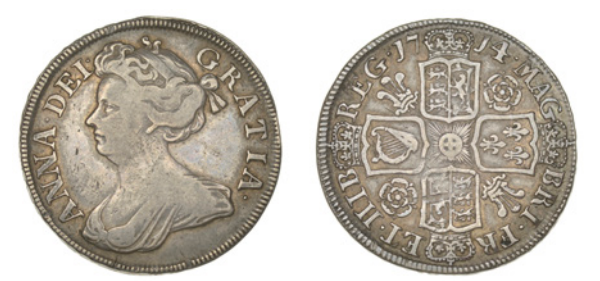
226 Halfcrown, 1714, roses and plumes, edge DECIMO TERTIO (ESC 1377 [585]; S 3607). About very fine