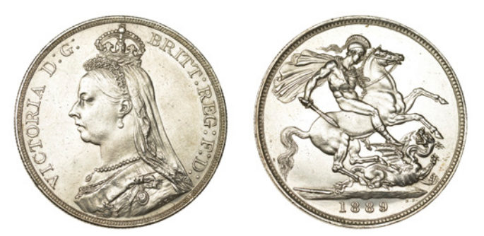
314 Crown, 1889 (ESC 2589 [299]; S 3921). A few minor marks, otherwise about as struck

313 Proof Crown, 1887, edge grained, 28.25g/12h (ESC 2586 [297]; S 3921). Fields lightly hairlined and a few minor marks, otherwise about as struck £800-£1,000