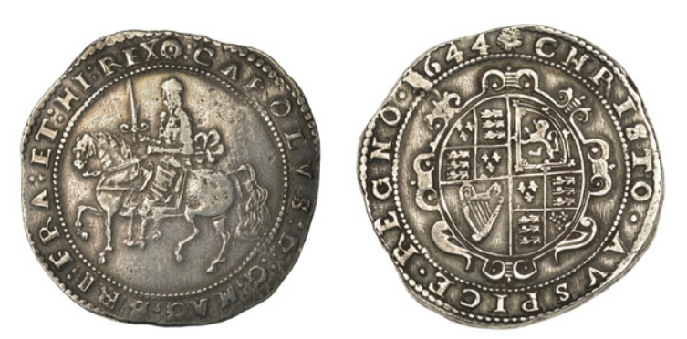
163 Exeter mint, Crown, 1644, mm. rose, 28.56g/4h (Besly C9; SCBI Brooker 1033, same dies; N 2557; S 3058). Full flan, minor double-striking on obverse, otherwise good very fine, scarce £1,000-£1,200