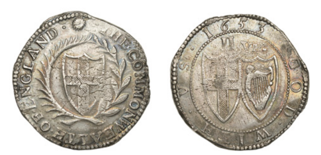
167 Halfcrown, 1653, mm. sun on obv . only, 14.58g/10h (ESC 28 [431]; N 2722; S 3215). Good very fine, toned £600-£800 Provenance: DNW Auction 30, 16 July 1997, lot 182

168 Shilling, 1653, mm. sun on obv . only, 5.35g/4h (ESC 124 [987]; N 2724; S 3217). Nearly very fine