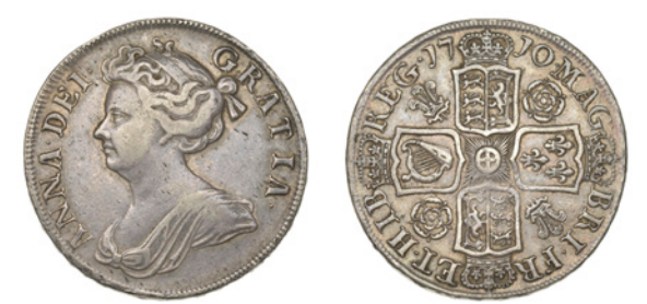
222 Halfcrown, 1710, roses and plumes, edge NONO (ESC 1372 [581]; S 3607). Very fine