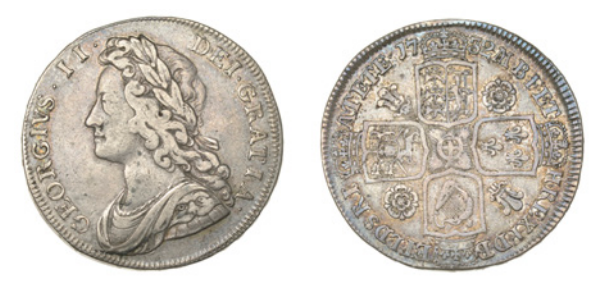
249 Halfcrown, 1732, roses and plumes, edge SEXTO (ESC 1675 [596]; S 3692). About very fine

248 Crown, 1746 LIMA, edge DECIMO NONO (ESC 1668 [125]; S 3689). Better than extremely fine, attractively toned £2,200-£2,600