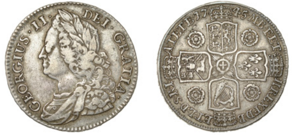
252 Halfcrown, 1745, roses, edge DECIMO NONO (ESC 1685 [604]; S 3694). About very fine