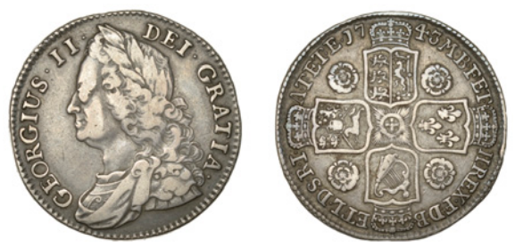
251 Halfcrown, 1743, roses, edge DECIMO SEPTIMO (ESC 1684 [603A]; S 3694). About very fine

250 Halfcrown, 1732, roses and plumes, edge SEXTO (ESC 1675 [596]; S 3692). Small dig on reverse, otherwise about very fine £200-£260