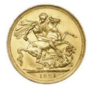
298 Sovereign, 1821 (M 5; S 3800). Has been cleaned in the past, some surface marks, otherwise extremely fine or better £600-£800