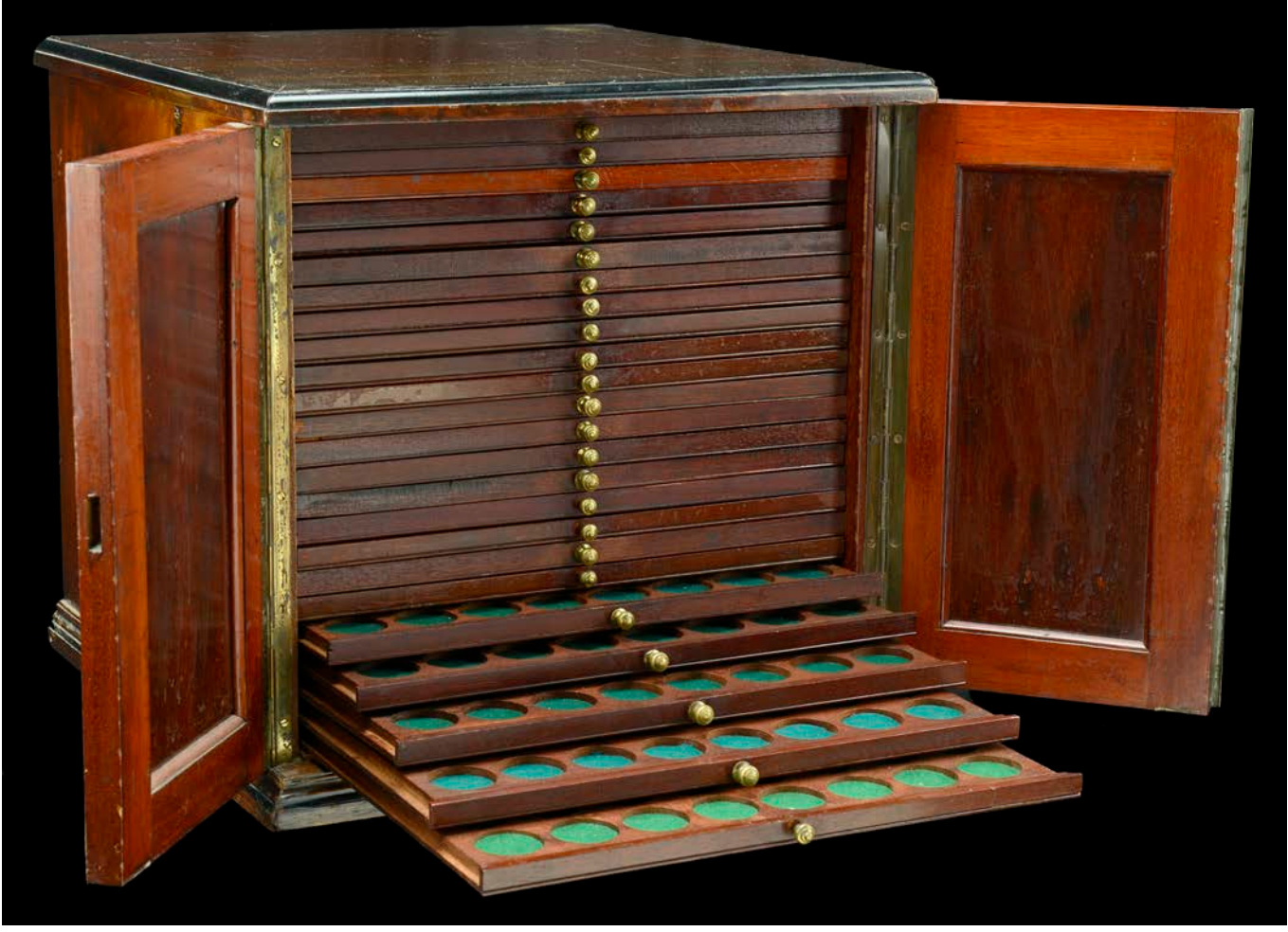
753 A polished 19th century mahogany coin cabinet, 36 x 36 x 35.5cm, comprising 24 trays double-pierced to house a total of 889 coins, brass pulls, double inlaid doors, lock (no key), felt base. A substantial cabinet in excellent overall condition, ideal for a collection of Pennies or Halfcrowns, complete with all felts £300-£400