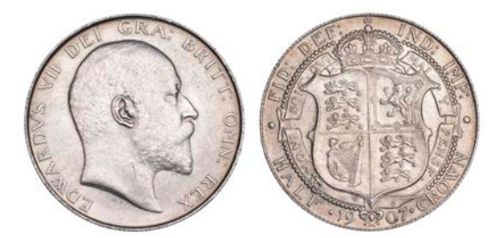
374 Halfcrown, 1907 (ESC 3573 [752]; S 3980). Slight cut on neck, otherwise good extremely fine Provenance : G. Freestone Collection, DNW Auction 165, 4-5 December 2019, lot 239