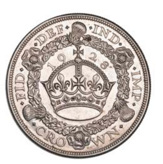
388 Crown, 1928 (ESC 3633 [368]; S 4036). A few surface marks, otherwise better than extremely fine Provenance : G. Freestone Collection, DNW Auction 165, 4-5 December 2019, lot 266