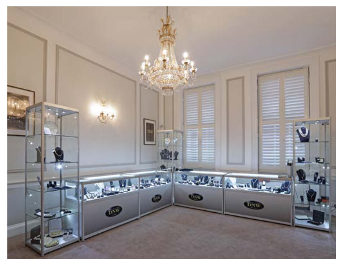
Jewellery viewing room

Our offices, open from 9.30am-5pm, Monday to Friday, include viewing rooms, normally enabling us to offer viewing prior to each auction.