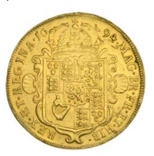
258 Five Guineas, 1694, elephant and castle (MCE 142; $ 3423). Edge smoothed to allow for a ring mount, otherwise better than very fine, attractive, rare £4,000-£5,000