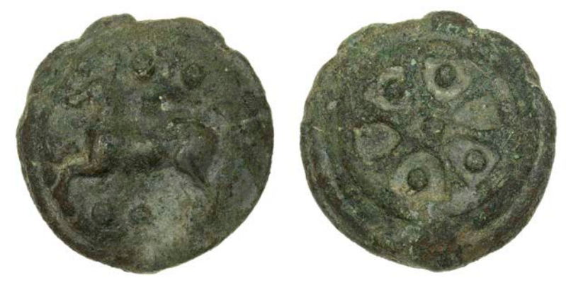
565 Anonymous , Æs Grave, Triens, Libral standard, horse prancing left, two pellets above and below, rev. six-spoke wheel, four pellets within angles, 94.26g (Craw. 24/5; HN Italy 328). Very fine, green surfaces £200-£300