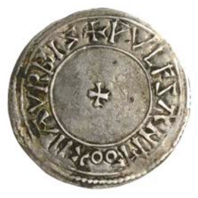
207 Penny, Circumscription Cross type [Southern Group], Oxford, Wulfsan, EADGAR REX ANGORV, small cross pattée, rev. PULFSAN MO OXNA VRBIS, small cross pattée, 1.47g/9h (SCBI Ashmolean 410, same dies; SCBI BM 1078, same dies; CTCE 225; N 749; S 1135). Some small surface deposits, otherwise full and round, nearly very fine, lightly toned £700-£900 Provenance: Bt Baldwin