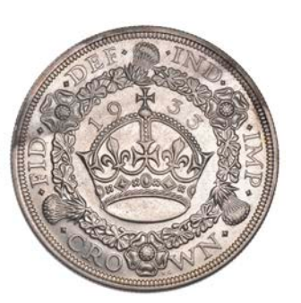
392 Crown, 1933 (ESC 3644 [373]; S 4036). Good extremely fine Provenance : G. Freestone Collection, DNW Auction 165, 4-5 December 2019, lot 271