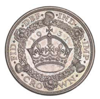
390 Crown, 1931 (ESC 3639 [371]; S 4036). Extremely fine or better Provenance: G. Freestone Collection, DNW Auction 165, 4-5 December 2019, lot 269