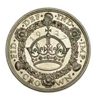
386 Proof Crown, 1927 (ESC 3631 [367]; S 4036). About as struck, brilliant