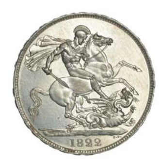
303 Crown, 1822, edge TERTIO (ESC 2320 [252]; S 3805). Of bright appearance, minor surface marks, otherwise about mint state £1,200-£1,500