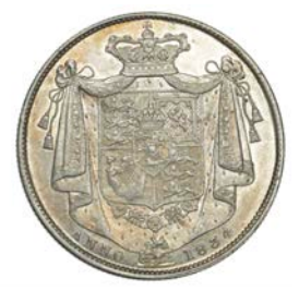
307 Halfcrown, 1834, ww in script (ESC 2478 [662]; $ 3834). Of bright appearance, marks in obverse field, otherwise extremely fine £360-£400