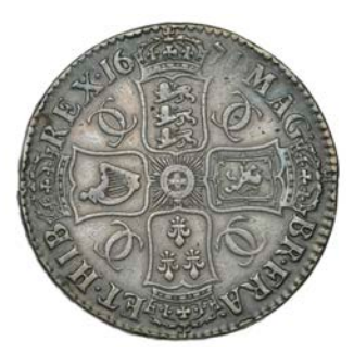
247 Crown, 1671, second bust, edge VICESIMO TERTIO (ESC 382 [42]; S 3357). Small rim flaw at 5 o'clock, otherwise about very fine, reverse better £400-£600