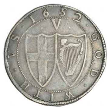
242 Crown, 1652/1, mm. sun on obv . only, 29.89g/6h (ESC 5 [5]; N 2721; S 3214). Full and round, better than very fine but slightly weak in centres £2,000-£2,400