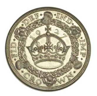
387 Proof Crown, 1927 (ESC 3631 [367]; S 4036). About as struck