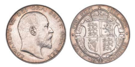
373 Halfcrown, 1906 (ESC 3572 [751]; S 3980). Extremely fine, reverse better, light peripheral toning Provenance : G. Freestone Collection, DNW Auction 165, 4-5 December 2019, lot 238