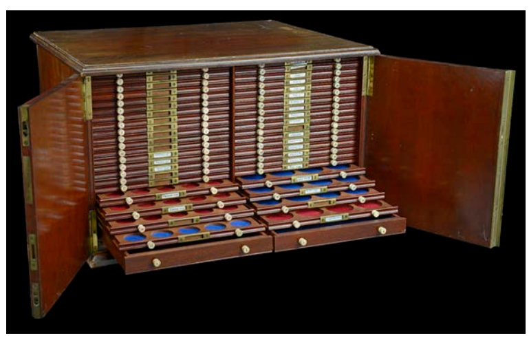
752 A 19th century mahogany coin cabinet, 56 x 44 x 34cm, comprising 42 trays in two banks, each double-pierced to house a total of 2,094 coins, two deep bottom drawers, ivory numbered pulls, double doors, lock and key, brass carrying handles at sides. A substantial cabinet in excellent overall order and complete with all felts; ideal for the advanced collector Provenance: Robert Lyall