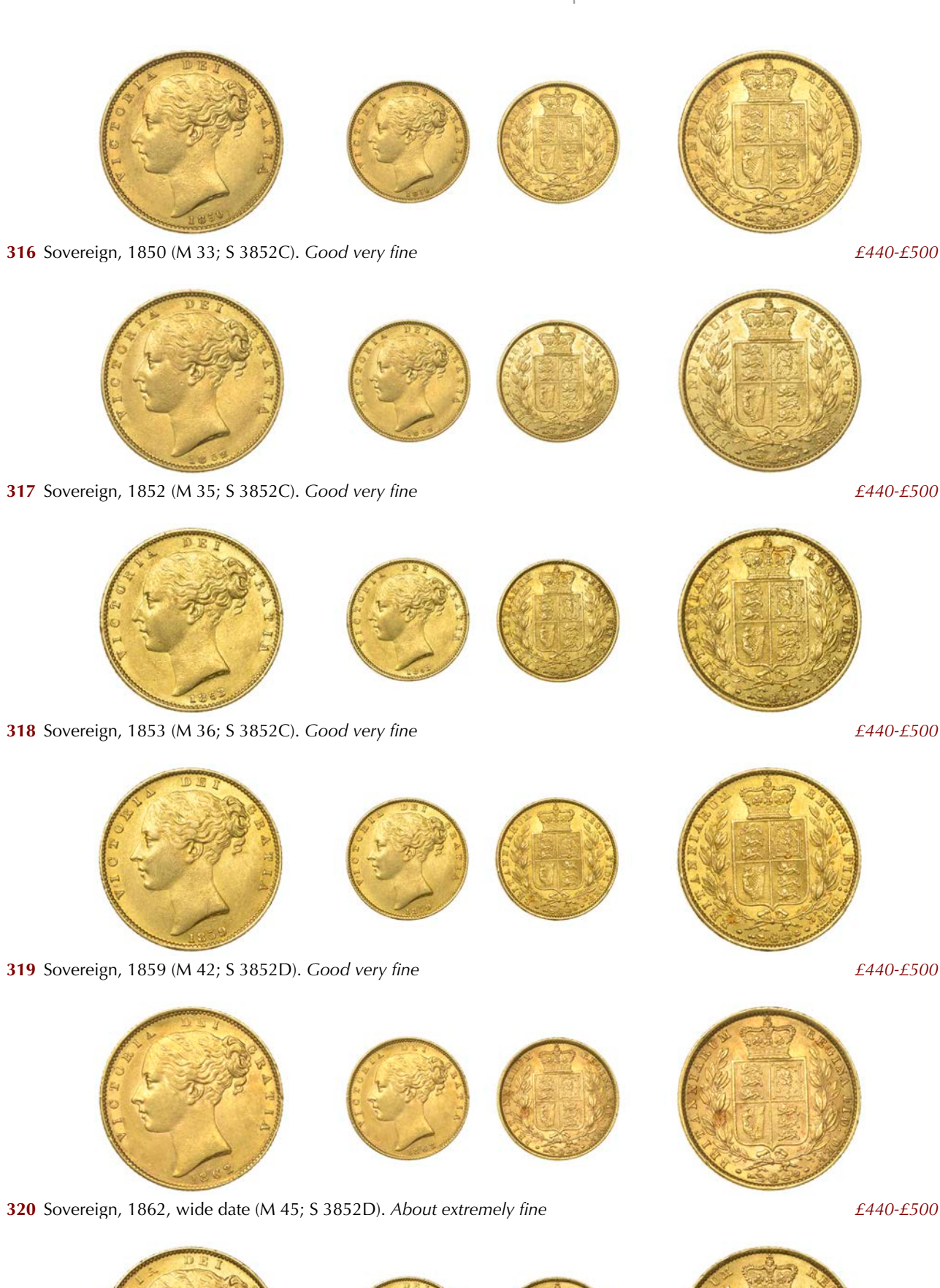
G 321 Sovereign, 1872, no die number (M 47; S 3853B). About extremely fine