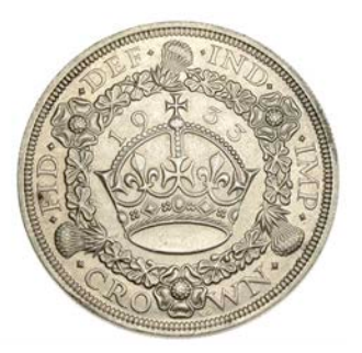
393 Crown, 1933 (ESC 3644 [373]; S 4036). Nearly extremely fine