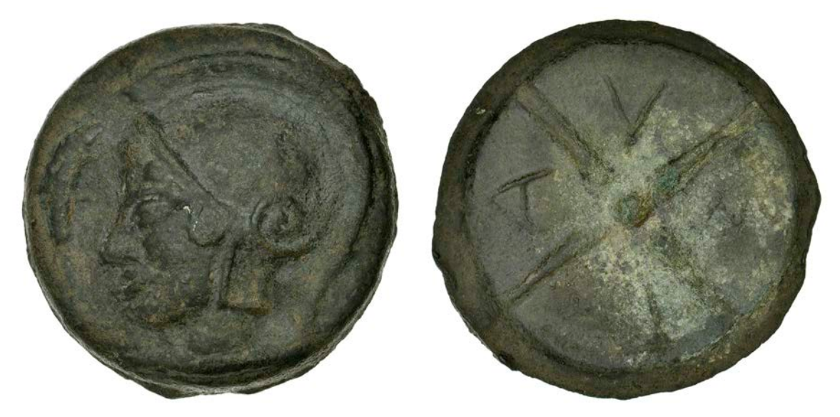
539 SKYTHIA , Olbia , Æ 70 cast disk, produced under the magistrate Paus[–], 450-440, helmeted head of Athena right, dolphin in front, rev. four-spoke wheel, π A Y Σ, in quarters, 142.76g (SNG BM Black Sea –; SNG Pushkin –; Sear-; CNG Triton XXII, 160). Very fine, thick patina with typical small encrustations £800-£1,000