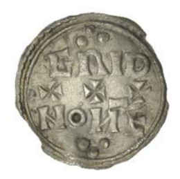
206 Penny, Two Line type [HT North-Eastern V variety], Grith, GRID MONE between three crosses, trefoil of pellets above and below, 1.01g/12h (CTCE 47; N 741; S 1129). Rim chips, otherwise good fine **Frovenance** A. Scammell Collection** **Frovenance** A. Scammell Collection** **Trefoil of pellets above and below, 1.01g/12h (CTCE 47; N 741; S 1129). Rim chips, otherwise good fine **Frovenance** A. Scammell Collection**