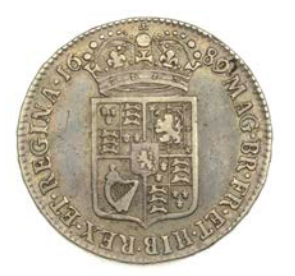
259 Halfcrown, 1689, second shield, caul only frosted, pearls, edge PRIMO (ESC 842 [510]; S 3435). Nearly very fine £200-£260