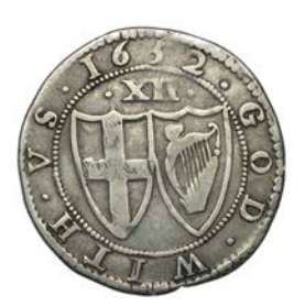
243 Shilling, 1652, mm. sun on obv . only, 5.63g/8h (ESC 103 [985]; N 2724; S 3217). Better than fine, on a full flan £150-£200