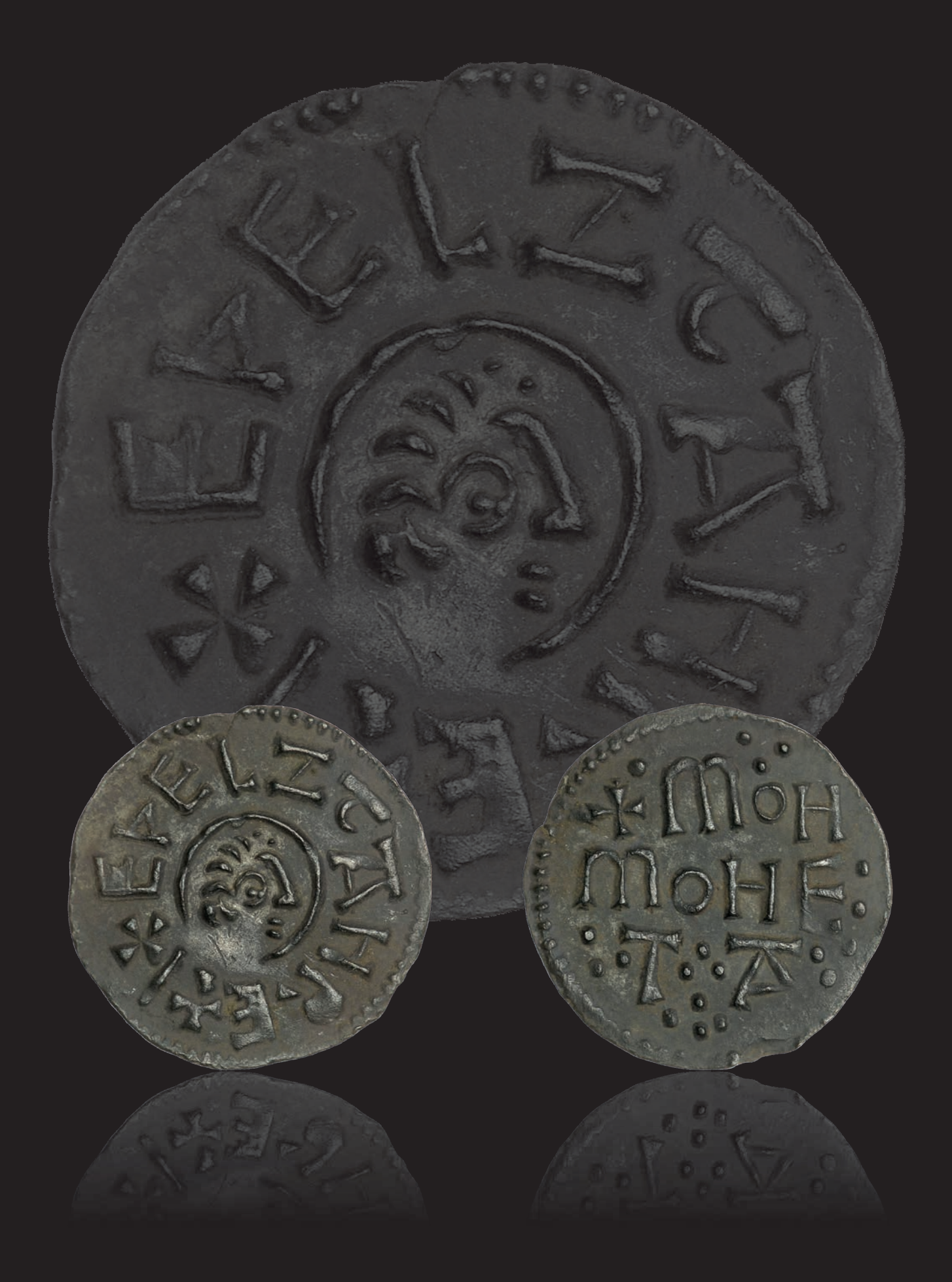
205 Æthelstan I (825-45), Penny, Ipswich, Monne, EDELZTAN REX, draped bust right, rev. +MON MONE TA, in three lines, 1.30g/3h (Naismith E31.1; N 437; S 949). Minor edge chip, original colour and nearly extremely fine, the portrait pleasing, very rare £6,000-£8,000

Provenance: Found in West Norfolk, June 2020 (EMC 2020.0244)