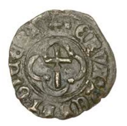
499 James III , Crux Pellit coinage, series III, 'Three-penny Penny', orb with rosette in centre, rev . Latin cross within quatrefoil, 1.28g/3h (Holmes type IIIL; SCBI 35, 806ff; S 5311). About very fine #120-£150 Provenance: J.G. Rose Collection