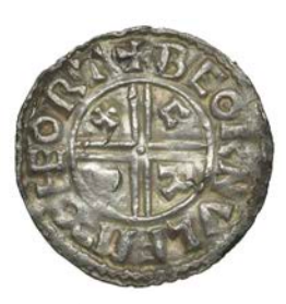
209 Penny, CRVX type, Hertford, Beornwulf, BEORNVLF M<sup>-</sup>O HEORT, 1.61g/3h (SCBI Copenhagen –; BEH 1306; N 770; S 1148). Some peckmarks, otherwise very fine, the moneyer very rare £240-£300 Provenance: T. Maudlin Collection, DNW Auction 160, 5-6 June 2019, lot 110 [frpm S. Hall August 2014]