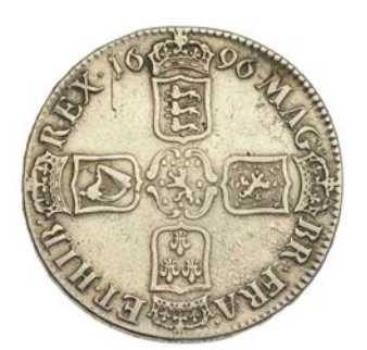
260 Crown, 1696, first bust, edge OCTAVO (ESC 995 [89]; $ 3470). Cleaned, otherwise about very fine