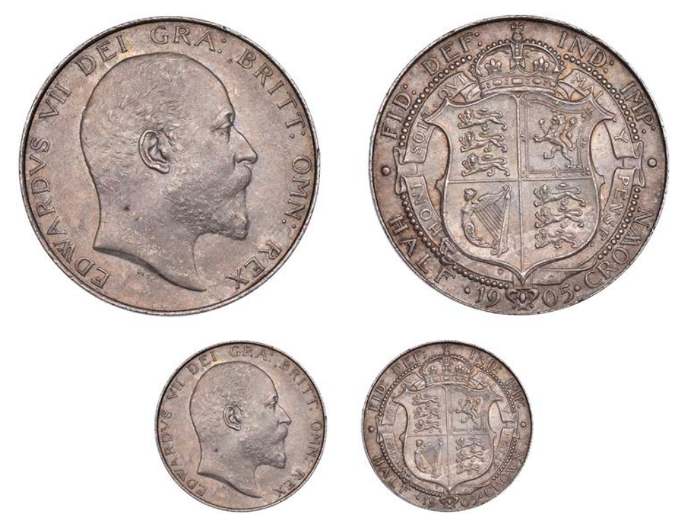
372 Halfcrown, 1905 (ESC 3571 [750]; S 3980). A few tiny surface and rim marks, otherwise virtually mint state, lightly toned, very rare £8,000-£10,000 Provenance: G. Freestone Collection, DNW Auction 165, 4-5 December 2019, lot 237