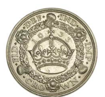
391 Crown, 1933 (ESC 3644 [373]; S 4036). About as struck