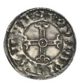
220 Penny, Pointed Helmet type, Winchester, Godwine Widia, GODPINE PIDIA ON PIN, 1.24g/3h (Winchester Mint 1684; Freeman 176; N 825; S 1179). Slight crack, otherwise good fine, portrait better, struck on a full flan £200-£260 Provenance: A. Scammell Collection