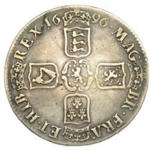
261 Crown, 1696, first bust, edge OCTAVO (ESC 995 [89]; S 3470). Good fine