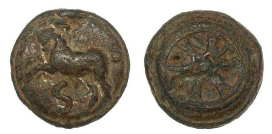
564 Anonymous, Æs Grave, Semis, Heavy standard, bull leaping right, s below, rev. six-spoke wheel, s between two spokes, 115.35g (Craw. 24/4; HN Italy 327). Some roughness and with small adhesive deposits on obverse, otherwise very fine £300-£400