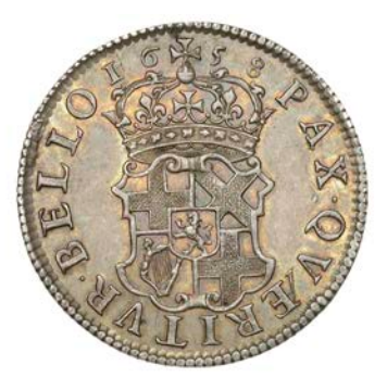
244 Shilling, 1658 (Lessen J28; ESC 254 [1005]; S 3228). Light wear to high points and minor surface marks on obverse, otherwise extremely fine, attractive tone £3,000-£3,600