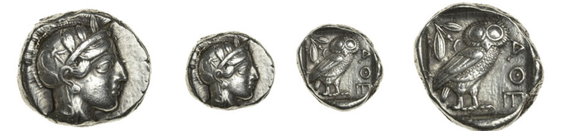
349 ATTICA , Athens , Tetradrachm, c. 449-405, helmeted head of Athena right, rev . owl standing right, olive sprig to left, AΘE to right, all within incuse square, 17.17g (Kroll 8; BMC, Group β, 46ff). Good very fine £400-£500