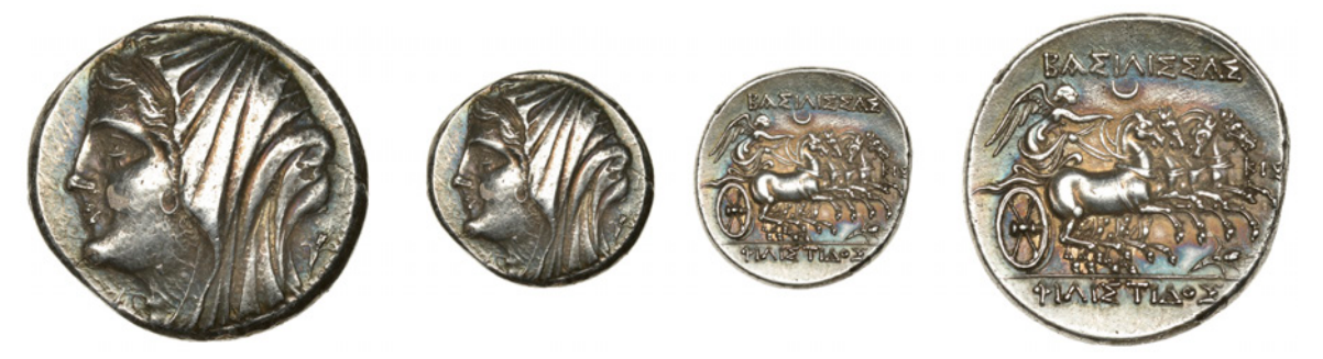
310 SICILY, Syracuse , Philistis (wife of Hieron II), 16 Litræ, 240-216, diademed and veiled bust left, grain-ear behind, rev. ΒΑΣΙΛΙΣΣΑΣ ΦΙΛΙΣΙΔΟΣ, charging quadriga driven right by Nike, grain-ear below, κιΣ before horses, 13.52g (SNG ANS 882, Manchester 543 and Pozzi 1355, same dies). Small delaminations on edge and cheek, usual die rust on obverse, otherwise very fine