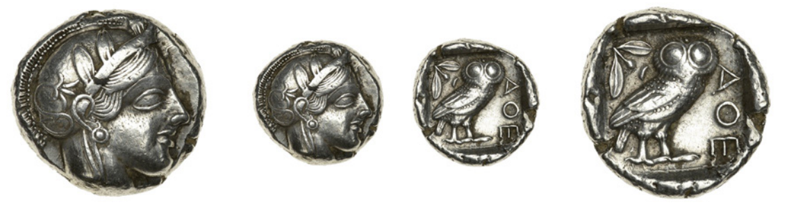
347 ATTICA , Athens , Tetradrachm, c . 449-405, helmeted head of Athena right, rev . owl standing right, olive sprig to left, AΘE to right, all within incuse square, 17.17g (Kroll 8; BMC, Group β, 46 f f). Good very fine, obverse well-centred £400-£500