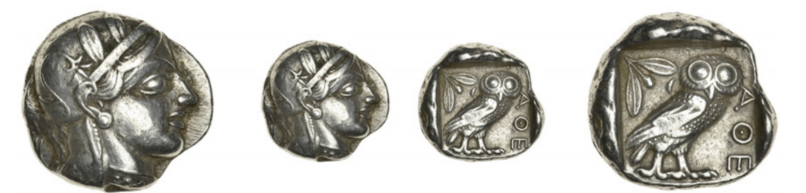
350 ATTICA , Athens , Tetradrachm, c . 449-405, helmeted head of Athena right, rev . owl standing right, olive sprig to left, AΘE to right, all within incuse square, 17.15g (Kroll 8; BMC, Group β, 46ff). Good very fine £400-£500