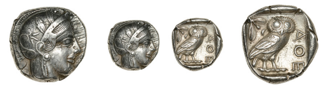
351 ATTICA , Athens , Tetradrachm, c . 449-405, helmeted head of Athena right, rev . owl standing right, olive sprig to left, AΘE to right, all within incuse square, 17.15g (Kroll 8; BMC, Group β, 46 ff ; Sear 2526). Good very fine, reverse better £300-£400