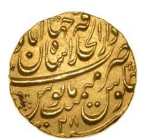
348 Aurangzeb , Mohur, Dar al-Khilafat Shahjahanabad 1096h, yr 28, 10.91g/4h (KM. 315.42; ICV 4284). Extremely fine £500-£700