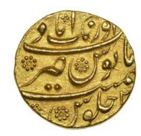
343 Aurangzeb, Mohur, Aurangabad 1088h, yr 2[–], 10.97g/11h (KM. 315.10; ICV 4284). About extremely fine £500-£700