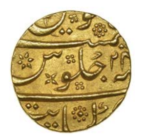
345 Aurangzeb, Mohur, Kanbayat 1092h, yr 24, 11.09g/11h (KM. 315.27; ICV 4284). Extremely fine