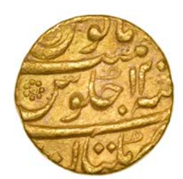
347 Aurangzeb , Mohur, Multan 1080h, yr 12, 10.91g/8h (KM. 315.36; ICV 4284). Test mark and punchmark on edge, otherwise very fine £500-£700