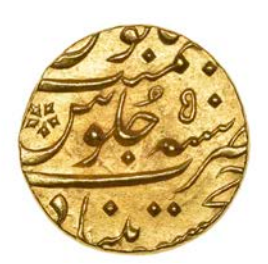
346 Aurangzeb , Mohur, Khujista Bunyad 1117h, yr 50, 10.96g/10h (KM. 315.30; ICV 4284). Good extremely fine £500-£700