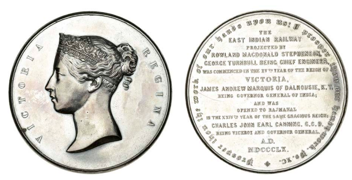
x 466 East Indian Railway Opened to Rajmahal, 1860, a silver medal, unsigned [after W. Wyon, Calcutta mint], coronetted bust of Victoria left, rev. THE EAST INDIAN RAILWAY...GEORGE TURNBULL, etc, 73mm, 96.37g (Pudd. I, 860.2; Moyaux 46; Swan 399). Bright from past cleaning and with a small spot by first 1 of VICTORIA, otherwise good very fine, rare £300-£400 Provenance: DNW Auction M10, 15 March 2011, lot 1628