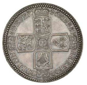
261 Proof Crown, 1746, edge VICESIMO, 30.12g/6h (L & S 7; ESC 1669 [126]; S 3690). Tooled, artificially toned and some surface corrosion, otherwise about extremely fine £2,000-£2,600