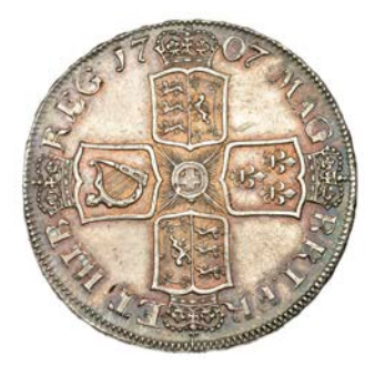
239 Crown, 1707, second bust, plain, edge SEPTIMO (ESC 1344 [104]; S 3601). Minute edge bruises at 3 and 11 o'clock, otherwise extremely fine, lightly toned Provenance: SNC April 2004 (MS 5813)