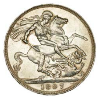
308 Crown, 1897, edge LXI (ESC 2603 [313]; 3937). Fields lightly marked, otherwise nearly extremely fine, lightly toned £200-£260