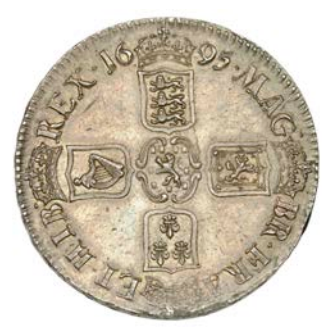
223 Crown, 1695, first bust, edge OCTAVO (ESC 991 [87]; S 3470). Extremely fine, lightly toned