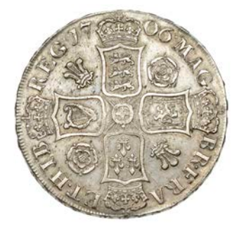
238 Crown, 1706, first bust, roses and plumes, edge QVINTO (ESC 1342 [101]; S 3578). Good very fine, reverse better £1,000-£1,200