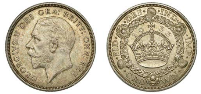
317 Crown, 1933 (ESC 3644 [373]; S 4036). Stained and a small mark on cheek, otherwise about extremely fine £300-£400