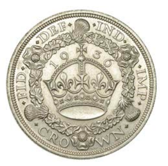
320 Crown, 1936 (ESC 3649 [381]; S 4036). Several small contact marks on obverse, otherwise nearly extremely fine £300-£400