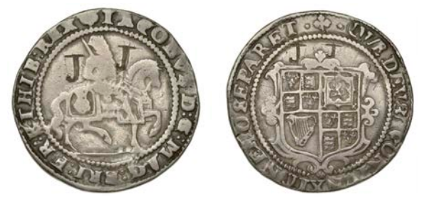
178 Third coinage, Halfcrown, mm. trefoil, 14.86g/1h (N 2122; S 2666). Initials engraved in fields on both sides, otherwise about very fine £150-£180