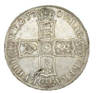
237 Crown, 1703 vigo, edge tertio (ESC 1340 [99]; S 3576). Light flecking on obverse and flan flaw on reverse, otherwise good very fine £600-£800