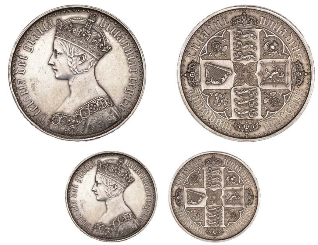
298 Proof 'Gothic' Crown , 1853 , edge DECIMO SEPTIMO, 28.14g/6h (ESC 2584 [293]; S 3884). Obverse fields lightly hairlined, a few minor marks, otherwise good extremely fine, very rare £20,000-£26,000

299 Crown, 1887 (ESC 2585 [296]; S 3921). Nearly extremely fine