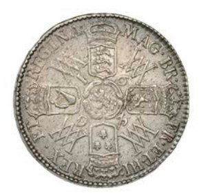
220 Halfcrown, 1693, edge QVINTO (ESC 861 var. [519]; S 3436). Minor flan flecking, otherwise good very fine, toned £500-£600