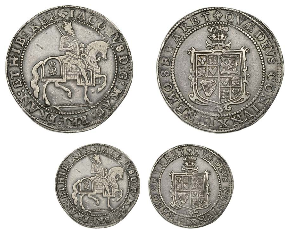
176 Third coinage, Crown, mm. trefoil (over lis on both sides), grassy ground line below horseman, plume over shield, 29.90g/4h (FRC dies X*/XIX* [Sale, lot 36]; N 2121; S 2665). Scratch in obverse field, otherwise good very fine £4,000-£5,000

Provenance: C.J. Boismaison Collection [from R.K. Richardson May 2009]; DNW Auction 142, 13-15 September 2017, lot 838