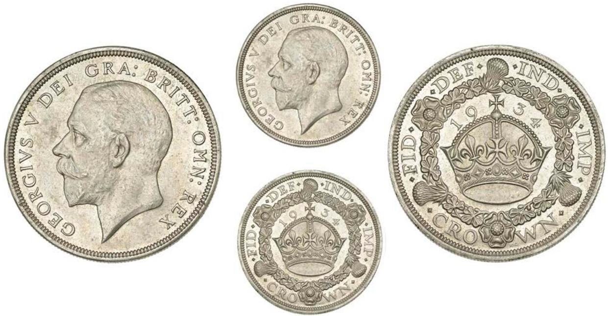
318 Crown, 1934 (ESC 3647 [374]; S 4036). Better than extremely fine, some original brilliance, very rare £3,000-£4,000