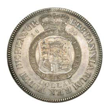
276 Pattern Dollar, 1804, by C.H. Küchler, in silver, types I/3, laureate bust right, rev. shield in Garter, 27.00g/12h (L & S 91; ESC 1963 [182]; Selig 1243-4). Traces of undertype visible, about extremely fine, reverse better, attractively toned £1,200-£1,500