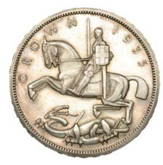
319 Proof Crown, 1935, edge raised xxv, 28.40g/12h (ESC 3655 [378]; S 4050). Fields lightly hairlined, otherwise about as struck