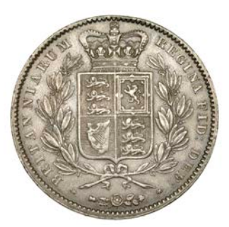
294 Crown, 1845, edge VIII, cinquefoil stops (ESC 2564 [282]; S 3882). Tiny marks on neck and in obverse fields, otherwise extremely fine, lightly toned