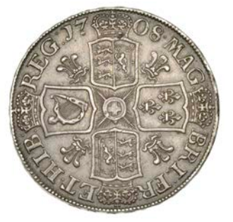
240 Crown, 1708, second bust, plumes, edge SEPTIMO (ESC 1347 [108]; S 3602). Extremely fine, reverse better, dark-toned £1,200-£1,500