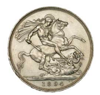
305 Crown, 1894, edge LVII (ESC 2596 [305]; $ 3937). Small contact marks on face and neck, otherwise about extremely fine £120-£150