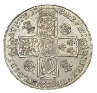
257 Crown, 1735, roses and plumes, edge OCTAVO (ESC 1663 [120]; $ 3686). Minor adjustment marks on reverse, otherwise about extremely fine, lightly toned £1,500-£1,800