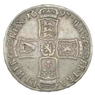
225 Crown, 1697, third bust, edge NONO (ESC 1009 [96]; S 3473). Good fine with attractive dark tone, extremely rare £3,000-£4,000