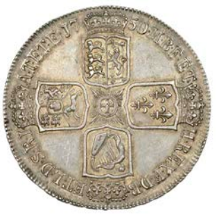
262 Crown, 1750, edge VICESIMO QVARTO (ESC 1670 [127]; S 3690). Nearly extremely fine, light tone