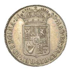
218 Halfcrown, 1689, second shield, caul only frosted, pearls, edge PRIMO, top of caul clearly defined (ESC 842 [510]; S 3435). A few minor marks, otherwise good very fine £500-£600