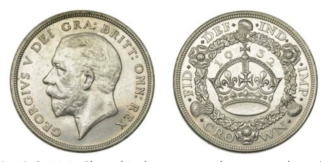
316 Crown, 1932 (ESC 3641 [372]; S 4036). Cleaned in the past, several contact marks on face and neck, otherwise about extremely fine