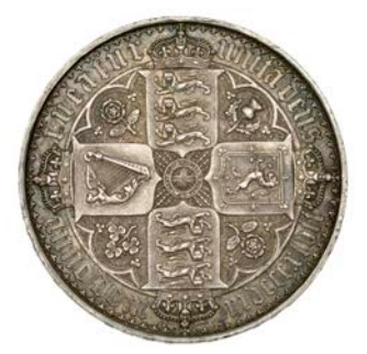
297 'Gothic' Crown, 1847, edge UNDECIMO (ESC 2571 [288]; $ 3883). Fields lightly hairlined, otherwise about extremely fine, dark-toned £2,000-£2,600