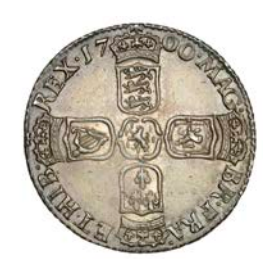
236 Sixpence, 1700, third bust (ESC 1250 [1579]; S 3538). Extremely fine, toned