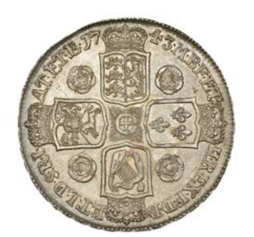
260 Crown, 1743, roses, edge DECIMO SEPTIMO (ESC 1667 [124]; S 3688). Small mark on cheek and a flan flaw on forehead, otherwise extremely fine, toned £2,000-£2,600