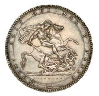
279 Crown, 1818, edge LIX (ESC 2009 [214]; S 3787). Minor marks across face, otherwise nearly extremely fine, toned £300-£400