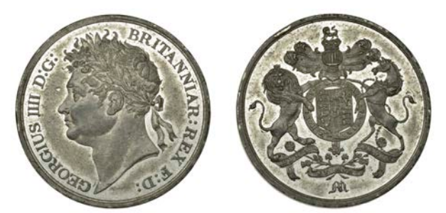
291 Pattern Crown or medal, undated, after B. Pistrucci, in white metal, laureate bust left, rev . royal arms with supporters, no legend, μ in gothic script below, edge plain, 16.03g/12h (L & S 43; ESC 2353 [265a]; cf. BHM 1103). Small dig in obverse field and a small edge bruise on reverse at 11 o'clock, otherwise about extremely fine, extremely rare