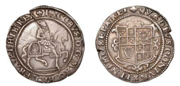
177 Third coinage, Halfcrown, mm. trefoil, 14.85g/10h (N 2122; S 2666). Edge crack, otherwise good very fine, toned £600-£800

Provenance: C.J. Boismaison Collection [from R.K. Richardson May 2009]; DNW Auction 142, 13-15 September 2017, lot 838