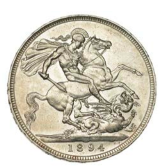
306 Crown, 1894, edge LVIII (ESC 2597 [306]; $ 3937). Small contact marks on face and neck, otherwise nearly extremely fine £150-£180