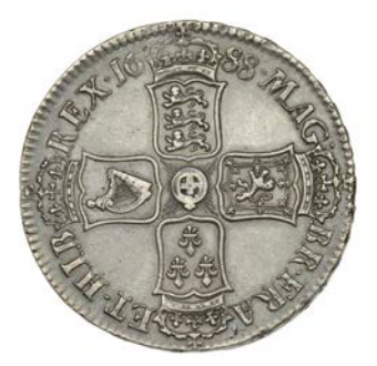
213 Crown, 1688, second bust, edge QVARTO (ESC 746 [80]; S 3407). Previously cleaned, otherwise good very fine £1,200-£1,500