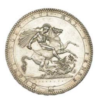
278 Crown, 1818, edge LIX (ESC 2009 [214]; $ 3787). Edge bruise by date, otherwise extremely fine or better, fields proof-like but hairlined