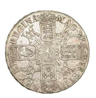
216 Crown, 1691, 1 over E in GVLIELMVS, edge TERTIO (ESC 821 [82B]; S 3433). Very fine