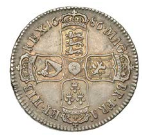
214 Halfcrown, 1686, first bust, edge SECVNDO (ESC 749 [494]; S 3408). Very fine, toned