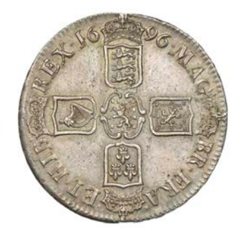
224 Crown, 1696, first bust, edge octavo (ESC 995 [89]; S 3470). Good extremely fine, lightly toned