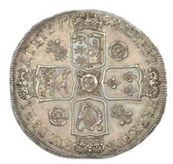
256 Crown, 1732, roses and plumes, edge SEXTO (ESC 1660 [117]; $ 3686). Nearly extremely fine, reverse better, toned £2,000-£2,600