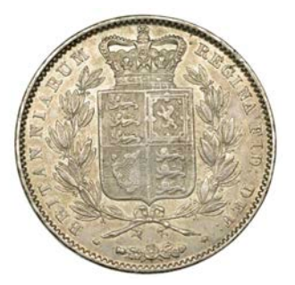
295 Crown, 1845, edge viii, cinquefoil stops (ESC 2564 [282]; S 3882). Good very fine