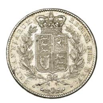
296 Crown, 1847, edge xi (ESC 2567 [286]; S 3882). Small edge bruise at 12 o'clock and some contact marks, otherwise about extremely fine £600-£800