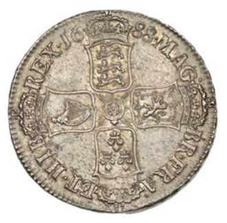
212 Crown, 1688/7, second bust, edge QVARTO (ESC 747 [81]; S 3407). Minor flecking and weak in places, otherwise extremely fine or better, toned £4,000-£5,000