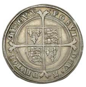
167 Third period, Fine issue, Halfcrown, 1551, mm. y, 14.91g/2h (N 1934; S 2479). Very fine, toned Provenance: H.M. Lingford Collection [from Baldwin October 1946]