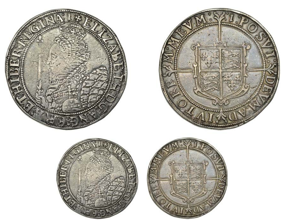
168 Seventh issue, Crown, mm. 1, sceptre points to G of REGINA, 29.64g/1h (FRC A-2 [Sale, lot 2]; N 2012; S 2582). Minute surface cracking, otherwise very fine and toned, the variety very rare £3,000-£4,000