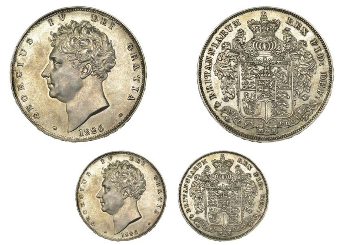
290 Proof Crown, 1826, edge SEPTIMO, 28.15g/6h (L & S 28; ESC 2336 [257]; S 3806). Previously cleaned, and now re-toning, small edge bruise at 10 o'clock, otherwise nearly extremely fine £5,000-£6,000