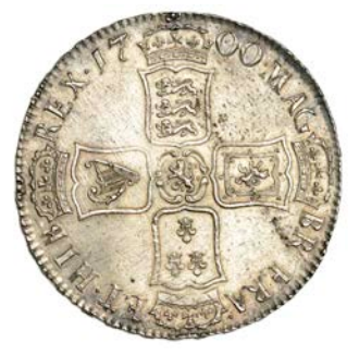
226 Crown, 1700, third bust variety, edge DVODECIMO (ESC 1010 [97]; S 3474). Light hairlines in fields, otherwise good extremely fine