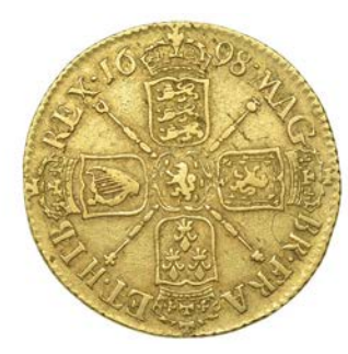
222 Guinea, 1698, second bust, elephant and castle (MCE 181; S 3461). Traces of mounting on edge, otherwise very fine, rare £3,000-£4,000