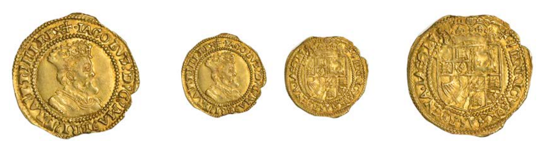
108 Britain Crown, mm. plain cross, fifth bust, 2.47g/6h (SCBI Schneider 56; N 2092; S 2626). Traces of creasing, otherwise better than very fine