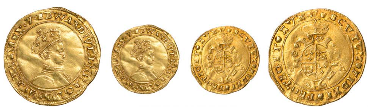
39 Half-Sovereign, Southwark, mm. Y, crowned bust, 5.38g/3h (SCBI Schneider 687; N 1911; S 2438). Somewhat creased, otherwise very fine or better £4,000-£5,000