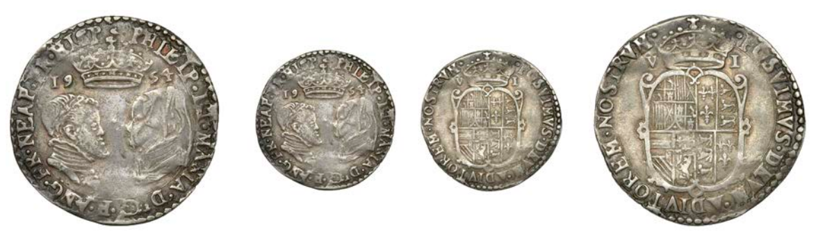
58 Sixpence, 1554, full titles, reads 1954, 2.90g/12h (N 1970; S 2505). Lightly creased, otherwise about very fine and toned, the error date clear and very rare £1,200-£1,500 Provenance: J.R. Hulett Collection Part I, DNW Auction 142, 13-15 September 2017, lot 408 [from B. Reeds September 1992]