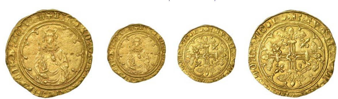
152 Hardi d'or, Bordeaux, lion in first and fourth quarters, colon stops on obv. , rosettes on rev. , 3.73g/1h (W 270B; E 223a; S 8140). Slightly off-centre, otherwise about very fine and very rare £3,000-£3,600