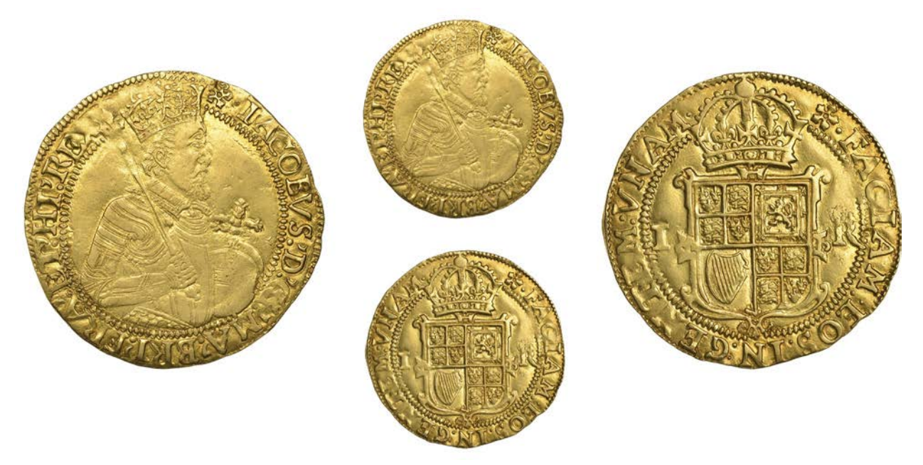
105 Unite, mm. cinquefoil, fifth bust, 9.91g/5h (SCBI Schneider 28; N 2085; S 2620). Obverse nearly very fine and slightly double-struck, reverse better £1,000-£1,200