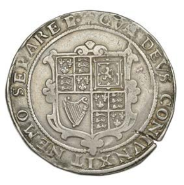
123 Crown, mm. lis, 29.60g/1h (FRC dies X/XVIII [Sale, lot 33]; N 2120; S 2664). Nearly very fine, toned