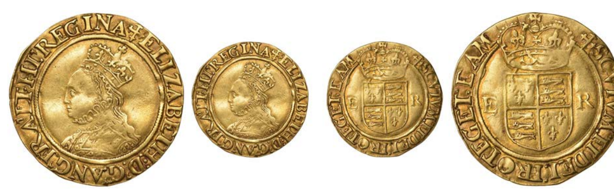
70 Half-Pound, mm. cross-crosslet, bust 3C, reads fra et hi and proteget, 5.23g/6h (Brown/Comber G5/G6; SCBI Schneider 738; N 1982; S 2520). Lightly creased, otherwise about very fine £2,400-£3,000