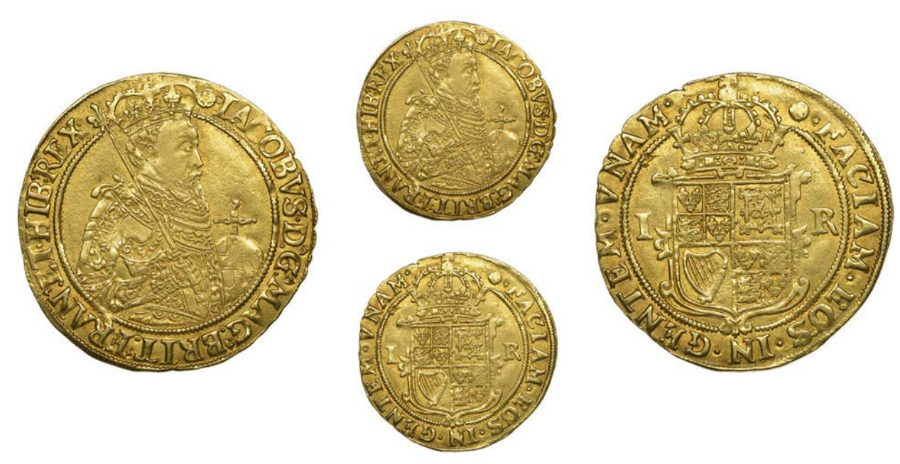
104 Unite, mm. rose, second bust, 9.92g/11h ( cf. SCBI Schneider 22-3; N 2083; S 2618). Better than very fine £1,500-£1,800