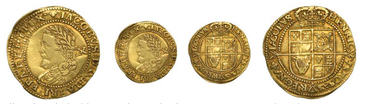
121 Half-Laurel, mm. lis, fourth bust, 4.45g/8h (SCBI Schneider 91; N 2117; S 2641A). Nearly very fine