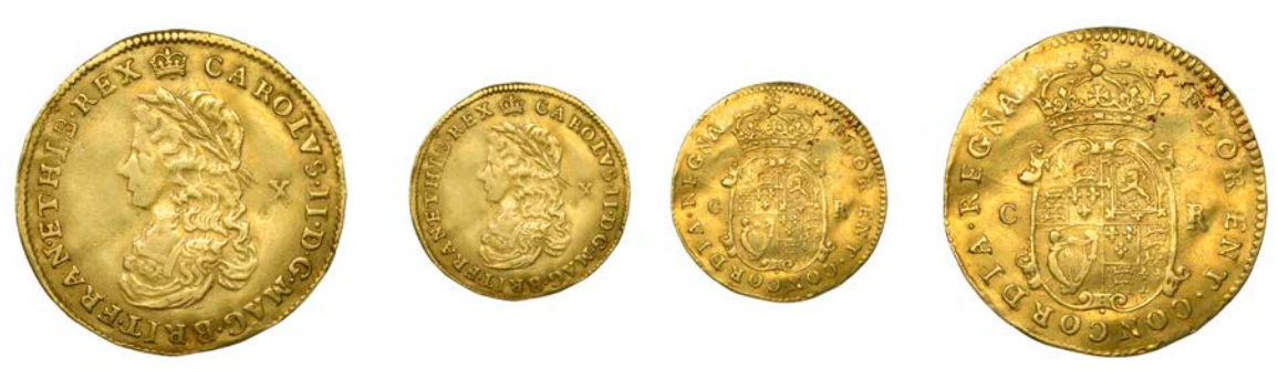
136 Double-Crown, mm. crown on obv . only, 4.41g/4h (Schneider O3/R5; SCBI Schneider 417, same dies; N 2756; S 3305). Some light crease marks, otherwise nearly very fine £2,000-£2,400 Provenance : Spink Auction 212, 28-9 March 2012, lot 533