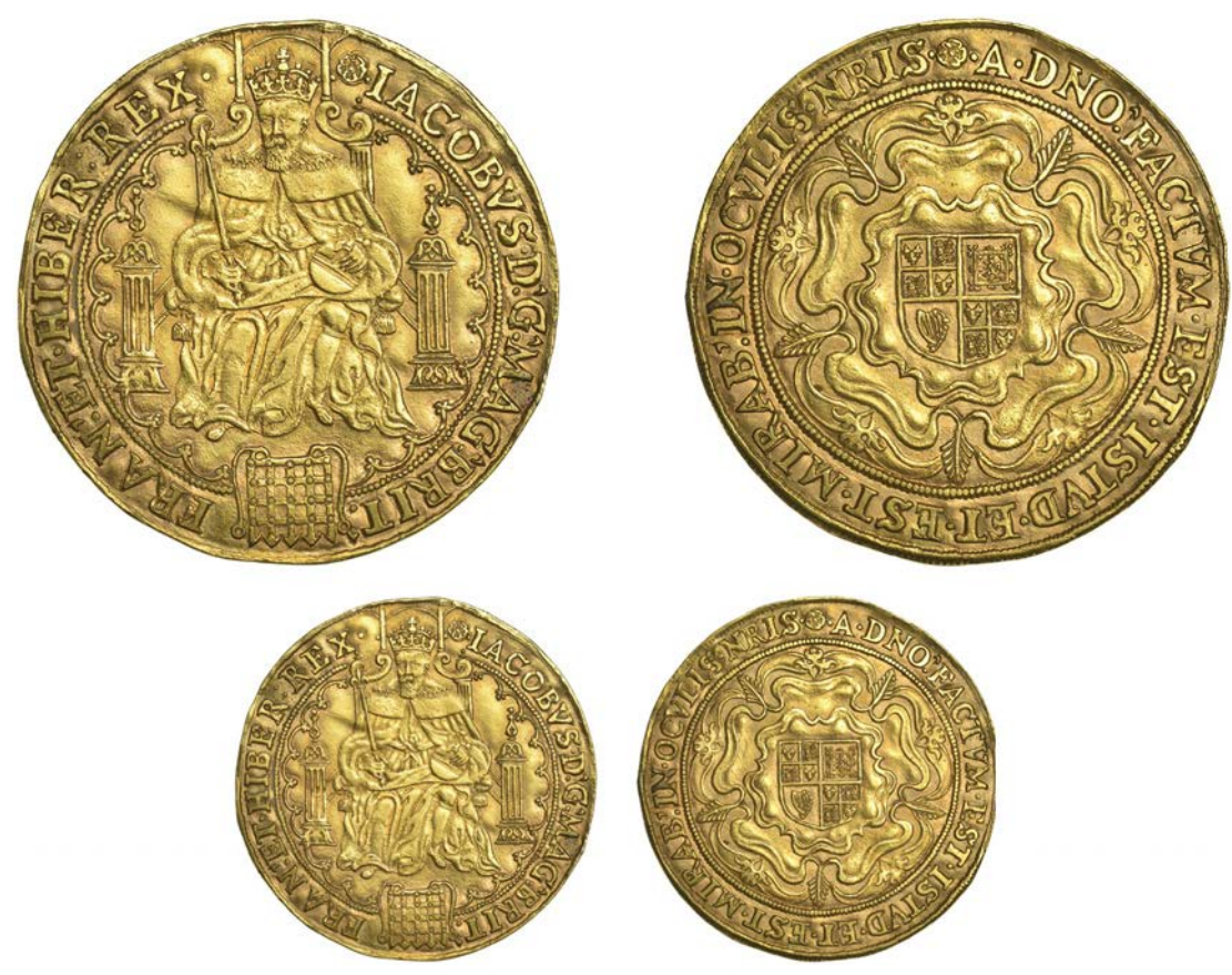
103 Rose Ryal, mm. rose, 13.73g/11h (Stewartby dies Aa; SCBI Schneider 6, same dies; N 2079; S 2613). Probably removed from a ring mount, otherwise better than very fine £5,000-£6,000