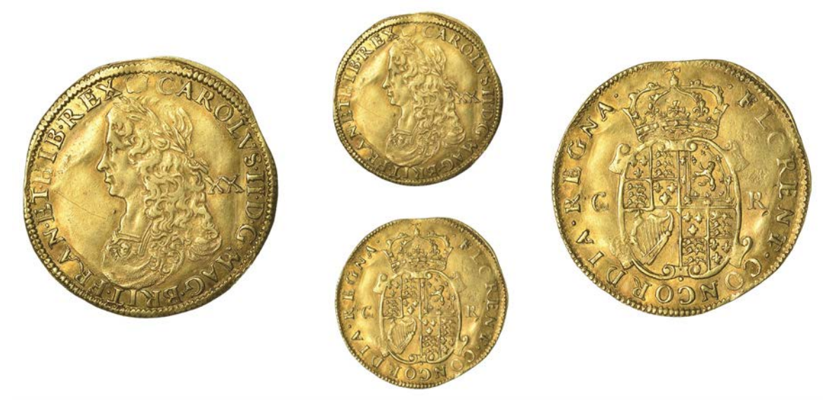
135 Unite, mm. crown on obv . only, 8.88g/10h (Schneider dies O7/R11; SCBI Schneider 404, same dies [see note on rev . die]; N 2754; S 3304). Slightly creased and with a light scratch in obverse field, otherwise nearly very fine, reverse better £2,400-£3,000