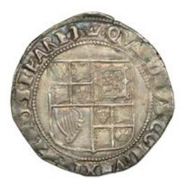
114 Shilling, mm. coronet, fifth bust, 6.04g/7h (N 2101; S 2656). Nearly extremely fine with old cabinet tone Provenance: English Hammered Coins from a Private Collection, DNW Auction 104, 5 December 2012, lot 245