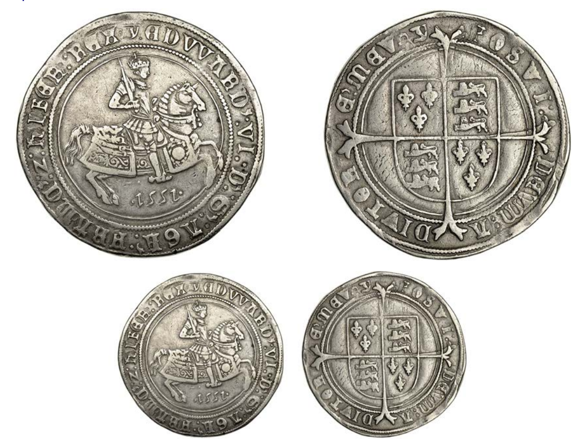
45 Crown, 1551, mm. y, reads FRANC' z : HIBER, 30.96g/9h (Lingford dies A-4; N 1933; S 2478). Nearly very fine £1,200-£1,500