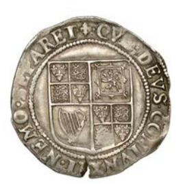
112 Shilling, mm. lis, third bust, 6.00g/1h (N 2099; S 2654). Small striking split, otherwise very fine or better Provenance: DNW Auction 106, 6 February 2013, lot 446

113 Shilling, mm. escallop, fourth bust, 5.90g/9h (N 2100; S 2655). Nearly very fine, reverse a little better