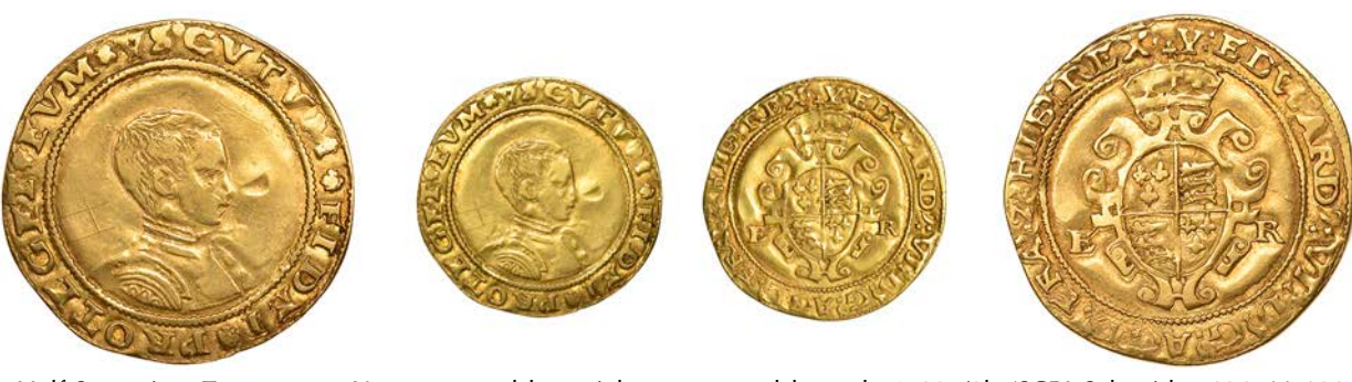
38 Half-Sovereign, Tower, mm. Y, uncrowned bust right, transposed legends, 5.02g/8h (SCBI Schneider 686; N 1908; S 2435). Dent before face and graffiti behind head, otherwise about very fine but sometime lightly cleaned £2,400-£3,000 Provenance: St james's Auction 38, 29 September 2016, lot 214