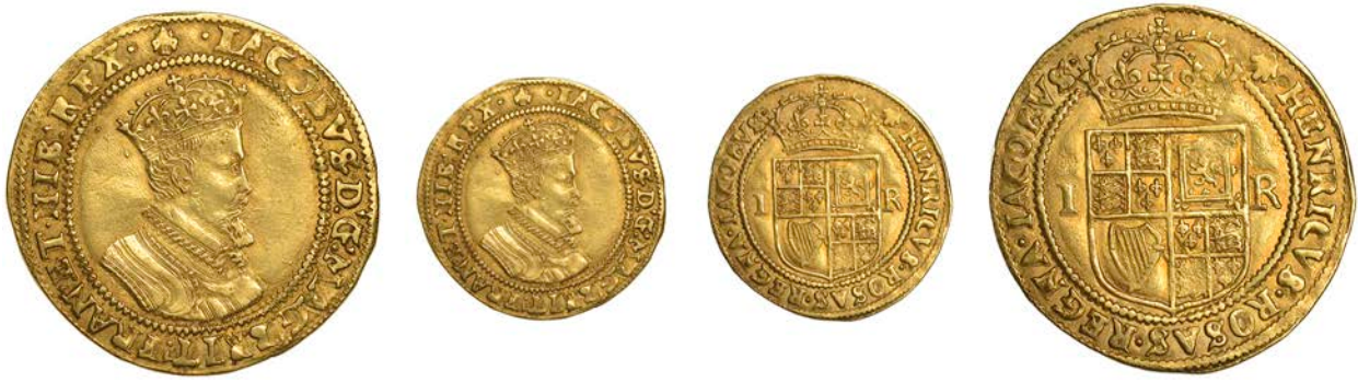
106 Double-Crown, mm. escallop (over rose on obv .?), fourth bust, 4.89g/10h (SCBI Schneider 33; N 2087; S 2622). Full and round, better than very fine #1,200-£1,500 Provenance: 'Glenister' Collection, Spink Auction 222, 26-7 March 2014, lot 1600