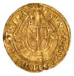
86 Half-Angel, mm. bell (over sword both sides), 2.51g/6h (Brown/Comber D11 var.; RCL 1973 same dies [mm. sword] and 4386 [= Clonterbrook 176] same dies [mm. bell over sword both sides]; cf. SCBI Schneider 791; N 2006; S 2532). Cracked, otherwise fine to very fine, rare £500-£700 Provenance: W. Wilkinson Collection, DNW Auction 163, 18-19 September 2019, lot 1405 [from J. Duggan July 1979]