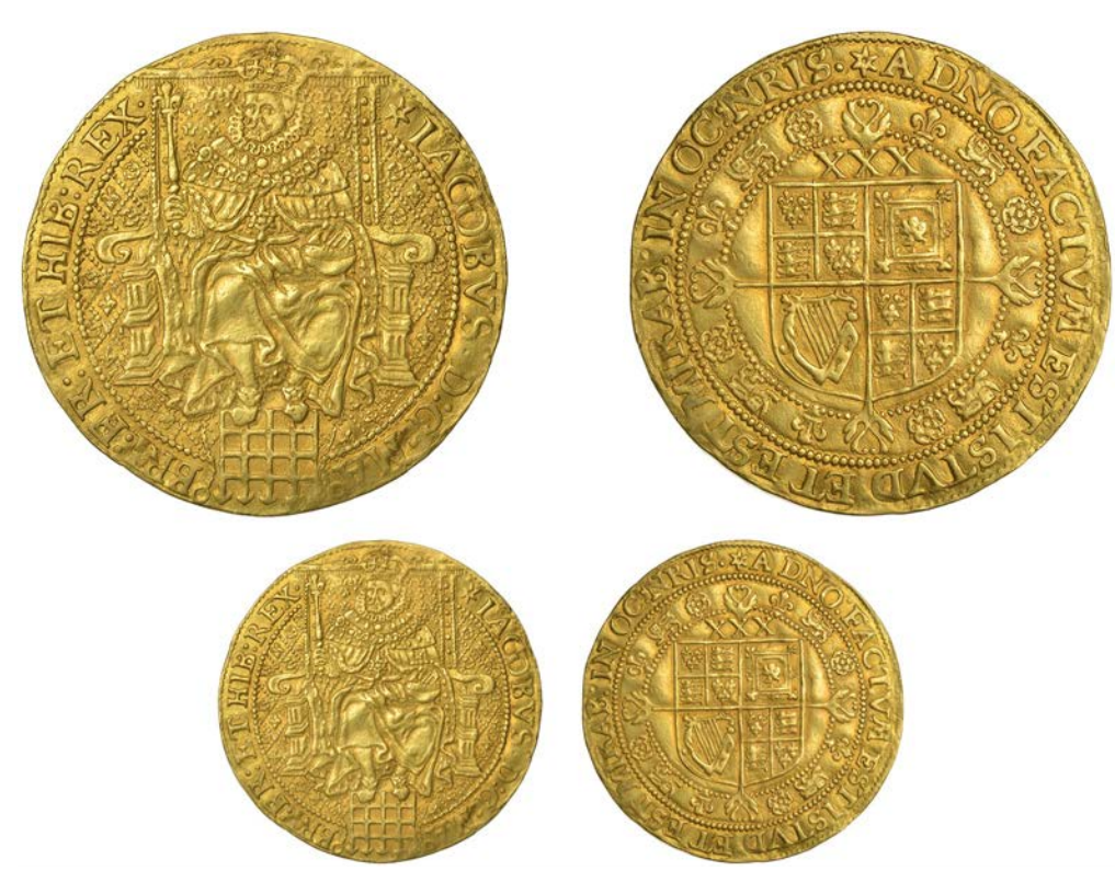
118 Rose Ryal, mm. spur rowel, 12.04g/4h (SCBI Schneider 77, same dies; N 2108; S 2632). Repaired above crown, otherwise very fine or better Provenance: Künker Auktion 151 (Osnabrück), 11 March 2009, lot 4168