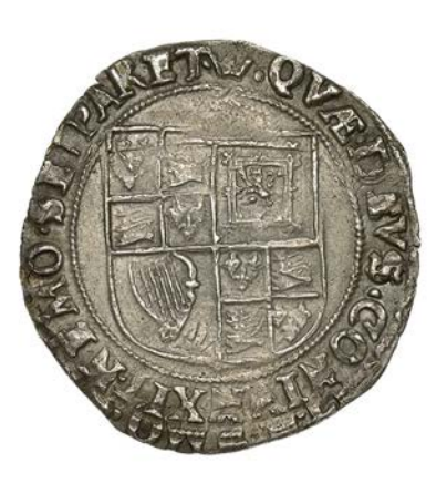
115 Shilling, mm. coronet, fifth bust variety, 5.72g/2h (N 2101; S 2656). Slightly double-struck, otherwise nearly extremely fine but surfaces marked and a little rough, rare £200-£300 Provenance: J.R. Hulett Collection, Part VII, DNW Auction 152, 14-15 November 2018, lot 454 [from Seaby 1968]

116 Sixpence, 1605, mm. rose, third bust, 2.93g/5h (N 2102; S 2657). About very fine