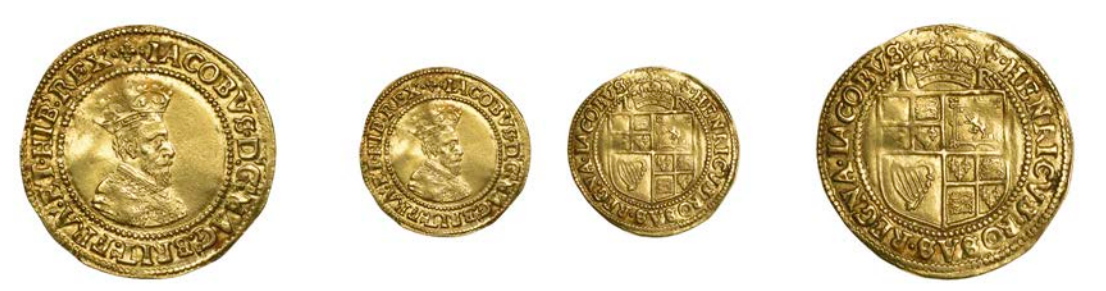
107 Britain Crown, mm. lis, first bust, 2.54g/3h (SCBI Schneider 43-4; N 2090; S 2624). Full and round, better than very fine but creased and sometime cleaned £400-£500