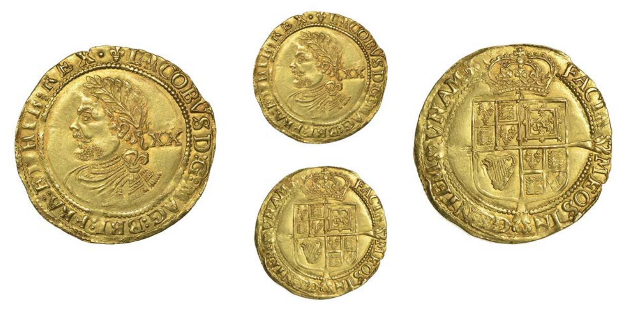
119 Laurel, mm. lis, fourth bust, 9.02g/9h (SCBI Schneider 86; N 2114; S 2638C). Nearly extremely fine with a bold portrait £2,000-£2,400