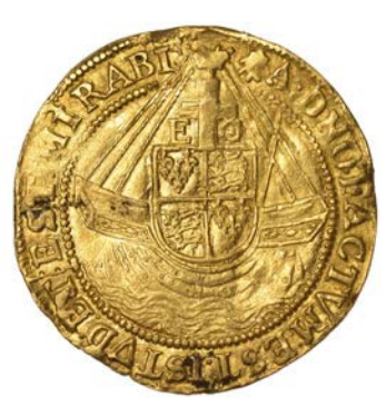
85 Angel, mm. escallop, 5.10g/3h (Brown/Comber C33; SCBI Schneider 788; N 2005; S 2531). Slightly creased and weak in places, otherwise good very fine £2,000-£2,600