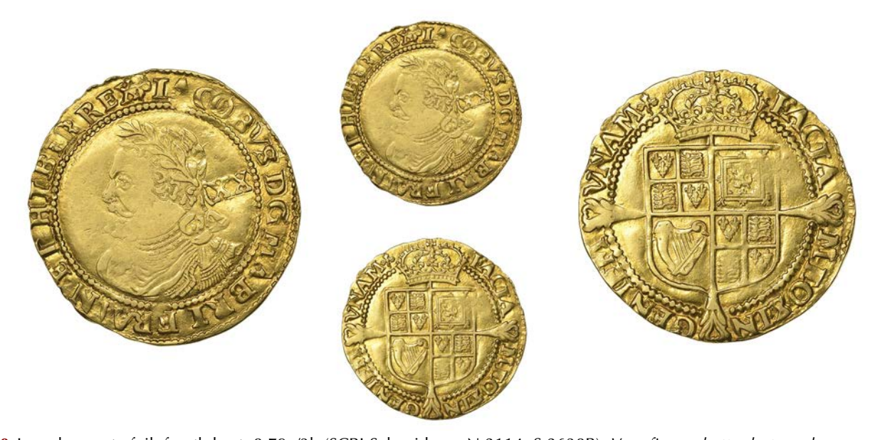
120 Laurel, mm. trefoil, fourth bust, 8.79g/3h (SCBI Schneider \rightarrow ; N 2114; S 2638B). Very fine or better but weak on portrait £1,000-£1,200