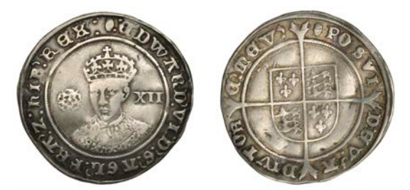
47 Shilling, mm. tun, 6.19g/3h (N 1937; S 2482). A few surface marks on reverse, otherwise good fine or better £150-£200