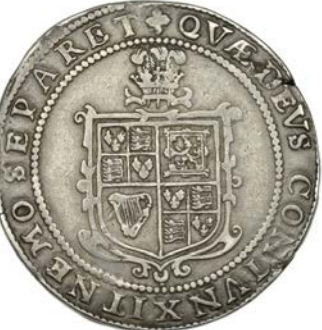
124 Crown, mm. trefoil over lis, from the same obv . die as previous, plume over shield, 29.59g/3h (FRC dies X*/XIX* [Sale, lot 36]; N 2121; S 2665). Nearly very fine, toned