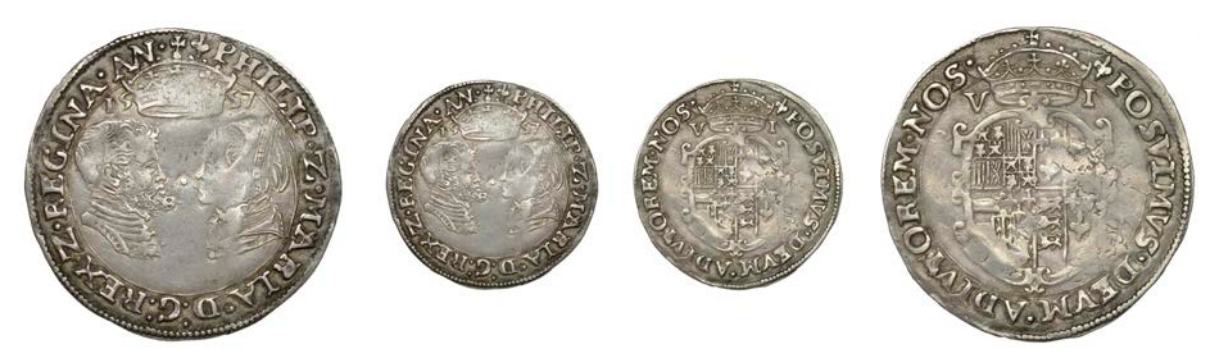
60 Sixpence, 1557, mm. lis, English titles, reads AN and NOS, 3.10g/8h (N 1971; S 2506). Very fine, toned Provenance: Bt Spink 1992 £400-£500