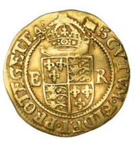
88 Crown, mm. woolpack, bust 7C, 2.55g/10h (Brown/Comber H15; SCBI Schneider 814; N 2010; S 2536). Fine £1,000-£1,200