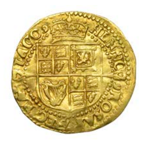
122 Quarter-Laurel, mm. trefoil, fourth bust, beaded inner circle on both sides, 2.15g/5h (cf. SCBI Schneider 99; N 2118; S 2642B). Better than very fine