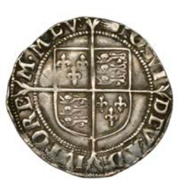
89 Shilling, mm. hand, bust 6B, 6.07g/9h (N 2014; S 2577). Some surface marks, otherwise better than very fine £200-£260