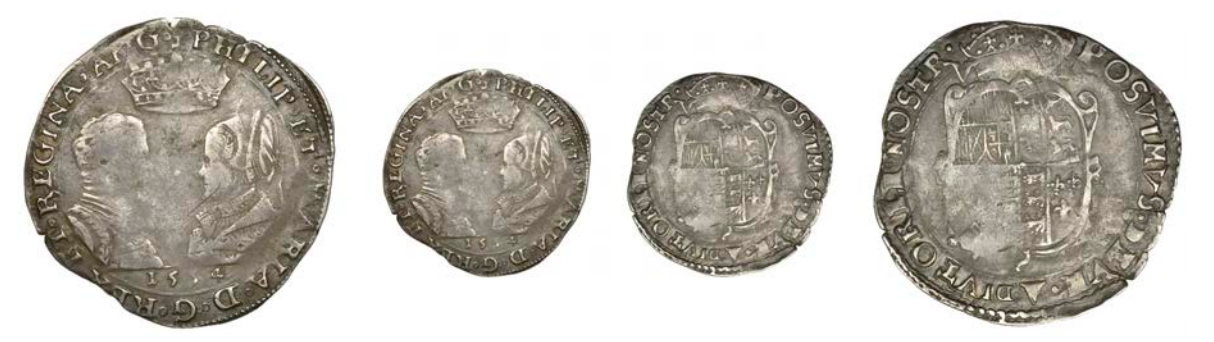
59 Sixpence, 1554, English titles, date below busts, reads NOSTR, annulet stops, 2.92g/7h (N 1972; S 2507). Centres weak, otherwise fine, very rare £1,200-£1,500 Provenance: H.H. Snellenburg Jr Collection; S.A. Bole Collection, Part I, DNW Auction 89, 29 September 2010, lot 1456 [from Spink November 1966]; DNW Auction 102, 18 September 2012, lot 2475