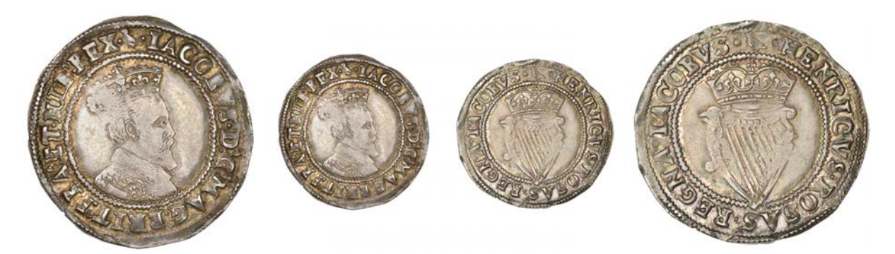
140 Second coinage, Shilling, mm. martlet, third bust, 4.40g/9h (S 6515; DF 261). On a full flan, very fine and attractively toned £200-£300 Provenance: Bt Spink

141 Second coinage, Shilling, mm. rose, third bust, 4.27g/4h (S 6515; DF 261). Nearly very fine£120-£150