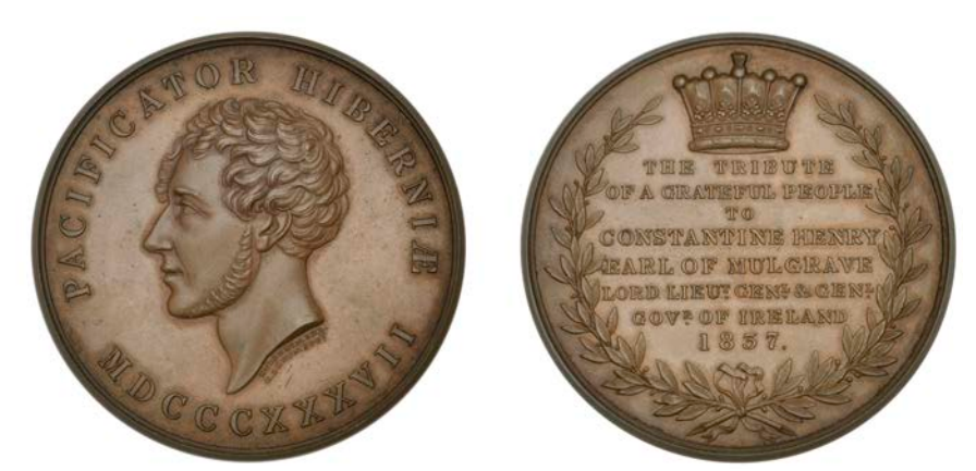
339 Earl of Mulgrave , 1837, a copper medal by G. Brown [after B. Mulrenin], bust left, rev. crown over legend within wreath, 51mm (BHM 1750; E 1299). Extremely fine, scarce Provenance : DNW Auction 66, 6 July 2005, lot 1286

Provenance: Baldwin Auction, 7 February 2004, lot 505