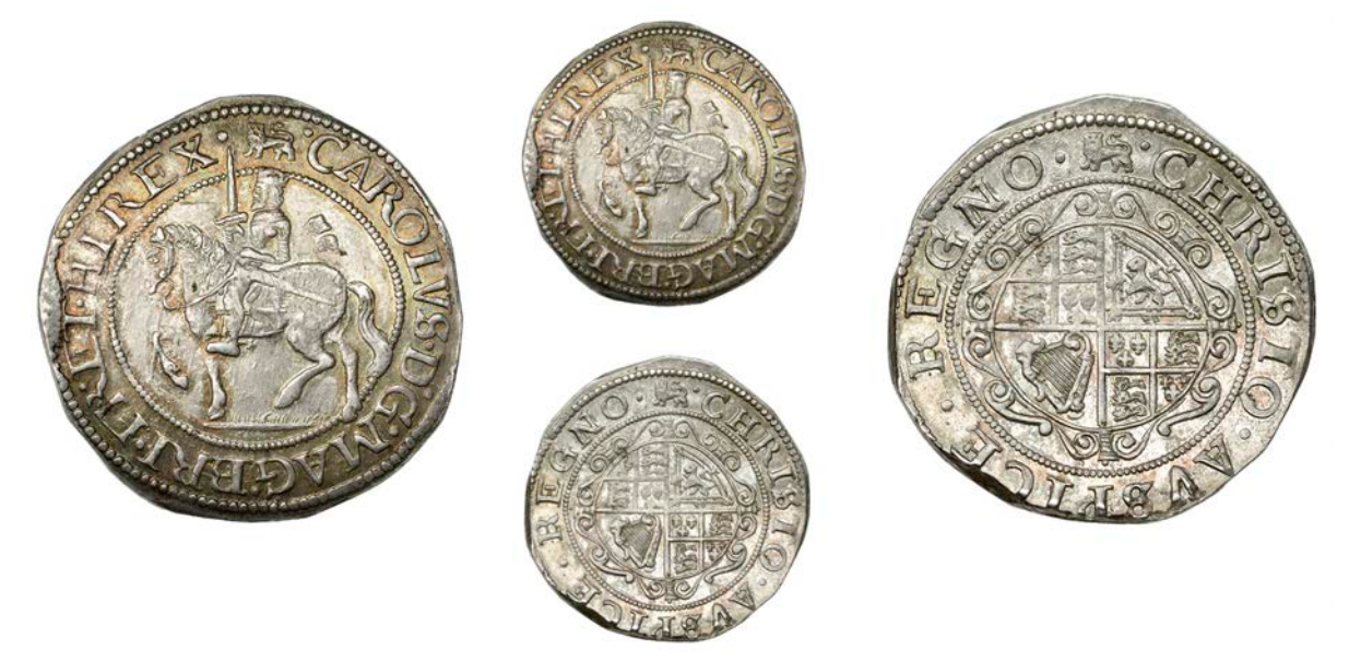
105 Halfcrown, Gp 1 [type 2], mm. lion, grassy ground line, oval garnished shield, 13.81g/12h (Bull 552, this coin; Besly 1C; SCBI Brooker 1077, same dies; N 2310; S 2864). Extremely fine or better with original mint bloom, an exceptional specimen £2,400-£3,000