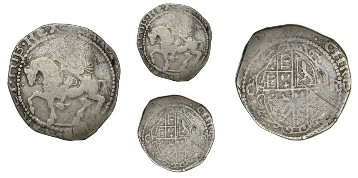
189 Charles I, Confederate Catholics, 'Blacksmith's' issue, Halfcrown, mm. not visible, no cross on housings, with ground line, 12.41g/8h (Bull 30 (L-7-2-7); S 6557A; DF 335). Some old scratches, otherwise fair to fine, rare £400-£500