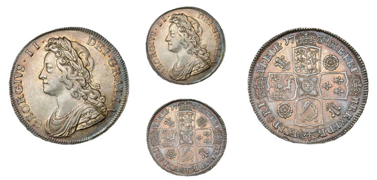
157 Halfcrown, 1732, roses and plumes, edge SEXTO (ESC 1675 [596]; S 3692). Good very fine, toned