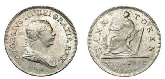
191 George III, Bank of Ireland coinage, Thirty Pence, 1808 (S 6616). About extremely fine