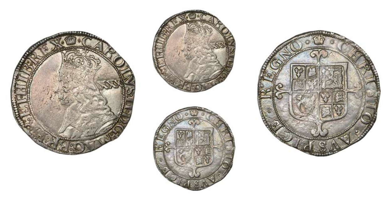
126 Third Hammered issue, Halfcrown, mm. crown, with mark of value and inner circles, reads MAG BR FR, 14.97g/3h (ESC 302 [456]; N 2761; S 3321). Bust weakly struck, otherwise about extremely fine **E600-£800** Provenance: Bt Baldwin December 1975