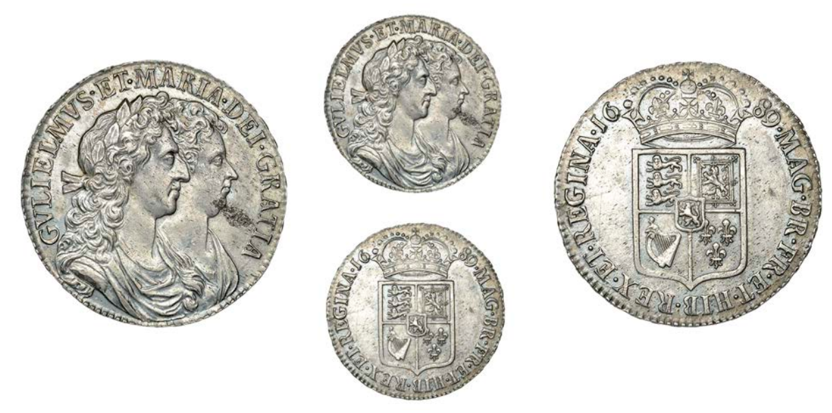
133 Halfcrown, 1689, first shield, caul and interior frosted, pearls, edge PRIMO (ESC 826 [503]; S 3434). Flan flaw on obverse, otherwise extremely fine