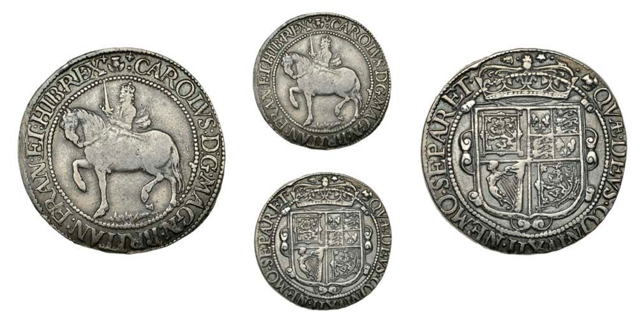
186 Charles I , Third coinage, Falconer's Second issue, Thirty Shillings, mm. leaved thistle (with cross and pellet each side on obv. ), rough ground line, F below hoof, F and star over crown, 14.75g/6h (Bull 10; Murray 3; SCBI 35, 1499, same dies; B 41; S 5556A). About very fine £200-£300