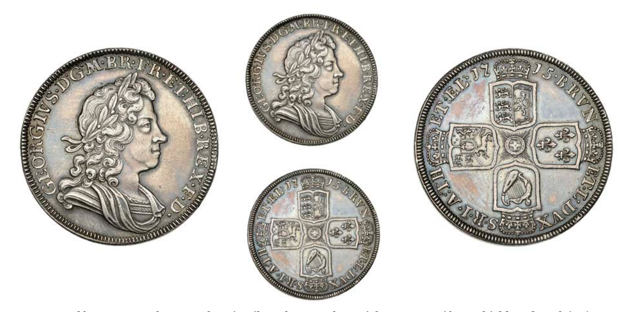
152 Pattern Halfcrown, 1715, by J. Croker, in silver, laureate bust right, rev. cruciform shields, edge plain (ESC 1549 [586]; S 3641). Cleaned at one time but now re-toned, scratched in obverse field and on edge and with some minor marks, otherwise about extremely fine, extremely rare £3,000-£4,000