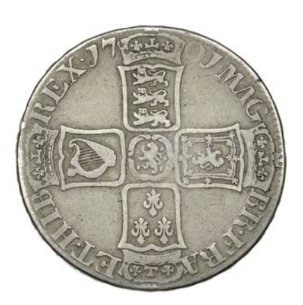
142 Halfcrown, 1701, elephant and castle, edge DECIMO TERTIO (ESC 1050 [566]; S 3495). Fine, extremely rare