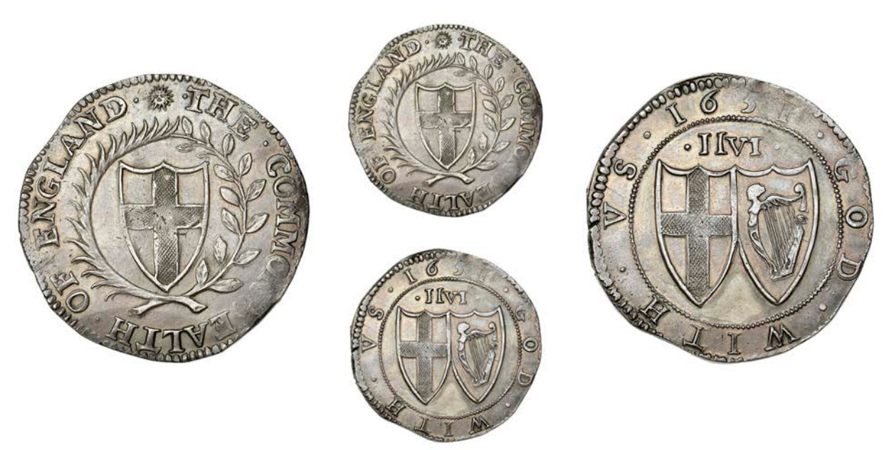
121 Halfcrown, 1651, mm. sun on obv . only, no central stop in mark of value, 15.07g/7h (ESC 22 [426B]; N 2722; S 3215). Good very fine, toned £800-£1,000 Provenance : Bt Spink 1967