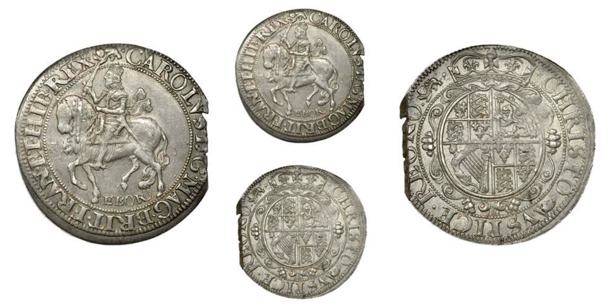
108 Halfcrown, Gp 2 [type 7], mm. lion, horse with tail between legs, ebor below, crowned oval shield, 13.96g/12h (Bull 562; Besly 2G; SCBI Brooker 1086; N 2315; S 2869). Flan defect from 2 to 4 o'clock, otherwise nearly extremely fine, toned

The vendor's ticket states 'Lockett 2372'. Comparison with the illustration in the Lockett sale catalogue clearly demonstrates that it is not this coin and such a ticket should be correctly allied to SCBI Brooker 1088A