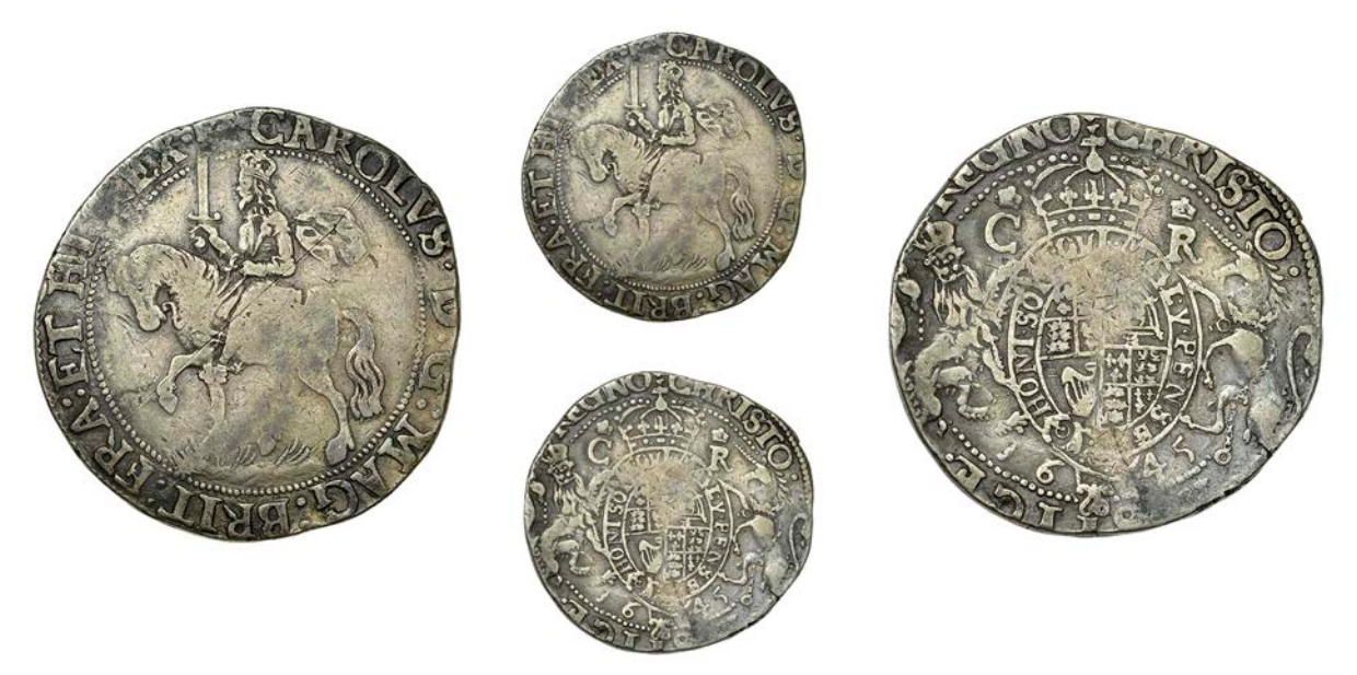
102 Halfcrown, 1645, King on horseback left, oval shield within Garter, supported by lion and unicorn, crown and small crowned c R above, date below, 14.04g/8h (Bull 683/62 (62-4); N 2359; S 2915). Struck in base-looking silver, old scratch across obverse, otherwise nearly very fine for this extremely rare issue £5,000-£7,000 Provenance: Bt Spink 1980