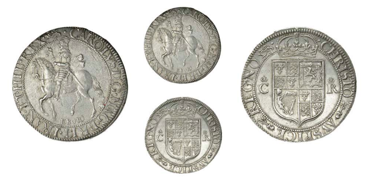
Halfcrown, Gp 3 [type 5], mm. lion, tall horseman, tail behind legs, ebor below horse, crowned square-topped shield, crowned c r at sides, 15.05g/12h (Bull 568, this coin; Besly 3A; SCBI Brooker 1081, same dies; N 2313; S 2867). Nearly extremely fine, rare £1,000-£1,200