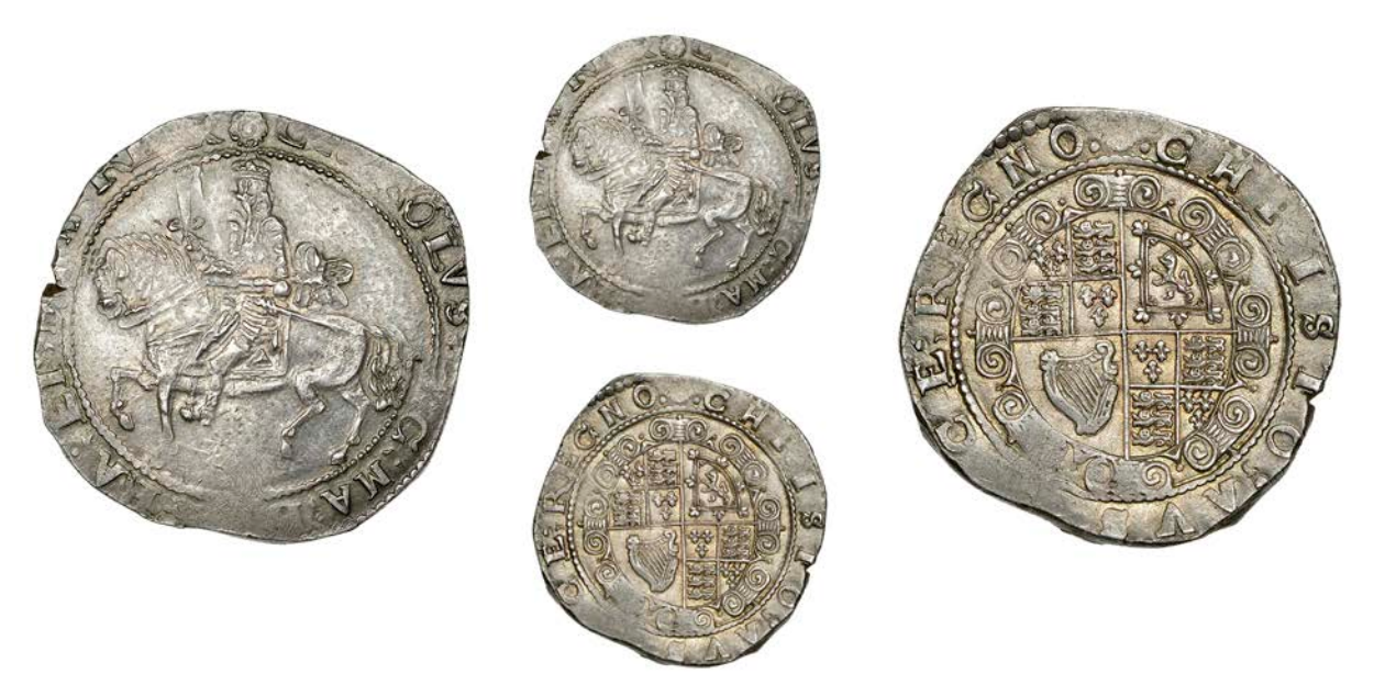
77 Halfcrown, mm. rose, large equestrian portrait, walking horse, oval garnished shield, 13.86g/11h (Bull 660/11 (45a -35); Besly J11; SCBI Brooker 1028; N 2549; S 3064). On an irregular flan typical of the issue, nearly extremely fine, attractively toned