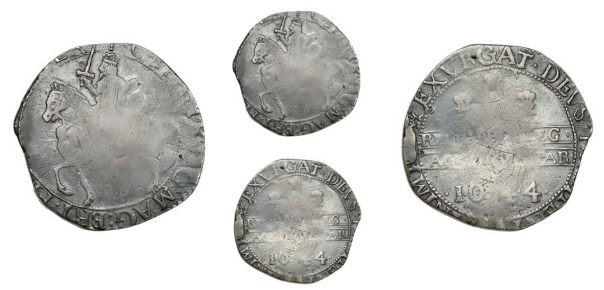
113 Halfcrown, 1644, mm. sword erect between three gerbs on obv. , plume on rev. , horseman left, Declaration in two lines, three plumes above, date below, between pellets, 11.46g/12h (Bull 577 (D14-6); Lyall C/3; SCBI Brooker 1112, same dies; N 2630; S 3133). Numerous surface scratches, otherwise fair, rare #300-£400 Provenance: Bt N. Wales Coins 1973