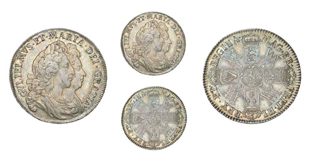
Halfcrown, 1693, edge QVINTO (ESC 860 [519]; S 3436). Minor wear on high points, otherwise extremely fine or better, attractively toned \pounds 2,000-\pounds 2,600