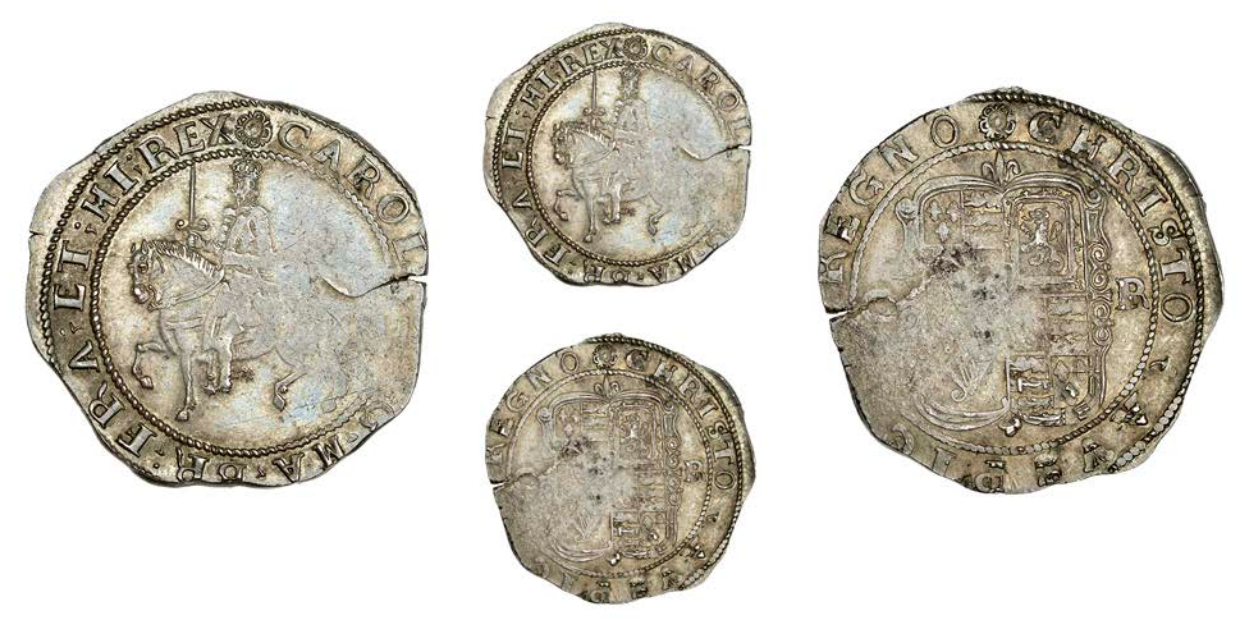
76 Halfcrown, mm. rose, King on trotting horse left, oblong scroll-garnished shield, crat sides, 14.30g/12h (Bull 658/6 (66-2); Besly H6; SCBI Brooker 1017; N 2538; S 3052). Partly flat, otherwise nearly extremely fine, lightly toned £2,000-£2,600