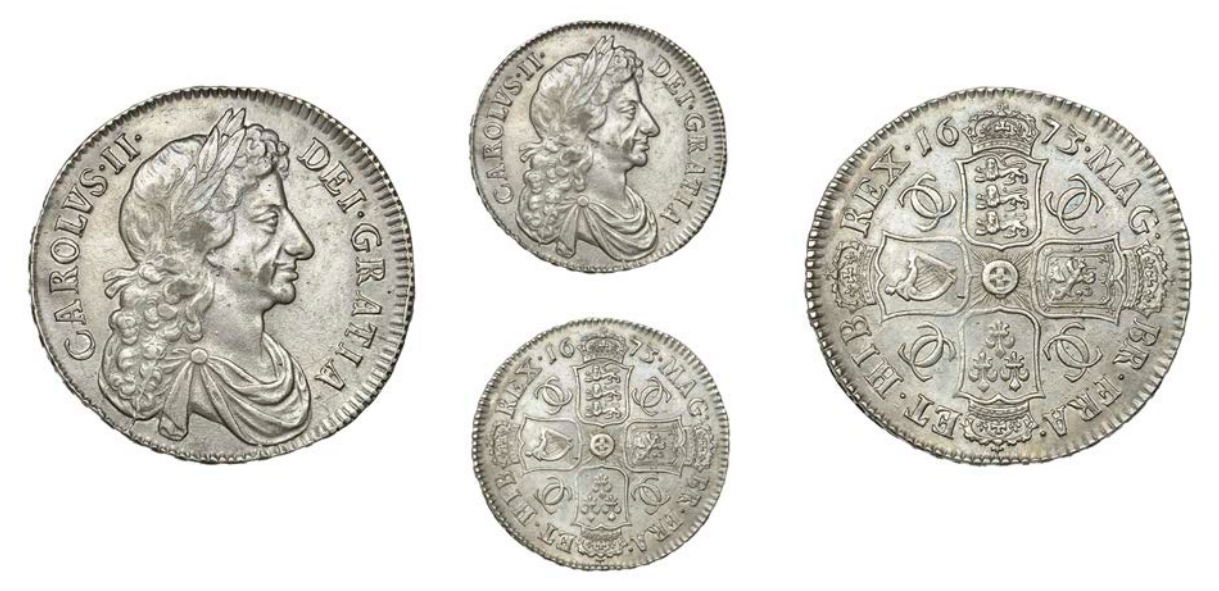
129 Halfcrown, 1673, fourth bust, edge vicesimo qvinto (ESC 463 [473]; S 3367). Good very fine