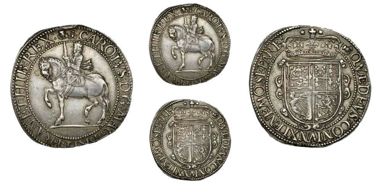
185 Charles I , Third coinage, Falconer's Second issue, Thirty Shillings, mm. two leaved thistles (large and small), F by horse's hoof, smooth ground line, two small stars above crown, 14.99g/6h (Bull 15; Murray 4; cf. SCBI 35, 1492-4; B 38; S 5555). Edge flaw at 12 o'clock, otherwise better than very fine £400-£500