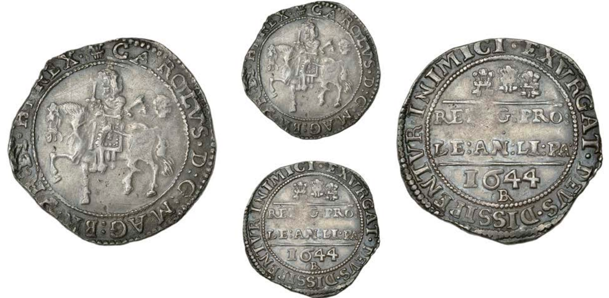
67 Halfcrown, 1644, mm. Bristol plume on obv. only, Bristol horseman, Bristol plume behind, three Bristol plumes above Declaration, date and BR monogram below, 14.34g/10h (Bull 641/4 (D21-2b), this coin; Morr. B-4; SCBI Brooker 981; N 2490; S 3008). Good very fine and toned, but faint old scratches by King's head £700-£900 Provenance: H.M. Lingford Collection; bt Baldwin 1993