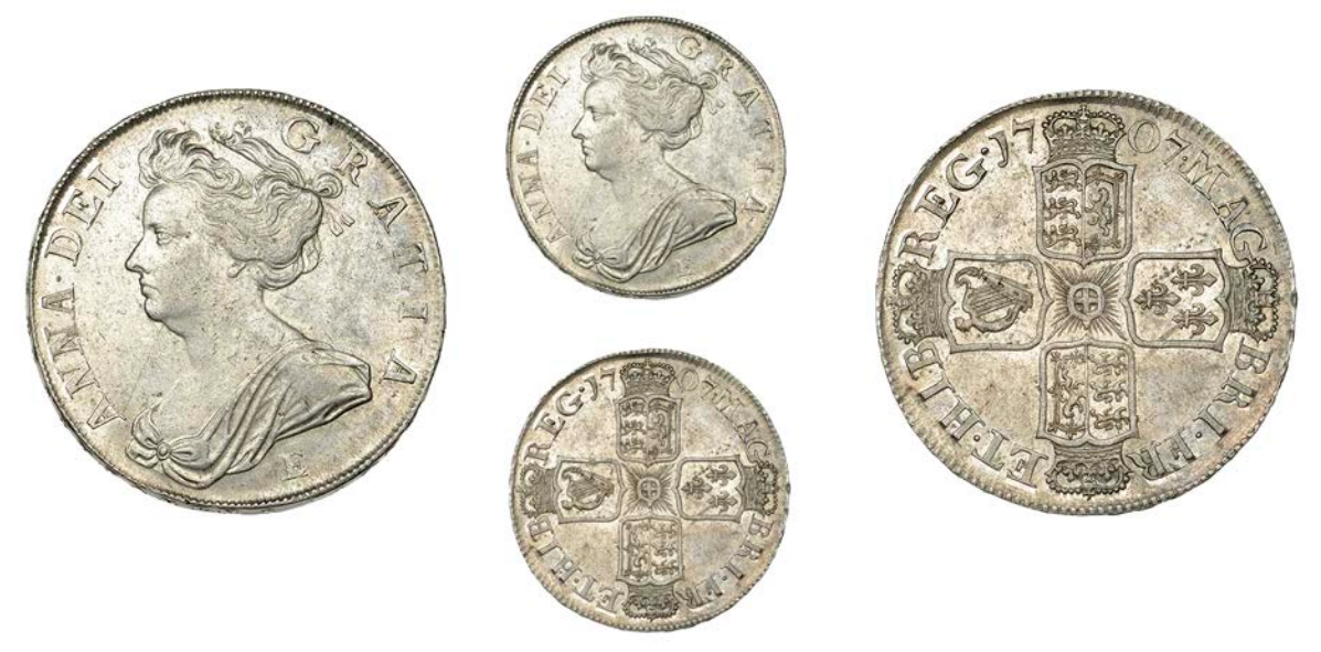
148 Halfcrown, 1707E, edge SEXTO (ESC 1379 [575]; S 3605). Some contact marks, otherwise extremely fine £400-£500