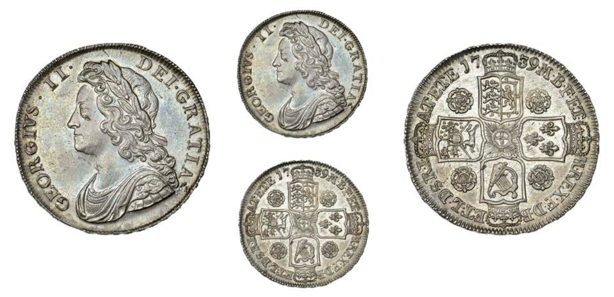
158 Halfcrown, 1739, roses, edge DVODECIMO (ESC 1679 [600]; S 3693). Extremely fine