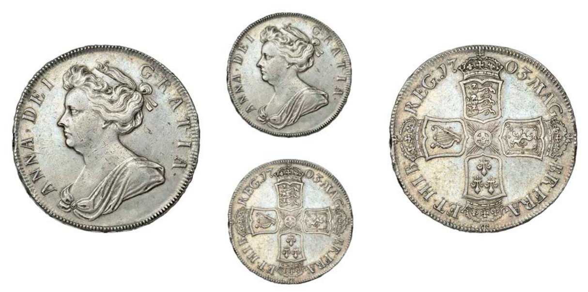
144 Halfcrown, 1703, edge TERTIO (ESC 1357 [568]; S 3579). Some contact marks, otherwise good very fine, very rare \pounds 2,000-\pounds 2,600