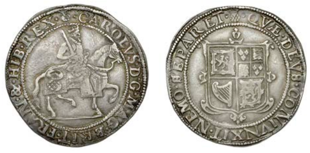
182 Charles I, First coinage, Thirty Shillings, mm. large thistle-head, 14.91g/7h (Bull 3c/L7; Murray pl. iii, 13; SCBI 35, 1412; B 2, fig. 997; S 5541). Very fine