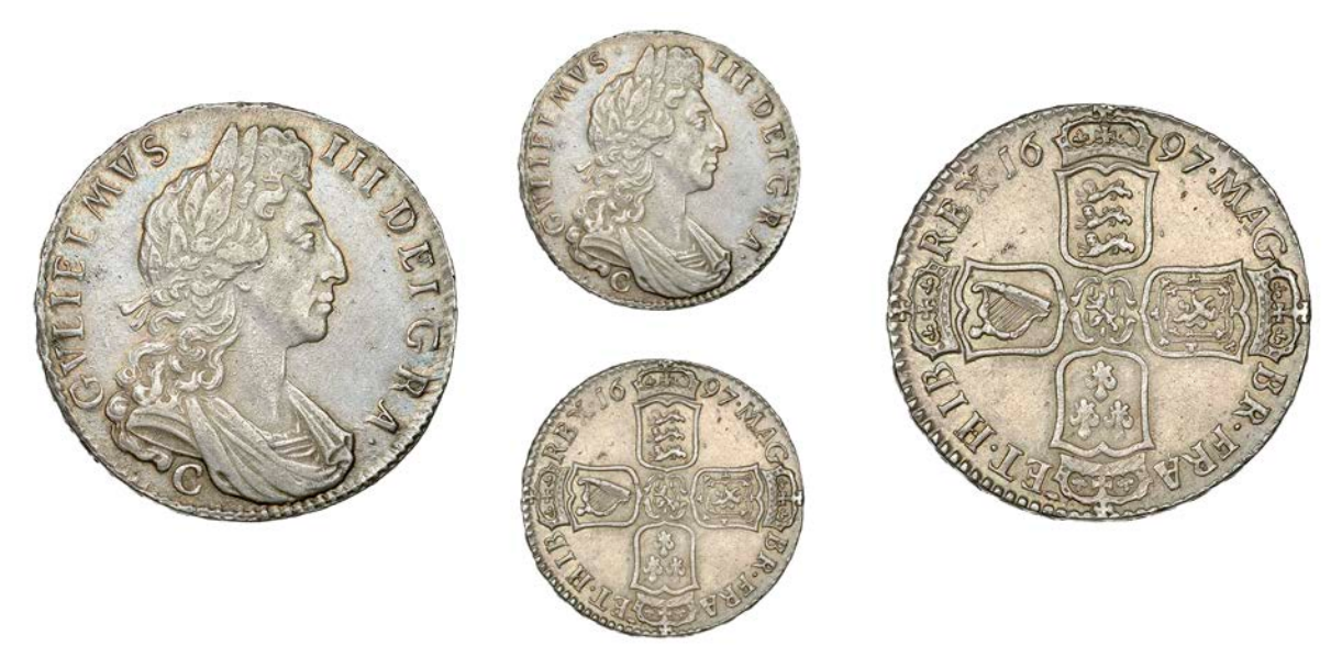
138 Halfcrown, 1697c, large shields, large late harp, edge NONO (ESC 1068 [545]; S 3489). Good very fine and toned, scarce £500-£700