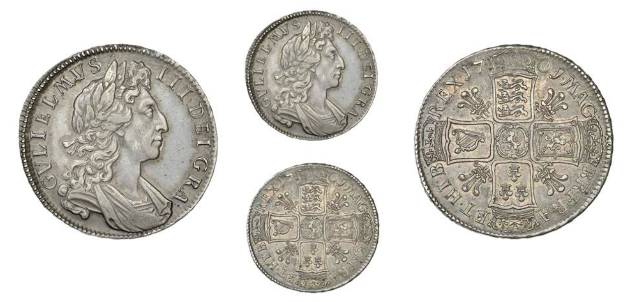
143 Halfcrown, 1701, plumes, edge DECIMO TERTIO (ESC 1052 [567]; S 3496). Lightly cleaned at one time but now re-toned, otherwise good very fine, rare £1,000-£1,200