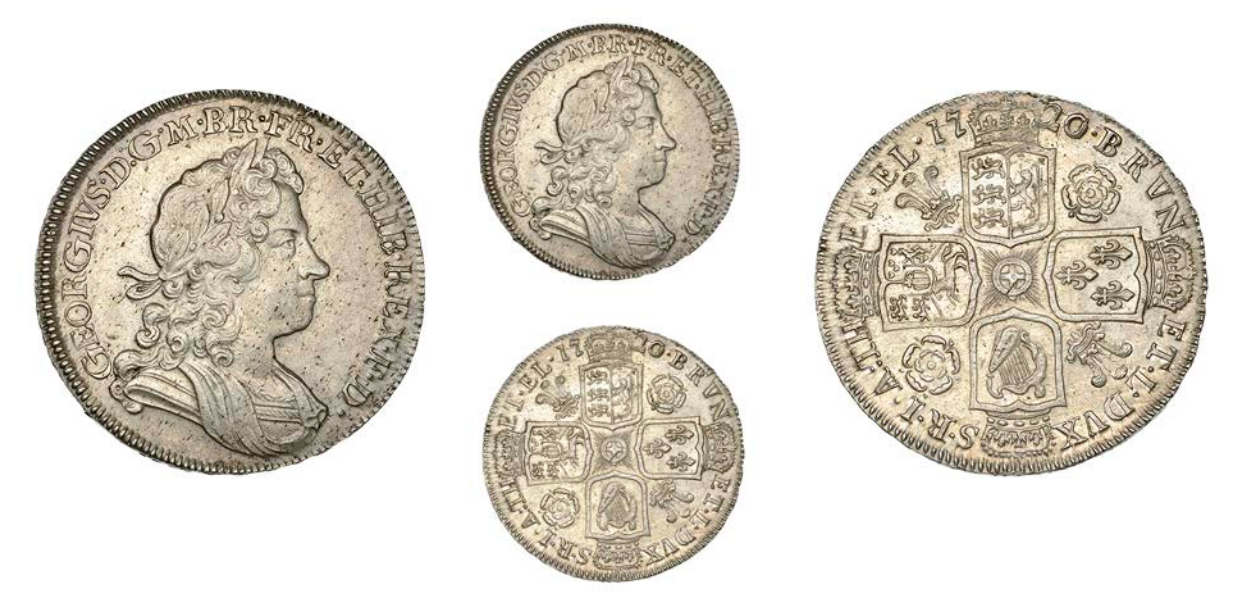
153 Halfcrown, 1720/17, roses and plumes, edge SEXTO (ESC 1555 [590]; S 3642). Minor flecking, otherwise extremely fine £1,000-£1,200