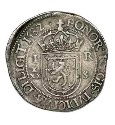
179 James VI , Fourth coinage, Thirty Shillings, 1582, mark of value in two lines, 22.73g/10h (SCBI 35, 1237-8; SCBI 58, 1461-3; B 2, fig. 933; S 5487). Very fine or a little better