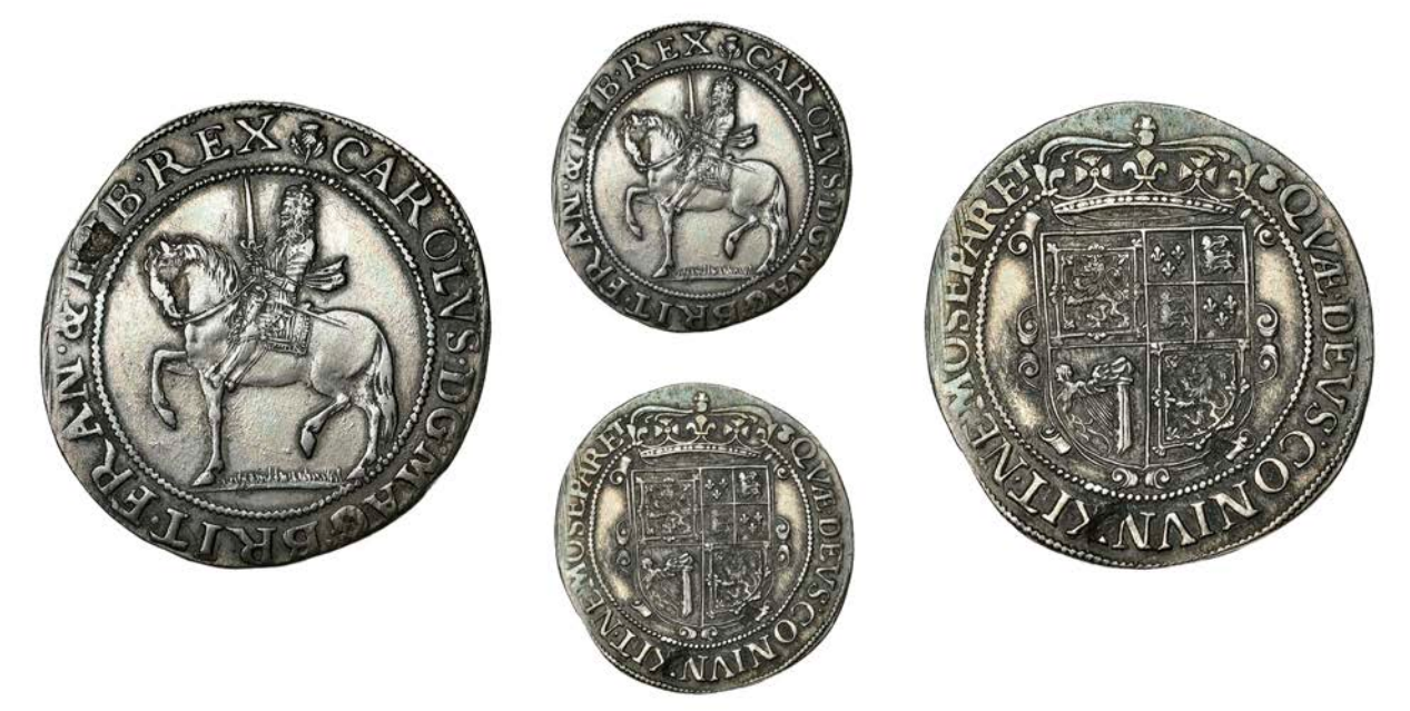
187 Charles I, Third coinage, Falconer's Anonymous issue, Thirty Shillings, mm. leaved thistle on obv., thistle-head on rev., 14.73g/6h (Bull 22; Murray 5; cf. SCBI 35, 1519; B 52, fig. 1023; S 5557). Metal flaw in legend both sides, otherwise better than very fine but some discolouration on reverse £300-£400