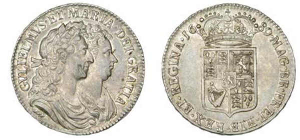
134 Halfcrown, 1689, second shield, caul only frosted, pearls, edge PRIMO (ESC 839 [510]; S 3435). Good very fine with traces of mint bloom \pounds 400-\pounds 500