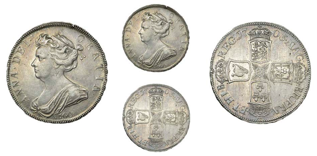
145 Halfcrown, 1703 vigo, edge tertio (ESC 1358 [569]; S 3580). Has been cleaned, otherwise good very fine £300-£400 www.dnw.co.uk