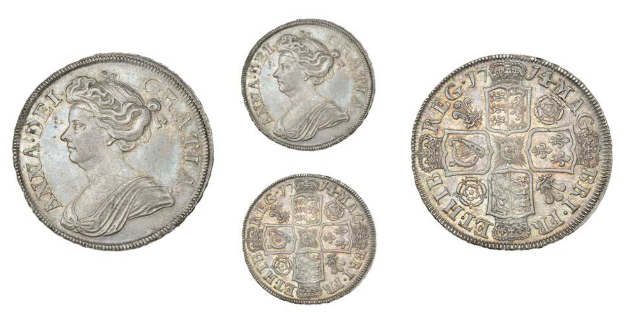
151 Halfcrown, 1714/3, roses and plumes, edge DECIMO TERTIO (ESC 1378 [585A]; S 3607). About extremely fine and toned, the overdate rare