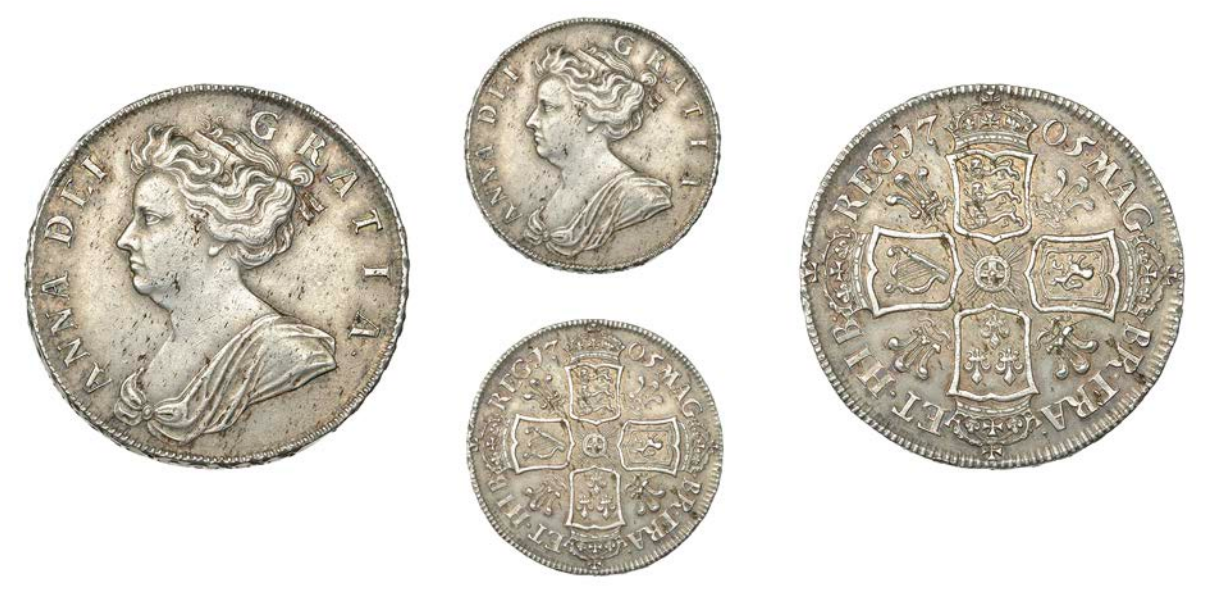
146 Halfcrown, 1705, plumes, edge QVINTO (ESC 1360 [571]; S 3581). Some flecking, otherwise about extremely fine, rare £800-£1,000