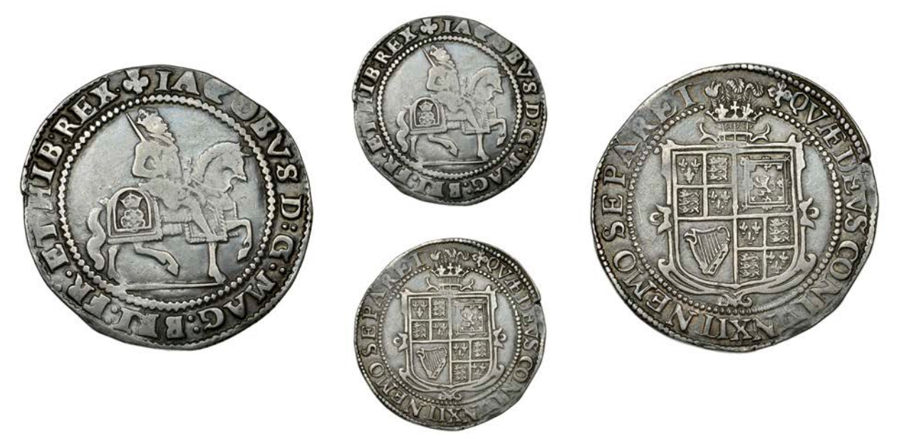
6 Third coinage, Halfcrown, mm. trefoil, plain ground line below horse, plume above shield, 14.83g/12h (N 2123; S 2667). About very fine, reverse better, dark tone