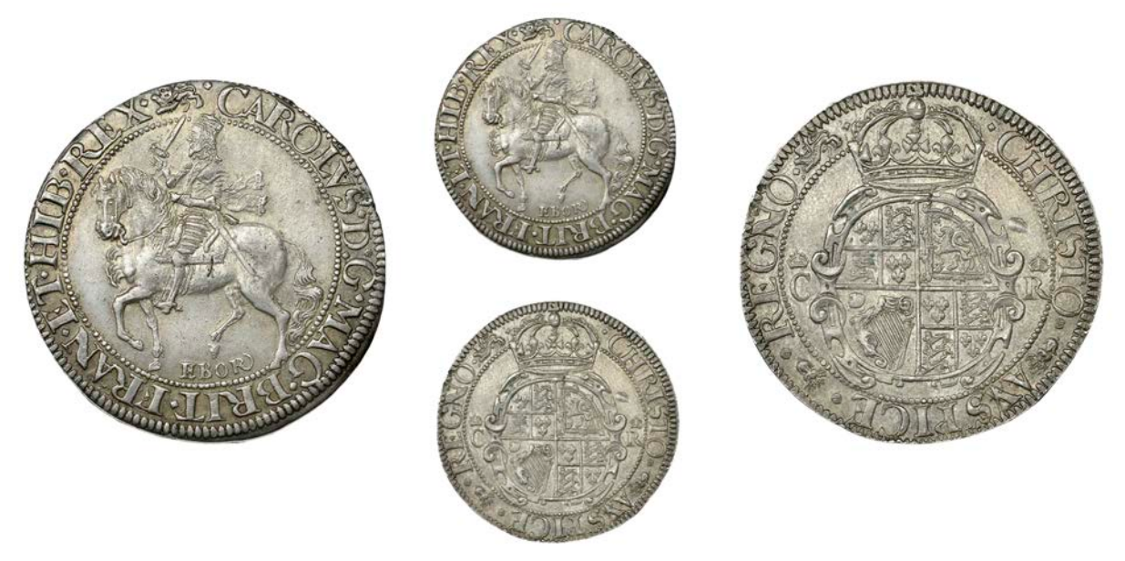
110 Halfcrown, Gp 3 [type 6], mm. lion, tall horseman, tail behind legs, ebor below horse, crowned oval garnished shield, crowned c r at sides, 14.88g/12h (Bull 572; Besly 3E; SCBI Brooker 1083; N 2314; S 2868). Small dent in reverse field, otherwise about extremely fine £1,000-£1,200