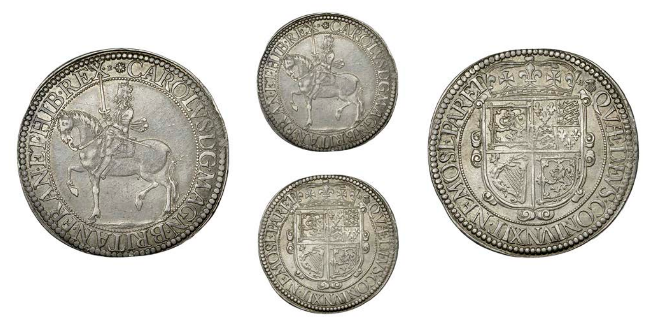
183 Charles I, Third coinage, Briot's issue, Thirty Shillings, mm. flower on obv. , thistle-head on rev. , signed B both sides, 14.81g/6h (Bull 6; Murray pl. iii, 14; SCBI 35, 1427-9; B 6, fig. 1006; S 5553). Good very fine, grey tone £400-£500