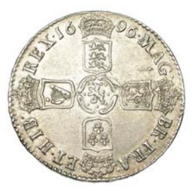
136 Halfcrown, 1696B, small shields, early harp, edge остаvo (ESC 1053 [535]; S 3476). Very fine, reverse better, scarce £200-£260