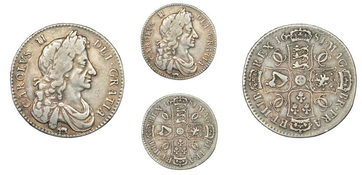
130 Halfcrown, 1681, fourth bust, elephant and castle below, edge TRICESIMO TERTIO (ESC 492 [488]; S 3370). About very fine, extremely rare