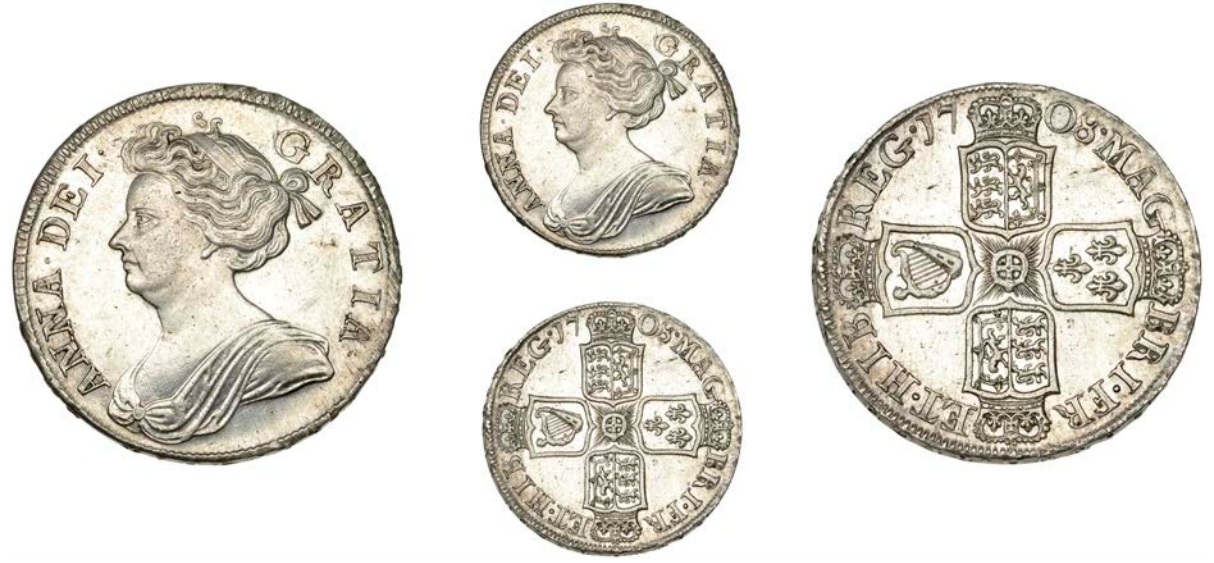
150 Halfcrown, 1708, edge SEPTIMO (ESC 1370 [577]; S 3604). Lightly cleaned, otherwise extremely fine