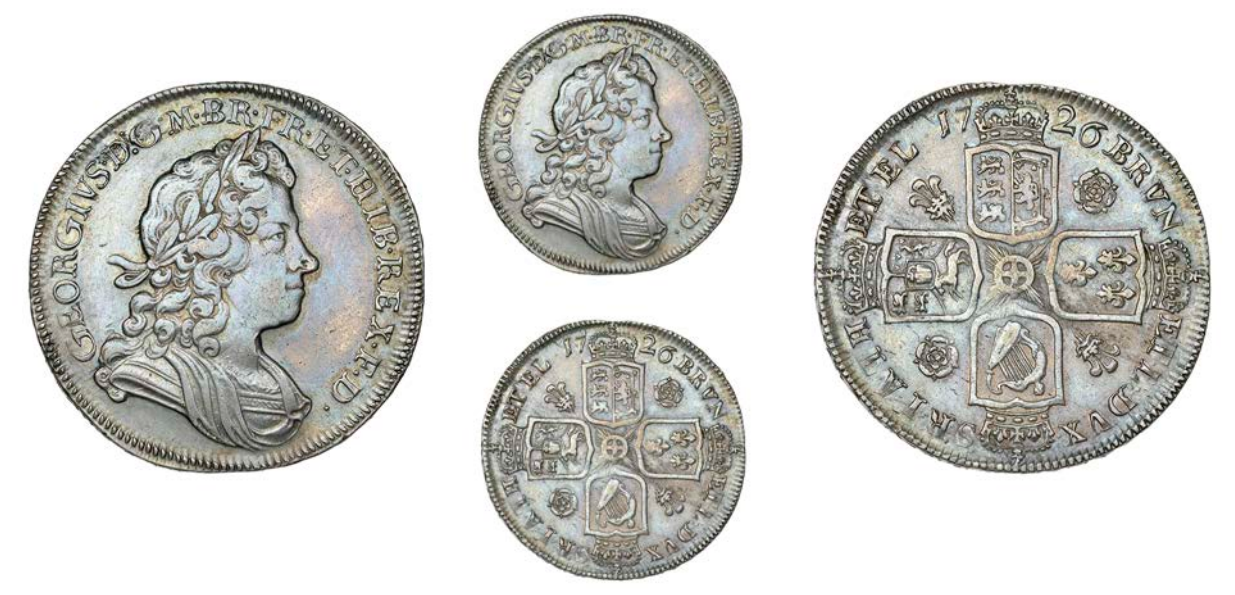
Halfcrown, 1726, small roses and plumes, edge decimo tertio (ESC 1559 [593]; S 3644). Good very fine and toned, extremely rare \pounds 10,000- \pounds 12,000