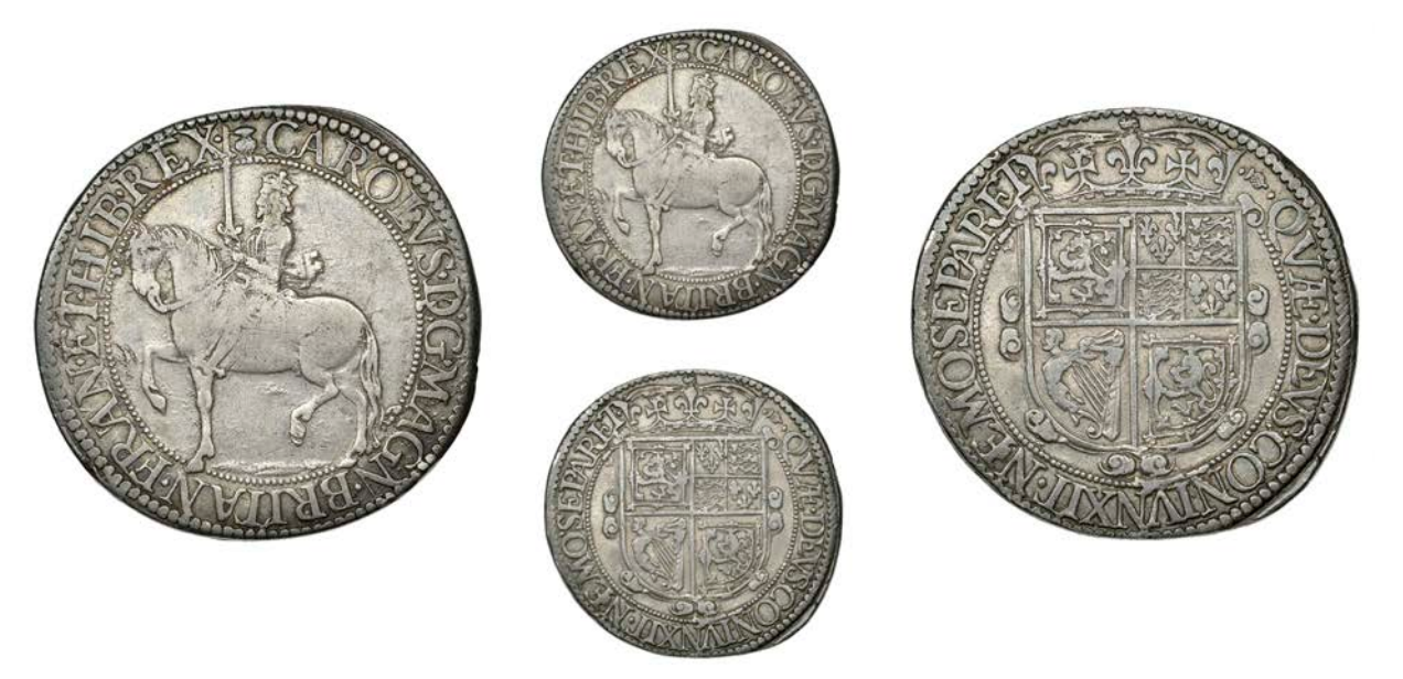
184 Charles I , Third coinage, Intermediate issue, Thirty Shillings, mm. thistle-head, 14.38g/6h (Bull 7; Murray pl. iii, 15; SCBI 35, 1457; B 20, fig. 1015; S 5554). Good fine or better \pounds 200-\pounds 260