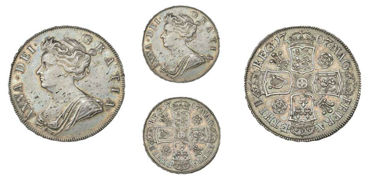
147 Halfcrown, 1707, roses and plumes, edge SEXTO (ESC 1364 [573]; S 3582). Some flecking, otherwise about extremely fine, toned