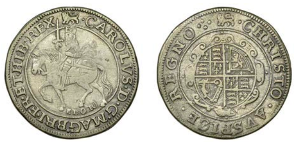
111 Halfcrown, anomalous [type 4], mm. lion, ebor below horse, oval garnished shield, pellet stops both sides, 11.04g/6h (Bull 573; Besly pl. 8, 7; SCBI Brooker 1080; N 2312; S 2866). Very fine or better for issue, an unusually good specimen for the type £300-£400

Generally thought to be a contemporary or slightly later forgery in base silver. However it may perhaps have been officially machine-made at the mint at a period when there was a shortage of specie