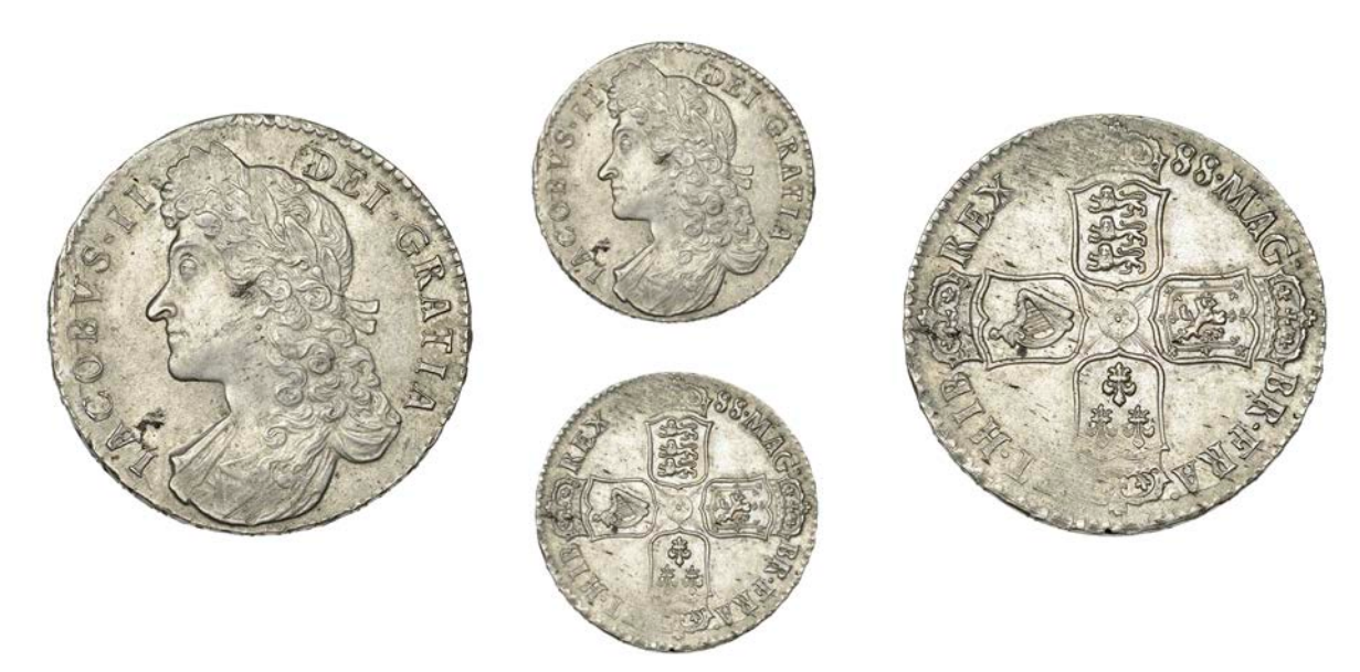
132 Halfcrown, 1688, second bust, edge QVARTO (ESC 759 [502]; S 3409). Weak in parts and minor scrapes on obverse, otherwise about extremely fine \pounds 500-\pounds 700