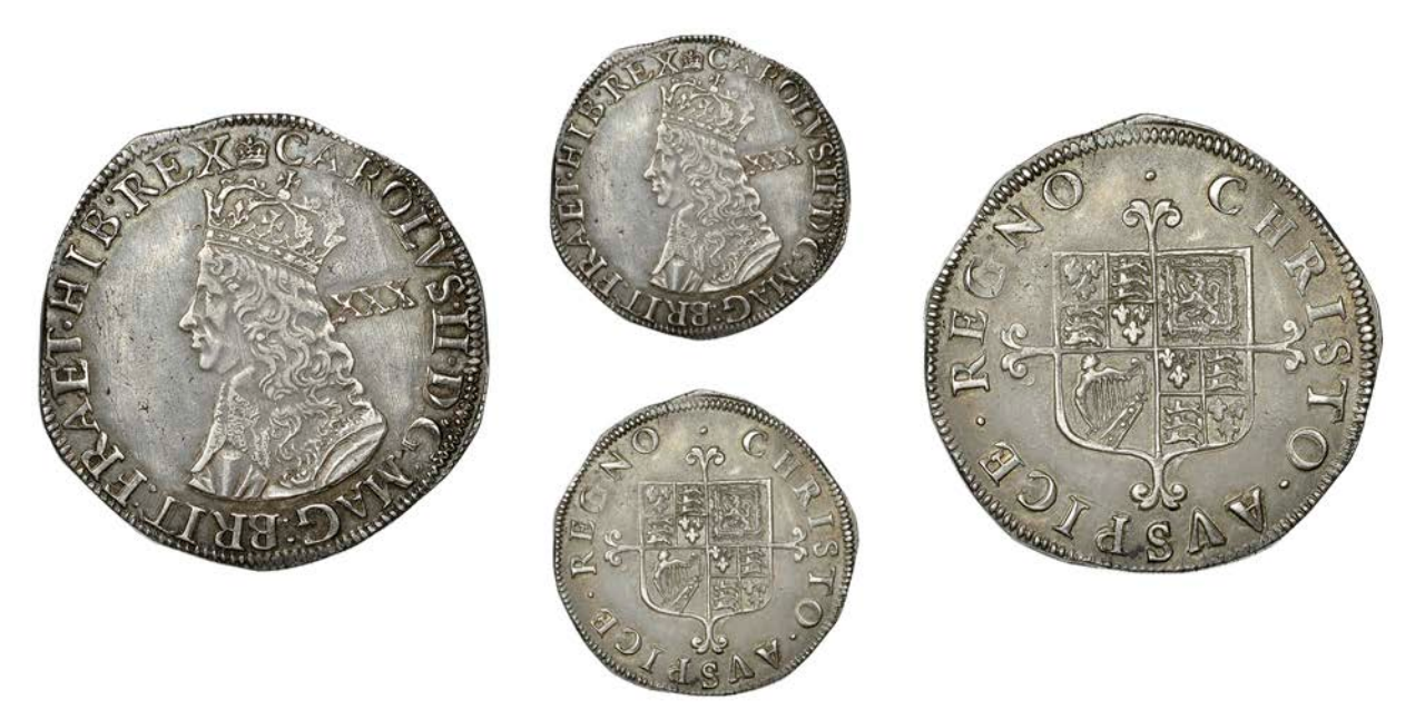
125 Second Hammered issue, Halfcrown, mm. crown on obv . only, with mark of value, reads BRIT FRA, 15.06g/1h (ESC 286 [450]; N 2760; S 3313). Extremely fine for issue and extremely rare, possibly the finest known example