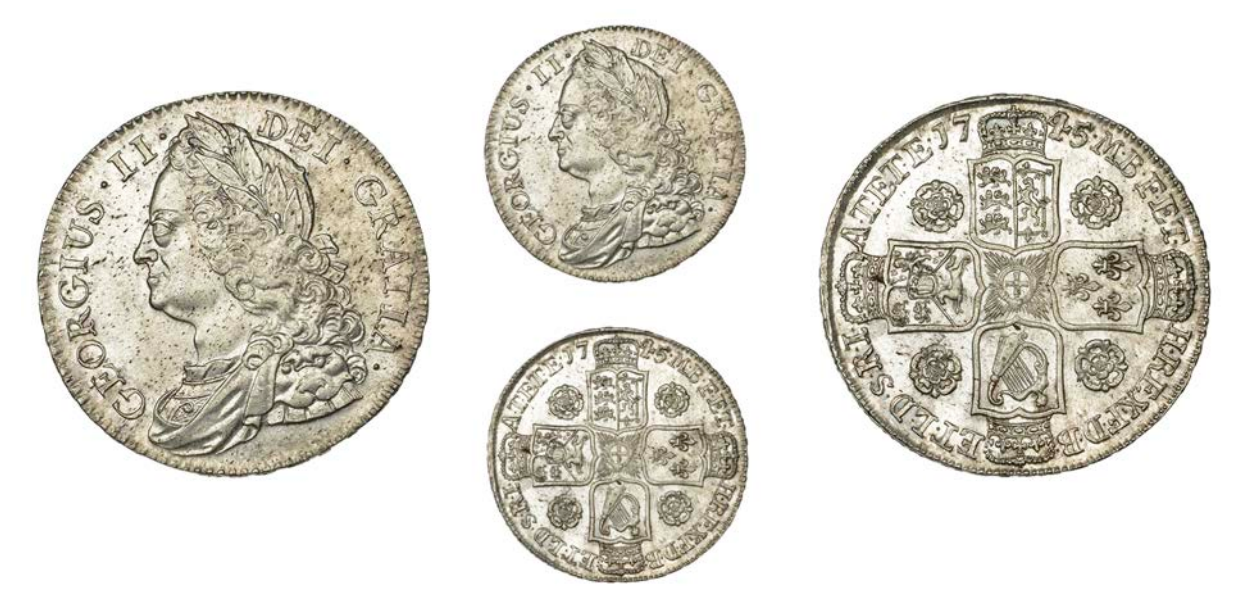
Halfcrown, 1745, roses, edge decimo nono (ESC 1685 [604]; S 3694). Minor flecking, otherwise good extremely fine \pounds 1,000-\pounds 1,200