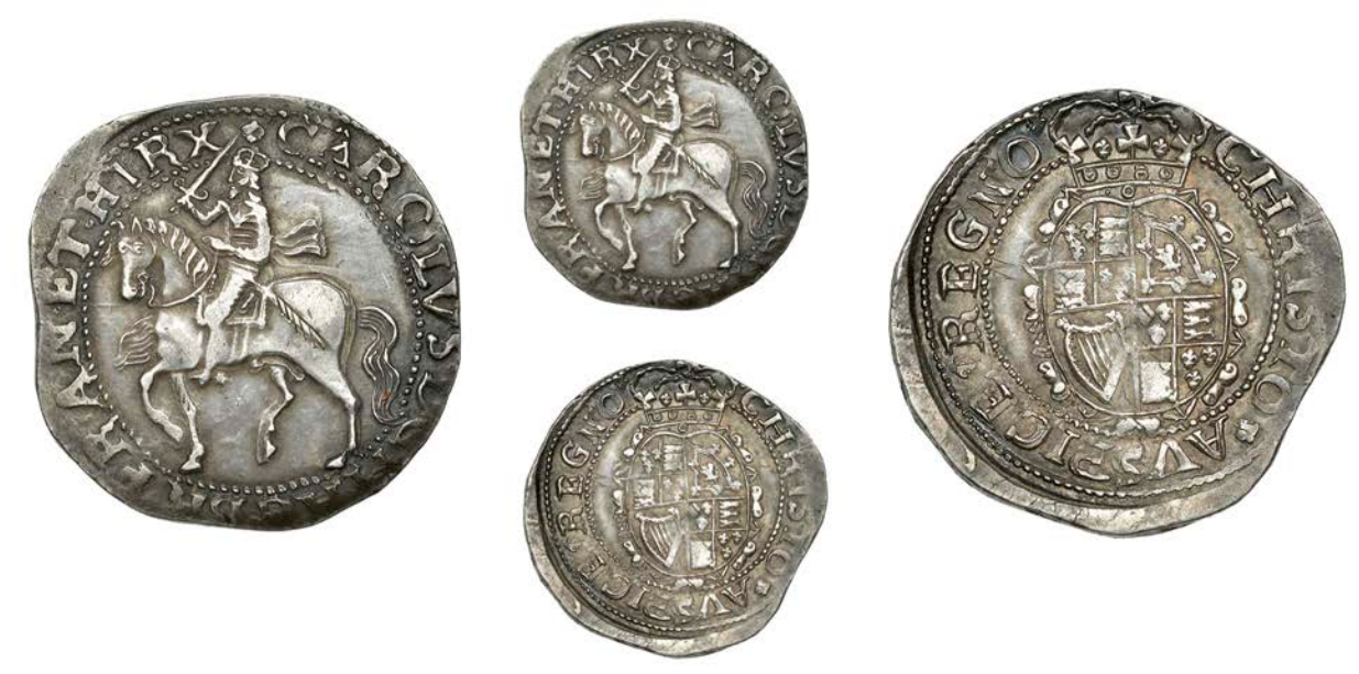
99 Halfcrown, mm. small lis on obv. only, tall horseman, nothing below, crowned oval garnished shield, 14.65g/11h (Bull 675/39A (109(Lys)-15), this coin; Allen obv. I, rev. unlisted; SCBI Brooker 1164A, this coin; N 2605; S 3124). Reverse slightly off-centre, otherwise good very fine with attractive dark tone, very rare £4,000-£6,000 Provenance: H. Webb Collection, Part I, Sotheby Auction, 9-14 July 1894, lot 559; H. Montagu Collection, Part III, Sotheby Auction, 13-20 November 1896, lot 607; R.C. Lockett Collection, Part II, Glendining Auction, 11-17 October 1956, lot 2548; J.G. Brooker Collection; bt Spink October 1979