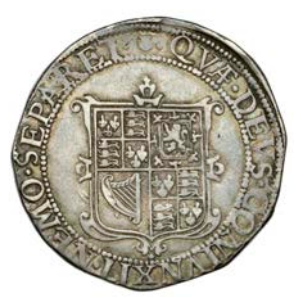
180 James VI , Ninth coinage, Thirty Shillings, mm. thistle-head, English arms in first and fourth quarters, 14.85g/3h (SCBI 35, 1363; B –, fig. 973; S 5503). Good fine, reverse better