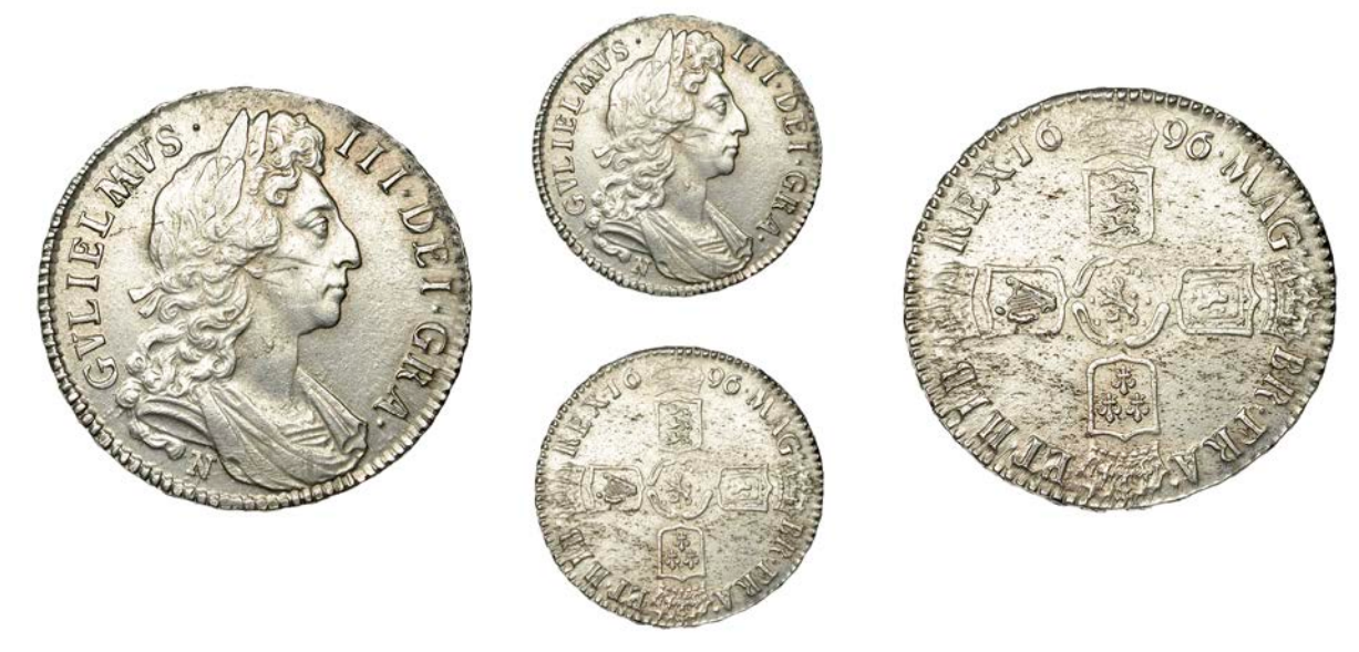
137 Halfcrown, 1696N, small shields, early harp, edge octavo (ESC 1083 [538]; S 3479). Marks on bust, otherwise about extremely fine, scarce £500-£700