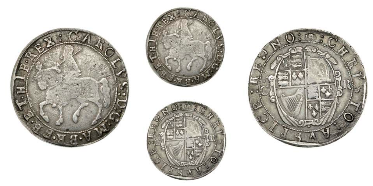
120 A contemporary forgery of a Tower mint Halfcrown, as Gp II, mm. tun on rev. only, second horseman but with untrimmed tail, no ground line, large oval garnished shield between c R, reads c · AROLVS, reversed G in REGNO, 15.61g/11h (Bull F3; SCBI Brooker 1186 [= Lockett 3404], same dies). Obverse fine, reverse better, scarce £100-£150