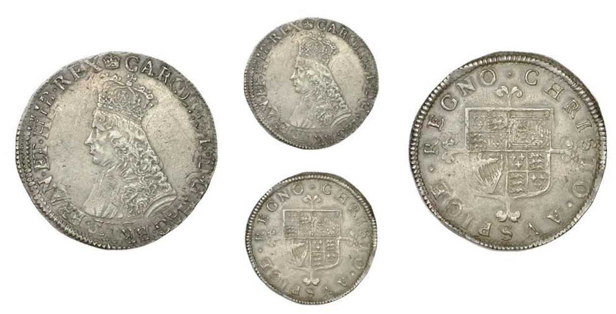
124 First Hammered issue, Halfcrown, mm. crown on obv . only, 14.96g/9h (ESC 271 [448]; N 2759; S 3307). Some double-striking, otherwise very fine, very rare Provenance: Bridgewater House Collection, Sotheby Auction, 15-16 June 1972, lot 330