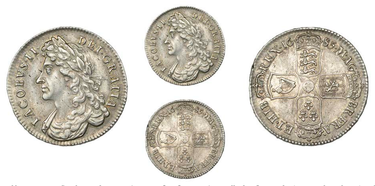
131 Halfcrown, 1685, first bust, edge PRIMO (ESC 748 [493]; S 3408). Small edge flaw and minor marks, otherwise about extremely fine \pounds 800-\pounds 1,000