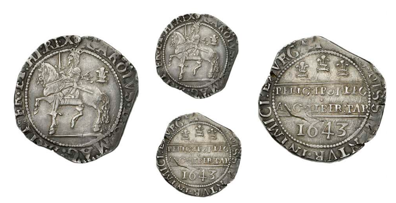
54 Halfcrown, 1643, mm. Oxford plume on obv . only, Oxford horseman, Oxford plume behind, ground line below, three Oxford plumes above Declaration, date below, colon before legend, 14.76g/8h (Bull 603/2 (Ox.1-6-2c); Morr. E-2; SCBI Brooker 892; N 2415; S 2955). On an irregular flan, otherwise good very fine, toned #600-£800 Provenance: Bt Baldwin 1993

Provenance: F. Willis Collection, Part I, Glendining Auction, 5 June 1991, lot 293