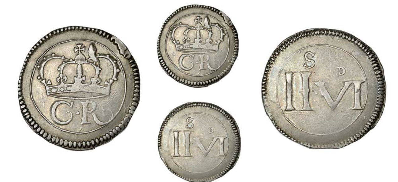
188 Charles I, Ormonde money, Halfcrown, triangle stop between c R, rev. shorter figures in II vI, small star between, 14.19g/2h (Bull 7 (A-3); S 6545; DF 294 var.). Very fine and toned Provenance: R.C. Lockett Collection, Glendining Auction, 18-19 June 1957, lot 621; N. Asherson Collection, Spink Auction 6, 10-11 October 1979, lot 235