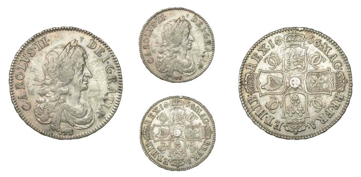
128 Halfcrown, 1666/4, third bust, elephant below, edge xvIII (ESC 447 [462]; S 3364). Small edge knock or flaw and some light scratches, otherwise very fine, very rare £1,500-£1,800