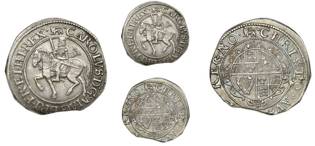
106 Halfcrown, Gp 1 [type 3], mm. lion, no ground line below horse, oval garnished shield, 13.81g/12h (Bull 554; Besly 1E; SCBI Brooker 1079; N 2311; S 2865). Short of flan at 6 o'clock, otherwise nearly extremely fine and toned, very rare £1,500-£2,000