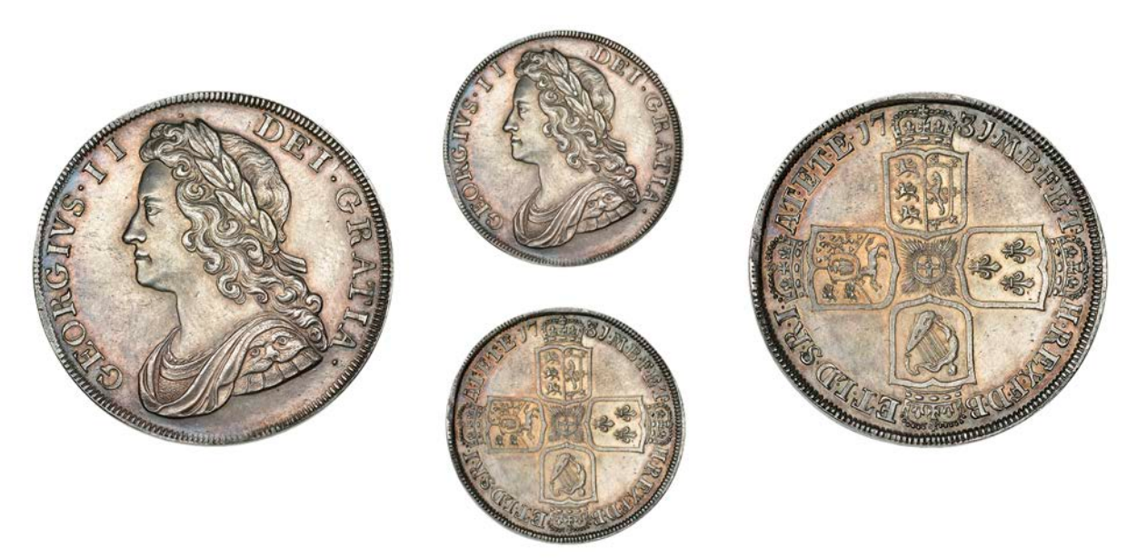
156 Pattern Halfcrown, 1731, by J. Croker, in silver, laureate bust left, rev. cruciform shields, edge plain, 15.38g/6h (ESC 1673 [594]; S 3691). Characteristic flatness on rim at date, a few minor surface marks, otherwise extremely fine and attractively toned, very rare