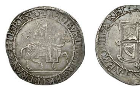
181 James VI , Tenth coinage, Thirty Shillings, mm. thistle-head, Scottish arms in first and fourth quarters, 14.75g/2h (SCBI 35, 1370-4; B 14, fig. 984; S 5504). Small digs in obverse field, otherwise about very fine, toned £200-£300