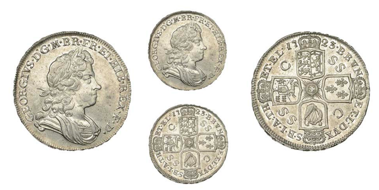
Halfcrown, 1723 ss c, edge DECIMO (ESC 1557 [592]; S 3643). Tiny edge bruise on obverse at 2 o'clock, otherwise extremely fine with mint bloom \pounds 2,000-\pounds 2,600