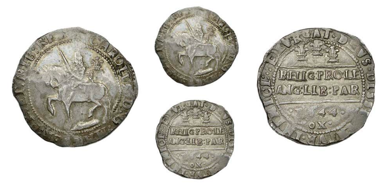
58 Halfcrown, 1644, mm. Oxford plume on obv ., Briot's horseman, Oxford plume behind king, grassy ground line below, three Oxford plumes above Declaration, date in small figures and ox below, both between pellets, 15.14g/7h (Bull 612/26 (Ox.5/18-19.5b); Morr. C-26; cf. SCBI Brooker 906; N 2425; S 2958/2965). On an irregular flan, very fine, reverse better, old cabinet tone, rare £800-£1,000

57 Halfcrown, 1644, mm. rosette and Oxford plume on obv. , rosette on rev. , Briot's horseman, Oxford plume behind king, grassy ground line below, large Oxford plume between two smaller above Declaration, date in large script figures between pellets, ox below, between rosettes, 14.94g/7h (Bull 611/12 (Ox.16-19-5c), this coin ; Morr. B-12; cf. SCBI Brooker 905; N 2426; S 2968). On an irregular flan, very fine and toned, rare £600-£800 Provenance : H.W. Morrieson Collection, Sotheby Auction, 20-4 November 1933, lot 529 (part); R.C. Lockett Collection, Part IV, Glendining Auction, 26-7 April 1960, lot 4204; N. Asherson Collection, Spink Auction 6, 10 October 1979, lot 69. This coin is illustrated in H.W. Morrieson's article 'The Coinage of Oxford, 1642-46' ( BNJ XVI [1921-2], pl. V, 71).