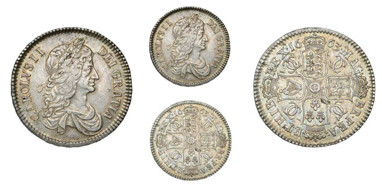
Halfcrown, 1663, first bust, edge xv, no stops on obv. (ESC 444 [459]; S 3361). Old scratch on bust, otherwise good very fine and toned \pounds 1,000-\pounds 1,200