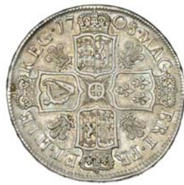
149 Halfcrown, 1708, plumes, edge SEPTIMO (ESC 1369 [578]; S 3606). Some light scratches, otherwise good very fine and toned \pounds 300-\pounds 400