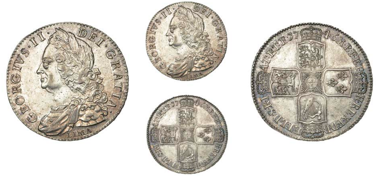
160 Halfcrown, 1746 LIMA, edge DECIMO NONO (ESC 1688 [606]; S 3695A). Extremely fine