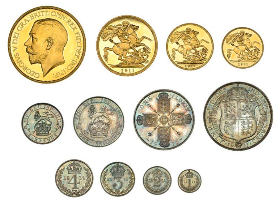
402 Proof set, 1911, comprising Five Pounds, Two Pounds, Sovereign and Half-Sovereign, Halfcrown to Maundy Penny [12]. Virtually mint state, gold brilliant, silver with light matching tone; in official case of issue £15,000-£18,000