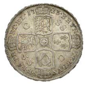
350 Halfcrown, 1723 ss c, edge DECIMO (ESC 1557 [592]; S 3643). Better than extremely fine, lightly toned £2,400-£3,000