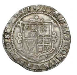
280 Third coinage, Halfcrown, mm. trefoil, ground line below horse, 14.81g/3h (N 2122; S 2666). Very fine, reverse better, attractively toned £800-£1,000