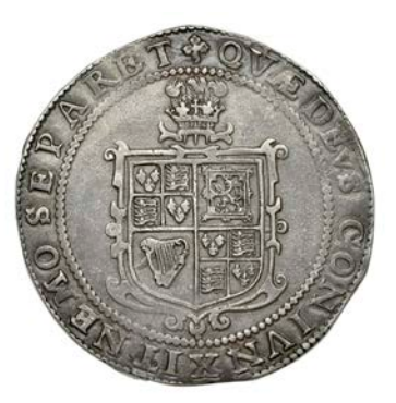
279 Third coinage, Crown, mm. trefoil (over lis both sides), plume over shield, 29.77g/9h (FRC dies X^*/XIX^* [Sale, lot 36]; N 2121; S 2665). Nearly extremely fine with old cabinet tone £3,000-£4,000