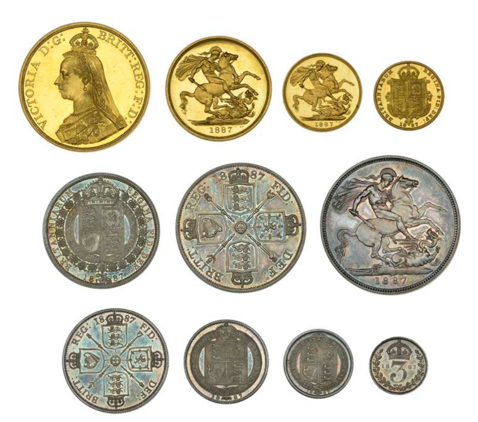
391 Proof set , 1887 , comprising Five and Two Pounds, Sovereign and Half-Sovereign, Crown to Threepence [11]. Gold with very minor marks and hairlines, otherwise about as struck, brilliant, silver with uniform toning, an attractive set; in dated leather case £24,000-£30,000