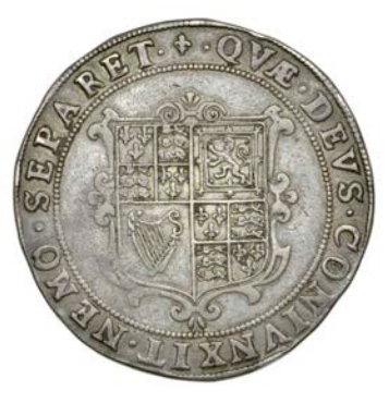
278 Second coinage, Crown, mm. lis, 29.53g/5h (FRC dies IV/VI [Sale, lot 21]; N 2097; S 2652). Evenly struck with good detail, very fine or better £4,000-£5,000