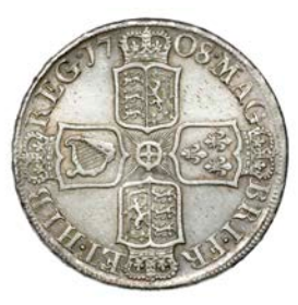
347 Halfcrown, 1708, edge SEPTIMO (ESC 1370 [577]; S 3604). Better than extremely fine