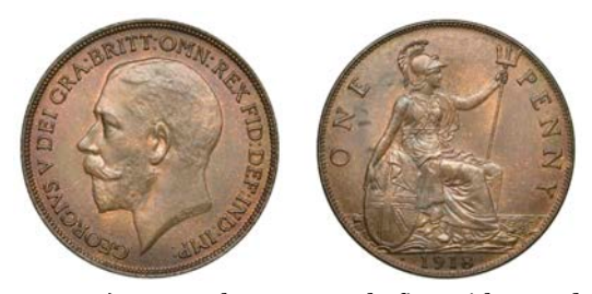
400\, Penny, 1918H (F 183; BMC 2253; S 4052). Better than extremely fine with muted original colour