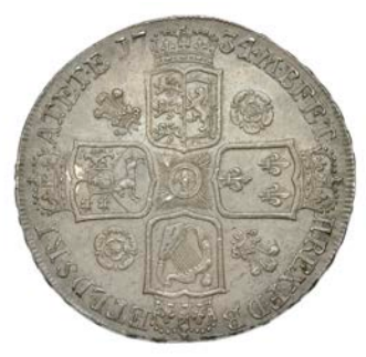
352 Crown, 1734, roses and plumes, edge septimo (ESC 1662; S 3686). Good extremely fine with dark tone over reflective fields £3,000-£3,600