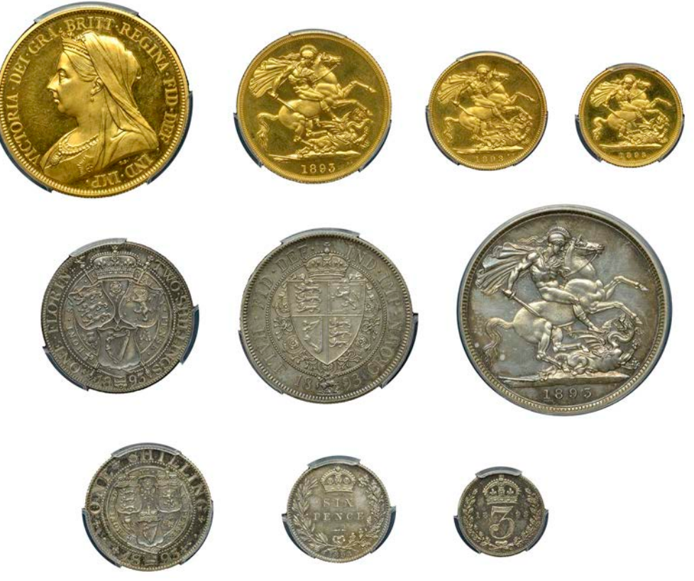
498 Proof set, 1893, comprising gold Five and Two Pounds, Sovereign and Half-Sovereign, silver Crown to Threepence [10]. Brilliant, a superb set, silver with matching olive-grey tone [slabbed PCGS PR 62+ CAM, PR 63 DCAM, PR 63 CAM, PR 64 CAM and PR 62 respectively] £40,000-£50,000