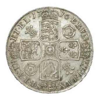
\textbf{349} \ \, \textbf{Crown, 1716, roses and plumes, edge } \textbf{SECVNDO (ESC 1540 [110]; S 3639)}. \textit{Extremely fine or better} \\