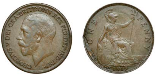
401 Penny, 1919 \kappa N (F 187; BMC 2257; S 4053). Good very fine but flan split at 9 o'clock on reverse, rare