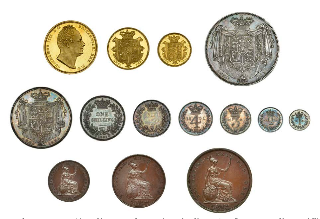
363 Proof set, 1831, comprising gold Two Pounds, Sovereign and Half-Sovereign, silver Crown, Halfcrown, Shilling, Sixpence and Maundy set; copper Penny, Halfpenny and Farthing [14]. Gold and silver with some light hairlines, silver with matching tone, these better than extremely fine and brilliant, copper much as struck; in a modern maroon fitted case £70,000-£80,000