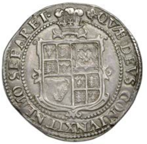
281 Third coinage, Halfcrown, mm. trefoil (over lis on obv . [?]), ground line below horse, plume above shield, 14.62g/4h (N 2123; S 2667). Portrait slightly smoothed, otherwise very fine, reverse better, old cabinet tone £1,200-£1,500 Provenance: H.M. Lingford Collection, Part II, Glendining Auction, 20-1 June 1951, lot 1258; bt Spink