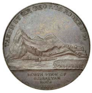
808 Duke of Kent, Governor of Gibraltar , 1802, a copper medal, unsigned, uniformed bust left, rev. view of Gibraltar, 38mm (E 939; BHM 531). Some light scuffing, otherwise good very fine £80-100