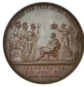
818 George IV, Coronation, 1821, a copper medal by B. Pistrucci, similar, 35mm (BHM 1070; E 1146a). About as struck