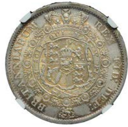
152 Halfcrown, 1817, large head (ESC 2090 [616]; S 3788). Good extremely fine, lightly toned [slabbed NGC MS 64] \pounds 400-\pounds 600