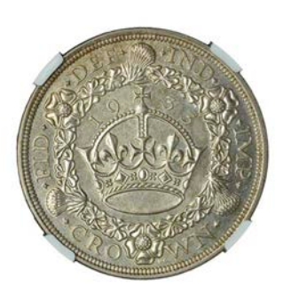
207 Crown, 1933 (ESC 3644 [373]; S 4036). Almost as struck [slabbed NGC MS 63]