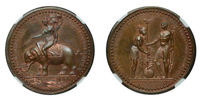
883 INDIA, Victory at Plassey, 1758, a copper medal, unsigned [by J. Pingo], for the SPAC, Victory seated on elephant left, rev. Lord Clive holding sceptre surmounted by lion, presenting another sceptre surmounted by a dolphin to Meer Jaffar, edge plain, 40mm (Pudd. 757.1; Eimer 30; MI II, 683/400; E 655). Usual die flaws at bottom of obverse, fields hairlined, otherwise good extremely fine with original colour, scarce [slabbed NGC MS 65 RB] £400-£500