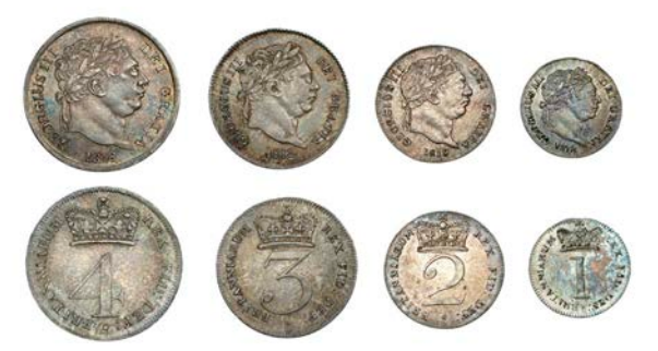
156 Maundy set, 1818 (ESC 2241 [2423]; S 3792) [4]. Extremely fine with matching tone