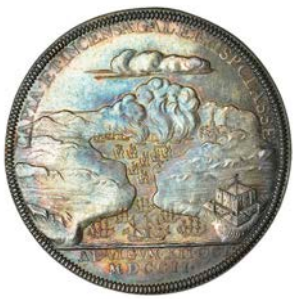
798 Expedition to Vigo Bay, 1702, a silver medal by J. Croker, crowned bust of Anne left, rev. panoramic view of the blockaded harbour, ships burning, 38mm, 17.75g (MI II, 236/18; E 395a). Extremely fine, toned