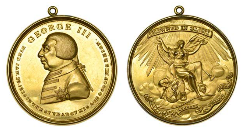
816 George III, Obsequies, 1820, a hollow gilt medal, unsigned, for Hyde, uniformed bust left, rev. angel seated above clouds, 46mm (BHM 1007). Extremely fine, rare; with loop for suspension The entire proceeds from this medal benefit Oxfam