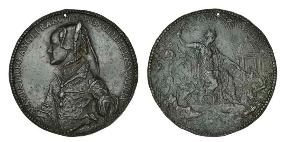
787 State of England , 1554, a cast lead (?) medal by J. da Trezzo, half-length portrait of Queen Mary left, veiled and draped, rev . seated figure of Mary as Peace, applying torch to pile of arms before a temple, supplicant figures beset by hailstorms to left, above, heavenly rays, below, water, 66mm (MI I, 72/20; E 33). A later cast, pierced at top, very fine