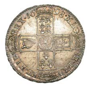
105 Halfcrown, 1698, edge DECIMO (ESC 1034 [554]; S 3494). Some light surface marks, otherwise better than extremely fine £600-£800