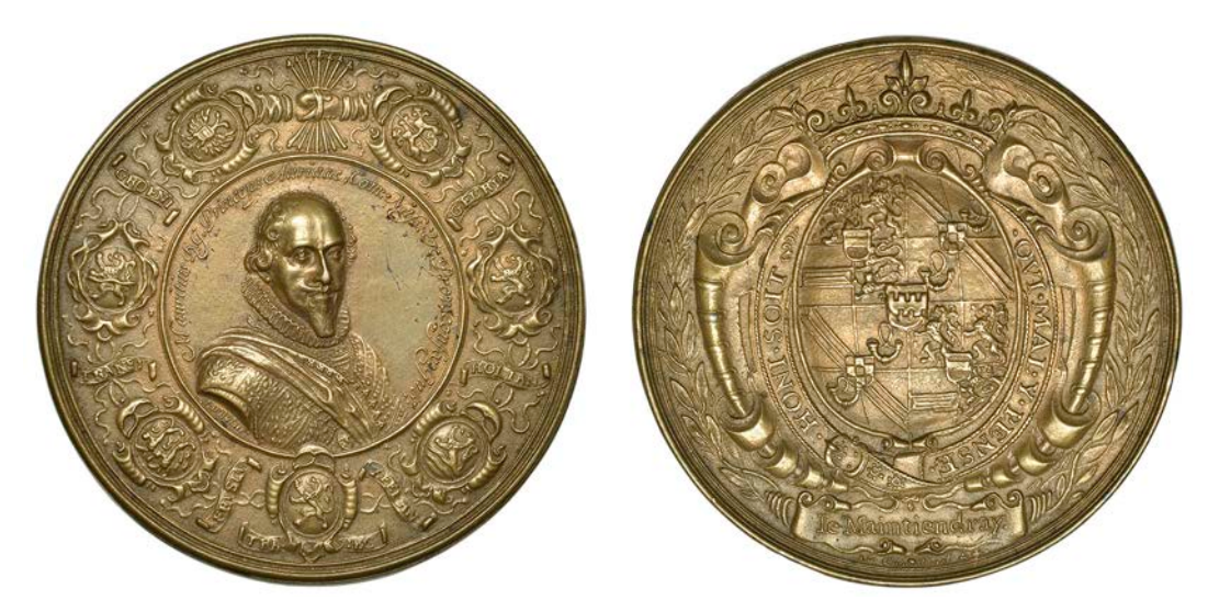
887 NETHERLANDS, Naval Victories over Spain, 1624, an electrotype copy in brass of the medal by J. van Bijlaer, bust of Maurice, Prince of Orange, facing three-quarters right within central circle, seven shields of the United Provinces around, rev . crowned arms of Prince Maurice within wreath, 66mm ( cf. MI I, 231/91; cf. E 103). Very fine

886 JAPAN, Completion of the Tokyo Penitentiary, Meiji 36 [1903], a bronze medal, unsigned, front view of the gateway and main building, rev. plan of the site, 61mm. Cleaned at one time, otherwise extremely fine, scarce; in original wooden box [this damaged] £80-£100