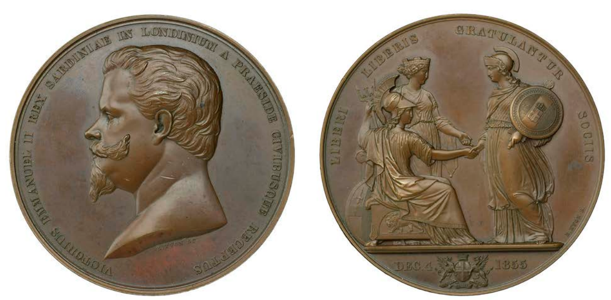
831 Visit of King Victor Emanuel II to the City of London, 1855, a copper medal by B. Wyon, bust left, rev. figures of Britannia, Londinia and Sardinia, 76mm (W & E 717.1; BHM 2567; E 1499). Extremely fine £150-£200

830 Opening of Crystal Palace, 1854, a white metal medal by G.G. Adams for Pinches, 63mm (Allen 110; W & E 679.1; BHM 2545; E 1484); together with other 19th and 20th century base metal medals (4) [5]. First extremely fine and in case of issue, others in varied state £70-£90