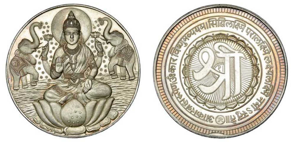
884 INDIA , a silver good fortune medal, 20th century, goddess Lakshmi seated facing on lotus flower, flanked by two elephants, rev. large central character, legend around, 60mm. Excess metal on rim at bottom of reverse, extremely fine and toned £150-£180