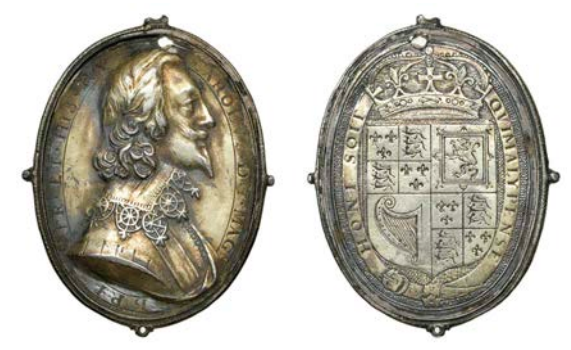
788 Charles I , a cast silver-gilt Royalist badge by T. Rawlins, bust right, rev . crowned arms within Garter, 40 x 31mm, 8.52g (MI I, 360/231; E 167b). Pierced at top, light scratches on reverse, otherwise very fine £200-£260