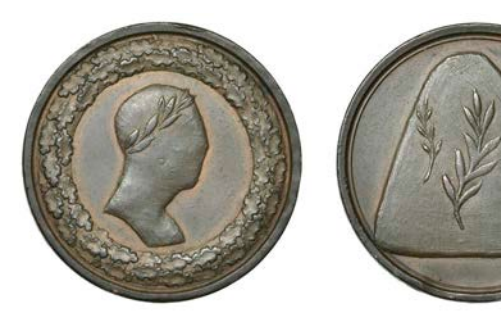
814 Anonymous, c. 1815 (?), a copper medal, unsigned, unfinished laureate bust right within wreath, rev. two olive branches upon pyramid, lettered edge reading wfodapovyfcobhhttmrb nicipyrdwdrubnqpmsvzo, 36mm (Eimer Appendix 1; ВНМ 898). About extremely fine, rare