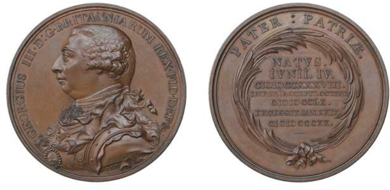
815 Death of George III , 1820, a copper medal by C.H. Küchler, bust left, rev . inscriptions and wreath, 48mm (BHM 991; E 1121). Mint state; in original metal shells