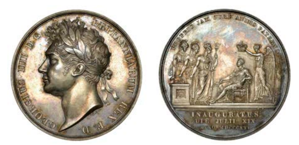
817 George IV, Coronation, 1821, a silver medal by B. Pistrucci, laureate bust left, rev. Britannia, Scotia and Hibernia approaching the enthroned King being crowned by Victory, 35mm (BHM 1070; E 1146a). Good extremely fine and attractively toned; in contemporary leather red case £300-£400