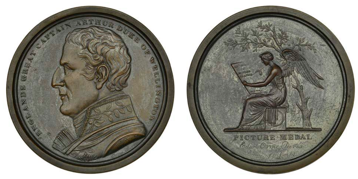
813 Victories of the Peninsular War, 1815, a bronze box medal by J. Porter for E. Orme, bust of Wellington left, rev. Victory seated under a tree and inscribing a tablet, 75mm; containing 1 [of 13] aquatint roundel of contents (Eimer 80; BHM 866; E 1074) [Lot]. Medal and content very fine; in original maroon case of issue [this somewhat scuffed] £200-£260