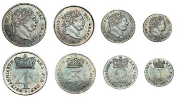
157 Maundy set, 1820 (ESC 2242 [2424]; S 3792) [4]. Extremely fine with matching tone