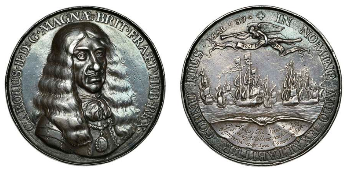
792 Charles II, Embarkation at Scheveningen, 1660, a hollow cast silver medal by P. van Abeele, similar, 70mm, 70.99g (MI I, 455/44; E 210; v.L. II, 462; MH 42). Usual air-hole in edge and some rim bruises, graffiti in obverse field, otherwise very fine or better, dark tone £240-£300

793 Charles II, Marriage to Catherine of Braganza, 1662, a silver badge, unsigned, crowned bust of Charles left, rev. draped bust of Catherine left, 31 x 28mm, 3.58g (MI I, 483/96; E 225). Fine, rare; with loop for suspension £120-£150