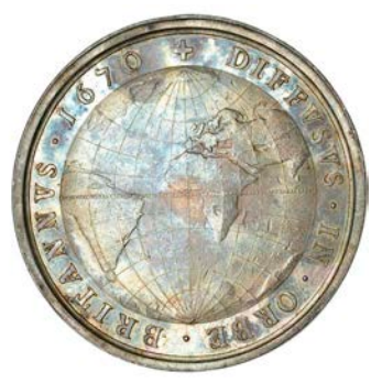
795 British Colonization , 1670, a silver medal by J. Roettiers, conjoined busts of Charles II and Catherine right, rev. globe, 42mm, 34.63g (MI I, 546/203; E 245). A few contact marks, otherwise extremely fine, attractively toned £600-£800