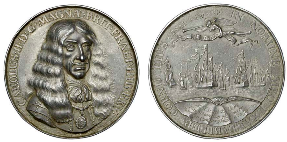
791 Charles II, Embarkation at Scheveningen , 1660, a hollow cast silver medal by P. van Abeele, armoured bust almost full-face, hair long, wearing silk cravat and the Garter George from a heavy chain, rev . Fame flying over fleet under sail, 70mm, 73.58g (MI I, 455/44; E 210; v.L. II, 462; MH 42). Usual air-hole in edge, some light scratches on reverse and edge, otherwise very fine £800-£1,000

Provenance: DNW Auction 137, 21 September 2016, lot 394