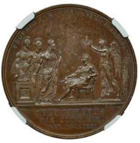
819 George IV, Coronation, 1821, a copper medal by B. Pistrucci, similar, 35mm (BHM 1070; E 1146a). About as struck [slabbed NGC MS 64 BN] £120-£150