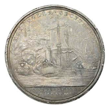
796 Battle of La Hogue , 1692, a silver medal by J. Roettiers, conjoined busts right, rev. naval engagement, 50mm (MI II, 64/266; E 346). Numerous edge nicks and surface marks, otherwise very fine or better, very rare £300-£400