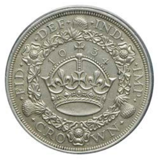
208 Crown, 1934 (ESC 3647 [374]; S 4036). Good extremely fine, rare [slabbed PCGS MS 62]