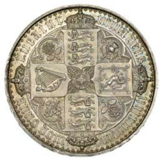
175 'Gothic' Crown, 1847, edge undecimo (ESC 2571 [288]; S 3883). Some minor edge nicks and surface hairlines, otherwise extremely fine, reverse better, toned £2,000-£3,000