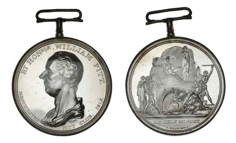
812 Manchester Pitt Club, 1813, a silver medal by T. Wyon Jr, bust left, rev. allegory of Pitt rousing Genius to resist the demons of anarchy, 50mm (BHM 771; E 1039; D & W 166/501). About as struck, set in a silver ring with glazing intact and original suspension; housed in a contemporary case with paper insert, an unusually attractive example £150-£200