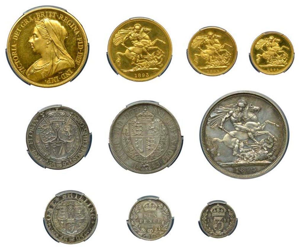
215 Proof set , 1893 , comprising gold Five and Two Pounds, Sovereign and Half-Sovereign, silver Crown to Threepence [10]. Brilliant, a superb set, silver with matching olive-grey tone [slabbed PCGS PR 62+ CAM, PR 63 DCAM, PR 63 DCAM, PR 64, PR 63 CAM, PR 64, PR 63 CAM, PR 64 CAM and PR 62 respectively] £36,000-£40,000