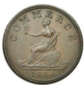
705 Not Local: British , Druid's Head issues, Pennies (2), 1814, 18.00g/6h (W 1635), undated, 18.46g/6h (W 1636) [2]. First good fine, second fine but weakly struck in centres, both very rare and superior to the Withers plate pieces