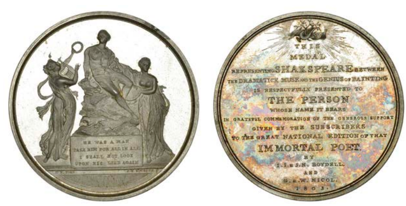
811 National Edition of Shakespeare's Works , 1803, a silver Subscriber's medal by C.H. Küchler for J. and J. Boydell, similar, edge named (Richard Homer Esqr), 48mm (Pollard 28; BHM 553; E 950). Fields lightly brushed, otherwise good extremely fine; in original metal shells within contemporary fitted case [this slightly worn]