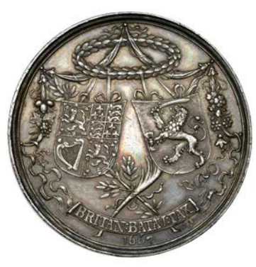
794 Peace of Breda and the Alliance of England and Holland, 1667, a silver medal by C. Adolfszoon, English and Dutch ships sailing alongside one another, each with an olive wreath atop the main mast, rev. shields of Britain and Holland suspended from an olive wreath within festoon of flowers, 44mm, 31.78g (MI I, 534/184; E 242). Edge knock at 7 o'clock, otherwise good very fine and toned, rare £200-£300