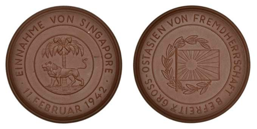
890 SINGAPORE , Japanese Capture of Singapore , 1942, a brown porcelain medal, lion and palm tree, rev . Japanese flag within wreath, 52mm. About as struck, rare £200-£260