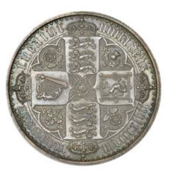
176 Proof 'Gothic' Crown, 1847, edge plain, 25.27g/12h (ESC 2578 [291B]; S 3883). Practically mint state, attractive blue-grey tone \pounds 8,000-\pounds 10,000