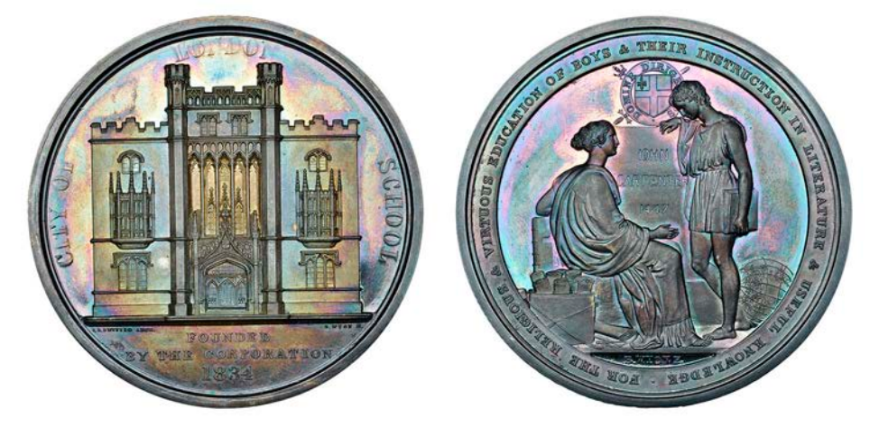
Foundation of the City of London School, 1834, a silver award medal by B. Wyon, frontal elevation of the building, rev.Knowledge seated right, instructing youth leaning on tablet, 58mm (BHM 1680; Taylor 120a; E 1279; D & W 245/328).FDC, toned; in black case of issue by Wyon, 287 Regent Street, London£140-180