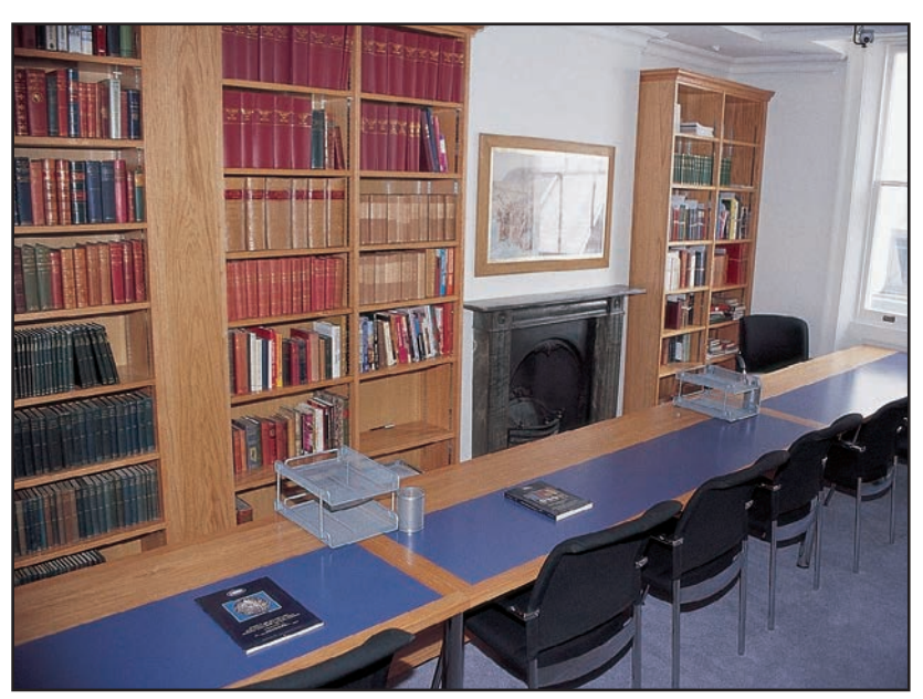
Auction viewing room

In addition, we handle discreet private treaty sales of fine orders, decorations and medals.