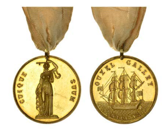
Ouzel Galley Society , Dublin , c . 1803, a gilt-copper medal, unsigned, standing figure of Justice, rev. galley left, 32mm ( cf . W 2329 ff ). Pierced with loop mount and ribbon attached, some marks in fields and a file-mark on edge, otherwise about extremely fine, extremely rare £200-260