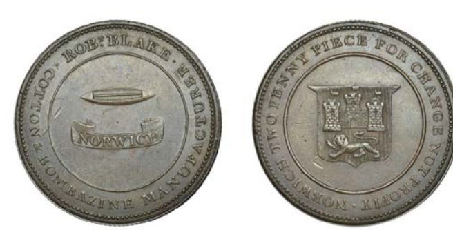
NORFOLK, Norwich, Robert Blake, Twopence, shuttle, rev. city arms, 45.56g/6h (W 910). Trifling marks, otherwise good very fine or better, patinated £80-100