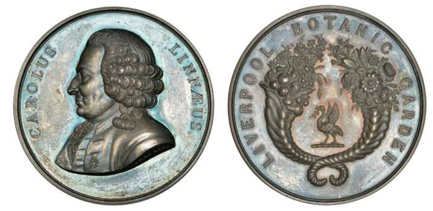
Liverpool Botanic Garden , c. 1830, a silver award medal by Sheriff, bust of Charles Linnæus left, rev . liver bird between two cornucopiae, un-named, 51mm (E 1235). Extremely fine and attractively toned, rare; in contemporary case £150-180

BRITISH HISTORICAL MEDALS FROM VARIOUS PROPERTIES