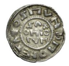
215 Æthelwulf, Penny, Saxoniorum Phase [I], Canterbury, Osmund, EDELVVLF REX around cross pattée with wedges in angles, rev. OSMVND MONETA around SAXONIORVM in three lines, 1.32g/3h (Naismith C101l, this coin; BMC 29; N 596; S 1044). Very fine, light grey tone, rare £1,500-2,000