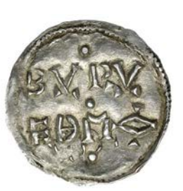
252 Plegmund , Penny, Viking imitation, Plegemyn doro retrograde around cross pattée, rev. byrved mo divided by three single pellets, 1.38g/9h (BMC 76 obv. ; N 253; S 974). Very fine and very rare £1,500-2,000