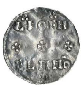
230 Edward the Elder (899-924), Penny, Portrait type [HLT 1], Leofhelm, EADVVEARD REX around diademed bust left, rev. Liofhelm M<sup>-</sup>o divided by three crosses pattée, trefoils of pellets flanking further cross pattée above, trefoil of pellets below, 1.58g/12h (CTCE 31; SCBI Ashmolean 309 and CNG 103, 1164, same dies; BMC -; N 651; S 1084). Slightly crimped, otherwise about very fine, clear portrait, toned, rare £1,500-2,000

Provenance: G.C. Drabble Collection, Part I, Glendining Auction, 4-6 July 1939, lot 397; SNC July-August 1970 (8290)