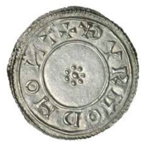
245 Eadgar, Penny, Circumscription Rosette type, no mint name, Thormodr, EADGAR RET around rosette, rev. Dyrmod mont around rosette, 1.54g/12h (CTCE 341; SCBI Edinburgh 578, same rev. die; cf. BMC 204; N 758; S 1136). Good very fine, scarce £800-1,000

Provenance: Joel Malter Auction 1 (Encino, CA), 9 November 1973, lot 505