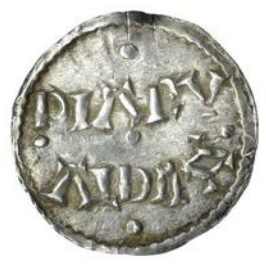
228 Alfred the Great , Penny, Phase III, Two Line type, Canterbury style, Deorweald, Elfred Rex doro around cross pattée, rev . DIARVALD MO divided by three central pellets, additional single pellet above and below, 1.53g/12h (SCBI Norweb 144, same rev . die; BMC 10; N 635; S 1069). About very fine £800-1,000