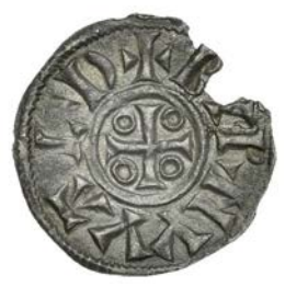
205 Berhtwulf (840-52), Penny, Gp II, London, Beornweald, BERHTVLF REX around small diademed head right breaking inner circle, rev. BVRNVVALD around cross with annulet in each angle, 1.03g/6h (Naismith L33.3b, this coin [recté 1.03g]; Booth, KCA type Ciii, no. 40, this coin [recté 1.03g]; SCBI Mack 600, this coin ; BMC 120, same dies; N 410; S 935). Chipped, otherwise good very fine and toned, very rare £1,000-1,500