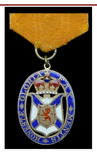
Baronet's Badge, of Nova Scotia, silver-gilt and enamel, base of crown and blue enamelled motto chipped on one side, central shield and crown slack, otherwise very fine, circa 1900 £600-800