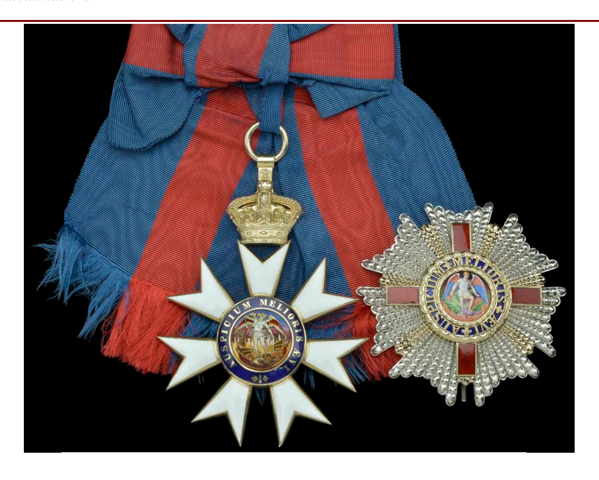
The Most Distinguished Order of St. Michael and St. George, G.C.M.G., Knight Grand Cross set of insignia, comprising sash badge, silver-gilt, gold and enamel, and breast star, silver, silver-gilt, with gold and enamel applique centre, with length of sash, good\ very\ fine\ (2)