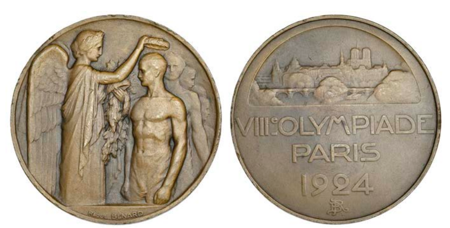
1324 Olympic Games , Paris , 1924, a bronze participant's medal by R. Bénard, winged figure crowns athlete, rev. city view in cartouche, 55mm (Gadoury 2; cf. DNW 56, 864). Good very fine

Attributed to Rudolf Svensson (1899-1978), Sweden's greatest Olympic wrestler, who won two silver medals at the Paris Olympiad for Light-heavyweight Freestyle and Lightweight Greco-Roman wrestling. He was to win gold four years later in Amsterdam (see Lot 1326) and again in the Los Angeles Games of 1932