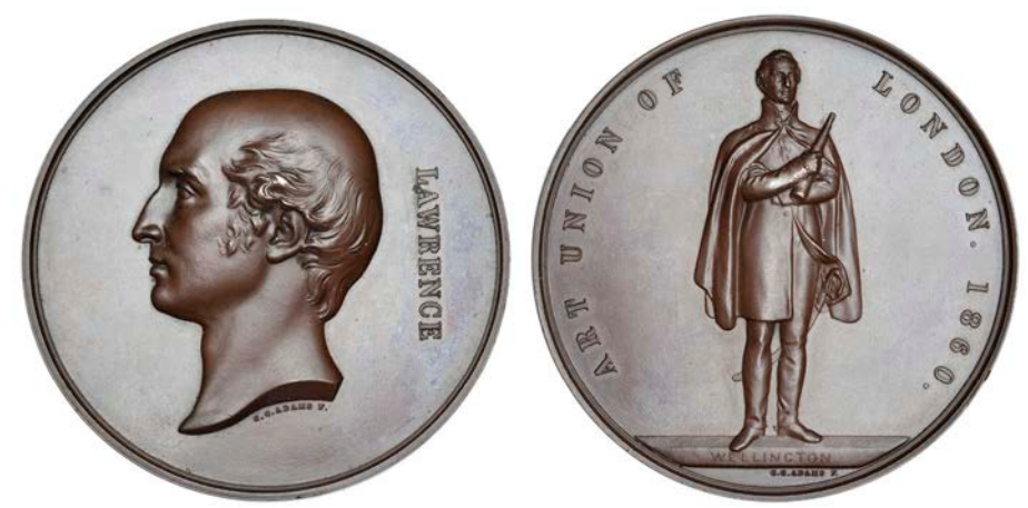
1073 Thomas Lawrence, 1860, a copper medal by G.G. Adams for the Art Union of London, bust left, rev. standing figure of Wellington, 56mm (Eimer 185; BHM 2676; E 1539; Beaulah 12). Extremely fine; in case of issue £90-120