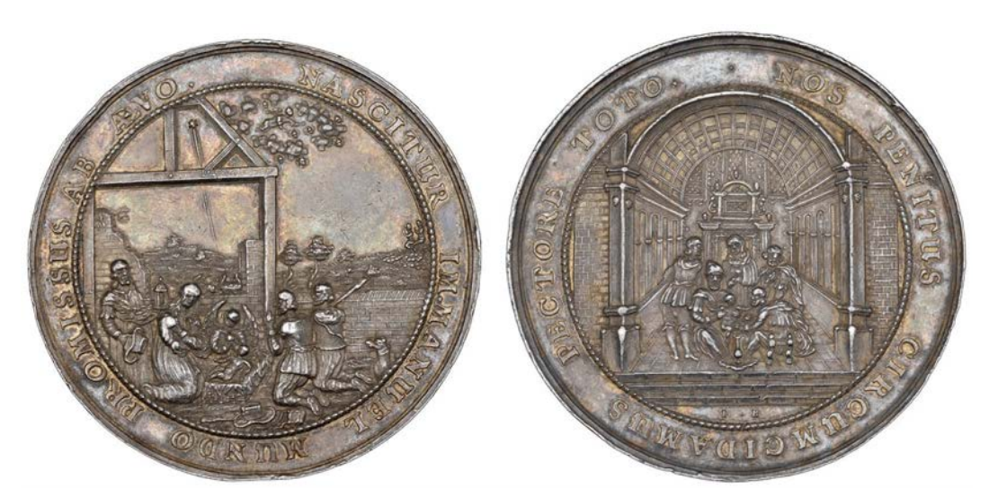
1340 Breslau , c . 1675, a silver Baptismal medal by J. Buchheim, Wise Men worship the infant Christ at the stable, rev . circumcision of the infant Christ within an ornamental chapel, 65mm, 90.21g (Goppel 1077; Jaschke 2848). Very fine and toned, rare £300-400