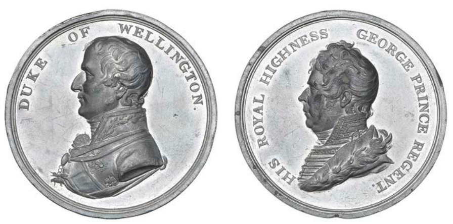
1039 Duke of Wellington and the Prince Regent, 1815, a white metal medal, unsigned, bust left, rev. bust of Prince<br/>of Wales left, 45mm (Eimer 86; BHM 857). Edge nick at 6 o'clock, otherwise almost extremely fine£80-100