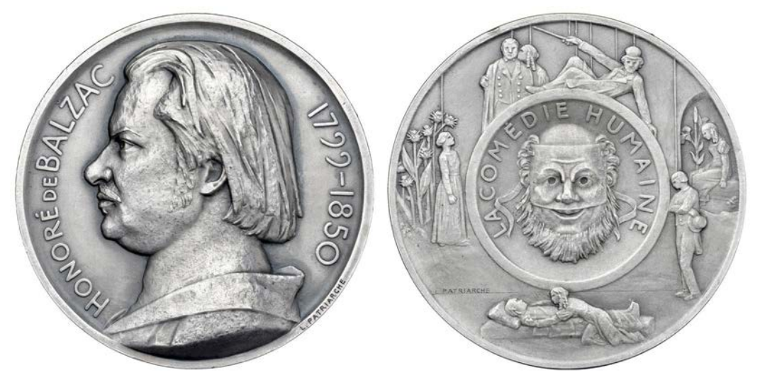
1276 Honoré de Balzac, 1933, a silver medal by L. Patriarche, bust left, rev. comedic mask, 68mm (CGMP p.304; cf. BDW 7, 853). Good very fine, rare £70-90

1275 Exposition Coloniale Internationale, Paris, 1931, a bronze medal by L. Bazor, Marianne greets figures representing North Africa, sub-Saharan Africa and Indo-China, rev. plan of the Expo, 68mm (CGMP p.30; cf. DNW M7, 2474); Construction, or Tailleurs de Pierre, 1934, a uniface bronze plaque by L. Burger, 72 x 53mm (CGMP p.69; cf. DNW 56, 822); together with other medals and plaques (6), by Anie Mouroux, Baron, Delannoy, Grun, etc [8]. Very fine and better; one in case of issue