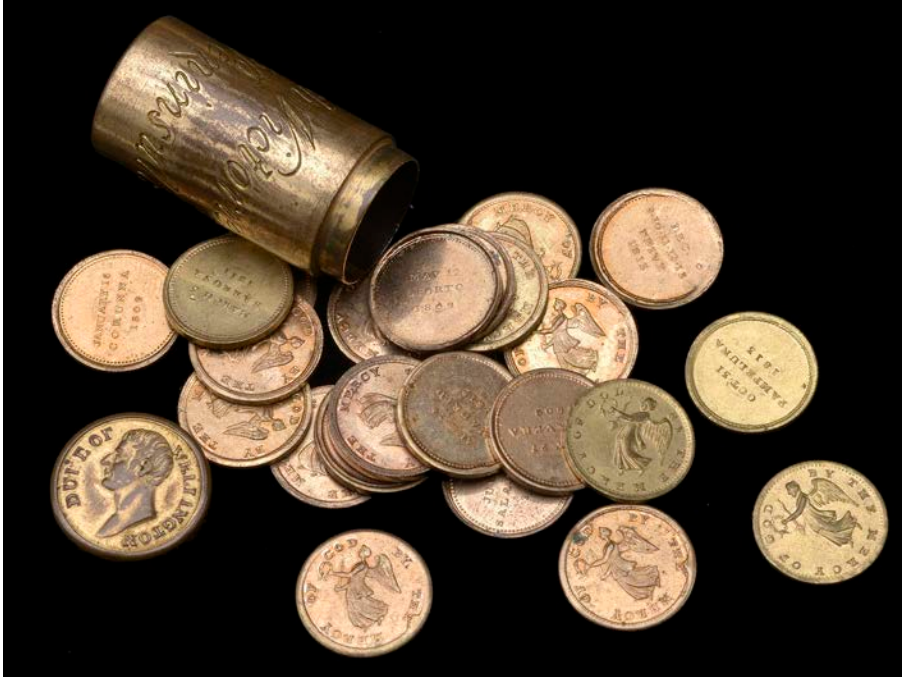
1038 British Battles, 1815, a set of 26 gilt-bronze medalets by E. Thomason, revs. with names and dates of the Peninsula engagements, all 19mm (Eimer 84; BHM 888; E 1076) [Lot]. Practically as struck; contained in the original tube, outside engraved 'British Victories in the Peninsula'