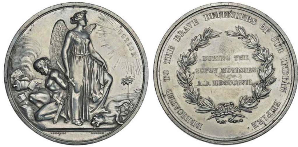
1396 Defenders of the Indian Empire during the Sepoy Mutinies, 1857, a white metal medal by J. Pinches, winged figure of Justice standing with foot on dead tiger, native captive kneeling behind her, chained to a sword she holds, rev. legends in and around wreath, 63mm (Pudd. 857.1; BHM 2601; E 1515). Surfaces marked, otherwise very fine or better £90-120