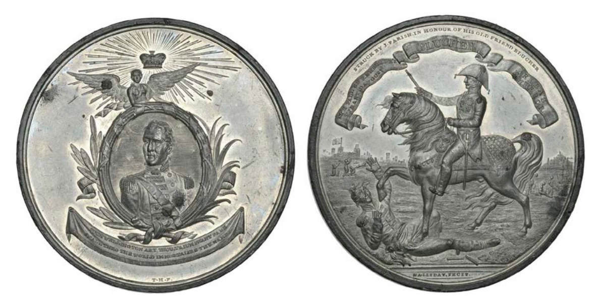
1031 Battle of Waterloo, 1815, a white metal medal by T. Halliday, bust in oval frame, angel and radiate crown above, rev. equestrian figure of Blücher tramples a bespectacled figure, 72mm (Eimer 58; BHM 902; E 1072; Bramsen 1736). Very fine, scarce £90-120

Illustration reduced. William Wellesley Pole, Master of the Mint and the Duke's elder brother, invited designs from the Royal Academy for a gold medal intended to be given to the rulers of the Alliance, their generals and senior ministers. The Prince Regent, however, approved the design submitted by Pistrucci, an engraver at the Mint. Pistrucci was much involved with the new coinage of 1816 and it was not until 1819 that preparatory wax models were submitted for approval. Amazingly thirty years were to elapse before the dies were completed, by which time all of the intended recipients of the medal, with the sole exception of Wellington, had died. Electrotype copies, the majority with obverse and reverse not united, were eventually produced by William Hamilton in 1852