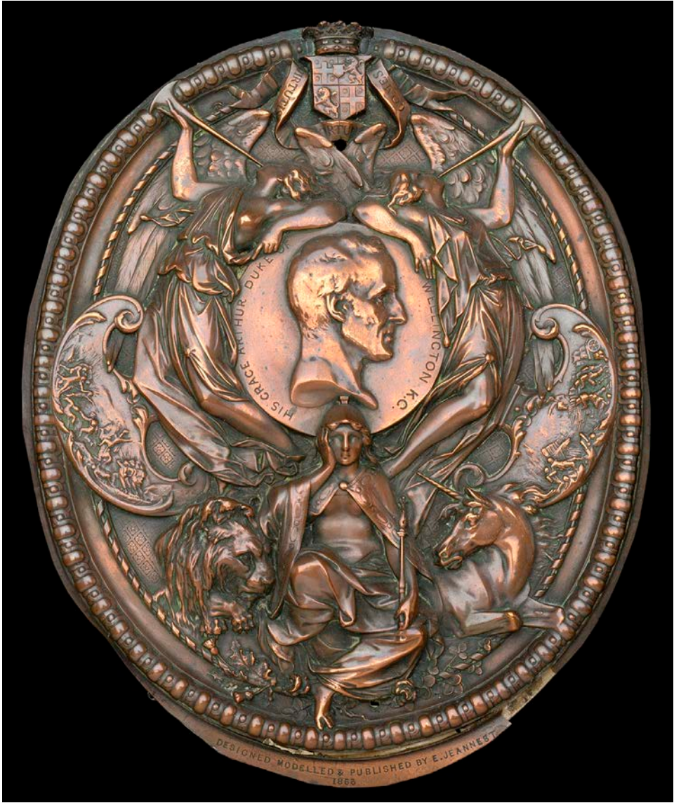
1070 Duke of Wellington Memorial, 1853, a uniface oval electrotype medallic plaque by E. Jeannest [for Elkington], bust right upon a central oval medallion, surrounded by figure of Fame either side, Duke's shield, crest and motto, seated figure of Britannia in mourning, between a lion and a unicorn, floriated background, 230 x 204mm (Eimer 182). Chipped and repaired at bottom, otherwise very fine

1069 Obsequies for the Duke of Wellington, 1852, a small uniface gold medal, unsigned, bust left, 9mm (Eimer 180).<br/>Extremely fine and very rare; in small turned mahogany box£150-200