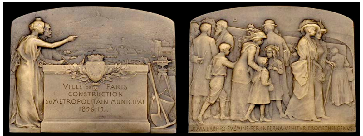
1268 Construction du Métropolitain Municipal de Paris, 1912, a bronze plaque by F.-C.-V. de Vernon, two<br/>standing figures by plinth, aerial view of Paris in background, rev. passengers disembarking from a Métro train, 90 x<br/>70mm (PBE 992; Maier 172; Moyaux -; BDM -). Extremely fine, rare £100-150

Provenance: DNW Auction 40, 14 April 1999, lot 704