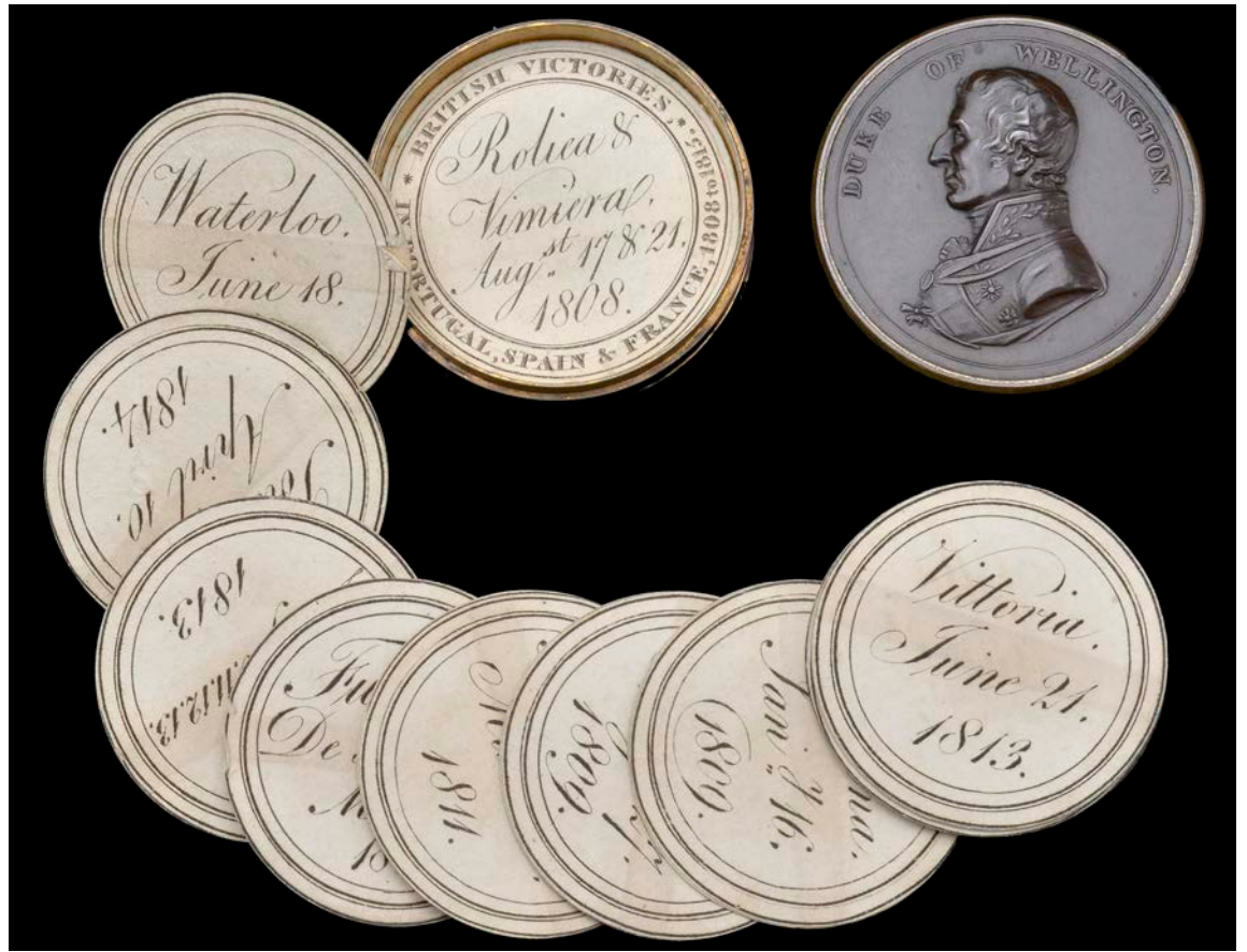
1036 British Battles, 1815, a copper box medal with a double opening, unsigned, bust left, rev . legend in 11 lines within wreath, top half of box containing 13 [of 14] monochrome roundels, lower compartment might have been used for snuff, 47mm (Eimer 82; BHM 885; E 1075a) [Lot]. Extremely fine £250-300 Provenance: Bt D. Fearon.

The missing roundel is for Arroyo del Molino/Orthes, 1814