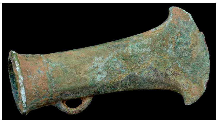
730 Bronze Age , Socketed axe, splayed outline with faceted body and curved cutting edge, loop below mouth moulding, 10.5 x 5.5cm. Intact with a green patina £150-200

This and the following 12 lots date from around 1000-800 BC. They are believed to have been found in Kent prior to 1980 and are types typical of south-eastern England