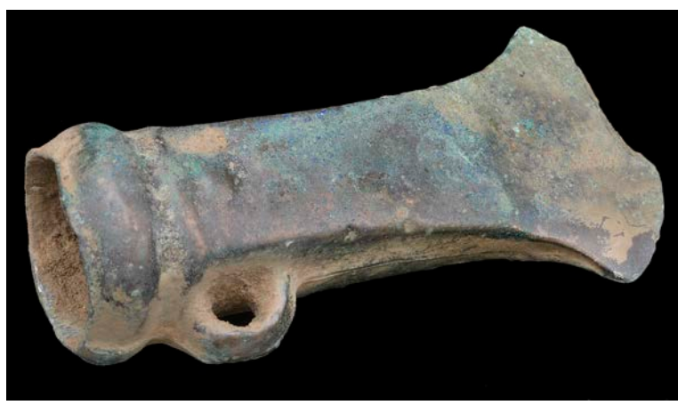
733 Bronze Age , Socketed axe, splayed outline with curved cutting edge, loop below mouth moulding, 96 x 47mm. Chipping to blade edge, green patina \pounds 40-60