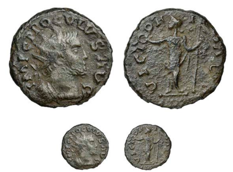
694 Proculus (Usurper c. 280-281), billon Radiate, uncertain Gallic mint, IMP C PROCVLVS AVG, radiate and cuirassed bust right, rev. VICTORIA AVG, female figure standing left, holding wreath and sceptre, 2.97g/12h (Vagi, Coinage and History of the Roman Empire, 2470). Very fine, dark tone, edge a little ragged; only the second known coin of this usurper, extremely rare and the only example available to commerce £50,000-70,000

Provenance: Found near Stamford Bridge, N. Yorkshire, November 2012 (UKDFD 39525).