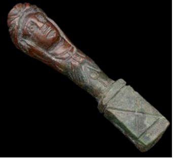
743 Roman , 2nd century, bronze knife handle, head of Hercules wearing lion-skin, 52mm. Good facial details, attractive green patina \pounds 150-250