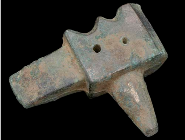
738 Bronze Age , multi-tool?, anvil shape with strong spike below, strong wedge shape tang at side, grooved top, faceted back, flat sides with two small holes each side, perhaps used as a block for working with jewellery, 75 x 62 x 22mm. **Brown patina with a silvered finish** £100-150