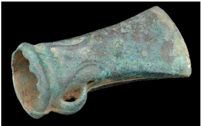
732 Bronze Age , Socketed axe, trapezoid outline expanding to curved cutting edge, loop below mouth moulding decorated with linear-wing ornamentation, 78 x 37mm. Intact with a green patina, two small casting holes £120-150