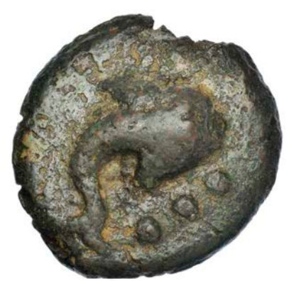
525 HATRIA, Teruncius, c. 275-225, dolphin right, rev. stingray, 112.85g/12h (HN Italy 14; ICC 239; Hæberlin p.208, pl. 76, 3-5). Fine to very fine, dark tone £100-150