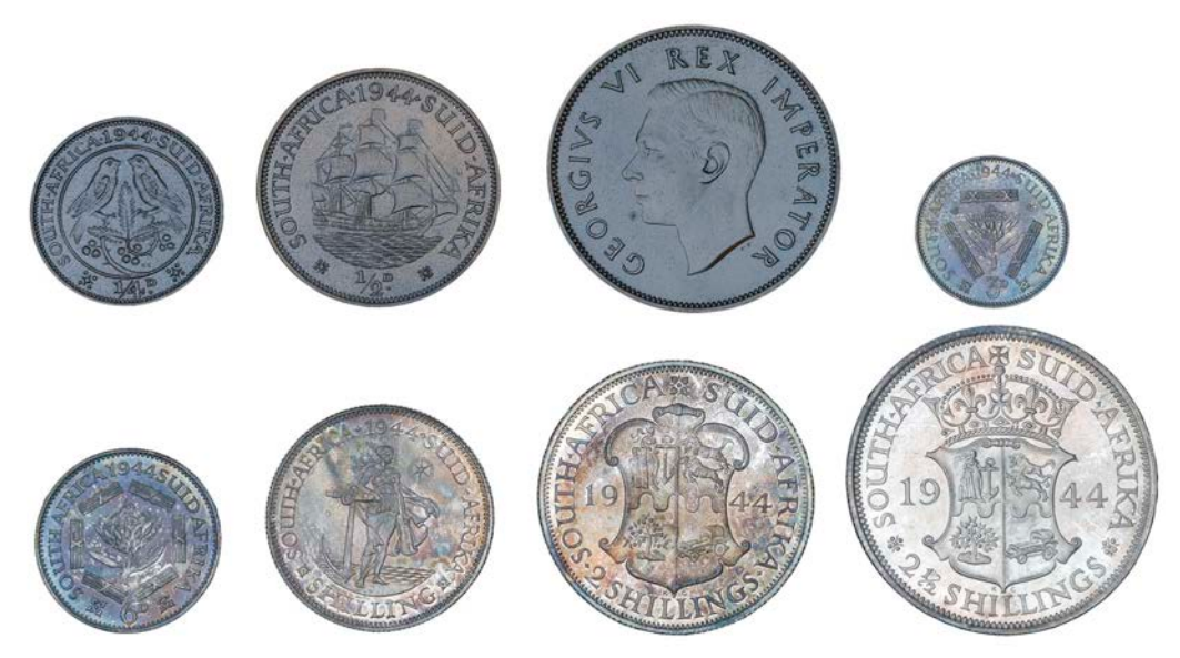
1572 George VI , Proof set, 1944, comprising Halfcrown to Farthing (Hern P17; KM. PS16) [8]. Silver slightly stained, otherwise about as struck, toned; in card case of issue 150 sets issued