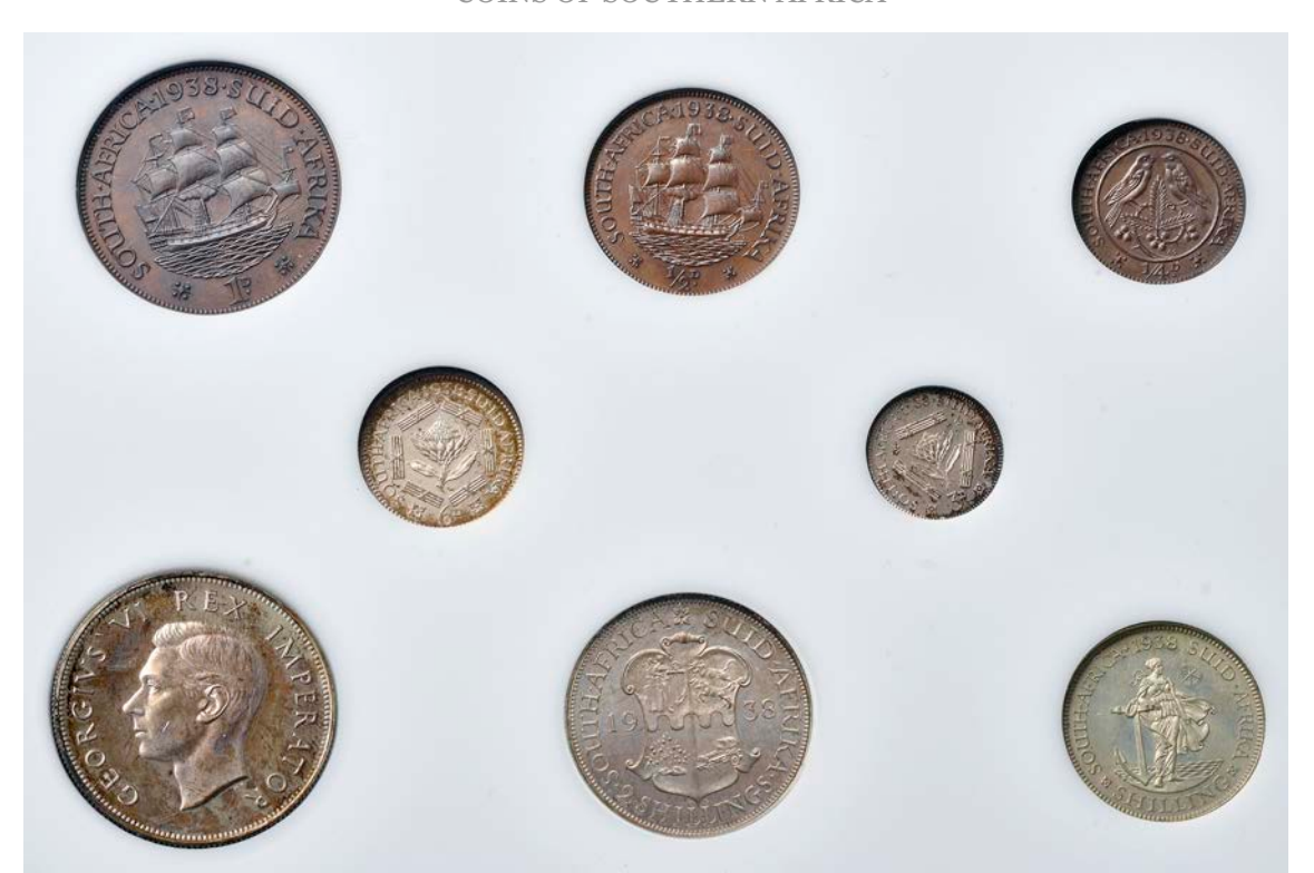
1571 George VI, Proof set, 1938, comprising Halfcrown to Farthing (Hern P14; KM. PS12) [8]. Silver stained, possibly lightly cleaned at some time, otherwise about as struck; in perspex fitted case £1,200-1,500 Provenance: J.J. Pittman Collection, Part III, David Akers Auction (Rosemont, USA), 6-8 August 1999, lot 4849. 44 sets issued