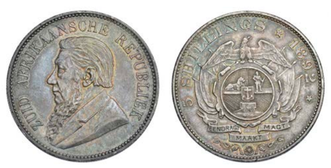
1535 Paul Kruger , Crown, 1892, single shaft (Hern Z37; KM. 8.1). Good very fine or better

Provenance: Baldwin Auction 48, 26 September 2006, lot 5089