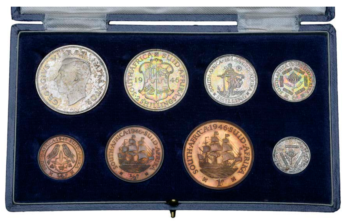
1574 George VI , Proof set, 1946, comprising Halfcrown to Farthing (Hern P19; KM. PS18) [8]. About as struck, silver a little tarnished; in SAM leather case 150 sets issued