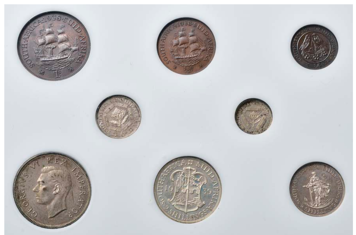
1561 George VI , Proof coins, 1938-9, viz. Halfcrown [1938], 2 Shillings [1939], Shilling, Sixpence, Threepence, Penny and Halfpenny [all 1938], Farthing [1939] (Hern S19, 59, 98, 137, 175, 213, 252, 289; KM. 23-30) [8]. Silver possibly lightly cleaned at some time, otherwise about as struck; in perspex fitted case, a rare group £1,000-1,500