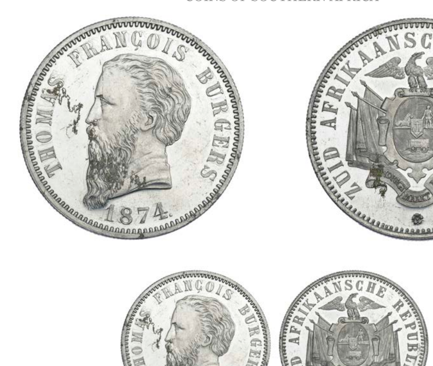
1518 Thomas Burgers, Pattern Crown, 1874, by L.C. Lauer, in aluminium, bust left, closed 4 and stop after date, rev. arms, edge grained, 7.97g/6h (Hern T6; KM. PnA 13 var). Some corrosion and scratched in front of bust, hairlined, otherwise about as struck, very rare £3,000-4,000

Provenance: Baldwin Auction 48, 26 September 2006, lot 5099