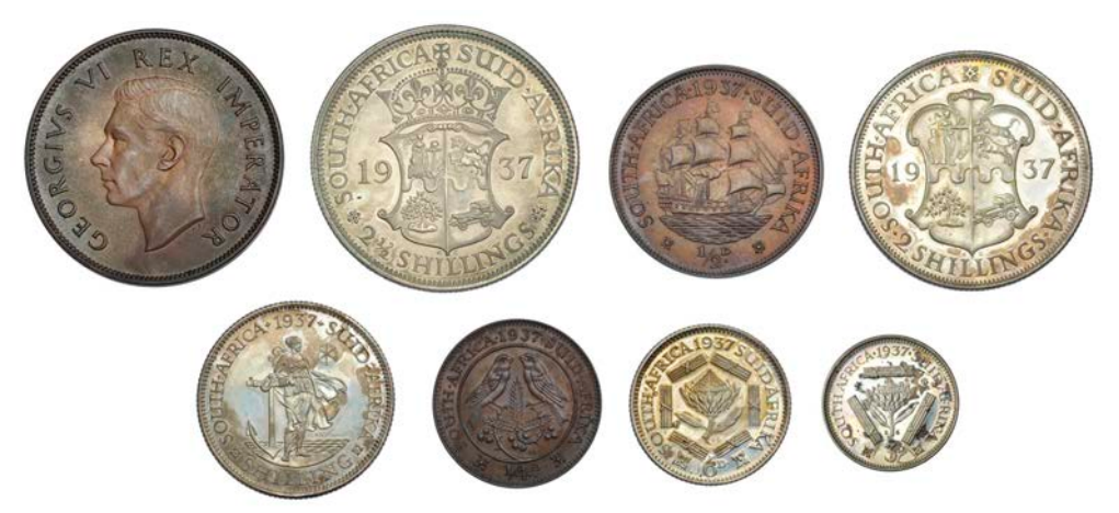
1570 George VI , Proof set, 1937, comprising Halfcrown to Farthing (Hern P13; KM. PS12) [8]. About as struck, toned; in card case of issue [this damaged] £1,000-1,200