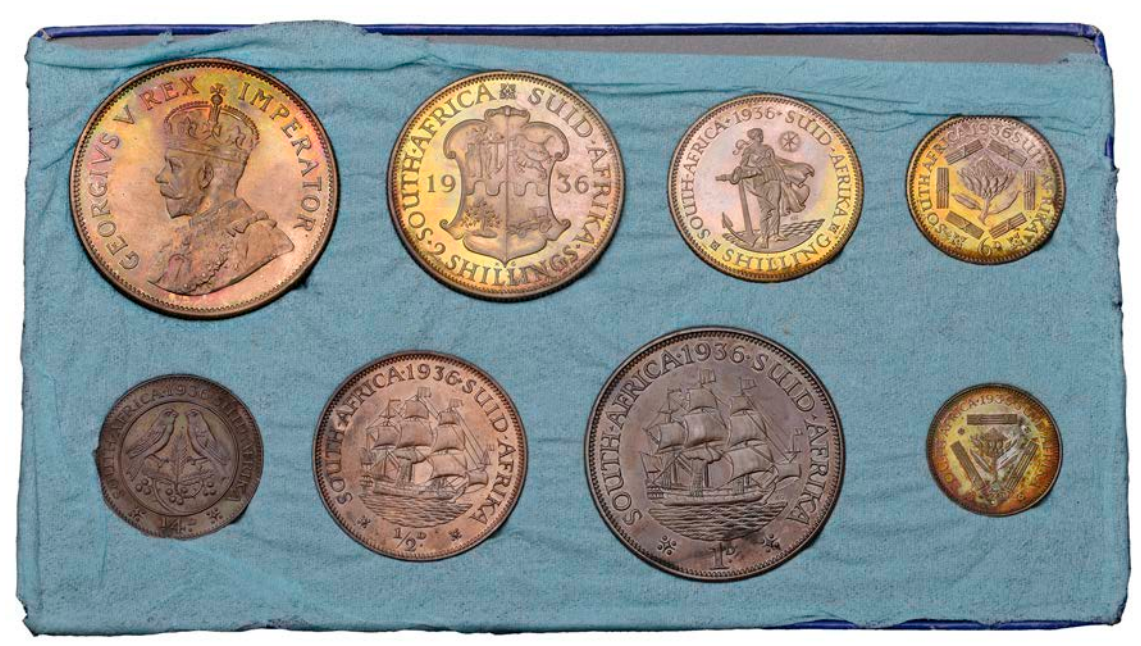
1560 George V, Proof set, 1936, comprising Halfcrown to Farthing (Hern P12; KM. PS11) [8]. Virtually as struck, toned; in embossed card case of issue, rare £2,500-3,000

2 Shillings only illustrated. 40 sets issued. Slabbed in CGS UK holders, graded UNC 90, UNC 92, UNC 91, UNC 90, UNC 88, UNC 90 and UNC 90 respectively