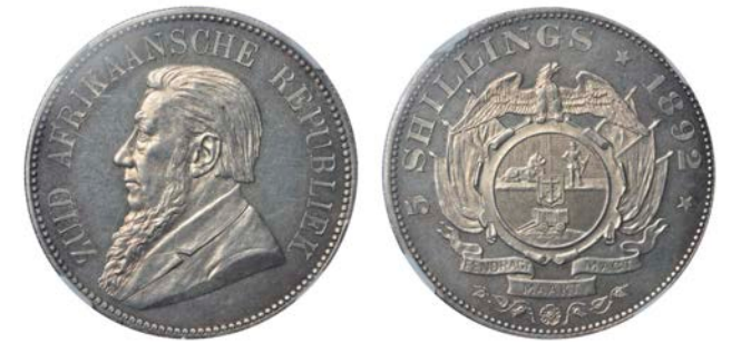
1533 Paul Kruger, Proof Crown, 1892, double shaft, edge grained, 11h (Hern Z36; KM. 8.2). A few light hairlines, otherwise practically as struck, extremely rare £6,000-8,000 Slabbed in NGC holder, graded PF 62