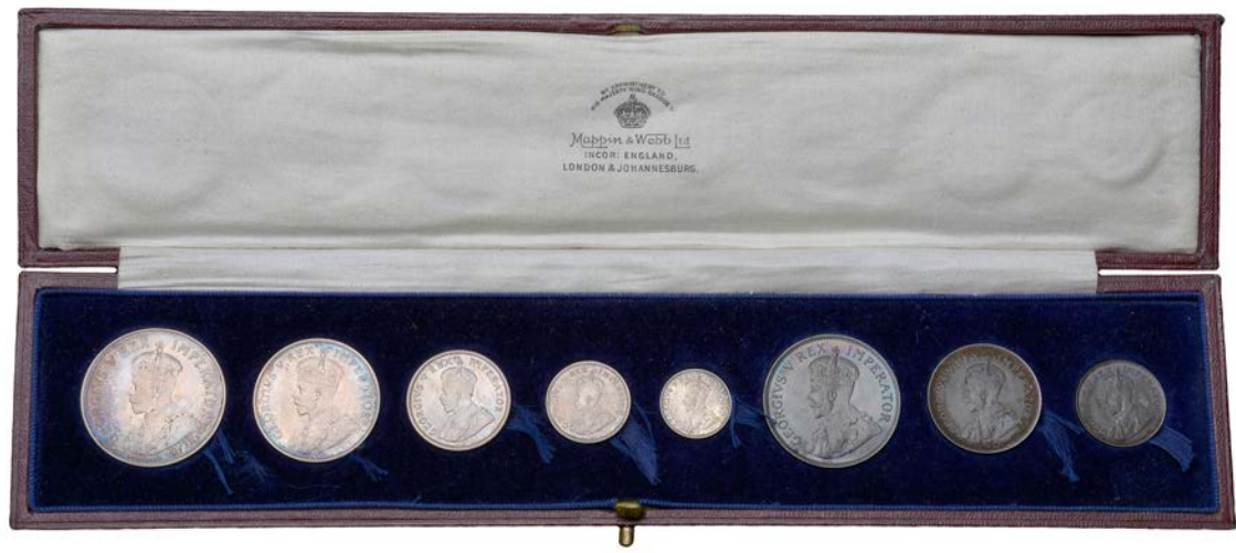
1558 George V, Proof set, 1923, comprising Halfcrown to Farthing (Hern P2; KM. PS 2) [8]. Silver lightly toned, otherwise brilliant and practically as struck, rare; in original maroon fitted case by Mappin & Webb £600-800