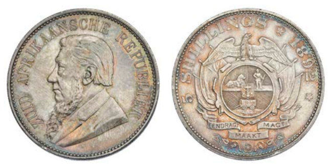
1531 Paul Kruger , Crown, 1892, double shaft (Hern Z36; KM. 8.2). A couple of rim nicks, otherwise about extremely fine with patchy toning £300-400