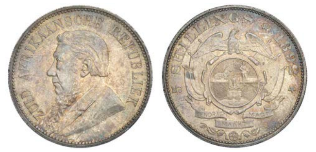
1534 Paul Kruger, Crown, 1892, single shaft (Hern Z37; KM. 8.1). Minor surface marks, otherwise good extremely fine, toned £1,000-1,200

Provenance: Baldwin Auction 48, 26 September 2006, lot 5089