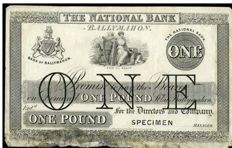
3331 The National Bank, One Pound, Ballymahon , uniface proof on paper, stamped SPECIMEN at lower right (NA 27). Worn bottom edge, otherwise extremely fine £90-120