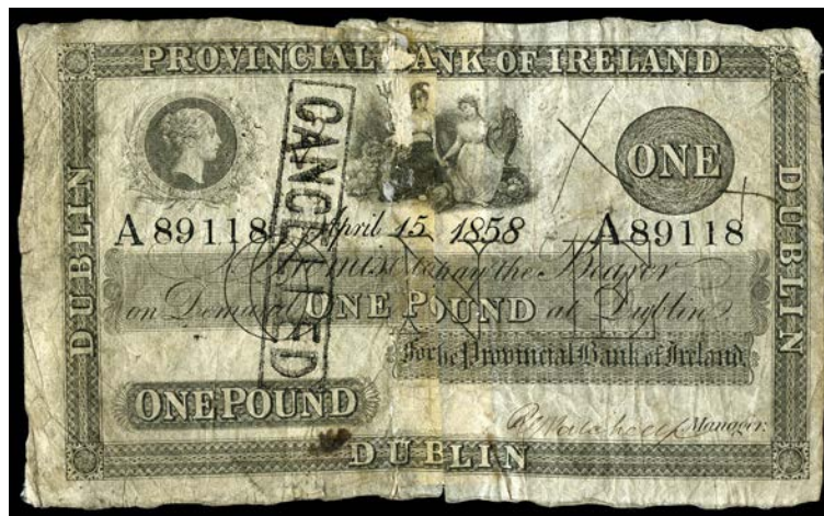
3340 Provincial Bank of Ireland, One Pound, 15 April 1858, A 66760, Dublin , stamped CANCELLED on left side (PR 35). Split and rejoined at centre, pinholes, otherwise about very fine £180-220