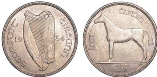
3232 Halfcrown, 1934 (S 6625). Trifling bagmarks, otherwise brilliant mint state