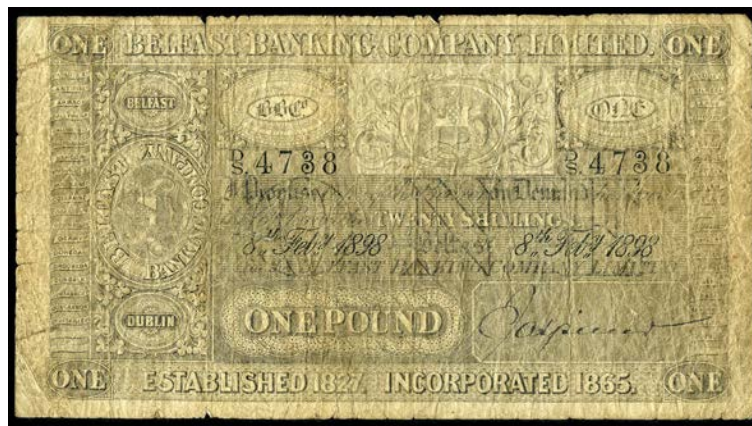
3317 Belfast Banking Co Ltd , One Pound, 8 February 1898, D/S 4738, signature of E.A. Spiller (BB 46b; Pick –). Two tears in top edge, bottom edge worn and a few tiny splits in body, otherwise very good, scarce £500-600