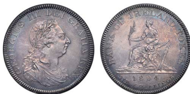
3299 George III , Bank of Ireland coinage, Six Shillings, 1804, top leaf of wreath points to upright of E in DEI (S 6615; DF 614). Hairline scratches on reverse, otherwise extremely fine and toned