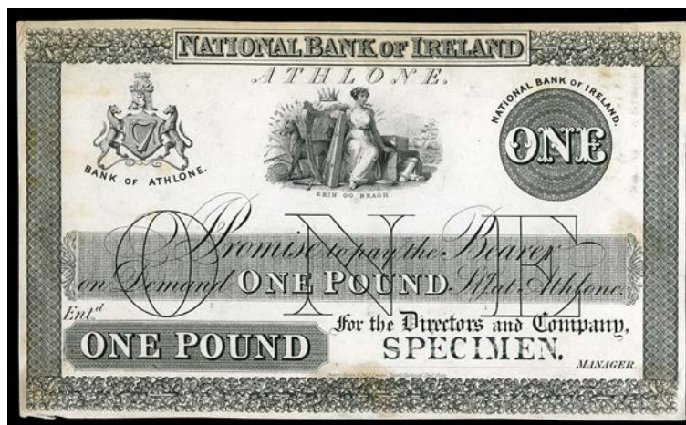
3330 National Bank of Ireland, One Pound, Athlone , uniface proof on card, stamped SPECIMEN at bottom right (NA 22). Mount marks and some wear on the back, otherwise about extremely fine £120-150