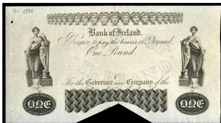
3316 Bank of Ireland, One Pound, uniface proof on bank watermarked paper, 'Feb. 1886' pencilled at top left (BA 51). Small hole at top left and V-shaped section cut from bottom edge, otherwise about extremely fine £150-200