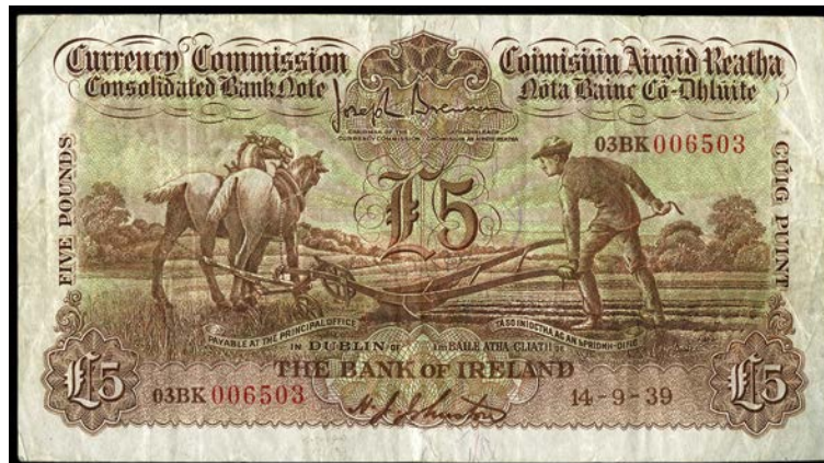
3328 Currency Commission (Consolidated issues), Bank of Ireland , Five Pounds, 14 September 1939, 03BK 006503, Brennan-Johnston signatures (CB1 2; MacDevitt E-004). Very fine £600-800