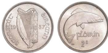
3240 Florin, 1937 (S 6626). Minor bagmarks, otherwise practically mint state