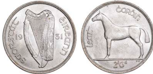
3230 Halfcrown, 1931 (S 6625). Reverse with bagmarks, otherwise brilliant mint state