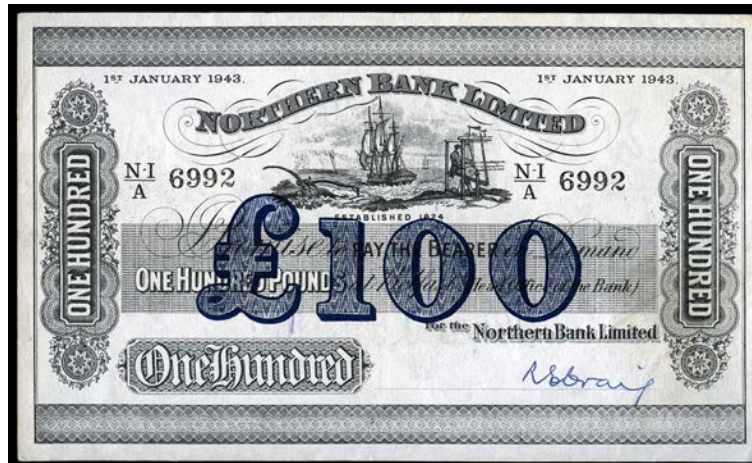
3334 Northern Bank Ltd , One Hundred Pounds, 1 January 1943, N-I/A 6992, signature of R.E. Craig (NR 85, this note illustrated ; Pick 183). Small smudge on back, otherwise good very fine £350-400