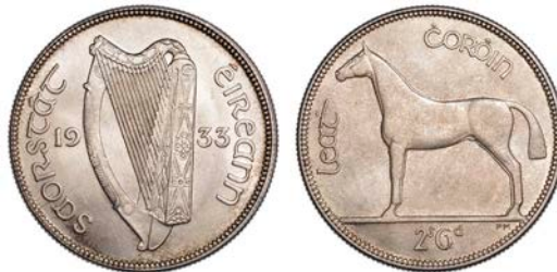
3231 Halfcrown, 1933 (S 6625). Brilliant mint state