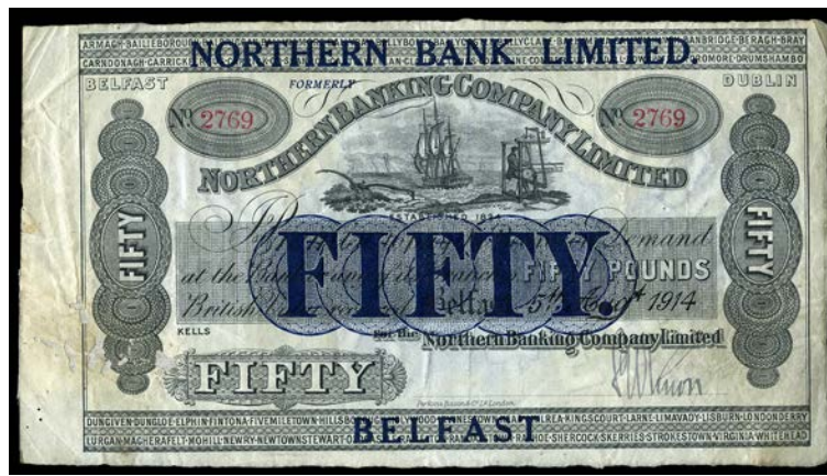
3333 Northern Bank Ltd , Fifty Pounds, 1929, overprint on original date 5 April 1914, no. 2769, signature of S.W. Knox (NR 64; Pick 175). Repairs on back and lower left covering small holes, otherwise good very fine £300-350