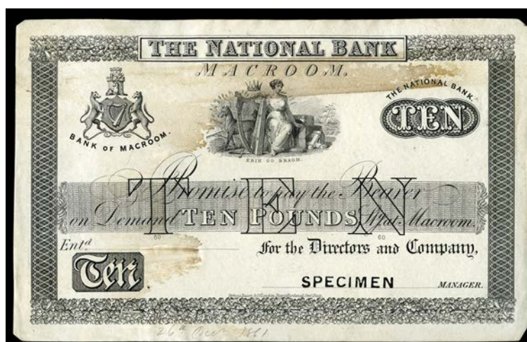
3332 The National Bank, Ten Pounds, Macroom , uniface proof on paper, stamped SPECIMEN at bottom right, '26th Oct 1861' pencilled in bottom margin (NA 30). Clipped corner tips and a light ink splash, otherwise extremely fine £120-150