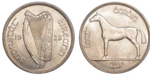
3228 Halfcrown, 1928 (S 6625). Brilliant mint state