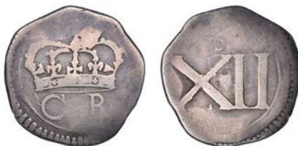
3293 Charles I , Ormonde Money, Shilling, 5.51g/12h (S 6546; DF 297). Better than fine