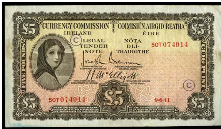
3325 Currency Commission , Five Pounds, 9 June 1941, 50T 074914, code letter C, Brennan-McElligott signatures (LTN 19; MacDevitt E-091). A few light marks in margins, otherwise very fine £90-120