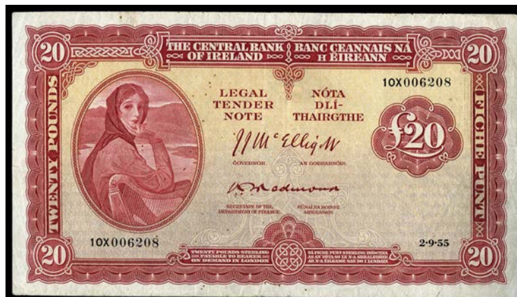
3319 The Central Bank of Ireland , Twenty Pounds, 2 September 1955, 10X 006208, McElligott-Redmond signatures (LTN 37; MacDevitt E-116). Lightly pressed and a few tiny spots, otherwise very fine £150-200