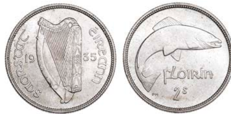
3239 Florin, 1935 (S 6626). Bagmarks and minor grazes, otherwise practically mint state