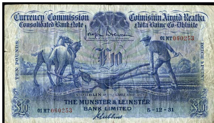
3329 Currency Commission (Consolidated issues), Munster & Leinster Bank Ltd , Ten Pounds, 5 December 1931, 01MT 060253, Brennan-Gubbins signatures (CHB 3; MacDevitt E-020). Pinholes and a 15mm tear in left edge, otherwise good fine £1,200-1,500