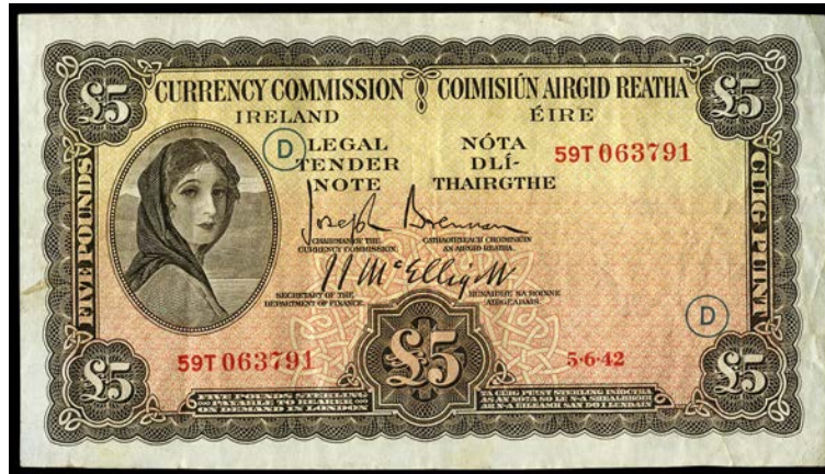
3326 Currency Commission , Five Pounds, 5 June 1942, 59T 063791, code letter D, Brennan-McElligott signatures (LTN 19; MacDevitt E-091). Very fine to good very fine £90-120