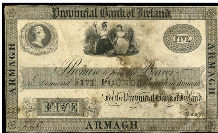
3337 Provincial Bank of Ireland, Five Pounds, Armagh , proof on card with later vignette of George IV (PR 14; Pick –). Staining both sides, otherwise very fine or better £200-250