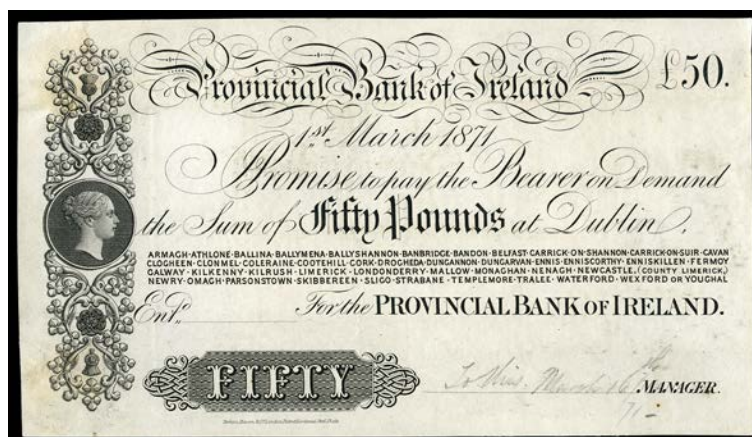
3342 Provincial Bank of Ireland, Fifty Pounds, 1 March 1871, proof on paper, 'To this March 16th/71' pencilled at lower right (PR 56, this note illustrated). Mount marks on backs of two corners and slight thinning on bottom left corner, otherwise good extremely fine £300-350