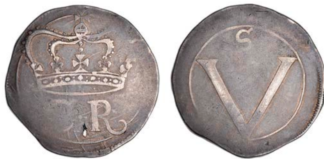
3292 Charles I , Ormonde Money, Crown, 29.51g/9h (S 6544; DF 288). Fine