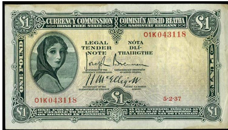
3322 Currency Commission, One Pound, 5 February 1937, 01K 043118, Brennan-McElligott signatures (LTN 9; MacDevitt E-076). Light stain on top edge, otherwise very fine or better £120-150