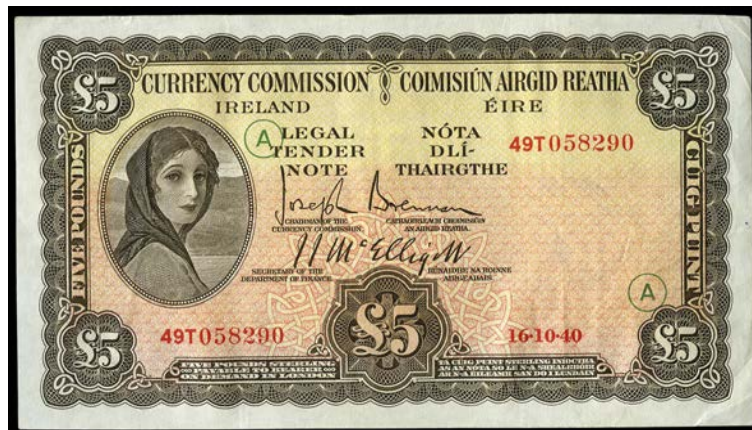
3323 Currency Commission, Five Pounds, 16 October 1940, 49T 058290, code letter A, Brennan-McElligott signatures (LTN 19; MacDevitt E-091). Good very fine £120-150