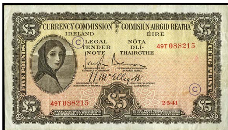
3324 Currency Commission, Five Pounds, 2 May 1941, 49T 088215, code letter C, Brennan-McElligott signatures (LTN 19; MacDevitt E-091). Very fine £90-120