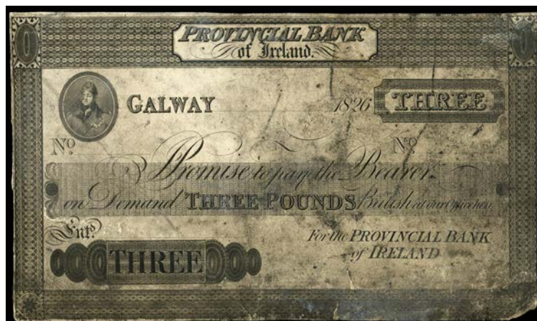
3336 Provincial Bank of Ireland , Three Pounds, 1826, Galway, proof on light card with early vignette of George IV (PR 6, this note illustrated ). Grubby, a few pinholes, short tear and rounded corner on bottom edge, otherwise about very fine, scarce £400-450