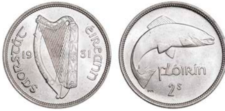
3236 Florin, 1931 (S 6626). Minor bagmarks on reverse, otherwise practically mint state