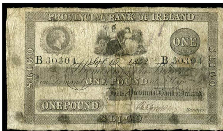
3338 Provincial Bank of Ireland, One Pound, 15 September 1852, B 30304, Sligo (PR 34; Pick –). Split and rejoined at centre with part of serial number on right side removed and replaced to match original number, neat handiwork, fine £120-150