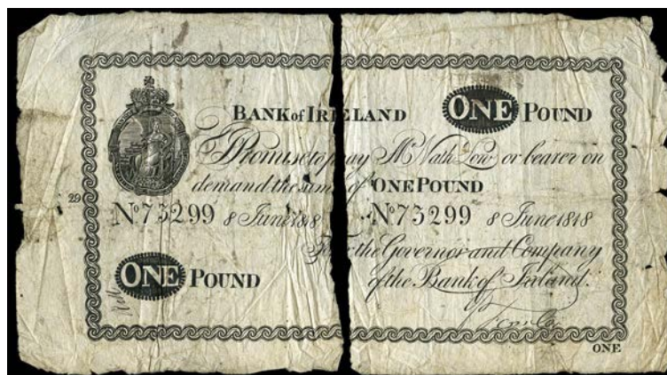
3315 Bank of Ireland, One Pound, 8 June 1818, contemporary forgery (cf. BA 14). Split at centre but not rejoined, various small holes, splits and notations on back, otherwise good to very good £200-250