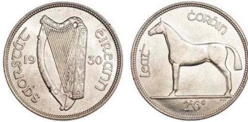
3229 Halfcrown, 1930 (S 6625). Brilliant mint state