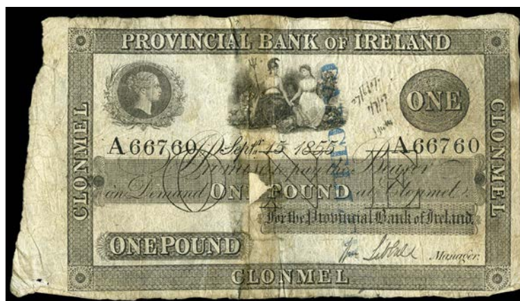
3339 Provincial Bank of Ireland, One Pound, 15 September 1855, A 66760, Clonmel , stamped CANCELLED on right side (PR 35). Split and rejoined at centre, covering piece missing from middle, fine £120-150