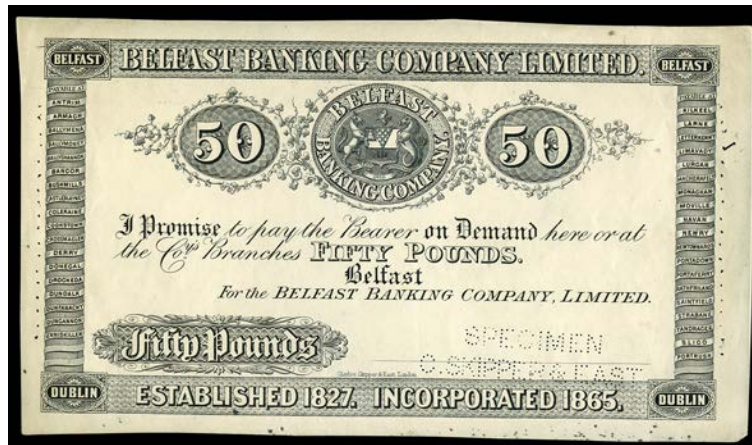
3318 Belfast Banking Co Ltd , Fifty Pounds, uniface black and white proof on paper, perforated SPECIMEN C SKIPPER & EAST (BB 57a; Pick A54). A line of ink dots and one tick alongside branches in border, otherwise good very fine to about extremely fine £200-250