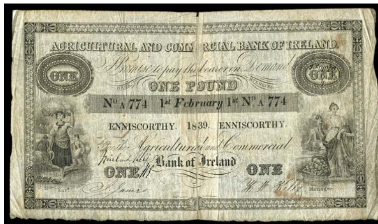
3313 Agricultural and Commercial Bank of Ireland, One Pound, 1 February 1839, A774 (AG 5c). Split and rejoined at centre, very fine £350-400