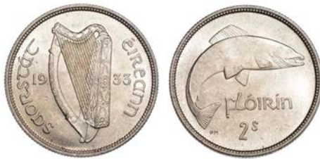
3237 Florin, 1933 (S 6626). Trifling bagmarks, otherwise brilliant mint state