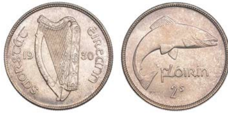
3235 Florin, 1930 (S 6626). Brilliant mint state