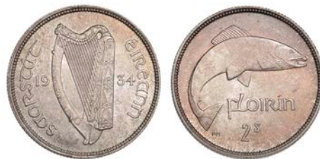
3238 Florin, 1934 (S 6626). Practically mint state, toned