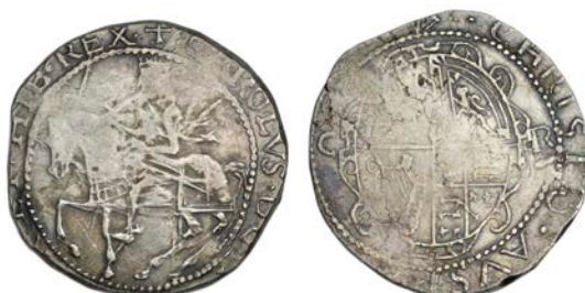
3294 Charles I , Confederate Catholics, 'Blacksmith's' issue, Halfcrown, mm. cross pattée with pellet/harp, horse with cross on housing, no groundline, 14.78g/4h (Bull – [dies not listed]; S 6557; DF 335). Flat in places, otherwise good fine