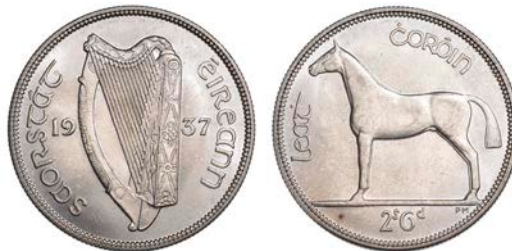
3233 Halfcrown, 1937 (S 6625). Minor bagmarks, otherwise brilliant mint state, rare