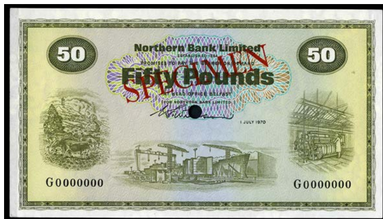
3335 Northern Bank Ltd , Fifty Pounds, 1 July 1970, colour trial, G 0000000, signature of W.S. Wilson, stamped SPECIMEN in red, small punch-hole through signature area (NR 105; Pick 191). Uncirculated £150-200