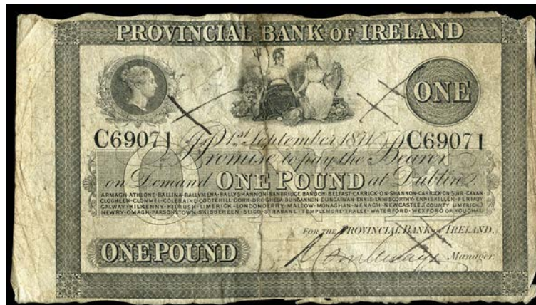
3341 Provincial Bank of Ireland, One Pound, 1 September 1871, C 69071 (PR 51). Split and rejoined at centre, pinholes, otherwise fine £120-150