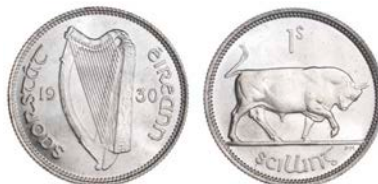
3242 Shilling, 1930 (S 6627). Trifling bagmarks, otherwise brilliant mint state