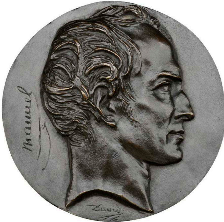
1342 Jacques-Antoine Manuel , 1830, a large uniface cast bronze medal by D. d'Angers, bust right in high relief, 145mm (Reinis 301). A good mid-19th century cast on a thick flan by Eck et Durand, extremely fine £150-200