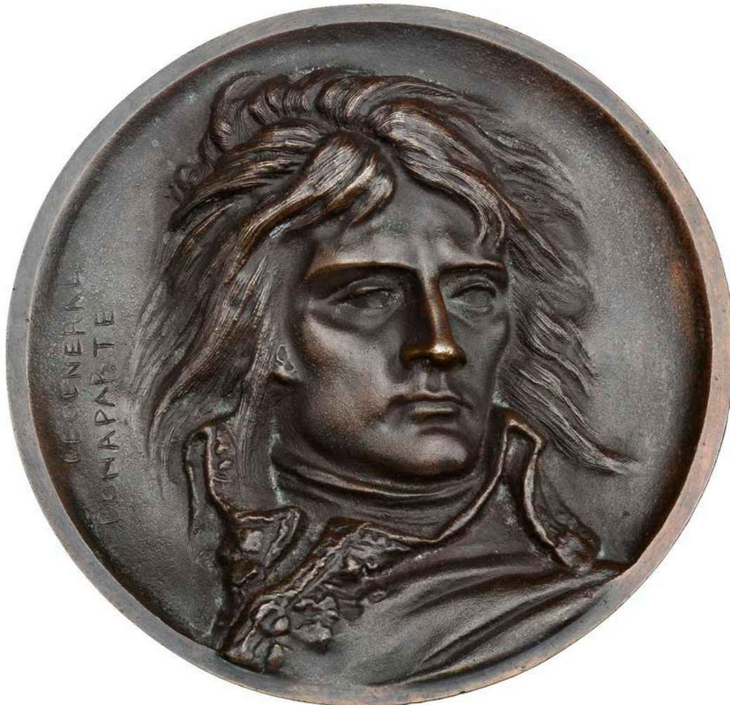
1343 Napoléon Bonaparte , 1832, a large uniface cast bronze medal, unsigned [after D. d'Angers], youthful uniformed bust, head turned almost full-face, 157mm (Reinis 58). A good mid-19th century cast by Eck et Durand, good very fine; edge pierced for suspension £100-150