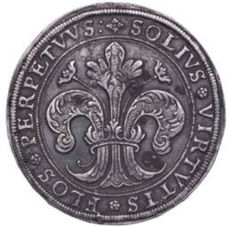
3423 STRASBOURG , City, Thaler, undated, 28.62g/12h (KM. 306; Dav. 5842). Surface stains, otherwise very fine or better £150-200