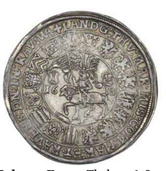
3436 SAXE-COBURG-EISENACH , Johann Casimir and Johann Ernst , Thaler, 1618wa, Saalfeld, 28.95g/4h (Dav. 7429). Nearly very fine , toned £150-200