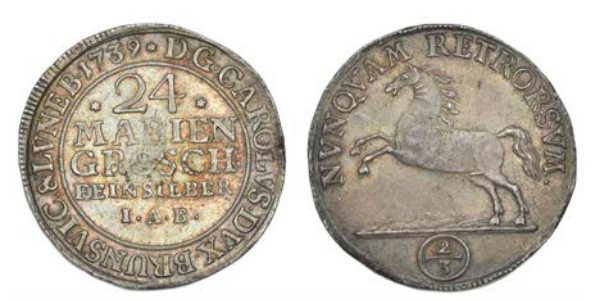
3432 BRUNSWICK-WOLFENBÜTTEL , Karl I , Two-Thirds-Thaler, 1739IAB, Zellerfeld (KM. 895). Good very fine, toned