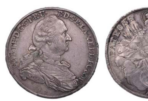
3428 BAVARIA , Karl Theodor , Thaler, 1778Hs (KM. 563.1; Dav. 1964). Some adjustment marks on reverse, otherwise very fine or better £90-120