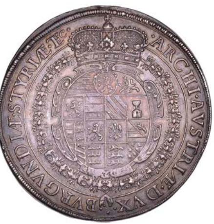
3397 Ferdinand III, Broad Double-Thaler, 1641, Graz, 57.55g/12h (KM. 876.1; Dav. A3186). Suspension ring removed at 12 o'clock and some light surface marks and cracks, otherwise good very fine and lightly toned, still an impressive piece £400-600

Provenance: Spink Auction, 30 September 2010, lot 665