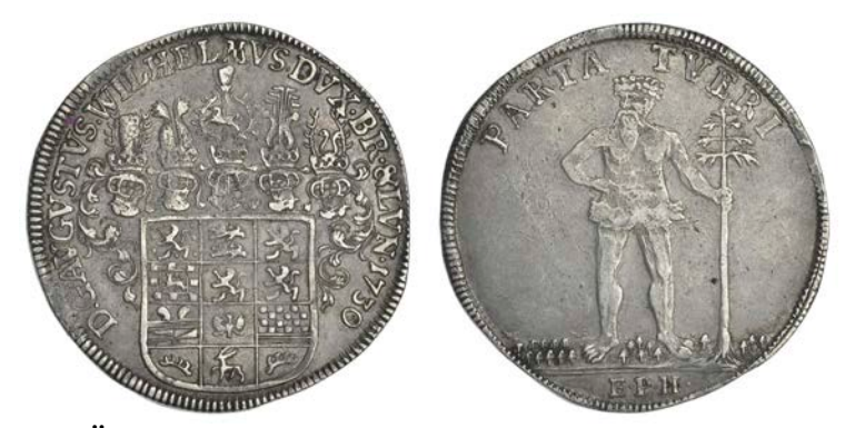
3431 BRUNSWICK-WOLFENBÜTTEL, August Wilhelm, Thaler, 1730ерн, Zellerfeld (КМ. 739; Dav. 2126). About very fine £200-250