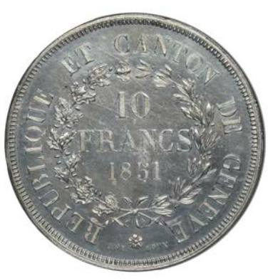
3506 GENEVA , City, 10 Francs, 1851 (DT 279; KM. 138; Dav. 374). A few light hairlines, otherwise about mint state £1,200-1,500

Slabbed in large NGC holder, graded MS 63