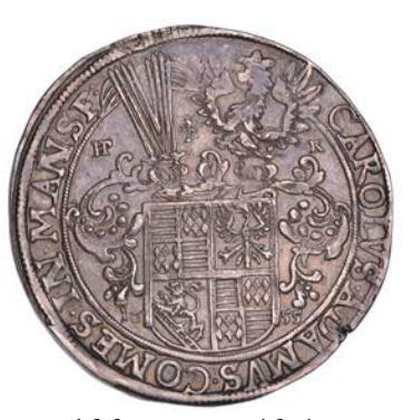
3434 MANSFELD-BORNSTÄDT, Karl Adam, Thaler, 1655нр-к, Eisleben, 28.75g/1h (КМ. 98; Dav. 6930). Scratched in obverse field, otherwise good very fine £100-150