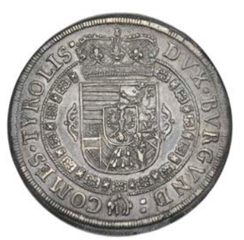
3399 TYROL , Archduke Leopold , Thaler, 1632, Hall, 28.18g/12h (KM. 629.2; Dav. 3338). Good very fine, toned £120-150

3400 TYROL , Archduke Leopold , Thaler, 1632, Hall, 28.20g/12h (KM. 629.2; Dav. 3338). Better than very fine, but with suspension loop removed at 12 o'clock £80-100