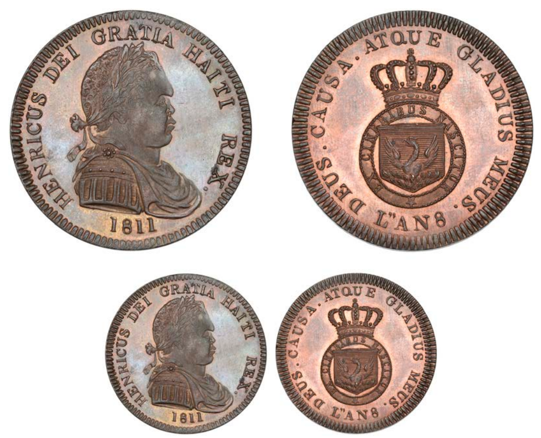
3452 Henri Christophe , Trial striking for a Crown, 1811, in copper, unsigned, thin laureate armoured bust right, hair incomplete at top and by forehead, rev . crowned arms, edge plain, 29.36g/12h. Brilliant mint state, extremely rare £4,000-5,000