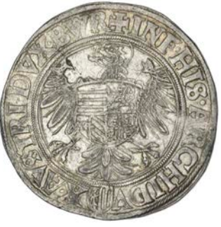
3396 Ferdinand I, Thaler, undated, Linz, 28.66g/12h (Dav. 8014). Nearly extremely fine