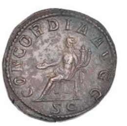
3070 Pupienus (238), Sestertius, Rome, laureate, draped, and cuirassed bust right, rev. Concordia seated left, 23.94g/2h (RIC 20). Better than very fine, brown patina