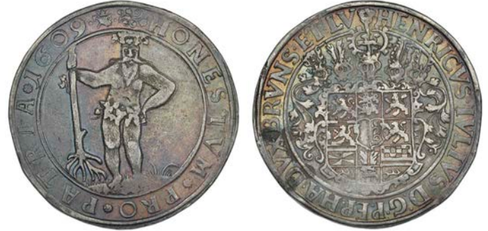
3430 BRUNSWICK-WOLFENBÜTTEL, Heinrich Julius, Reichsthaler, 1609, Zellerfeld, 29.03g/12h (KM. 7; Dav. 6285). Good fine £100-150