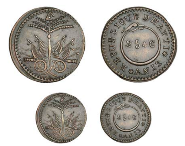
3453 Alexandre Pétion , Pattern 25 Centimes, AN 12 [1815], unsigned, in copper, flags and military trophies under palm tree, rev. value in torque, edge plain, 1.86g/6h (KM. –; cf. R. Byrne 617, same dies). Obverse slightly off-centre, otherwise good very fine, extremely rare £4,000-4,500