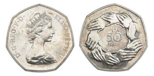
1586 Piédfort 50 Pence, 1973, in silver, 21.11g/12h (ESC 3021; S 4224A). Practically as struck, very rare £800-1,000

One of only two known specimens; the other was sold in these rooms, 5 December 2012, lot 658