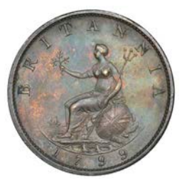
1427 Proof Halfpenny, 1799 (early Soho), in copper, raised dot on shoulder, ship with tall masts, 12.96g/6h (BMC 1253 [KH 26]; Selig –; S 3778). Extremely fine, lightly toned, very rare £350-400 Provenance: DNW Auction 62, 30 June 2004, lot 380