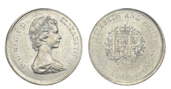
1587 25 Pence, 1972, edge plain, 28.48g/12h. Struck out of collar, virtually as made, unusual

These pieces were struck for presentation to EEC finance ministers and possibly other senior officials on the occasion of the UK joining the European Economic Community in 1973