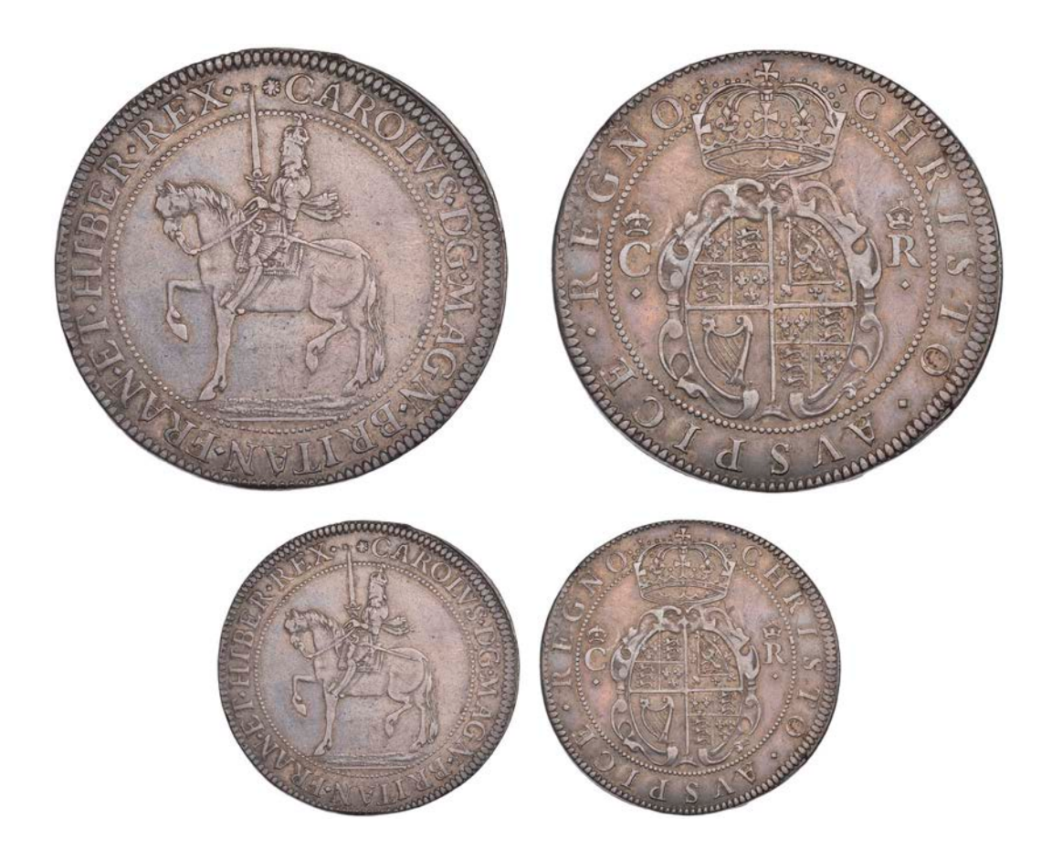
1016 Briot's First Milled issue, Crown, mm. flower on obv . only, signed B both sides, 29.94g/6h (SCBI Brooker 714; N 2298; S 2852). Surface marks and scratches, otherwise about very fine, toned £1,200-1,500

Provenance: Bt Spink (Australia) August 1977