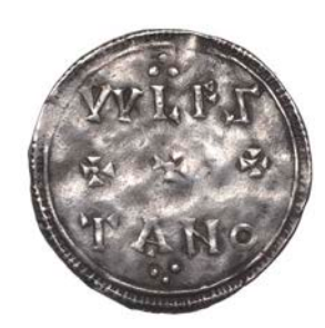
Penny, Two Line type, Wulfstan, small cross, crescent in field, ÆDVLSTAN RE, rev. VVLFSTAN 0 in two lines divided by three crosses, trefoil of pellets above and below, 1.55g/9h (CEB 115; N 668; S 1089). Crimped, otherwise nearly very fine £250-300