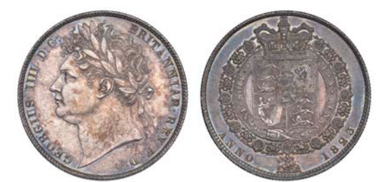
1104 Halfcrown, 1823, type 2 (ESC 634; S 3808). Better than extremely fine *Provenance: J. Smith Collection, Noble Numismatics Auction 75 (Sydney), 31 March-1 April 2004, lot 1118