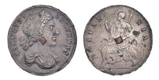
1031 Halfpenny, 1686 (BMC 543; S 3419). Copper plug, trifling tin pest and a few surface marks, otherwise extremely fine with an excellent portrait and Britannia's fine detail well-struck, very rare £1,500-2,500

Provenance: Noble Numismatics Auction 89A (Sydney), 25-8 November 2008, lot 2931