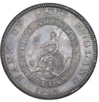
1085 Dollar, 1804, types A/2 (ESC 144; S 3768). Die break on rim at 5 o'clock on reverse, otherwise nearly extremely fine, dark tone \pounds 250 -300

Provenance: Glendining Auction, 12-13 September 1979, lot 336; bt Spink (Australia) November 1979