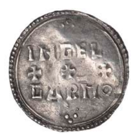
Penny, Two Line type [HT1, York], Ingelgar, E-A-DMVND REX E B, rev. INGELGAR MO in two lines, 1.27g/12h (CTCE 167; N 691; S 1105). Nearly very fine or better £300-400