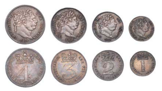
1095 Maundy set, 1818 (ESC 2423; S 3792) [4]. Extremely fine Provenance : Bt E.H. Crawford August 1989

Provenance: Bt E.H. Crawford October 1995