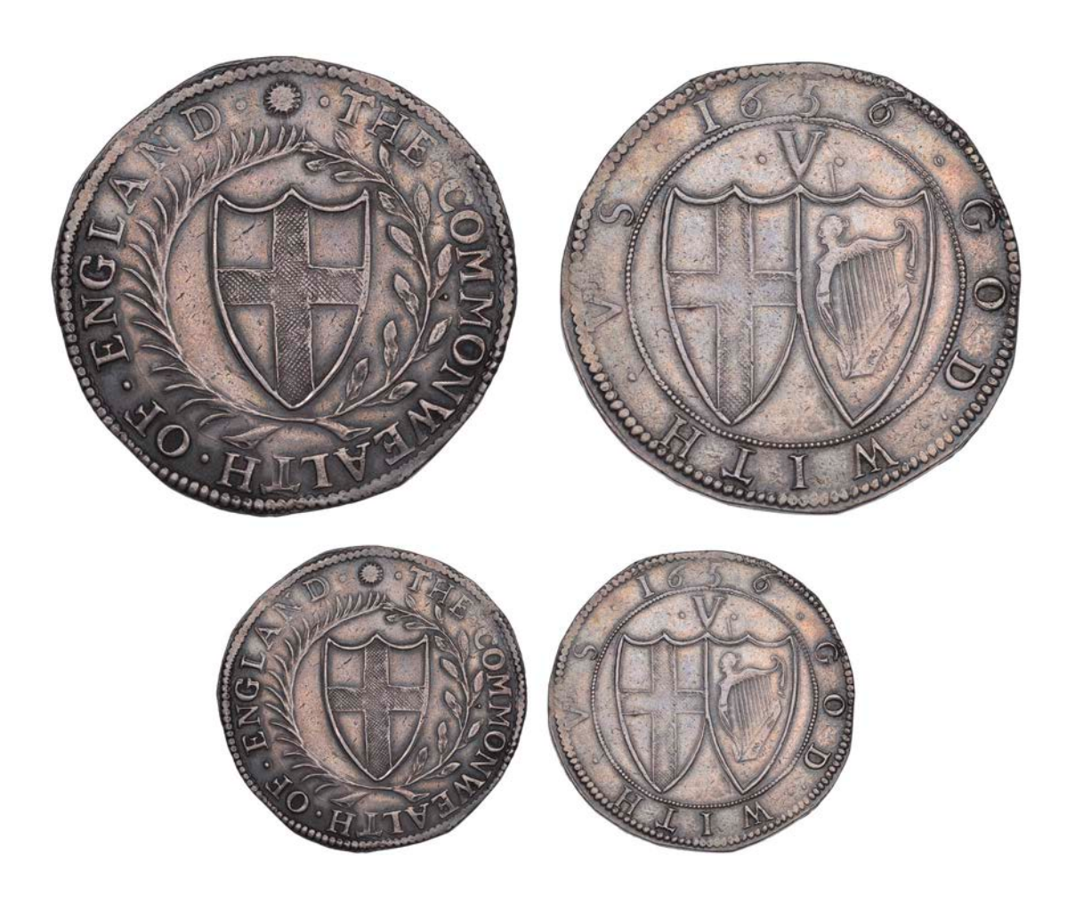
1019 Crown, 1656/4, mm. sun on obv . only, small 6s in date, 30.06g/1h (ESC 9; N 2721; S 3214). Small die break above Irish shield, otherwise nearly extremely fine, toned £2,500-3,000

Provenance: Bt Spink (Australia) March 1978