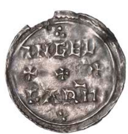
Penny, Two Line type [HT1, York], Ingelgar, EADMVND REX, annulet in field, rev. INGELGAR MO in two lines, 1.36g/12h (CTCE 167; N 691; S 1105). Tiny edge chip at 1 o'clock, otherwise nearly very fine £250-300