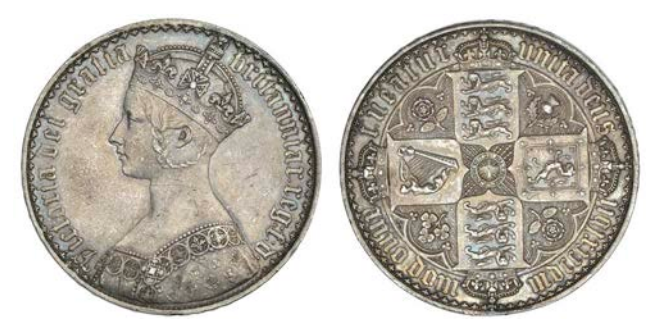
Crown, 1847, edge undecimo (ESC 288; S 3883). Surfaces marked and a large edge bruise on reverse at 6 o'clock, otherwise very fine or better \pounds 600-800