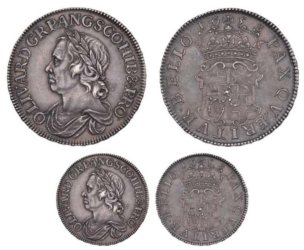
1021 Crown, 1658/7 (Lessen E12; ESC 10; S 3226). Early strike with just a trace of flaw on bust, a little wear on high spots, otherwise extremely fine, toned Provenance: Bt Spink (Australia) November 1978 £3,000-3,500