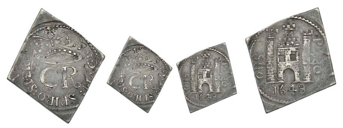
1375 Pontefract, Shilling, 1648, type II, large crown, rev. value dividing PC, 5.86g/12h (Hird 276-8; SCBI Brooker 1233, same dies; N 2647; S 3149). Slightly weakly struck, otherwise nearly very fine, very rare £3,000-3,500