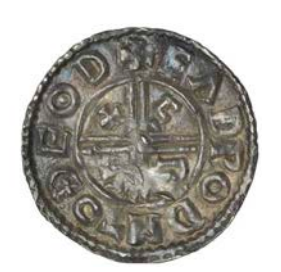
Penny, CRVX type, Thetford, Eadwold, EADPOD M-O DEOD, 1.65g/12h (Carson 110; BEH 3713; N 770; S 1148). Slight crease and peckmarking, otherwise good very fine, round flan £250-300