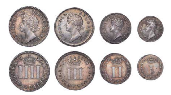
1030 Maundy set, 1686 (ESC 2381; S 3418) [4]. Very fine to extremely fine, toned, scarce