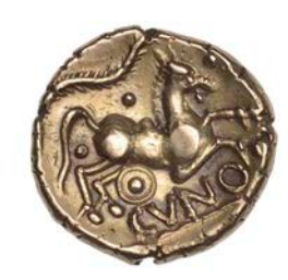
Cunobelin , Stater, Plastic type, ear of barley dividing CA-MV, rev . horse prancing right, branch and pellet above, pellet below tail, pellet-in-annulet and CVNO below, 5.42g/12h (ABC 2786; BMC 1809 ff ; VA 2010; S 286). Good very fine £1,000-1,200