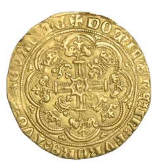
1336 Treaty period, Half-Noble, London, mm. cross potent on rev . only, saltire before EDWARD, 3.60g/12h (SCBI Schneider 79-80; N 1238; S 1506). Some minor surface marks, otherwise very fine or better £800-1,000