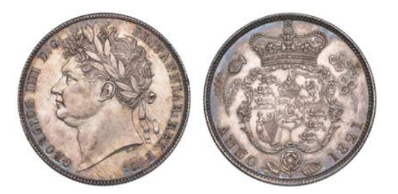
1103 Halfcrown, 1821 (ESC 631; S 3807). Good extremely fine, lightly toned Provenance : Bt Spink August 2000