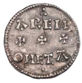
Penny, Two Line type [NE I], Are, small cross, <code>ADELSTAN REX</code>, <code>rev</code>. Are moneta in two lines divided by three crosses, trefoil of pellets above and below, 1.41g/6h (CEB 370; N 668; S 1089). Hairline crack and surface scratches, otherwise nearly very fine, full flan £250-300