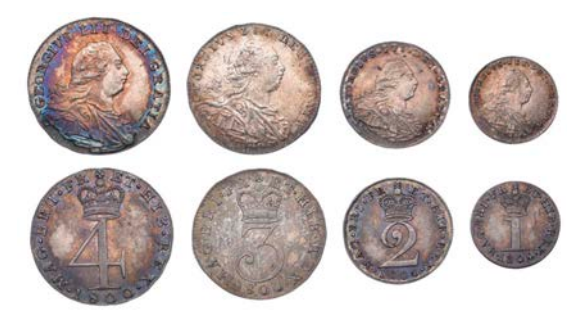
1077 Maundy set, 1800 (ESC 2421; S 3764) [4]. Good very fine