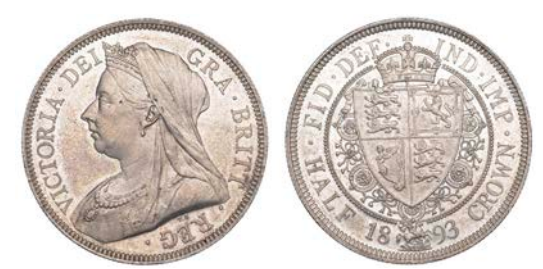
1548 Proof Halfcrown, 1893, edge grained (ESC 727; S 3938). A few surface marks and hairlines, otherwise good extremely fine £250-300

1549 Halfcrown, 1900 (ESC 734; S 3938). Good extremely fine, the fields proof-like