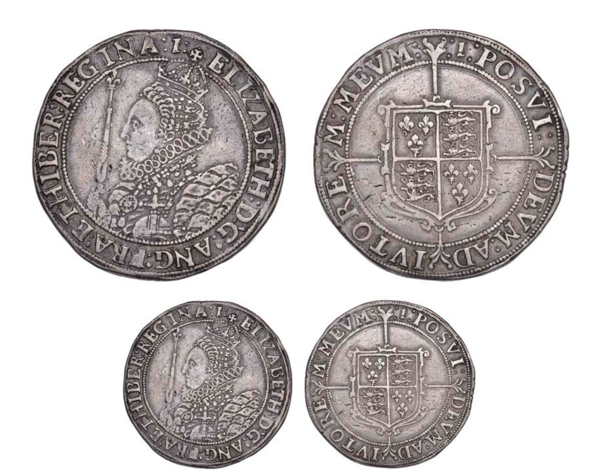
1013 Seventh issue, Crown, mm. 1, sceptre points to 1 of REGINA, 29.69g/9h (FRC D-6 [Sale, lot 12]; N 2012; S 2582). Scratch on crown, otherwise nearly very fine, reverse better £2,500-3,000 Provenance: Bt Spink (Australia) November 1979