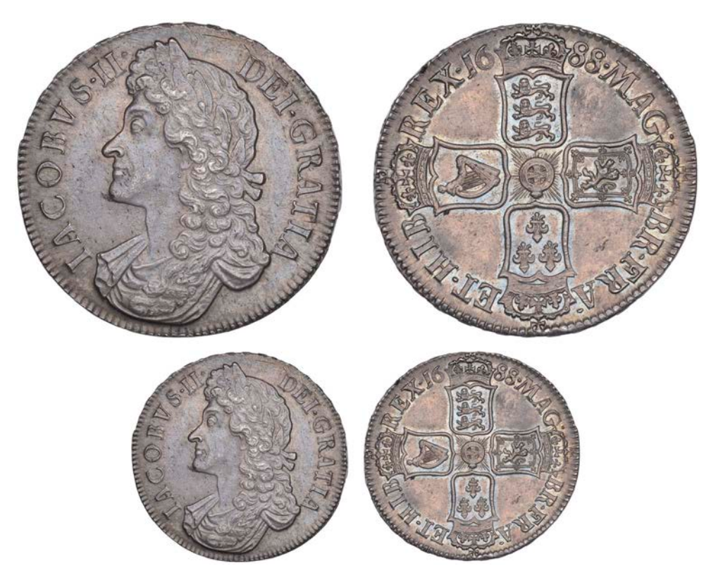
1028 Crown, 1688, second bust, edge QVARTO (ESC 80; S 3407). Minimal cabinet friction on high points, otherwise good extremely fine with attractive tone Provenance: Bt Spink (Australia) December 1979 ### Provenance: Bt Spink (Australia) Provenance: Provenance: Bt Spink (Australia) December 1979