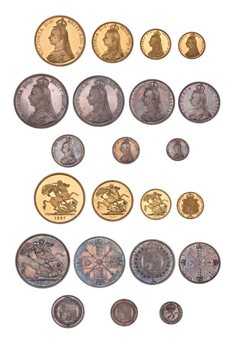
1570 Proof set , 1887, c omprising gold Five and Two Pounds, Sovereign and Half-Sovereign, silver Crown to Threepence [11]. Brilliant and almost as struck, silver toned; contained in official fitted leather velvet-lined case £12,000-15,000