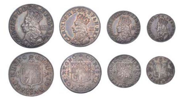
1024 Maundy set, undated, Twopence with single-arched crown (ESC 2365; S 3391) [4]. Twopence good very fine, others extremely fine, all attractively toned Provenance: R.S. James Collection, Spink Auction 31, 12 October 1983, lot 314

Of comparable quality to the specimen which fetched £7,500 hammer in St James's Auction 23, 4 February 2013, lot 158