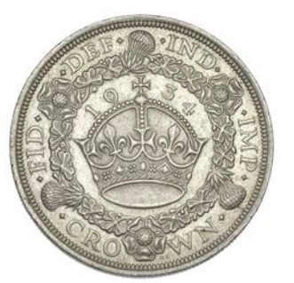
1579 Crown, 1934 (ESC 374; S 4036). Some surface marks and stains, otherwise good very fine, very rare £2,500-3,000