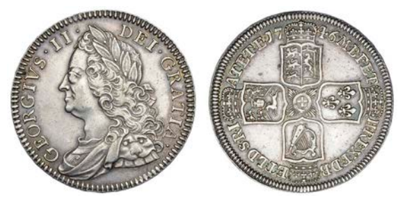
1417 Proof Halfcrown, 1746, edge VICESIMO, 15.13g/6h (ESC 608; S 3696). Surface marks, wear to the high points and has been cleaned at some time, otherwise good very fine, rare £2,500-3,000