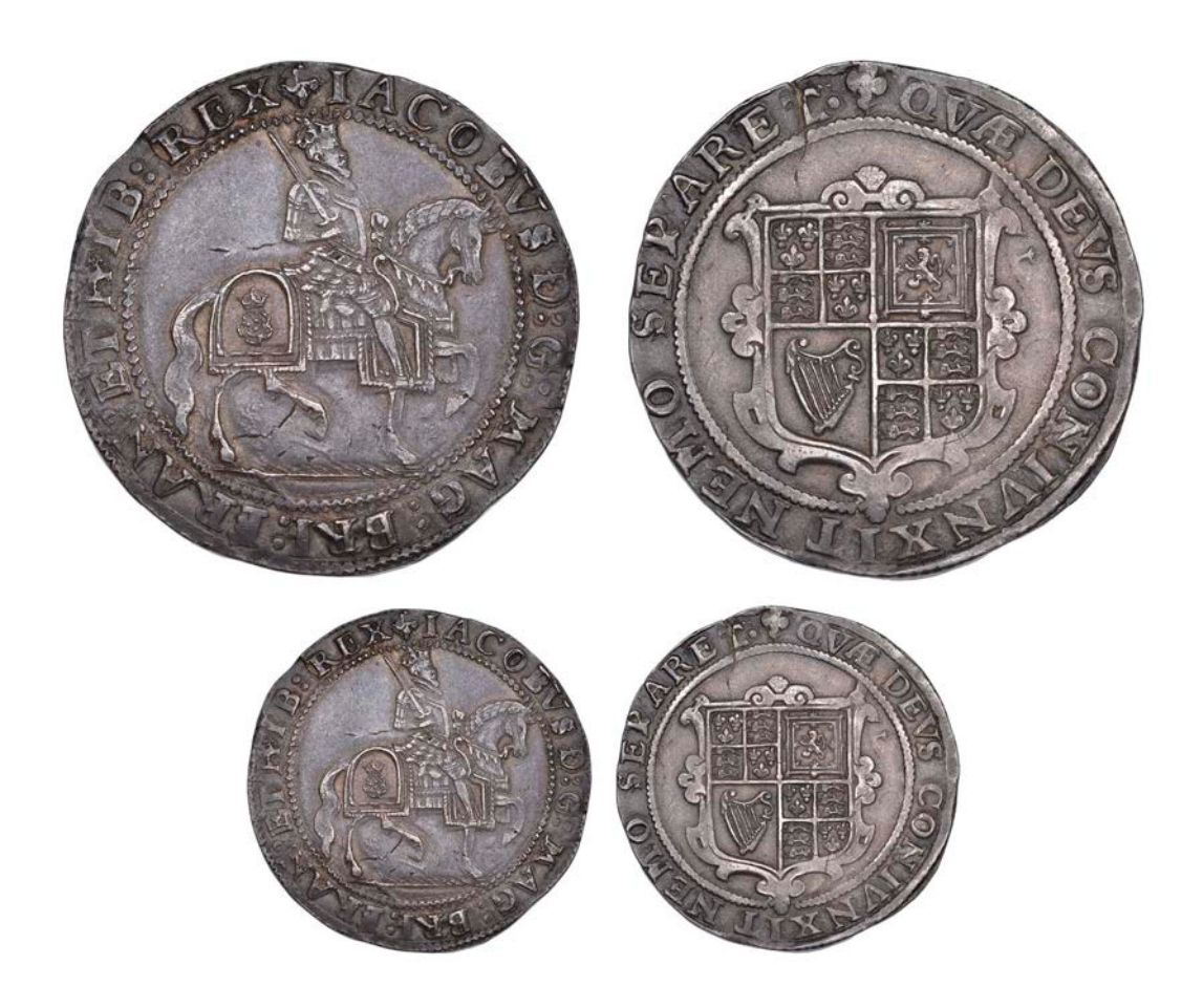
1014 Third coinage, Crown, mm. trefoil (over lis both sides), 29.71g/2h (FRC X*/XVIII* [Sale, lot 35]; N 2120; S 2664). A couple of minor surface cracks, otherwise nearly extremely fine and toned, scarce \pounds 2,500-3,000

Provenance: Bt Spink (Australia) November 1978