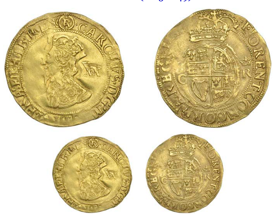
1357 Tower mint, Unite, Gp F, mm. (R) (possibly over (P) on obv.), 8.97g/4h (SCBI Schneider 167-8; SCBI Brooker 118-19; N 2155; S 2695). Rather double-struck, otherwise nearly very fine, rare £1,500-2,000