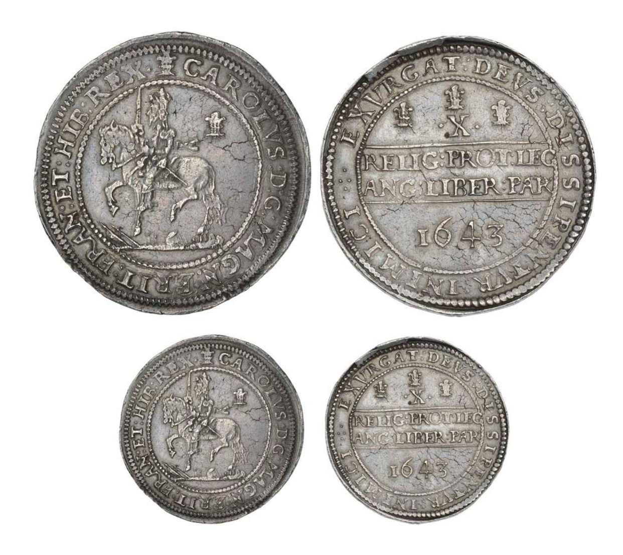
Oxford mint, Half-Pound, 1643, mm. Oxford plume, Shrewsbury horseman riding over arms, Oxford plume in field behind, rev . Declaration, three Oxford plumes above, date below, group of four pellets before legend, 58.31g/6h (Morr. A-1; SCBI Brooker Appendix I, 15; N 2404; S 2945A). Good very fine and well-centred on a large flan, attractive grey tone, rare £4,000-5,000