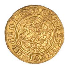
1335 Pre-Treaty period, Quarter-Noble, series G, mm. cross 3, small E in centre of rev ., saltire stops, 1.87g/7h (N 1192; S 1498). About very fine £400-500