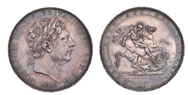
1091 Crown, 1819, edge LIX (ESC 215; S 3787). Small score on neck, otherwise extremely fine, toned £200-250 Provenance: Bt M.R. Roberts May 1977