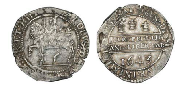
1366 Oxford mint, Halfcrown, 1643, mm. Oxford plume on obv . only, Oxford horseman, plume behind king, rev . Declaration, three Oxford plumes above, date below, colon before legend, 13.90g/8h (Bull 604/2; Morr. G-2; SCBI Brooker -; N 2415; S 2955). Striking split and reverse flan flaw, otherwise about very fine, the die-pairing rare £400-500