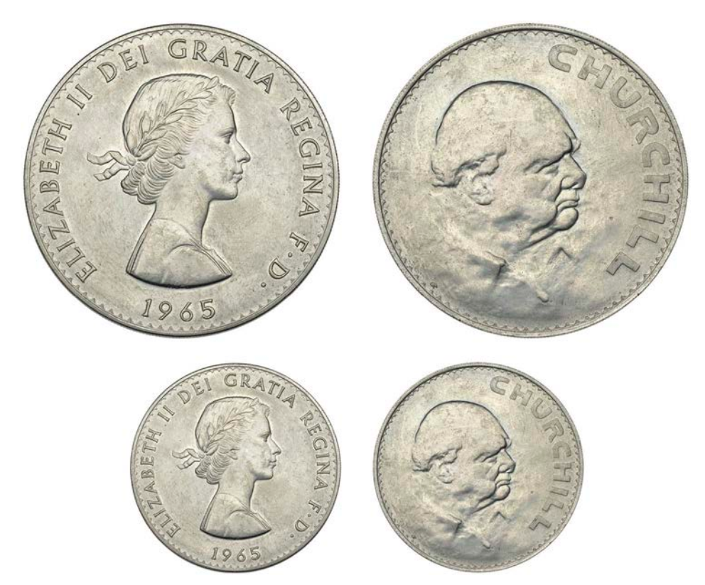
Proof Crown, 1965, 'satin finish', initials on [Oscar Nemon] under bust near rim, 28.29g/12h (cf. ESC 393O; cf. S 4144). About as struck, excessively rare £2,000-2,500

Provenance: Ponterio Auction 133 (New York), 14-15 January 2005, lot 2226.