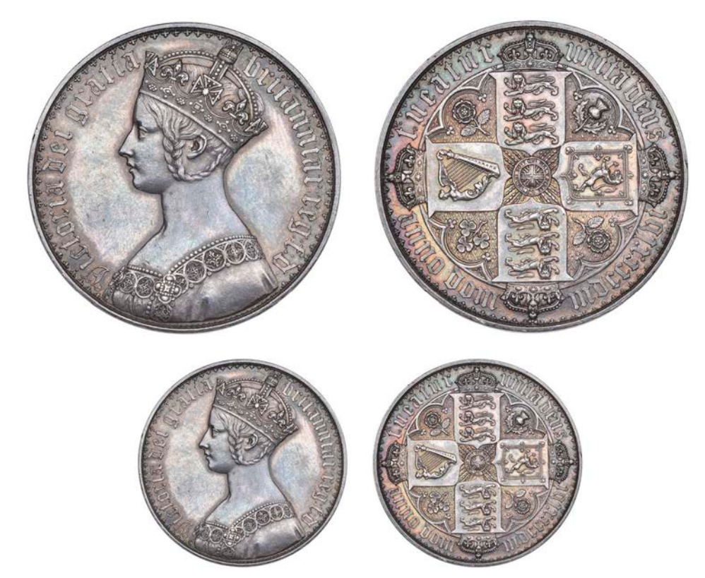
Pattern Crown, 1846, by W. Wyon, in silver, 'Gothic' bust left, no decoration on shoulder, rev. crowned shields cruciform, edge plain, 27.99g/12h (L & S 56; ESC 341; cf. S 3883). Extremely fine, dark-toned, extremely rare; the first specimen to be offered at auction in almost 20 years £10,000-12,000