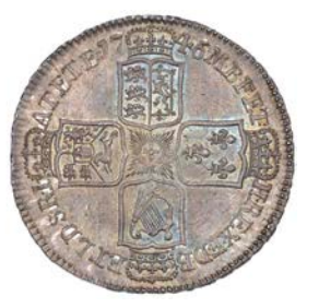
1055 Halfcrown, 1746 LIMA, edge DECIMO NONO (ESC 606; S 3695A). Good extremely fine, attractively toned \pounds 200-250

Provenance: W.H. Lampard Collection, Noble Numismatics Auction 78B (Sydney), 6-7 April 2005, lot 2264 [from P. Eccles 1982]