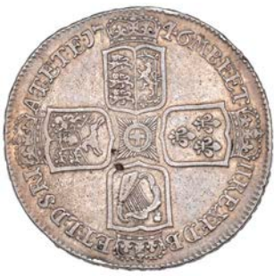
1415 Crown, 1746 LIMA, edge DECIMO NONO (ESC 125; S 3689). A few edge and surface marks, otherwise good fine or better \pounds 350\text{-}400