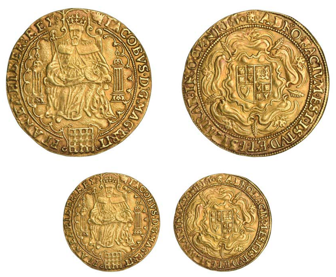
1356 Second coinage, Rose Ryal, mm. tower (over mullet over coronet on obv.), 13.61g/4h (Stewartby dies Cj; SCBI Schneider 10, same dies; N 2079; S 2613). Good very fine with reddish tone, very rare \pounds 9,000-12,000