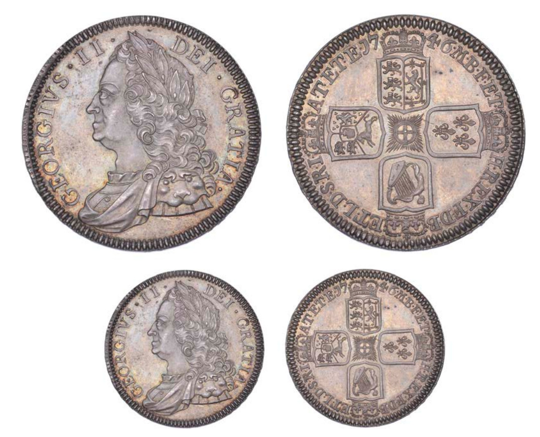
1416 Proof Crown, 1746, edge VICESIMO, 30.15g/6h (L & S 7; ESC 126; S 3690). Virtually mint state with reflective fields and attractive old cabinet toning \pounds 6,000-8,000