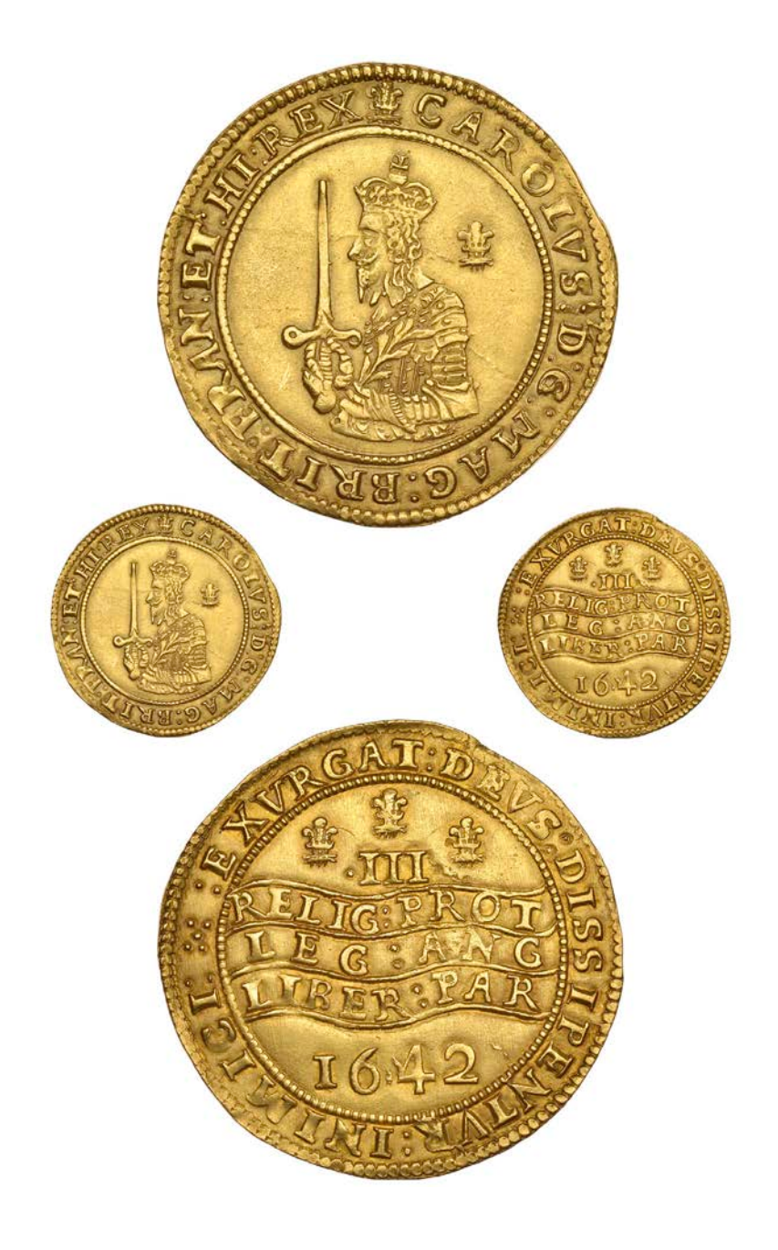
Oxford mint, Triple-Unite, 1642, mm. plume, tall narrow bust with sword and olive-branch, Oxford plume behind, rev . Declaration on three lines, value and three Oxford plumes above, date below, group of five pellets in legend, 27.06g/9h (SCBI Schneider 286, same dies; SCBI Brooker 832, same dies; N 2381; S 2724). Nearly extremely fine, very rare £60,000-80,000

Provenance: Bridgewater House Collection, Sotheby Auction, 15-16 June 1972, lot 110