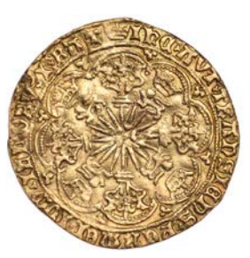
1339 Light coinage, Ryal, London, class VII, mm. crown on rev. only, fleurs in spandrels, 7.55g/9h (B & W VII; SCBI Schneider 358ff; N 1549; S 1950). Removed from a mount and perhaps plugged beneath rose, otherwise about very fine £800-1,000