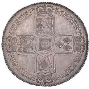
1054 Crown, 1746 Lima, edge decimo nono (ESC 125; S 3689). Extremely fine, reverse better, old cabinet toning £1,200-1,500

Provenance: Bt Spink (Australia) December 1979