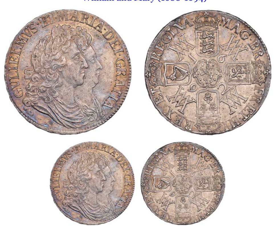
1032 Crown, 1692, edge QVARTO (ESC 83; S 3433). Minimal haymarking, otherwise good extremely fine with lustrous fields and light toning \pounds 4,000-5,000

Provenance: Spink Auction 16, 10 July 1981, lot 576