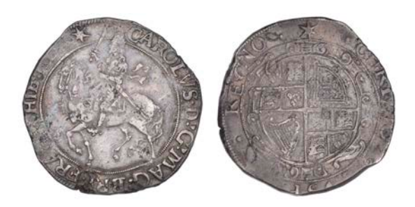
1015 Tower mint, Halfcrown, Gp IV, mm. star, 14.59g/9h (SCBI Brooker 365; N 2214; S 2779). Nearly very fine £80-100