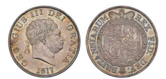
1094 Halfcrown, 1817, small head (ESC 618; S 3789). Edge bruise at 11 o'clock, otherwise better than extremely fine