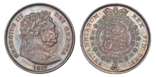
1093 Halfcrown, 1817, large head (ESC 616; S 3788). Extremely fine or better, toned Provenance : Bt Spink August 2000