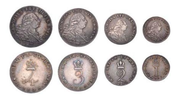
1076 Maundy set, 1792 (ESC 2419; S 3763) [4]. Twopence good fine, others good very fine Provenance: Noble Numismatics Auction 81 (Sydney), 22-4 March 2006, lot 913