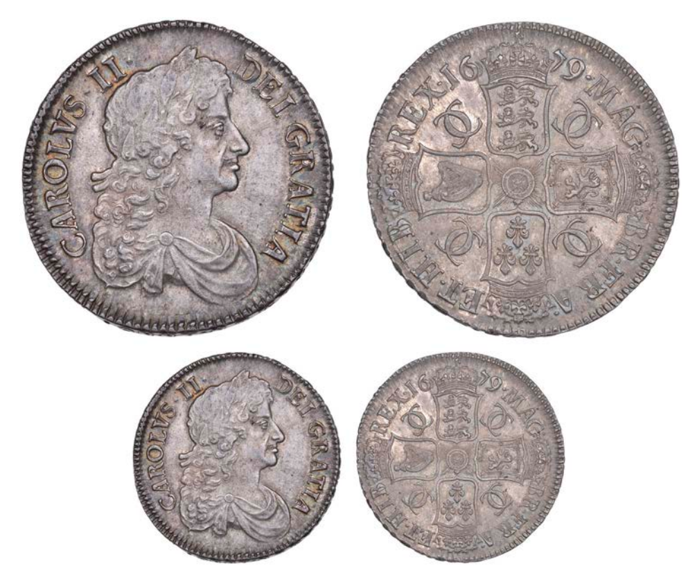
1023 Crown, 1679, third bust, edge tricesimo primo (ESC 56; S 3358). Good extremely fine, some original brilliance underlying the attractive tone \pounds 4,000-5,000

Provenance: E.C. Carter Collection; J.F.H. Checkley Collection, Glendining Auction, 10 February 1965, lot 69; bt Spink (Australia) November 1977