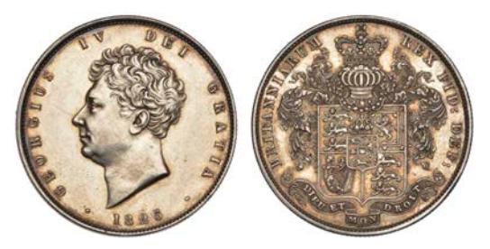
1105 Halfcrown, 1825 (ESC 642; S 3809). Sometime cleaned, otherwise nearly extremely fine £100-150 Provenance: Bt E.H. Crawford August 2000