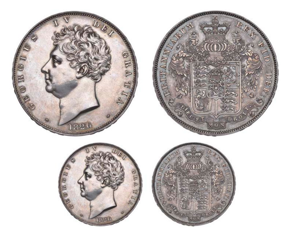
1102 Proof Crown, 1826, edge SEPTIMO, 28.12g/6h (L & S 28; ESC 257; S 3806). Obverse lightly hairlined and of bright appearance, extremely fine, reverse better and toned £4,000-4,500 Provenance: Bt Spink (Australia) November 1977