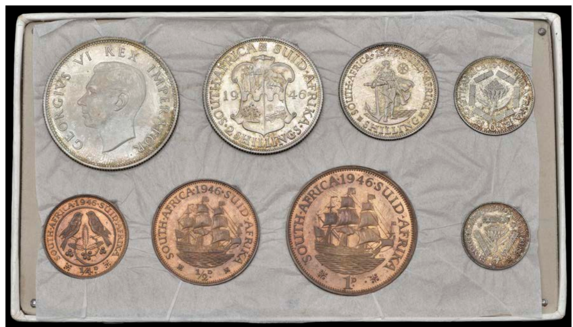
1410 George VI, Proof set, 1946, comprising Halfcrown to Farthing (Hern P19; KM. PS18) [8]. About as struck, silver a little tarnished; in card case of issue 150 sets issued