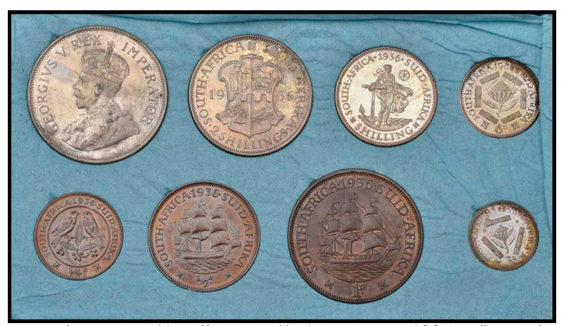
1399 George V, Proof set, 1936, comprising Halfcrown to Farthing (Hern P12; KM. PS11) [8]. Virtually as struck, toned; in case of issue, rare £2,500-3,000 40 sets issued