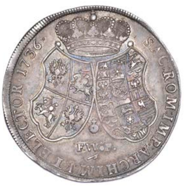
1341 SAXONY, Friedrich August II, Speciethaler, 1736FWOF, Dresden (KM. 880; Dav. 2665). Nearly extremely fine, toned £500-700