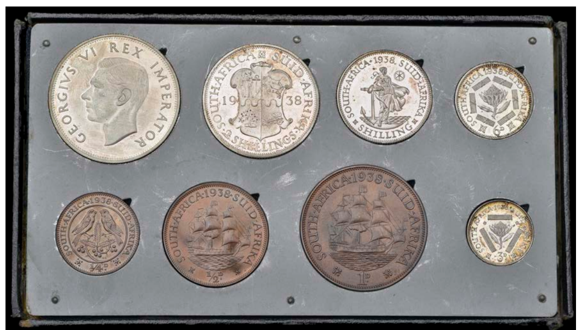
1401 George VI, Proof set, 1938, comprising Halfcrown to Farthing (Hern P14; KM. PS12) [8]. About as struck, toned; in card case of issue [this damaged] £1,000-1,200