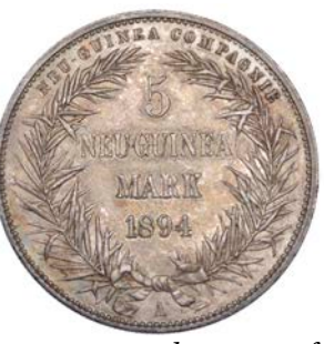
1336 William II, 5 Marks, 1894A (KM. 7). Light verdigris on reverse and some surface marks, otherwise about extremely fine £400-600