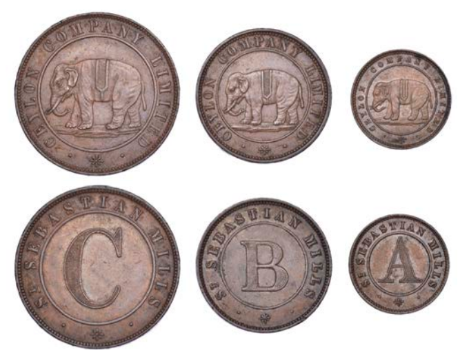
1313 COLOMBO, St Sebastian Mills, Maclure, Macdonald & Macgregor, C, B and A tokens (Ninepence, Fourpence-Halfpenny and Twopence-Farthing), c. 1866, elephant, revs. value (Prid. 17-19) [3]. Very fine £100-150