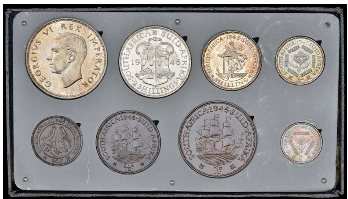
1406 George VI , Proof set, 1945, comprising Halfcrown to Farthing (Hern P18; KM. PS17) [8]. Silver has been lightly cleaned at some time, with hairlines, otherwise about as struck, toned; in card case of issue [this damaged] £600-800