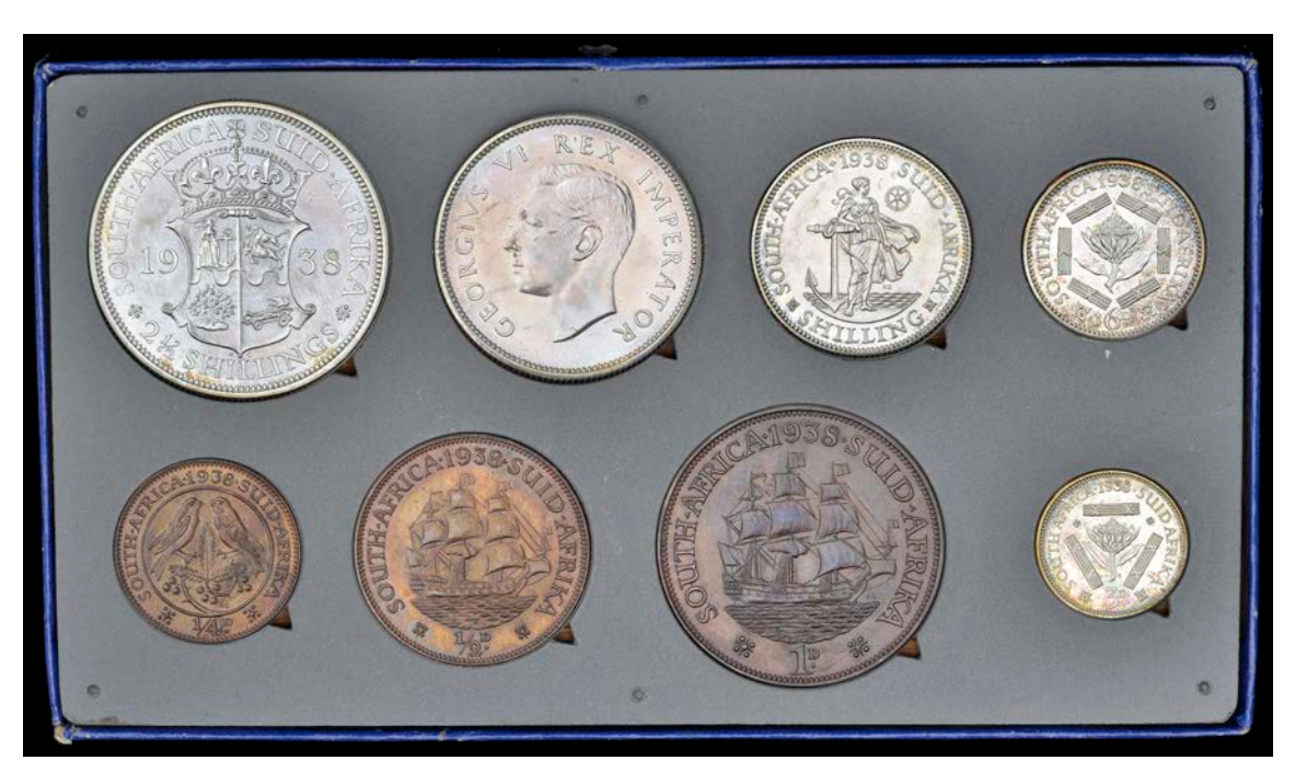
1402 George VI , Proof set, 1938, comprising Halfcrown to Farthing (Hern P14; KM. PS12) [8]. About as struck, toned; in card case of issue [this damaged]