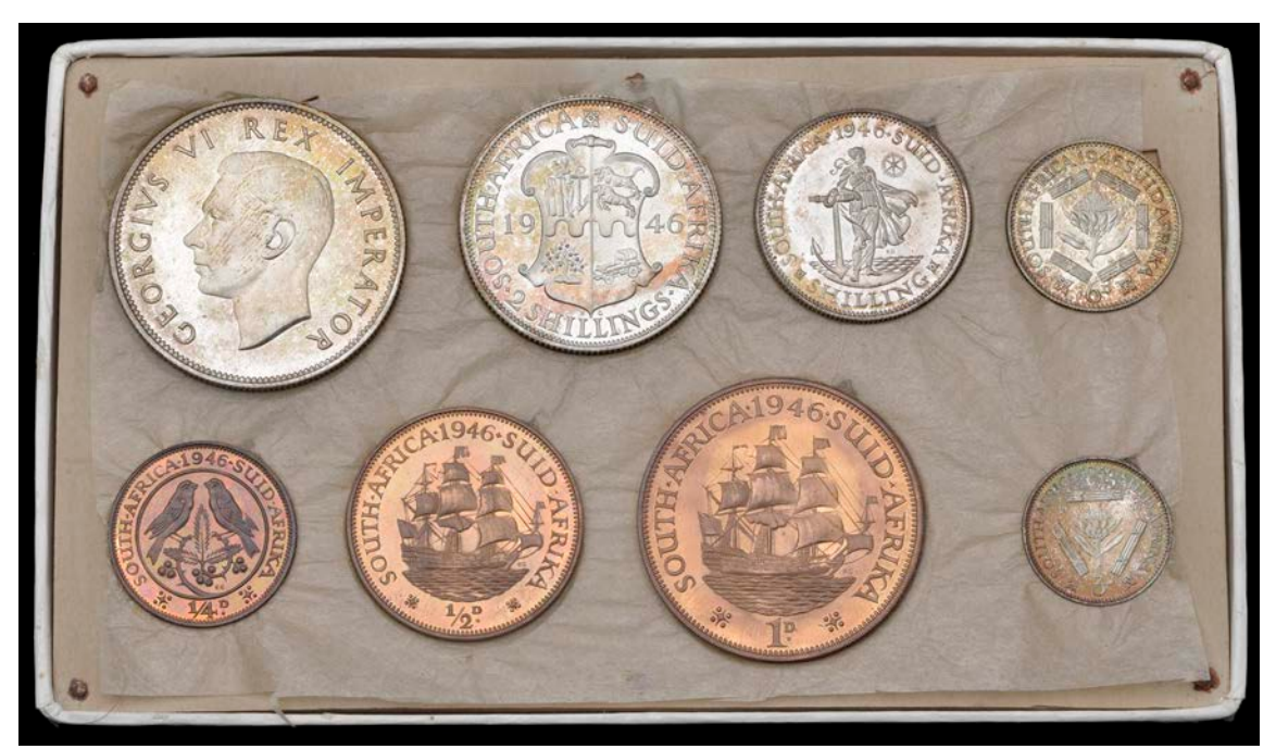
1409 George VI, Proof set, 1946, comprising Halfcrown to Farthing (Hern P19; KM. PS18) [8]. About as struck, silver a little tarnished; in card case of issue 150 sets issued