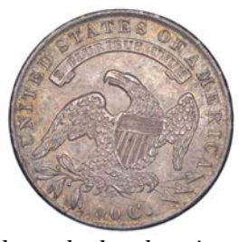
1461 Half-Dollar, 1835. Tiny cut above head and light scratch on cheek, otherwise good extremely fine, attractively toned £500-700