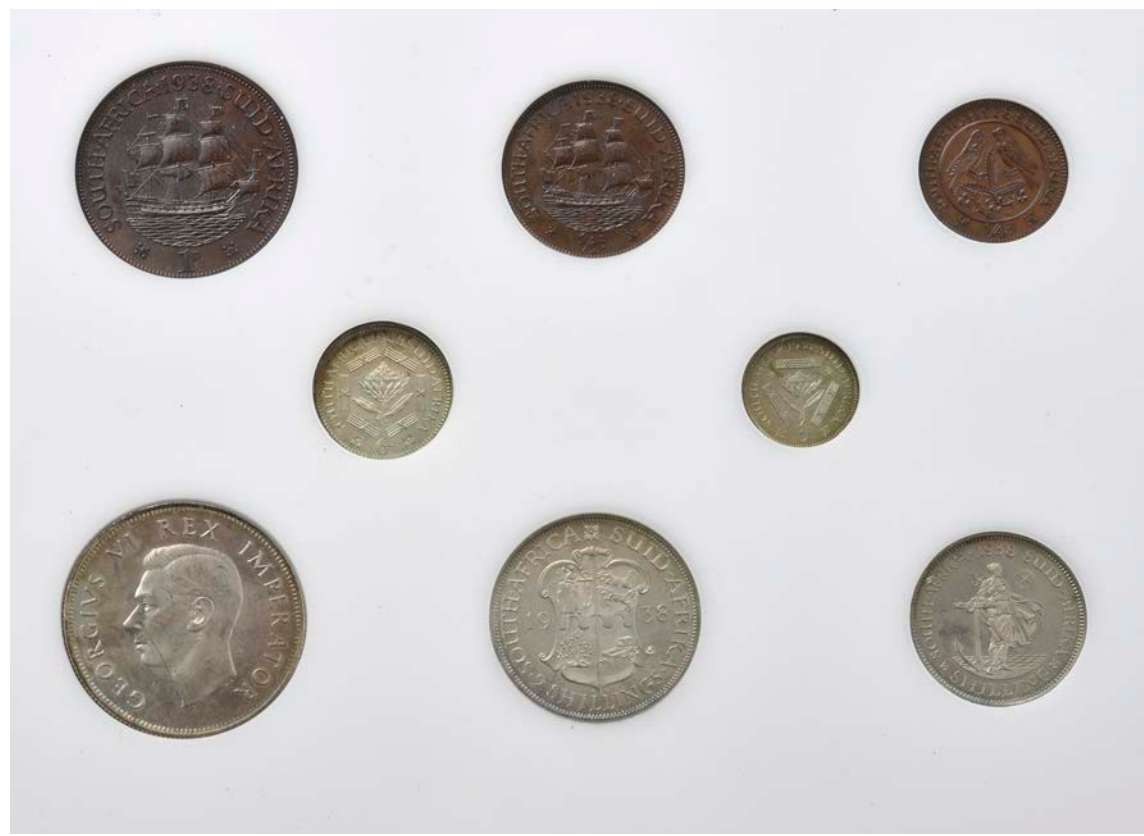
1400 George VI , Proof set, 1938, comprising Halfcrown to Farthing (Hern P14; KM. PS12) [8]. Silver a little dull, otherwise about as struck; in perspex fitted case