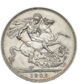
584 Proof Crown, 1902, edge II (ESC 362; S 3979). Has been lightly cleaned, otherwise good extremely fine ### ### Provenance: Bonhams Auction, 18 October 2012, lot 406

585 Proof Crown, 1902, edge II (ESC 362; S 3979). Extremely fine, cleaned in the past, now toned