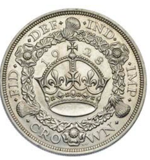
602 Crown, 1928 (ESC 368; S 4036). Some surface marks, otherwise good very fine