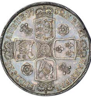
479 Proof Crown, 1732, roses and plumes, edge plain, 30.25g/6h (L & S 6; ESC 118; S 3686). Tiny reverse rim flaw, otherwise good extremely fine, toned, very rare £5,000-6,000