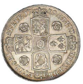
480 Crown, 1739, roses, edge dvodecimo (ESC 122; S 3687). Small reverse edge flaw, otherwise nearly extremely fine, reverse better £1,200-1,500