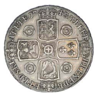
481 Crown, 1743, roses, edge decimo septimo (ESC 124; S 3688). Mount probably removed at 2 o'clock, otherwise about very fine £150-200