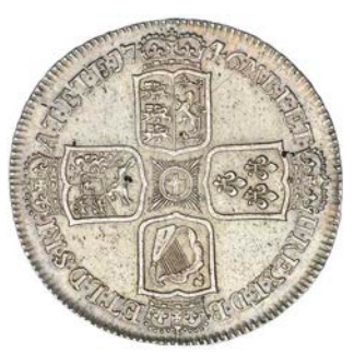
482 Crown, 1746 LIMA, edge DECIMO NONO (ESC 125; S 3689). Extremely fine