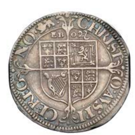
354 York mint, Shilling, Gp 1 [type 2], mm. lion, 5.71g/9h (Besly 1D; SCBI Brooker 1093, same dies; N 2319; S 2871). Obverse good fine, reverse better, rare £300-350