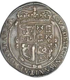
662 Charles I , Third coinage, Falconer's Anonymous issue, Thirty Shillings, mm. leaved thistle on obv. , thistle head on rev. , similar, 14.80g/6h (Murray 4; SCBI 35, 1519; B 51; S 5557). On a slightly oval flan, nearly very fine £150-200