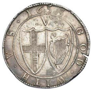
361 Crown, 1653, mm. sun on obv. only, 29.85g/3h (ESC 6; N 2721; S 3214). Edge crack at 6 o'clock, otherwise very fine or better £1,000-1,200