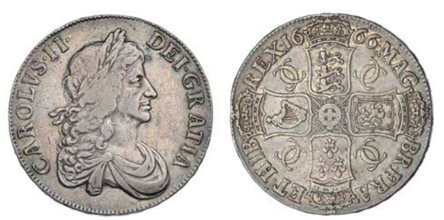
389 Crown, 1666, second bust, edge xvIII, no stop after MAG (cf. ESC 32; S 3355). Better than very fine and very rare, the punctuation variety not listed in ESC £800-1,000

Provenance: H.M. Lingford Collection, Part I, Glendining Auction, 24-6 October 1950, lot 298 (part)