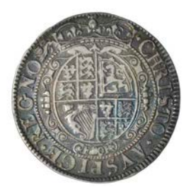
355 York mint, Shilling, Gp 2 [type 5], mm. lion, 5.76g/12h (Besly 2Dd; SCBI Brooker 1098, same dies; N 2320; S 2874). Slightly creased, otherwise obverse fine, reverse better, toned £120-150