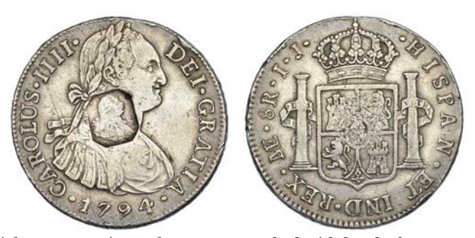
512 PERU , Charles IIII , 8 Réales, 1794ы, Lima, obv . countermarked with head of George III in octagon (ESC 140A; S 3766). Good fine or better