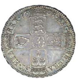
440 Halfcrown, 1698, edge DECIMO (ESC 554; S 3494). Nearly extremely fine Provenance: F.H. Fellows Auction (Edgbaston), 1 November 1972