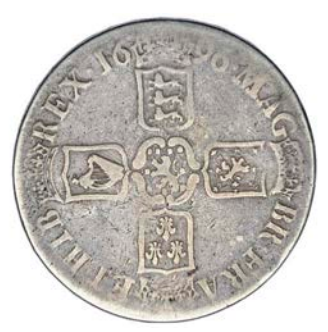
437 Crown, 1696, first bust, G over D in GRA, no stops on obv., edge octavo (ESC 89A-B; S 3470). About fine, very rare £100-150

The two obverse varieties are known separately but apparently not previously recorded together