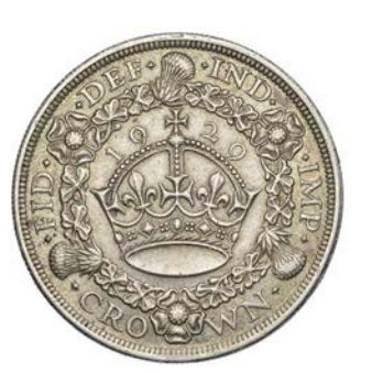
604 Crown, 1929 (ESC 369; S 4036). About extremely fine, toned