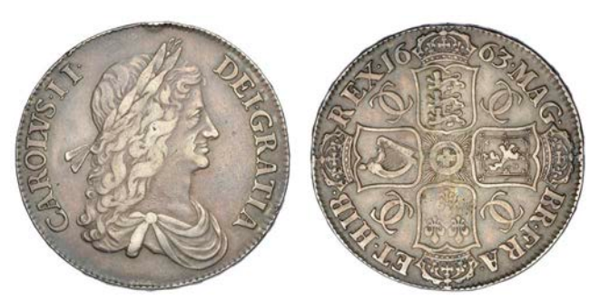
387 Crown, 1663, first bust, edge xv (ESC 22; S 3354). Edge knock at 12 o'clock on obverse, otherwise good fine £150-200