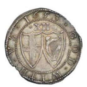
366 Shilling, 1653, mm. sun on obv . only, 5.78g/3h (ESC 987; N 2724; S 3217). Very fine or better, toned £300-400