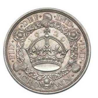
{\bf 605} Crown, 1929 (ESC 369; S 4036). About extremely fine, toned