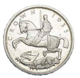
610 Proof Crown, 1935, edge xxv, 28.26g/12h (ESC 378; S 4050). Has been dipped and with hairlines, otherwise about as struck, brilliant \pounds 300-350