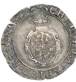
359 Dovey Furnace mint, Groat, mm. crown, plume before bust, rev. plume above scroll-garnished shield, 1.99g/4h (SCBI Brooker 790, same dies; N 2354; S 2911). Three minor striking cracks, otherwise very fine, rare £400-600