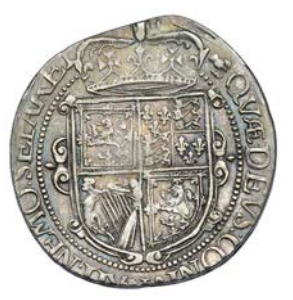
663 Charles I , Third coinage, Falconer's Second issue, Thirty Shillings, mm. leaved thistle, similar, 14.80g/6h (Murray 6; SCBI 35, -; B -; S 5556). Small mark above crown, good fine or better £150-200