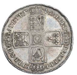
483 Crown, 1746 Lima, edge decimo nono (ESC 125; S 3689). Numerous edge marks and bruises, otherwise very fine or better