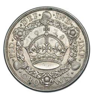
603 Crown, 1928 (ESC 368; S 4036). Some surface marks, otherwise good very fine