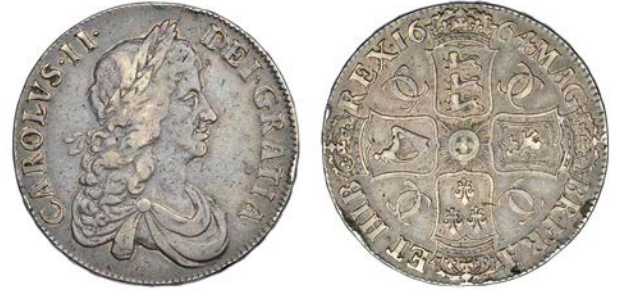
388 Crown, 1664, second bust, edge xvI (ESC 28; S 3354). Edge nicks, otherwise fine, toned