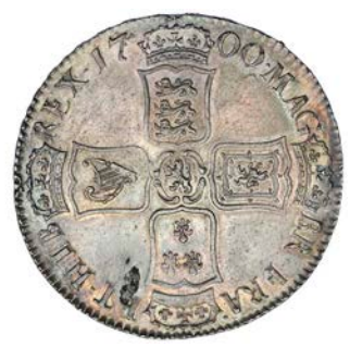
438 Crown, 1700, edge dvodecimo (ESC 97; S 3474). Reverse flan flaw, otherwise good extremely fine with attractive tone £800-1,000