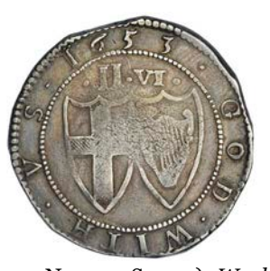
363 Halfcrown, 1653, mm. sun on obv. only, 14.51g/2h (ESC 431; N 2722; S 3215). Weak in centres, otherwise nearly very fine \pounds 250 -300