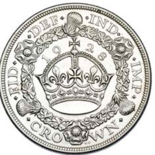
601 Crown, 1928 (ESC 368; S 4036). Has been lightly cleaned and with some surface marks, otherwise almost extremely fine \pounds 150-200