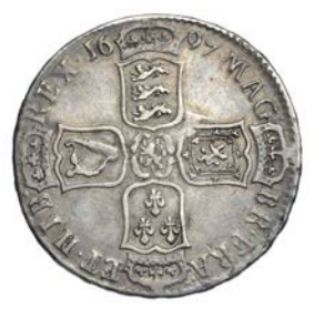
439 Halfcrown, 1697E over c, first bust, later harp, small crowns, edge NONO (ESC 548; S 3480). Wear to high points, otherwise good fine and toned, extremely rare £250-300