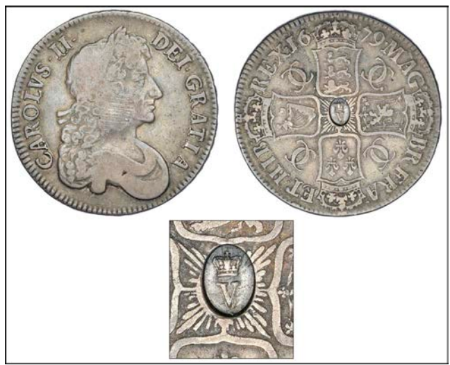
395 Crown, 1679, third bust, edge TRICESIMO PRIMO, rev. Garter Star countermarked with a crowned v in oval, 29.49g (Brunk 322; cf. ESC 56; cf. S 3358). Obverse about fine, reverse good fine, toned, the countermark of fine style, unusual

The significance of the countermark, recorded by Brunk on a 1662 crown, is uncertain; there was no example in the H.D. Gibbs