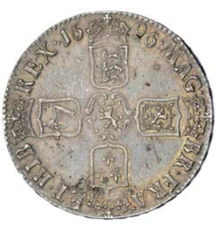
435 Crown, 1696, first bust, edge octavo (ESC 89; S 3470). Small edge flaw at 10 o'clock and a scratch in one quarter of reverse, otherwise nearly extremely fine, toned £600-800

\textbf{436} \ \ \text{Crown, 1696, first bust, edge octavo (ESC 89; S 3470)}. \ \textit{Some surface marks, otherwise good fine or better £100-150}