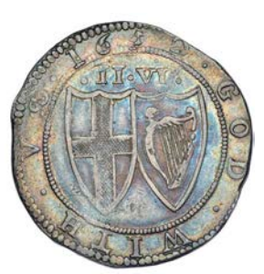
362 Halfcrown, 1652, mm. sun on obv. only, 15.00g/7h (ESC 429; N 2722; S 3215). Very fine with attractive blue tone, rare \pounds 500-700