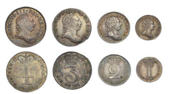
507 Maundy set, 1784 (ESC 2417; S 3762) [4]. Threepence and Twopence about very fine, others about extremely fine, toned

Provenance: Bearne's Auction (Exeter), 23 June 1998, lot 770 (part)