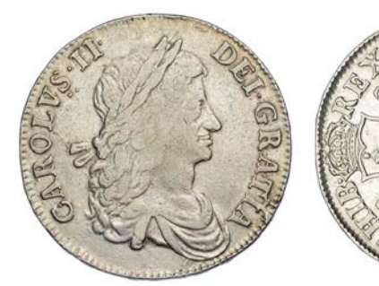
386 Crown, 1663, first bust, edge xv (ESC 22; S 3354). Weakly struck, otherwise about very fine, reverse better £300-400