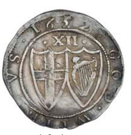
365 Shilling, 1652, mm. sun on obv. only, reads common · wealth, 5.94g/8h (ESC 986C; N 2724; S 3217). Slightly creased, otherwise about very fine, very rare £300-400