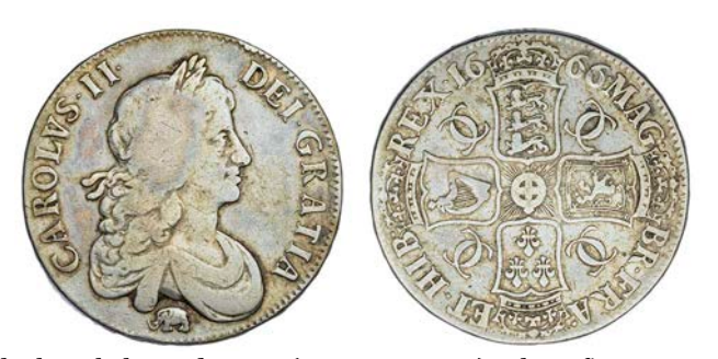
390 Crown, 1666, second bust, elephant below, edge xvIII (ESC 33; S 3356). About fine, very rare

Provenance: H.M. Lingford Collection, Part I, Glendining Auction, 24-6 October 1950, lot 298 (part)