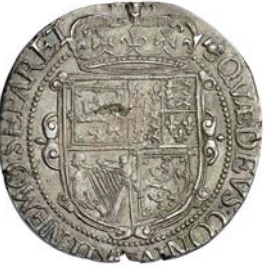
664 Charles I, Third coinage, Falconer's Second issue, Thirty Shillings, mm. leaved thistle, similar, slightly rough groundline, 14.97g/6h (Murray 6; SCBI 35, -; B -; S 5556). Slightly small of flan and tiny striking split at 12 o'clock, otherwise about very fine but scratched behind head £150-200