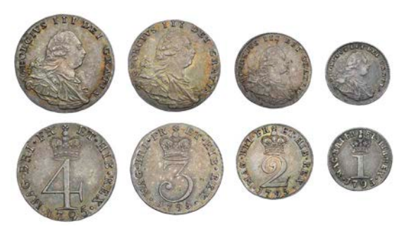
508 Maundy set, 1795 (ESC 2420; S 3764) [4]. Penny good fine and dark-toned, others about extremely fine and better, matching olive tone £200-250

Provenance: Bearne's Auction (Exeter), 23 June 1998, lot 770 (part)