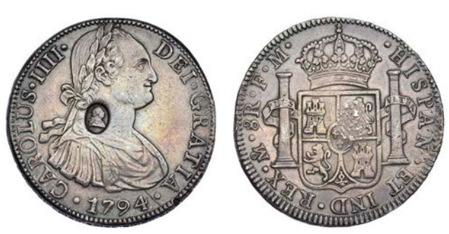
511 MEXICO, Charles IIII , 8 Réales, 1794<sub>FM</sub>, Mexico City, obv . countermarked with head of George III in oval (ESC 129; S 3765A). Good very fine, toned £400-500