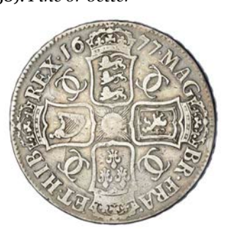
394 Crown, 1677, third bust, edge vicesimo nono (ESC 52; S 3358). Small graffiti scratch on neck, otherwise good fine or £150-200