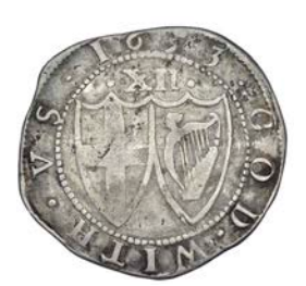
367 Shilling, 1653, mm. sun on obv. only, reads commonweath, 5.47g/8h (ESC 989; N 2724; S 3217). Obverse nearly fine, reverse better, the mis-spelling clear and very rare