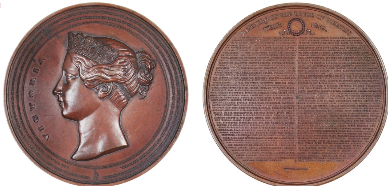
Members of the House of Commons , 1849, a bronze medal by L.C. Lauer, coroneted bust of Victoria left, names of her ministers around, rev. divided legend in 50 lines listing names of the members, 95mm (BHM 2351; E 1439). Very fine