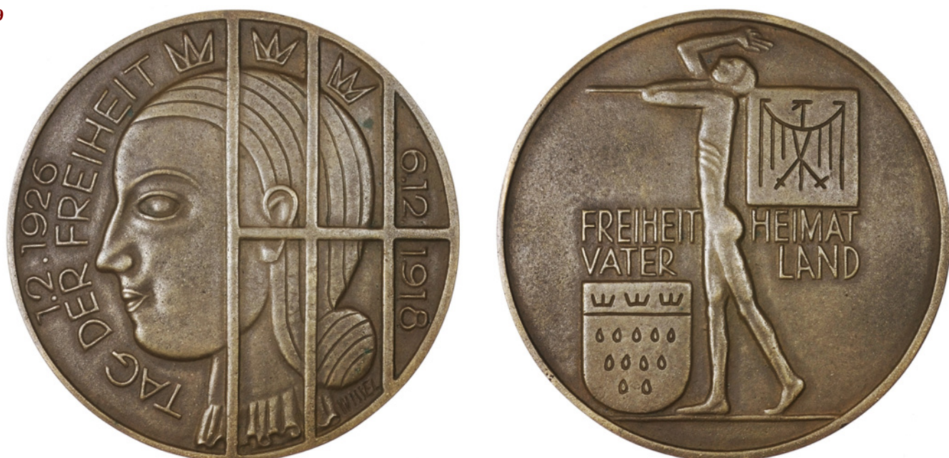
Tag der Freiheit [Day of Freedom], 1926, an Art Déco bronze medal by A. Wissel, female head emerging from behind bars, rev. standing male between two shields, 84mm (cf. DNW M7, 2498). Very fine, rare Provenance: D. Corrick Collection

Mutterschaft [Motherhood], c. 1930, a bronze plaque by H. Moshage, mother suckling child, rev. in imitation 1620 engraving (Ich will es schreiben in meinen Sinn, daß ich nicht nur für mich auf Erden bin, daß ich die Liebe, von der ich leb, liebend an andere weiter geb!), 140 x 95mm; Adolf Hitler, a silvered plaque by Hurin, 56 x 42mm; Hermann Göring, a plated portrait medal, undated, unsigned, 76mm [3]. First extremely fine and in fitted case, others fine, second mounted on wooden frame