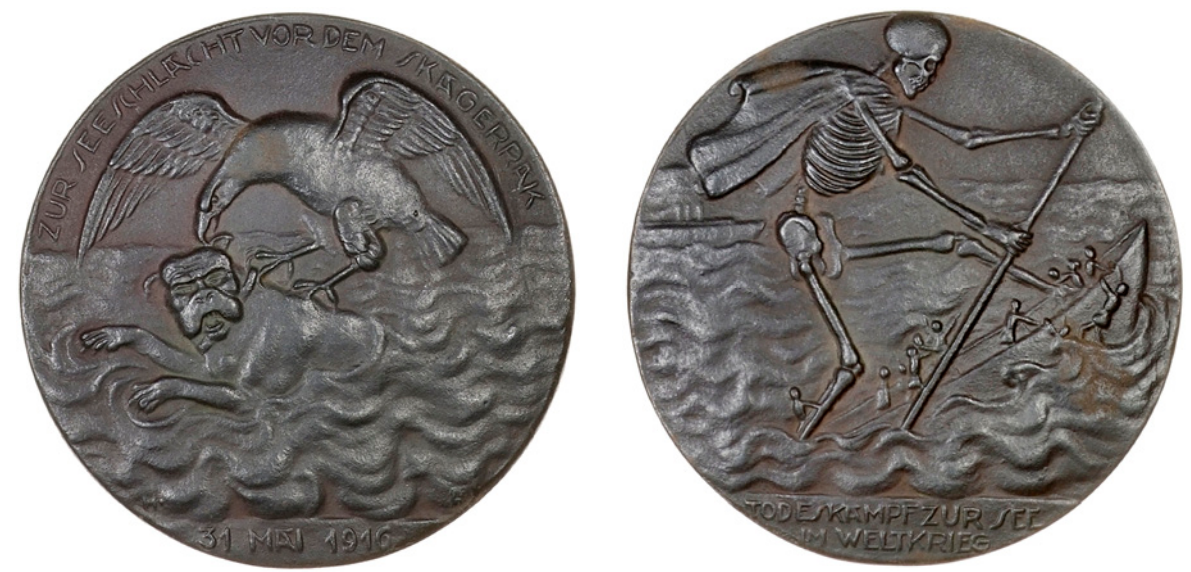
Zur Seeslacht vor dem Skaggerak [Naval Battle off the Skaggerak], 1916, a cast iron medal by H. Lindl, British bulldog swimming in sea, attacked by German eagle, rev. skeletal figure of Death rowing boat with shipwrecked sailors, 73mm (Frankenhuis 1446; BDM VII, 558; cf. DNW 68, 1764). Good very fine £90-120

Provenance: DNW Auction 68A, 15 December 2005, lot 1764; D. Corrick Collection