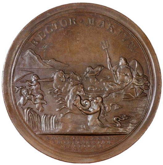
George I, Arrival in England, 1714, a copper medal by J. Croker, laureate and armoured bust right, rev. George, as Neptune, approaches the shore in a marine car, 68mm (MI II, 422/6; E 466). Trifling hairlines, otherwise extremely fine, attractive patina £200-250