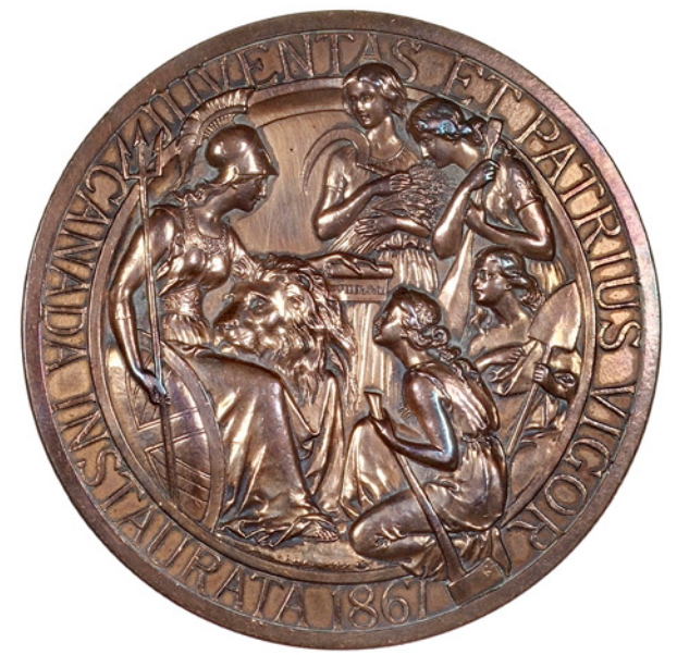
Confederation of Canada , 1867, a copper medal by J.S. & A.B. Wyon, crowned and veiled bust of Victoria left, rev. Britannia seated by lion, four female figures around, 76mm (BHM 2875; E 1590a). Brightly cleaned and with associated surface marks, otherwise about very fine, scarce £80-100