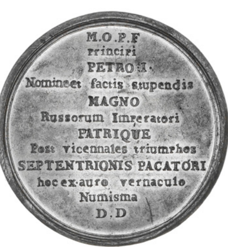
Peace of Nystadt, 1721, a white metal medal, unsigned, Noah's Ark in sea, rainbow connecting St Petersburg and Stockholm, rev. legend in 12 lines, 60mm (Diakov 57.5). Some tin pest on obverse, otherwise very fine £60-80 Provenance: Croydon Coin Auction 28, 2 October 1985, lot 456; D. Corrick Collection