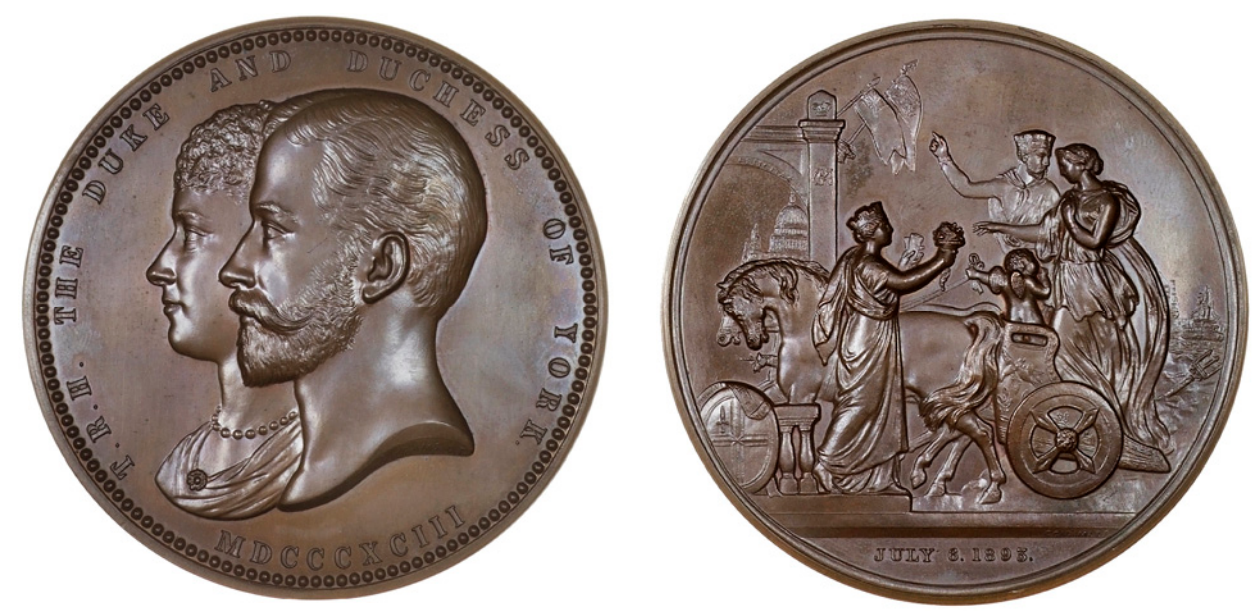
Visit of the Duke and Duchess of York to the City of London, 1893, a copper medal by G.G. Adams for the Corporation of London, conjoined busts left, rev. Duke and Duchess in biga left, being presented with a cornucopia by Londinia, 76mm (W & E 1763.1; BHM 3452; E 1780; Welch 25). Extremely fine; in original case of issue £80-100 Provenance: Bt Mrs Allen January 1975