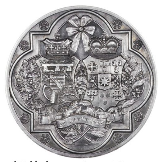
Marriage of the Duke of Albany and Princess Helen of Waldeck, 1882, a silver medal by J.S. & A.B. Wyon, conjoined busts right, rev. pair of crowned arms on wreaths of oak and rosemary within quadrilobe, 64mm (BHM 3113; E 1687). Good very fine, toned