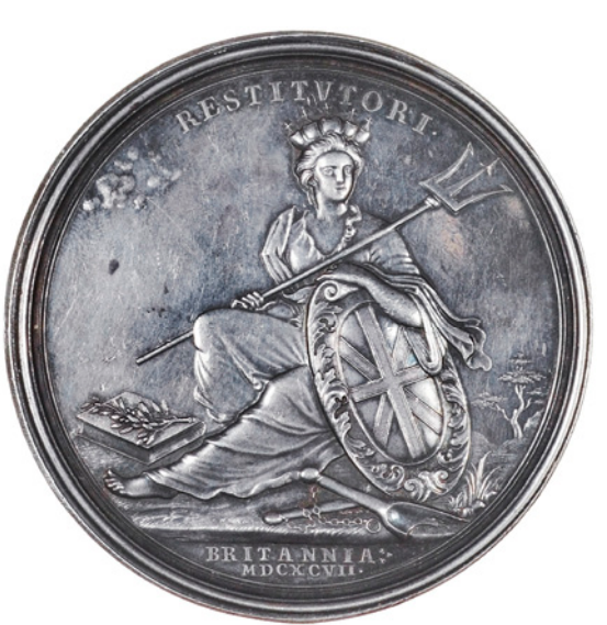
State of Britain, 1697, a silver medal, unsigned [by J. Croker], laureate and draped bust of William III right, rev. Britannia seated by an olive branch on a book and a broken yoke, 70mm, 107.46g (MI II, 192/499; E 372). About extremely fine, toned £500-600