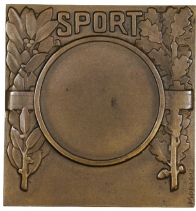
Natation , 1941, a bronze award plaque by E.-A. Monier and P.-A. Morlon, female swimmer in water, rev. circular tablet tied to branches of oak and palm, un-named, 54 x 50mm (CGMP p.262; cf. DNW 64, 1415). Good very fine, scarce £40-50