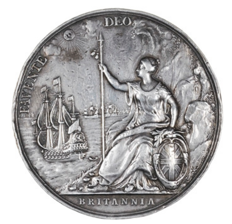
Peace of Breda, 1667, a silver medal by J. Roettiers, laureate bust of Charles II right, legend reads BRIT, rev. Britannia seated on rock contemplating her navies, edge lettered, 56mm, 74.71g (MI I, 535/185; E 241 var). Edge knocks, fine £100-150