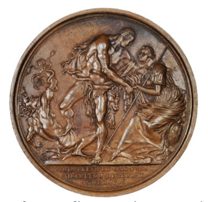
Battle of Culloden, 1746, a copper medal by R. Yeo, from the same dies as previous, 51mm (Woolf 55:2; MI II, 613/278; E 604). Extremely fine £100-150