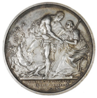
Battle of Culloden, 1746, a silver medal by R. Yeo, armoured bust of the Duke of Cumberland right, rev. Cumberland, as Hercules, clasping the hand of Britannia while trampling Discord, 51mm, 50.92g (Woolf 55:2; MI II, 613/278; E 604). About extremely fine; in contemporary shagreen case £200-250