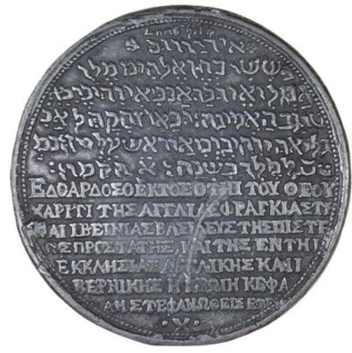
Edward VI, Coronation, 1547, a cast lead restitutional medal, unsigned [perhaps by H. Basse], crowned halflength bust right with sword and orb, legend in three concentric circles around, rev. 15-line legend in Hebrew and Greek, 64mm (MI I, 53/1; E 28b). Late 18th century work, fine to very fine £80-100