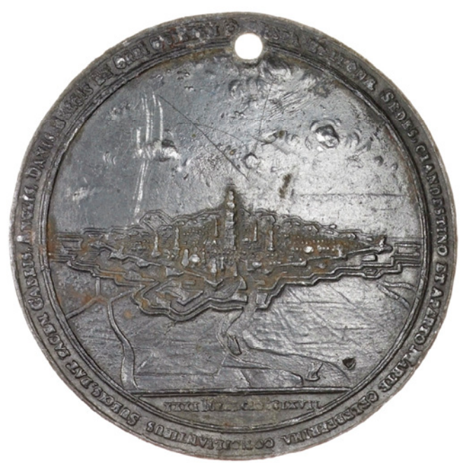
Peace of Breda, 1667, a lead medal, unsigned, Peace seated on clouds above military trophies which she burns, rev. panoramic view of Breda, 87mm (MI I, 530/178, not recorded in lead; v.L. II, 534). Large piercing at top, otherwise fine £80-100