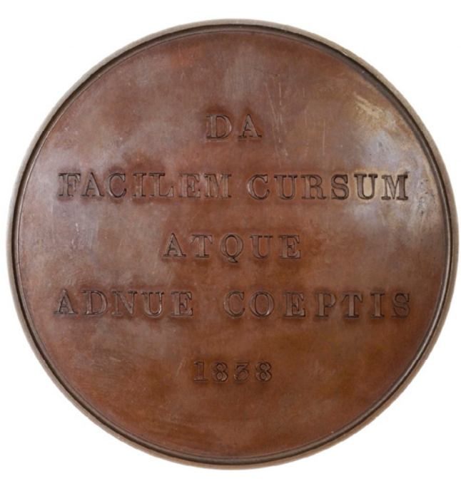
Victoria, Coronation, 1838, a copper medal by B. Pistrucci for Rundell, Bridge and Rundell, diademed and draped bust left, rev. DA FACILEM CURSUM ATQUE ADNUE COEPTIS and date, 87mm (W & E 90.1; BHM 1802; E 1309). Extremely fine; in black fitted case £150-200

Victoria, Coronation, 1838, a white metal medal by W.J. Taylor, bust right, rev. Knight on horseback, 42mm (W & 1200 E 129B1; BHM 1838; E 1314); together with other early Victorian white metal medals (16), including Marriage to Prince Albert 1840, Visits to Ireland 1849, 1852, etc [17]. First about extremely fine, in fitted contemporary case, others in varied state