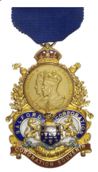
George V, Coronation, 1911, a gold and enamel badge by Elkington for the Corporation of Salford, conjoined busts left, set in an ornate mount with arms of Salford below, 55 x 39mm, 9ct, 30.32g. Extremely fine; with original blue ribbon and gilt suspender bar