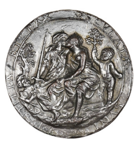
Anglo-Dutch Fishing Treaty, 1636, a plated electrotype copy of the medal by H. Reinhard, conjoined busts right, rev. Justice and Peace embrace, 54mm, 67.24g (MI I, 278/81; E 128). Good fine £80-100 Provenance: Bt March 1992