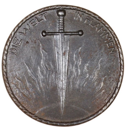
Die Welt in Flammen [The World in Flames], 1915, a cast iron medal by A. Zadikow, two naked warriors wrestling above a globe, rev. sword over a flaming globe, 65mm (Frankenhuis 766). Very fine £80-100

Provenance: D. Corrick Collection [bt M. Hood September 1992]