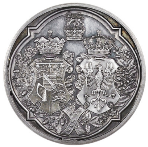
Marriage of the Duke of Connaught and Princess Louise of Prussia, 1879, a silver medal by J.S. & A.B. Wyon, conjoined busts left, rev. pair of crowned arms on wreaths of oak and rosemary within roseace, 64mm (BHM 3052; E 1662). Some scuffing in obverse field and rim nicks, otherwise very fine, reverse better, toned, rare