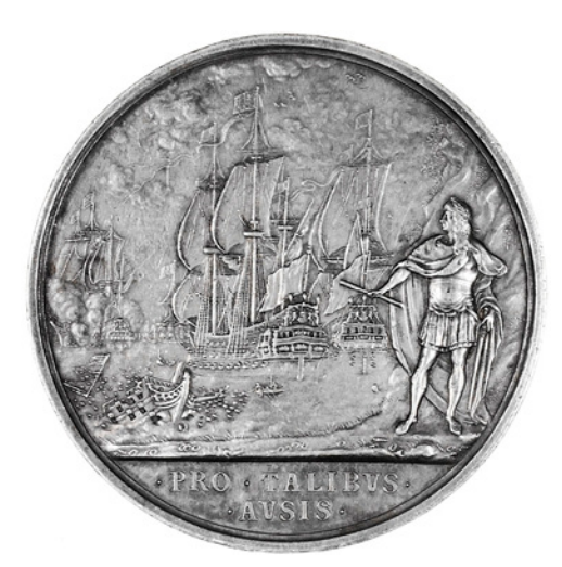
Naval Reward, 1665, a silver medal by J. Roettiers, laureate bust of Charles II right, rev. King on sea-shore viewing naval engagement, 62mm, 93.49g (MI I, 503/139; E 230). Stain in field by forehead, otherwise very fine £400-500 Provenance: Bt Mrs Allen September 1987