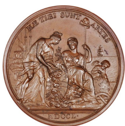
State of England, 1750, a copper medal by J.A. Dassier, laureate and armoured bust of George II left, rev. seated Britannia regarding Mercury, who pours out an abundant cornucopia, 55mm (MI II, 658/363; E 630; Eisler II, 297/22). About extremely fine £70-90