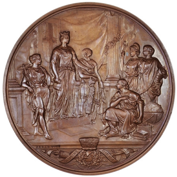
Opening of the New Council Chamber at the Guildhall, 1884, a copper medal by J.S. & A.B. Wyon for the Corporation of London, interior of the Chamber, rev. Londinia, attended by Commerce and Magistracy, addressing her council, 77mm (BHM 3177; E 1705; Welch 19; Taylor 206a). Extremely fine; in black case of issue Provenance: Bt Seaby November 1986

Franchise Demonstration, Glasgow, 1884, an openwork badge, city arms, 77 x 49mm; Edward VII, 1240 Coronation, medals (16), by A. Fenwick (3), in bronze, 38mm (W & E 4245.4), in white metal (2), 51mm, 33mm (W & E 4234B, 4237A.1), and copies (5); by G. Frampton for The Mint, Birmingham Ltd (5), in silver (2, 35 and 24mm), bronze (3, 51, 35 and 24mm) (W & E 4435.1, 2, 8, 10, 14; BHM 3767); unsigned, for Glasgow Children's Fete (3), all bronze, 36mm (W & E 4777) [17]. First fine and lacking pin, others generally very fine or better; in three original presentation cases