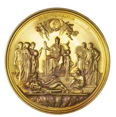
Victoria, Golden Jubilee, 1887, a gold medal by L.C. Wyon after Sir J.E. Boehm and Sir F. Leighton, crowned bust left, rev. enthroned figure of Empire surrounded by standing figures representing Science, Letters, Art, etc, Mercury and Time below, 58mm, 89.83g (W & E 2000.3; BHM 3219; E 1733a). A few light surface and scuff marks, particularly in upper reverse field, otherwise extremely fine; in original red leather case £2,000-2,500

Provenance: Baldwin Auction 46, 4 May 2006, lot 2074