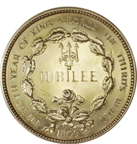
George III , Golden Jubilee , 1809, a silver-gilt medal by J. Barber for Rundell, Bridge and Rundell, King enthroned with sceptre and orb, Britannia, holding shield stands behind, rev. within wreath, a trident and Jubilee legend around, 70mm (BHM 641; E 992). A stamped 'cut' between Britannia's hand and sceptre and has been rubbed, otherwise good fine, extremely rare £200-300