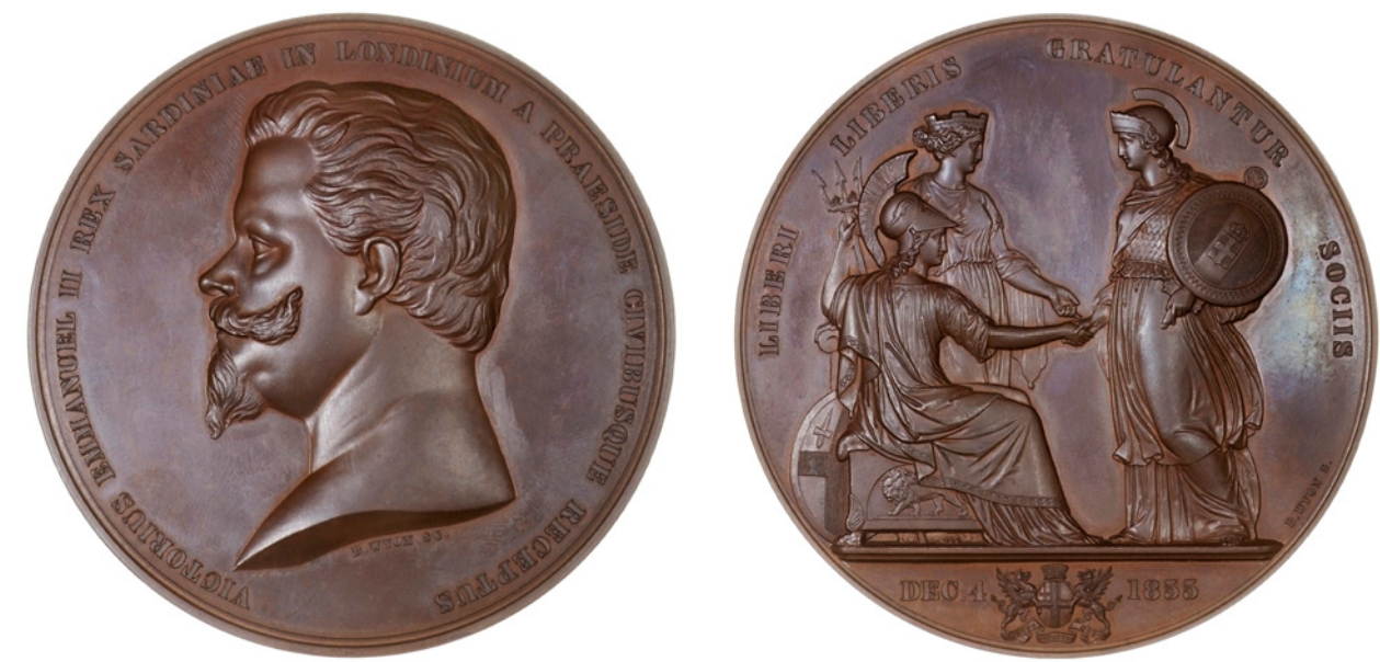
Visit of King Victor Emanuel II to the City of London, 1855, a copper medal by B. Wyon for the Corporation of London, bust left, rev. figures of Britannia, Londinia and Sardinia, 76mm (W & E 717.1; BHM 2567; E 1499; Welch 8). Extremely fine; in green fitted case of issue