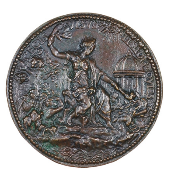
State of England, 1554, a cast bronze medal by J. da Trezzo, half-length portrait of Queen Mary left, veiled and draped, rev. seated figure of Mary as Peace, applying torch to pile of arms before a temple, supplicant figures beset by hailstorms to left, above, heavenly rays, below, water, 67mm (MI I, 72/20; E 33; Attwood 80; Arm. I, 241/3; Scher 54). A somewhat later and well patinated cast, very fine £150-200