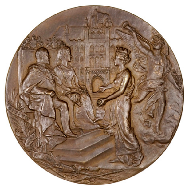
Edward VII, Visit to the City of London, 1902, a bronze medal by Searle & Co for the Corporation of London, conjoined busts left, rev. Londinia presents welcoming address to their majesties seated on a dais, 76mm (W & E 4850.1; BHM 3868; E 1874). Extremely fine; in black case of issue