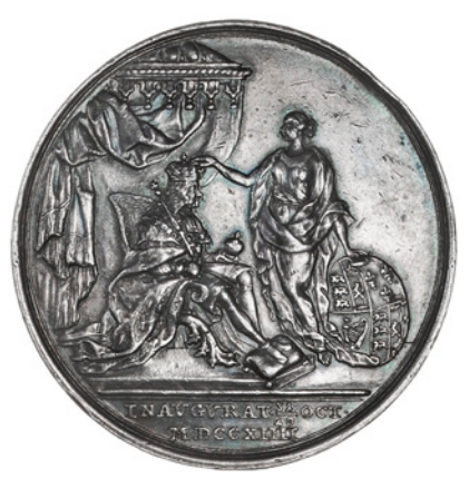
George I, Coronation, 1714, a silver medal by E. Hannibal, laureate, cuirassed and draped bust right, rev. King seated beneath canopy being crowned by Britannia, 52mm, 72.70g (MI II, 423/8; E 470). Scuffed, otherwise good fine £300-350

George I, Coronation, 1714, a silver medal by J. Croker, laureate bust right, rev. Britannia crowning King, 34mm, 1080 15.75g (MI II, 424/9; E 470); George I, Coronation , 1714, a silver counter, unsigned, 25mm, 3.22g (MI II, 428/18) [2]. About very fine and better £120-150