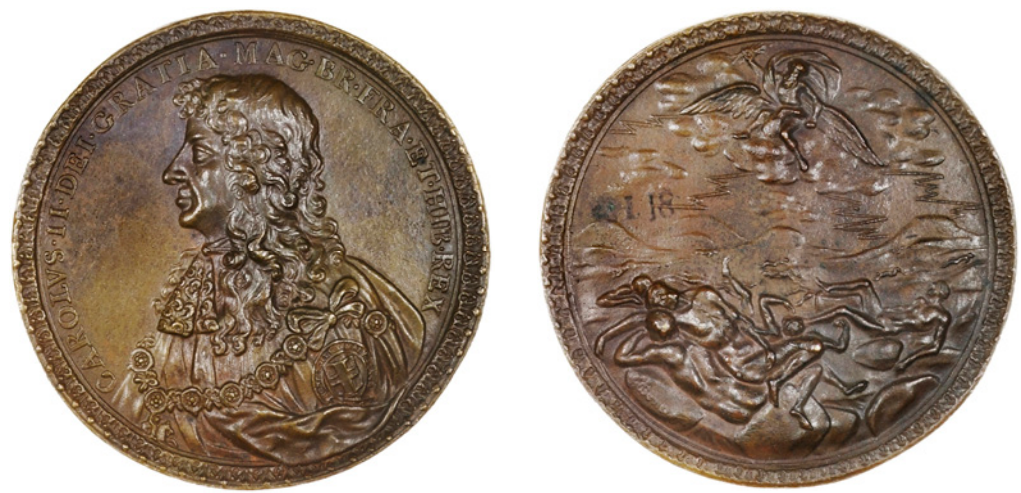
Charles II, Restoration, 1660, a cast bronze medal by G. Bower, bust left, hair long draped in robes of the Garter, rev. Jupiter, seated on his eagle, hurls his thunderbolts upon the giants who lie prostrate in a desolate landscape, ornamental border both sides, 64mm (MI I, 458/50; E 213). A contemporary cast of this very rare medal, very fine and patinated £200-250