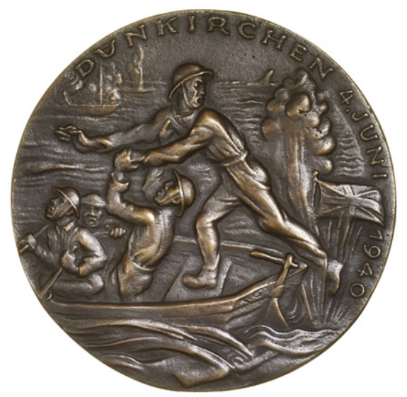
Ende der Flandern Schlacht [End of the Battle of Flanders], 1940, a cast bronze medal by K. Goetz, King Leopold standing, hands raised in surrender, German troops marching right in background, rev. British soldiers fleeing into a rowing boat under fire at Dunkirk, rescue ships in background, 71mm (K 574). Very fine, rare Provenance: DNW Auction M7, 1 July 2008, lot 2570; D. Corrick Collection

Einzug der Siegreichen Soldaten Adolf Hitlers in Mühldorf, 1940, a white metal medal, unsigned, crowd 1624 watch soldiers marching through town, rev. shields and swastika on wreath, 50mm; together with other miscellaneous World medals, etc (33, some silver), including a Hungarian plaque for the 1960 Olympic Games [34]. Varied state £60-80