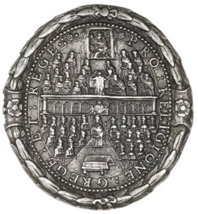
Declaration of Parliament, 1642, a plated cast copy of the unique medal by T. Rawlins, ship in full sail flying banners and flags, rev. the two Houses of Parliament, 54 x 50mm (MI I, 293/110). Very fine Provenance: Bt B. Brady October 1976

Charles I, Memorial, 1649, copper medals by J. Roettiers (2), armoured and draped bust right, revs. hand from 1020 heaven holds a crown, both 50mm (MI I, 346/200; E 162a). Very fine and better £120-150