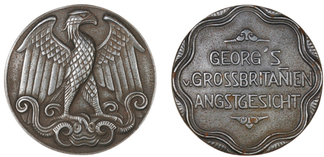
Georg's von Grossbritañien Angstgesicht [The Anxiety of King George], c. 1915, a cast iron medal by H. Weddig, eagle with octopus in its claws, rev. legend, 68mm (Frankenhuis 1506; BDM VIII, 255; cf. DNW 38, 945). Very fine £50-70