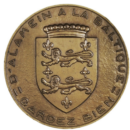
Viscount Montgomery of Alamein, 1946, a bronze medal by P. Turin, bust three-quarters left, wearing cap, rev. his shield of arms, d'alamein à la baltique, gardez bien, 68mm (BHM 4414; CGMP p.1837; cf. DNW 58, 1608). Minor edge nicks, otherwise extremely fine