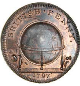
408 Bungay , Skidmore's Globe series, Penny, remains of Bungay Tower, rev . globe, edge 1 promise to pay on demand the bearer one penny, 24.23g/12h (DH Middlesex 136). Extremely fine with original colour £100-150