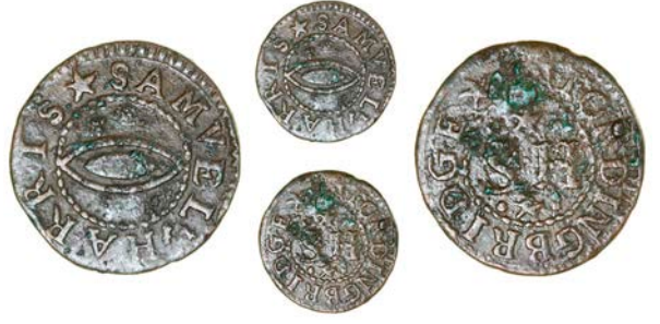
135 Fordingbridge , Samuel Harris, Farthing, 2.10g/6h (N 1862; BW. 66). Surface veridgris both sides, otherwise good fine, rare £50-70

Provenance: R.J. Carthew Collection, SCMB March 1946 (CT 14, part); D. Sadler Collection, DNW Auction T7, 7 October 2009, lot 278.