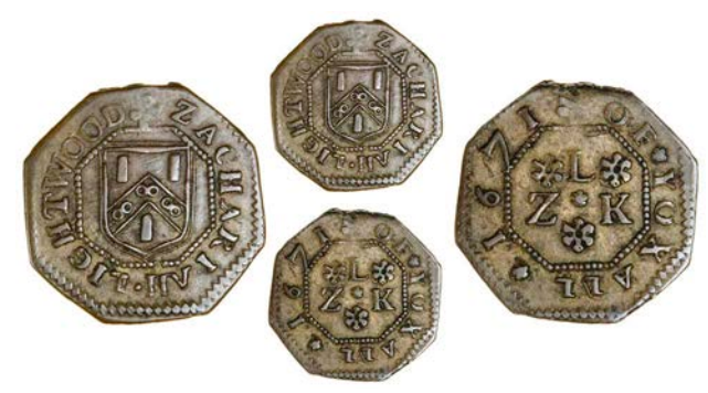
372 Yoxall , Zachariah Lightwood, octagonal Halfpenny, 1671, 1.53g/12h (N 4235; BW. 103). About very fine £70-90 Zachary Lightwood, ironmonger