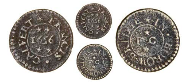
381 Boroughbridge , Francis Calvert, Farthing, 1656, 1.07g/6h (N 5811; BW. 36). About fine; the only issue for the town

382 Leeds , Henry Coates, Halfpenny, 1666, 1.35g/12h (N 5929; BW. 182). Excavated state £30-40