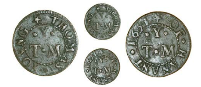
139 Havant , Thomas Young, Farthing, 1653, 1.09g/6h (N 1879; W 2; BW. 82). Good fine £50-70 Provenance: T.G. Anstiss Collection, DNW Auction T6, 19 March 2009, lot 14 [from S.H. Monks]