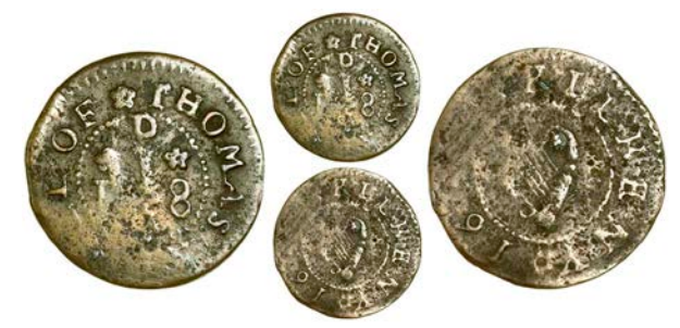
390 Co KILKENNY, Kilkenny, Thomas Nevell, Penny, 1658, 1.52g/7h (N 6291 rev., different obv.; Macalister 362a; BW. 521). Quarter flat, otherwise about fine, very rare £60-80