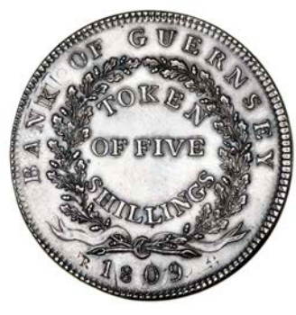
508 Bishop de Jersey & Co, electrotype of the Five Shillings, 1809, arms, rev. value in wreath, 22.36g/6h (cf. D 1; cf. Prid. 90). A good quality electrotype taken from an original which was struck over a Spanish-American 8 Réales of 1794; R punched to left of date, otherwise extremely fine