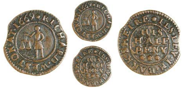
39 East Ilsley , Richard Weston, Halfpenny, 1669, 2.03g/12h (N 88; BW. 39). Surface and edge faults, otherwise good fine; the only issue for the town £40-50

Provenance: G. Atkins Collection, Reading CC Auction, 5 October 1998, lot 17