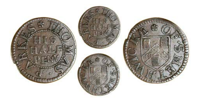
370 Smethwick , Thomas Parkes, Halfpenny, 1.72g/6h (N 4210; BW. 50). Good fine; the only issue for the town £60-80