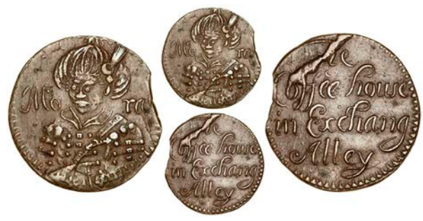
192 Exchange Alley , Morat's Coffee House [Walter Elford], Halfpenny, 1.84g/12h (N 6881; Berry p.121; BW. 968). Flan clip and die flaw on reverse in late stage, otherwise about very fine £60-80