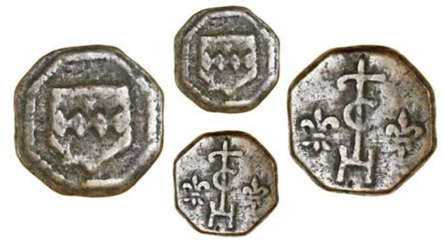
186 Sark , Amice de Carteret, octagonal token, c. 1600, 6.04g/6h (N 6367; D Uncertain 89D). Good fine, very rare

Provenance: Bt R. Gladdle February 2003.