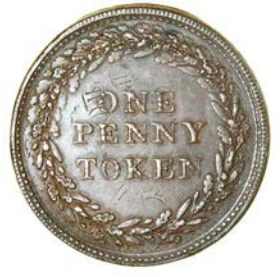
458 Sedbury , 'Sedbury Ironworks', Penny, factory, rev. value in wreath, 17.14g/6h (W 970a). Overstruck on an unlocalised 1813 Penny (W 1617), very fine, brown patina, rare £60-80