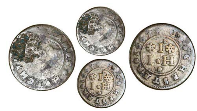
338 Chester, James Hutchinson, Penny, 1669, 2.76g/12h (N 506; BW. 21). Obverse mediocre, reverse about fine