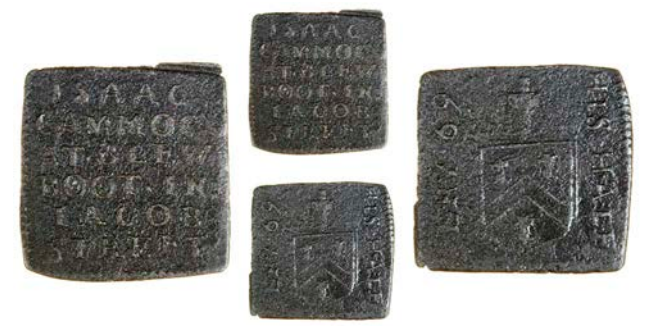
174 Jacob Street, Isaac Cammock, square Halfpenny, [16]69, 1.25g/3h (N -; BW. 275). Surface deposit and dark excavated patina, otherwise fine, extremely rare