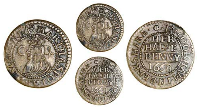
38 Cookham, Martha Spot, Halfpenny, 1668, 2.11g/12h (N 76; BW. 17). Legend weak in parts, otherwise good fine; the only issue for the village £60-80

Provenance: G. Atkins Collection, Reading CC Auction, 5 October 1998, lot 17