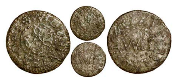
361 Tattershall , William Hunter, Farthing, 1660, 0.86g/6h (N –; BW. 262). About fine, very rare; only 5 specimens known to the cataloguer £80-100