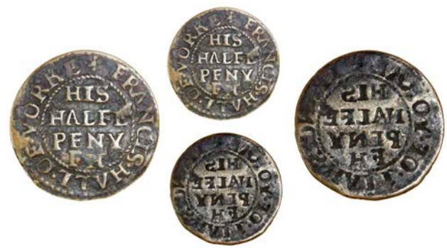
185 York, Francis Hall, Halfpenny [1666], obv. brockage, 1.06g (N 6125; BW. 399). Fine and unusual, very rare £80-100