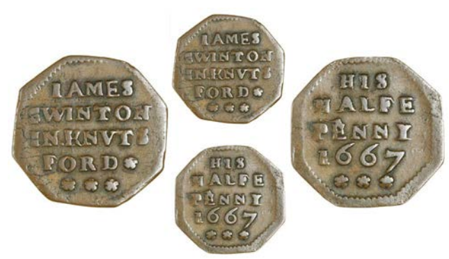
339 Knutsford , James Swinton, octagonal Halfpenny, 1667, 1.86g/12h (N 516; BW. 50). Good fine £80-100