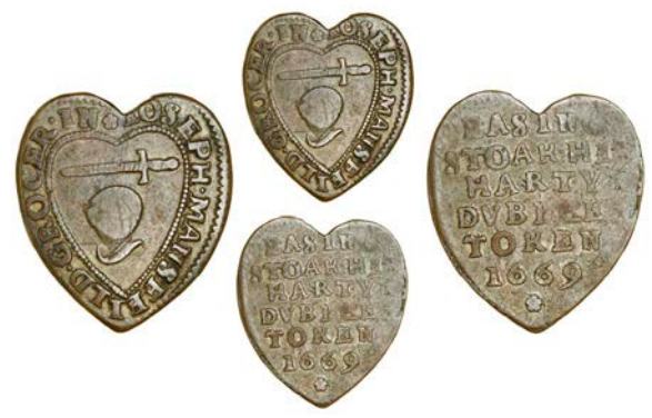
129 Basingstoke , Joseph Mansfeild, heart-shaped Halfpenny, 1669, 2.50g/12h (N 1831; BW. 36). Obverse fine, reverse nearly so, light brown patina £120-150

Henry Barefoot, churchwarden 1670, mayor 1679, 1680 and 1696. John Coleman (†March 1681), mayor 1655, 1665, 1673 and 1680. Samuel Kichener, chandler. Barnard Reeve, innholder, The Angel