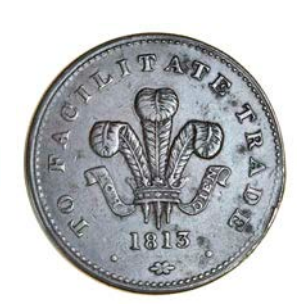
509 Jersey, Guernsey and Alderney , Pennies, 1813 (2), 17.08g/6h (W 2044), 17.85g/12h (W 2044a) [2]. First fine, second better but reverse partly weak, rare £100-150