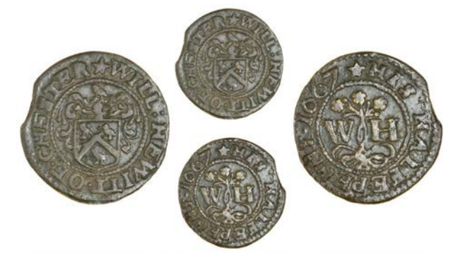
337 Chester , William Hewitt, Halfpenny, 1667, 1.54g/12h (N –; BW. 18). Flan clip, otherwise good fine, very rare £200-250