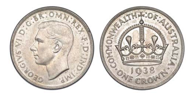
2118 George VI , Crown, 1938 (KM. 34). Minor bagmarks, otherwise extremely fine £90-120 Provenance : D.C. Pennock Collection

2117 George V, Halfpenny, 1923 (KM. 22). About very fine, very rare £600-800