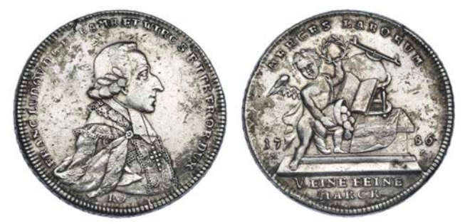
2160 WÜRZBURG, Franz Ludwig , Double-Thaler, 1786мр (KM. 427; Dav. 2906). Sometime cleaned, otherwise better than very fine, rare £300-400

2159 SCHLESWIG-HOLSTEIN, Christian VII, Speciedaler, 1788B-MF (KM. 138.1; Dav. 1311). Nearly very fine £90-120