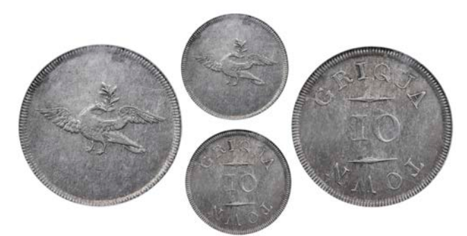
2199 GRIQUATOWN, Ten Pence (Hern GT1; KM. Tn5). Good<br/>very fine, lightly toned E 1,500-2,000Slabbed in NGC holder, graded XF 45