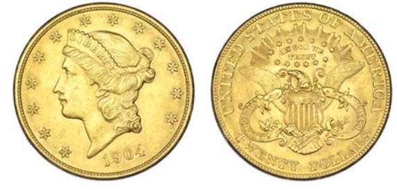
2236 Twenty Dollars, 1904. Extremely fine

2235 Twenty Dollars, 1894. Extremely fine or better G £1,000-1,100