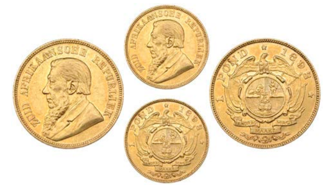
2203 Paul Kruger , Pond, 1892, single shaft (Hern Z45; KM. G 10.2; F 2). "Mai" lightly scratched beneath the bust, otherwise good very fine, reverse better, rare

2202 Thomas Burgers, Pond, 1874, fine beard (Hern B1; KM.G1.2; F 1a). Removed from a swivel mount and plugged,<br/>good fine or better but sweated£1,000-1,200