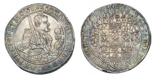
2158 SAXONY, Johann Georg I , Thaler, 1648 (KM. 525; Dav. 7612). Good very fine £100-150