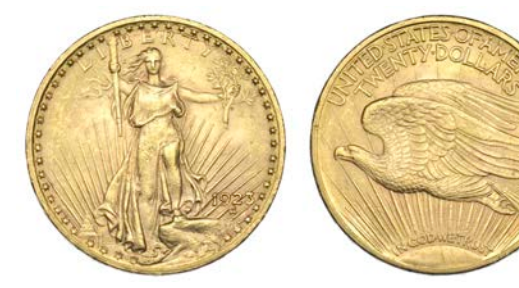
2238 Twenty Dollars, 1923. Extremely fine