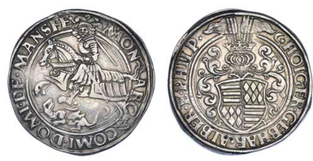
2156 MANSFELD-ARTERN, Hoyer VI, Gebhard VII, Albrecht II and Philipp II, Thaler, 1531, 29.15g/2h (Dav. 9479). Very fine or better £150-200

2155 BREMEN , City , Two-Thirds Thaler, 1753, in the name of Francis I (KM. 200). Nearly extremely fine £150-200