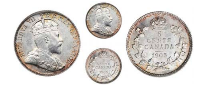
2136 Edward VII , 5 Cents, 1905 (KM. 13). Practically as struck, light peripheral toning £80-100

2135Edward VII, 5 Cents, 1903н, large н (КМ. 13). Practically<br/>as struck, lightly toned£200-250