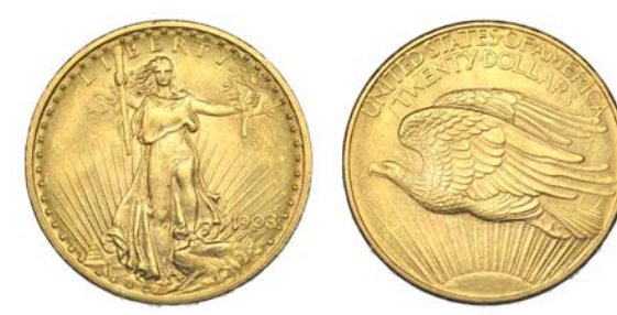
2237 Twenty Dollars, 1908. Extremely fine