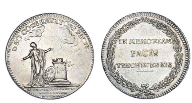
2154 BRANDENBURG-ANSBACH , Alexander , Thaler, 1779, Peace of Teschen (KM. 318; Dav. 2023). Small reverse edge nick, otherwise very fine or better, scarce £250-350

2161 Victoria, Quart, 1842/0 (Prid. 6; KM. 2). Extremely fine with considerable original colour £150-200