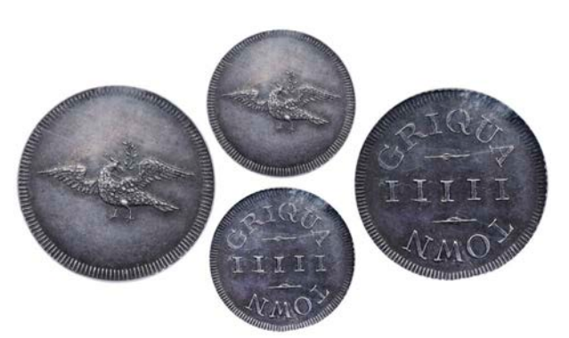
2200 GRIQUATOWN , Five Pence (Hern GT2; KM. Tn4). Extremely fine or better, toned £1,500-2,000