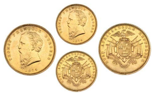
2201 Thomas Burgers, Pond, 1874, fine beard, 7.79g/6h (Hern G B1; KM. 1.2; F 1a). Has been pierced and plugged at 12 o'clock, otherwise very fine and very rare £2,500-3,000