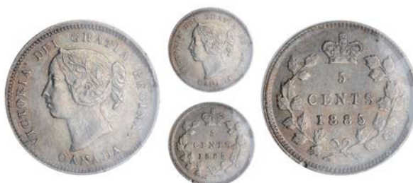
4020 Victoria, 5 Cents, 1885, small 5 (KM. 2). Nearly extremely fine Sealed and certified by ICCS, graded EF 45