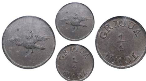
4465 GRIQUATOWN , Farthing (Hern GT4; KM. Tn1). Extremely fine or better with residual traces of original colour