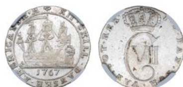
4184 Christian VII , 12 Skilling, 1767, Altona [struck in 1790-1] (Hede 146; KM. 12). Almost extremely fine

Slabbed in NGC holder, graded XF details, surface hairlines