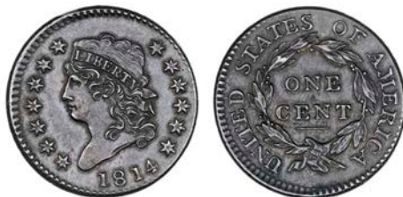
4511 Cent, 1814, crosslet 4 (Sheldon 294). Marginally off-centre, light scratch on cheek, otherwise nearly extremely fine £400-600