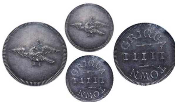
4463 GRIQUATOWN , Five Pence (Hern GT2; KM. Tn4). Extremely fine or better, toned