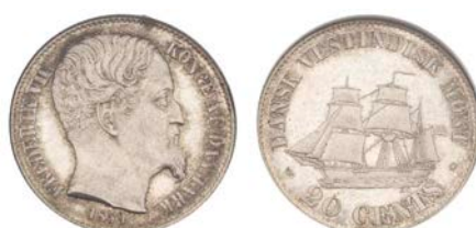
4188 Frederick VII , Proof-like 20 Cents, 1859 (KM. 67). About as struck, toned, rare

Last slabbed in NGC holder, graded MS 63