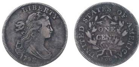
4510 Cent, 1798 (Sheldon 157). Die break from throat to rim and some surface marks, otherwise fine or better £90-120