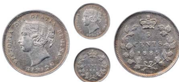
4019 Victoria, 5 Cents, 1884, near 4 (KM. 2). Nearly extremely fine, rare Sealed and certified by ICCS, graded EF 45