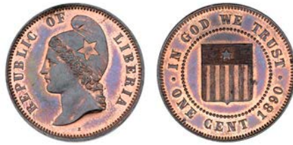
4441 Republic , Pattern Cent, 1890, unsigned, in copper, similar, rev. shield, edge plain, 7.06g/6h (KM. Pn48). Practically as struck with some original colour £90-120