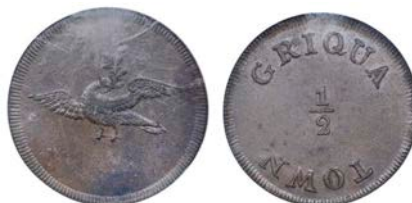
4464 GRIQUATOWN , Halfpenny (Hern GT3; KM. Tn2). Nearly extremely fine