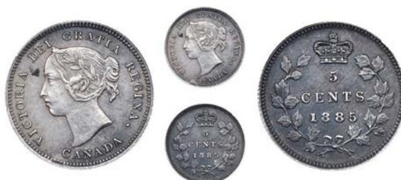
4021 Victoria, 5 Cents, 1885, small 5 over large 5 (KM. 2). Stain in obverse field, otherwise about extremely fine, rare