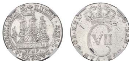
4183 Christian VII , 24 Skilling, 1767 Altona, pellets to left of M and after date (Hede 148; KM. 10). Good very fine, rare