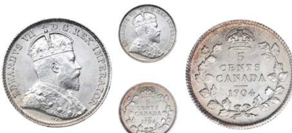
4040 Edward VII, 5 Cents, 1904 (KM. 13). Practically as struck, scarce