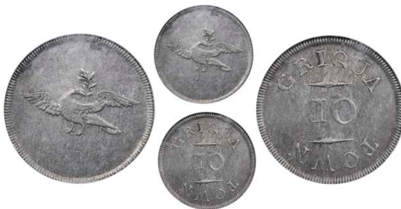
4462 GRIQUATOWN , Ten Pence (Hern GT1; KM. Tn5). Good very fine, lightly toned