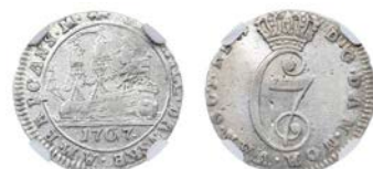
4185 Christian VII , 6 Skilling, 1767 (Hede 136; KM. 11). Good very fine, slightly bent