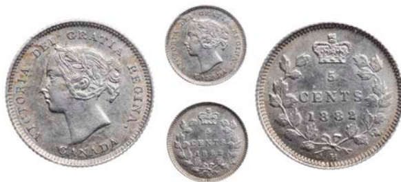
4017 Victoria, 5 Cents, 1882 H (KM. 2). Better than extremely fine Sealed and certified by ICCS, graded AU 55