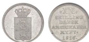
4186 Frederick VI , 20 Skilling, 1816 (KM. 15). About as struck

Slabbed in NGC holder, graded XF details, bent