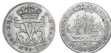
4181 Frederick V , 12 Skilling, 1748 (Hede 117; KM. 5). Very fine, rare