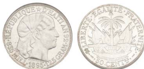
4236 Republic , 50 Centimes, 1895 (KM. 47). Almost as struck