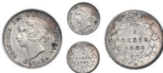
4018 Victoria, 5 Cents, 1883 H (KM. 2). A few surface marks and stains, otherwise nearly extremely fine