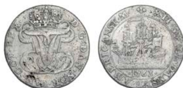
4182 Frederick V , 12 Skilling, 1763 (Hede 121; KM. 6.2). Good fine