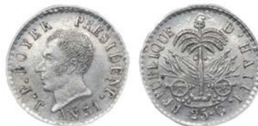
4232 Jean-Pierre Boyer , 25 Centimes, AN 31 [1834] (KM. 15.2). Good extremely fine