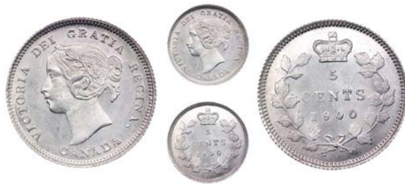
4034 Victoria, 5 Cents, 1900, narrow o (KM. 2). Practically as struck