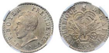
4231 Jean-Pierre Boyer , 25 Centimes, AN 25 [1828] (KM. 15.2). About as struck

Slabbed in ANACS holder, graded AU 58 cleaned