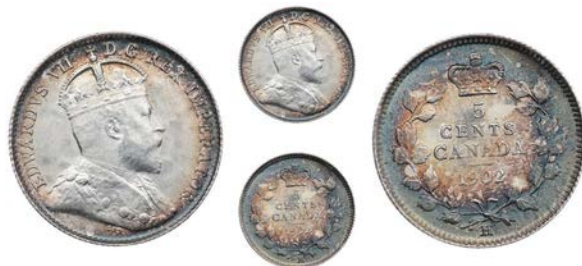
4037 Edward VII, 5 Cents, 1902 H , large H (KM. 9). Practically as struck, lightly toned