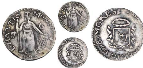
4227 North Haiti , 7 Sols 6 Deniers, 1808, 1.56g/6h (KM. 3). Fine, rare