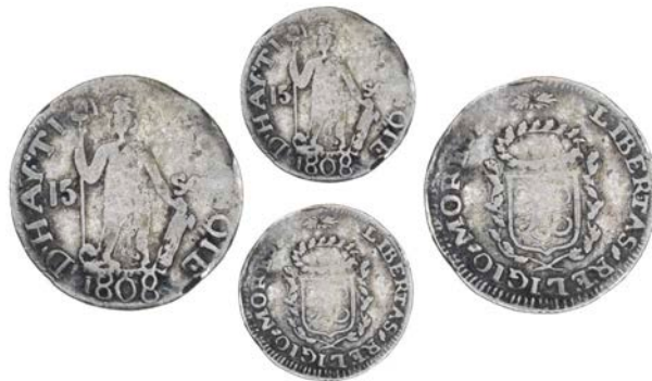
4226 North Haiti , 15 Sols, 1808, 2.20g/6h (KM. 6). Weak at 1 o'clock, otherwise fine, rare