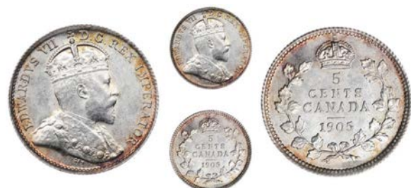
4041 Edward VII, 5 Cents, 1905 (KM. 13). Practically as struck, light peripheral toning