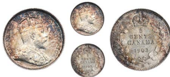
4038 Edward VII, 5 Cents, 1903 H , large H (KM. 13). Practically as struck, lightly toned