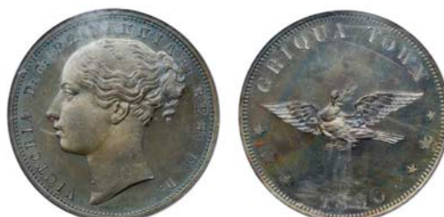
4466 GRIQUATOWN, Victoria , Pattern Penny, 1890, by W. Lauer, in bronze, bust left, rev. dove with olive branch between six stars, large letters, edge plain, 6h (Hern GT20; KM. Pn5). Practically as struck