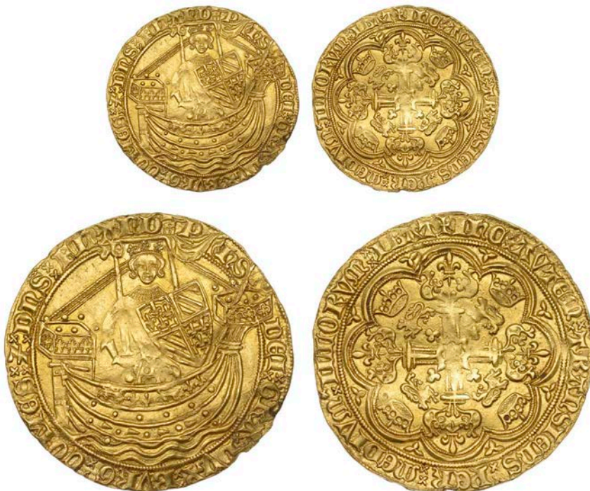
4442 FLANDERS, Philip the Bold (1384-1404), Noble, Bruges, Ghent or Malines, after 1388, imitating the contemporary English issue, 7.69g/1h (Del. 474; SCBI Schneider 152-3; F 169). Small edge scuff, slightly creased and weak in centre of reverse, otherwise good very fine £1,500-2,000