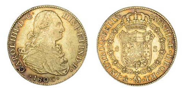
112 Charles IV , 8 Escudos, 1806тн, Mexico City (СС 17300; ССТ 56; КМ. 159; F 43). Better than very fine £800-1,000