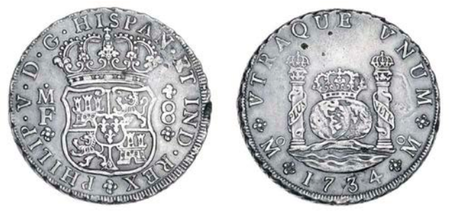
Philip V, 8 Réales, 1734MF, Mexico City (Cayón 9381; KM. 103). Better than very fine, but possibly from sea salvage £90-120