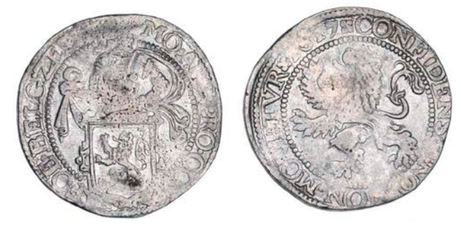
119 ZEELAND , Lion Daalder, 1617 (Del. 839; KM. 16). Fine £80-100

118 UTRECHT , Ducaton, 1760 (Del. 1031; Dav. 1832; KM. 92). Very fine, but with attempted piercing on reverse and lightly gilt at some time £80-100