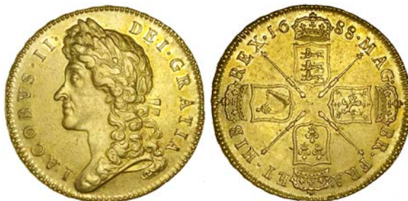
1619 Five Guineas, 1688, second bust, edge QVARTO (MCE 119; S 3397A). Nearly extremely fine