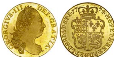
1657 Proof Guinea, 1774, fourth bust, edge plain, 8.10g/12h (MCE 379; S 3728). A few minor surface marks, otherwise practically as struck