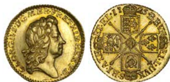
1637 Half-Guinea, 1725, second bust (MCE 274; S 3637). About extremely fine