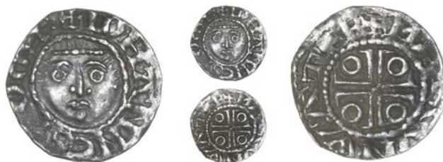
1789 Second coinage, Halfpenny, Waterford, type Ib, Marcus, MARC ON WATER, obv. reads IOHANNES DOMI', 0.74g/6h (S 6208; DF 39). About very fine, portrait better, scarce £200-300