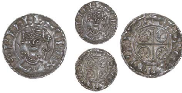
1038 Penny, PAXS type, Dorchester, Oter, OTER ON DORECEST, 1.37g/6h (BMC 631; N 850; S 1257). Extremely fine, rare £700-900