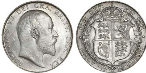
1749 Halfcrown, 1910 (ESC 755; S 3980). A few surface marks, otherwise practically as struck