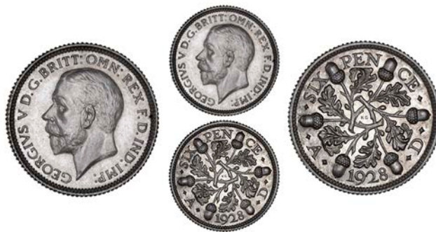
1507 1928 Proof , edge grained, 2.81g/12h (Davies 1892P; ESC –; KM. 832). Practically as struck, extremely rare £300-400