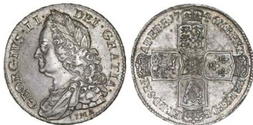
1654 Halfcrown, 1746 LIMA, edge DECIMO NONO (ESC 606; S 3695A). Nearly extremely fine