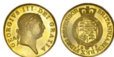
1660 Proof Guinea, 1813, sixth bust, 8.42g/12h (WR 114; MCE 404; S 3730). Some light hairlining, otherwise good extremely fine, very rare