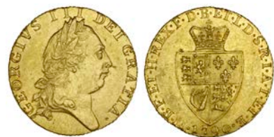
1658 Guinea, 1790, fifth bust (MCE 394; S 3729). Some surface marks, otherwise nearly extremely fine