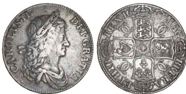
1613 Crown, 1663, first bust, no stops on rev., edge xv (ESC 27A; S 3354). Graffiti on face, otherwise good fine or better, rare £200-250