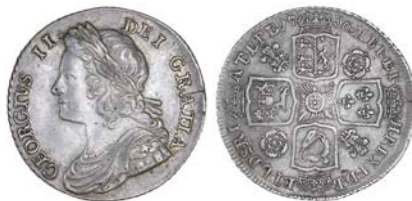
1655 Shilling, 1736, roses and plumes (ESC 1199; S 3700). Tiny edge split, otherwise better than very fine