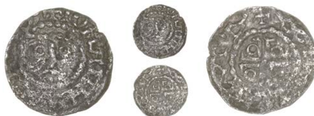
1791 Second coinage, Halfpenny, Waterford, type Ib, Willmus, w[—] WAT', 0.63g/6h (S 6208; DF 39). Surfaces rough, otherwise fine or better £90-120