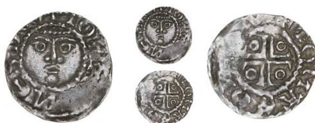
1784 Second coinage, Halfpenny, Dublin, type Ib, Tomas, TOMAS ON D[—]VV, 0.72g/9h (S 6205; DF 39). Flat in places, otherwise very fine or better, toned £200-300