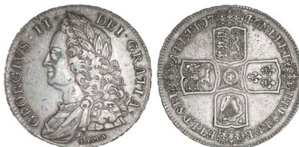
1651 Crown, 1746 LIMA, edge DECIMO NONO (ESC 125; S 3689). Better than very fine