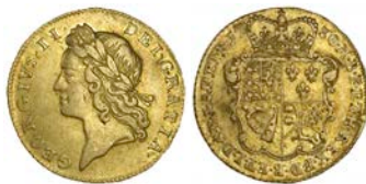
1647 Half-Guinea, 1730 (MCE 337; S 3681A). About very fine, scarce