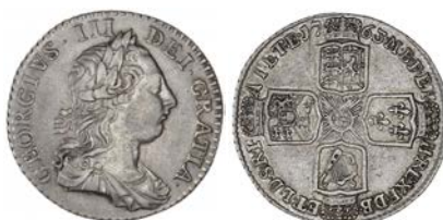
1664 Shilling, 1763 (ESC 1214; S 3742). Slight scratch by date, otherwise about very fine