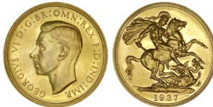
§ 1750 Proof Two Pounds, 1937 (S 4075). Rather scuffed, extremely fine