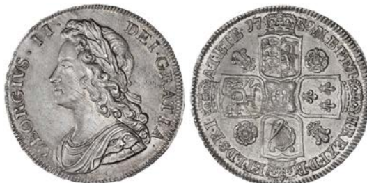
1652 Halfcrown, 1732, roses and plumes, edge SEXTO (ESC 596; S 3692). A few light adjustment marks, otherwise better than extremely fine with some mint bloom