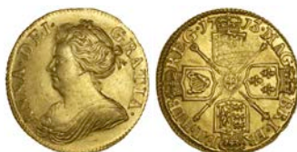
1631 Half-Guinea, 1713 (MCE 236; S 3575). Adjustment mark on reverse, otherwise extremely fine