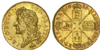
1620 Guinea, 1685, first bust, elephant and castle (MCE 124; S 3401). Some minor surface marks and hairlines, otherwise extremely fine or better