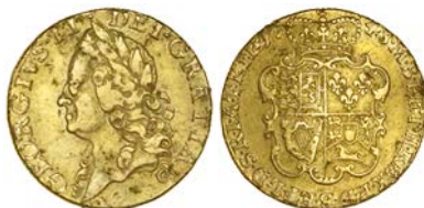
1646 Guinea, 1748 (MCE 323; S 3680). Nearly very fine but slightly bent