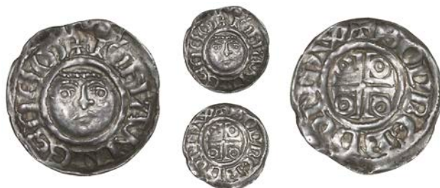
1787 Second coinage, Halfpenny, Dublin, type Ic, Robert, RODBERD : ON : DW, obv. reads IOHANNES DEM, 0.67g/8h (S 6206; DF 40a). About very fine on a spread flan £200-250