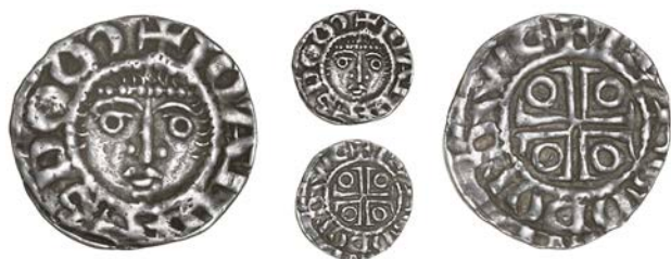
1785 Second coinage, Halfpenny, Dublin, type Ib, Turgod, TVRGOD ON DWE, 0.78g/9h (S 6205; DF 39). Very fine, portrait better £200-300