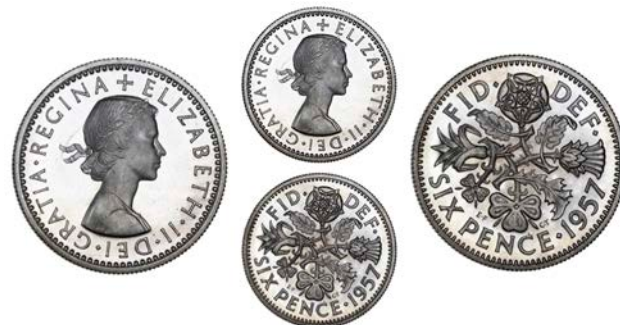
1519 1957 Proof , edge grained, 2.81g/12h (Davies 2455P; ESC p.168 footnote; KM. 903). Brilliant, very rare £200-250