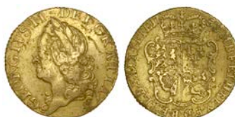
1649 Half-Guinea, 1752 (MCE 361; S 3685). Scraped in obverse field, otherwise fine or better