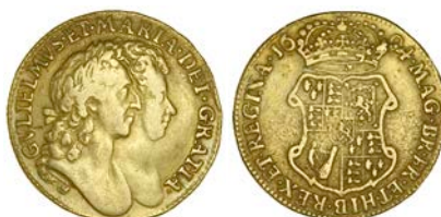
1622 Guinea, 1694/3 (MCE 142; S 3426). Edge knock at 3 o'clock, slightly flat on Queen's neck, otherwise good fine, the overdate clear