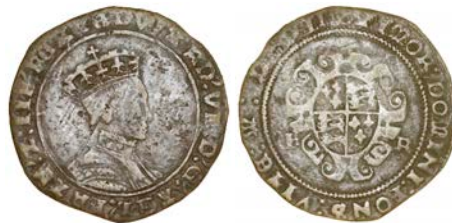
1826 Shilling, MDLII, Dublin, mm. harp, a contemporary imitation in brass, 4.61g/12h (S 6494A; cf. DF 213). Good fine £120-150