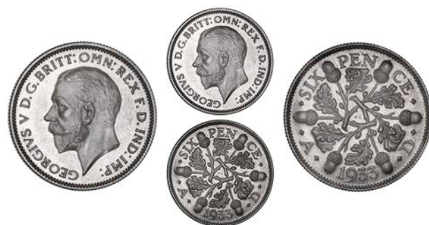
1509 1933 Proof , edge grained, 2.85g/12h (Davies 1897P; ESC –; KM. 832). Practically as struck, extremely rare £300-400