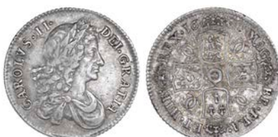
1616 Shilling, 1668, second bust (ESC 1030; S 3375). Good very fine, lightly toned £500-600