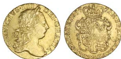
1656 Guinea, 1771, third bust (MCE 376; S 3727). A few surface marks, otherwise about very fine