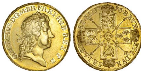
1635 Five Guineas, 1716, edge SECVNDO (MCE 238; S 3626). A few light surface scratches, otherwise about extremely fine