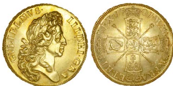
1624 Five Guineas, 1701, second bust, edge DECIMO TERTIO (MCE 172; S 3456). A few surface marks, otherwise better than extremely fine