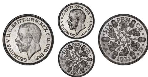
1508 1931 Proof , edge grained, 2.82g/12h (Davies 1895P; ESC –; KM. 832). Practically as struck, extremely rare £300-400