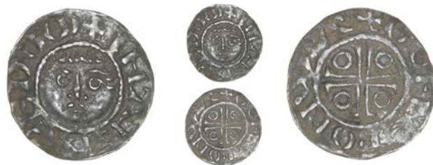
1788 Second coinage, Halfpenny, Waterford, type Ib, Gefrei, GEFREI · ON WA, 0.77g/2h (S 6208; DF 39). About very fine, portrait better, dark tone, scarce £200-300