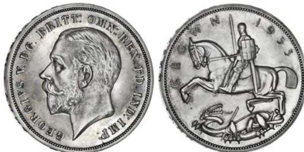
1751 Proof Crown, 1935, edge xxv, 28.39g/12h (ESC 378; S 4050). Some surface marks, otherwise practically as struck, lightly toned