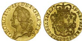
1650 Half-Guinea, 1759 (MCE 365; S 3685). Better than extremely fine