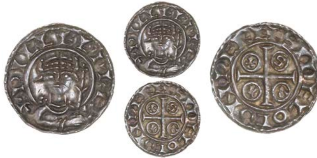
1039 Penny, PAXS type, Wareham, Sideloc, SIDELOC ON PERE, 1.39g/6h (BMC 1038-9; N 848; S 1257). Good very fine and toned, rare £400-600

Provenance: A.A. Banes Collection, Sotheby, 30-31 October 1922, lot 17; Lt W.S. Marshall Collection, Glendining Auction, 29 April 1946, lot 49 (part) [from Seaby December 1939]