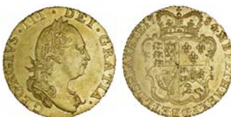
1662 Half-Guinea, 1784, fourth bust (MCE 424; S 3734). Extremely fine