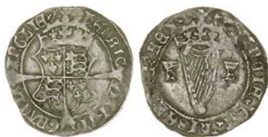
1821 Fourth Harp issue, Sixpenny Groat, mm. lis, HR by harp, 2.51g/7h (S 6482; DF 209). Nearly very fine £90-120