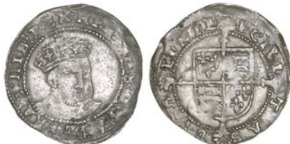
1822 Posthumous coinage, Sixpenny Groat, type IV, Dublin, mm. P on rev. only, late Tower bust, 2.26g/10h (S 6488; DF 218). On a broad flan of good metal, good very fine or better for issue £250-300