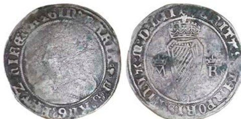
1827 Shilling, MDLIII, mm. lis (at 3 o'clock), reads HIBE REGIN', 5.41g/6h (S 6495; DF 225). Portrait weak, otherwise fine, reverse good fine or better for issue, very rare £500-700