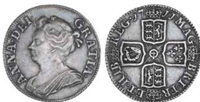
1634 Shilling, 1711, fourth bust (ESC 1158; S 3618). Scratches at nape of neck, otherwise good very fine or better £80-100