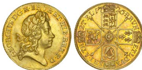
1636 Two Guineas, 1726 (MCE 244; S 3627). Some surface marks in obverse field, otherwise extremely fine