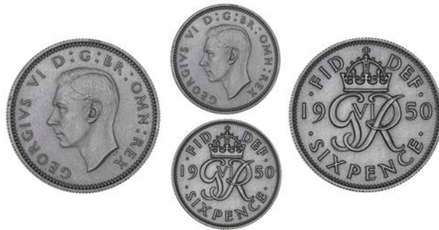
1516 1950 Matt Proof , edge grained, 2.84g/12h (Davies –; ESC –; KM. 875). Matt, practically as struck, extremely rare £600-800