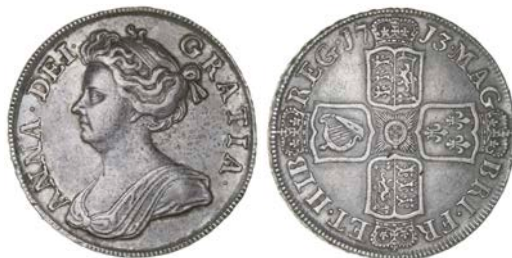
1632 Halfcrown, 1713, edge DVODECIMO (ESC 583; S 3604). Some surface marks, otherwise good very fine