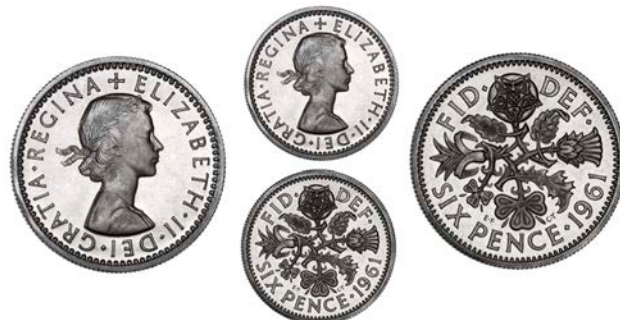
1521 1961 Proof , edge grained, 2.81g/12h (Davies 2459P; ESC p.168 footnote; KM. 903). Brilliant, very rare £200-250