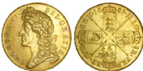
1618 Five Guineas, 1687, edge TERTIO (MCE 117; S 3397A). Nearly extremely fine £6,000-8,000