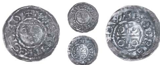
1786 Second coinage, Halfpenny, Dublin, type Ic, Robert, RODBERD : ON : DWE, obv. reads IOHANNES DEO, 0.67g/8h (S 6206; DF 40a). Reverse slightly off-centre, otherwise very fine on a full round flan £200-250