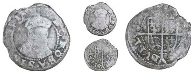
1824 Posthumous coinage, Three-Halfpence (Quarter-Groat), late Tower bust, 0.66g/11h (S 6492A; DF 222). Nearly fine, reverse better, very rare £150-200