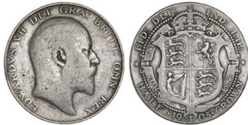
1748 Halfcrown, 1905 (ESC 750; S 3980). Nearly fine, the date clear, rare