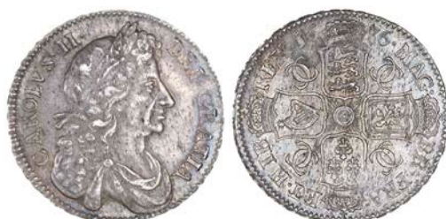
1614 Halfcrown, 1676, fourth bust, edge, VICESIMO OCTAVO (ESC 478; S 3367). Surfaces a little haymarked, otherwise extremely fine, lightly toned £1,200-1,500