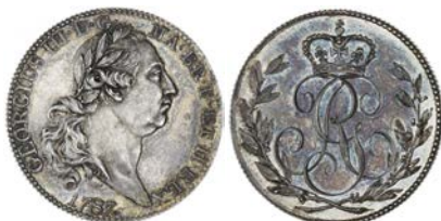
1665 Pattern Shilling, 1787, by J.-P. Droz, in silver, laureate bust right, DF on truncation, rev. GR crowned within wreath, edge grained, 5.00g/12h (ESC 1242; Selig –). Some hairlining, otherwise good extremely fine with proof-like fields, toned, very rare