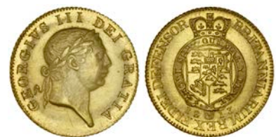
1659 Guinea, 1813, sixth bust (MCE 404; S 3730). Extremely fine or better