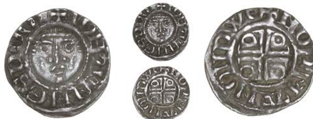
1783 Second coinage, Halfpenny, Dublin, type Ib, Norman, NORMAN ON DWE, 0.71g/11h (S 6205; DF 39). Good very fine, toned £200-300