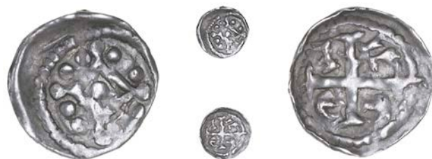
1792 Second coinage, Farthing, Dublin, Alex (?), mascle with trefoil of pellets at angles, rev. ALEX in arms of cross, 0.27g/12h (S 6220; DF 38). Very fine, excessively rare £1,200-1,500

Provenance: H. Hird Collection, Glendining Auction, 6 March 1974, lot 172.