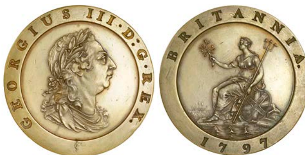
1667 Restrike Proof Twopence, 1797, by W.J. Taylor after C.H. Küchler, in gilt-copper, stops by κ not drilled out, incuse stops both sides, edge plain, 56.12g/6h (cf. BMC 1078-9 [R 48]; Selig –). Gilding inferior to contemporary productions, otherwise as struck, not recorded with gilt finish, extremely rare