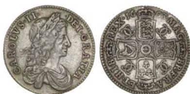
1615 Shilling, 1663, first bust (ESC 1022; S 3371). Nearly very fine £150-200