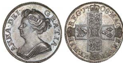
1633 Shilling, 1708, third bust (ESC 1147; S 3610). Extremely fine or better, toned