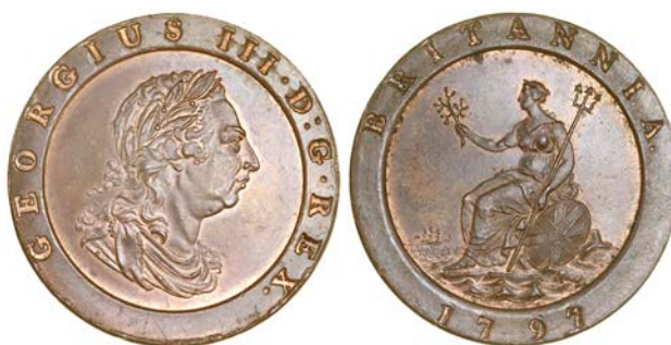
1666 Twopence, 1797 (BMC 1077; S 3776). Minor grazes on obverse rim at 6 o'clock and a couple of spots on reverse, otherwise extremely fine with original colour