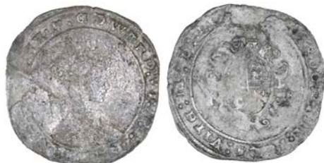
1825 Shilling, MDLII, Dublin, mm. harp, bust 6, 4.49g/2h (DF 213; S 6494). About fine, very rare £500-700