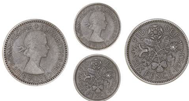
1518 1953 Matt Proof , edge grained, 2.75g/12h (Davies –; ESC –; KM. 889). Matt, as struck, dark, extremely rare £600-800