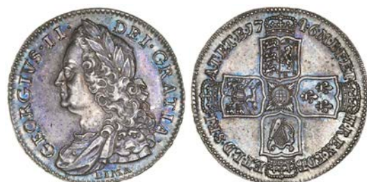
1653 Halfcrown, 1746 LIMA, edge DECIMO NONO (ESC 606; S 3695A). Extremely fine, attractively toned