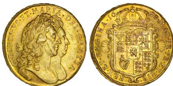
1621 Five Guineas, 1693, edge QVINTO (MCE 140; S 3422). A couple of small rim marks, otherwise extremely fine