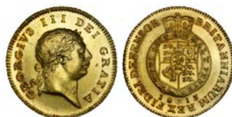
1663 Half-Guinea, 1813, seventh bust (MCE 448; S 3737). Better than extremely fine