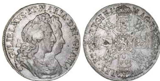
1623 Halfcrown, 1693, 3 over inverted 3, edge QVINTO (ESC 521; S 3436). Nearly very fine