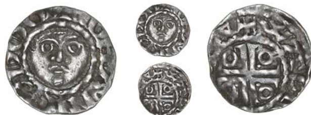
1790 Second coinage, Halfpenny, Waterford, type Ib, Walter, WALT[ER ON W]A, 0.70g/6h (S 6208; DF 39). Reverse off-centre, otherwise very fine £200-300