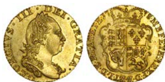
1661 Half-Guinea, 1778, fourth bust (MCE 421; S 3734). Extremely fine