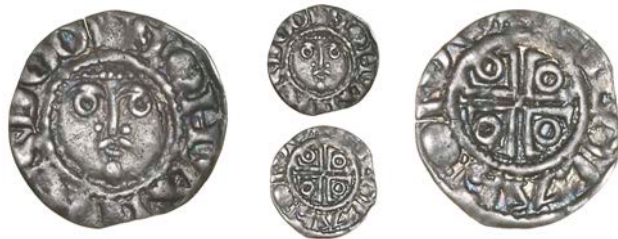
1782 Second coinage, Halfpenny, Dublin, type Ib, Nicolas, NICOLAS ON DW, 0.62g/4h (S 6205; DF 39). Very fine, toned, rare £200-300