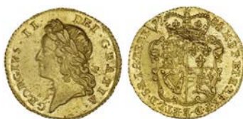
1648 Half-Guinea, 1734 (MCE 344; S 3681A). Some surface marks and flecking, otherwise nearly extremely fine