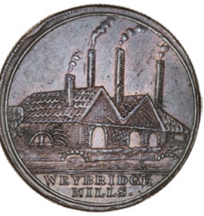
157 Surrey, Weybridge, John Bunn & Co, Penny, 1812 (W 1200). Minor surface marks, about extremely fine £40-50