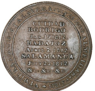
165 Picard's Wellington series, Halfpenny, 1812 (W 1526). Very fine £10-15