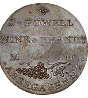
126 Monmouthshire, Abergavenny, James Powell, Halfpenny, 1795 (DH 1). Extremely fine, patinated £70-90