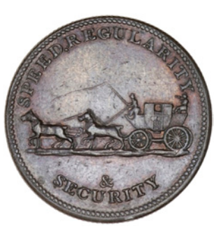
152 London, Lad Lane, William Waterhouse, Halfpenny (W 840). Extremely fine £40-60