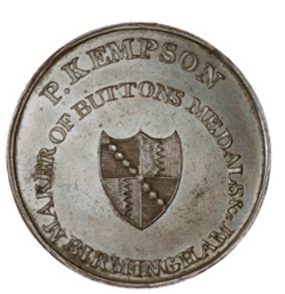
112 Warwickshire, Birmingham, Kempson's Halfpenny, Hotel (DH 208). Extremely fine, patinated £30-40