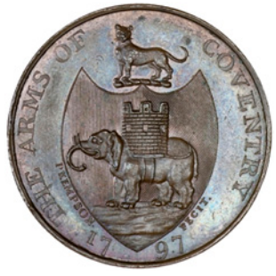
115 Warwickshire, Coventry, Kempson's Halfpenny, Coventry Cross (DH 286). Extremely fine £35-45