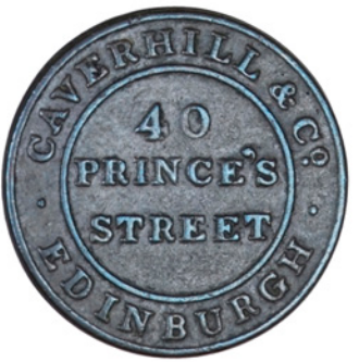
193 Midlothian, Edinburgh, Caverhill & Co, Farthing, 1823 (BWS 7070). About very fine