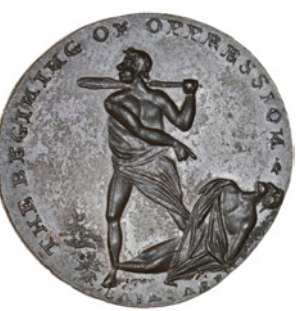
64 Middlesex, Thomas Spence, mule Halfpenny, sailor and landsman/Cain and Abel (DH 735). Extremely fine, patinated £90-120