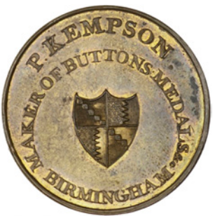
109 Warwickshire, Birmingham, Kempson's Halfpenny, in brass, General Hospital (DH 181). Minor spotting, otherwise virtually as struck £40-60