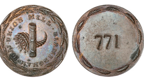
98 Warwickshire, Birmingham, Union Mill, Penny, 1796, no. 771 (DH 37). Some spotting, otherwise extremely fine £60-80