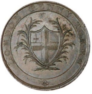
34 Middlesex, Kempson's Buildings, Penny, Trinity Almshouse (DH 67). About extremely fine £30-40