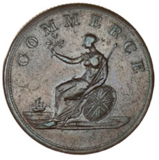
170 Marquis Wellington, Halfpenny, 1813 (W 1565). Good fine