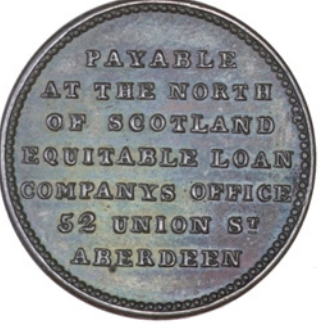
Aberdeenshire, Aberdeen, North of Scotland Equitable Loan Co, Farthing (BWS 6990). Extremely fine £50-70