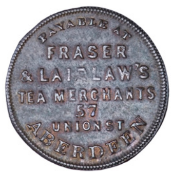
173 Aberdeenshire, Aberdeen, Fraser & Laidlaw, Farthing, 1838 (BWS 6950). Good very fine, scarce £40-50