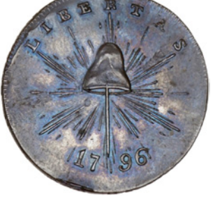
75 Middlesex, Thomas Spence, mule Halfpenny, Thelwall/cap of Liberty (DH 865). Some staining, extremely fine £60-80