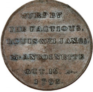
80 Middlesex, Skidmore's mule Halfpenny, Louis and Marie Antoinette/legend (DH 995a). Extremely fine £35-45