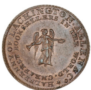
54 Middlesex, Finsbury Square, Lackington, Allen & Co, Halfpenny, 1795 (DH 358). Extremely fine, original colour £20-30