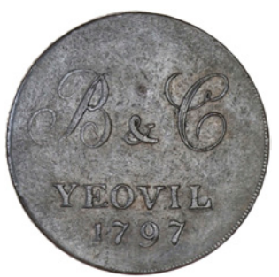
89 Somerset, Yeovil, Brett & Cayme, Halfpenny, 1797 (DH 110). About very fine £15-25