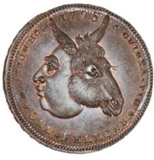
82 Northumberland, Newcastle-upon-Tyne, Spence's mule Halfpenny, sailor/Odd Fellows (DH 12). Good extremely fine, original colour £100-150