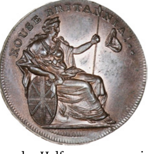
71 Middlesex, Thomas Spence, mule Halfpenny, man in prison/Britannia (DH 849). Good extremely fine, original colour £100-150