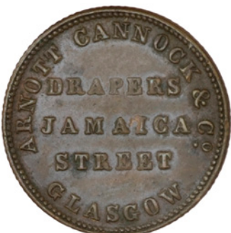
180 Lanarkshire, Glasgow, Arnott, Cannock & Co, Farthing (BWS 7280). About extremely fine