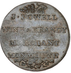
127 Monmouthshire, Monmouth, James Powell, Halfpenny, 1795 (DH 3). Very fine, patinated £30-40