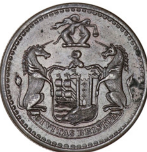
154 Somerset, Bristol, anonymous issue, Penny, 1811 (W 416). Some spotting, about extremely fine £40-50