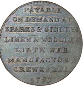
88 Somerset, Crewkerne, Sparks & Gidley, Halfpenny, 1797 (DH 105). Extremely fine, patinated £40-50