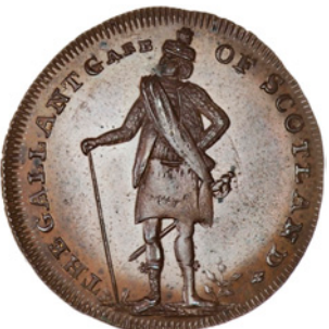
Middlesex, Thomas Spence, mule Halfpenny, United Token/highlander (DH 900). Extremely fine, attractive patina £100-150