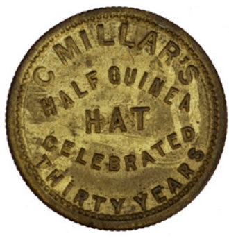
182 Lanarkshire, Glasgow, C. Millar, Farthing (BWS 7330). Extremely fine and very rare £80-100