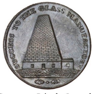
Somerset, Bristol, Lutwyche's mule Halfpenny, glass factory/legend (DH 98). Extremely fine, rare £60-80