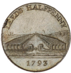
122 Yorkshire, Leeds, Henry Brownbill, Halfpenny, 1793 (DH 37). Obverse stained, otherwise extremely fine £20-30