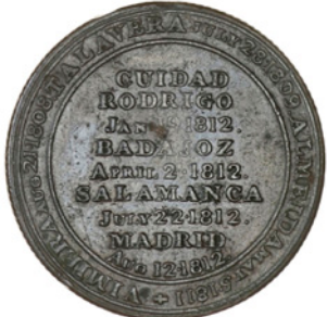
167 Picard's Wellington series, Halfpenny, 1812 (W 1538). About very fine £10-15