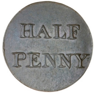
44 Middlesex, Newgate Street, Christ's Hospital, Halfpenny, 1800 (DH 278). Good very fine £25-35