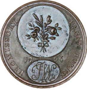
Warwickshire, Birmingham, Thomas Wyon, Penny, 1796 (DH 25). Extremely fine, a little original colour £50-70