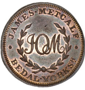
121 Yorkshire, Bedale, James Metcalf, Halfpenny, 1792 (DH 9c). Virtually as struck, much original colour £90-120