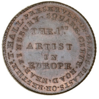
51 Middlesex, City Road, Thomas Hall, Halfpenny (DH 319c). Extremely fine, original colour but lightly lacquered £30-40