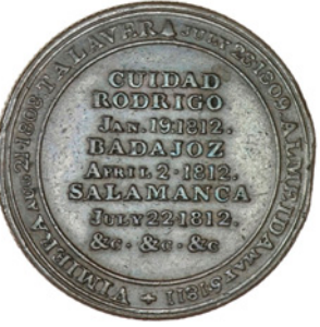
164 Picard's Wellington series, Halfpenny, 1812 (W 1520). Edge flaw, otherwise very fine, extremely rare £30-40