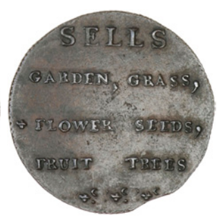
144 Lothian, Edinburgh, Joseph Archibald, Halfpenny, 1796 (DH 10). Very fine £20-30