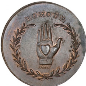
76 Middlesex, Thomas Spence, mule Halfpenny, Horne Tooke/heart and hand (DH 876). Stain on one edge, otherwise extremely fine, original colour £80-100