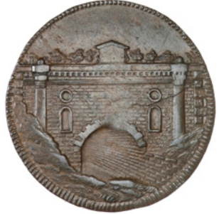
19 Gloucestershire, Brimscombe Port, Thames & Severn Canal Co, Halfpenny, 1795 (DH 59). About extremely fine £35-45