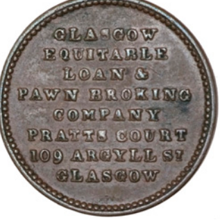
181 Lanarkshire, Glasgow, Equitable Loan & Pawnbroking Co, Farthing (BWS 7300). Very fine £20-30