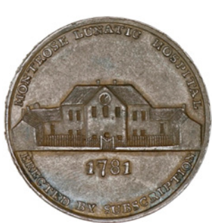
134 Angus, Montrose, James Bissett & Son, Halfpenny, 1799 (DH 33). Good very fine £40-60