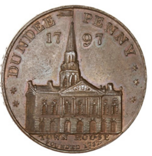
128 Angus, Dundee, Thomas Webster Jr, Penny, 1797 (DH 5). Extremely fine, original colour £80-100