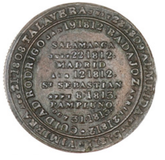
169 Picard's Wellington series, Halfpenny, 1812 (W 1560). Very fine, scarce £30-40