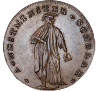
78 Middlesex, Thomas Spence, mule Halfpenny, turnstile/Westminster Scholar (DH 898). Extremely fine, brown patina £80-100