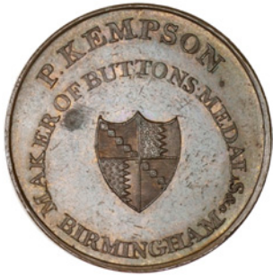
111 Warwickshire, Birmingham, Kempson's Halfpenny, Blue Coat Charity School (DH 197a). Spot on reverse, otherwise extremely fine £25-35