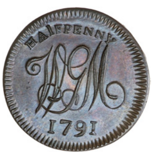
118 Wiltshire, Salisbury, Skidmore's mule Halfpenny (DH 12a). Virtually as struck, attractive glossy surfaces £90-120