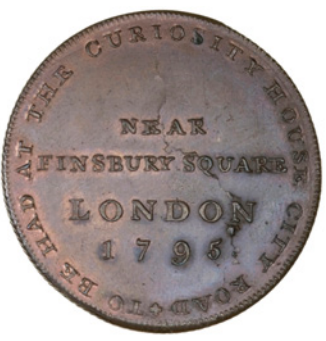
49 Middlesex, City Road, Thomas Hall, Halfpenny (DH 315). Good extremely fine, original colour £60-80