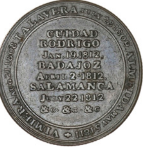
166 Picard's Wellington series, Halfpenny, 1812 (W 1526a). Good fine, very rare £15-25