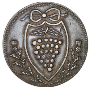
142 Lothian, Edinburgh, uncertain issuer, Halfpenny, 1796 (DH 1). Good very fine £25-35