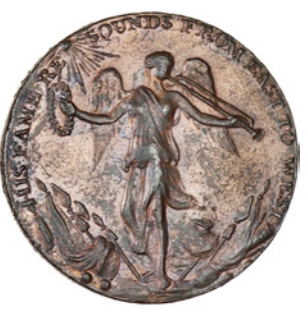
90 Suffolk, Bury St Edmunds, Philip Deck, Penny, 1794 (DH 4). Extremely fine, streaky original colour £40-50