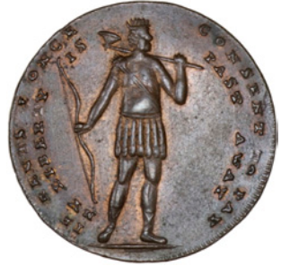
Halfpenny, Spence, legend/Indian (DH 711). Extremely fine, original colour £80-100