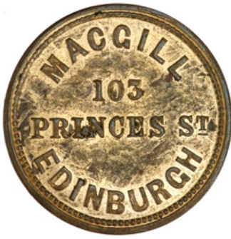
195 Midlothian, Edinburgh, MacGill, Farthing, edge plain (BWS 7180 variant). Extremely fine and very rare £80-100