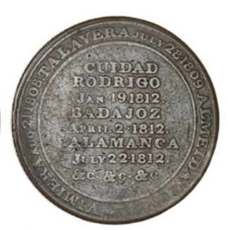
163 Picard's Wellington series, Halfpenny, 1812 (W 1515A). Fair to fine, extremely rare £20-30