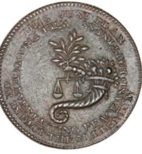
Middlesex, Thomas Spence, Halfpenny (DH 676). Extremely fine, a little original colour £40-60