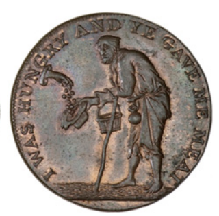
17 Gloucestershire, Badminton, Kempson's mule Halfpenny, plough/beggar (DH 39). Obverse off-centre, otherwise virtually as struck, original colour £50-70