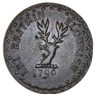
143 Lothian, Edinburgh, uncertain issuer, Halfpenny, 1796 (DH 3). About extremely fine £25-35