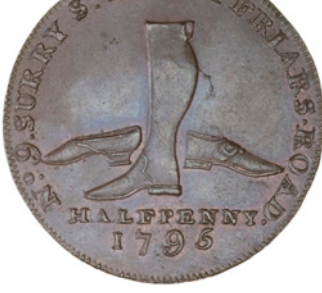
47 Middlesex, Blackfriars, Barnett Guest, Halfpenny, 1795 (DH 308). Good extremely fine £30-40