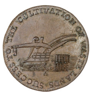
16 Gloucestershire, Badminton, Kempson's mule Halfpenny, George III/plough (DH 26). Extremely fine £50-70