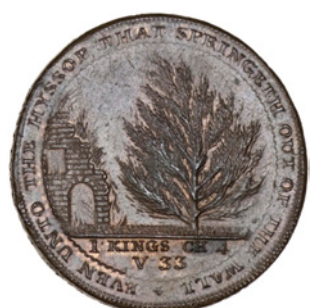
84 Somerset, Bath, John Jelly, Penny, 1794 (DH 5). Extremely fine, some original colour £75-100