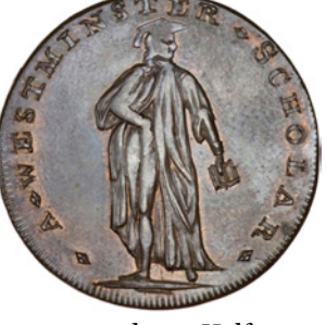
61 Middlesex, Thomas Halfpenny, Spence, mule legend/Westminster Scholar (DH 704). Weakly struck in centre, otherwise extremely fine, original colour £80-100