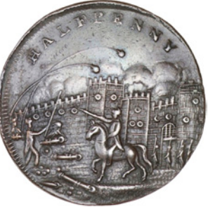
93 Sussex, Brighton, Skidmore's officer/Bastille (DH 6). Good very fine