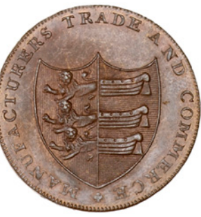
30 Kent, Sandwich, Thomas Bundock, Halfpenny (DH 39). Good extremely fine, much original colour £50-70