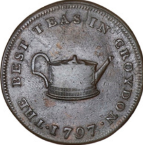
92 Surrey, Croydon, D. Garraway, Halfpenny, 1797 (DH 8). Good fine, scarce £30-40