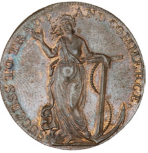
11 Essex, Chelmsford, Kempson's mule Halfpenny, 1794 (DH 7). Extremely fine, original colour £25-35