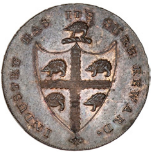
Warwickshire, Birmingham, Kempson's Halfpenny (DH 50). Extremely fine, original colour £35-45