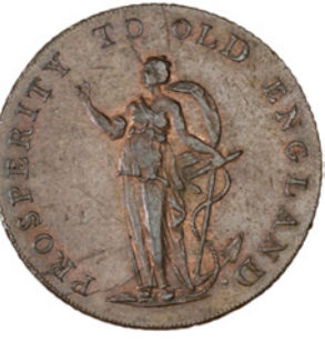
10 Essex, Chelmsford, Kempson's mule Halfpenny, 1794 (DH 6). Very fine £20-30