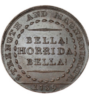
95 Warwickshire, Prize Fighting Ring, copper medal, 1789, Isaac Perrins (DH 13). Extremely fine, attractive patina £70-90