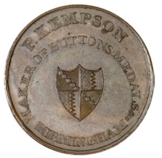
106 Warwickshire, Birmingham, Kempson's Halfpenny, Old Meeting Destroyed (DH 160). Extremely fine £30-40