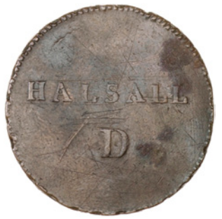
31 Lancashire, Halsall, Charles Mordaunt, Penny (DH 1). Some surface marks, otherwise good fine £35-45