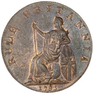
141 Lanarkshire, Glasgow, Lutwyche's mule Halfpenny, arms/Britannia (DH 6a). Extremely fine, original colour £40-50