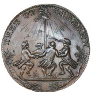
69 Middlesex, Thomas Spence, mule Halfpenny, Cain and Abel/tree of Liberty (DH 817). Extremely fine, patinated £90-120