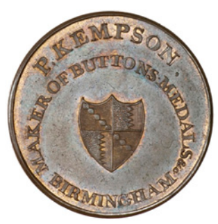
113 Warwickshire, Birmingham, Kempson's Halfpenny, bust of George III (DH 218). Extremely fine, original colour £30-40