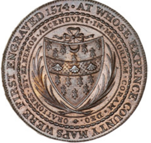
91 Suffolk, Woodbridge, Robert Loder, Penny, 1796 (DH 15). Virtually as struck, considerable original colour £140-180