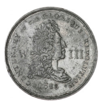
36 Middlesex, Centenary of the Revolution, 1788, medal by C. James in white metal (DH 186). Very fine, reverse better £30-40