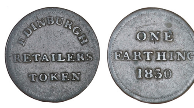
199 Midlothian, Edinburgh, Retailers' Farthing, 1830 (BWS 7250). Fine, rare £25-35