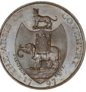
116 Warwickshire, Coventry, Kempson's Halfpenny, St Mary Hall (DH 295). Extremely fine, dark brown patina £30-40