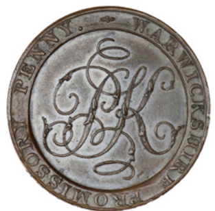
94 Warwickshire, Birmingham, Peter Kempson, Penny, 1796 (DH 6). Extremely fine, patinated £60-80