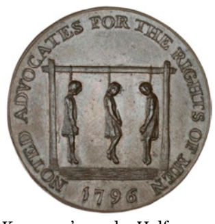
56 Middlesex, Newgate Street, Kempson's mule Halfpenny, attractively patinated, scarce