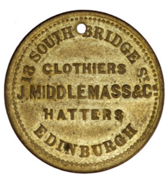
198 Midlothian, Edinburgh, J. Middlemass & Co, Farthing (BWS 7220). Extremely fine but pierced, rare £50-70