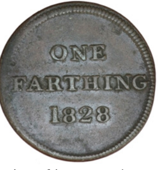
183 Lanarkshire, Glasgow, Retailers' Farthing, 1828 (BWS 7370). About very fine £10-15