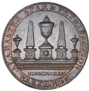
102 Warwickshire, Birmingham, James Bisset, Halfpenny (DH 120). Extremely fine, original colour £40-60