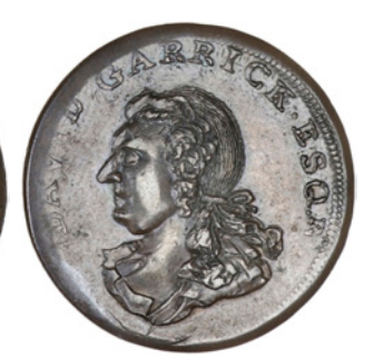
103 Warwickshire, Birmingham, William Hallan, Halfpenny, 1792, legend/bust of Garrick, edge plain (DH 130a). Very fine and extremely rare with this edge