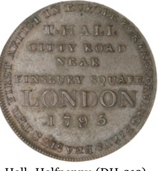
48 Middlesex, City Road, Thomas Hall, Halfpenny (DH 313). Extremely fine £45-60