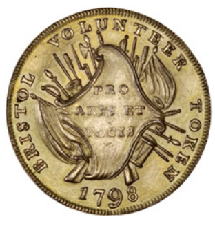
86 Somerset, Bristol, Lutwyche's mule Halfpenny, arms/antique shield (DH 92). Contemporary gilding, extremely fine, rare £150-200