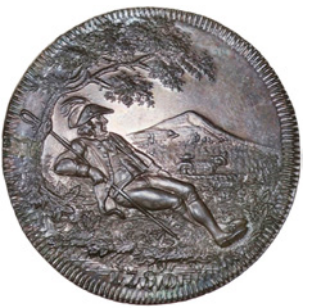
73 Middlesex, Thomas Spence, mule Halfpenny, man in prison/shepherd (DH 853). Mint state, glossy patina £120-150