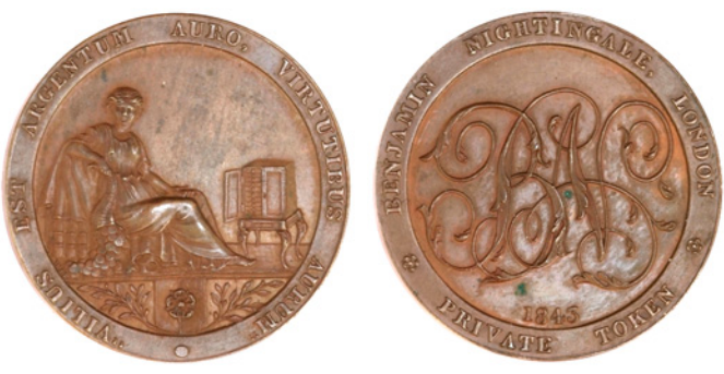
200 London, Benjamin Nightingale, private token, 1843 (Bell A3; D & W 345/49). Spot above date, otherwise virtually as struck £40-50