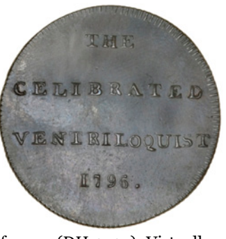
40 Middlesex, Joseph Askins, Halfpenny (DH 252a). Virtually as struck, attractive patina £200-250