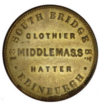
196 Midlothian, Edinburgh, Middlemass, Farthing (BWS 7200). Minor spotting, otherwise virtually as struck £35-45