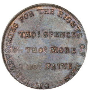
119 Worcestershire, Dudley, Spence's mule Halfpenny, castle/legend (DH 9). Extremely fine £60-80