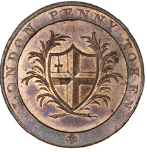
33 Middlesex, Kempson's Buildings, Penny, St Paul's Covent Garden (DH 52). Virtually as struck, much original colour £50-70