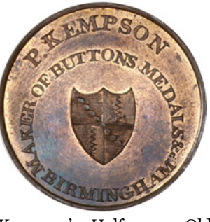
110 Warwickshire, Birmingham, Kempson's Halfpenny, Old Cross (DH 188). Virtually as struck, full original colour £40-60