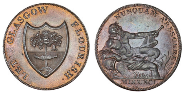
140 Lanarkshire, Glasgow, Gilbert Shearer & Co, Halfpenny, 1791 (DH 2). Good extremely fine, original colour £30-40