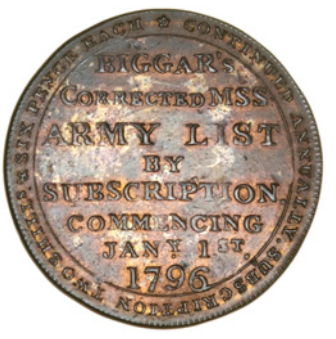
42 Middlesex, Spring Gardens, Charles Biggar, Halfpenny, 1796 (DH 256). Extremely fine, original colour £40-50