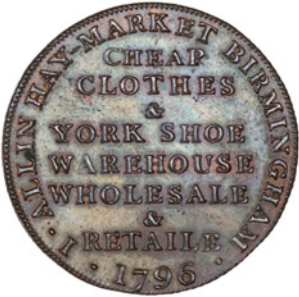
100 Warwickshire, Birmingham, John Allin, Halfpenny, 1796 (DH 62). Extremely fine, original colour £40-50