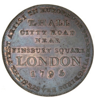
50 Middlesex, City Road, Thomas Hall, Halfpenny (DH 316). Extremely fine, original colour £60-80