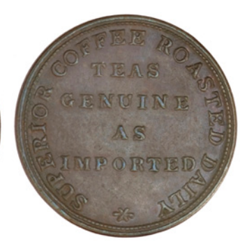
174 Aberdeenshire, Aberdeen, Angus Fraser, Farthing (BWS 6960). Extremely fine and very rare £50-70