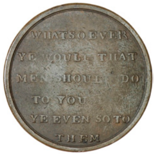
38 Middlesex, Anti-Slavery Society, copper medal (cf. DH 235 bis II, different reverse die). Obverse fine, reverse fair