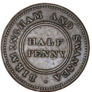
158 Warwickshire, Birmingham, Rose Copper Co, Halfpenny, 1811 (W 272). Good very fine £25-35