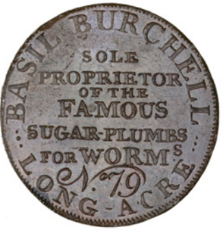
43 Middlesex, Long Acre, Basil Burchell, Halfpenny (DH 274). Extremely fine, lightly lacquered £25-35