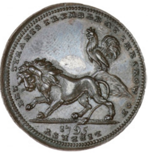
120 Worcestershire, Dudley, Spence's mule Halfpenny, castle/lion and cock (DH 16a). Extremely fine, rare