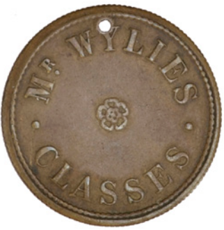
192 Lanarkshire, Glasgow, James Wylie, Farthing, 1869 (BWS 7485). Very fine but pierced, very rare £50-70