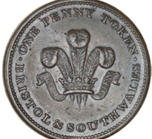
155 Somerset, Bristol, Bristol & South Wales, Penny, 1811 (W 542). About extremely fine £40-50