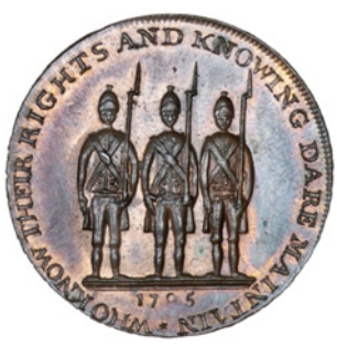
72 Middlesex, Thomas Spence, mule Halfpenny, man in prison/three citizens (DH 851). Good extremely fine, much original colour £120-150