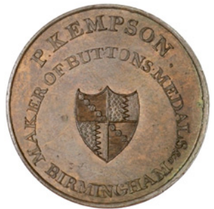
105 Warwickshire, Birmingham, Kempson's Halfpenny, St Martin's Church (DH 154). Extremely fine £30-40