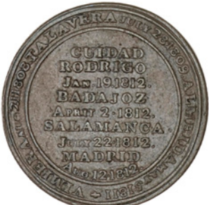
168 Picard's Wellington series, Halfpenny, 1812 (W 1545). About very fine, very rare