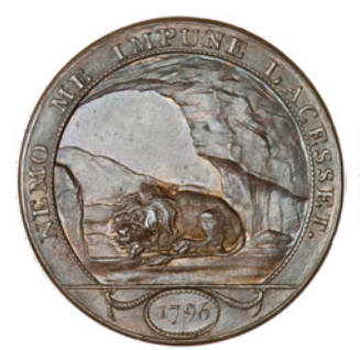
96 Warwickshire, Birmingham, Peter Kempson, Penny, 1796 (DH 20). Extremely fine £80-100