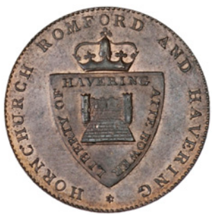
13 Essex, Hornchurch, George Cotton, Halfpenny (DH 33). Extremely fine, much original colour £40-60