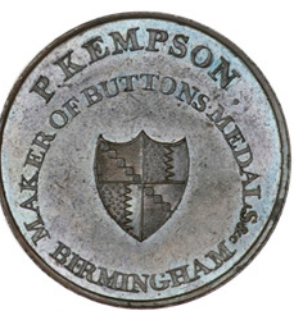
107 Warwickshire, Birmingham, Kempson's Halfpenny, Old Meeting Rebuilt (DH 162). Scratch on obverse, otherwise extremely fine £25-35