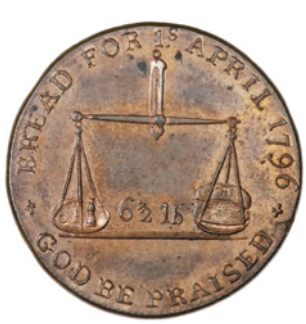
18 Gloucestershire, Badminton, Kempson's mule Halfpenny, plough/scales (DH 43). Virtually as struck, original colour £50-70