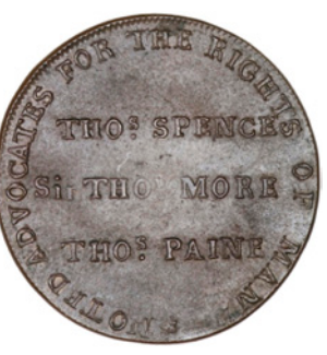
70 Middlesex, Thomas Spence, mule Halfpenny, pig/legend (DH 842b). Extremely fine £40-60