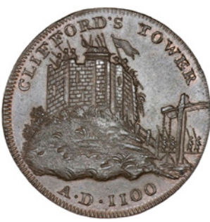
124 Yorkshire, York, uncertain issuer, Halfpenny, 1795 (DH 63). Extremely fine, original colour £30-40