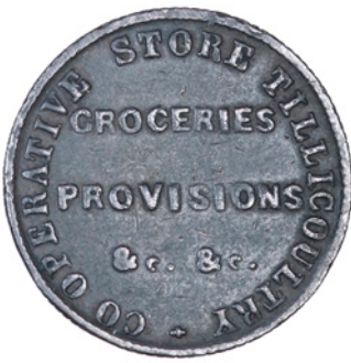
179 Clackmannanshire, Tillicoultry, Co-op Store, Farthing, edge grained (BWS 7540 variant). Very fine, very rare £40-60