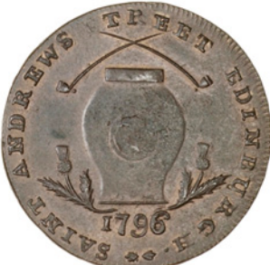
145 Lothian, Edinburgh, E. Campbell, Halfpenny, 1796 (DH 15a). Punchmark on face of Turk, otherwise about extremely fine, original colour, rare £70-90