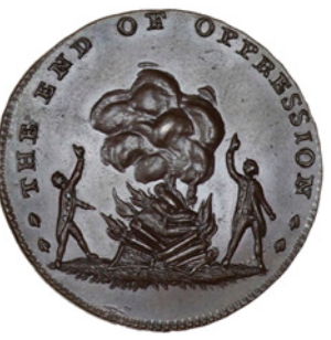
68 Middlesex, Thomas Spence, mule Halfpenny, Cain and Abel/bonfire (DH 814). Virtually as struck, attractively patinated £100-150