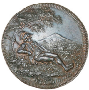
65 Middlesex, Thomas Spence, mule Halfpenny, sailor and landsman/shepherd (DH 737). Obverse spotted, otherwise extremely fine £90-120