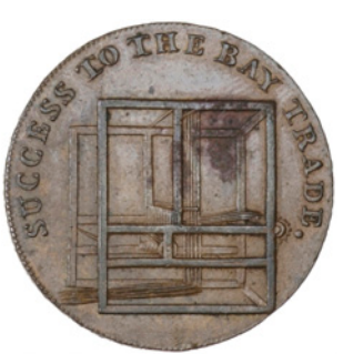
12 Essex, Colchester, Charles Heath, Halfpenny, 1794 (DH 10). About extremely fine, reverse stained £20-30