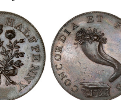
138 Inverness-shire, Inverness, Mackintosh, Inglis & Wilson, Halfpenny, 1793 (DH 1b). Extremely fine, uneven patina £40-50