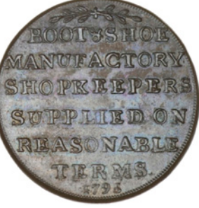
52 Middlesex, Snow Hill, Thomas Hatfield, Halfpenny, 1795 £20-30 (DH 323). Extremely fine, patinated