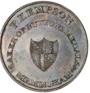
108 Warwickshire, Birmingham, Kempson's Halfpenny, New Meeting Burnt (DH 165). About extremely fine £25-35