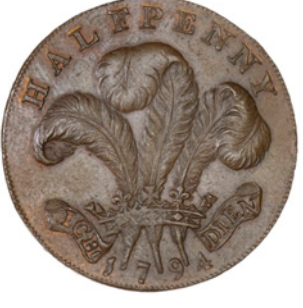
14 Essex, Warley, Camp Halfpenny, 1794 (DH 36). Extremely fine, original colour £30-40