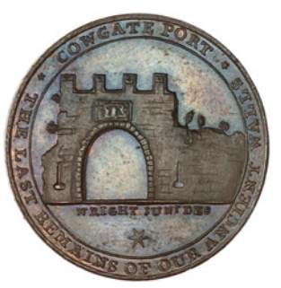
132 Angus, Dundee, Alexander Swap, Halfpenny, 1797 (DH 21). Extremely fine £50-70