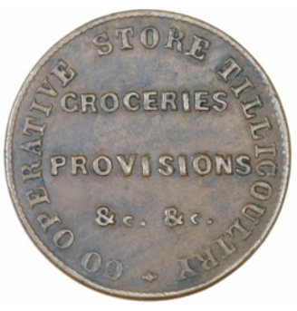
178 Clackmannanshire, Tillicoultry, Co-op Store, Farthing, edge plain (BWS 7540). Very fine, scarce £30-40