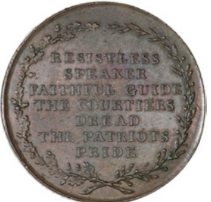
37 Middlesex, Charles Fox, medal by W. Lutwyche in copper (DH 223). Extremely fine £40-50