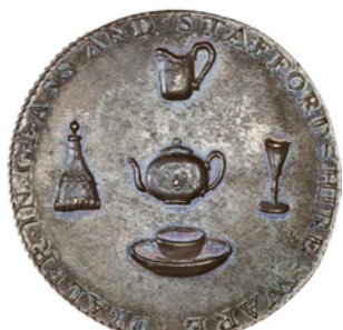
104 Warwickshire, Birmingham, William Hallan, Halfpenny, 1793 (DH 131). Good extremely fine, attractive patina, scarce £150-200