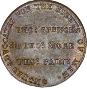
58 Middlesex, Thomas Spence, mule Halfpenny, head/legend (DH 677). Carbon specks behind head, otherwise extremely £80-100 fine or better