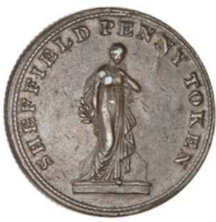
161 Yorkshire, Sheffield, Overseers, Penny, 1812 (W 982). Good very fine £40-50