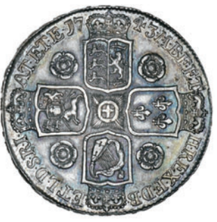
1964 Crown, 1743, roses, edge DECIMO SEPTIMO (ESC 124; S 3688). A couple of reverse edge knocks, otherwise nearly extremely fine, toned £1,000-1,200