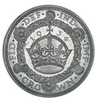
2069 Crown, 1934 (ESC 374; S 4036). Graze on cheek and in reverse field, otherwise better than extremely fine, toned £3,000-3,500