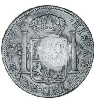
RENFREWSHIRE, Hurlet, a Mexico, Charles IIII, 8 Réales, 1795 Mexico City, obv. countermarked J·& J·w. Hurlet · around 5/., privy mark of triangle of punched dots at right, 26.66g/12h (Manville 64a, and p.125, this coin listed). Coin good fine but with light graffiti in obverse field, countermark very fine, toned; seven specimens known

Provenance: H.D. Gibbs Collection, Hans Schulman Auction (New York), 19 November 1960, lot 293A; D.W. Grey Auction (London), 31 March 1971, lot 48; H.D. Rauch Auction (Vienna), 2-4 November 1972, lot 2264.