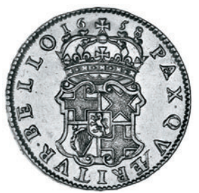
2126 Halfcrown, 1658 (ESC 447; S 3227A). Has been cleaned and some surface marks, otherwise better than very fine £1,500-2,000