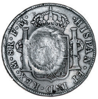
1944 CO KILKENNY, Castlecomer, a Mexico, Charles IIII, 8 Réales, 1796FM, Mexico City, obv. countermarked PAYABLE AT CASTLE COMER COLLIERY around 5s 5d, 26.54g/12h (Manville 108, and p.221, this coin listed; Seaby, BNJ 1965, pl.xv, 3, this coin). Coin fine but flan slightly bent, countermark very fine £4,000-5,000

Provenance: R.F. Peltzer Collection, Glendining Auction, 20-4 June 1927, lot 237; D.S. Napier Collection, Glendining Auction, 30 May 1956, lot 299; SCMB November 1957 (7356); Glendining Auction, 14 December 1967, lot 249; bt Baldwin 1987.