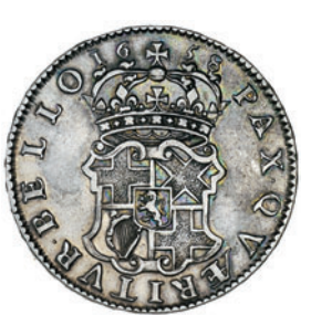
1952 Halfcrown, 1658 (ESC 447; S 3227A). Nearly very fine £1,500-1,800