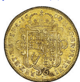
1880 Two Guineas, 1694/3, elephant and castle (MCE 147; S 3425). Very fine £2,000-2,500