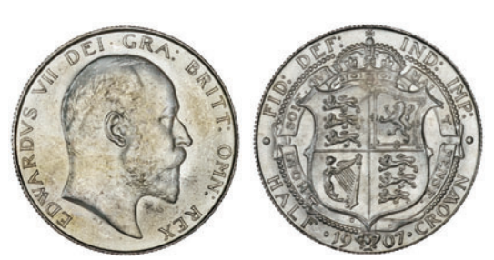
2047 Halfcrown, 1907 (ESC 752; S 3980). Minimal bagmarks, otherwise as struck £350-450