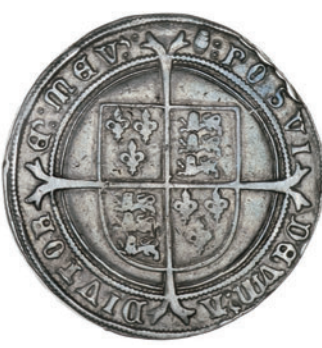
1945 Third period, Fine issue, Crown, 1552, mm. tun, 31.09g/11h (Lingford dies Z-13; N 1933; S 2478). Reverse edge flaws, otherwise nearly very fine, attractively toned, scarce £1,800-2,200