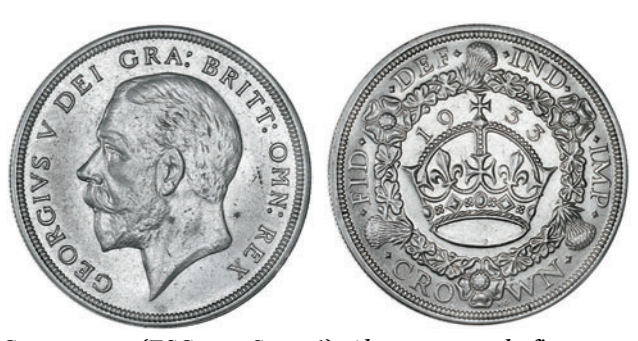
2065 Crown, 1933 (ESC 373; S 4036). About extremely fine £250-300