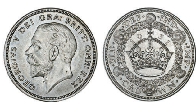
2061 Crown, 1931 (ESC 371; S 4036). Nearly extremely fine £150-200