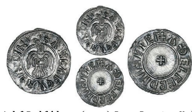
2074 Anlaf Guthfrithsson (939-41), Penny, Raven type, York, Æthelferth, raven standing with wings outstretched and head turned to left, +anlaf cvnvncin, rev. +adelferd minetrl around cross, 1.17g/7h (N 537; S 1019). Full and round, nearly extremely fine, very rare £8,000-10,000

In the early tenth century, Danish influence in the north of England declined and for the next forty years the territory was fought over by the English and the Norse Vikings of Dublin. The city of York changed hands several times. Soon after the death of Æthelstan in October 939, it was occupied by the Norse prince Anlaf Guthfrithsson whose rule briefly extended from Northumbria to the East Midlands. The Vikings were finally expelled from York by Eadred in 954.