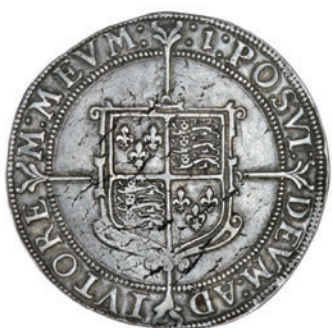
1947 Seventh issue, Crown, mm. 1, sceptre points to 1 of REGINA, 29.80g/6h (FRC C-4 [Sale, lot 10]; N 2012; S 2582). Some surface flan cracks, otherwise about very fine