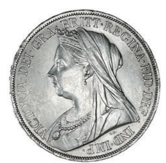
2013 Crowns (2), 1897 edge LX, 1900 edge LXIII (ESC 312, 318; S 3937) [2]. Extremely fine or better £200-250