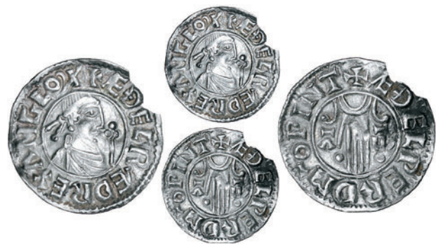
2075 Penny, Second Hand type, Winchester, Æthelweard, ÆDELWERD MO PINT, 1.38g/9ĥ (SCBI Norweb 176, same dies; BMC -; BEH -; N 768; S 1146). A little crimped and the edge slightly chipped, otherwise better than very fine, the moneyer rare £200-250