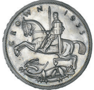
2070 Proof Crown, 1935, edge xxv, 28.39g/12h (ESC 378; S 4050). Practically as struck, lightly toned £300-350