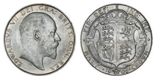
2045 Halfcrown, 1906 (ESC 751; S 3980). Practically as struck £300-400