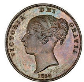
Slabbed in CGS-UK holder (as ESC 1376), graded UNC 88