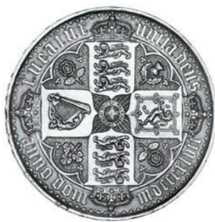
2006 Crown, 1847, edge UNDECIMO (ESC 288; S 3883). A couple of slight edge nicks, otherwise about extremely fine