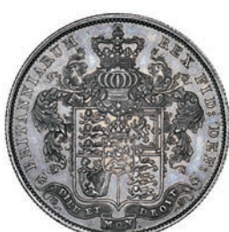
1991 Halfcrown, 1825 (ESC 642; S 3809). Extremely fine, reverse better £200-250