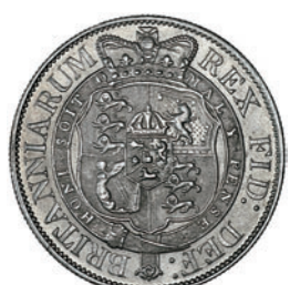
1980 Halfcrown, 1818 (ESC 621; S 3789). A few surface marks, otherwise nearly extremely fine £150-200