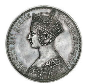
Provenance: Bt September 1979