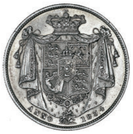
2001 Halfcrown, 1834, ww in script (ESC 662; S 3834). Sometime cleaned, otherwise nearly extremely fine £150-200