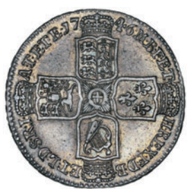
1969 Halfcrown, 1746 LIMA, edge DECIMO NONO (ESC 606; S 3695A). Very fine or better, toned £90-120