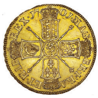
1883 Five Guineas, 1701, second bust, edge DECIMO TERTIO (MCE 172; S 3456). Marks on face, otherwise better than very fine £4,000-5,000