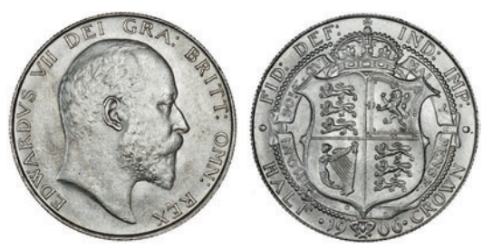
2046 Halfcrown, 1906 (ESC 751; S 3980). Light cut on cheek, otherwise practically as struck £300-350