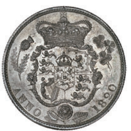
1987 Halfcrown, 1820 (ESC 628; S 3807). Practically as struck, pleasantly toned £300-350