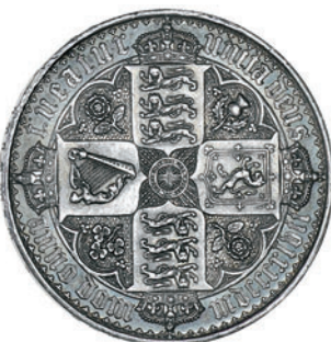
2007 Crown, 1847, edge UNDECIMO (ESC 288; S 3883). Edge nicks, otherwise good very fine, reverse better £800-1,000

2008 Crowns (2), both 1887 (ESC 296; S 3921) [2]. Both practically as struck, attractively toned £200-250