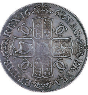
2128 Crown, 1662, first bust, rose below, edge undated (ESC 15; S 3350). Slightly weak in centres, otherwise good very fine, attractive tone £1,200-1,500