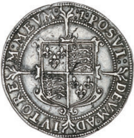
1948 Seventh issue, Halfcrown, mm. 1, 14.78g/9h (N 2013; S 2583). A few surface cracks, otherwise about very fine, reverse better £1,500-2,000