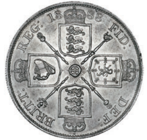
2019 Double Florin, 1888, inverted 1 for 1 in VICTORIA (ESC 397A; S 3923). Nearly extremely fine £120-150