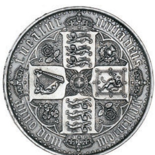
2005 Crown, 1847, edge UNDECIMO (ESC 288; S 3883). Nearly extremely fine £1,000-1,200