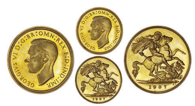
2288 Proof Half-Sovereign, 1937 (WR 442; S 4077). A few marks and hairlines, otherwise brilliant £200-250

2295 Proof set, 2002, comprising gold Two Pounds, Sovereign and Half-Sovereign [3]. Brilliant; in green leatherette case of issue £550-650