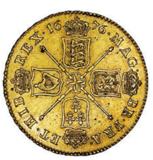
1872 Five Guineas, 1676, first bust, elephant and castle, edge VICESIMO OCTAVO (MCE 14; S 3330). Edge bruises, otherwise better than very fine £4,000-5,000