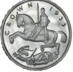
2071 Proof Crown, 1935, edge xxv, 28.39g/12h (ESC 378; S 4050). Practically as struck £300-350