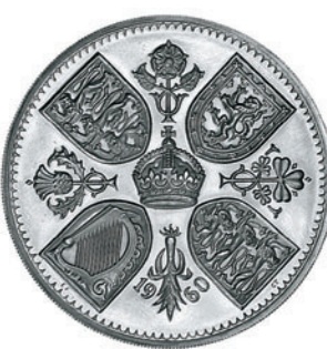
2294 Proof Crown, 1960, so-called VIP issue, edge grained, 27.93g/12h (ESC 393M; S 4143). Light hairlines and some peripheral toning on obverse, otherwise brilliant and practically as struck, rare; in red Royal Mint case of issue £300-400