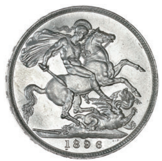
2012 Crown, 1896, edge LX (ESC 311; S 3937). Practically as struck £200-250