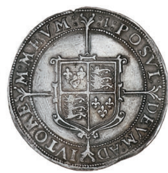
1946 Seventh issue, Crown, mm. 1, sceptre points to G of REGINA, 29.80g/11h (FRC B-3 [Sale, lot 5]; N 2012; S 2582). Lightly tooled in fields, otherwise very fine, reverse better £2,500-3,000