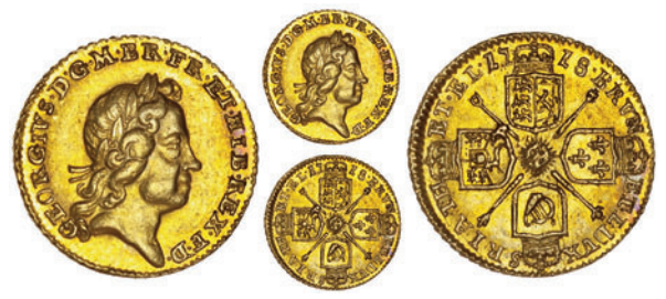
2140 Quarter-Guinea, 1718 (MCE 277; S 3638). About extremely £300-400