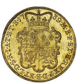
1893 Two Guineas, 1739, intermediate head (SCBI Schneider 567, dies 7/7; MCE 293; S 3668). Marks on face, otherwise nearly extremely fine £1,200-1,500