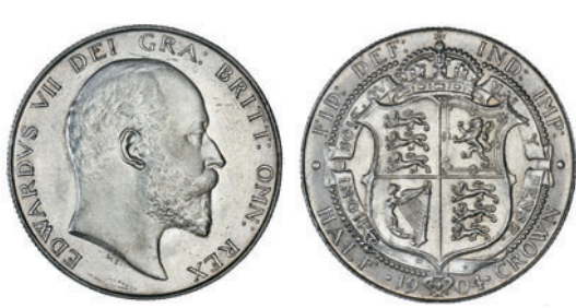
2044 Halfcrown, 1904 (ESC 749; S 3980). Some minimal surface marks, otherwise better than extremely fine, very rare £1,200-1,500