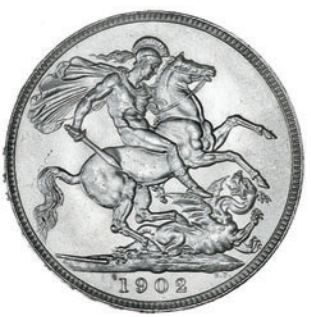
2041 Crown, 1902, edge II (ESC 361; S 3978). About as struck £150-200