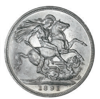
2010 Crown, 1891 (ESC 301; S 3921). Practically as struck £150-200