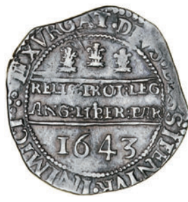
2118 Oxford mint, Halfcrown, 1643, mm. Oxford plume on obv. only, 14.70g/9h (cf. Bull 599, but rev. die not in Bull; Morr. A-3; SCBI Brooker 883ff; N 2413; S 2954). Good fine, reverse better £450-550