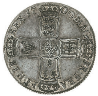
2134 Crown, 1700, edge DVODECIMO (ESC 97; S 3474). A little light haymarking on obverse, otherwise good extremely fine with attractive blue tone £600-800