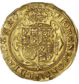
2109 Tower mint, Unite, Gp A, mm. lis, class II, 9.09g/2h (cf. SCBI Schneider 114-15; cf. SCBI Brooker 22-3; N 2146; S 2685). Good very fine £2,000-2,500

Provenance: Christie's Auction, 8 March 1960, lot 147; R.D. Beresford-Jones Collection, Spink Auction 29, 2 June 1983, lot 102