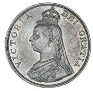
2018 Double Florins (4), 1888, 1889 (3) (ESC 397, 398; S 3923) [4]. All extremely fine or better £150-200