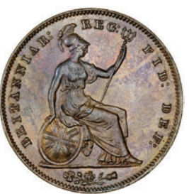
2250 Penny, 1856, close colon (BMC 1510; S 3948). Good extremely fine with traces of original colour and some light toning, rare £800-1,000