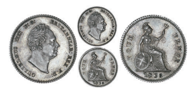
2003 Proof Britannia Groat, 1836, edge grained, 1.87g/12h (ESC 1919; S 3837). Small scratch above King's head, otherwise good extremely fine and toned, rare £350-400