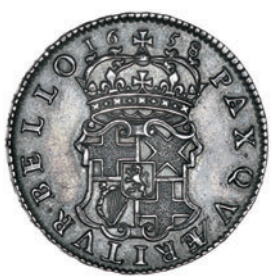
1950 Halfcrown, 1658 (ESC 447; S 3227A). About extremely fine, toned £2,500-3,000