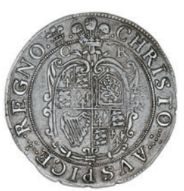
2112 Tower mint, Shilling, Gp C, mm. plume, 5.75g/4h (Sharp C2/4; SCBI Brooker 455, same dies; N 2222; S 2788). A fine work striking from carefully engraved dies with guide lines within both inner and outer beaded circles, well-centred on an almost round flan, about very fine and toned, very rare £800-1,000