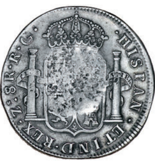
1941 RENFREWSHIRE, Greenock, a Mexico, Ferdinand VII, 8 Réales, 1821rg, Zacatecas, obv. countermarked J·MCK. & Son GREENOCK around 4/6, 26.85g/12h (Manville 58, and p.114, this coin listed). Coin and countermark good fine