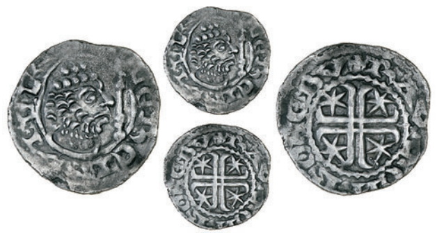
2326 William the Lion, Short Cross and Stars coinage, Phase A, Sterling, Roxburgh, Raul, RAVL ON ROCEBY, bust right, 1.28g/9h (SCBI 35, 54; B 3a, fig. 42A; S 5028). The legends a little flat, otherwise about very fine with a strong portrait, very rare £400-500

Very few coins seem to have been struck between the death of David I in 1153 and the introduction of the crescent and pellet coinage around 1180. It is possible that some posthumous coins in the name of David were struck at this time but named coins of Malcolm IV and William the Lion's first type are excessively rare. Burns records three specimens of William's first type in 1887 (B. fig 25b-c-d) and by 1967 a fourth is mentioned by Stewart. From then until the present no further examples seem to have been published. It is interesting to note that R.C. Lockett had no specimen in his extensive collection although he owned no less than 23 sterlings of David I