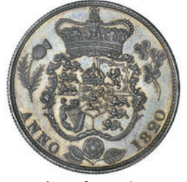
1988 Halfcrown, 1820 (ESC 628; S 3807). A few minor surface marks, otherwise practically as struck £300-350