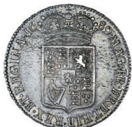
1956 Halfcrown, 1689, second shield, caul only frosted, pearls, edge PRIMO (ESC 510; S 3435). A little light haymarking, otherwise good very fine or better £500-600