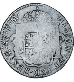
1938 LANARKSHIRE, New Lanark, a Mexico, Charles IIII, 8 Réales, 1791fm, Mexico City, obv. countermarked payable at Lanark mills around 5/, 26.27g/12h (Manville 69, and p.146, this coin listed). Coin fair, countermark good fine