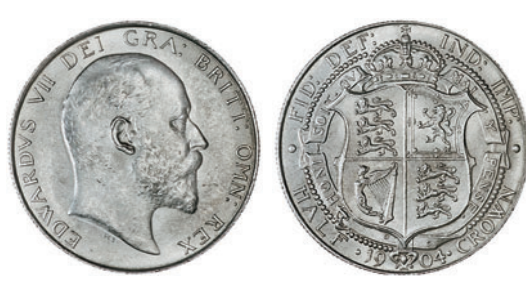
2043 Halfcrown, 1904 (ESC 749; S 3980). A few small surface marks, otherwise better than extremely fine, very rare £1,200-1,500