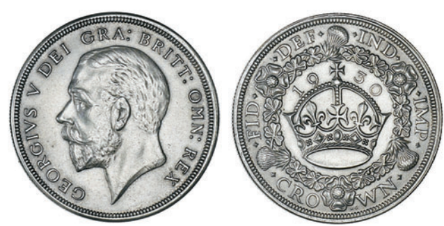
2059 Crown, 1930 (ESC 370; S 4036). A few minor surface marks, otherwise good very fine or better £150-200