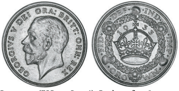
2066 Crown, 1933 (ESC 373; S 4036). Good very fine £200-250