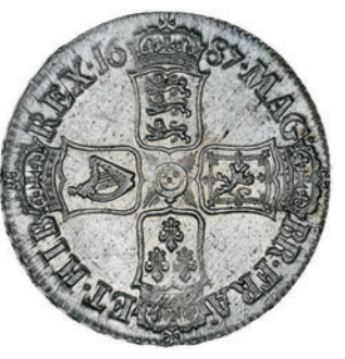
2132 Crown, 1687, second bust, edge TERTIO (ESC 78; S 3407). Slight surface marks, otherwise extremely fine, toned £1,000-1,200