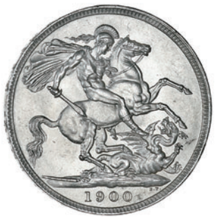
2014 Crown, 1900, edge LXIV (ESC 319; S 3937). A few light surface marks, otherwise nearly as struck £250-300

2015 Double-Florins (3), all 1887, Roman (2) and Arabic numerals (ESC 394-5; S 3922-3) [3]. Extremely fine or £120-150