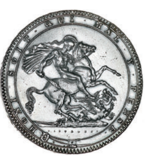
1976 Crown, 1819, edge LIX (ESC 215; S 3787). Small flaw in the reverse milling and perhaps sometime cleaned, otherwise nearly extremely fine £120-150