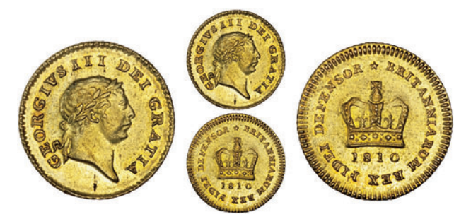
2165 Third-Guinea, 1810, second bust (MCE 460; S 3740). G Scuffed, otherwise better than extremely fine