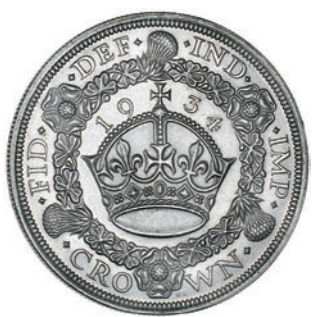
2068 Crown, 1934 (ESC 374; S 4036). Better than extremely fine £3,000-3,500