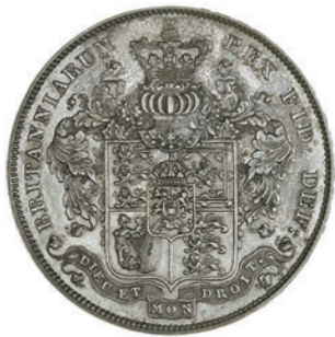
2204 Proof Crown, 1826, edge SEPTIMO, 28.27g/6h (L & S 28; ESC 257; S 3806). About extremely fine £3,000-3,500