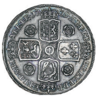
1963 Crown, 1739, roses, edge DVODECIMO (ESC 122; S 3687). A few edge nicks, otherwise about very fine, reverse better £700-900