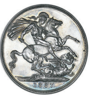
2009 Proof Crown, 1887 (ESC 297; S 3921). Mark in obverse field and rather hairlined, otherwise better than extremely fine £300-400