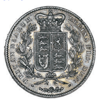
2004 Crown, 1845, edge viii, cinquefoil stops (ESC 282; S 3882). Extremely fine or better, lightly toned £700-900