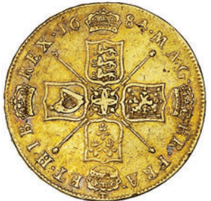
1873 Five Guineas, 1684, second bust, elephant and castle, edge TRICESIMO SEXTO (MCE 30; S 3332). Nearly very fine £3,000-4,000