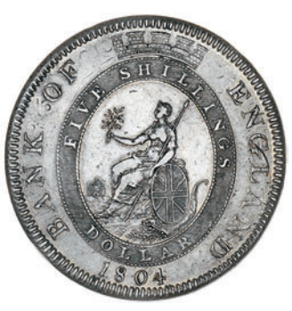
1972 Dollar, 1804, types A/2 (ESC 144; S 3768). Traces of undertype [Charles IIII, 1798] visible on both sides, good very fine £200-250