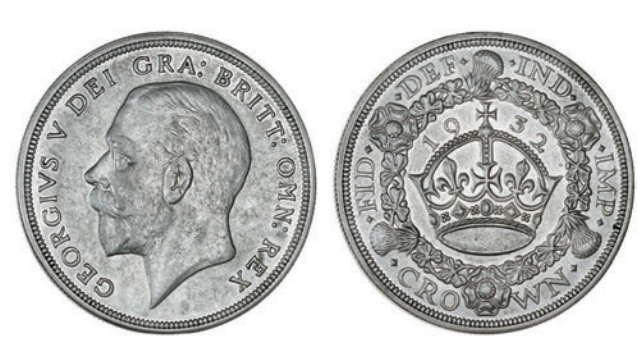
2063 Crown, 1932 (ESC 372; S 4036). Surfaces dull, otherwise nearly extremely fine, scarce £300-350