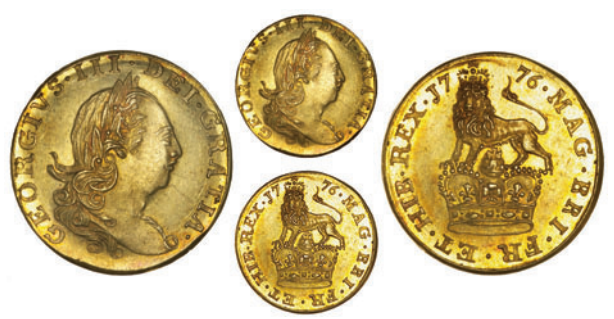
1913 Pattern Third-Guinea, 1776, by R. Yeo, in gold, laureate bust right, rev. lion left astride crown, edge plain, 2.82g/12h (WR 137; Selig 1154). Brilliant, rare £1,200-1,500