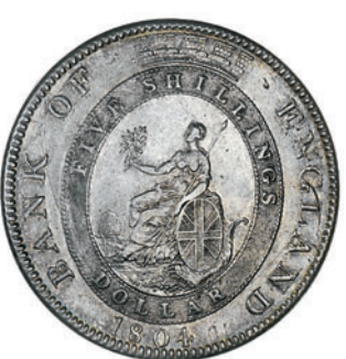
1973 Dollar, 1804, types C/2 (ESC 144; S 3768). Faint trace of undertype visible, very fine