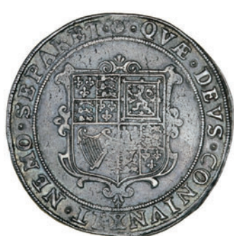
2106 Second coinage, Crown, mm. rose, 30.06g/6h (FRC dies V/IX [Sale, lot 24]; N 2097; S 2652). Light scratch in centre of shield, otherwise better than very fine on a full, round flan, even grey cabinet toning £2,000-2,500 Provenance: Bt Spink