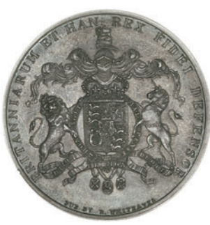
2202 Pattern Crown, 1820, by G. Mills for R. Whiteaves, in silver, large bare head left, date below, rev. crowned arms in Garter, with supporters, national emblems on ribbons below, edge plain, 35.90g/12h (L & S 7; ESC 259). Light wear on high points and a small edge nick on reverse at 8 o'clock, otherwise practically as struck with grey tone, £4,000-5,000 very rare