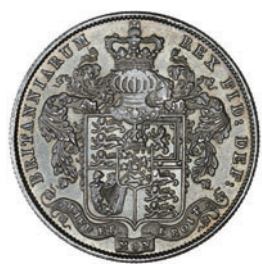
1992 Halfcrown, 1826 (ESC 646; S 3809). About extremely fine, reverse better, toned £200-250