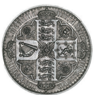
2241 Proof Crown, 1847, edge plain, 27.56g/12h (ESC 291; S 3883). Nearly extremely fine, dark tone, rare