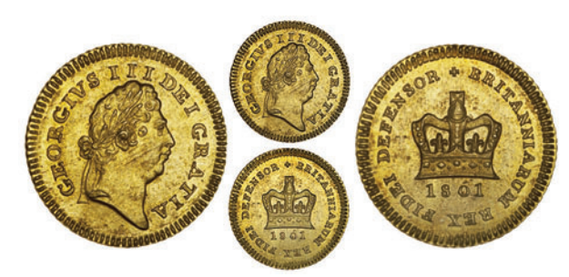
1915 Third-Guinea, 1801, first bust (MCE 453; S 3739). About G extremely fine £150-200