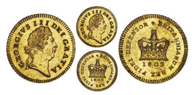
1917 Third-Guinea, 1803, first bust (MCE 455; S 3739). G Extremely fine or better £200-250