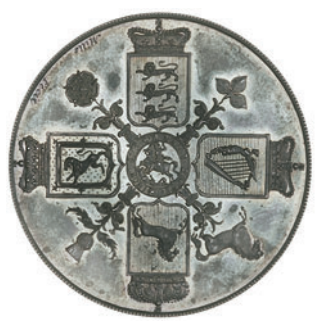
2184 Pattern Crown, undated [1820], by G. Mills and T. Webb for J. Mudie, in silver, laureate bust right, rev. cruciform shields, lesser George in centre, national emblems in angles, edge plain, 27.90g/12h (L & S 214; ESC 221; Selig 1210). Tiny cut on King's cheek, otherwise good extremely fine, reverse better, beautifully toned, rare £1,200-1,500