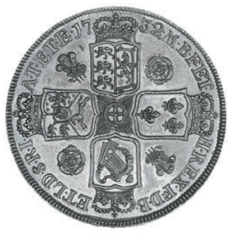
2145 Proof Crown, 1732, roses and plumes, edge plain, 29.91g/6h (L & S 6; ESC 118; S 3686). Very lightly rubbed on King's lower jaw, otherwise brilliant and practically as struck, toned, very rare £4,000-5,000