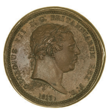
2180 Pattern Crown, 1817, by W. Wyon, a uniface trial for the 'Three Graces' type in copper, laureate bust right, 35.46g (L & S 156; cf. ESC 225; Selig -). Struck from a somewhat rusty die, extremely fine, extremely rare £1,200-1,500