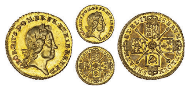
2139 Quarter-Guinea, 1718 (MCE 277; S 3638). About extremely £300-400