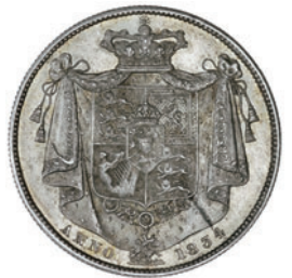
2000 Halfcrown, 1834, ww in block (ESC 660; S 3834A). Practically as struck with light patchy toning, rare £500-600