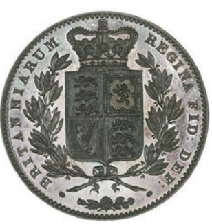
2240 Proof Crown, 1839, edge plain, 28.23g/6h (ESC 279; S 3882). Some marks in obverse field, otherwise good extremely fine, dark tone £2,500-3,000