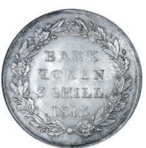
2172 Three Shillings, 1813 (ESC 421; S 3770). About as struck £150-200