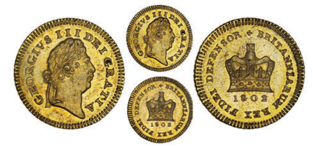
1916 Third-Guinea, 1802, first bust (MCE 454; S 3739). G Extremely fine £200-250