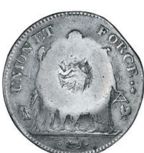
1931 LANARKSHIRE, Dalzell, a France, Directoire, 5 Francs, AN 6a [1797/8], rev. countermarked payable at dalzell farm. 24.51g/6h (Manville 20, this coin listed). Coin fair to fine but edge partly smoothed and knocked, countermark about very fine