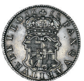
1951 Halfcrown, 1658 (ESC 447; S 3227A). Good very fine £2,000-2,500