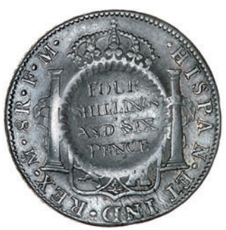
1929 LANCASHIRE, Cark-in-Cartmel, a Mexico, Charles III, 8 Réales, 1785fm, Mexico City, obv. countermarked CARK COTTON WORKS 1787, rev. countermarked four shillings and six PENCE, 26.79g/12h (Manville 101, and p.202, this coin listed). Coin about very fine and toned, countermarks better £1,500-2,000

Provenance: Glendining Auction, 13 April 1988, lot 188.