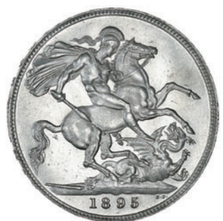
2011 Crown, 1895, edge LIX (ESC 309; S 3937). Practically as £200-250