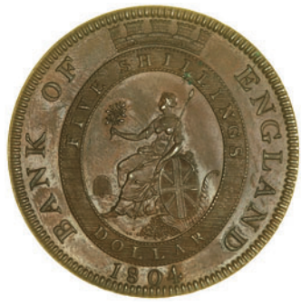
2171 Proof Dollar, 1804, in copper, types E/2, on a thick flan, plain edge, 37.42g/6h (L & S 79; ESC 167; Selig 1240). Small mark in front of King's face, otherwise practically as struck, very rare £800-1,000