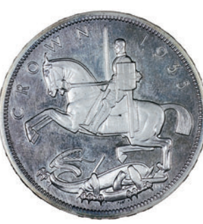
2277 Proof Crown, 1935, edge xxv, 28.51g/12h (ESC 378; S 4050). Practically as struck, toned £300-350