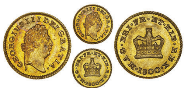
1914 Third-Guinea, 1800, first bust (MCE 452; S 3738). Extremely fine or better £200-250