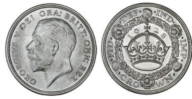
2058 Crown, 1928 (ESC 368; S 4036). Extremely fine or better £200-250