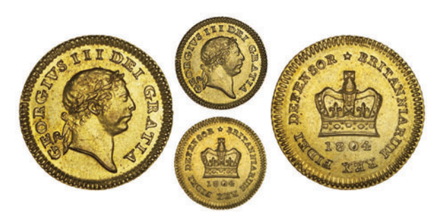
1918 Third-Guinea, 1804, second bust (MCE 456; S 3740). G Extremely fine £200-250