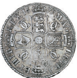
2129 Halfcrown, 1677, fourth bust, edge vicesimo nono (ESC 479; S 3367). Scored by date, otherwise very fine £250-300