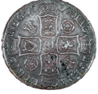
2138 Crown, 1707, roses and plumes, edge SEXTO (ESC 102; S 3578). A few minor marks on obverse, particularly below chin, otherwise good very fine, reverse better £800-1,000 Provenance: An Old English Collection, DNW Auction 86, 16-17 June 2010, lot 741