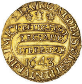
2117 Oxford mint, Unite, 1643, mm. plume with bands on obv. only, 9.04g/8h (Beresford-Jones VIII/12; SCBI Brooker 851, same dies; SCBI Schneider 317, same dies; N 2387; S 2732). Some obverse flan flaws, otherwise about extremely fine, reverse better £8,000-10,000