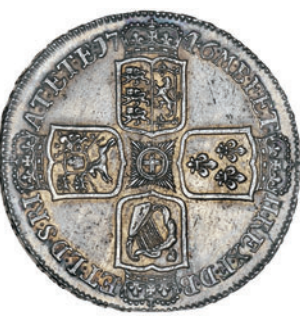
1966 Crown, 1746 LIMA, edge DECIMO NONO (ESC 125; S 3689). Nearly extremely fine £1,000-1,200