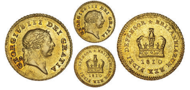
2166 Third-Guinea, 1810, second bust (MCE 460; S 3740). Some G surface scratches, otherwise better than very fine