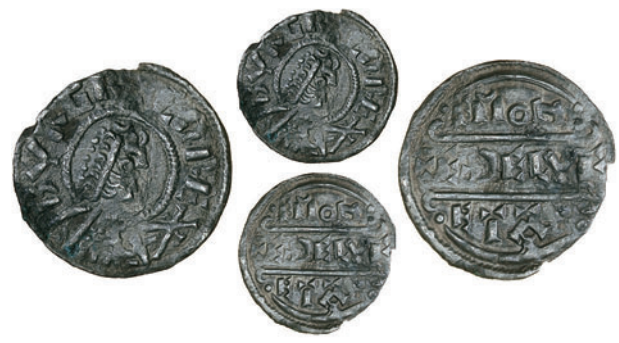
2073 Burgred (852-74), Penny, type D, Æthelwulf, ÆDELVF MONETA, 0.96g/10h (Pagan p.21; cf. BMC 299; N 426; S 941). Slight edge chip, otherwise nearly very fine