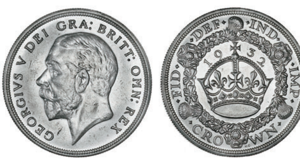
2062 Crown, 1932 (ESC 372; S 4036). About extremely fine, scarce £300-350