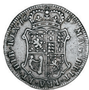
2330 James VII , Forty Shillings, 1687, edge tertio, reads iacobus (SCBI 35, 1677-8; B 4, fig. 1062; S 5637). Fine, scarce