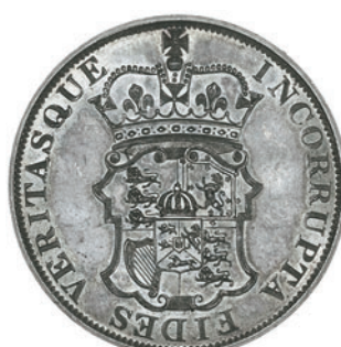
2181 Pattern Crown, 1817, by W. Wyon, in silver, laureate draped bust right, rev. crowned garnished shield, INCORRUPTA FIDES VERITASQUE, frosted lettering both sides, edge plain, 28.92g/12h (L & S 159; ESC 229; Selig 1184). Some friction on obverse high points, otherwise about as struck, toned, very rare £10,000-15,000

2182 Crown, 1820, obv. and rev. enamelled in eight different colours. Brooch-mounted on edge, some small chips to the reverse enamelling, of high-quality workmanship, particularly the obverse; with pin and chain