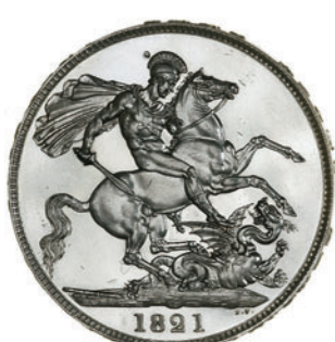
2203 Proof Crown, 1821, edge TERTIO, 28.31g/6h (ESC 250; S 3805). Polished, with light scratches by King's throat and other marks and hairlines, otherwise extremely fine, the error edge reading very rare £1,500-2,000