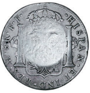
1940 RENFREWSHIRE, Greenock, a Mexico, Charles III, 8 Réales, 1780ff, Mexico City, obv. countermarked McFie Lindsay & COY * GREENOCK * around 4/6, 26.82g/12h (Manville 57, and p.112, this coin listed). Coin very fine, countermark better £900-1,200

Provenance: with A. Almanzar 1972; bt Baldwin.