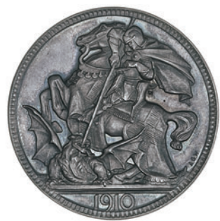
2275 Pattern Crown, 1910, by A. G. Wyon, in silver, bare head left, a g wyon on truncation, rev. St. George and the dragon, agw in field, edge plain, 32.42g/12h (L & S 8; ESC 387). Practically as struck with attractive blue toning, extremely rare £6,000-8,000