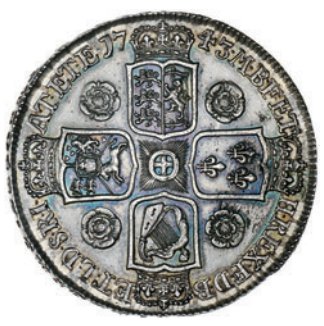
1965 Crown, 1743, roses, edge decimo septimo (ESC 124; S 3688). About extremely fine, toned £1,000-1,200