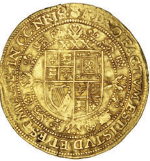
2107 Third coinage, Rose Ryal, mm. thistle, ornate throne-back, 12.39g/3h (SCBI Schneider -; N 2108; S 2632). Probably creased and flattened, especially on the obverse, otherwise fine, reverse better £3,000-3,500