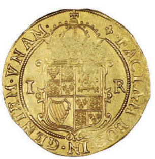
2105 Second coinage, Unite, mm. lis, second bust, 10.04g/11h (SCBI Schneider 22; N 2083; S 2618). A little weak on King's face (and corresponding on reverse), otherwise nearly extremely fine £1,500-1,800