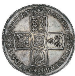
1967 Crown, 1746 LIMA, edge DECIMO NONO (ESC 125; S 3689). Small edge flaw, otherwise good very fine £700-900