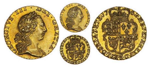
1920 Quarter-Guinea, 1762 (MCE 463; S 3741). Extremely fine £300-400