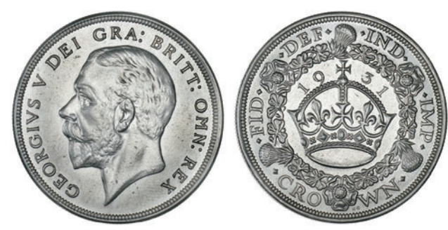
2060 Crown, 1931 (ESC 371; S 4036). A few surface marks, otherwise about extremely fine £180-220