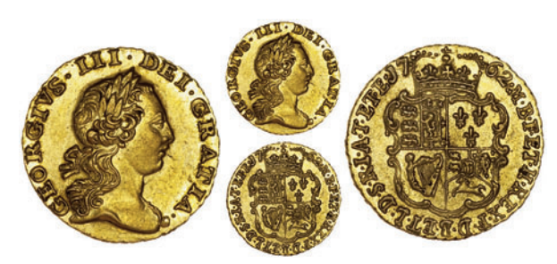
2168 Quarter-Guinea, 1762 (MCE 463; S 3741). About extremely £300-400