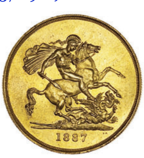
2214 Five Pounds, 1887 (S 3864). Some edge and surface g marks, otherwise nearly extremely fine £800-1,000