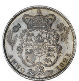
1990 Halfcrown, 1821 (ESC 631; S 3807). Small reverse edge nick, otherwise almost as struck, toned £300-350