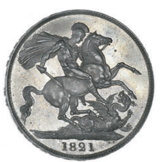
1986 Crown, 1821, upright wwp, edge secundo (ESC 246; S 3805). Practically as struck and lightly toned, the reverse fields proof-like £900-1,000