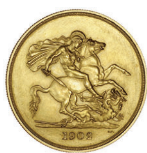
2274 Proof set, 1902, comprising gold Five Pounds, Two Pounds, Sovereign and Half-Sovereign, silver Crown to Maundy Penny [13]. Matt, practically as struck; in official red case of issue £2,000-2,500