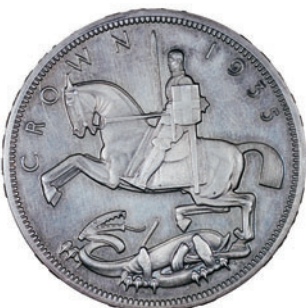
2278 Proof Crown, 1935, error edge decus anno regni et tutamen xxv, 28.03g/12h (ESC 380; S 4050). Practically as struck, attractively toned £1,000-1,200

Provenance: J. Pellegrino Collection, Bank Leu/Spink Auction (Zurich), 26 April 1978, lot 254.