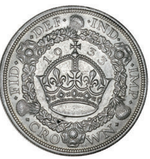
2067 Crown, 1933 (ESC 373; S 4036). Good very fine £200-250