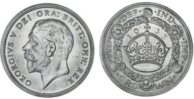
2064 Crown, 1933 (ESC 373; S 4036). About extremely fine £250-300