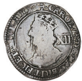
Provenance: Silver Coins of Charles I from a Private Collection (Part II), DNW Auction 79, 24 September 2008, lot 3590