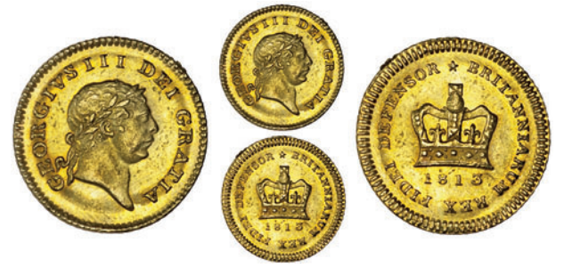
2167 Third Guinea, 1813, second bust (MCE 462; S 3740). A G little scuffed, otherwise practically as struck, an exceptionally fine example of this rare date