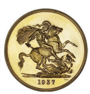
2287 Proof Five Pounds, 1937 (S 4074). Some surface hairlines, 6 otherwise almost as struck £900-1,000

2295 Proof set, 2002, comprising gold Two Pounds, Sovereign and Half-Sovereign [3]. Brilliant; in green leatherette case of issue £550-650