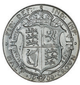
2048 Halfcrown, 1908 (ESC 753; S 3980). Extremely fine or better £300-400