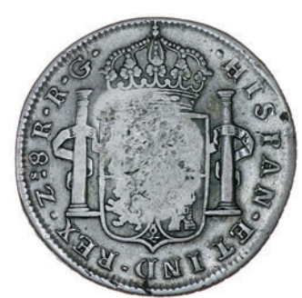
1942 RENFREWSHIRE, Greenock, a Mexico, Ferdinand VII, 8 Réales, 1821rg, Zacatecas, obv. countermarked J & A. MUIR * GREENOCK · * around 4/6, 27.72g/12h (Manville 59, and p.116, this coin listed). Coin fine but slightly off-centre, countermark about very fine but partially weak