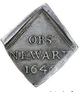
2123 Newark, Halfcrown, 1646, OBS: NEWARK, 14.86g/12h (Bull 688; cf. Hird 246; cf. SCBI Brooker 1222; N 2638; S 3140A). Reverse a little off-centre, otherwise very fine and toned, rare £1,500-1,800

Provenance: St James's Auction 12, 5-6 November 2009, lot 445