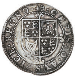
2116 Briot's Hammered issue, Shilling, mm. anchor, lozenge stops both sides, reads BRIT, 5.69g/9h (SCBI Brooker 737; N 2308; S 2862A). Obverse scratched and portrait smoothed, reverse about very fine, extremely rare