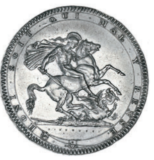
1974 Crown, 1818, edge LVIII (ESC 211; S 3787). A couple of edge knocks and some surface marks, otherwise about extremely fine £150-200