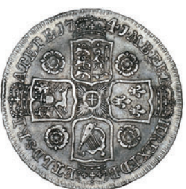
1968 Halfcrown, 1741, roses, edge DECIMO QVARTO (ESC 601; S 3693). Very fine or better £300-400