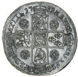
2146 Halfcrown, 1739, roses, edge DVODECIMO (ESC 600; S 3693). Rim flaw at 12 o'clock, otherwise good very fine, toned £300-400