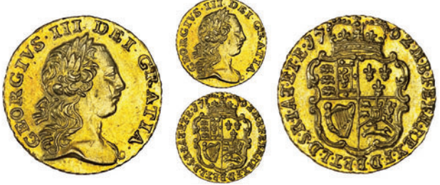
2169 Quarter-Guinea, 1762 (MCE 463; S 3741). Some surface marks, otherwise nearly extremely fine £300-350