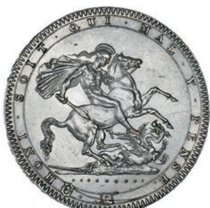
1977 Crown, 1820, edge LX (ESC 219; S 3787). About extremely £150-200