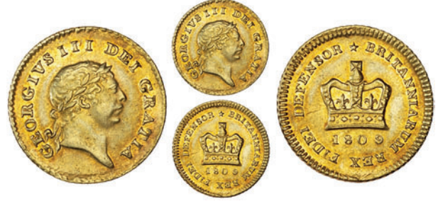
2164 Third-Guinea, 1809, second bust (MCE 459; S 3740). Nearly extremely fine £120-150