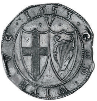
2125 Crown, 1653, mm. sun on obv. only, 29.97g/1h (ESC 6; N 2721; S 3214). Removed from a brooch mount, the edge damaged in two places and parts of the legends reworked, otherwise good very fine £800-1,000