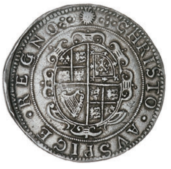
1949 Tower mint, Crown, mm. sun, Gp IV, 29.93g/7h (FRC XXIV/XXXVII [Sale, lot 96]; SCBI Brooker 272, same dies; N 2198; S 2761). A few surface marks, otherwise nearly very fine £800-1,000