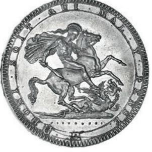
1975 Crown, 1819, edge LIX (ESC 215; S 3787). Several tiny cuts on face, otherwise extremely fine £150-200