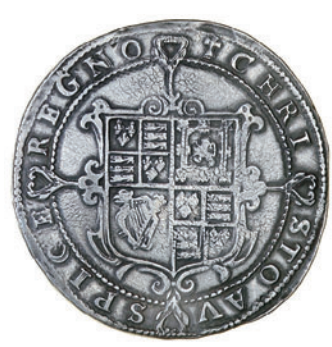
2111 Tower mint, Crown, type Ia, mm. cross on steps (over lis on obv.), 29.95g/9h (FRC dies II*/VII [Sale, lot 44]; SCBI Brooker 236, same dies; N 2190; S 2753). Some surface cracking, otherwise about very fine £1,200-1,500