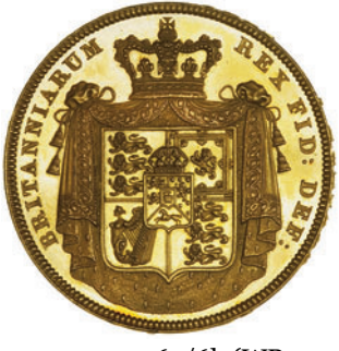
2185 Proof Five Pounds, 1826, edge septimo, 39.76g/6h (WR 213; S 3797). Obverse field a little hairlined, otherwise practically as struck £8,000-10,000