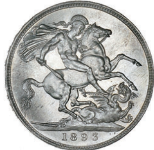
2242 Crown, 1893, edge LVI (ESC 303; S 3937). Small dig in front of face, otherwise extremely fine or better with proof-like surfaces £150-200