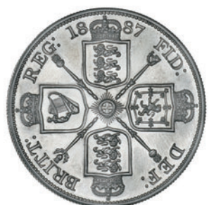
2017 Proof Double-Florin, 1887, Arabic numeral (ESC 396; S 3923). The fields impaired by cleaning, otherwise better than extremely fine