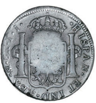
1930 BUTE-SHIRE, Rothsay, a Mexico, Ferdinand VII, 8 Réales, 1819, Mexico City, obv. countermarked ROTHSAY COTTON WORKS around 4/6 1820, privy mark of a small dot at base of shield, 26.44g/12h (Manville 92, and p.181, this coin listed). Coin fair, countermark about very fine