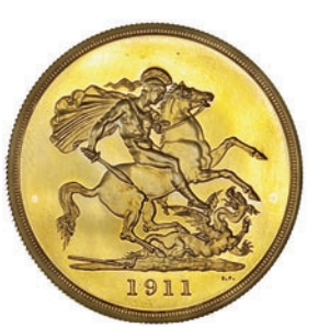
2285 Proof set, 1911, comprising Five and Two Pounds, Sovereign and Half-Sovereign, silver Halfcrown to Maundy Penny [12]. A few light surface marks and lightly cleaned, otherwise brilliant; in official red case of issue