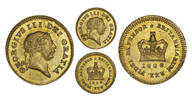
1919 Third-Guinea, 1808, second bust (MCE 458; S 3740). Good g very fine £150-200