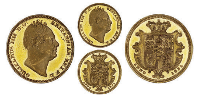
2208 Proof Half-Sovereign, 1831, small flan, edge plain, 3.81g/6h (WR 267; S 3830). Marks in obverse field and on rim, hairline scratch on neck, otherwise good extremely fine £900-1,200

There seems no apparent reason why this coin should weigh almost 0.2g light