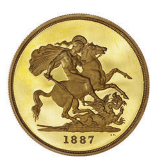
2215 Proof Five Pounds, 1887, initials in exergue, edge grained, G 39.77g/12h (WR 285; S 3864). Some light hairlining, otherwise brilliant £2,500-3,000