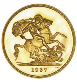
2286 Proof Five Pounds, 1937 (S 4074). Minimal hairlining, otherwise about as struck £1,000-1,200