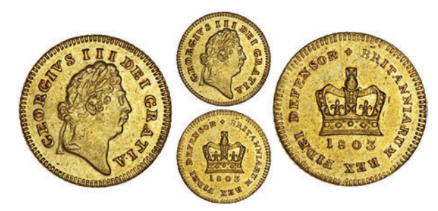
2163 Third-Guinea, 1803, first bust (MCE 455; S 3739). Good very fine £120-150 G

2162 Third-Guinea, 1800, first bust (MCE 452; S 3738). About 🥨 G very fine £80-100