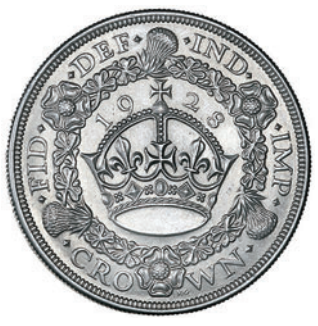
2276 Crown, 1928 (ESC 368; S 4036). Extremely fine or better £200-250