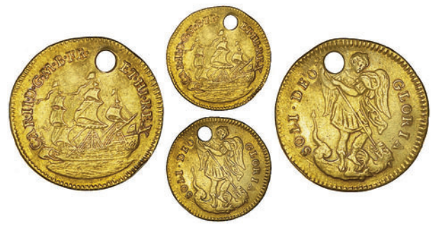
1877 Touch Piece, in gold, by J. Roettier, type B, 1.91g/12h (Woolf B). Pierced for use, nearly very fine, rare £200-300