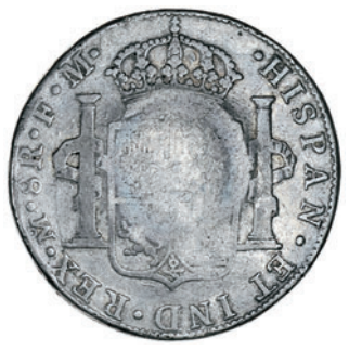
1928 DERBYSHIRE, Cromford, a Mexico, Charles III, 8 Réales, 1774fm, Mexico City, obv. countermarked cromford DERBYSHIRE around 4/9, 26.27g/12h (Manville 104, and p.206, this coin listed). Coin fair, countermark about very £800-1,000

Provenance: SCMB October 1968 (5026); W. Allen Collection, Spink Auction 34, 14-15 March 1984, lot 9 [from Hall, Glasgow]; bt Baldwin.