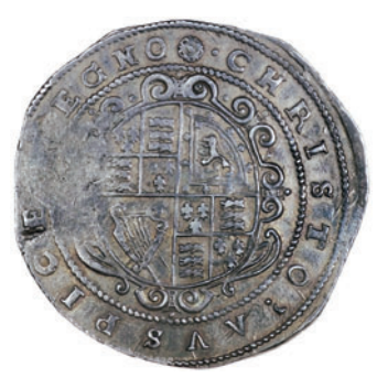
2120 Truro mint, Crown, mm. rose, 29.31g/4h (Besly A1; SCBI Brooker 1008-9, same dies; N 2531; S 3045). A little weak on King's face (and corresponding on reverse), otherwise good very fine and attractively toned