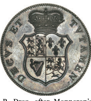
2183 Pattern Crown, 1820, by J.-P. Droz, after Monneron's pattern by G. Dupré, in silver, Hercules seated, attempting to break sticks across his knee, rev. crowned arms, edge plain, 24.13g/12h (L & S 212; ESC 243). About as struck with proof-like fields, attractive blue tone, very rare