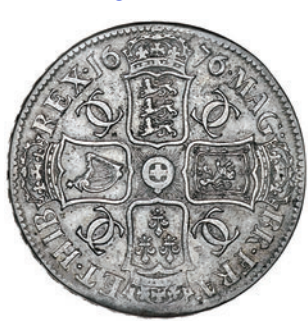
1955 Crown, 1676, third bust, edge VICESIMO OCTAVO (ESC 51; S 3358). Surface marks, otherwise fine, reverse better £120-150