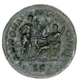
722 Nero, Sestertius, Rome, c. 64, rev. annona avgvsti ceres, Ceres seated left facing Abundantia, ship in background, 28.50g/6h (CBN 278; RIC 130; MacDowall 104). Good very fine, dark patina with shallow pitting £500-600