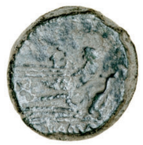
642 Dolphin series, As, Sicily (?), c. 209-208, 24.97g/3h (Crawford 80/2). Very fine, earthy dark patina £80-100