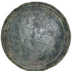
723 Nero , Sestertius, Lugdunum, c. 66-7, rev. hollowed out for use as a mirror, 8.71g (cf. CNG e-sale 170 [2007], 211 and NAC sale O [2004], 1922). Very fine, dark green patina £200-300

Roman coins transformed into small cosmetic mirrors or compacts are rare; the interiors were either tinned or silvered