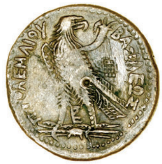
592 Ptolemy IV, Æ Pentobol, head of Zeus Ammon right, rev. eagle left, 44.71g/12h (cf. Svoronos 974; SNG Copenhagen 228; Köln 92). Very fine, good brown tone £100-150