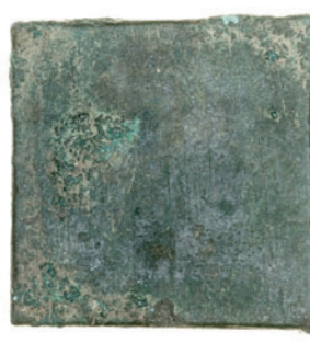
996 Engraved three ounce weight, \Gamma \Gamma flanking long cross, all within wreath on square flan, 82.82g (Dürr pl. 4, 25; cf. Bendall 66). Extremely fine, dark green patina £200-250