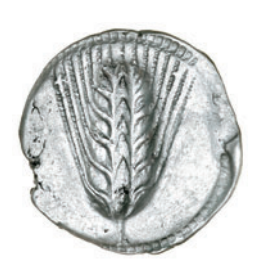
407 METAPONTUM , Stater, c. 520, barley-ear, rev. incuse, 8.05g/12h (Noe, Johnston 43; HN Italy 1463). Very fine, broad flan £250-300