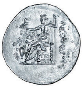
477 Alexander III , posthumous Tetradrachm, Temnos, c. 188 -170, head of young Herakles right, rev. Zeus seated left, 16.02g/12h (Price 1690). Good very fine £100-150