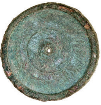
900 Contorniate, Rome, late 4th or early 5th cent. AD, large, engraved monogram PE, the vertical stroke and the middle horizontal stroke meeting at the central hole, rev. concentric circles centred on the central hole, 38.94g (Alföldi –). Very fine, earthy green patina £200-250