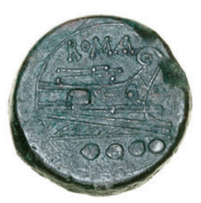
629 Triens, c. 215-212, 29.97g/9h (Crawford 41/7b). Extremely fine, glossy green-brown patina £600-800