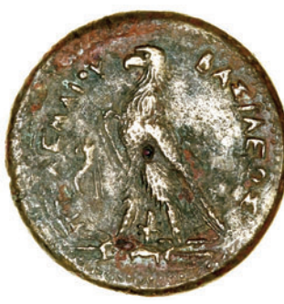
588 Ptolemy III (246-221), Æ Drachm, head of Zeus Ammon right, rev. eagle left, 64.51g/11h (Svoronos 964; SNG Copenhagen 171; Köln 71). Fine, brown tone £80-100