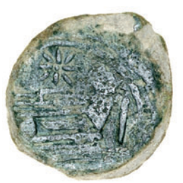
645 Star series, As, c. 206-195, 20.19g/7h (Crawford 113/2). Very fine, dark patina, rare