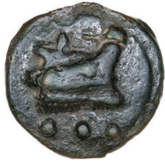
627 Cast Quadrans, c. 225-217, 68.71g/12h (Crawford 35/4; Thurlow & Vecchi 54; HN Italy 340). Very fine, dark green and brown patina £100-150