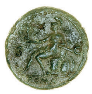
721 Nero , Sestertius, Lugdunum, c. 64, rev. ROMA, Roma seated left, 26.44g/7h (CBN 68; RIC 398; MacDowall 409). Fine, rich green patina £100-150