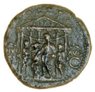
716 Gaius called Caligula (37-41), Sestertius, Rome, c. 39 -40, DIVI AVG S C, Gaius sacrificing before hexastyle temple of Divus Augustus, 29.15g/12h (CBN 104; RIC 44; Cohen 9). Very fine, dark brown tone £200-250