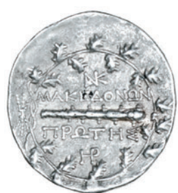
498 First Meris , Republican period, c. 167-149, Tetradrachm, Amphipolis, diademed and draped bust of Artemis right, at the centre of a Macedonian shield, rev. club within oak wreath, 16.72g/8h (AMNG III/1, 164; SNG Ashmolean 3293). Very fine £150-200