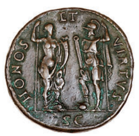
901 'Paduan' Sestertius after G. Cavino, laureate and draped bust of Vitellius right, rev. Honos and Virtus standing facing, 20.19g/6h (Klawans 18; Lawrence 28). Later aftercast, very fine, dark brown patina £50-70