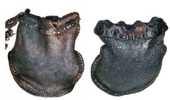
1095 Medieval leather purses (2), 13th century, both 10 x 9 cm [2]. Professionally conserved and in very good condition £100-150

1094 Miscellaneous (39), various issues [39]. Varied state; with identifying tickets £250-300