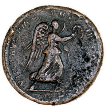
783 Septimius Severus (193-211), Æ Medallion, Rome, c. 195, rev. VICT AVG P M TR P III COS II P P, Victory advancing right, holding wreath and palm branch, 49.72g/12h (Gnecchi p.76, 25, pl. 93, 4, same dies; Cohen 678 [Fr. 300]). Fine, brassy-brown tone, extremely rare £600-800

Provenance: Friedrich Collection, NAC Auction 2 (Zurich), 2 April 1995, lot 1654